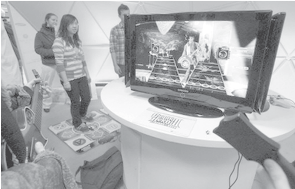
Teenagers sample the "Guitar Hero III" video game at the CeBIT trade fair in Hanover. Games consoles — of which 62 million were sold in last year — are the gas guzzlers of this industry, using huge amounts of energy to generate the necessary mindblowing graphics and sounds.