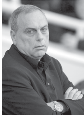
Chelsea manager Avram Grant

Kayode Odejayi scored the only goal of the game just after the hour to give Barnsley the most unlikely of wins - although Chelsea barely threatened at the other end.