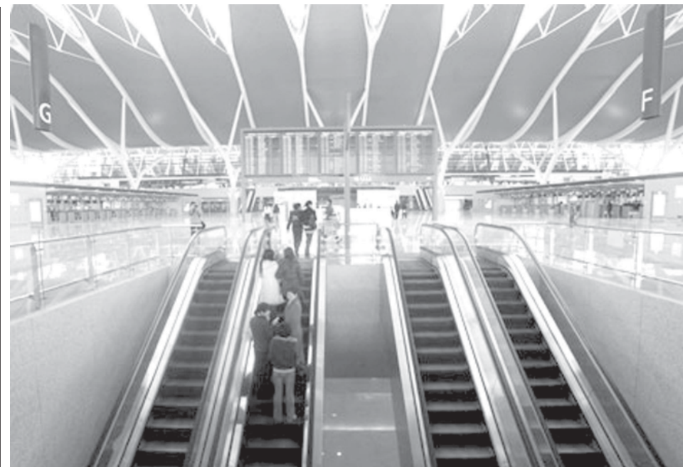
Photo taken on 7 March, 2008 shows the interior of newly-built No 2 terminal building of the Pudong International Airport in Shanghai, east China.