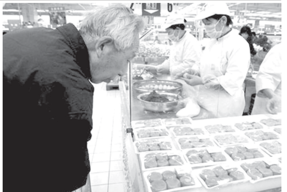
A senior citizen is attracted by green dumplings at a supermarket in Suzhou, east China's Jiangsu Province, on 7 March, 2008.