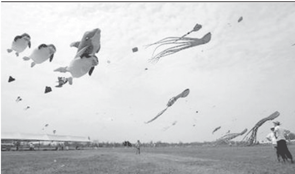
Germany's Meik Schlenger (R) looks at his kite during the 10th Thailand International Kite Festival at the Thai resort beach town of Cha-Am, 160km (99 miles) southwest of Bangkok, on 8 March, 2008. The festival will take place over the weekend.