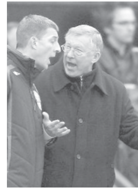
Sir Alex Ferguson

LONDON, 8 March — Manchester United boss Sir Alex Ferguson hit out at the refereeing after Portsmouth beat the Red Devils 1-0 at Old Trafford to progress into the semifinals of the FA Cup.