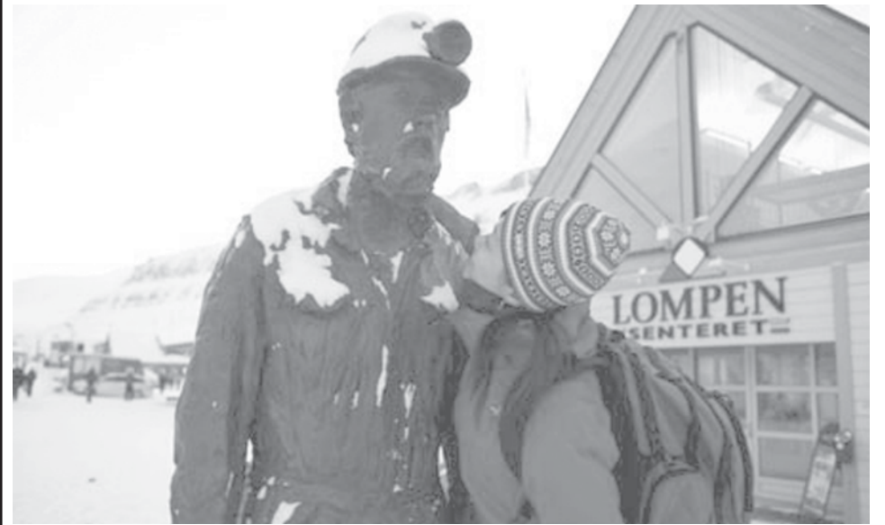
A girl student of the Chinese Arctic expedition team embraces the statue of miner in Longyearbyen, Norway, on 5 March, 2008. A total of 15 women students, journalists and polar experts took part in the Chinese Arctic expedition team, which conducts research and experiments in the fields of biology, physics, astronomy, climate and geography in the Norwegian part of the Arctic from 29 Feb to 12 March.