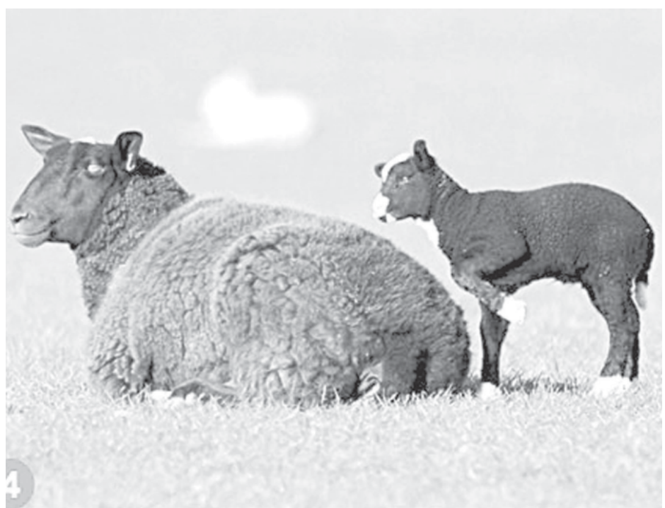
Photos taken by a British photographer show a hungry lamb kicked its mother with its forehoof to beg for milk.—XINHUA