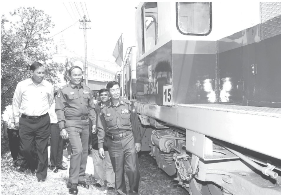
Minister for Rail Transportation Maj-Gen Aung Min observes the locomotives purchased from India.

dia and accepted five locomotives on 22 September 2007 in the first batch. At present, 15 locomotives were accepted as the second batch.