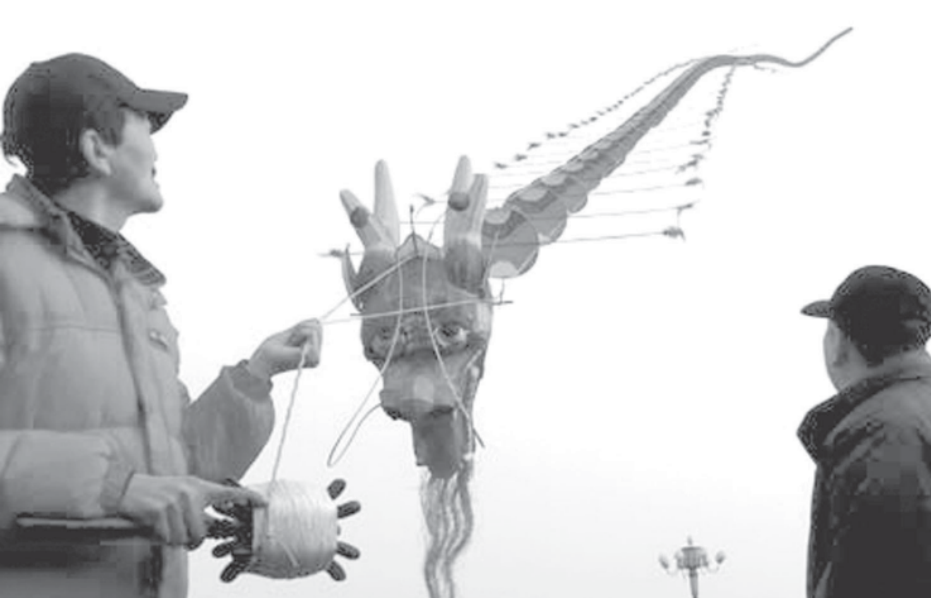
A man flies a dragon-shaped kite at the Beiling Park in Shenyang, capital of northeast China's Liaoning Province, on 9 March, 2008. —XINHUA

Child show their works for auction during a commonweal auction in Hangzhou City, capital of east China's Zhejiang Province, on 9 March, 2008. 60 painting works created by members of the Hangzhou youth painting and calligraphy academy were sold during a commonweal auction. All the income will be used to imburse poor students' art education after school.—XINHUA