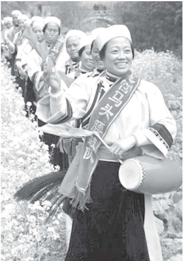
Local women perform waist drum dance in the cole field at the Longgong scenic area in Anshun City, southwest China's Guizhou Province, on 8 March, 2008.