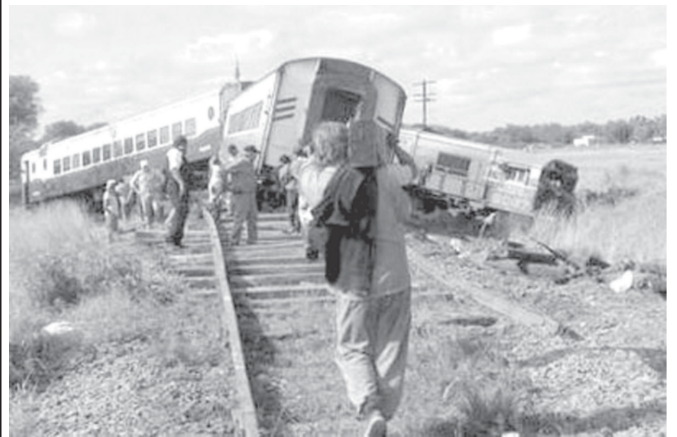
Rescue workers and local residents walk around wreckage at the crossing where a passenger train crashed into an interprovincial bus, in the city of Dolores, Buenos Aires Province on 9 March, 2008. At least 18 people were killed and 45 injured in the crash, local media reported.—INTERNET

Visitors gather around displayed cars during the first weekend of the 78th Geneva International Motor Show in Geneva, Switzerland, on 8 March, 2008. The Motor Show opens its gates to the public from 6 to 16 March, presenting over international 1,000 brands.—INTERNET