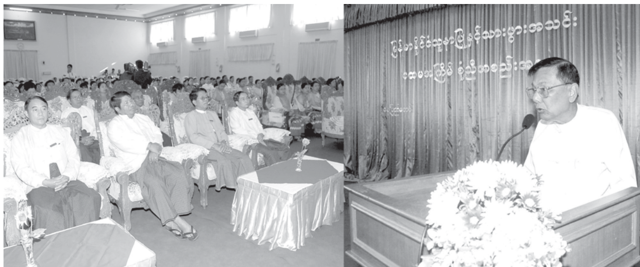
Deputy Minister for Health Dr Mya Oo addresses the first annual meeting of Myanmar Nurses and Midwifery Association.—MNA

Also present at the meeting were departmental heads, CEC members of the association and representatives of states and divisions. —MNA