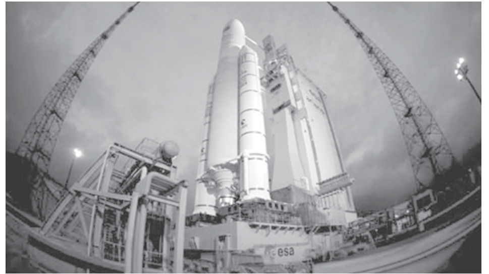
The Ariane 5 ES-ATV launcher, on its mobile launch table, arrives for fuelling and final launch preparations at the Launch Zone (ZL-3) of Ariane Launch Complex No. 3 (ELA-3) at the Guiana Space Centre on 7 March, 2008.