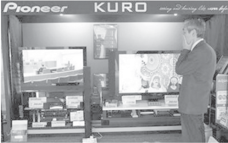
An employee reacts in front of Pioneer Corp's plasma televisions at an electric home appliances shop in Tokyo on 4 March, 2008. Japan's Pioneer Corp is finalizing plans to stop all production of plasma display panels in a bid to turn around its loss-making flat TV operations, an industry source briefed on the plan said on Tuesday.