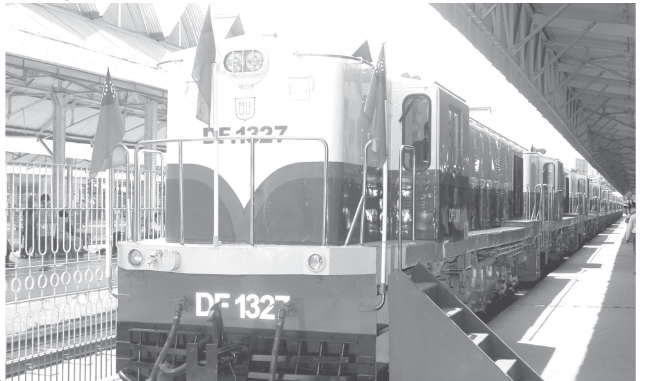
Locomotives imported from India seen at Yangon Central Railway Station.

Ltd under the Ministry of Rail Transportation of In-