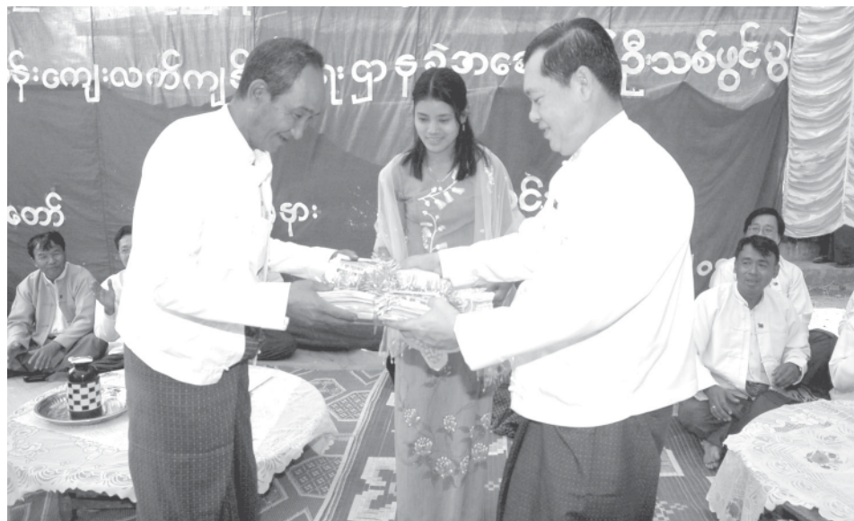
Minister for Transport Maj-Gen Thein Swe donates cash to the rural dispensary in Zigon Village.—MNA

The secretary-general also presented publications to the local residents.—MNA