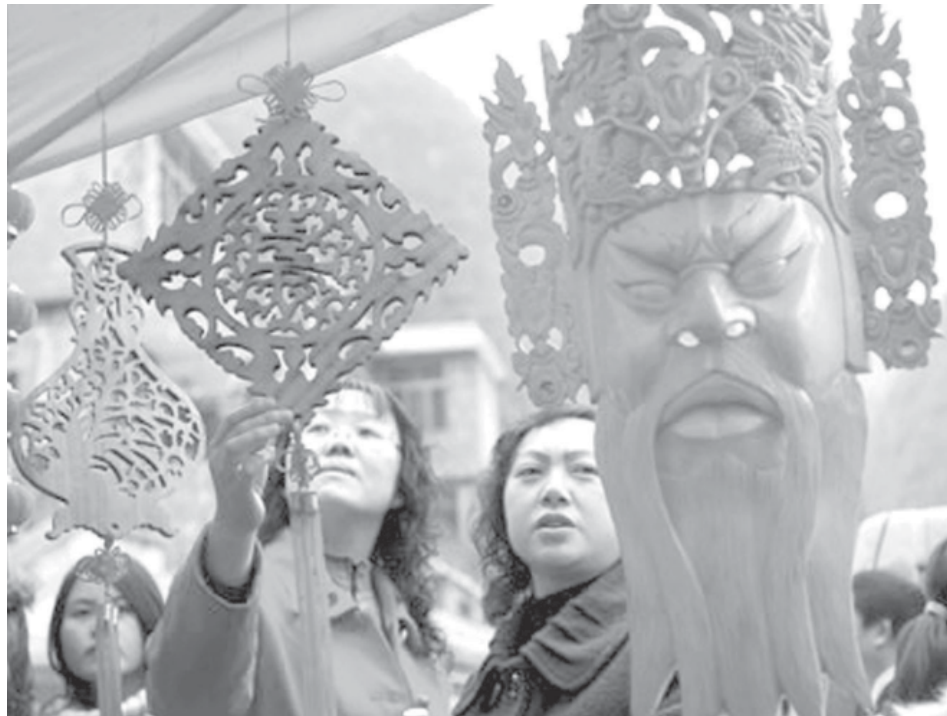
Tourists look at handicrafts during the 6th Guizhou (Anshun Longgong) Cole Flower Tour Festival, opened at the Longgong scenic area in Anshun City, southwest China's Guizhou Province, on 8 March, 2008.