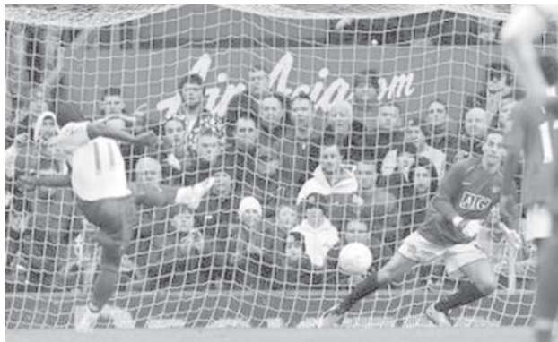
Portsmouth's Sulley Muntari (L) scores a penalty past Manchester United's Rio Ferdinand during their FA Cup quarter-final soccer match at Old Trafford in Manchester, northern England on 8 March, 2008.