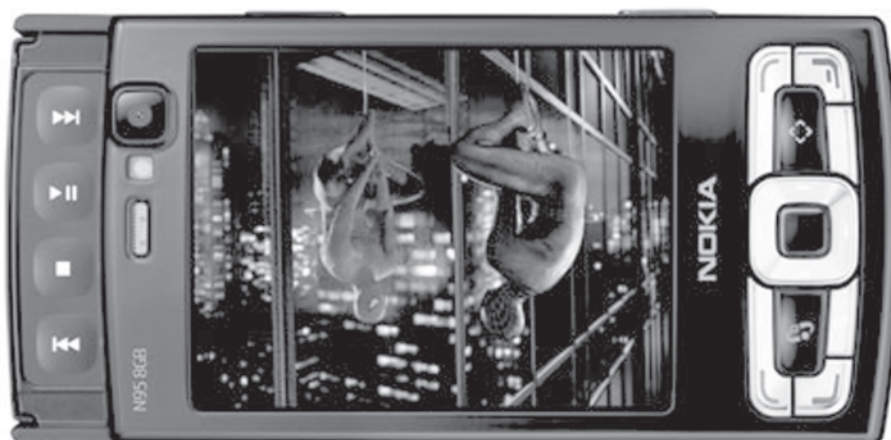
A Nokia N95 mobile phone with an 8 gigabyte memory is seen in an undated handout photo. It had started shipments of a new version of its top-of-the-range mobile phone model N95 with an 8 gigabyte memory and improved battery life.

The recall will start on 26 March, the AQSIQ said. Neither the agency nor the company mentioned whether there have been customer complaints. The sedans involved were found to have defects in their power steering hose, which may cause hose cracks and fluid leaks. —MNA/Xinhua