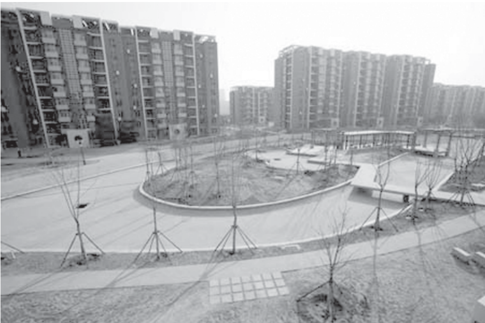
Photo taken on 5 March, 2008 shows the Olympic Village under construction in Beijing, capital of China.