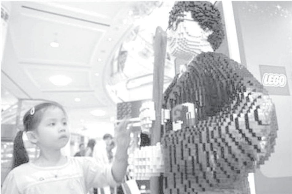
A girl touches a Harry Potter mannequin made of Lego blocks in Singapore, in this file photo.