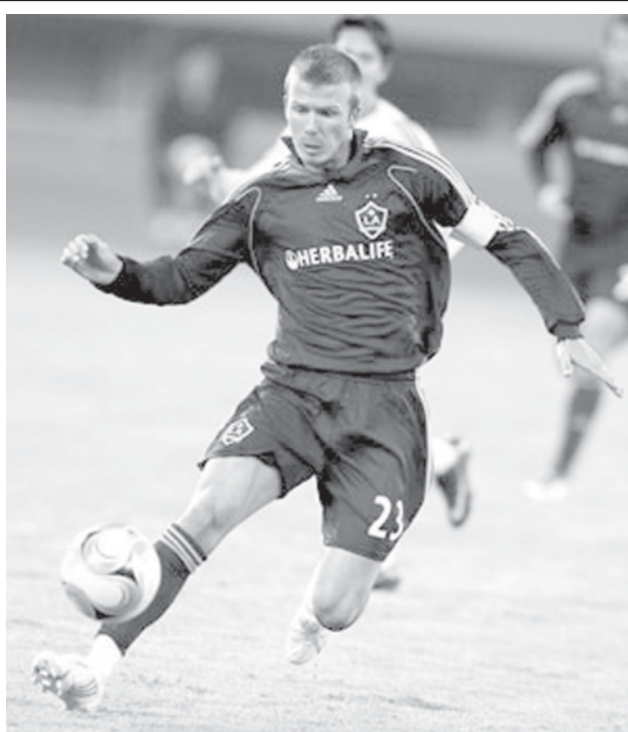
Los Angeles Galaxy's David Beckham fights for the ball during a soccer match performance against Shanghai Hong Kong United in Shanghai, east China, on 5 March, 2008. Los Angeles Galaxy won 3-0.