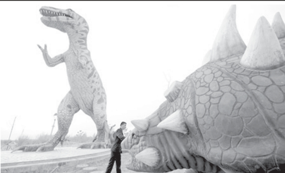
A visitor walks at a dinosaur park in Karamay of northwest China's Xinjiang Uygur Autonomous Region, 4 March, 2008.

freezes, curbs on dual-use items, export credit, financial monitoring, cargo inspections on aircraft and vessels, and possible "next steps". "The resolution is not aimed at punishing Iran, but promoting the resumption of negotiation and thus to reactivate a new round of diplomatic efforts", Qin said in the statement. Xinhua