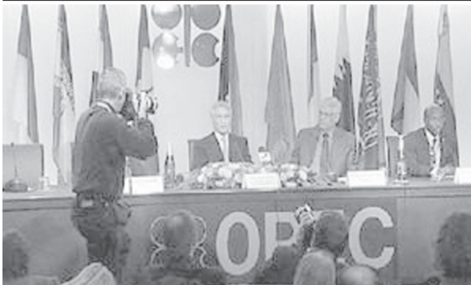
OPEC says it will not be putting more oil on the global market, despite near record-high crude prices.