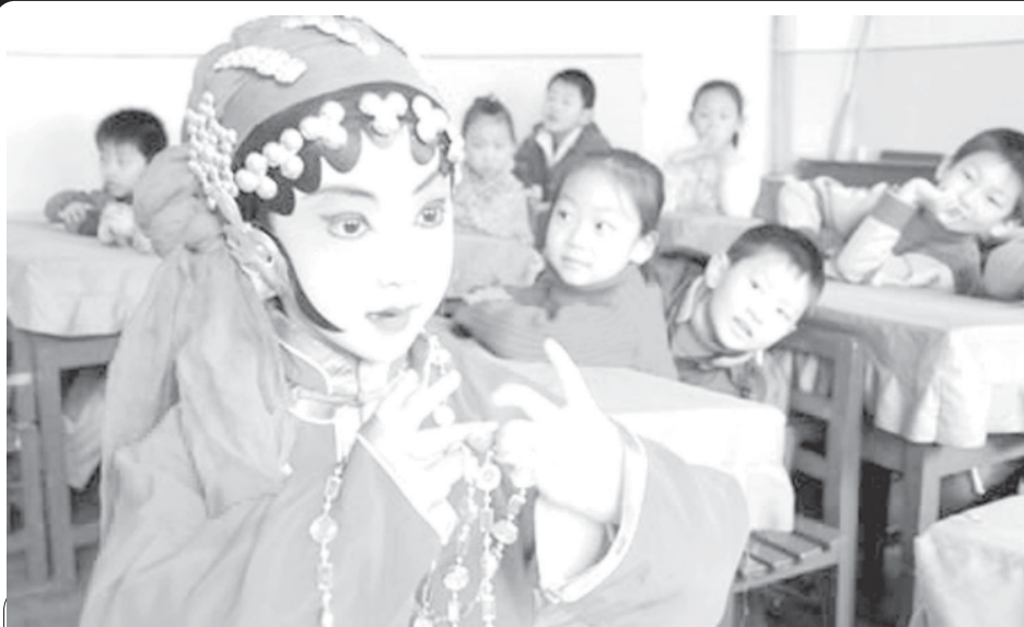
Students at Yumin Primary School are attracted by Beijing Opera performed by little performers of a kindergarten Beijing Opera performance class in Harbin, capital of northeast China's Heilongjiang Province, on 6 March, 2008. Little performers visited here at the invitation of the school.