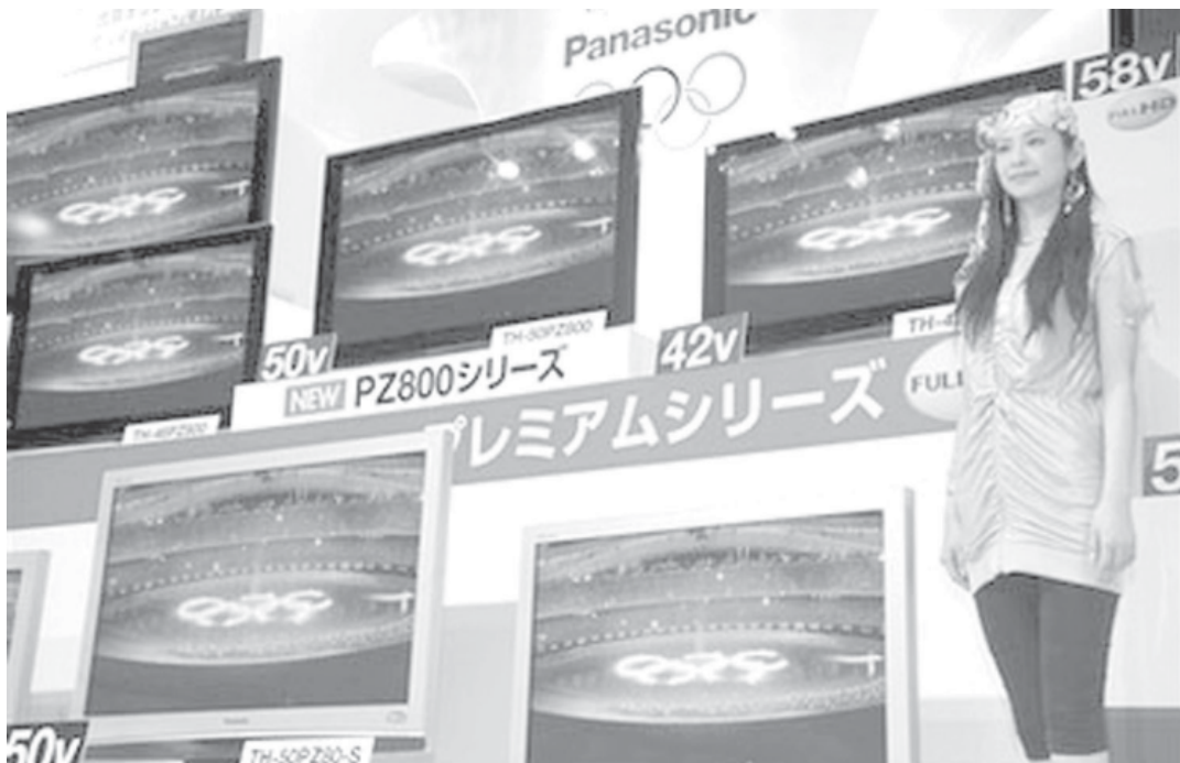
A model poses with Viera full high-definition plasma TVs during a press event by Panasonic, a unit of Matsushita Electric Industrial Co, in Tokyo on 6 March, 2008. The Japanese consumer electronics maker plans to sell the new TV sets targeting people who wish to watch the upcoming 'Beijing Olympics' with its latest full HD system 'Full HD Peaks' that Panasonic says possible to display athletes' powerful and fast moving images on the screen.