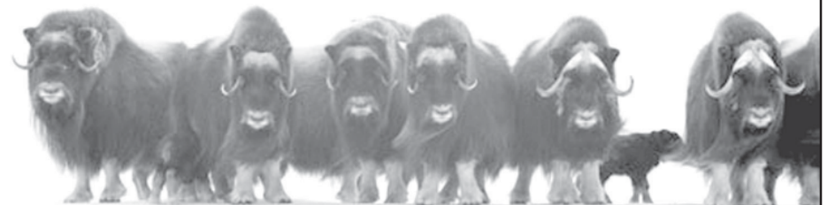
Musk-oxen huddle together during a snowstorm in Canada's frigid Northwest Territories. A strange phenomenon known as a "rain on snow" event, in which warm rain freezes into a solid layer of ice on the ground in winter, killed off a quarter of the region's musk-oxen population in 2003. Scientists are still working to figure out why and when these elusive incidents occur.

Myanmar Furniture Fair 2008 have advantages on getting more national income, gaining achievement in wood-based industries, creating more job opportunities and making better use of human resources, penetrating international markets in comparison with previous year fairs. The fair continues tomorrow. — MNA