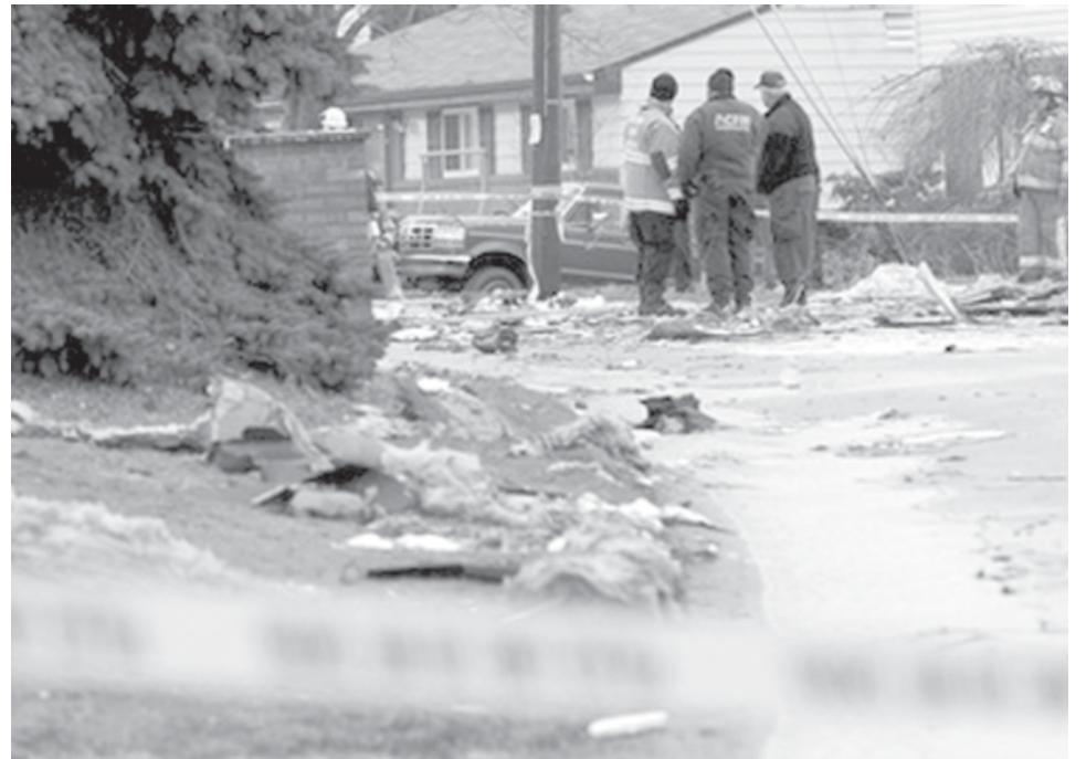
Debris can be seen scattered around the scene of a house explosion in Plum, Pa, on 5 March, 2008. An explosion flattened the house in suburban Pittsburgh, killing one person, injuring at least one other and damaging at least eight neighbouring homes, authorities said.