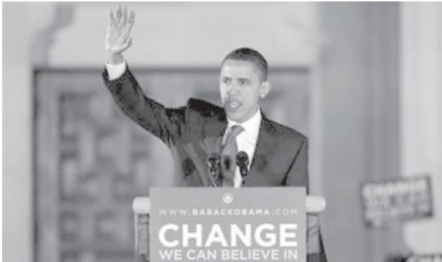
Democratic presidential candidate Senator Barack Obama speaks to supporters at his Ohio and Texas primary election night rally in San Antonio, Texas on 4 March, 2008.