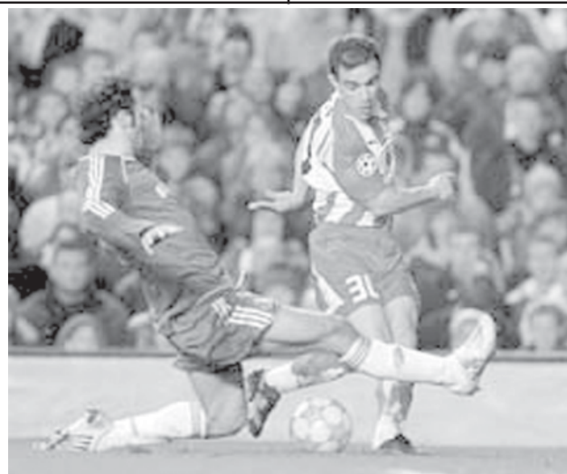
Real Madrid's Raul Gonzalez of Spain, right, battles for the ball against Roma's Juan Silveira of Brazil, left, during their second round match of the Champions League at the Santiago Bernabeu stadium in Madrid, on 5 March, 2008.