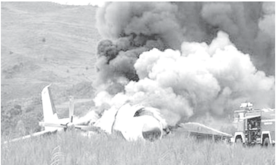
A cargo plane bursts into flames moments after landing at Wamena Airport in Indonesia's remote Papua Province on 6 March, 2008. The plane, which was carrying diesel fuel and other commodities, had eight people on board who escaped uninjured, Antara news agency reported.—INTERNET