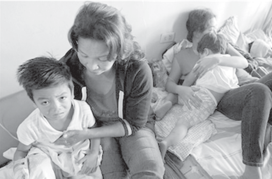
Filipino patients, mostly children, recuperate in their makeshift beds along the corridors of the JP Rizal Medical Centre, a government hospital, following a typhoid outbreak in Calamba city, Laguna Province 55 kilometres (34 miles) south of Manila, Philippines on 6 March, 2008.