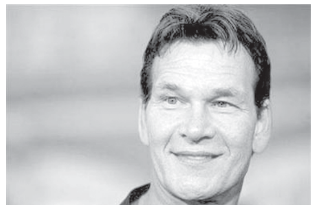
Actor Patrick Swayze attends the fan screening of "Mission: Impossible III" at the Grauman's Chinese theatre in Hollywood.

cancer is one of the deadliest of all tumors and only 4 percent of patients are alive after five years.