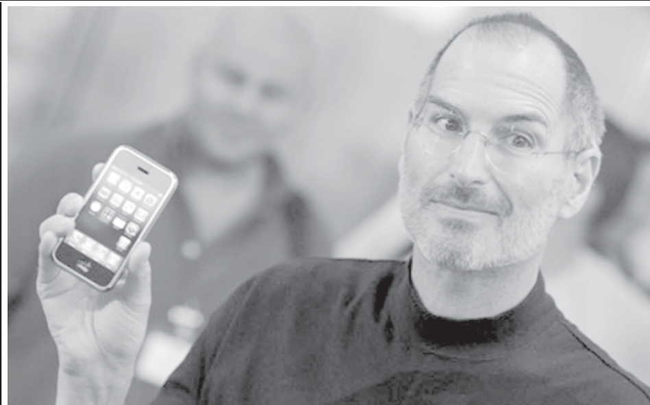
Following Steve Jobs' promise to open the zealously guarded inner workings of iPhones to computer programmes made by outsiders, Apple will unveil a "software roadmap" for outside developers interested in making programmes for iPhones, media reported on 6 March, 2008.

There are no casualties in coalition forces, he added.