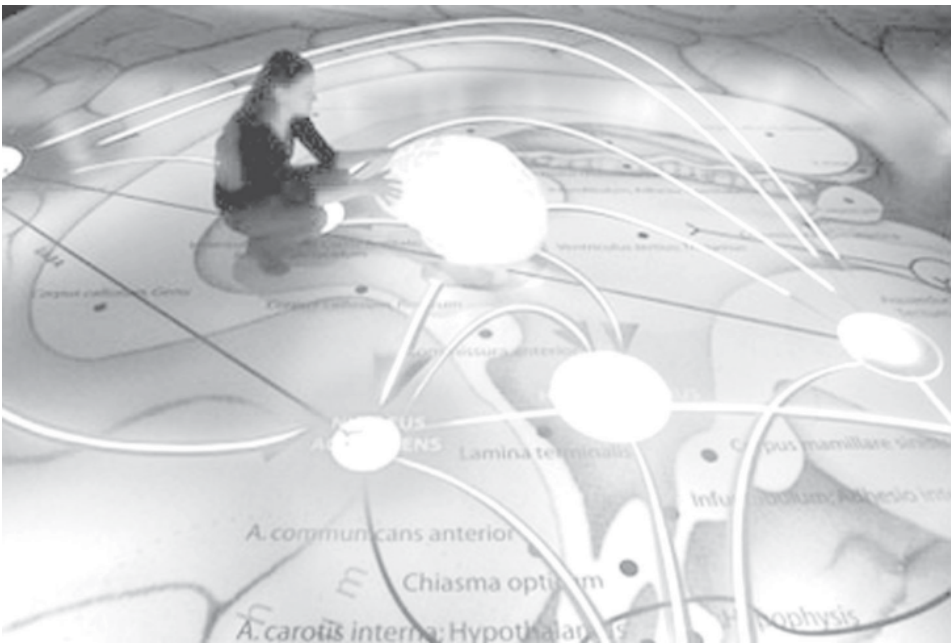
Checking the head : A woman inspects an exhibit featuring neurobiological processes in the human brain shown in the so-called Neurons-Room of the exhibition "Glueck - Welches Glueck" (literally: Happiness - Which Happiness) at the Deutsches Hygiene Museum in Dresden, eastern Germany.