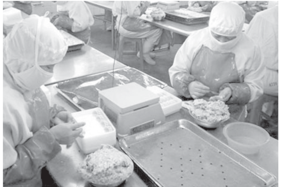
Chinese workers making Chinese dumplings at the Tianyang Food's factory in Shijiazhuang, China's Hebei Province. China will step up its monitoring of product safety, says Premier Wen Jiabao.