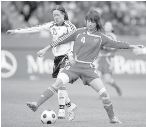
Germany's Renate Lingor (L) challenges China's Wang Kun (R) during their international friendly women's soccer match in Freiburg on 28 Feb, 2008.