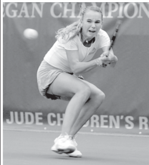
Caroline Wozniacki, of Denmark, returns a shot to Lindsay Davenport in a quarterfinal match at the Cellular South Cup tennis tournament in Memphis, Tenn, on 28 Feb, 2008. Davenport defeated Wozniacki, 6-0, 6-2.