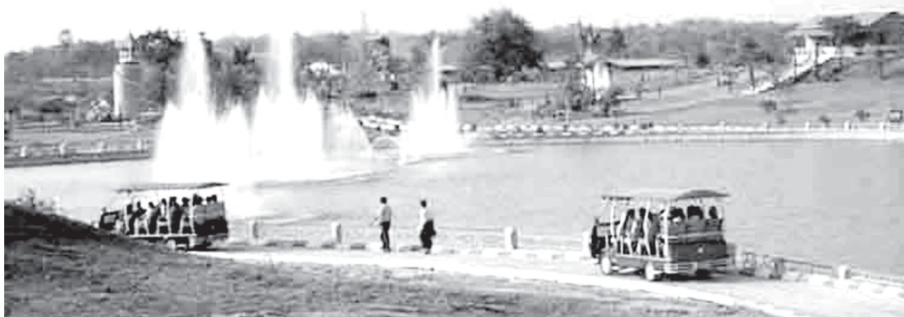
Holiday-makers visit Nay Pyi Taw Water Fountain Garden.