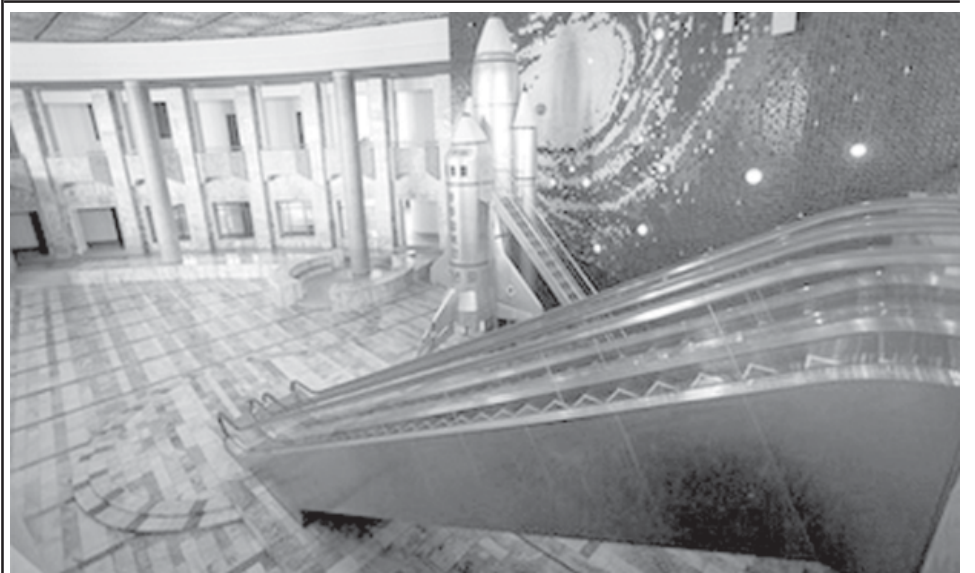
A model of a space shuttle stands in the lobby at the Mangyongdae Schoolchildren's Palace in Pyongyang, North Korea on 27 Feb 2008.