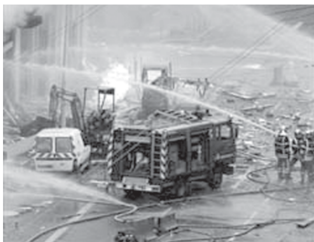
View of the site where a gas explosion occurred during road maintenance rocking the city centre of Lyon.

PARIS, 29 Feb—An explosion caused by a gas leak rocked the French city of Lyon on Thursday, killing a firefighter and injuring 40 people, one of them seriously, police said.