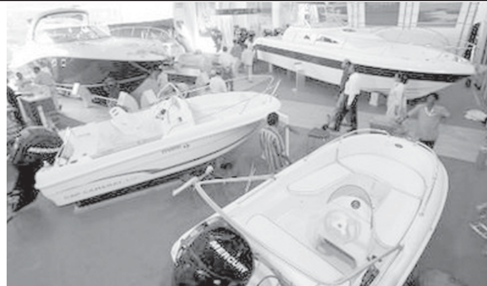
Boats are on display at the Samira Mumbai International Boat Show on 28 Feb, 2008. The three-day show, which begins on Friday, will showcase international brands from the leisure boating industry.