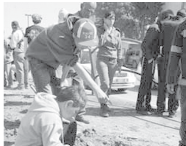
Israelis gather at the site where a rocket fired from Gaza landed in the southern Israeli town of Sderot.

A third was found dead in an electricity company vehicle, which carried another Palestinian who later died of his injuries, they said. —Internet