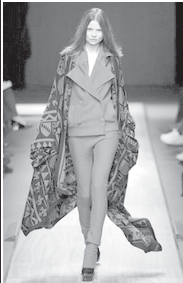
A model wears a creation by British fashion designer Stella McCartney as part of her fall-winter 2008-2009 ready to wear collection in Paris, on 28 Feb, 2008.