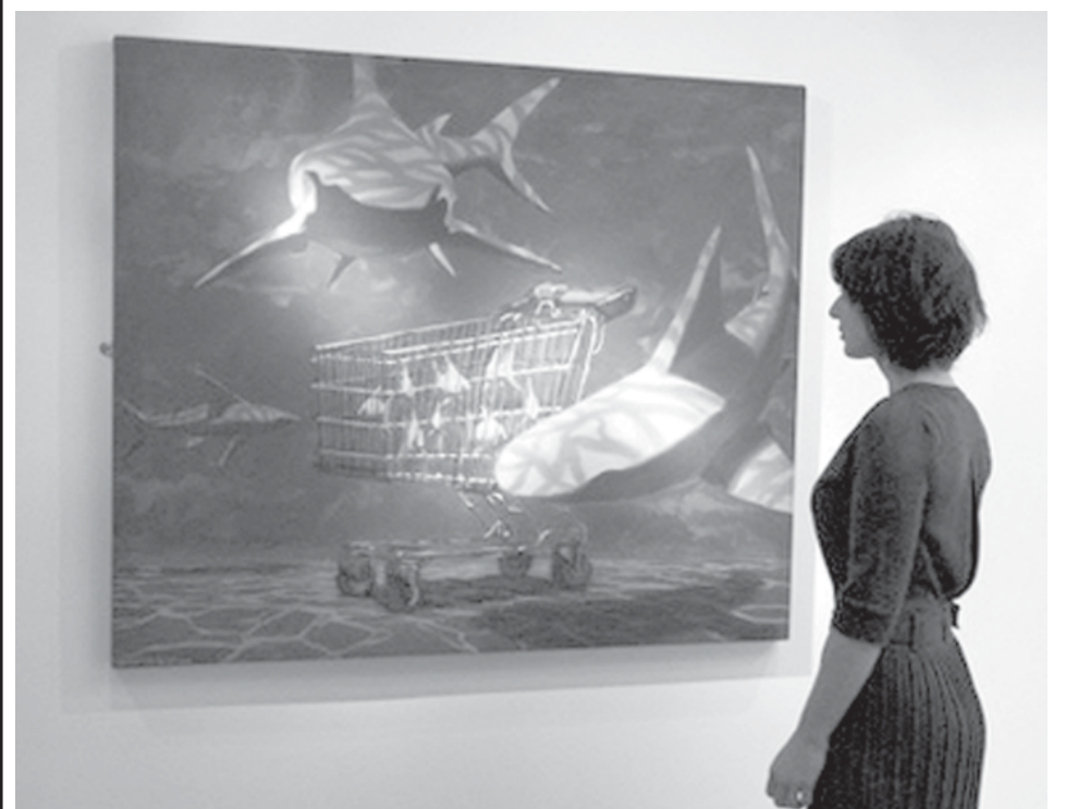
A gallery assistant looks at a painting in London. A contemporary art auction raised 95 million pounds (125 million euros, 188 million dollars) on 27 Feb, in London, the highest total for such a sale in Europe, auction house Sotheby's said. —INTERNET

Fire engulfed several buildings in the centre of France's third biggest city and police evacuated close to 1,000 people from the area. A 35-year-old firefighter and father of two children who was investigating a leak of gas into the basement of a building was killed in the blast, said Lyon Mayor Gerard Colomb. Interior Minister Michele Alliot-Marie, who travelled immediately to the scene, told reporters that lax security was partly to blame. She said she was sorry that “all the security procedures were not sufficiently taken into account” and pledged to find ways to boost safeguards for gas maintenance work. —Internet