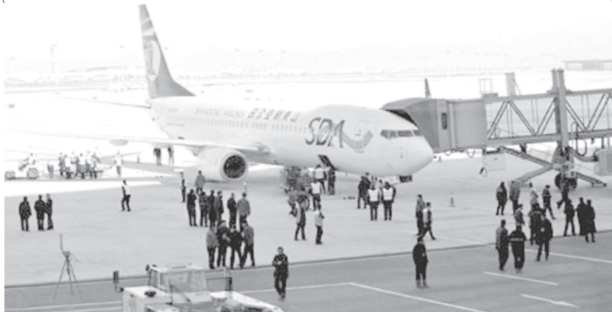
The SC1151 flight from east China's Shandong Province, the first one landing on Capital airport's new terminal in Beijing on 29 Feb, 2008. Capital airport's new terminal, a major expansion project in preparation for the passenger surge during the Olympics, received its first commercial flight after opening on Friday morning.