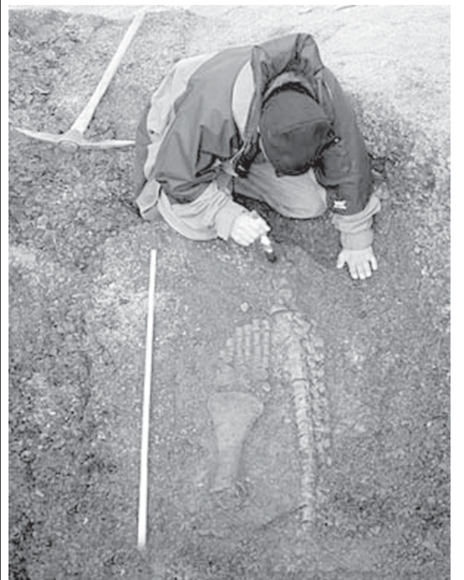
A researcher discovers parts of the fossilised skeleton poking out of the side on an island in the Arctic.

The first meeting of the Pakistan-India joint Judicial Committee on Prisoners was held in New Delhi on Tuesday, the Foreign Office said in a statement on Wednesday. The Committee recommended to the two governments that a consolidated list with full particulars and their present status of nationals in each other’s jails should be exchanged on 31 March, 2008. According to an agreement between the two governments, the fishermen in custody whose nationality status has been confirmed should be released and in remaining cases, consular access should be provided to them by 31 March, 2008, according to the statement.—Xinhua