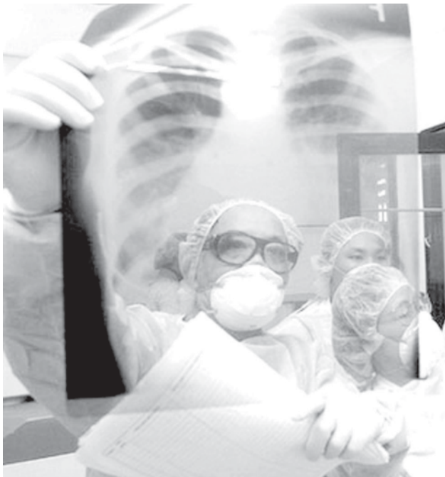
A doctor and his colleagues inspect the lung X-ray results of a young child at a hospital in Vietnam. Patients with end-stage chronic obstructive pulmonary disease (COPD) who have two lungs transplanted in place of one live nearly two years longer on average, according to a study released on Friday.