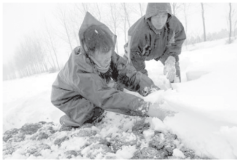
Farmers harvest vegetable in the snow-covered fields in Dayu township of Hefei, capital of east China's Anhui Province, on 27 Jan, 2008.

BEIJING, 29 Feb— Atmospheric scientists have long known that most snow and rain forms in chilly conditions high in the sky, under most conditions, the moisture needs something to cling to in order to condense.