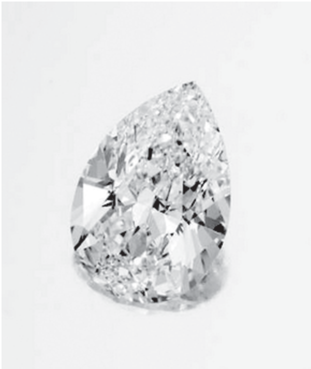
A 72-carat flawless white diamond worth an estimated $10 to $12 million is seen in this undated handout photo released by Sotheby's Asia to Reuters on 29 Feb, 2008. —INTERNET