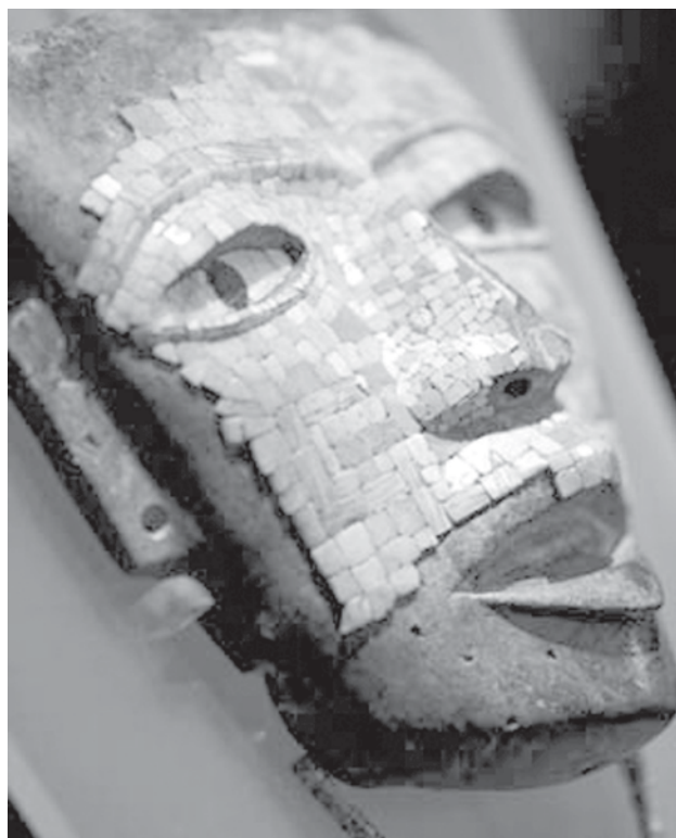
A turquoise encrusted mask is displayed during a media preview of the “Isis and the feathered serpent” exhibition at Mexico City’s National Museum of Anthrology and History on 27 Feb, 2008.