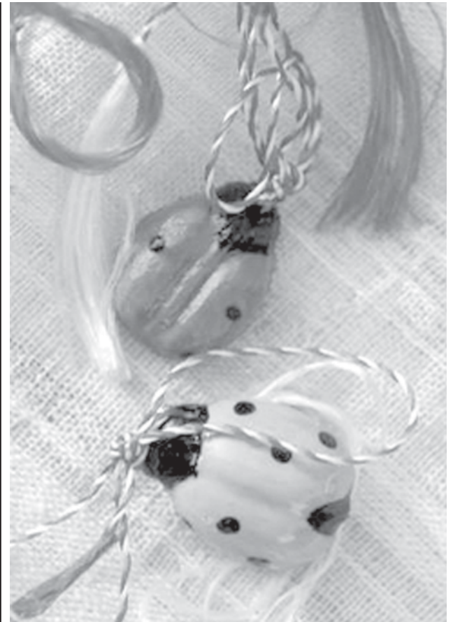
Small handmade figurines, called "Martisor", are displayed at the Romanian Peasant's Museum during the "Martisor Fair" in Bucharest on 28 Feb, 2008.