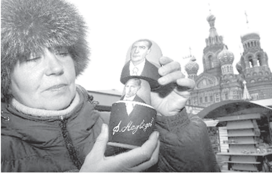
This photo taken on 28 February shows portraits of Russian presidential candidate Dmitry Medvedev and President Vladimir Putin.