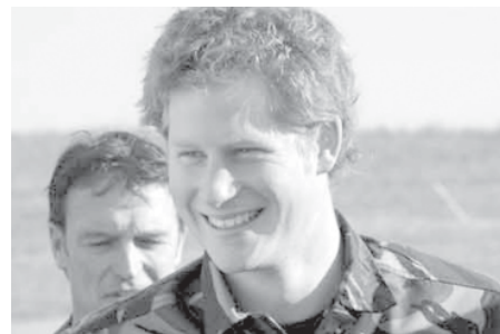
Britain's Prince Harry.

LONDON, 28 Feb—Prince Harry has been serving with the British Army in Afghanistan for 2-1/2 months, the Defence Ministry said on Thursday.