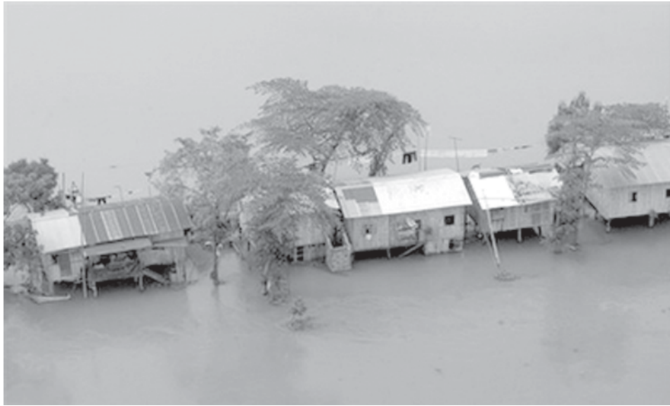
Homes are surrounded by floodwaters due to heavy rains in Guayas Province, Ecuador, on 28 Feb, 2008. Ecuador's President Rafael Correa said that 25 percent of the country's territory is flooded.