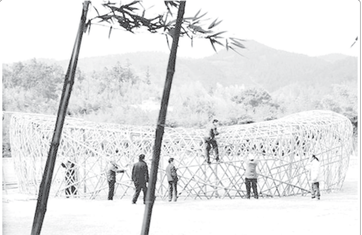
Skilled craftsmen examine a nearly finished bamboo model of the "Bird's Nest," also known as the Beijing National Stadium, at a Hangzhou tourism site, in eastern China's Zhejiang Province, on 24 Feb, 2008. This one-twentieth scale model of the "Bird's Nest" required nearly one thousand bamboo branches and about two weeks to make.