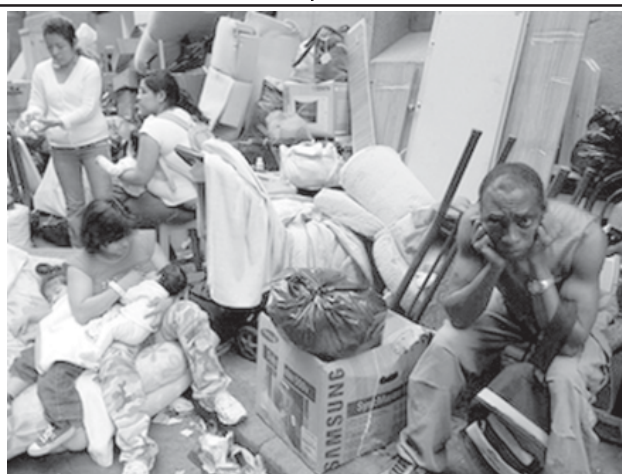
People sit among their families belongings after being evicted from a building by the police in Buenos Aires, on 25 Feb, 2008. A local court ordered the eviction of nearly 240 families from the property, where a construction company will build a new shopping centre.