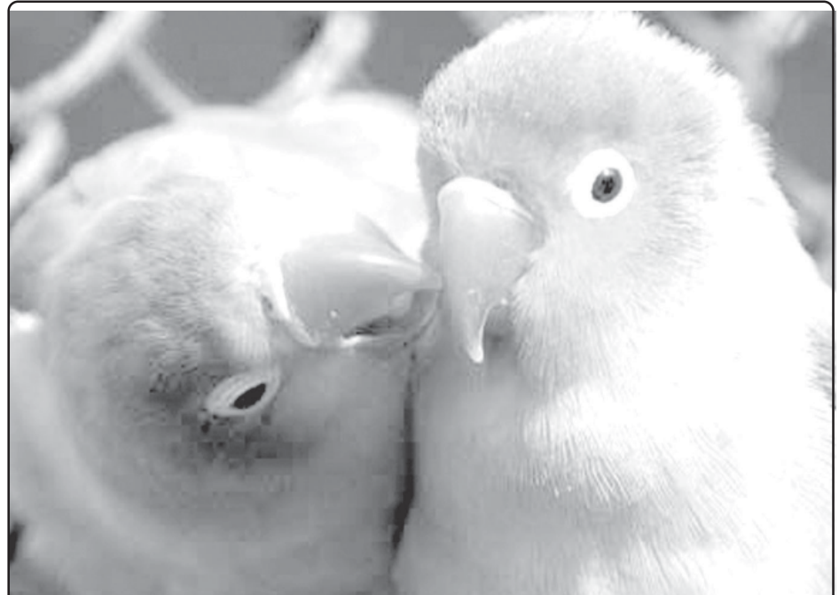
A pair of intimate parrots enjoy early spring at Hongshan wild zoo in Nanjing, capital of east China's Jiangsu Province, on 24 Feb, 2008.