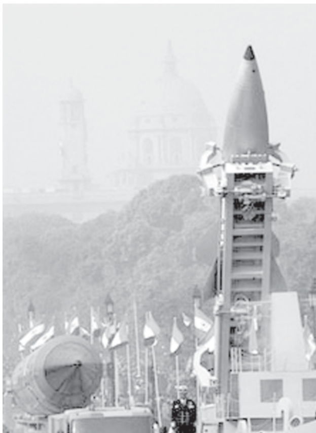
An Indian missile on display in New Delhi. India conducted its first test of a nuclear-capable missile from an undersea platform, completing its goal of having air, land and sea ballistic systems, the defence ministry said.