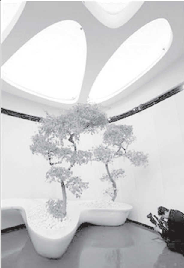
A camera man films an art piece entitled 'Wish Tree' created by Japan artist Yoko Ono inside the 'Mobile Art' exhibition in Hong Kong, on 26 Feb, 2008. 'Mobile Art,' is a traveling exhibition featuring pieces by 20 contemporary artists, in which all of the works are inspired by the iconic Channel quilt bag. The exhibition will begin in Hong Kong on 27 Feb, and will then travel around the world to Tokyo, New York, London, Moscow, and Paris.