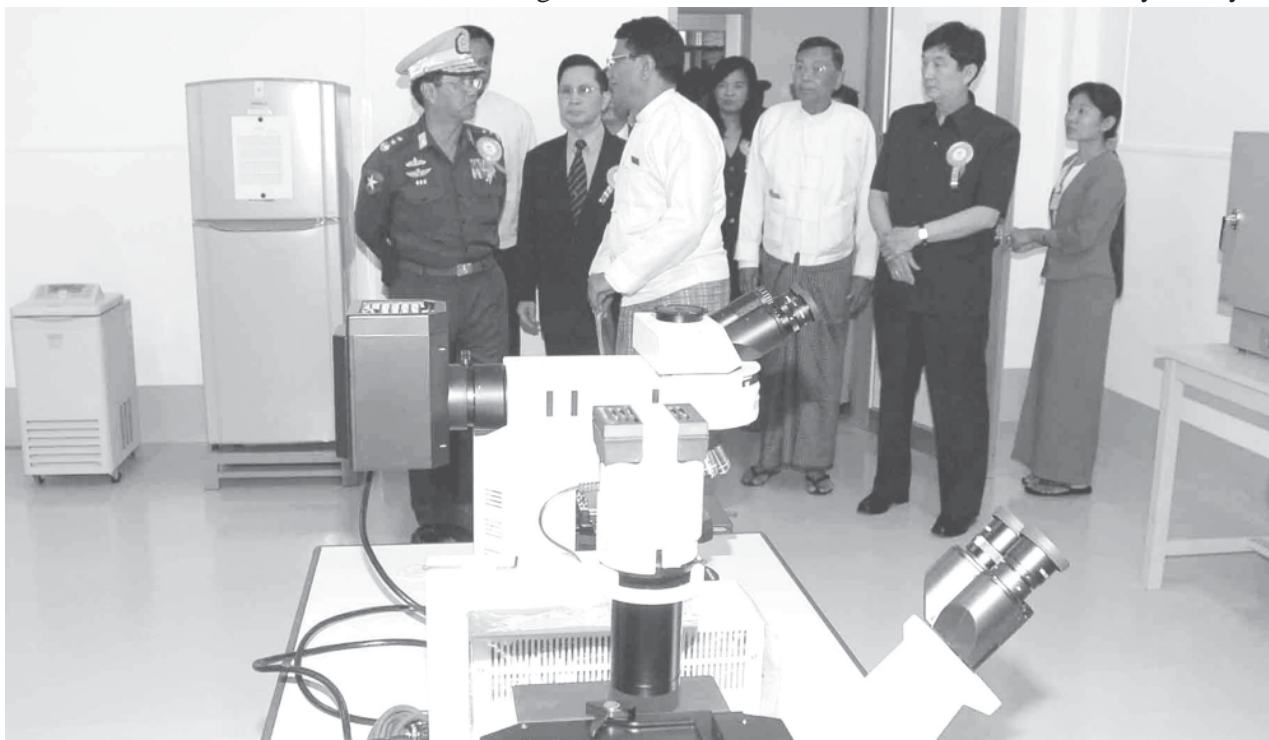
Lt-Gen Myint Swe of Ministry of Defence visits National Influenza Centre in Dagon Township.

First and foremost, I would like to thank all our partners present here today, especially WHO for its close collaboration with the Ministry of Health with technical support which is evidenced by successful (See page 10)