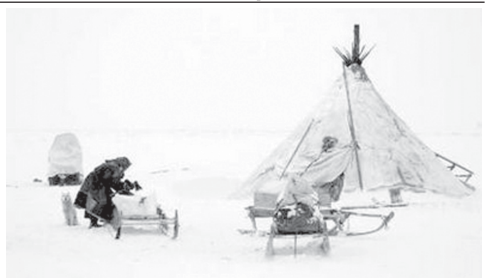
A Nenets woman works at her settlement in the Tundra region near village of Yar-Sale, located in the Yamal peninsula above the polar circle, some 2,150 km (1336 miles) northeast of Moscow, on 25 Feb, 2008. The Nenets are indigenous people in Russia's arctic region north of the Urals.