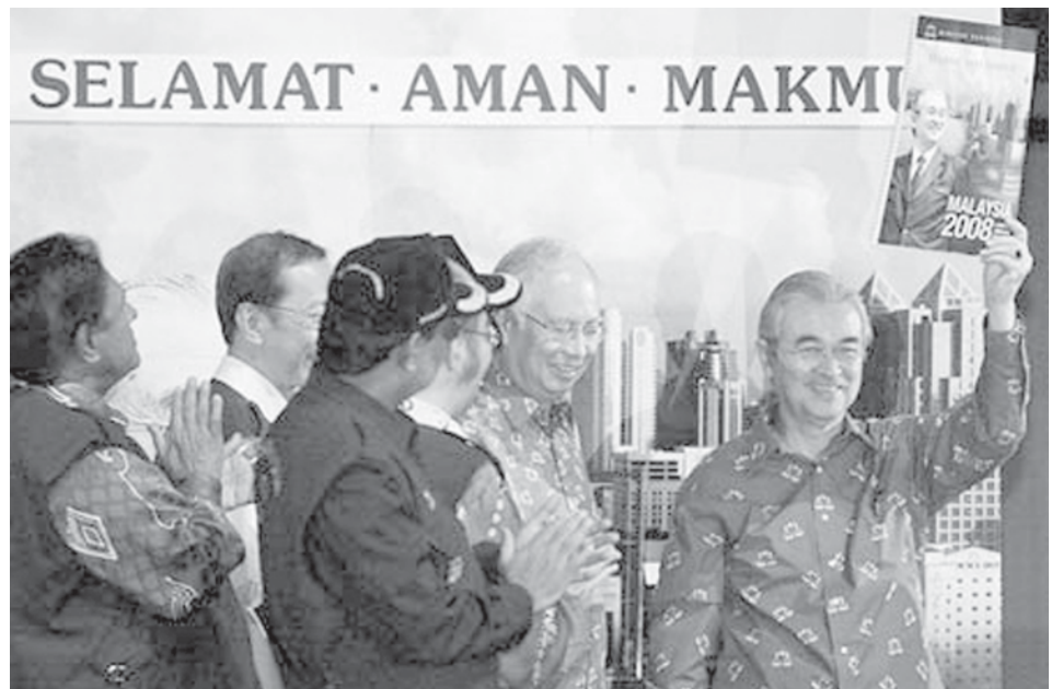
Malaysian PM Abdullah Ahmad Badawi (R) shows a booklet on his ruling party's manifesto for the upcoming general election during its launch in Kuala Lumpur on 26 Feb, 2008 on 26 Feb, 2008.

Thousands of protesters march towards the Presidential Palace in Manila on 26 Feb, 2008, to call for the ouster of Philippine President Gloria Macapagal Arroyo. INTERNET