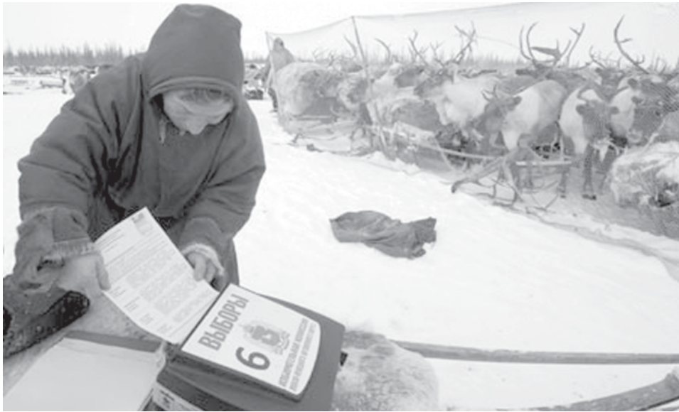
A man casts his ballot as he takes part in early voting for Russia's presidential election in the Tundra region, near the village of Yar-Sale, located in the Yamal peninsula above the polar circle, some 2,150 km (1,336 miles) northeast of Moscow, on 25 Feb, 2008.