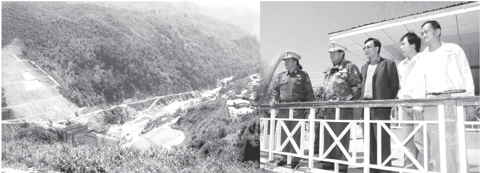
Lt-Gen Kyaw Win inspects Shweli Hydropower Project in Shan State (North).