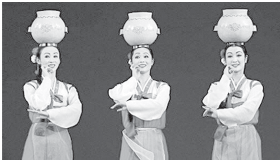
North Korean dancers perform a water jar dance onstage for members of the New York Philharmonic orchestra on the eve of their concert in the North Korea capital, Pyongyang on 26 Feb, 2008.—INTERNET