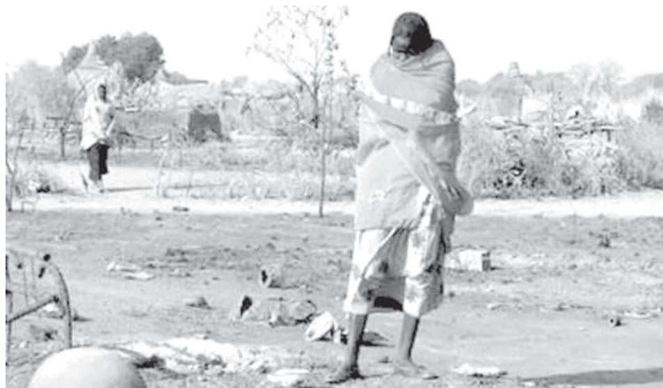
A woman stands in the ruins of a village destroyed in recent fighting near West Darfur's capital el-Geneina, on 22 Feb, 2008. Fighting has continued in Sudan's Darfur region despite an agreement to deploy the world's largest UN-funded peacekeeping operation there and people say they are losing faith in the international community's will or ability to help them.