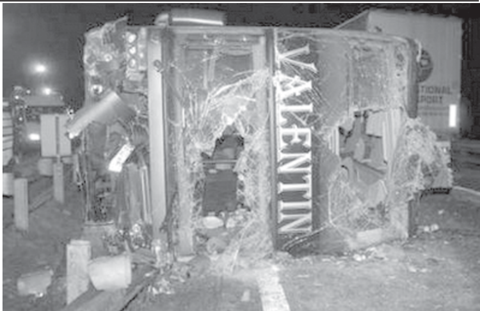
A Romanian bus lies crashed on the side of the A4 autobahn near Schwechat in Austria's province of Lower Austria early morning on 25 Feb, 2008.