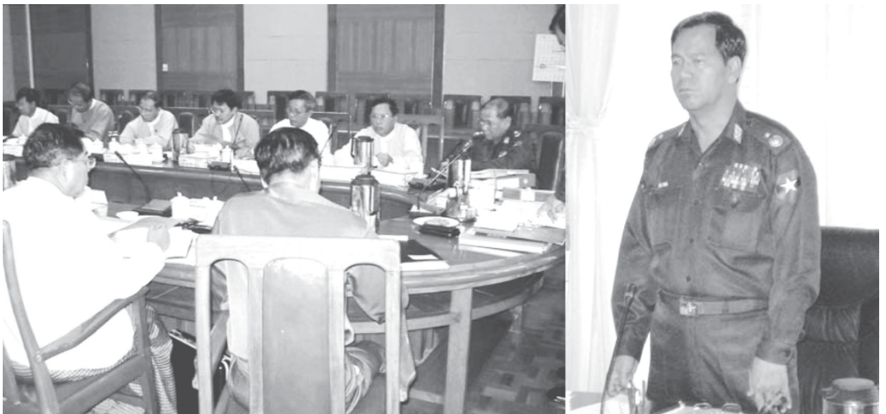
Minister Maj-Gen Hla Tun delivers an address at coordination meeting on achievement in implementing objectives of the F & R Ministry.

NAY PYI TAW, 25 Feb — The 97th meeting of Bank executive committee and Myanmar Banks Association under the Ministry of Finance and