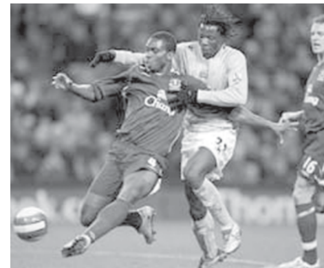
Manchester City's Mwaruwari Benjani (C) is tackled by Everton's Joseph Yobo.