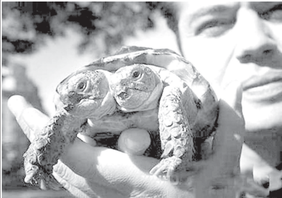
A two-headed Greek turtle named Janus is seen at the Natural History Museum in Geneva on 5 Sept, 2007.