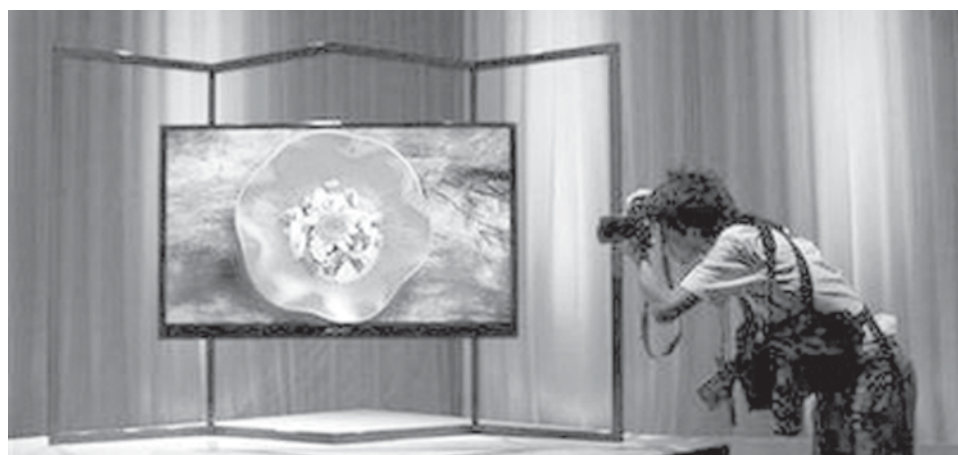
A photographer takes a photo of a Sharp LCD TV at a news conference in Tokyo. Sony is planning to start buying TV-use LCD panels from Sharp as early as in the next business year that begins in April, a source close to the matter said on 23 Feb, 2008.

The first massive project to pipe natural gas from the west to the east was put into commercial operation at the end of 2004, starting from the Tarim Basin of Xinjiang and arriving in Shanghai.