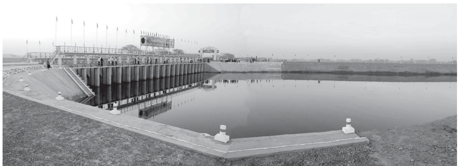
Takaw Sluice Gate in Thongwa Township.