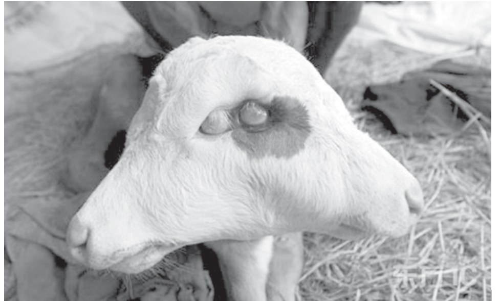
A two-faced calf was born in Indonesia recently. The animal has a normal set of lungs, heart, liver and intestines — but an extra face. —XINHUA

A citizen clears up street that covered with snow in Jinan, capital of east China's Shandong Province, on 25 Feb, 2008. The snowfall in most parts of Shandong Province recently is said in favour of spring farming. XINHUA