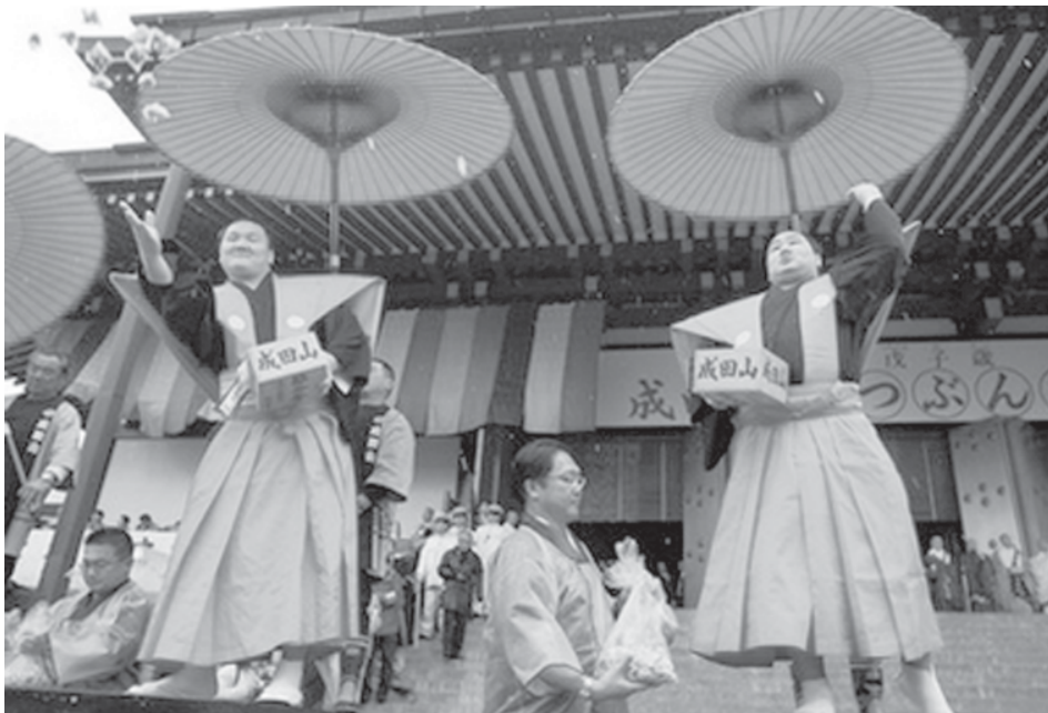
Two Mongolian sumo grand champion Hakuho, left, and Asashoryu throw packs of parched soybeans over a crowd gathered at the Naritasan Shinshoji Buddhist temple in Narita, near Tokyo, on 3 Feb, 2008.