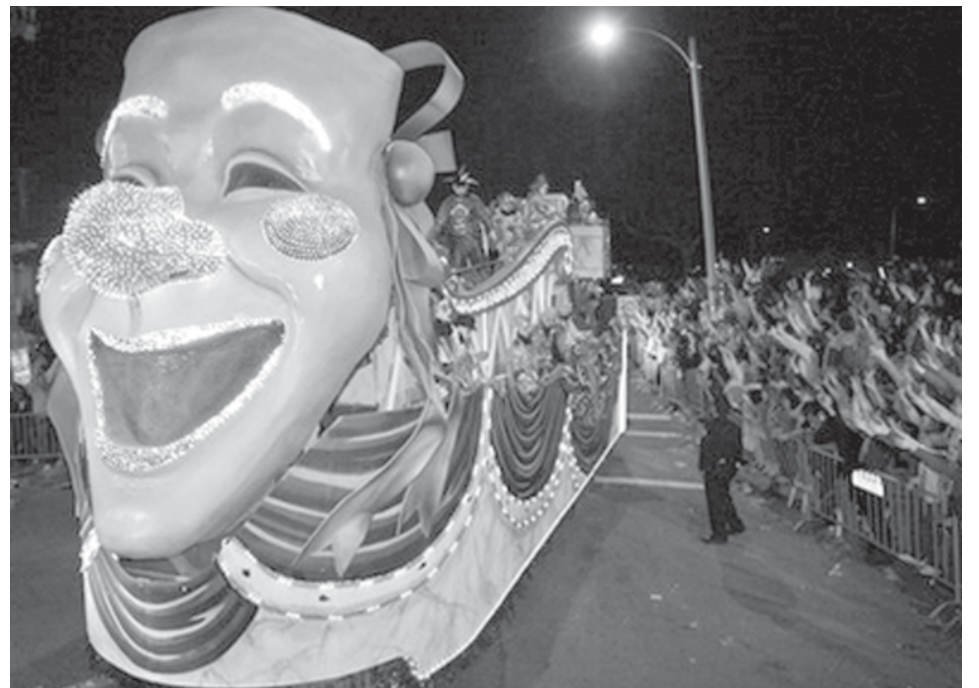
A float lit with fiber optic lights makes a turn during the Krewe of Endymion Mardi Gras parade in New Orleans on 2 Feb, 2008. Carnival revelers were greeted with good weather today in the weekend before Fat on 5 Feb.