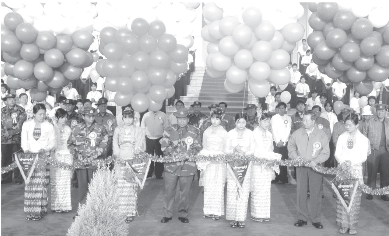
Lt-Gen Ye Myint, Commander Brig-Gen Myint Soe and Minister U Thaung formally open the three-storey building of Technological University (Kalay).

of the technological university in Kalay.