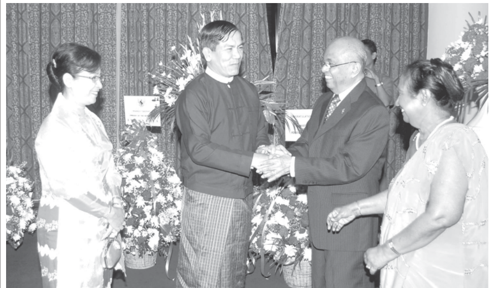
Sri Lankan Ambassador to Myanmar Mr PAD Samarasekera and wife greet Minister for Foreign Affairs U Nyan Win and wife on the reception of the 60th Anniversary Independence Day of the Democratic Socialist Republic of Sri Lanka at the Sri Lankan Embassy on 4 February.