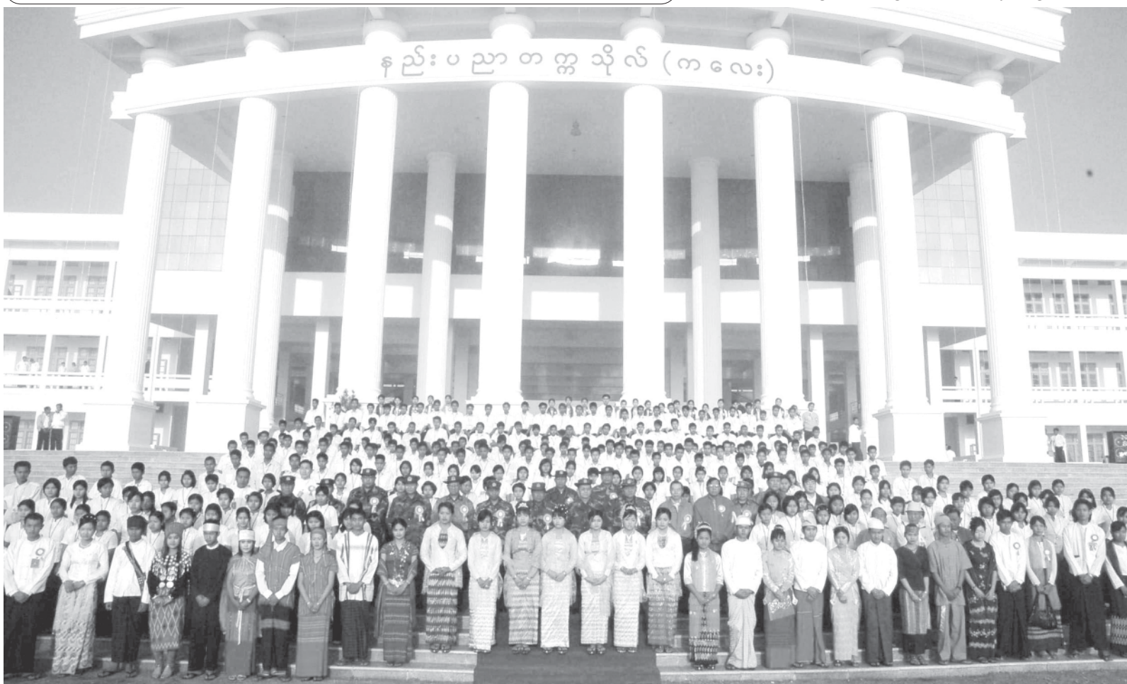
Prime Minister General Thein Sein and party pose for photo together with faculty members, students and local people at Technological University (Kalay).