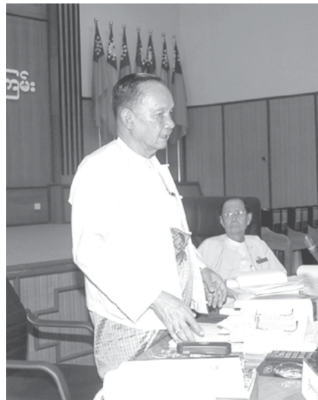
Attorney-General U Aye Maung.