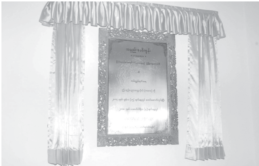
Prime Minister General Thein Sein unveils stone plaque of Technological University (Kalay).