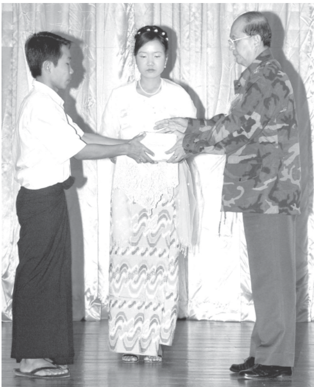
Prime Minister General Thein Sein presents prize to a winner of essay competition in commemoration of the 61st Anniversary Union Day. — MNA

He said every nation in the world accepts that education is the major sector for development of the nation and its people. Highly-qualified human resources are essential for building a developed nation and raising the living standard of the people. These are national requirements. Therefore, the government is implementing the national education promotion programmes with the opening of universities and colleges to produce educated human resources in major areas, he said.