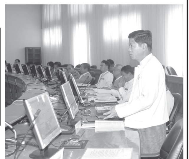
Deputy Chief Justice U Thein Soe, member of the Commission for Drafting State Constitution, presents a report. (News on page 16)