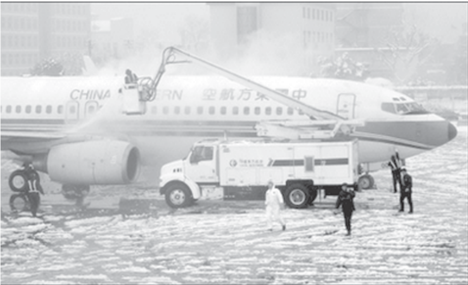
Workers remove snow and ice from a China Eastern plane at Shanghai's Hongqiao Airport. China has warned that the worst is not over in its national weather crisis as desperate holiday travellers jammed transport hubs and others endured bitter winter storms without power or water.