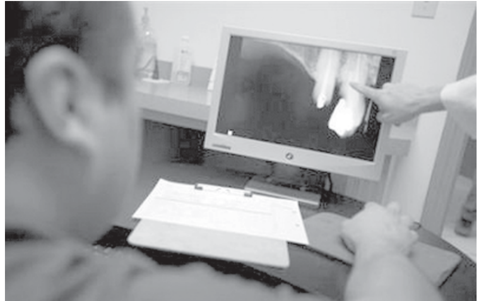
Dentists analyze a dental digital X-ray of an American patient at the Rio Dental clinic in the border city of Ciudad Juarez. Shrugging off concerns about hygiene and Mexico's brutal drug war, thousands of Americans are heading to Ciudad Juarez and other Mexican border cities for cheap dental treatment.