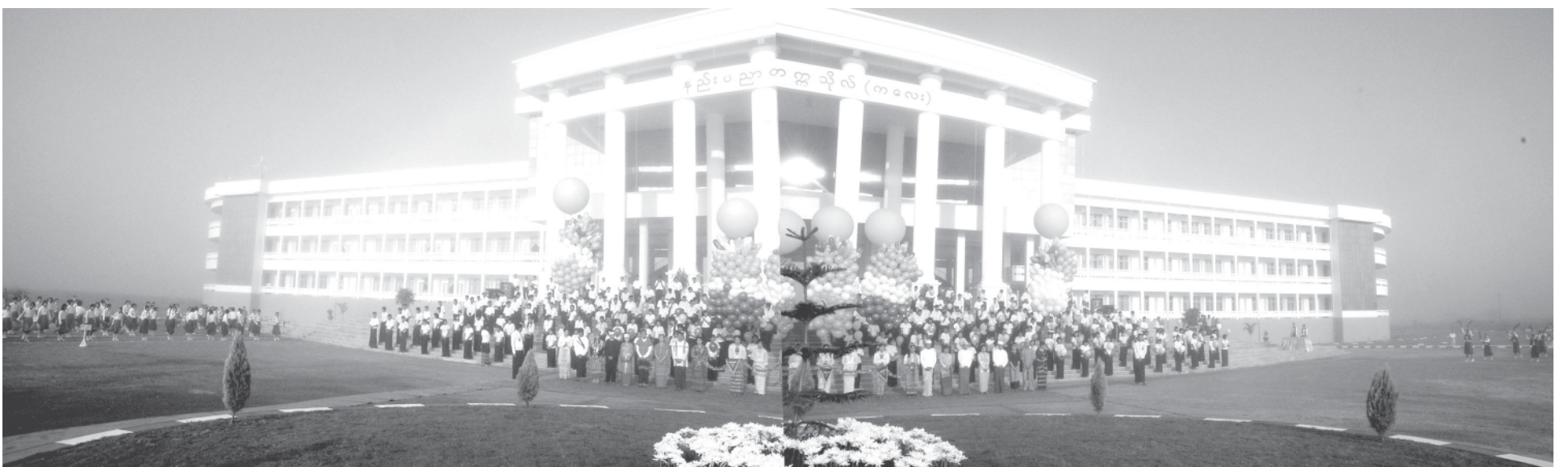
The opening ceremony of Technological University (Kalay) in progress.

It is incumbent upon the education sector to widen the horizons of youths and to train and nurture them to become ones on whom the State can rely. The entire national people are to make continued efforts for successful realization of the seven-step Road Map with duty consciousness and national outlook.