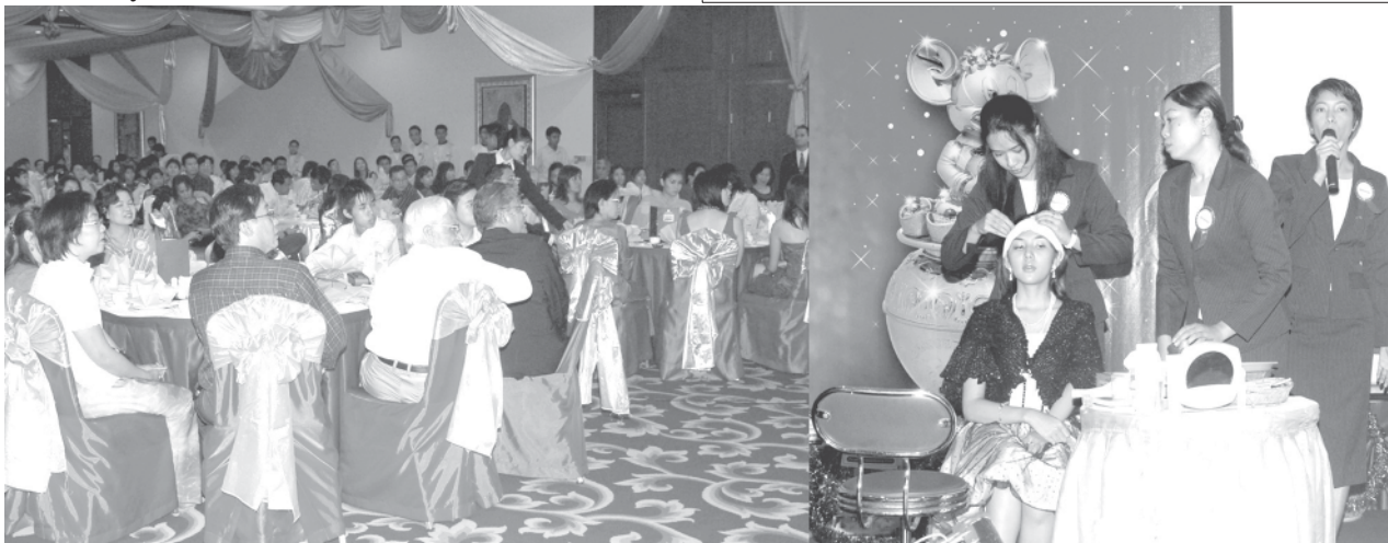
Introduction of Follow Me & Secret Beauty Products of Ta-Fa Trading Co Ltd in progress. — MNA

Please read "The former record of the station was (-4.0)°C (25)°F on 16th February, 2003." in the news "New Minimum Temperature Record" on Page 1 of this paper issued on 4 February, 2008.—Ed