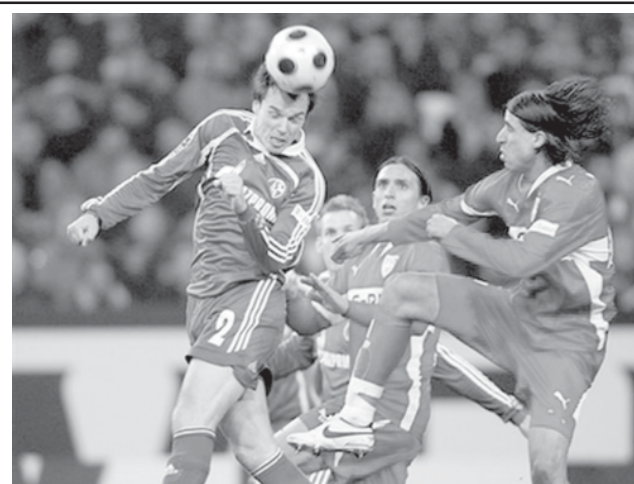
Schalke's scorer Heiko Westermann, left, and Stuttgart's Fernando Meira, right, jump for the ball during the German first division Bundesliga soccer match between FC Schalke 04 and VfB Stuttgart in Gelsenkirchen, Germany, on 3 Feb, 2008. Schalke defeated Stuttgart with 4-1.

"We wanted to train outside but it was impossible," smiled Japan midfielder Yasuyuki Konno. "It's the same situation for our opponents too so we have to make the best of it."