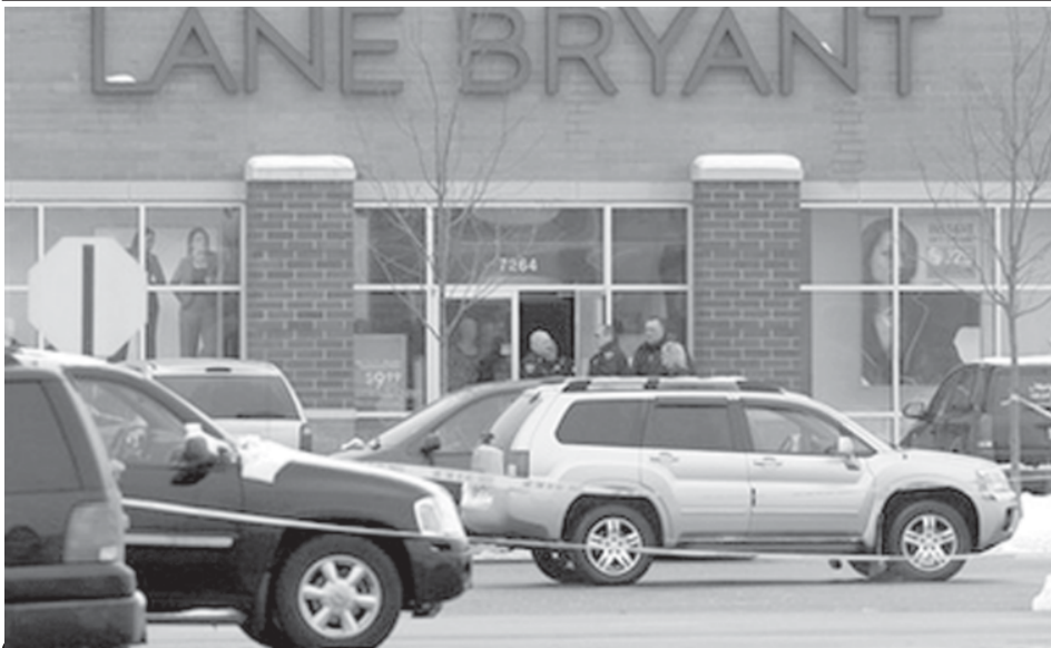
Police investigate the shooting in a Lane Bryant store at the Brookside shopping centre in Tinley Park, Ill, south of Chicago, on 2 Feb, 2008.