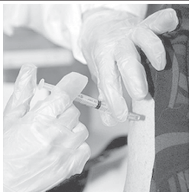
A nurse gives a woman a shot. Two drug companies are facing charges in France over a hepatitis B vaccine blamed for the death of a 28-year-old woman in 1998 and which caused serious side effects among 1,300 patients.