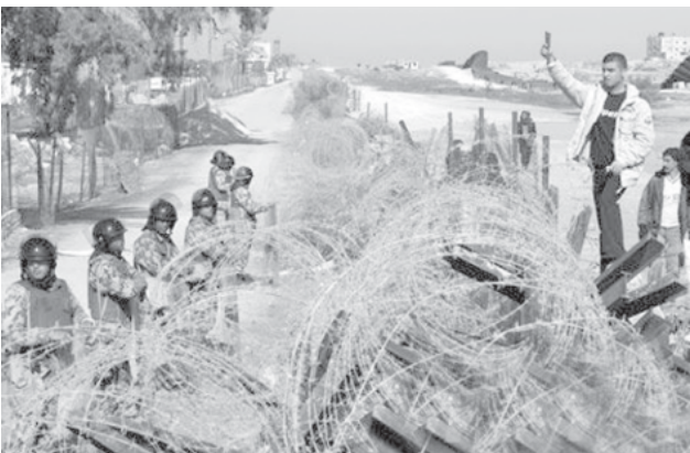
A Palestinian shows his ID to Egyptian soldiers guarding on the Egyptian side of the Rafah border crossing along the Egypt-Gaza border, on 3 Feb, 2008.