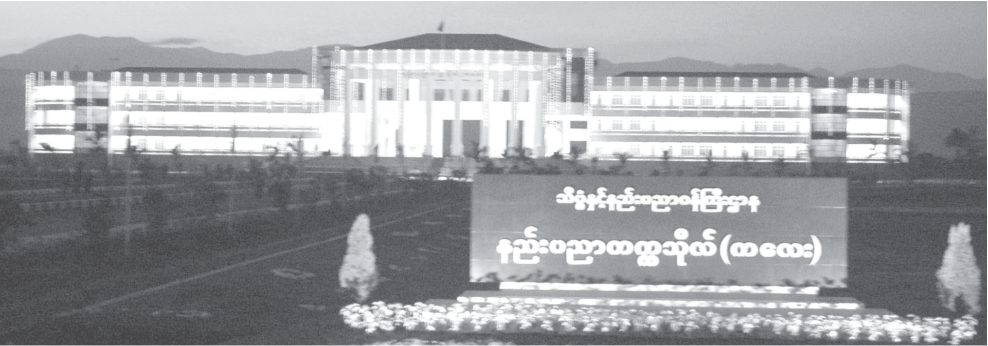
Technological University (Kalay) is illuminated at night.

Emergence of the State Constitution is the duty of all citizens of Myanmar Naing-Ngan.