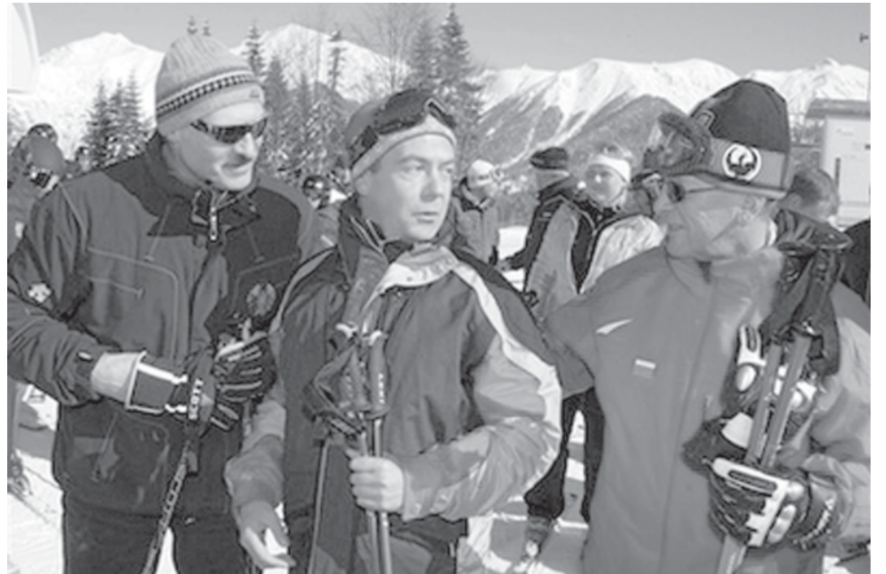
From left, Belarusian President Alexander Lukashenko, Russian First Deputy Prime Minister Dmitry Medvedev and Prime Minister Viktor Zubkov talk together as they ski at the Polyana Grand Hotel tourist complex in a Black Sea resort city of Sochi, Russia, on 3 Feb, 2008.