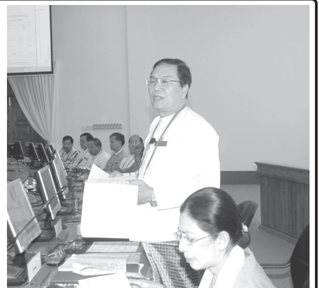
U Tha Hla, member of the Commission for Drafting State Constitution, presents a report. (News on page 16) — MNA