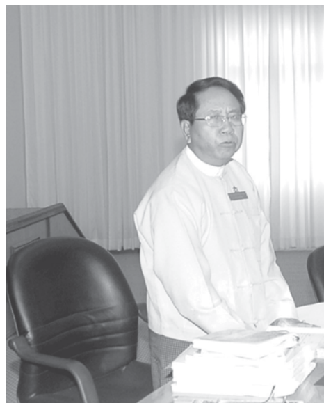
Minister Brig-Gen Kyaw Hsan. MNA