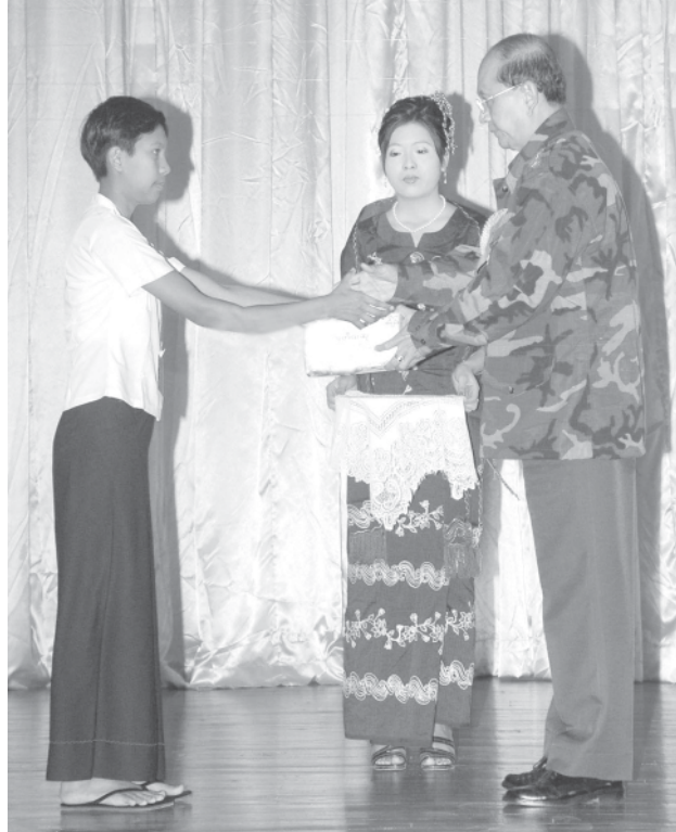
Prime Minister General Thein Sein presents prize to a winner of essay competition in commemoration of the 61st Anniversary Union Day. — MNA

Moreover, the projects for dams, river-water pumping and underground water tapping are being undertaken for development of Sagaing Division in-