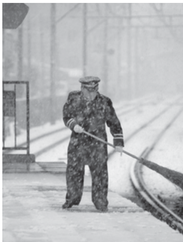
A station staff removes snow from a platform of a Tokyo station on 3 Feb, 2008. A snowfall covered Tokyo metropolitan area, disrupting air, railway and expressway traffic in eastern Japan.