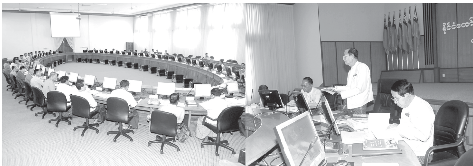
Chief Justice U Aung Toe delivers an address at meeting No 11/2008 of Commission for Drafting the State Constitution.

NAY PYI TAW, 4 Feb —The Commission for Drafting the State Constitution held meeting No 11/2008 at the commission office here this afternoon.