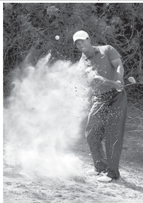
Tiger Woods from the US hits out of the desert sand after missing the fairway on the 3rd hole during the Dubai Desert Classic 3rd round in Dubai, United Arab Emirates, on 2 Feb, 2008.