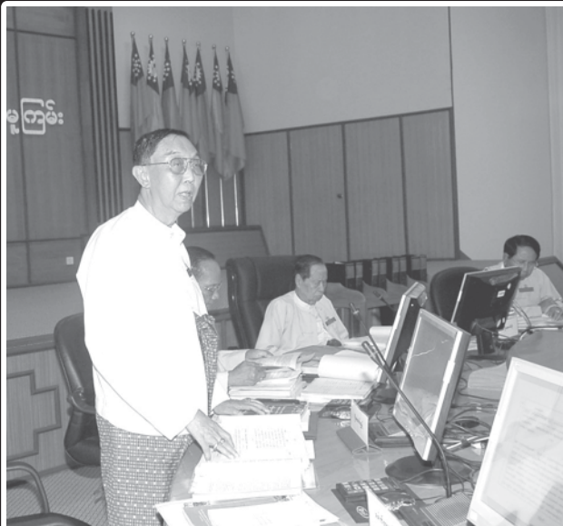
U Thaung Nyunt, member of the Commission for Drafting State Constitution, presents a report. (News on page 16)