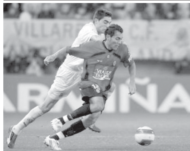
Real Mallorca's Juan Fernando Arango (front) and Villarreal's Bruno Soriano fight for the ball during their Spanish First Division soccer match at the Madrigal Stadium in Villarreal, on 3 Feb, 2008.

Boro squandered several chances in the second half notably through Gary O'Neil. In stoppage time they also had a goal disallowed when Jeremie Aliadiere smashed in a rebound after Stewart Downing's free kick came back off the post.