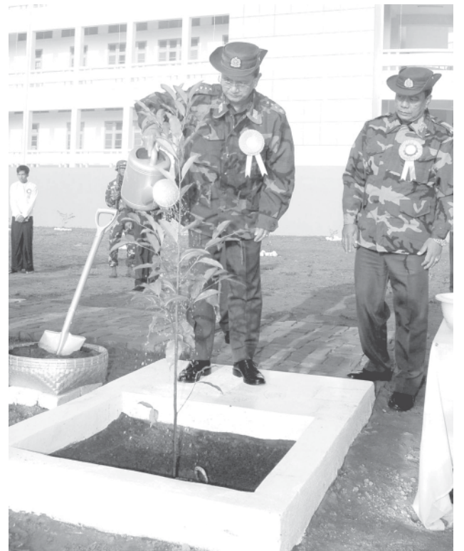
Prime Minister General Thein Sein plants a tree to mark opening of the three-storey building of Technological University (Kalay).

The State for its part is striving for the equitable development of all the states and divisions regardless of those with or without natural resources. With lofty aims, the State is trying to hand down good legacies to the posterity in political, economic, social