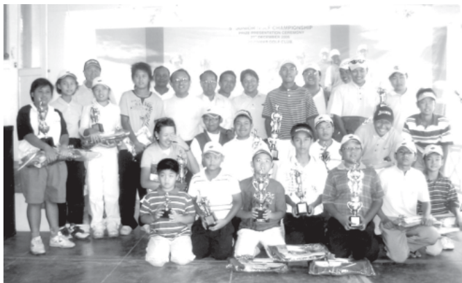
Winners of 5th New Generation Junior Golf Tournament pose for photo with responsible officials.

The main sponsor of the tournament is Han Golf Masters Pte Ltd and co-sponsors, Srixon, Han Event Management, Han Golf Masters Academy, Alpine Drinking Water, Myanmar Golf Club Driving Range, Han Golf Course Design and Construction and Golf Masters Magazine.