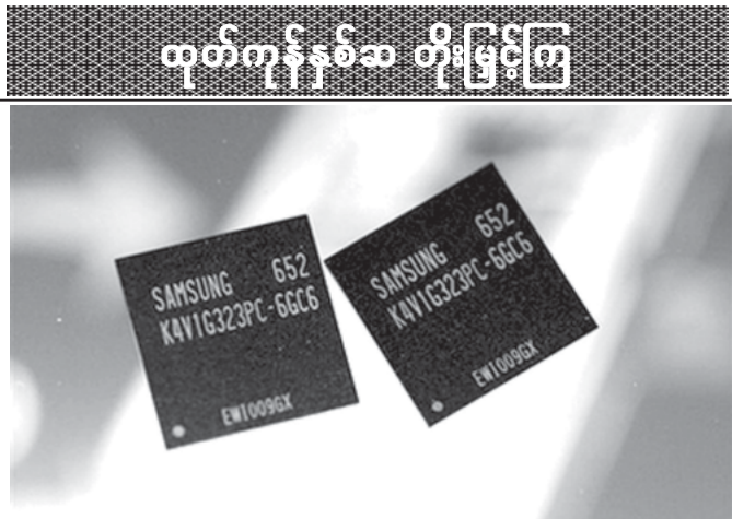
In this photo released by Samsung Electronics Co on 27 Dec, 2006, in Seoul, South Korea, shown are what they claim the industry's first one gigabit mobile DRAM (dynamic random access memory) for mobile products.—INTERNET