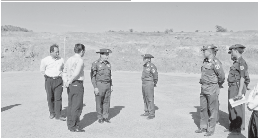
Commander Brig-Gen Maung Shein and Minister Maj-Gen Thein Swe inspect runway of An Airport. — TRANSPORT

After hearing reports on implementation of development tasks in the region, Minister Maj-Gen Thein Swe explained regional development tasks to be implemented by Manaung Township USDA and tasks of the association. He also gave instructions on the health, transportation and drinking water supply sectors in the region. — MNA