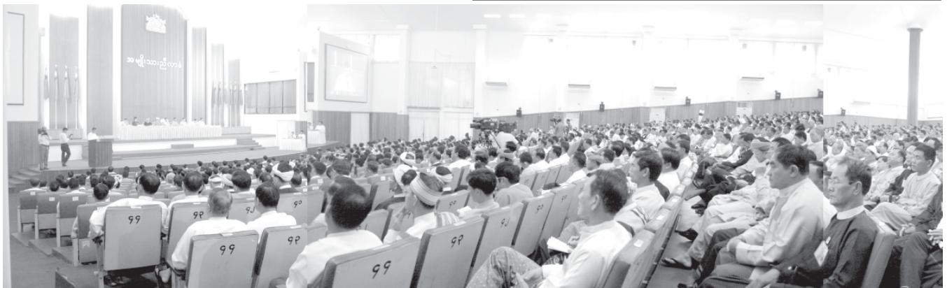
Plenary Session of the National Convention in progress at Pyidaungsu Hall of Nyaungnabin Camp, Hmawby Township. — MNA

YANGON, 27 Dec— Proposals of Delegate Group of National Races and Delegate Group of Peasants on laying down detailed basic principles for Chapters “Amendment of the Constitution”, “State Flag, State Seal, National Anthem and the Capital”, “Transitory Provisions” and “General Provisions” to be included in drafting the State Constitution made at the Plenary Session of the National Convention held at Pyidaungsu Hall of Nyaungnabin Camp in Hmawby Township, Yangon Division, today, will be published in the dailies. — MNA