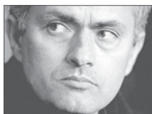
Mourinho's Chelsea trail Manchester United by four points.

To lose Petr and John at the same time is a very difficult problem to solve, especially in a