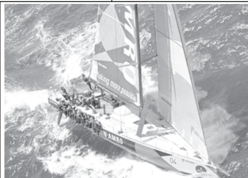
In this photo released by Rolex, ABN Amro is in action during the start of the Sydney to Hobart yacht race in Sydney, Australia on Boxing Day, 26 Dec, 2006. INTERNET

Heavy fog in Nanjing in east China's Jiangsu Province on Monday caused the cancellation of 171 flights, stranding thousands of tourists at the airport.—MNA/Xinhua