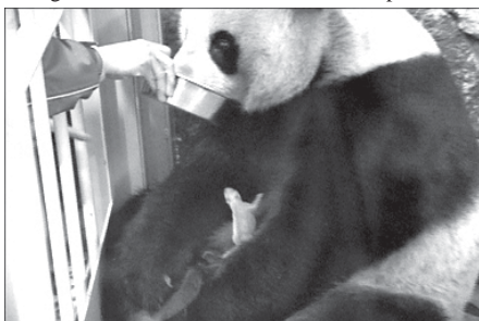
12-year-old female giant panda 'Meimei' holding her newborn baby on her chest. Santa Claus brought Japan twin giant panda cubs on 23 Dec, 2006, one of the world's rarest animals originated in China.

"Thanks to the scientists' hard work, we have accumulated mature techniques and experience in breeding giant pandas," he said, "the record number of cubs in this year shows the captive breeding of giant pandas has entered a golden age." Gaint pandas, only found in China, are known as "living fossils" and about 1,590 still live in the wild, mostly in the provinces of Sichuan and Shaanxi. More than 180 had been bred in captivity at zoos worldwide by the end of 2005.—MNA/Xinhua