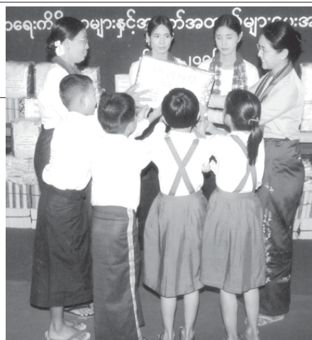
Myanmar Women's Affairs Federation donates stationery to primary school students in Kyauktan Township.