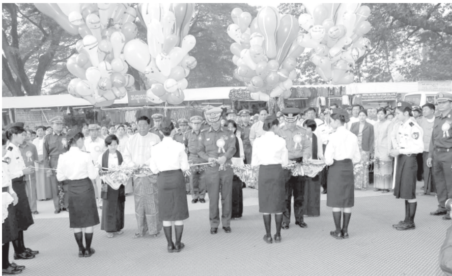
Minister Maj-Gen Aung Min, Deputy Director-General of Myanmar Police Force Brig-Gen Zaw Win and Deputy Minister U Pe Than formally open traffic rules competitions and exhibition.