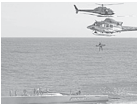
Three Maximus crew members were airlifted to safety. —INTERNET

"The mast just came straight down the boat, down the cockpit, out the back, boom and all," said Ian Treleaven, one of the Maximus crew members who