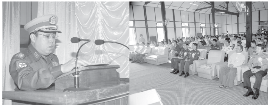
Commander Brig-Gen Wai Lwin speaks at opening ceremony of traffic rules knowledge competitions and exhibition.