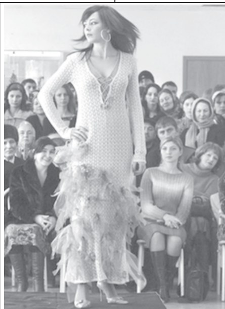
People look at a model wearing a dress during a fashion show in the Chechnya's capital Grozny on 25 Dec, 2006. — INTERNET

The Maracaibo city council was discussing a project on giving financial aid to the families affected by the incident. — MNA/Xinhua