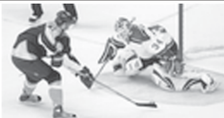
Nashville Predators right wing Alexander Radulov (47) of Russia scores a goal against St Louis Blues goalie Manny Legace (34) in a sudden-death shootout to give the Predators a 3-2 win in an NHL hockey game in Nashville, Tenn, on Tuesday, 26 Dec, 2006.