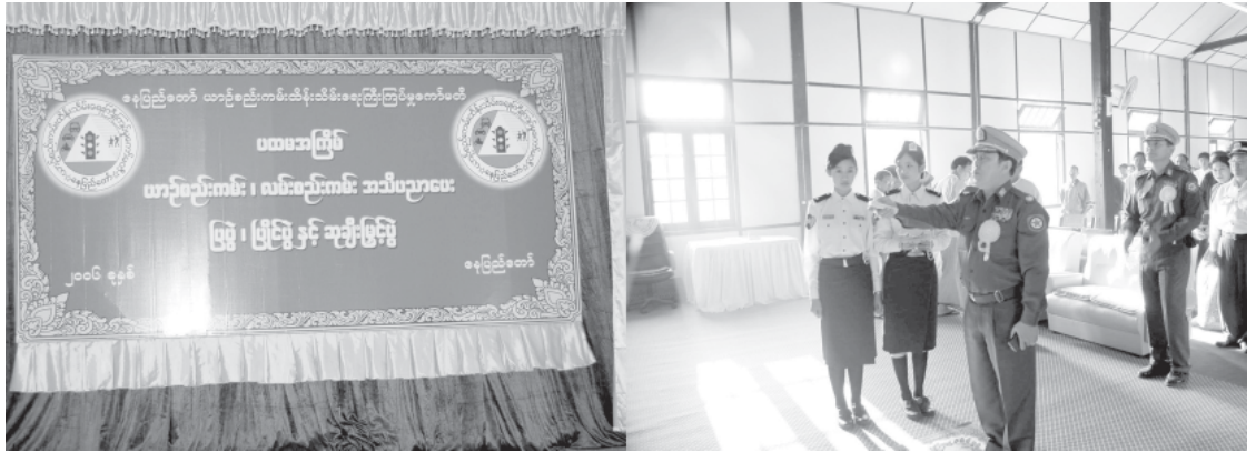
Commander Brig-Gen Wai Lwin unveils signboard of competitions and exhibition on traffic rules knowledge.

Also present on the occasion were Minister for Rail Transportation Maj-Gen Aung Min, Minister for Progress of Border Areas and National Races and Development Affairs Col Thein Nyunt, Deputy Ministers for Rail