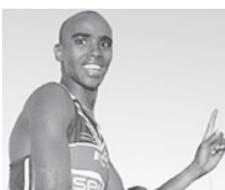
Farah won the event by over 90 seconds.

DUBLIN, 27 Dec — Mo Farah equalled Rob Denmark's British 5km road running record in County Donegal, Ireland, on Boxing Day.