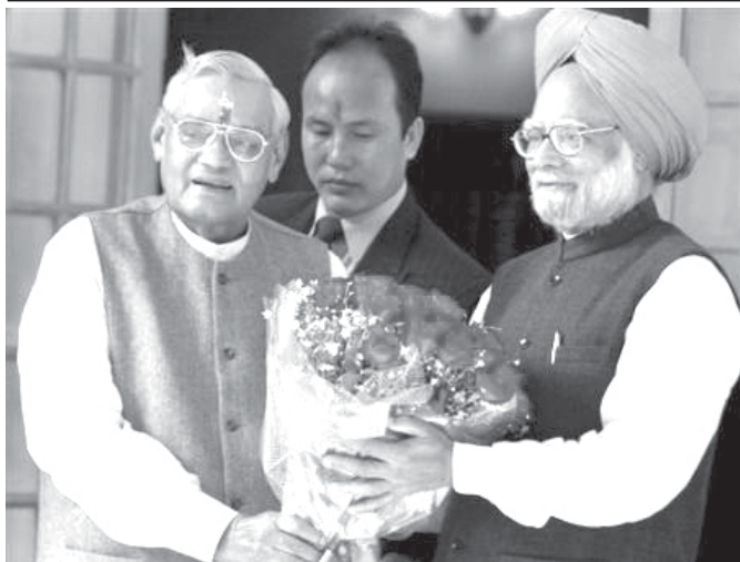
Indian Prime Minister Manmohan Singh, right, presents flowers to former Prime Minister Atal Bihari Vajpayee in New Delhi, India, on 25 Dec, 2006.