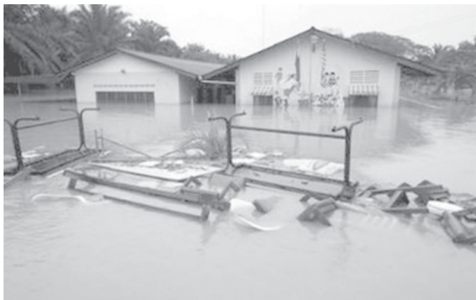
Pieces of furnitures float outside a flooded school in Malaysia's small town of Panchor in the southern state of Johor on 26 Dec, 2006.