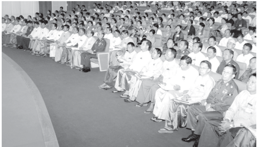
Chairman of NCCC Secretary-1 Lt-Gen Thein Sein and members, and delegates to National Convention attend Plenary Session of National Convention. — MNA

Delegates presented proposals of Delegate Group of National Races on laying down detailed basic principles for Chapters “Amendment of the Constitution”, “State Flag, State Seal, National Anthem and the Capital”, “Transitory Provisions” and “General Provisions” in drafting the State Constitution. First, Delegate U Ah Phar of Shan State (East) presented the proposal.