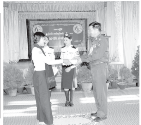
Minister Maj-Gen Aung Min presents prize to a winner.