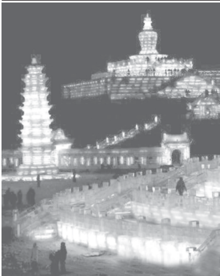
The ice sculptures in Harbin, capital of northeast China's Heilongjiang Province, prior to the official launch of the annual ice and snow festival on 23 Dec, 2006. Over 2,000 pieces of ice and snow sculptures are displayed at the festival that boasts the largest of its kind in the world.