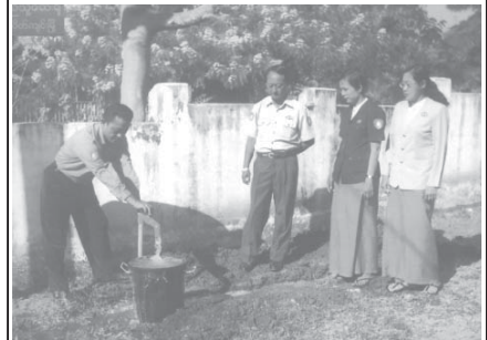
Officials of Thabeikkyin Townshi DAD inspect water supply facility in a ward in Thabeikkyin Township.

THABEIKKYIN, 25 Dec — Officials of Thabeikkyin Township Development Affairs Department inspected the supply of water to wards in Thabeikkyin on 28 November.