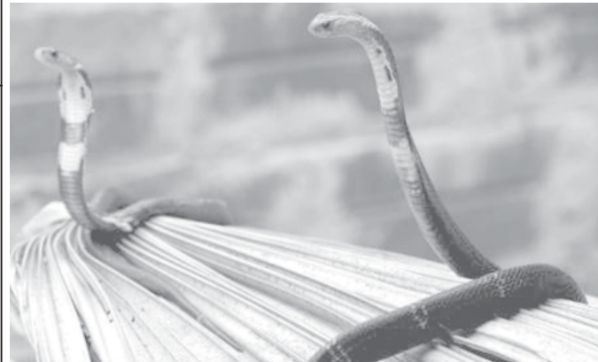
Copperhead snakes slither at a snake farm in Vinh Son, northwest of Hanoi, on 20 Dec, 2006. About 70 percent of families in this village breed Copperhead snakes that are later sold to restaurants and medicine halls. Last year, the village exported 160,000 snakes.

allow for repairs on buildings that have lacked essential upkeep since most of them were completed in the early 1950s. "Through the Capital Master Plan, UN Headquarters will become a safer, healthier and more secure environment for staff, delegates, and visitors," he said in his statement, one of the last during his decade-long tenure at the helm of the world body before retiring at the end of next week. MNA/Xinhua