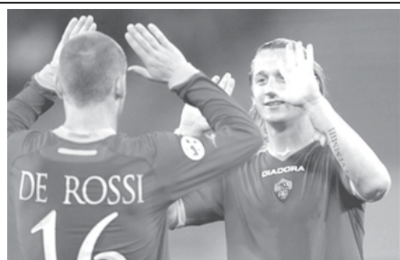
AS Roma's Philippe Mexes of France, right, celebrates with teammate Daniele De Rossi at the end of the Italian first division soccer league match between AS Roma and Cagliari at Rome's Olympic stadium, on 23 Dec, 2006.