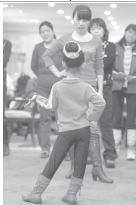
A girl poses and receives instructions from a coach during a lesson at a model training course for children in Beijing on 24 Dec, 2006. About 200 children aged 4 to 16 are taking part in this training course since it was founded in April. The children undergo physical training, stagecraft and various kinds of dances such as step dance and ballet during the courses, local media reported.

Last week's winner, Will Smith-starred "The Pursuit of Happiness" slipped to the number two spot this weekend with an estimated 15 million dollars. The film based on the true story of a homeless single father who eventually becomes a successful stockbroker has brought in some 53.3 million dollars since it debuted last week.— MNA/Xinhua