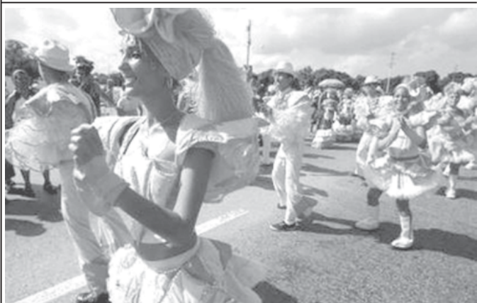
Revellers dance on Havana's Revolution Square on 23 Dec, 2006. Celebrations in Cuba have begun for the 48th anniversary of the Triumph of the Revolution and to mark the end of the year.