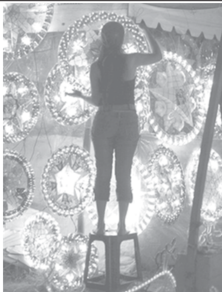
A woman hangs holiday decorations at her store in Manila, Philippines, on 23 Dec, 2006. Before Christmas, many Filipinos embraced the holiday season by hanging decorations.