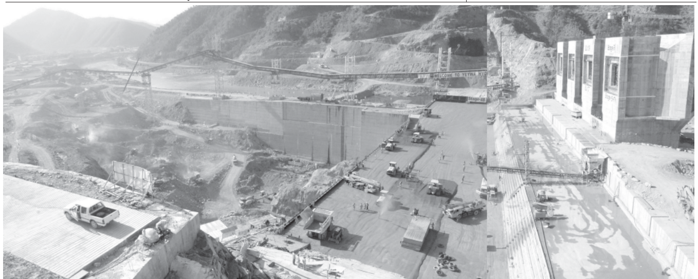
Yeywa Hydel Power Project under construction.—MNA

The minister visited warehouses in Ahlon Township where electrical equipment and related items are stored.—MNA