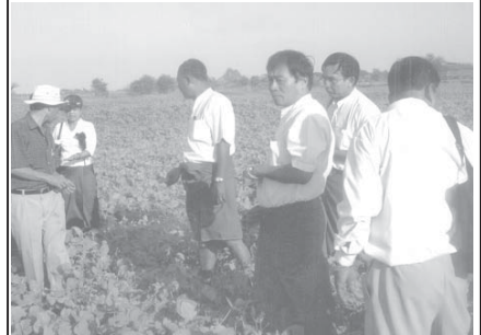
Officials of Yangon Division Agricultural Service inspect crops cultivation during their field trip.

YANGON, 25 Dec — Crops in Dagon Myothit (Seikkan) and Dagon (South) Townships were sprayed with pesticides on 14 December.