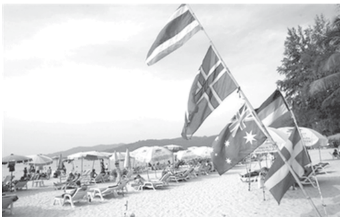
Flags from European nations as well as Australia and Thailand fly in the late afternoon breeze along Patong Beach on 24 Dec, 2006, in Phuket, Thailand. Tourists have returned to Thailand’s beaches in droves two years after a massive tsunami struck the area on 26 Dec, 2004.