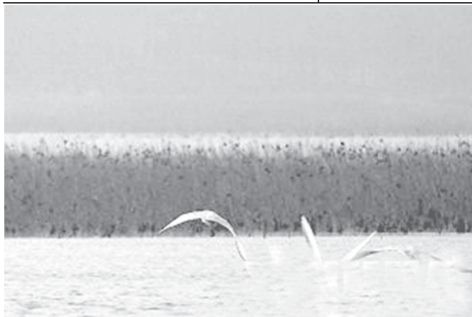
Shengtian Lake, the prime source of 900 hectares wetland, homing 238 species of bird and 52 varieties of fish, and a major stop for some migrant birds and an ideal winter shelter for some endangered wild animals, maintains unsoiled thanks to the local governmental measures including a lotus planting project in the area. —XINHUA

Under the new formula, Japan's dues will drop from 19.4 per cent of the total UN budget to 16.6 per cent, while China's will edge up from 2.05 per cent to 2.66 per cent.— MNA/Xinhua