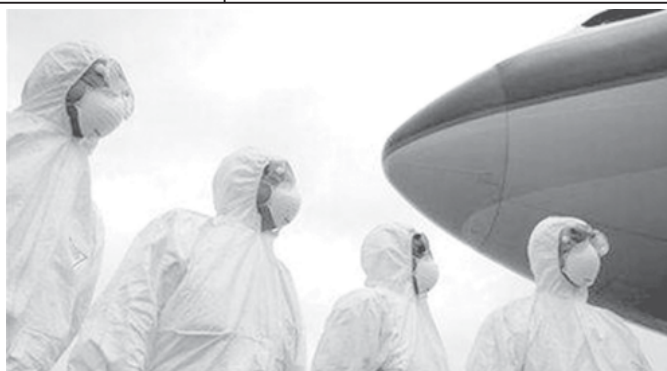
Members of Hong Kong's Health Department participate in an influenza simulation exercise at the Hong Kong International Airport recently.