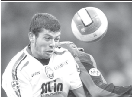
Atalanta's Massimo Donati, left, and Inter Milan's Patrick Vieira of France go for a high ball during an Italian major league soccer match at the San Siro stadium in Milan, Italy, on 23 Dec, 2006.

But he failed to revive the club who suffered a humiliating loss in the League Cup quarterfinals last Tuesday when they were beaten 1-0 at home by Fourth Division side Wycombe Wanderers.