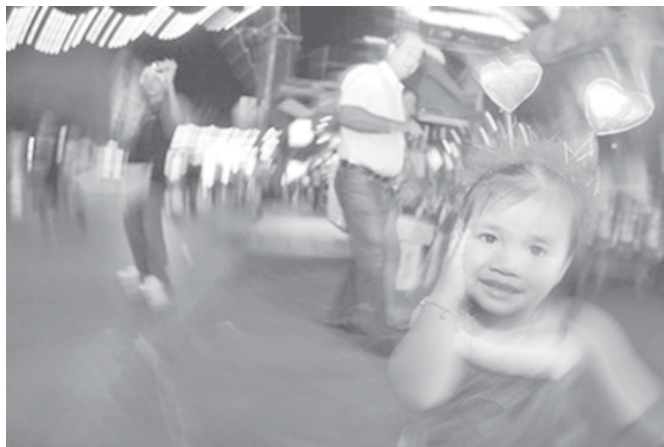
A young Thai girl dresses up for Christmas on Sunday, 24 Dec, 2006 near Patong Beach in Phuket, Thailand.

Over 1,000 high school students from either country visited the other in 2006. The exchange between the youths, who carry the responsibilities for future, is very important for the development of bilateral ties and he would endeavour to offer support, the Premier added. — MNA/Xinhua