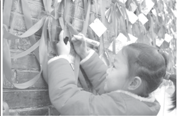
A little girl writes her wish on a piece of paper hung up on the 'make-wish wall' besides 1912 square in Nanjing, capital of west China's Jiangsu Province, on 23 Dec, 2006. Local citizens hung up the wish cards on the wall to hail the upcoming Christmas and new year.—XINHUA