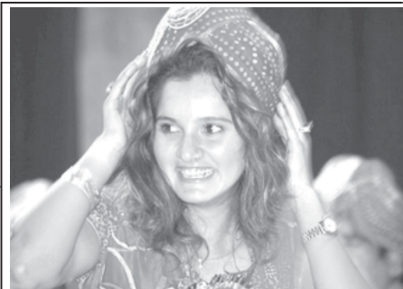
Indian tennis player Sania Mirza smiles as she is felicitated with a traditional Turban at a function in Hyderabad, India, on 24 Dec, 2006.