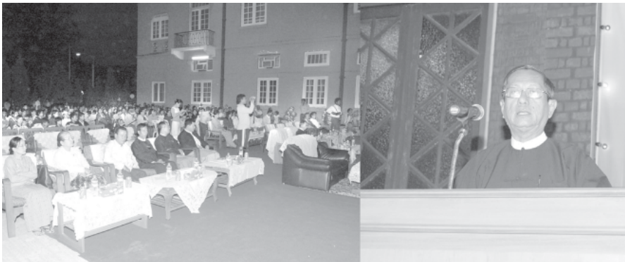
Religious Affairs Minister Brig-Gen Thura Myint Maung speaks at Christmas Celebration of Seventh Day Adventist Church.

YANGON, 25 Dec — Christmas celebration of Seventh Day Adventist Church was held today at the church in Dagon Township.