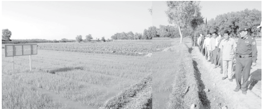
Commander Brig-Gen Hla Htay Win visits summer paddy plantation in Taikkyi Township. — MNA

YANGON, 25 Dec — Chairman of Yangon Division Peace and Development Council Commander of Yangon Command Brig-Gen Hla Htay Win inspected Aikalaung River Water Pumping Project in Taikkyi Township on 22 December and called on officials concerned to seek means and ways to achieve the project's target supply of irrigation water in the region.