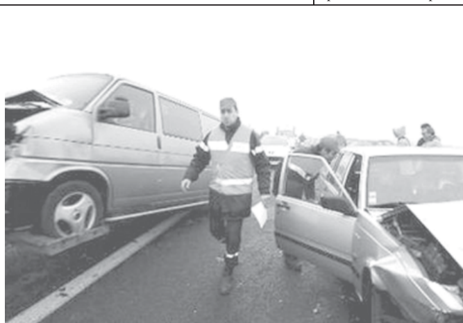
Rescue workers walk between cars after a pile up involving fifty vehicles on the French motorway in the direction of Bordeaux to Bayonne, south-western France on 23 Dec, 2006.