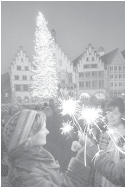
People celebrate Christmas Eve in front of the city-hall in Frankfurt, Germany, on 24 Dec, 2006.