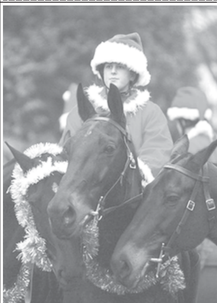
The King's Troop Royal Horse Artillery exercise on Oxford street in London on Christmas Eve with some members in festive clothing on 24 Dec, 2006.