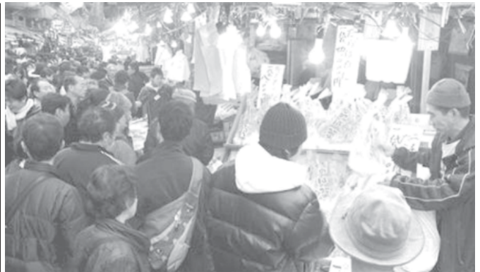
Possible customers stop by a shop specializing in marine products like salted roe of salmon and cod, and crab at Ameyoko shopping area in Tokyo on 24 Dec, 2006.