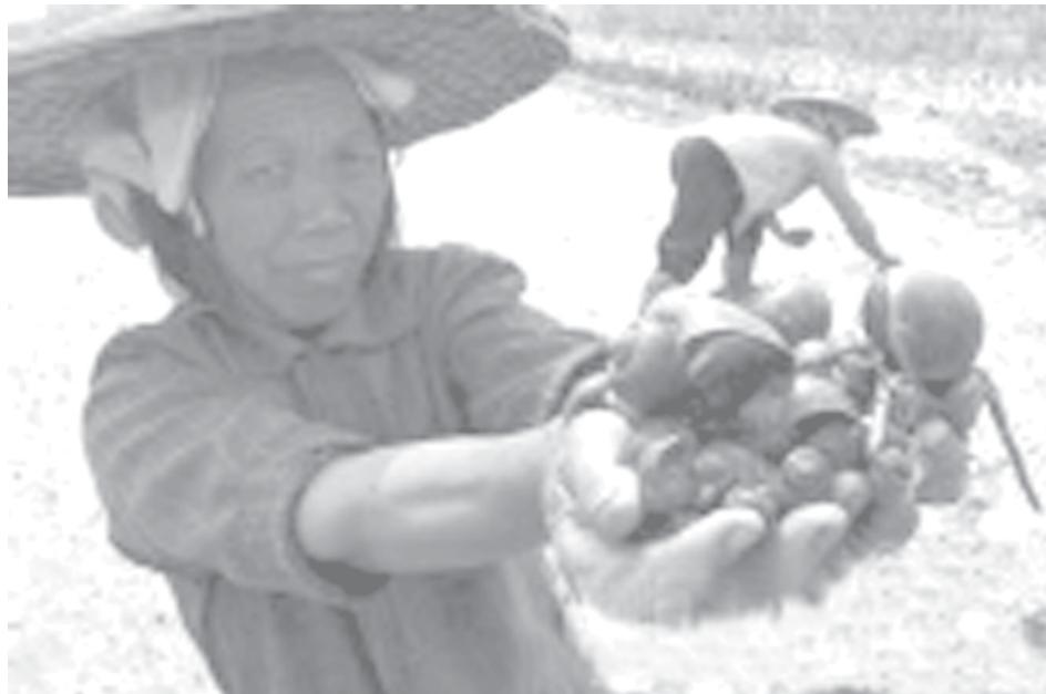
A farmer shows Amazonian snails in a village near the Guilin City, Guangxi Zhuang Autonomous Region on 20 August, 2006. —INTERNET

Pertamina has projected the sale of bio-fuel at 1.1 million kiloliters up to the end of 2006, comprising 400,000 kiloliters of industrial bio-diesel, 350,000 kiloliters of bio-diesel for power generators, 330,000 kiloliters of automotive bio-diesel and 20,000 kiloliters of automotive bio-ethanol. — MNA/Xinhua