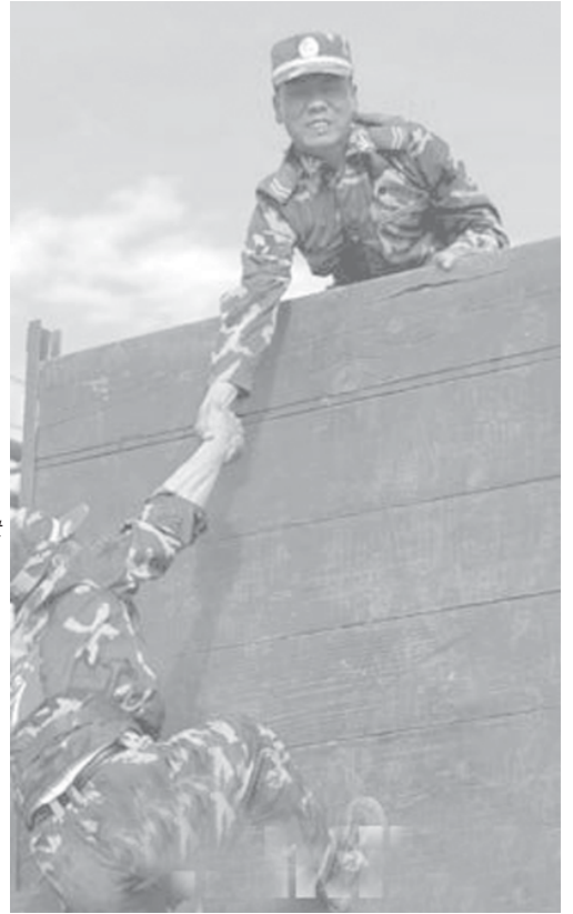
Soldiers of the Tibetan Border Police Corps take part in the climbing exercise during a military drill in southwest China's Tibet Autonomous Region, on 20 Aug, 2006.