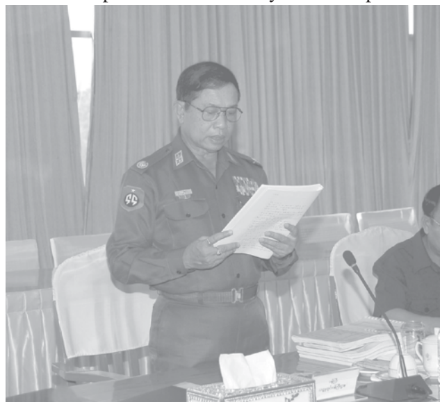
Minister for Mines Brig-Gen Ohn Myint reports on Myanmar gem industry.

All can witness the development of Myanmar gem industry and the increased foreign demand. As a result, the State as well as private gem entrepreneurs have benefited a lot from it.