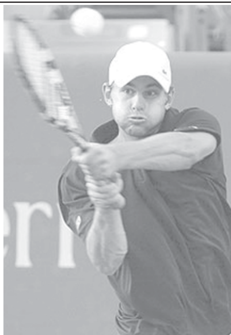
Andy Roddick of the United States hits a shot to Fernando Gonzalez of Chile during the Cincinnati Masters tennis tournament in Mason, Ohio on 19 August, 2006.

Chelsea's almost total control of the game stemmed from a couple of first-half goals, provided by two of their England internationals.—MNA/Xinhua