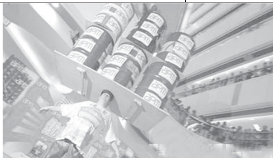
British giant John Evans carries six oilcans weighing 300 pounds on his head in Hong Kong, south China, on 20 Aug, 2006.

The deputy prime minister is likely to visit Finland in the next few days to appeal to the current EU presidency for help, Zapatero said at a rally in the Canaries late on Saturday.—MNA/Reuters