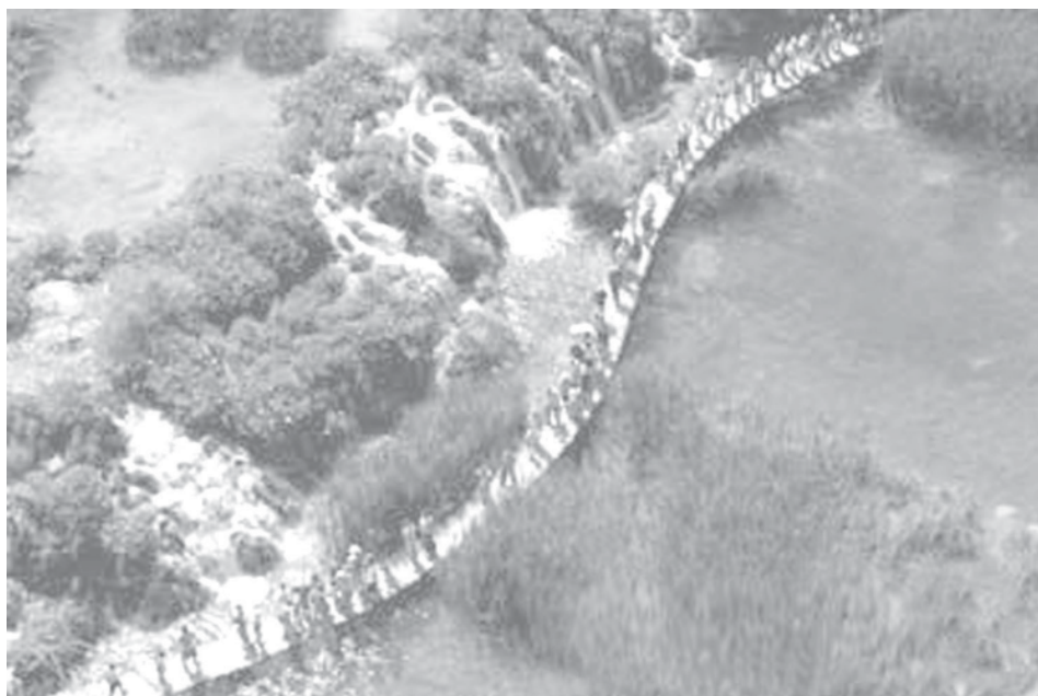
The photo taken on 26 July, 2006 shows tourists walking on a bridge in Plicvice National Park of Croatia. The Plicvice National Park, which also named Sixteen Lakes National Park, covers a total area of 19,462 hectares with 70% sheltered by forest. The park was inscribed on UNESCO's world heritage list in 2000.