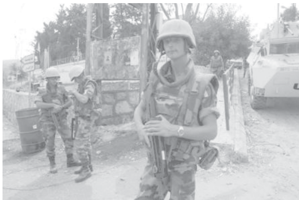
French peacekeepers patrol the Houla village in south Lebanon on 19 August, 2006.