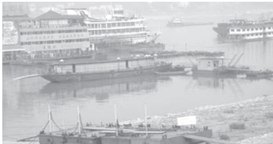
A wharfboat (front) lies on the exposed river bank of Yangtze River in Yichang city, central China's Hubei Province, on 20 Aug, 2006. The water level of the Yangtze River measured at hydrologic station in Yichang touched down to 40.60 meters at 8:00 am (GMT 0000) on Sunday, making it the lowest record at the station in corresponding period since 1877.