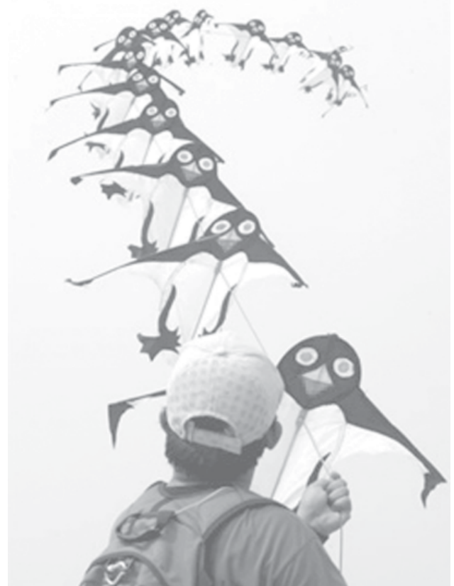
A contestant from Yogyakarta, central Java flies a kite at the International Kite Festival in Jakarta on 20 Aug, 2006.