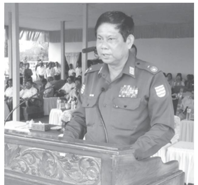
Minister Maj-Gen Htay Oo delivers an address at opening ceremony of Ngathayauk Dam.