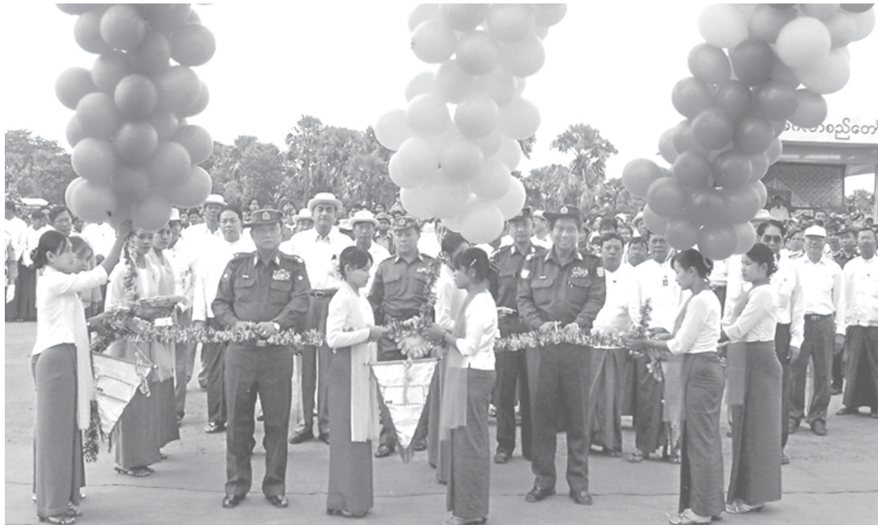
Commander Maj-Gen Khin Zaw and Agriculture and Irrigation Minister Maj-Gen Htay Oo formally open Ngathayauk Dam.

A local thanked the government for implementation of the dam projects. The commander and the minister greeted those present at the inauguration ceremony.