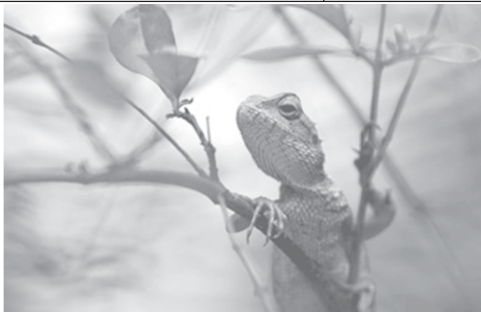
An iguana perched on a branch of a tree waits for its prey in New Delhi, on 19 August, 2006.