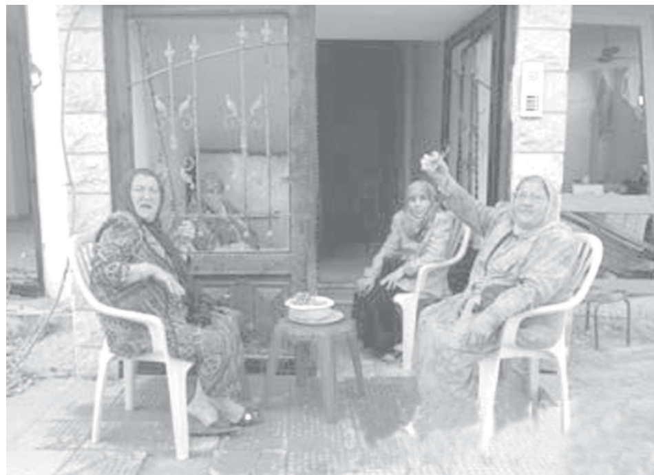
Four local women enjoy their leisure time in Khiam in southern Lebanon on 18 August, 2006.