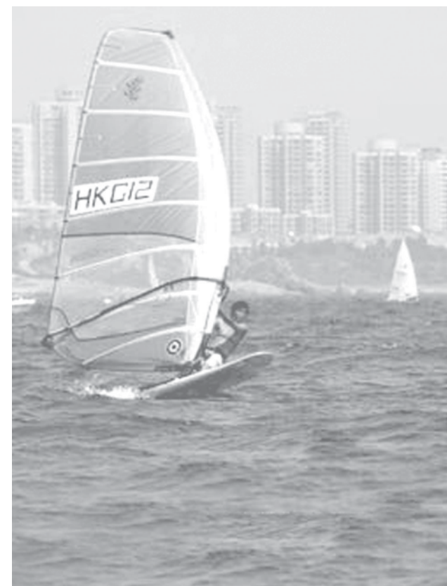
Competitors set off for RS:X practice race at the Good Luck Beijing — Qingdao International Regatta in Qingdao, a coastal city of east China's Shandong Province, on 20 August, 2006. —INTERNET

More than 60 per cent of the large industrial enterprises are located in east China. Tibet is the only region without any, said the NBS. — MNA/Xinhua