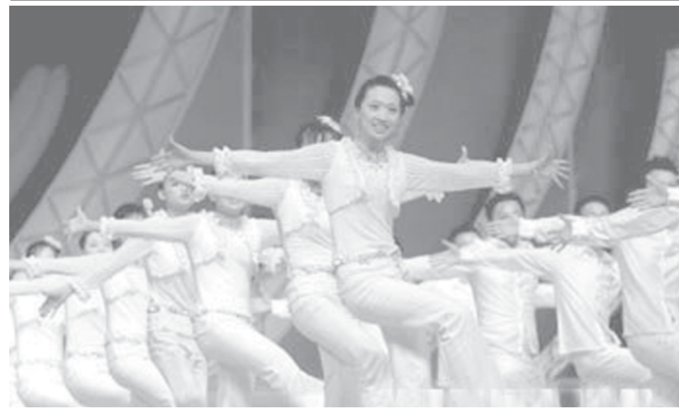
Dancers perform during the opening of the International Youth Dance Festival Celebrating the Joy of Nature held at Asia World-Expo of Hong Kong, south China, on 19 Aug, 2006.—INTERNET

India Friday offered dramatic tariff concessions for more than 4,000 ASEAN products in a bid to break the ice on the so-called deadlock on its FTA negotiations with ASEAN.—MNA/Xinhua