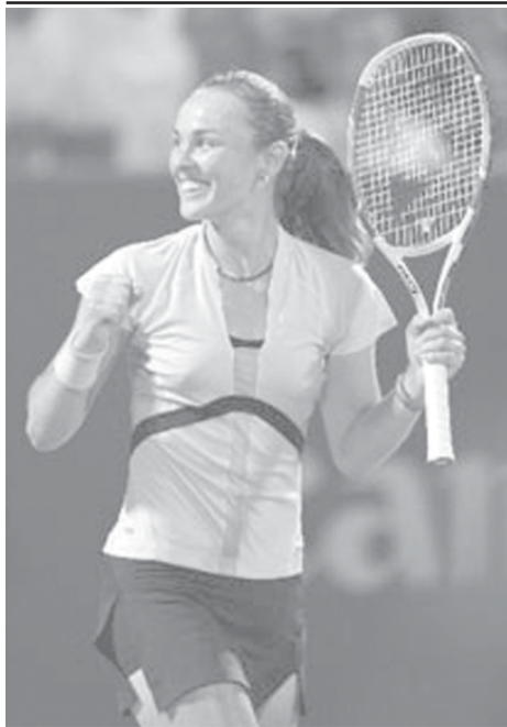
Former world number one Martina Hingis is projected to make her Top 10 return on Monday's Sony Ericsson WTA Tour Singles Rankings, at No 10, after reaching the final of the Montreal Cup on 19 August, 2006.

Booing was heard in the crowd at Uniprix Stadium after the 19-year-old told the umpire she could not continue.