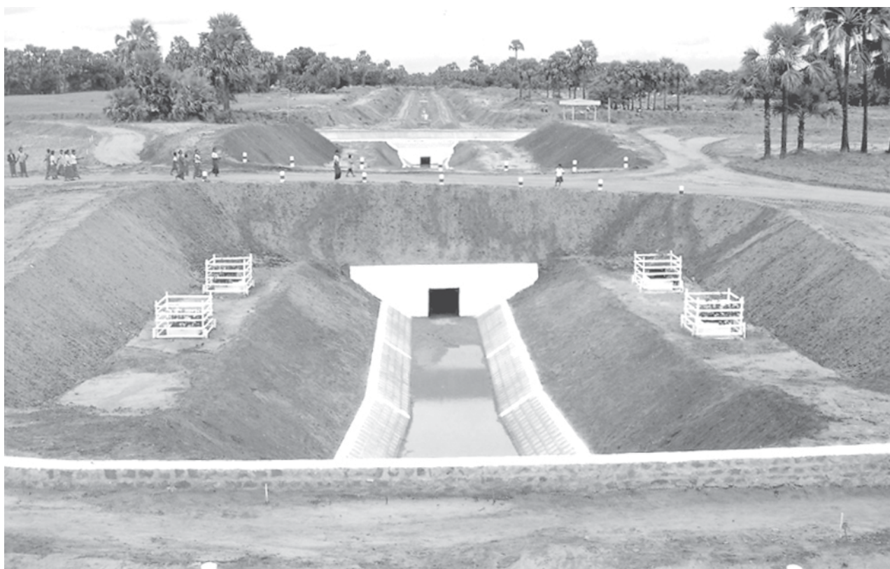
Ngathayauk Dam in NyaungU Township.

Ngathayauk Dam was built in accord with the Head of State's guidance to solve the water scarcity problem of Bagan-NyaungU region where people were not able to cultivate crops effectively and faced water shortages in summer despite the region's location on Ayeyawady River bank. It is the 188th dam of the nation and 48th of Mandalay Division. The 48 dams irrigate 723,188 acres of land to grow crops at any season in the division.