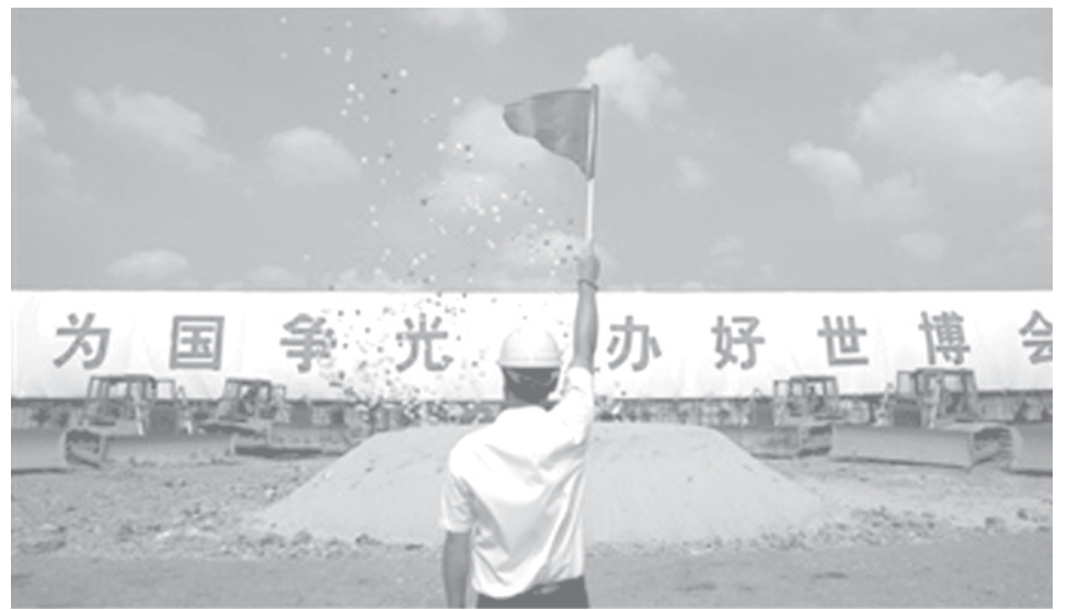
A worker waves a flag to signal the start of construction of the 2010 Shanghai World Expo Park during a ceremony in Shanghai on 19 August, 2006. China's preparations for the 2010 Shanghai World Expo began in earnest on Saturday as construction of the World Expo Park formally started in downtown Shanghai, according to Xinhua News Agency.