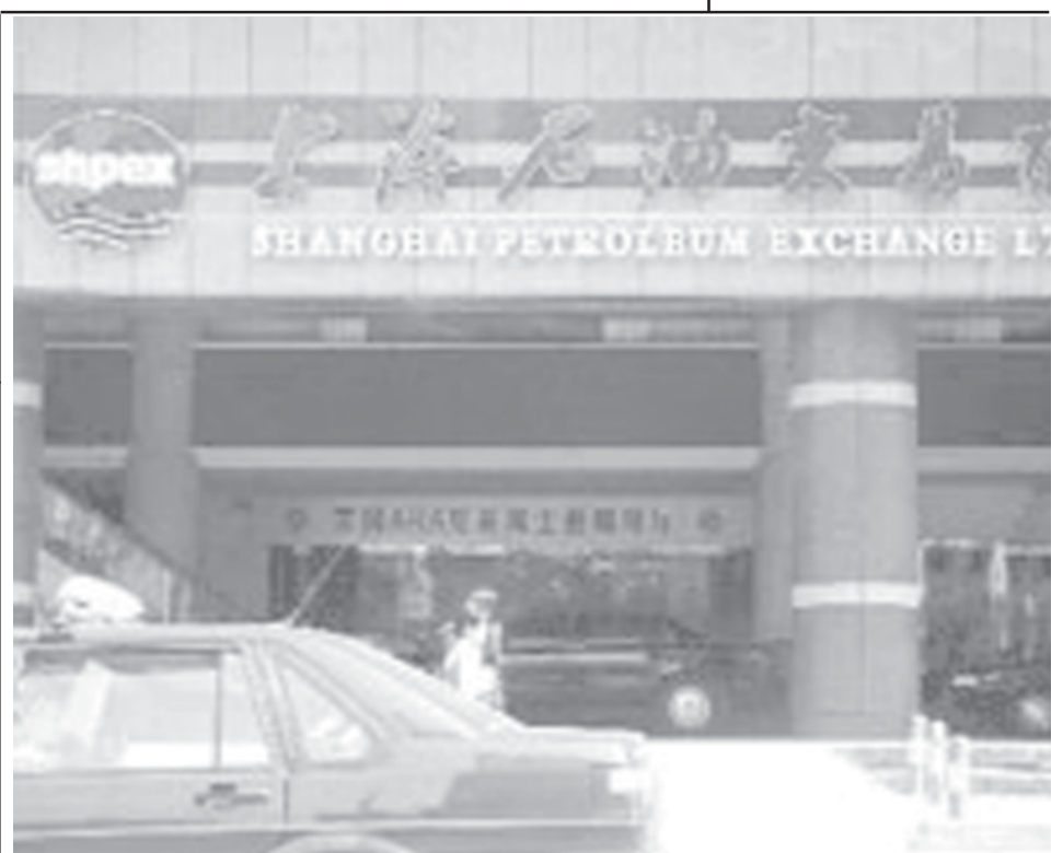
Shanghai Petroleum Exchange, China's first commodity and futures exchange for oil products, reported robust trade on 18 Aug, 2006, its first formal business day.—INTERNET