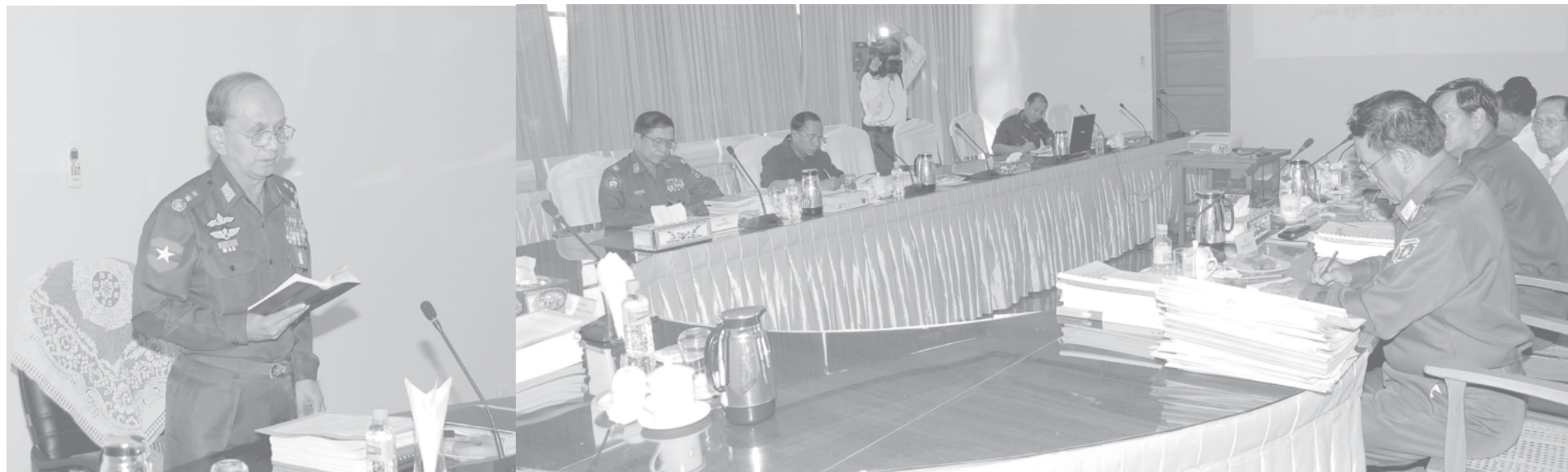
Secretary-1 of the State Peace and Development Council Lt-Gen Thein Sein speaks at meeting of the leading committee for development of Myanmar gem industry.

NAY PYI TAW, 21 Aug — A meeting of the leading committee for development of Myanmar gem industry took place at the Ministry of Mines here this evening with an address by Chairman of the leading committee Secretary-1 of the State Peace and Development Council