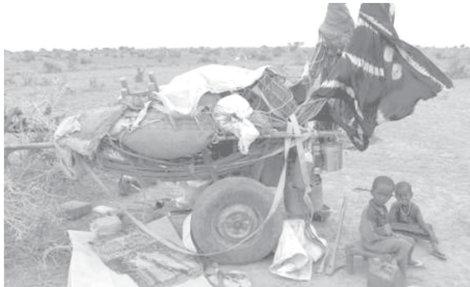
Nomadic Somali children sit beside a cart loaded with their family belongings in Middle Shabelle Region on 20 August, 2006, as people fled areas close to the swelling Shabelle river, northeast of Mogadishu, fearing floods which have already affected neighbouring Ethiopia.