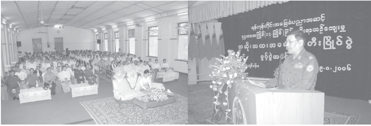
Commander Brig-Gen Hla Htay Win delivers an address at opening of Yangon Division's 14th basic education level performing arts competitions.

YANGON, 20 Aug— Yangon Division's 14th Traditional Cultural Performing Arts Competitions (Basic Education Level) took place at No-6 Basic Education High School in Botahtaung Township yesterday.