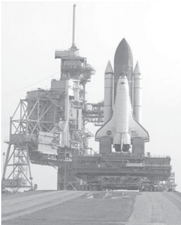
The space shuttle Atlantis arrives at launch pad 39B at the Kennedy Space Center in Cape Canaveral, Florida, on 2 Aug, 2006. NASA on 18 Aug, 2006 decided to go ahead with a risky and unprecedented launch pad repair on the space shuttle Atlantis to replace bolts that might come loose during liftoff. —INTERNET

The repair itself is tricky. A sole technician, lying on his or her side on a narrow gangplank attached to a work platform, will replace the suspect bolts. Access is difficult because of the shuttle's vertical position. —MNA/Reuters