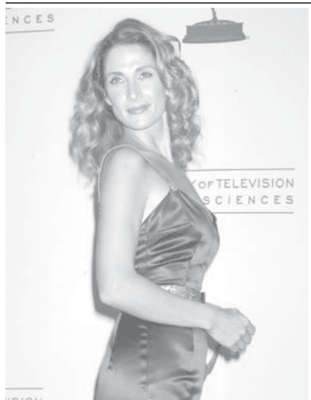
Actress Melina Kanakaredes, star of the television series ‘CSI: NY’, poses at the 2006 Creative Arts Emmys in Los Angeles on 19 Aug, 2006. Kanakaredes was a presenter at the awards show.

China and Japan joined the United Nations Chemical Weapons Convention in 1997. Two years later, they signed a memorandum, in which Japan admitted that it had abandoned a large amount of chemical weapons in China at the end of World War II. — MNA/Xinhua