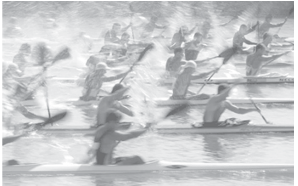
Competitors paddle at the start of the men's K4, 200 metres heat during the flat water Canoe and Kayak World Championship in Szeged, 170 km (106 miles) south from Budapest, on 19 Aug, 2006.