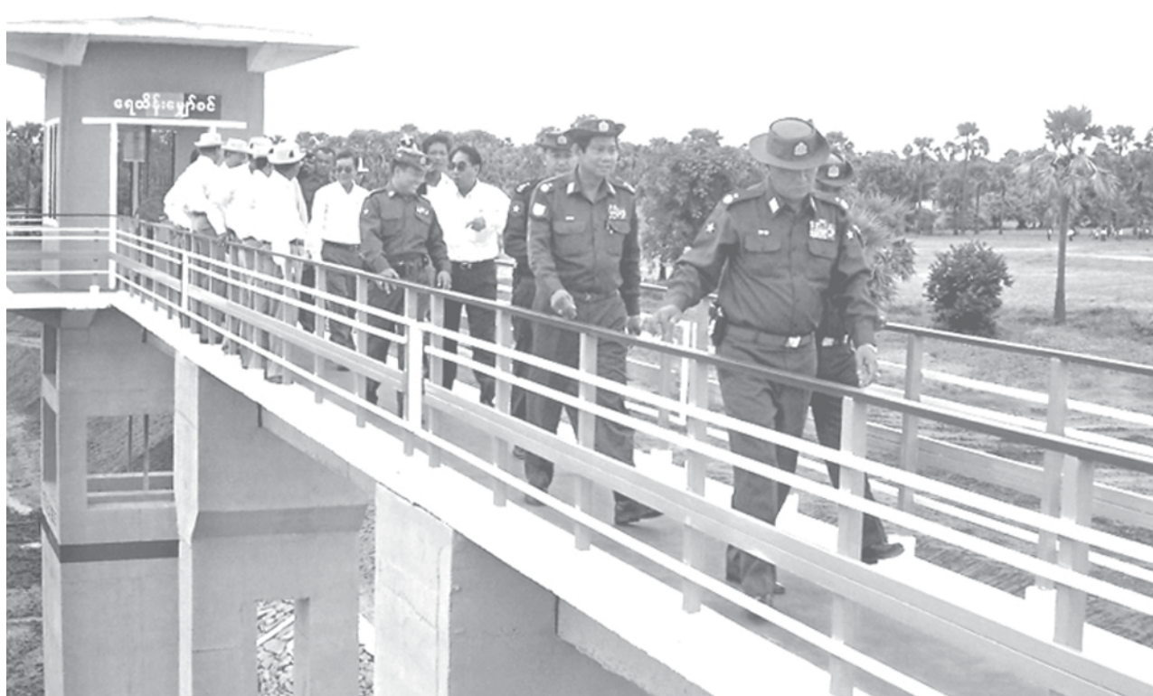
Commander Maj-Gen Khin Zaw and Minister Maj-Gen Htay Oo inspect Ngathayauk Dam. — MNA

Altogether 188 dams and sluice gates benefited 2.6 million acres of farmlands and 297 river water pumping stations contribute towards boosting production of crops and greening of the region. In 1988-89 there were only 2.89 million irrigated acres and now there are over 7.3 million acres.