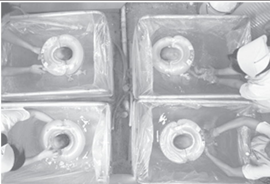
Newborn babies are given baths by a parent and nurses at a hospital in Wuhan, capital of central China's Hubei Province on 19 Aug, 2006.