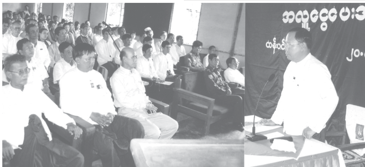
Forestry Minister Brig-Gen Thein Aung delivers an address at opening of Basic Education High School (Branch) in Ingapu Township.