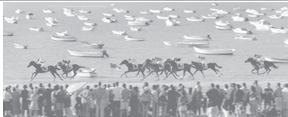
Jockeys take part in a race along the beach during low tide in the southern Spanish town of San Lucar de Barrameda on 19 Aug, 2006 as part of a local tradition that has been taking place for over 100 years.—INTERNET

A poll published Friday by ZDF Television indicated that 58 per cent of Germans oppose sending troops to Lebanon.—MNA/Xinhua