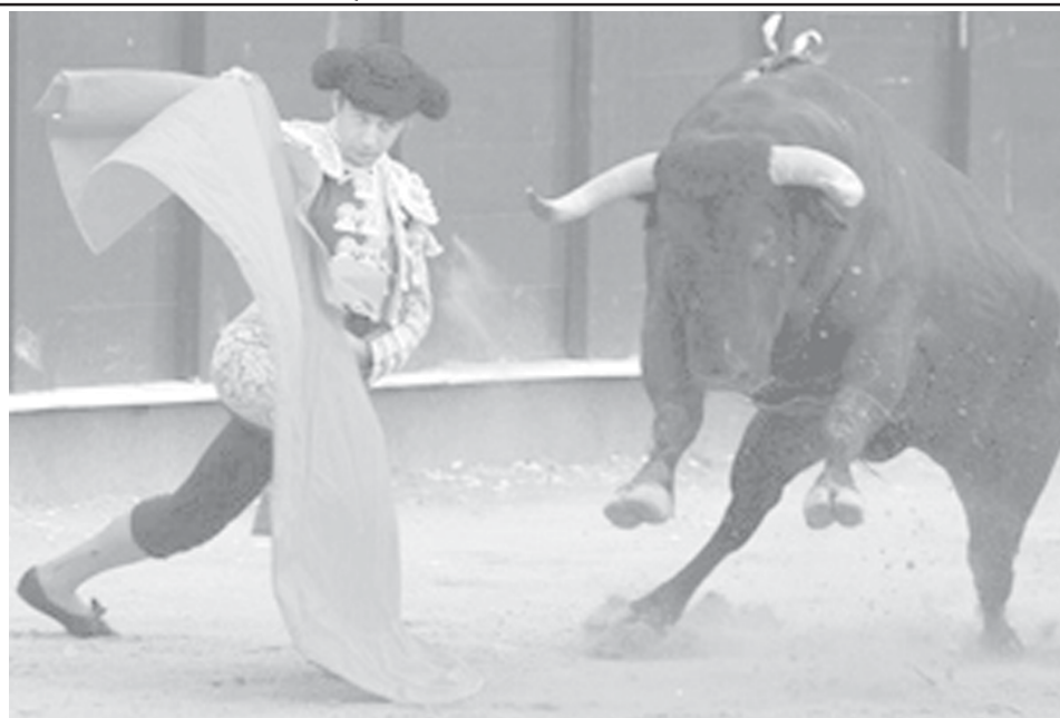
Spanish bullfighter Enrique Ponce performs a pass during a bullfight in the southern Spanish town of Malaga on 19 Aug, 2006.