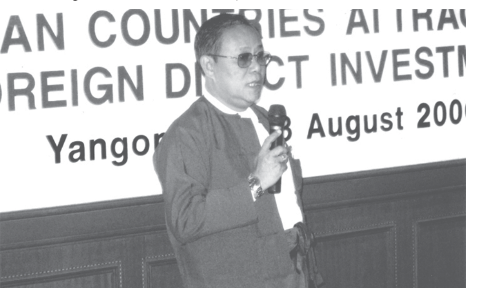
Director-General of Civil Service Selection and Training Department U Hla Kyi delivers an address at opening ceremony of IAI Training Course.