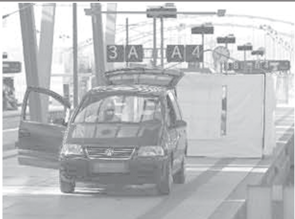
German police and forensic experts work at a site at the main train station in the northern city of Kiel, on 19 Aug, 2006.