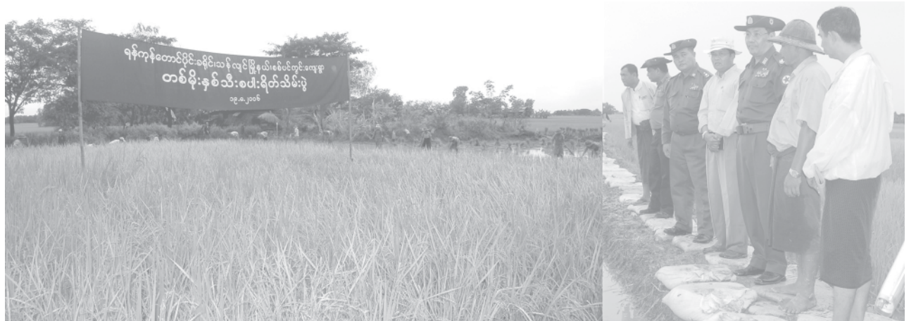
Commander Brig-Gen Hla Htay Win inspects triple cropping in Thanlyin.