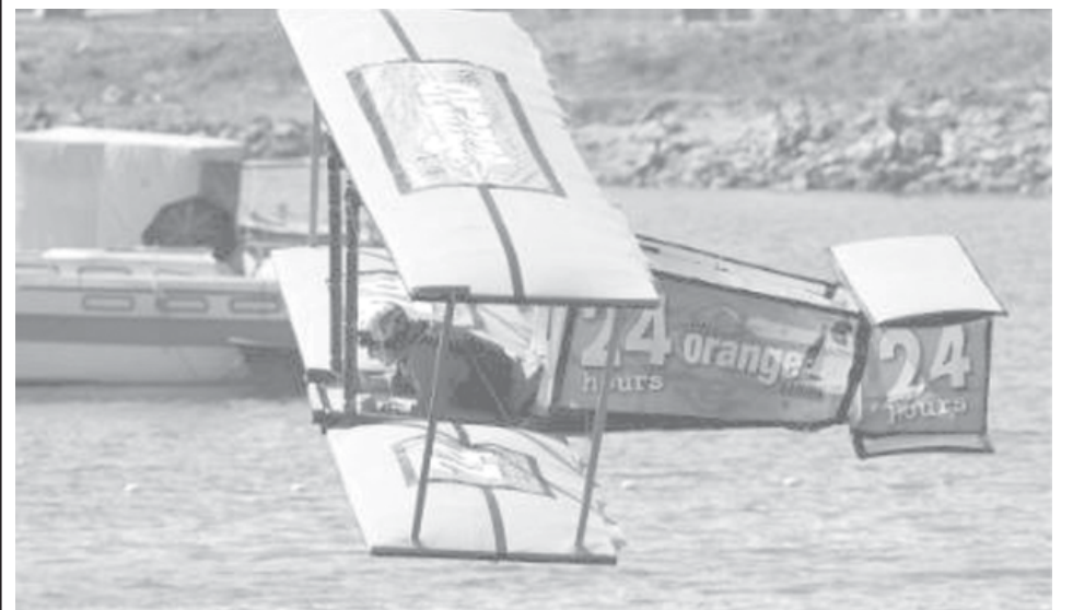
The Orange Baron team takes flight at Flugtag in Vancouver, British Columbia on 19 Aug, 2006. The first Flugtag which in German means “flying day” took place in Austria in 1991. The flying machines must be human-powered with no stored or external energy sources. The machines must also be constructed completely by human muscle power and be no more than 30 feet wide and 450 pounds in weight, including the pilot. —INTERNET