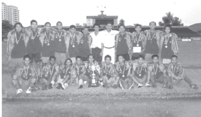
Aungtagon Football Team, which clinched the Second Division Cup for 2006-2007 football season seen with the coaches.

HIV/AIDS. The deputy minister also visited Kungyangon station hospital. — MNA