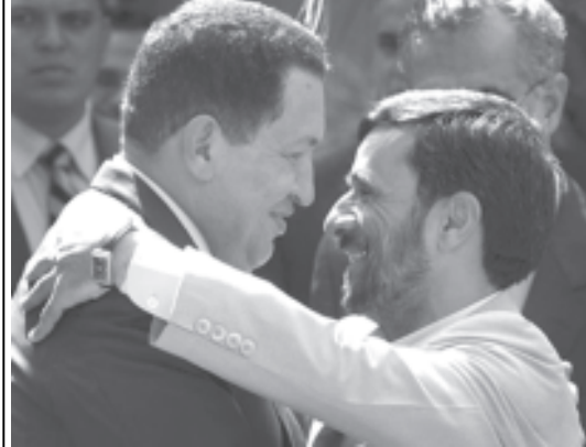
Iranian President Mahmoud Ahmadinejad (R) greets Venezuelan President Hugo Chavez in Teheran on 29 July, 2006.