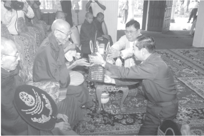
Lt-Gen Myint Swe donates offertories to a Sayadaw. MNA

Later, Sayadaw Bhaddanta Sumangalankara delivered a sermon, and Lt-Gen Myint Swe and party shared merits gained. — MNA