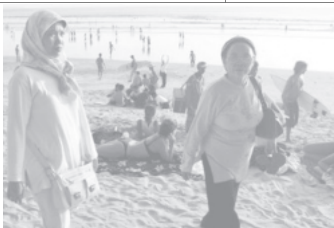
Indonesians walk past tourists sunbathing on Kuta Beach at the Indonesian resort island of Bali on 29 July, 2006.—INTERNET

people have died in militant-linked violence this year.—MNA/Reuters