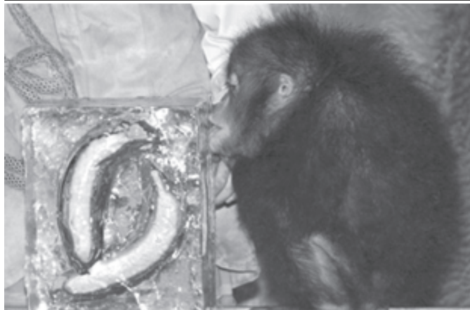
Jennie, a two year old orangutan, licks an ice block containing bananas at a promotional event to give animals some refreshment during the hot summer weather at Everland, South Korea’s largest amusement park, in Yongin, about 50 km (31 miles) south of Seoul, on 30 July, 2006.