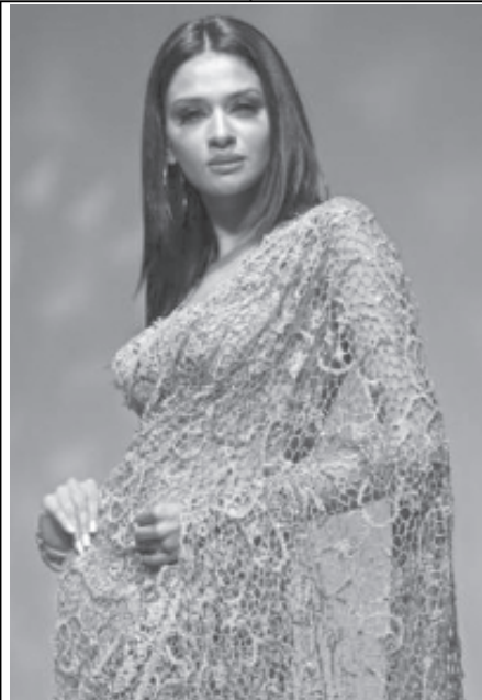
A model walks on the runway at the 2006 Bollywood Fashion Awards at Roseland Ballroom in New York City, on 29 July, 2006.—INTERNET

The report said that at the fourth scientific conference of the Uganda Diabetes Association (UDA) on Friday, Ugandan Prime Minister Apolo Nsibambi regretted the UDA finding, saying it cast a gloomy picture on Uganda’s health image. — MNA/Xinhua