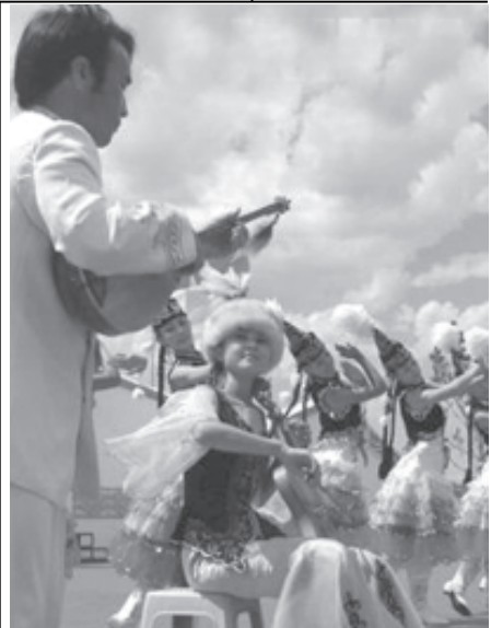
Actors perform traditional Kazak music at the 16th Aken concert held beside the scenic Hongshan Lake in Altay, northwest China's Xinjiang Uygur Autonomous Region, on 29 July, 2006.