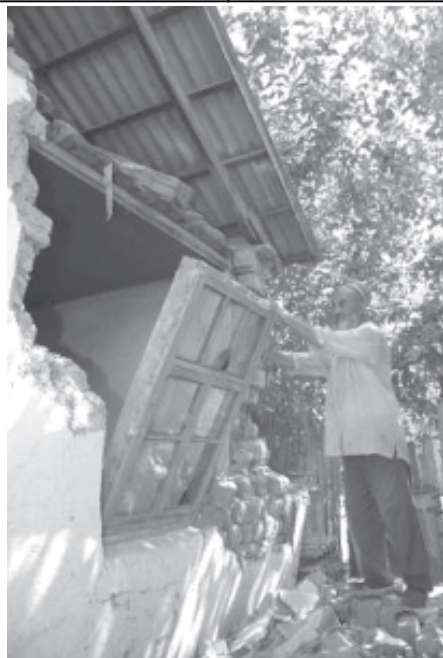
A Tajik villager inspects his house at a settlement in the Kumsangin region of Tajikistan on 30 July, 2006. An earthquake measuring 5.5 on the Richter Scale killed at least three children and left more than a thousand people without shelter in the south of Tajikistan, the Emergencies Ministry said on Sunday.—INTERNET

"Obviously it disturbs the flights, but now it is not on that level which can delay the flight schedules," he told Xinhua .—MNA/Xinhua