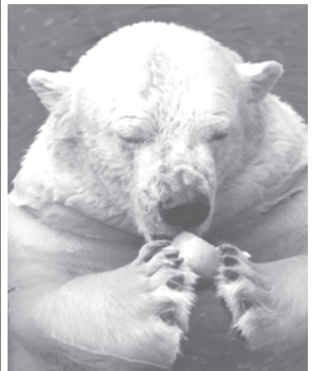
A polar bear eats an apple at a promotional event to give animals some refreshment during the hot summer weather at Everland, South Korea's largest amusement park, in Yongin, about 50 km (31 miles) south of Seoul, on 30 July, 2006.