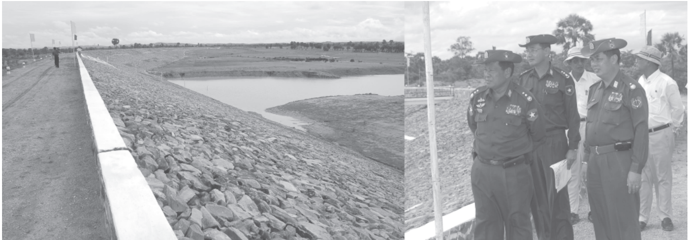
Lt-Gen Ye Myint of the Ministry of Defence inspects Inbat Dam in Inbat village, Pakokku Township.

NAY PYI TAW, 31 July — Member of the State Peace and Development Council Lt-Gen Ye Myint of the Ministry of Defence on 27 July inspected regional development tasks in Pakokku and Myaing townships in Magway Division.