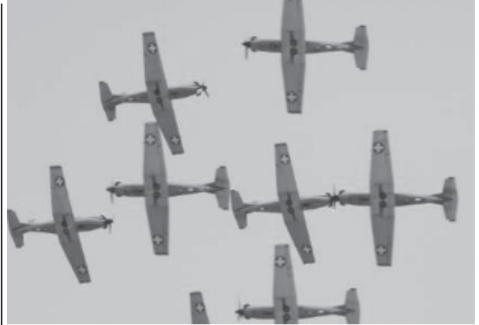
Switzerland’s PC7 aerobatic team participate in the RoIAS International Air Show at Mihail Kogalniceanu Airport, 240 km (149 miles) east of Bucharest, on 30 July, 2006.