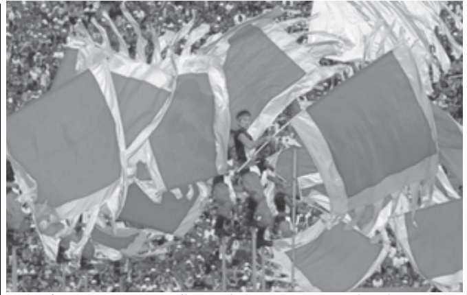
A performer is seen among flags at the Singapore National Stadium, on 29 July, 2006 in Singapore during a full dress rehearsal for the nation's upcoming Independence Day celebrations in August.