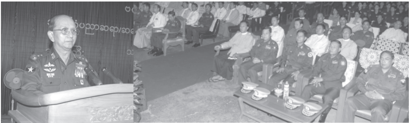
Secretary-1 Lt-Gen Thein Sein delivers an address at opening of Special Refresher Course No 59 for basic education teachers.

YANGON, 31 July— Special Refresher Course No 59 for basic education teachers opened at the Central Institute of Civil Service (Phaunggyi) in Hlegu Township, Yangon Division, this morning, with an address by Chairman of Myanmar Education Committee Secretary-1 of the State Peace and Development Council Lt-Gen Thein Sein.