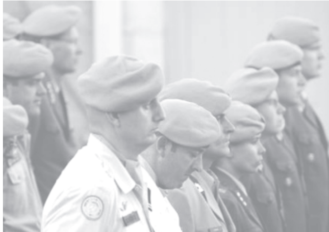
Colleagues of UN observers who were killed last week observe a moment of silence during a memorial ceremony in Jerusalem on 30 July, 2006.