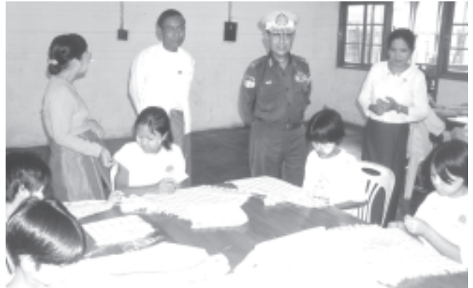
Maj-Gen Maung Maung Swe and party visit Vocational Training school of Social Welfare Department. — SOCIAL WELFARE.

YANGON, 30 July— Minister for Social Welfare, Relief and Resettlement Maj-Gen Maung Maung Swe together with responsible persons of Myanmar Women's Affairs Federation, director-general and deputy director-general of Social Welfare Department today inspected Vocational Training school in Bahan Township.