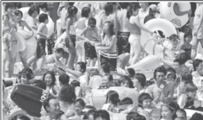
Summer vacationers pack a mammoth pool at the Toshima amusement park in Tokyo on 30 July, 2006. About 16,000 people flocked to the swimming pool at this amusement park to cool off on Sunday.