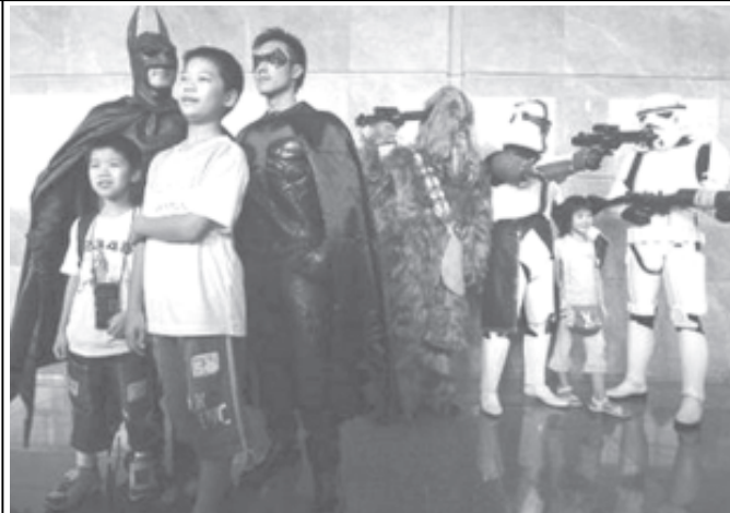
Cosplayers dressed up as characters from the movies ‘Star Wars’ and ‘Batman’ pose during the Ani-com Hong Kong, an animation and comic fair in Hong Kong, on 30 July, 2006.