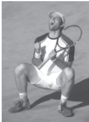
Argentina's Agustin Calleri celebrates his win over compatriot Juan Ignacio Chela in the final match at the ATP Generali Open tennis tournament in Kitzbuehel, on 30 July, 2006. Calleri won 7-6, 6-2, 6-3.