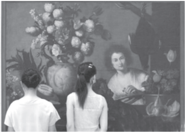
Two visitors view a painting during an Italian painting exhibition at the Jiangsu Art Gallery in Nanjing, capital of east China's Jiangsu Province, on 28 July, 2006. The month-long exhibition, opened on 28 July, displayed 49 Italian masterpieces dating back to a period from the 14th to 18th centuries.