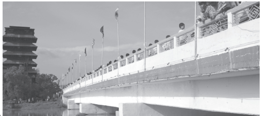
Shwelinban Bridge (Hlinethaya). — MNA

Shwelinban Bridge is the 28th bridge in Yangon Division, and it is the 218th bridge above 180 feet long built in the entire nation by the Tatmadaw Government after 1988. — MNA