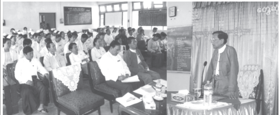
Deputy Minister for Health Dr Mya Oo delivers a speech in meeting with members of township health committee, health staff and members of social organizations at Twantay People's Hospital. — HEALTH