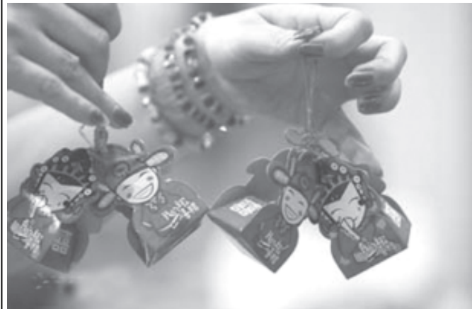
Photo taken on 28 July shows unique wedding candy packages shown at an exhibition on wedding necessities in Jinan, capital city of east China's Shandong Province on 28 July, 2006.