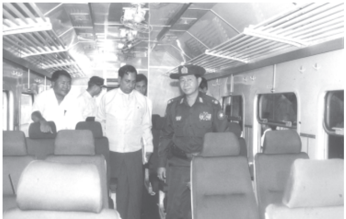
Maj-Gen Aung Min inspects renovated carriages donated by People's Republic of China. — RAILWAY

YANGON, 30 July — Minister for Rail Transportation Maj-Gen Aung Min inspected test-run of a locomotive repaired by Insein Locomotive Shed and locomotives repaired by Myitnge Carriage and Wagon Workshop this morning.