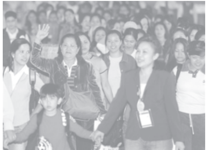
A Filipino worker returning from Lebanon waves as they arrive at Manila's International Airport on 30 July, 2006.