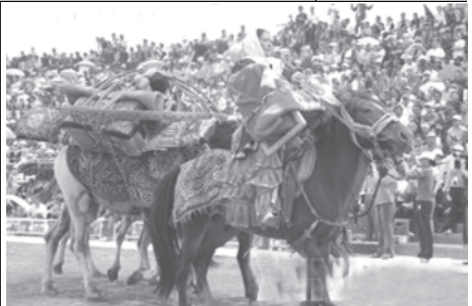
A woman demonstrates Kazak nomadic custom at the 16th “Aken” concert held beside the scenic Hongshan Lake in Altay, northwest China’s Xinjiang Uygur Autonomous Region, on 29 July, 2006.