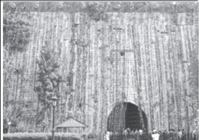
The Zhonghua (China) Gate is decorated with 770 thousand paper birds in Nanjing, capital of east China's Jiangsu Province, on 30 July, 2006.

HONG KONG, 30 July —An earthquake measuring 6.1 on the Richter Scale hit Taibei Friday, shaking buildings in Taibei, but there were no immediate reports of damage or casualties, according to media reports from Taibei. The quake's epicentre was located 82 kilometres east of port Nanao, a harbour town some 80 kilometres southeast of Taibei, according to local weather agency.—MNA/Xinhua