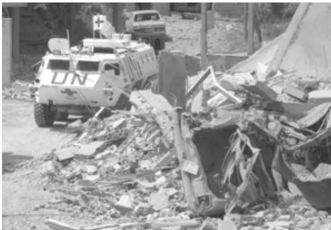
A UN armoured car is parked near rubble after an Israeli air raid in Qana, 6 km (4 miles) from the port-city of Tyre (Soure), in south Lebanon, on 30 July, 2006.