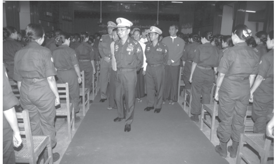
Lt-Gen Thein Sein cordially greets trainees at Special Refresher Course No 59 for basic education teachers. — MNA

In the higher education sector, opportunities are there in the country to pursue various subjects of science & technology of international standard. Specialized institutes and colleges as well as universities have also been opened throughout the nation. Thus, the teachers are to teach and train their pupils to be able to pursue education according to their respective