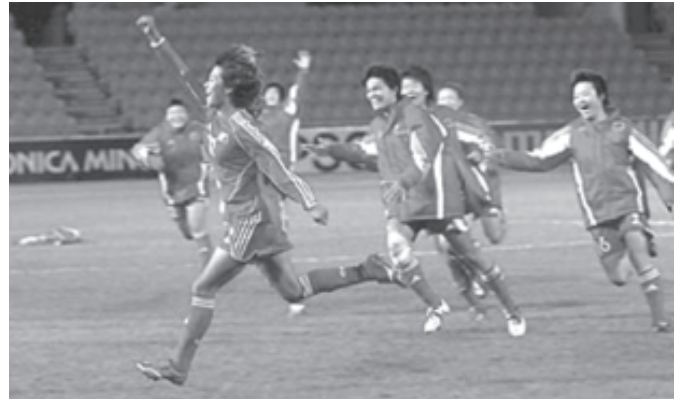
China's Han Duan (L1) celebrates after she made the final penalty shoot in the AFC Asian Women's Cup final in Adelaide, Australia, on 30 July, 2006. China won Australia a penalty shootout 4-2 to lift the AFC Asian Women's Cup.