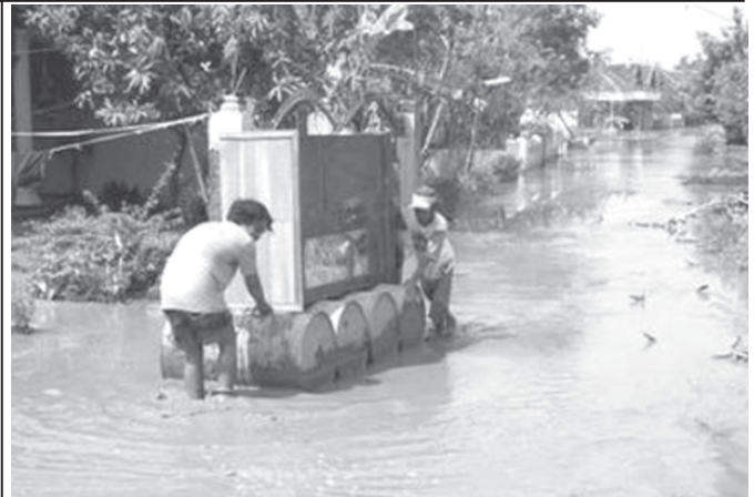
Indonesian villagers evacuate their belongings after hot mud from an oil and gas exploration operated by local company Lapindo Brantas flooded their village in Sidoarjo of East Java on 29 June, 2006. —INTERNET

His latest campaign is sure to catch the eye of soccer-obsessed Argentines. A tournament favourite, Argentina, faces Germany on Friday.—MNA/Reuters