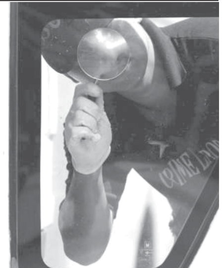
A policeman inspects the window of a van for fingerprints during a drill to test preparedness for a terror attack at a shopping centre in central Manila on 29 June, 2006.