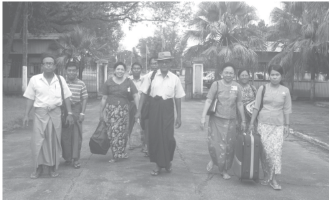
Arrival of delegates and observers at hostels of Kyaikkasan Ground to attend 4th Conference of Myanmar Writers and Journalists Association.

YANGON, 30 June — Delegates and observers to the 4th Conference of the Myanmar Writers and Journalists Association arrived in here today. They were welcomed by the officials of Reception and Accommodation Work Committee, and accommodated at hostels in Kyaikkasan Ground.—MNA