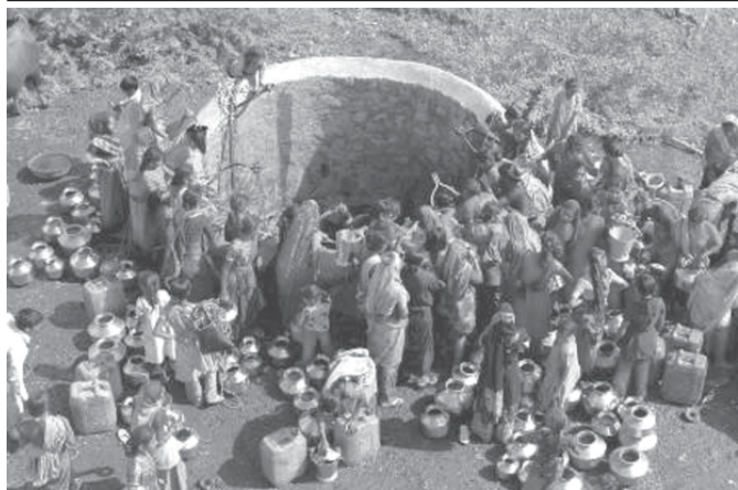
People gather around a village well to draw drinking water in the village of Chokadi in India's western state of Gujarat on 28 June, 2006. The village is among 200 villages hit by decreased water levels and delayed rain. Authorities are providing water by boring land and collecting the water in tanks.