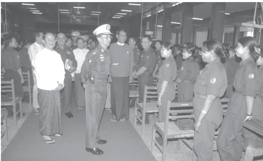
Secretary-1 Lt-Gen Thein Sein cordially converses with trainees at concluding ceremony of Special Refresher Course No 9 for Faculty Members.

Whatever system is being practised, the country is to be built on the basis of perpetuation of sovereignty, modernization of national defence forces, preservation of national culture and dignity, strong national economy and socio-economic development of the people.