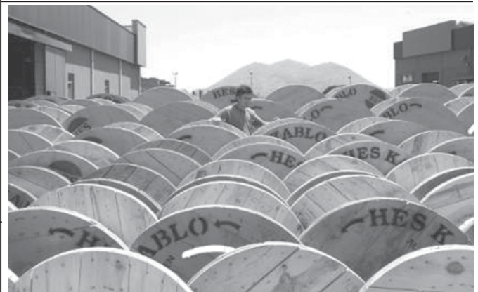
A worker checks cable drums at a factory in the city of Kayseri, central Turkey, on 27 June, 2006. The confident mood in Kayseri contrasts to the anxiety in Ankara, as they believe Turkey will weather the turbulence rocking its economy, and stay the course to European Union membership.