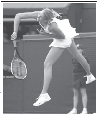
Russia's Maria Sharapova serves to Israel's Anna Smashnova during their match at the Wimbledon tennis championships in London on 28 June, 2006.

WORLD CUP Q/F Fixtures Saturday, 01 July 2006 England v Portugal, 21:30 MST Sunday, 02 July 2006 Brazil v France, 01:30 MST