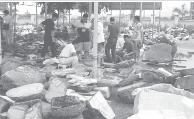
Gem merchants examining lots of cut jade at the special sales.

It is known to all that the sound foundations are being laid down for perpetual existence of the new nation. Due to implementation of the correct policy with goodwill, all the people can see sector-wise developments at present.