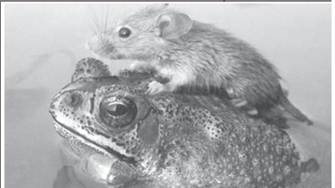
A mouse rides on the back of a frog in floodwaters in the northern Indian city Lucknow, on 30 June, 2006.

hours ago. ISS crews have reportedly dodged space debris six times on the station's trajectory. Currently, there are about 10,000 man-made objects, including discarded satellites and other equipment, in close earth orbit. Experts said some 2,000 items of space debris may pose serious threats to the safety of the ISS. MNA/Xinhua