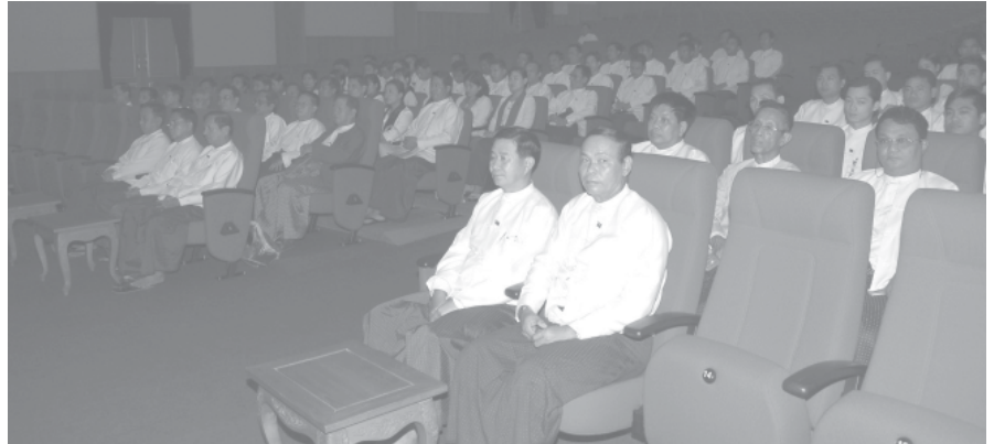
USDA Secretary-General U Htay Oo gives an address to the conclusion of Basic Journalism Course No 5 of Union Solidarity and Development Association.

YANGON, 30 June — The Basic Journalism Course No 5 of the Union Solidarity and Development Association concluded at the hall of USDA Headquarters on New University Avenue in Bahan Township this morning, with an address by Secretary-General of USDA U Htay Oo.