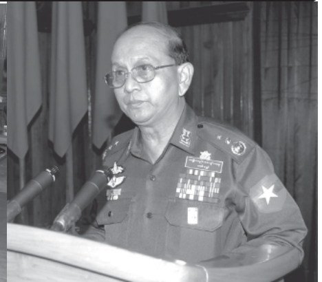
Lt-Gen Thein Sein delivers address at the conclusion of Special Refresher Course No 9 for Faculty Members.

YANGON, 30 June — Special Refresher Course No 9 for Faculty Members concluded at the Central Institute of Civil Service (Phaunggyi) in Hlegu Township this morning with an address by Chairman of Myanmar Education Committee Secretary-1 of the State Peace and Development Council Lt-Gen Thein Sein.