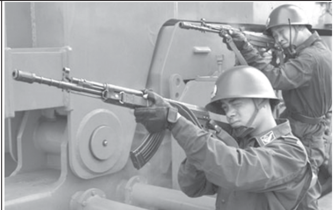
Chinese coast guards take part in an anti-hijack exercise at a port in Lianyungang, East China's Jiangsu Province, on 29 June, 2006. The exercise in which a passenger liner was taken hostage by "gunmen" aimed to test the coast guards' capability to deal with emergencies. — INTERNET

The British military has reported 113 deaths; Italy, 32; Ukraine, 18; Poland, 17; Bulgaria, 13; Spain, 11; Slovakia, Denmark three; El Salvador, Estonia, Netherlands, Thailand, two each; and Australia, Hungary, Kazakhstan, Latvia, Romania, one death each.—Internet