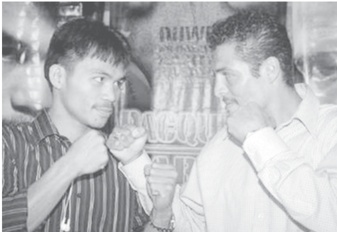
Filipino boxer Manny Pacquiao (L) and his Mexican challenger Oscar Larios pose after a news conference in Manila on 29 June, 2006.