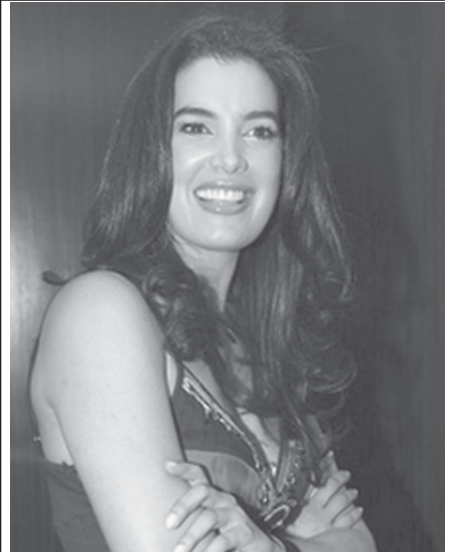
Venezuelan actress Ruddy Rodriguez, 39, poses for photographers before speaking to the press at a hotel in Caracas, Venezuela, on 29 June, 2006.