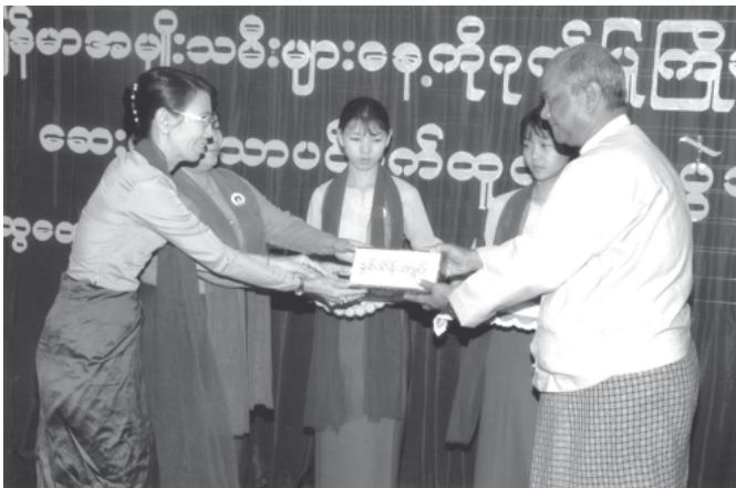
A responsible person presents K 200,000 donated by MWAF to the fund of New Yangon General Hospital.