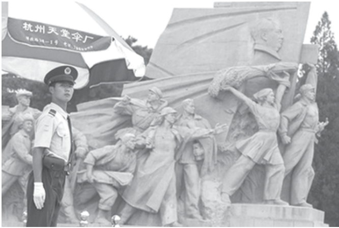
A Chinese soldier stands on duty near statues at Tiananmen Square on the eve of the 85th anniversary of the founding of the Communist Party of China in Beijing, on 30 June, 2006. The party was founded in Shanghai on 1 July, 1921, and now has more than 60 million members