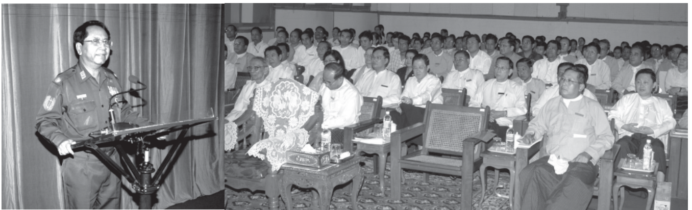
Information Minister Brig-Gen Kyaw Hsan delivers an address at the 36th anniversary of Myanmar Motion Picture Enterprise.