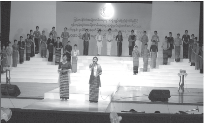
To hail Myanmar Women's Day, Fashion Show of Myanmar Women's Costumes in progress at Myoma Theatre.