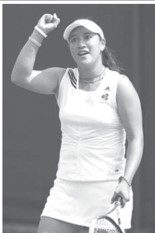
Thailand's Tamarine Tanasugarn celebrates winning her match against Japan's Shinobu Asagoe at the Wimbledon tennis championships in London on 29 June, 2006.