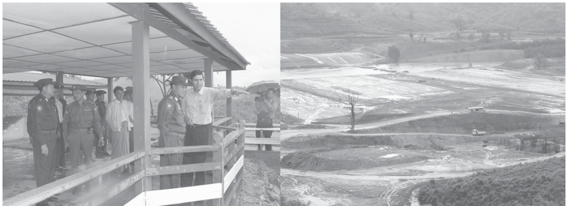
Lt-Gen Khin Maung Than views Shwegyin Hydrel Power Project site in Bago District.

to the Myanmar General and Maintenance Industries' rubber farm. A total of 2,000 acres of rubber plantation will continue to be nurtured. MGMI extended 450 acres of plants last year. It also set to grow 350 acres of rubber this rainy season and so far 100 acres have been put under the plant. On his tour of Shwegyin, Lt-Gen Khin Maung Than met with (See page 10)