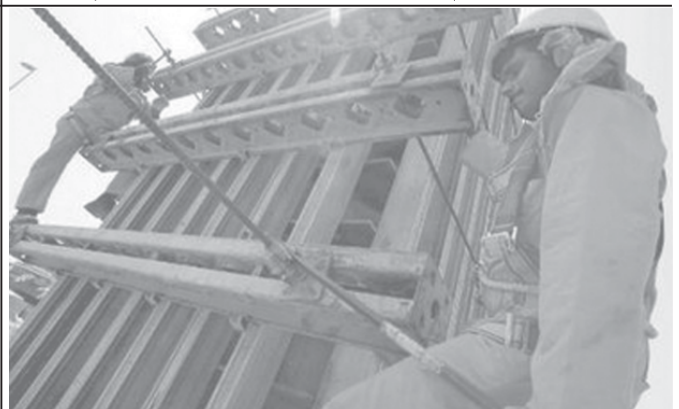
Workers fix scaffolding on a bridge pillar at a road construction site in Dubai on 19 June, 2006. Labourers in Dubai often work in high temperatures that reach more than 45 degrees centigrade.—INTERNET