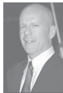
Bruce Willis has thrown a legal left hook at the photographer who claimed the actor didn't pose pretty for him.

Willis said in the suit, filed in Beverly Hills