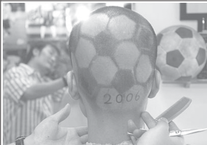
A football fan in China prepares for the tournament, which millions are expected to watch.