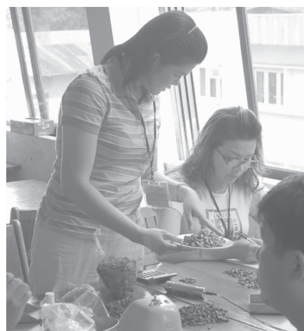
Local and foreign gem merchants observe gems at Myanmar Gems Emporium.

The gems and pearl are of fine quality and larger quantity than previ-