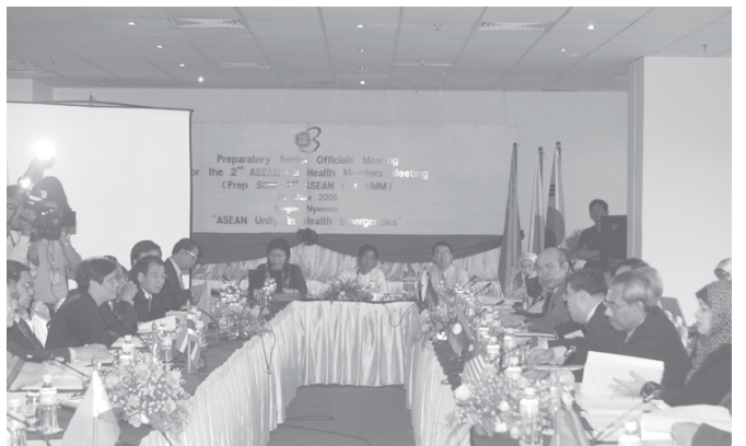
Preparatory Senior Officials Meeting of 2nd ASEAN+3 Health Ministers' Meeting in progress at Sedona Hotel.

YANGON, 21 June — Preparatory Senior Officials Meeting of the 2nd ASEAN+3 Health Ministers' Meeting was held at here yesterday.