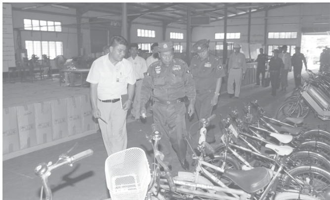
Lt-Gen Ye Myint of Ministry of Defence inspects products of Bicycle Factory in Kyaukse. — MNA

In the afternoon, the commander inspected construction of the reinforced concrete bridge on Taunggyi-Ayethaya Industrial Zone Road and production of factories in Ayethaya Industrial Zone. The commander oversaw the convocation hall and lecture halls at Government Technological College (Ayethaya), and gave instructions on growing of shade trees and flowery plants. — MNA