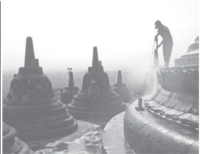
A worker sprays a stupa as he cleans Borobudur temple following an ash fall from the Mount Merapi volcano, central Java, on 19 June, 2006.