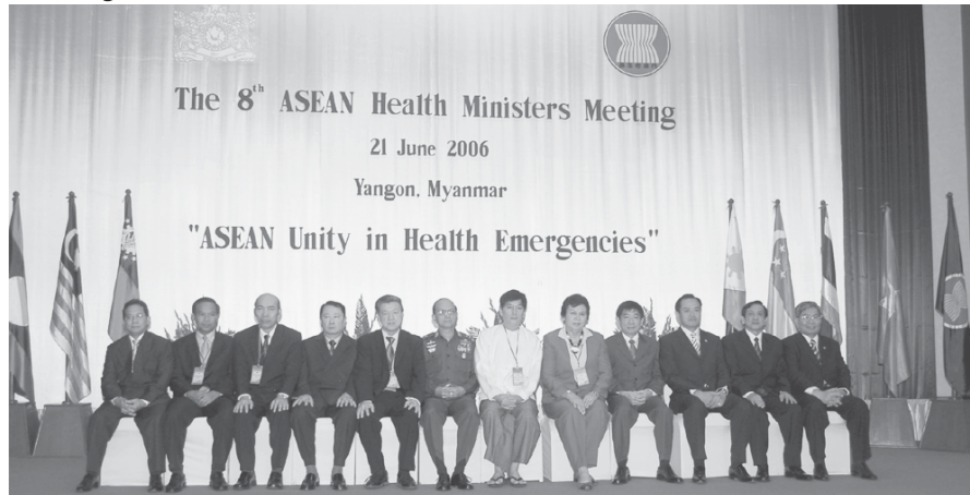
Secretary-1 Lt-Gen Thein Sein, Health Ministers and Deputy Health Ministers of ASEAN countries and the Deputy Secretary-General of ASEAN pose for documentary photo.

I am encouraged to learn that important issues such as ASEAN+3 Emerging Infectious Diseases (EID) Programme Phase II workplan, Operationalization of ASEAN+3 Framework for Cooperation on Integration of Traditional Medicine/Com-