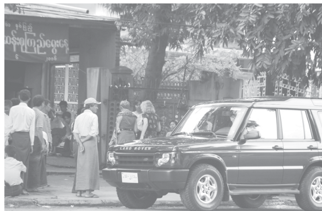
The photo shows the arrival of the British ambassador and a diplomat at NLD headquarters on 19 June 2006 by an embassy car.

The US which has been interfering in Myanmar's affairs since 1988 cut off all military and economic assistance to Myanmar soon after the Tatmadaw government assumed State duties. It acknowledged the result of 1990 election and has been pressing Myanmar to transfer power to NLD. The US Congress in 1997 passed a law prohibiting investments in Myanmar. It also approved a decree prohibiting all exports from Myanmar and freezing all overseas financial possessions of Myanmar families in 2003.