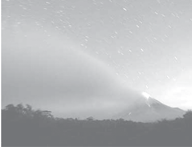
Lava flows down the slopes of Mount Merapi in Indonesia.