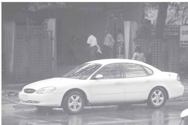
A US embassy staff arrives at NLD headquarters by an embassy car on 21 June 2006.

including six Americans, two Thai citizens and three Malaysians who were giving away to the people the pamphlets saying both in English and in Myanmar 'do not forget 8-8-88' at Bogoyoke Aung San Market and other busy places. And the people sent them to the authorities concerned. The 18 foreigners illegally entered the nation via the International Organization for Democracy in Burma in the US with the help of the Alternative