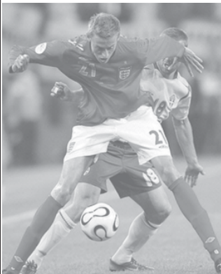
England's Peter Crouch (L) fends off Swedish forward Mattias Jonson during their World Cup match in Cologne, Germany. The two teams tied 2-2. Sven-Goran Eriksson's worst fears have been realized after the cruel injury to Michael Owen that has seriously depleted England's already threadbare attacking options.