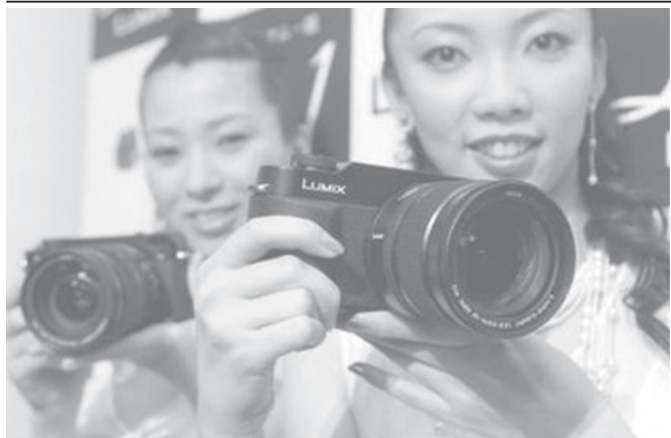
Models show off Matsushita Electric Industrial Co’s first digital single lens reflex (SLR) cameras ‘LUMIX DMC-L1’ during an unveiling in Tokyo on 21 June, 2006.