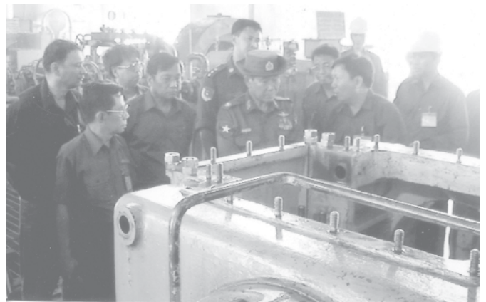
Minister Brig-Gen Lun Thi inspects No 1 Fertilizer Plant (Sale) in Magway Division.

YANGON, 21 June — Minister for Energy Brig-Gen Lun Thi inspected No 1 Fertilizer Plant (Sale) in Magway Division on 18 June.