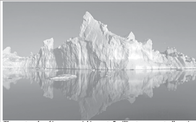
The great castles of ice, some weighing up to 7 million tons, are actually resting on the ocean floor, which is 1,500m (4,900ft) deep, recently.

and Bangkok, Thailand. Besides air pollution, water quality and accessibility were also worsening, he said. Therefore, the government should play the main role in efforts to handle all problems relating with environmental and natural resources management so that development could take place in a sustainable way, he said.—MNA/Xinhua