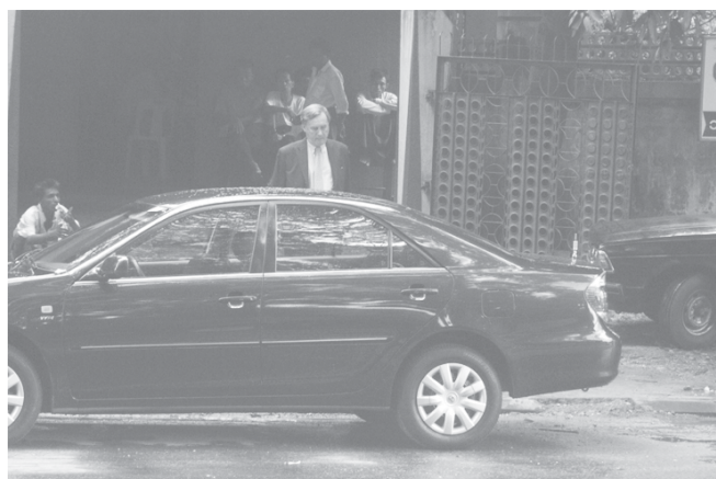
French embassy official seen at NLD headquarters on 6 June 2006.

At that time, Former Czech President Havel and Nobel Prize winner South African Archbishop Tutu compiled the accusations levelled by the western powers and their minions against Myanmar, prepared and presented a report that