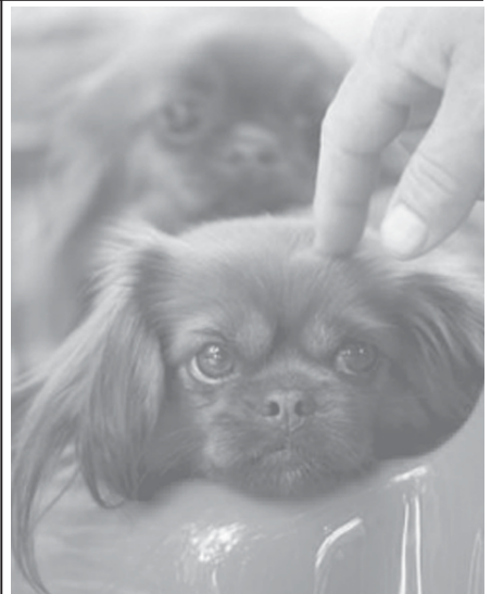
Dogs wait to enter a canine beauty contest in Bucharest on 18 June, 2006.—INTERNET

"Clearly long waits are unacceptable," it said in a statement. "Laboratories are now working very hard to get their new equipment and working practices up to speed." MNA/Reuters