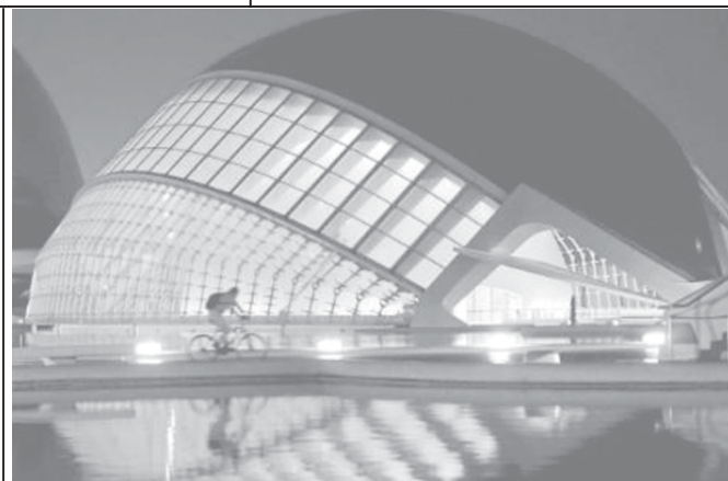
A cyclist rides next to the building of L'Hemisferic (Hemispheric), designed by Spanish architect and engineer Santiago Calatrava, in Valencia on 20 June, 2006.

The project in Kazakhstan, which is planned later than the projects in Russia and Mongolia, will follow a similar process to Mongolia, he said.—MNA/Xinhua