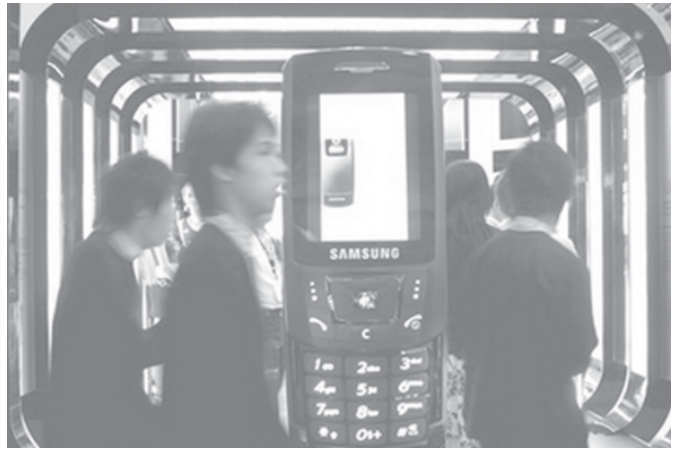
Visitors walk past a giant mobile phone on display during one of Asia's biggest communication technology exhibitions, on Tuesday, 20 June, 2006 in Singapore.