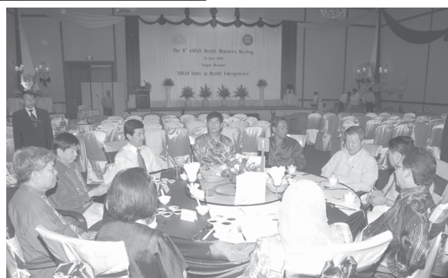
Minister for Health Dr Kyaw Myint hosts dinner in honour of participants in 8th ASEAN Health Ministers' Meeting.

Health Minister of Myanmar Dr Kyaw Myint hosted a dinner in honour of health ministers and senior officials from ASEAN nations, ASEAN Secretariat and WHO and ambassadors of ASEAN nations to Myanmar at Sedona Hotel.—MNA