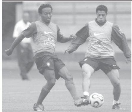
Brazil's Ze Roberto (L) and Cicinho fight for the ball during a soccer training session in Bergisch Gladbach on 20 June, 2006 during the World Cup 2006 tournament.