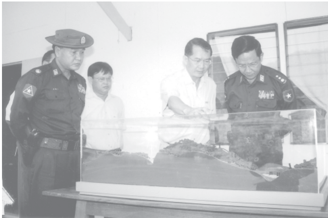
Minister Col Zaw Min inspects a scale model of Tarhsan Hydel Power Project.

The preliminary engineering works commenced in the early 2004. The plan is being implemented to build a 200-megawatt power plant for the first phase, three 771-megawatt hydel power plants for the second phase, and seven 771-megawatt hydel power plants for the third phase. On completion, the project will generate 7,310 megawatt. — MNA