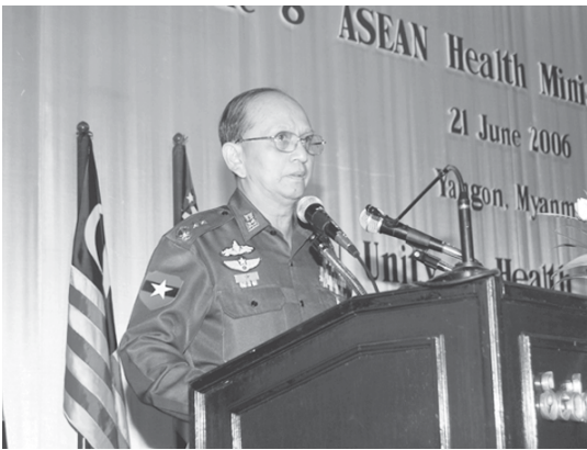
National Health Committee Chairman Secretary-1 Lt-Gen Thein Sein addresses 8th ASEAN Health Ministers' Meeting.

astating earthquake in Yogyakarta, Indonesia, which are beyond the capability of affected countries to cope with single handedly. Greater cooperation and coordination among nations is necessary in such health emergencies. Therefore, it is fitting that we have chosen the theme of this meeting as "ASEAN Unity in Health Emergencies". We must show our unity, solidarity and ASEAN's (See page 7)