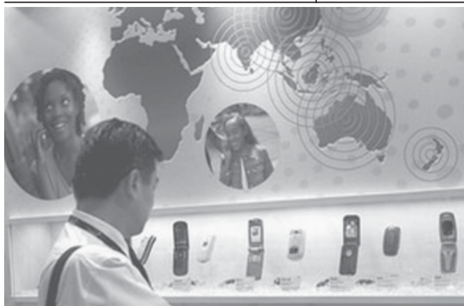
A visitor looks at a mobile phone display at the CommunicAsia 2006 exhibition in Singapore. Sales of music for use on mobile phones are expected to nearly double over the next five years, a European cellular content provider has said.

(Issued at 22:00 hours MST, Today) A Strong earthquake of intensity (6.0) Richter Scale with its epicenter outside Myannar (Nicobar Islands, India Region) about (770) miles Southwest of Kaba-Aye seismological observatory, was recorded at (19) hrs (07) min (27) sec MST on 21st June 2006.