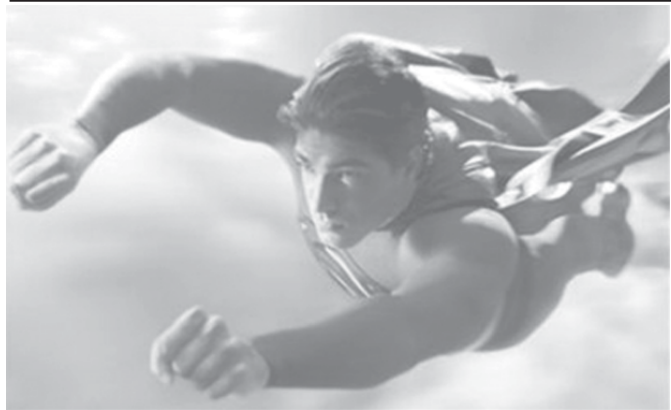
A scene from 'Superman Returns' from Warner Bros Pictures. The film, which opens in the US next week, is receiving knock-out first reviews from critics, with newcomer Brandon Routh tipped to win over audiences as the latest crime-fighting 'Man of Steel.'