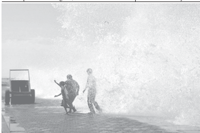
People run away from breaking waves in Jiquilillo, Nicaragua, 160km north of Managua, on 20 June, 2006. A freakishly powerful storm far off in the South Pacific propelled huge swells to the Americas, causing a surge of waves that battered homes and beachfront businesses from Peru to Mexico, authorities said on 20 June.