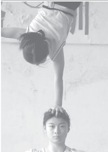
Acrobats train at a local acrobatic circus in Hefei in east China's Anhui Province on 19 June, 2006. The young acrobats normally have to go through seven years of training before they perform on stage, local media reported. Picture taken on 19 June, 2006.

The National Weather Service predicted thunderstorms could return to the Houston area and continue until midday Tuesday, dumping as much as another 5-10 inches (13-25 centimetres) onto the already water-logged ground. — MNA/Reuters