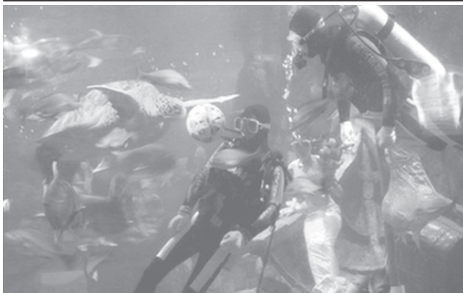
A ‘football’ game is held under water in Ocean World Park of Donghu Lake in Wuhan, central China, on 20 June, 2006. Two teams are respectively composed of marine creatures and two divers, and the referee is a ‘mermaid’ dressed up by a diver, said China’s Xinhua news agency, which distributed this photo.