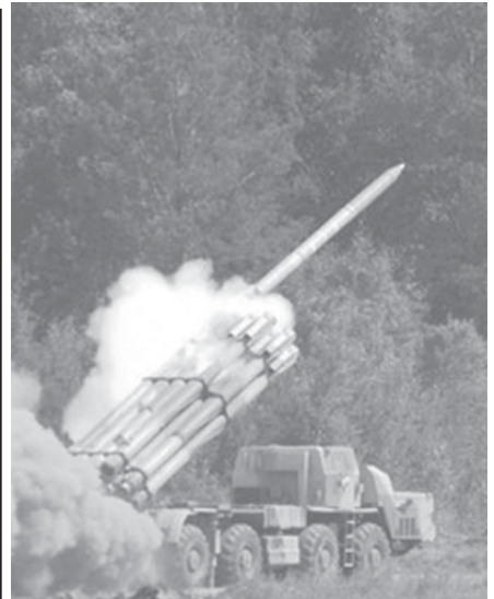
Russian made Smerch 300 mm Multiple Launch Rocket System fires a rocket during an exhibition in the Urals town of Nizhny Tagil, 1,300 km (801 miles) east of Moscow in this recent file photo.