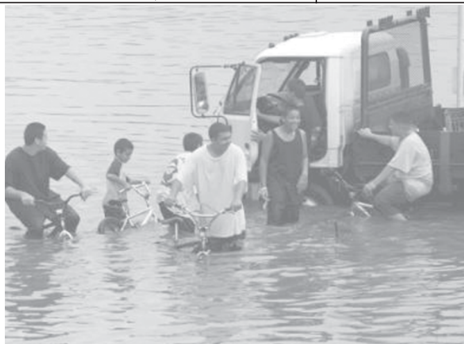
Teenagers on bicycles pedal through floodwaters amid stranded vehicles on a flooded freeway feeder road caused by severe thunderstorms in Houston, on 19 June, 2006.