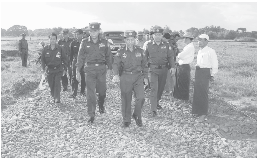
Lt-Gen Myint Swe of the Ministry of Defence inspects the road project between Yangon West University and Htantabin.