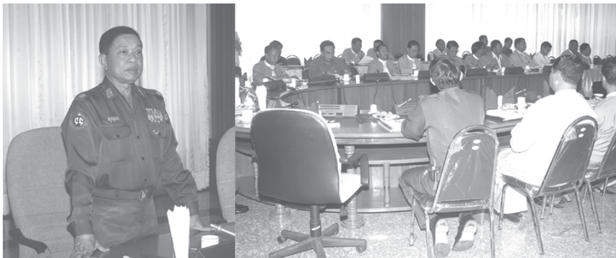
Minister Brig-Gen Ohn Myint addresses the 2nd meeting of the Central Committee for special sales of jade, gems and pearl for 2006. — MNA

YANGON, 20 June — A coordination meeting for the special gems sales for 2006 was held at Myanmar Convention Centre yesterday.