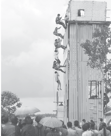
Policewomen of the Myanmar Police Force demonstrating their skills.

YANGON, 20 June — Hailing Myanmar Women's Day which falls on 3 July, a skill demonstration of policewomen of Myanmar Police Force organized by Myanmar Women's Affairs Federation was held at the training ground of No 7 Police Battalion in Kyauktan Township, Yangon Division this morning.