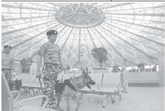
Police dogs guided by their handlers patrol the Shanghai South Railway station in Shanghai on 19 June, 2006. The Shanghai South Railway station will begin trial operations on 25 June and normal operations next month, Xinhua News Agency reported.