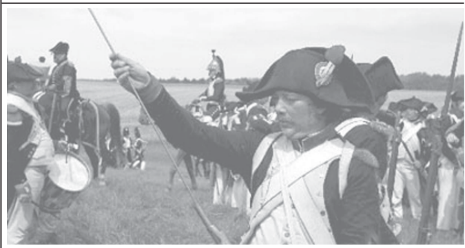
Actors take part in a remake of the 1815 Waterloo battle at the former battle field of Waterloo, some 20 km from Belgium's capital Brussels, on 18 June, 2006.