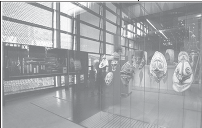
View taken on 16 June 2006 in the "Musée du quai Branly", a museum of primitive arts from Africa, Asia, Oceania and America designed by French architect Jean Nouvel. Europe's newest museum, dedicated to celebrating tribal arts and cultures, will be inaugurated on Tuesday by French President Jacques Chirac, the culmination of an 11-year personal quest.