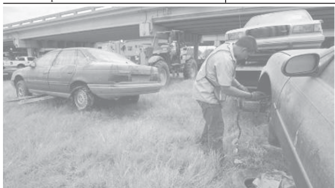
A worker prepares to tow an abandoned car near a highway overpass in New Orleans, on 19 June, 2006. The city has ordered the removal of thousands of damaged vehicles left behind after Hurricanes Katrina and Rita in 2005.