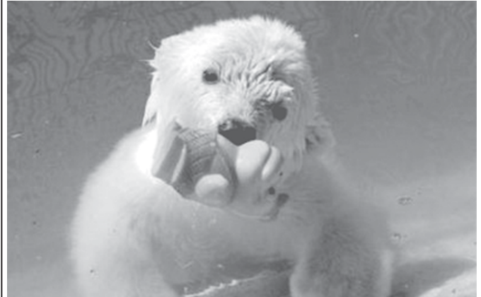
A four-month-old polar bear cub plays in a pool in the zoo in the Siberian city of Krasnoyarsk, on 19 June, 2006. The weak and hungry orphaned cub was delivered in May from a scientific polar station on Wrangel Island in the Arctic Ocean to the zoo, where it is recovering.