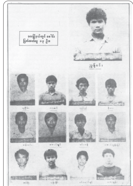
The thirteen who beheaded innocent people in Dalla Township during the 1988 disturbances.

The economic sector of the State was brought to a halt for about nine months due to riots. Production of goods and services nose-dived. When the Tatmadaw took over the responsibilities, it was confronted with the worst situation of economy. A foreign correspondent even remarked that it was unlikely the Tatmadaw government would be able to take control of the nation in the long run in view of