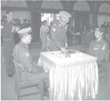
Commander of Yangon command Brig-Gen Hla Htay Win opens Commander's Shield Chess Competitions for 2006.

Next, the commander and party cheered the competitors taking part in the chess contest. Altogether 17 teams are participating in the contest which continues till 24 June. — MNA