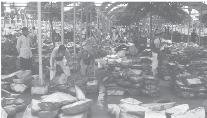
Local and foreign gem merchants examining the jade lots.

Local merchants are allowed to examine pearl lots at Myanmar Gems Emporium until 21 June and sales will be held on 22 June and the sales of gems and pearl lots for for-