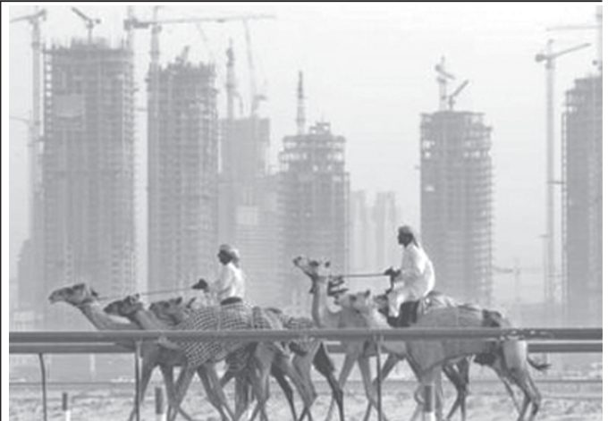
Camel trainers run their camels past construction developments opposite the Nad al-Sheba race track in Dubai on 20 June, 2006.