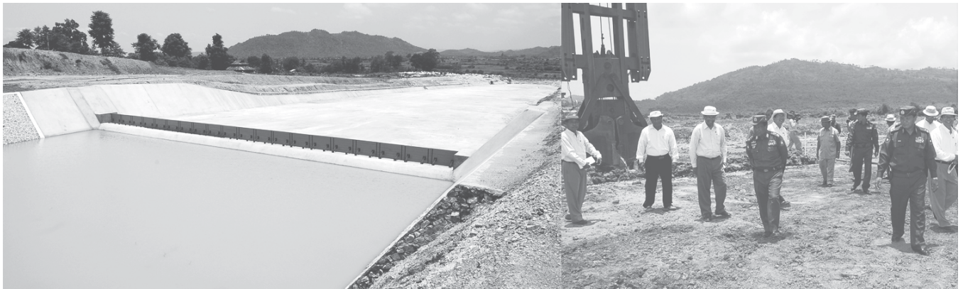
Lt-Gen Ye Myint inspects Marlenattaung Dam Project in Singu Township, PyinOoLwin District.