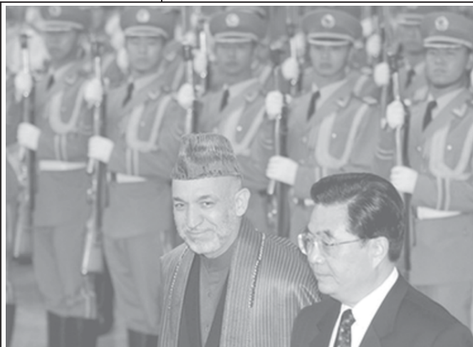
Afghanistan President Hamid Karzai, left, reviews an honour guard with Chinese President Hu Jintao during a welcome ceremony in Beijing's Great Hall of the People on 19 June, 2006.