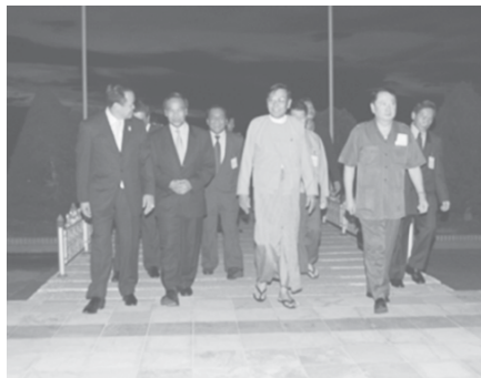
Health ministers and deputy ministers from Laos, Vietnam and Thailand are welcomed at Yangon International Airport.