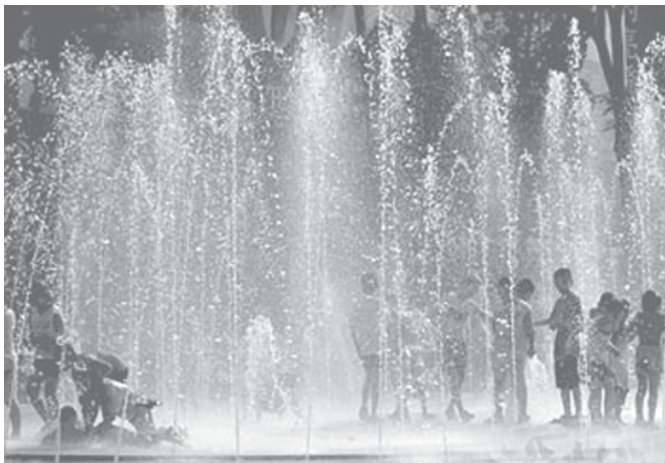
Children enjoy coolness beside a fountain at Zijingshan Square in Zhengzhou, capital of central China's Henan Province, on 19 June, 2006. The highest temperature hit 40 Celsius in Zhengzhou on 19 June, 2006.