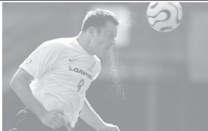
Australia's World Cup soccer team captain Mark Viduka heads the ball during a training session at the De Kuip Stadium in Rotterdam, the Netherlands on 3 June, 2006.