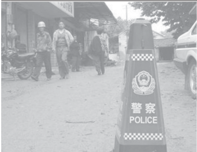
A police stop sign is seen on the way to the scene where a military transport plane crashed in east China's Anhui Province on 4 June, 2006.