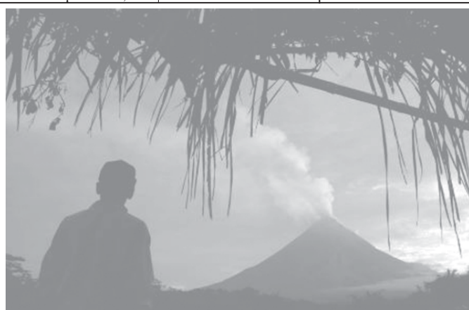
A villager watches as hot lava flows from the Mount Merapi volcano at Tunggularum village, near the Indonesian city of Yogyakarta, 440 km (273 miles) east of Jakarta, on 4 June, 2006.—INTERNET