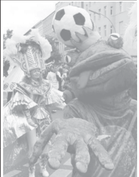
Participants of a parade dressed in colourful costumes dance in the streets of the German capital Berlin on 4 June, 2006. Thousands of people watched the parade of Berlin's ethnic minorities called 'Carnival of the Cultures'.