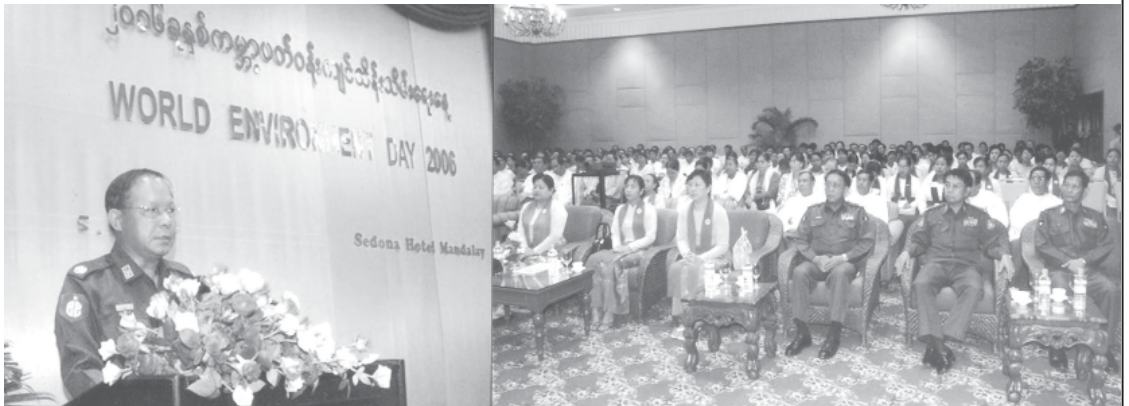
Minister Brig-Gen Thein Aung delivers a speech at the ceremony to mark the World Environment Day. — MNA

Minster Brig-Gen Thein Aung said the slogan for 2006 the World Environment Day was "Don't Desert