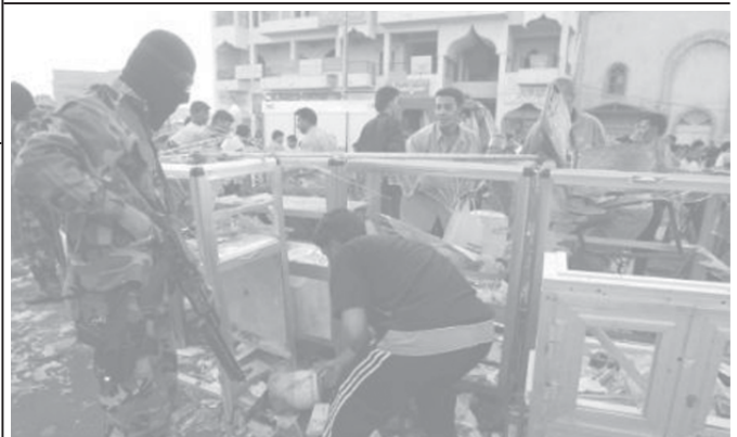
An Iraqi soldier watches as a street merchant recovers goods from his stall at the scene of a bombing which killed 15 people in Basra, 550 km (341 miles) south of Baghdad on 3 June, 2006.

"This whole thing must be completely cleared up," he added. Reports said that US Marines had carried out a massacre of civilians in the western Iraqi town of Haditha on 19 November, and covered up the fact. Women and children were among the 24 victims of the alleged killing, according to the reports.