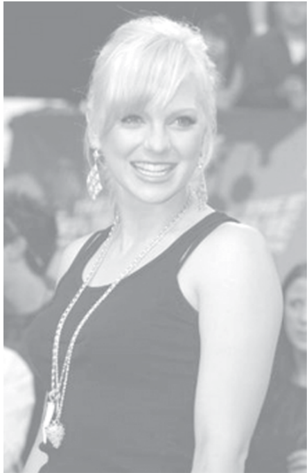
Actress Anna Faris arrives for the taping of the 2006 MTV Movie Awards in Los Angeles, on 3 June, 2006. The show will be telecast on 8 June, 2006.