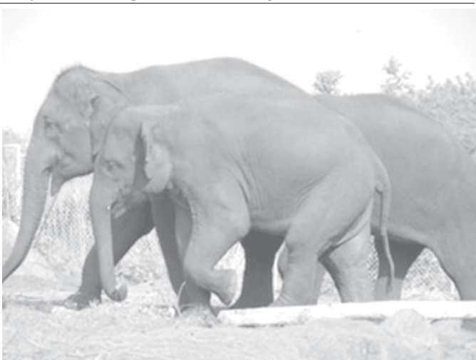
Three of the eight endangered Asian elephants at a Thai quarantine centre in 2005. The elephants have been stranded in Thailand for months due to legal wrangling but are now set to leave for Australia.

KATHMANDU, 5 June — Nepali Deputy Prime Minister KP Sharma Oli has said that the guerillas would do well to wait to "talk up their problem" rather than stepping up pressure on the government, The Himalayan Times reported on Sunday. Oli was quoted by the newspaper as saying while addressing a function in the capital on Saturday that the guerillas' leadership should not issue threats to "go back to the jungle when the government is ready to talk. There is absolutely no need to raise doubt over the motive of the state". "Don't use language of issuing warnings," Oli told guerilla leaders by way of reacting to almost daily reports of the guerilla leaders telling the government something or the other as part of "intimidatory tactics". Saying that it was always better to have patience when chasing an important agenda, Oli told the guerillas to have patience while the government works out the mechanism to resolve the Long-standing issues. MNA/Xinhua