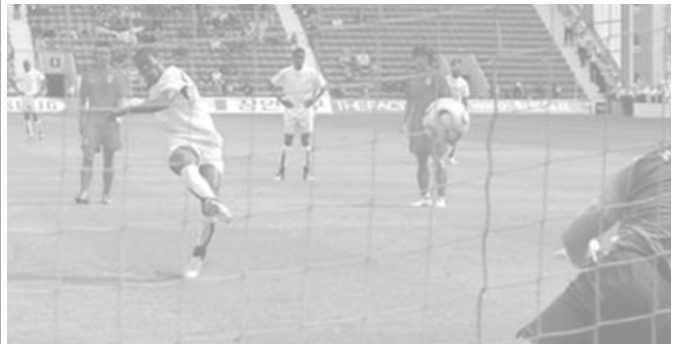
Ghana's Asamoah Gyan (2nd L) scores from the penalty spot against South Korea during their international friendly soccer match at Hibernian's Easter Road Stadium in Edinburgh, Scotland on 4 June, 2006.