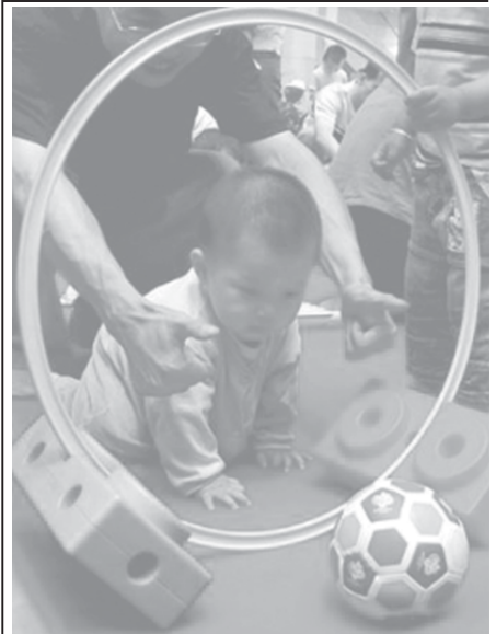
A baby crawls towards a football through a plastic hoop during Super Football Baby contest to celebrate the upcoming World Cup, in Nanjing, capital of east China’s Jiangsu Province on 4 June, 2006.—INTERNET

Shiite politicians, the Supreme Council for the Islamic Revolution in Iraq (SCIRI), one of the most powerful Shiite parties, wanted one of its own in the post.—Internet