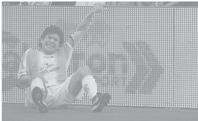
Argentina’s soccer legend Diego Maradona screams in pain after being fouled during his Indoor World Cup soccer match against Brazil in Jerez, southern Spain, on 3 June, 2006.