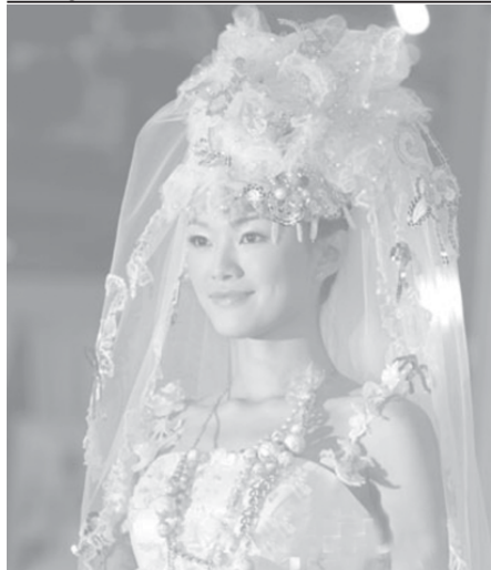
A model displays a bridal headgear at a wedding dress show in Hong Kong, south China, on 3 June, 2006.