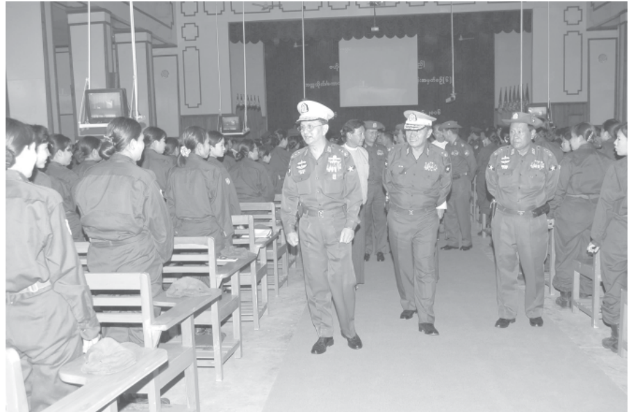
Secretary-1 of the State Peace and Development Council Lt-Gen Thein Sein greets trainees of the special refresher course No 6 for university teachers at CICS (upper Myanmar).—MNA

Nowadays, the government is making efforts for all-round development in every sector and imple-