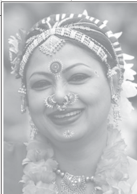
An unidentified costumed dancer from Bangladesh smiles during the Carnival of Cultures in Berlin, on 4 June, 2006.

Opened in January, 1977, Ocean Park is Hong Kong's unique local park with a heritage of delivering family fun and fond memories. It was chosen by Hong Kong citizens as the most favourite scenic spot in Hong Kong last year.