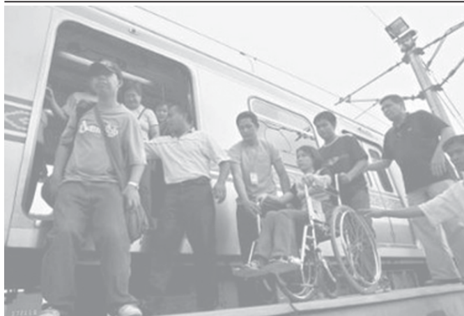
Passengers alight from a Light Rail Transit train during an earthquake drill in Manila on 4 June, 2006.