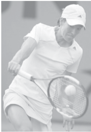
Belgium's Justine Henin-Hardenne returns the ball to Russia's Anastasia Myskina in their fourth round match during the French Open tennis tournament, at the Roland Garros stadium in Paris, on 4 June, 2006.