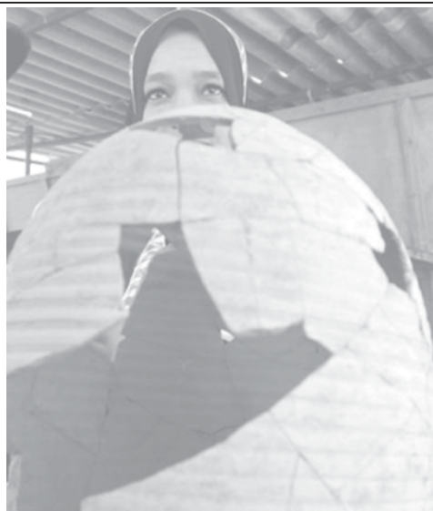
A worker restores an ancient vase at the Karnak Temple in Luxor, Egypt on 4 June, 2006.

Yet, a third of the nation's 750,000 active, post-residency physicians are older than 55 and likely to retire just as the boomer generation moves into its time of greatest medical need, according to the paper. — MNA/Xinhua