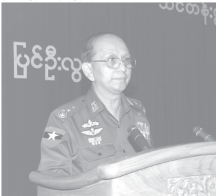
Secretary-1 of the State Peace and Development Council Lt-Gen Thein Sein delivers an address at the opening ceremony of the Special Refresher Course No 6 for university teachers at Central Institute of Civil Service (Upper Myanmar) in PyinOoLwin. — MNA

Nay Pyi Taw — Special Refresher Course No 6 for university teachers opened at Central Institute of Civil Service (Upper Myanmar), in PyinOoLwin Township, Mandalay Division, this morning, with an address by Chairman of Myanmar Education Committee Secretary-1 of the State Peace and Development Council Lt-Gen Thein Sein.