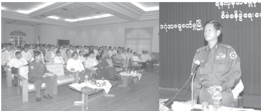
Maj-Gen Khin Maung Myint speaking in meeting with members of management committees of industrial zones. —MNA

Deputy Director-General of Electric Power Department U Saw Win later reported on arrangements to be made for supply of more electricity and the minister met with committee members from 10 industrial zones in Yangon East District. — MNA