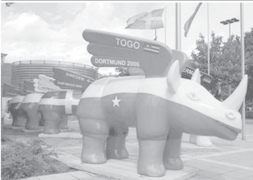
Sculptures of rhinoceros painted in different colours of participating countries of the World Cup 2006 are seen in the city of Dortmund. The FIFA soccer World Cup 2006 will be held in Germany from 9 June - 9 July. —Internet

Mandalay and neighbouring areas Likelihood of isolated rain or thundershowers. Degree of certainty is (60%).