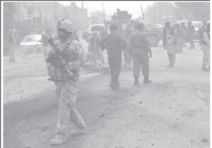
A Canadian soldier patrols a suicide car bomb blast site in Kandahar on 4 June, 2006.

The official said that the blocks had potential for hydrocarbon findings. — MNA/Xinhua