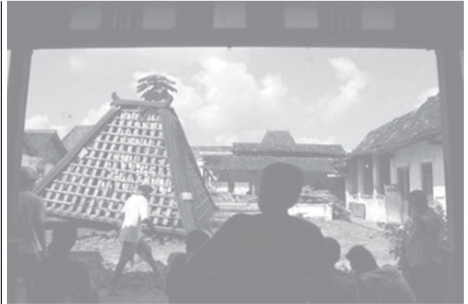
Villagers sit near a Javanese traditional rooftop named Joglo, which collapsed during an earthquake, at the ancient district of Kotagede in the earthquake-hit Indonesian city of Yogyakarta, on 3 June, 2006.