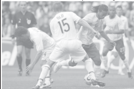
Brazil's Ronaldinho, right, fights for the ball with New Zealand's Noah Hickey, left, and Steve Old, center, during a test match between the national soccer teams of Brazil and New Zealand, in Geneva, Switzerland, on 4 June, 2006, ahead of the World Cup in Germany. Brazil will play in group F with Croatia, Australia and Japan. New Zealand is not qualified for the World Cup.