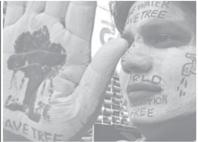
An environmental activist gestures in the central Indian city of Bhopal on 4 June, 2006.