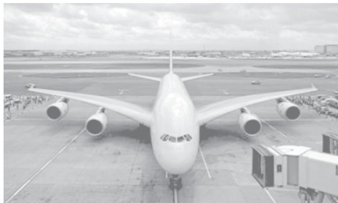
The world's largest passenger plane, the Airbus A380, is seen on the tarmac after it landed at Heathrow airport near London, on 18 May, 2006. The double-decker superjumbo, designed to carry 555 passengers but with room for more than 800, flew from Berlin to Heathrow for its first visit to Britain.