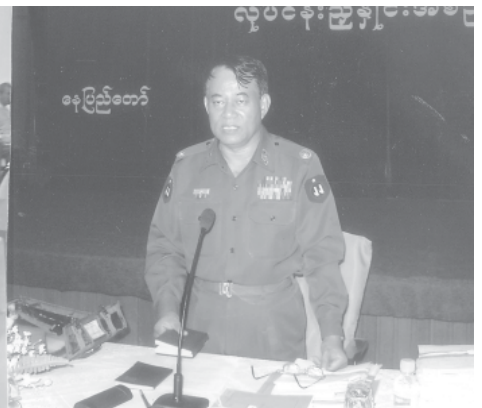
Minister for Livestock and Fisheries Brig-Gen Maung Maung Thein addresses the coordination meeting of the ministry. — MNA

ous kinds of tax, and releasing of fish species into lakes.