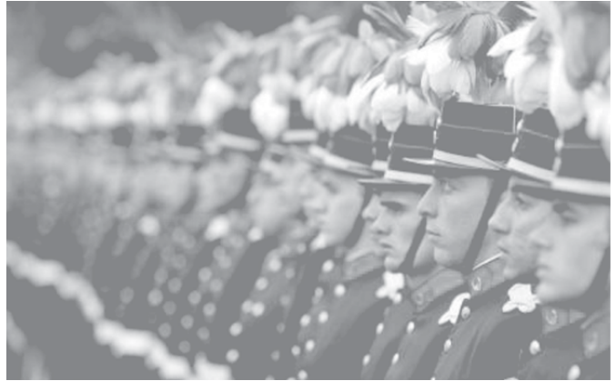
Uruguayan Army cadets stand in formation during Army day celebrations in Montevideo, Uruguay, on 18 May, 2006.