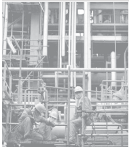
Singapore Refining Company personnel work at Jurong Island in Singapore, on 18 May, 2006. Oil ebbed to a five-week low just above $68 a barrel on Thursday on signs that high energy costs were firing inflation and dampening demand in top consumer the United States.