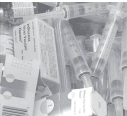
Doses of the influenza vaccine wait to be administered at a flu shot clinic at a pharmacy in Boston, Massachusetts on 13 December, 2003. The US Centers for Disease Control and Prevention is preparing its broadest and most ambitious vaccination effort yet for the coming influenza season, experts said on Thursday.