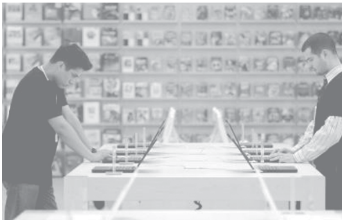
Apple store employees try out new MacBook computers at the new Apple retail store on Fifth Avenue in New York, on 18 May, 2006.