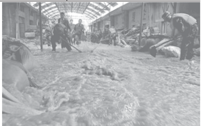
Chinese paramilitary policemen clean a road after heavy rain in Xiamen, east China's Fujian Province, on 18 May, 2006.

Fong said that his ministry was also looking into the possibility of requiring insurance companies to offer an insurance coverage for employers against cases like maids' running away. —MNA/Xinhua