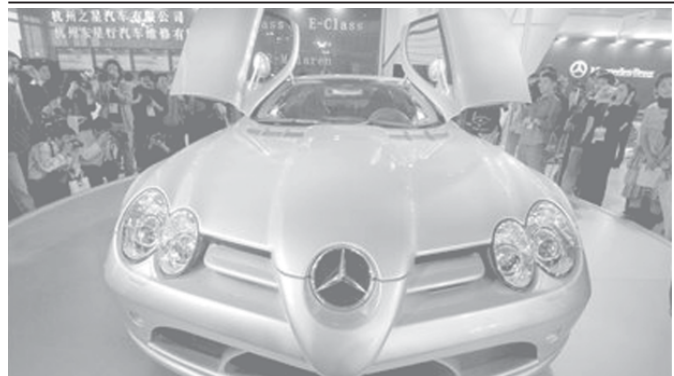
Visitors view the Mercedes Benz racing car SLR McLaren during the Seventh Hangzhou International Automobile Exhibition in Hangzhou, capital of east China’s Zhejiang Province, on 18 May, 2006.