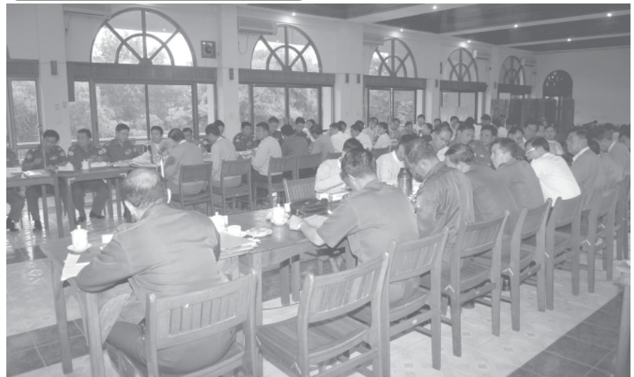
Those attending the meeting of Yangon Division Smooth and Secure Road Transport Supervisory Committee.