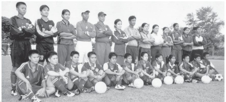
Tentatively-selected Myanmar women's soccer team.