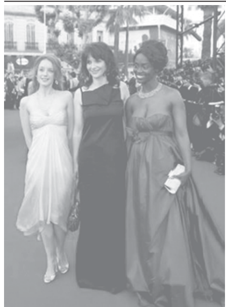
French actresses Ludivine Sagnier (L-R), Juliette Binoche, and Aïssa Maïga arrive for the screening of ‘Paris Je T’aime’ which opens the ‘Un Certain Regard’ competition at the 59th Cannes Film Festival, on 18 May, 2006.