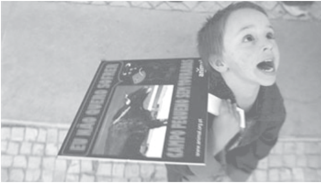
The son of a demonstrator holds a placard against bullfighting in front of Lisbon's Campo Pequeno Bullring on 18 May, 2006. The placard reads "I (the bull) do not want to suffer."