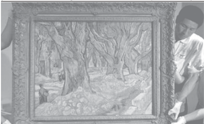
Staff display ‘Large Plane Trees’, a masterpiece by Vincent Van Gogh in Beijing, on 18 May, 2006. This is the first time the masterpiece by Van Gogh is shown in China. Three oil paintings by the Dutch artist will be displayed together with works by Claude Monet and Pablo Picasso, which are on loan from the Cleveland Museum of Art in the US, China Daily reported. Picture taken on 18 May, 2006.