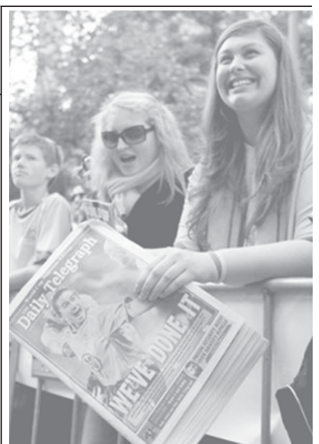
Australian Socceroo fans watch members of the team during a farewell event in Sydney, Australia, on 19 May, 2006. The event was the last chance for Sydney fans to farewell their team before they go to the World Cup in Germany.

The striker, handed the number nine shirt at White Hart Lane, also told a news conference he is keen to show that he is worth the money Spurs are paying for him.— MNA/Reuters