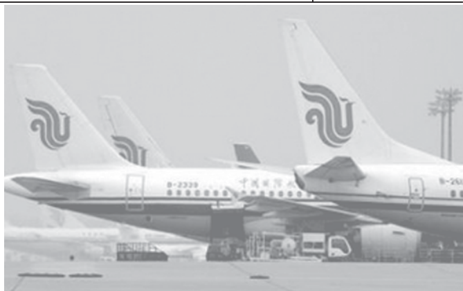
Air China Boeing and Airbus aircraft are seen at Beijing airport shown in this 20 Sept, 2005 file photo. Despite increased revenue, China's airlines posted a combined first quarter loss of 2.14 billion yuan (US$270 million) (211 million) due to higher oil prices, an official newspaper said on Friday, 19 May, 2006.