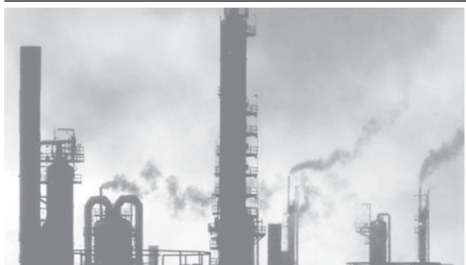
View of Venezuela's Amuay oil refinery at daybreak in Punto Fijo, 545km (340 miles) west of Caracas, on 18 May, 2006.