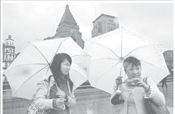
Chinese tourists from Jilin brave the wind and rain to take photos on Shanghai's historic Bund area. Typhoon Chanchu slammed into China's southeastern coast, killing 16 people and forcing the evacuation of more than one million residents, as torrential rains and winds caused landslides and flooding.

"People in your position need to know they cannot do these things and if they do the consequences are very, very serious," he said in handing down a sentence harsher than the six months home detention and community service sought by Tobin's lawyer. — MNA/Reuters