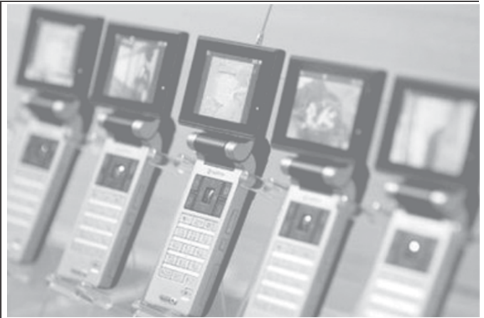
Vodafone’s new 905SH mobile phones are displayed at a news conference in Tokyo, on 18 May, 2006. Japan’s Softbank Corp said on Thursday it and Vodafone Group Plc have agreed to set up a joint venture and jointly develop and procure mobile phones and content.

Policosanol, which was originally popular as a natural way to reduce cholesterol in Cuba and is now marketed in more than 40 countries, is a combination of alcohols usually made from the waxy coating on sugarcane. Other sources of the ingredient include wheat germ, rice, bran and beeswax. — MNA/Xinhua