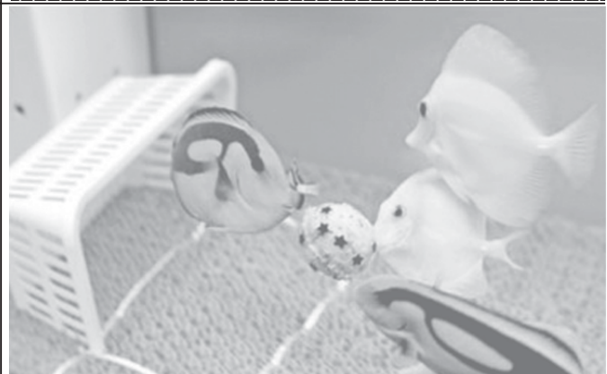
Yellow Tang and Blue Palett Surgeon fish pick fishbait packed ball, looking like playing soccer on a football field shaped fishtank at the Hakkeijima Sea Paradise aquarium in Yokohama, suburban Tokyo, on 18 May, 2006. If the forecasts are to be believed, Japan's players in next month's World Cup are small fish in a big pond.