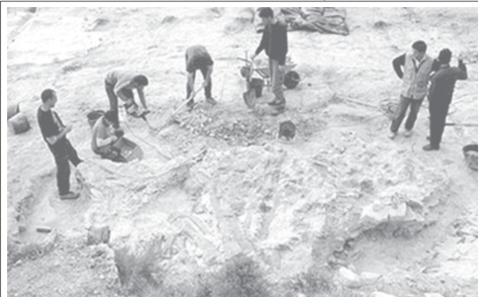
Teruel Paleontologic foundation workers are working on the dinosaur bone found in Barriohonda de Roviera a village close to Teruel, in Spain, in February 2004. Fossil-hunters have uncovered the first dinosaur remains in Lebanon, adding precious evidence to the theory that millions of years ago, the Middle East was covered with lush forests where giant reptiles roamed.