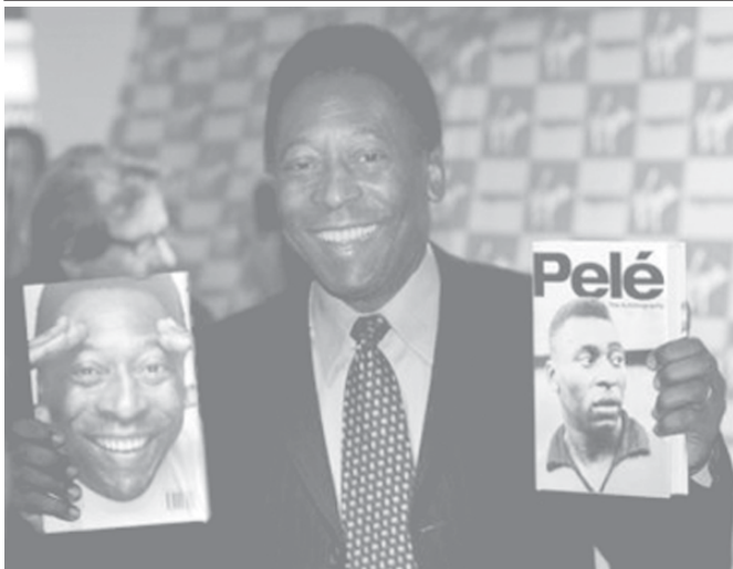
Brazilian soccer legend Pelé holds copies of his book titled 'Pel - The Autobiography' during a presentation at a central London's bookstore on 18 May, 2006. Pelé, who scored over a 1000 career goals, said he was looking forward to seeing some of the world's best strikers in this summer's World Cup finals in Germany.

Officials from six-times European champions AC Milan, Lazio and Fiorentina are also under investigation by magistrates.