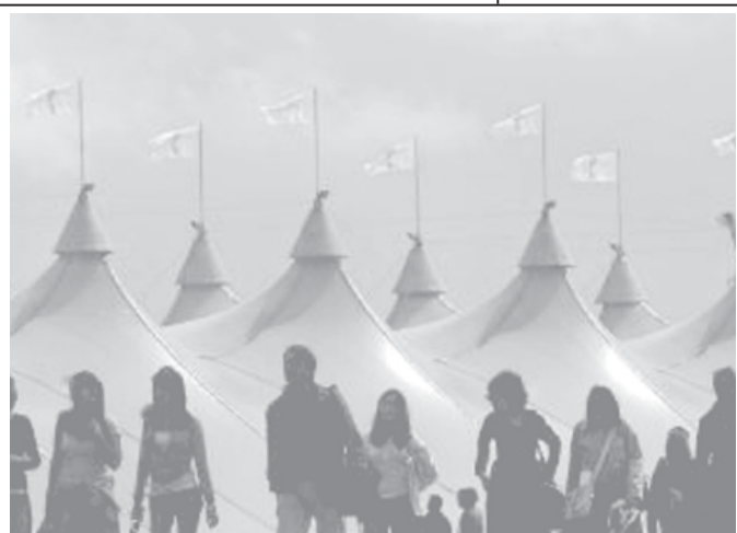
Park visitors walk near a pink tent in Hyde Park in London, on 18 May, 2006. The world's largest travelling tent has been erected for a breast cancer marathon that will take place on 22 May.