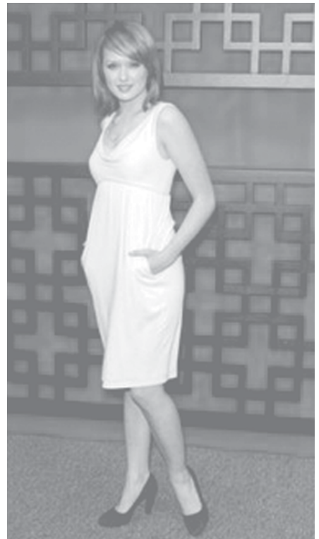
Actress Kaylee DeFer arrives at the FOX Broadcasting Company UpFront, on 18 May, 2006, in New York.

The restoration of the Garden of the Palace of Established Happiness was funded by the Hong Kong-based China Heritage Fund at a cost of nearly 100 million yuan (about 12.5 million US dollars).