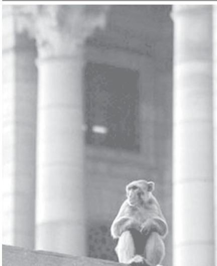
A monkey sits on a roof of the Defence Ministry building in New Delhi, in October 2004. A monkey rescued from the illegal pet trade in Singapore was repatriated to India for rehabilitation.