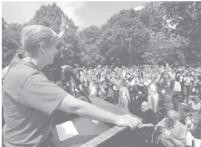
Anti-war activist Cindy Sheehan greets an anti-war rally outside the White House in Washington, on 18 May, 2006.