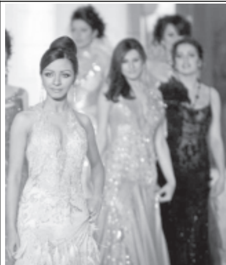
Contestants in the Pantene Miss Egypt 2006 pageant walk on stage during the competition in Cairo on 18 April, 2006.