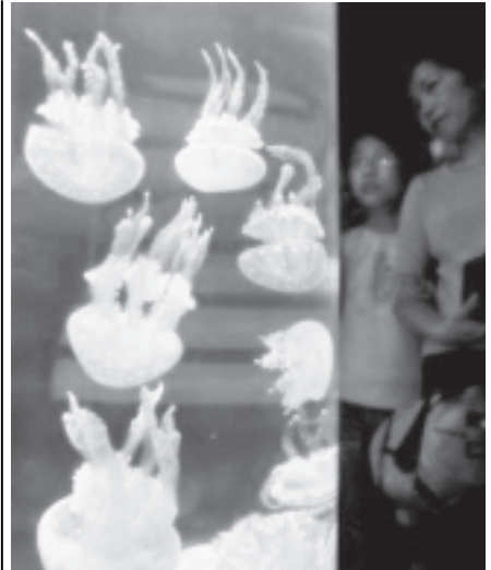
Visitors look at the jelly fish at the newly-opened exhibition hall titled 'Sea Jelly Spectacular' inside the Ocean Park aquarium-amusement park complex in Hong Kong on 18 April, 2006.