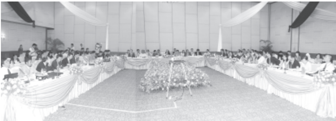
5th JICA-ASEAN Regional Co-operation Meeting in progress.