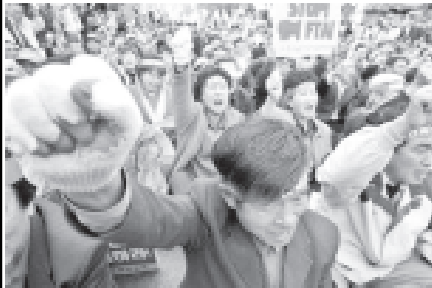
South Korean farmers shout slogans during an anti-government rally denouncing the South Korean government's move to forge a free trade deal with the United States in downtown Seoul, on 15 April, 2006.

South Korea and the United States recorded 72 billion US dollars in trade in 2004. The Korea Institute for International Economic Policy said in a report that Korea's exports to the United States could gain as much as 15.1 per cent, or 7.1 billion US dollars, while imports from the United States would rise as much as 39.4 per cent, or 12.2 billion US dollars, if the free trade deal goes into effect.—MNA/Xinhua