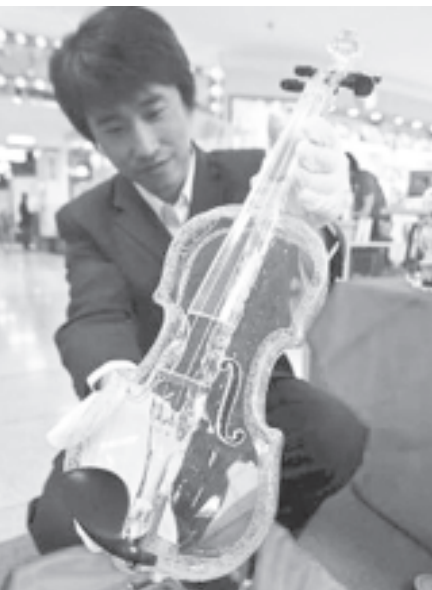
A vendor displays a violin made of glass at a shopping centre in Beijing, on 18 April, 2006. INTERNET

The lower reaches of the Yellow River have repeatedly dried up in recent years due to huge population pressures along the watercourse and an increasingly feeble ecosystem in its headwaters.—Internet