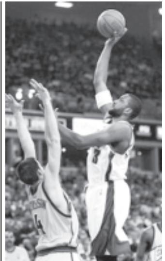
Sacramento Kings forward Shareef Abdur-Rahim, right, goes up for the shot over Seattle SuperSonics forward Nick Collison during the third quarter of an NBA basketball game in Sacramento, Calif, on 18 April, 2006. The Kings won 111-105.

All 32 sides in the finals will receive a pre-tournament shipment of 20 balls for training purposes.—MNA/Reuters