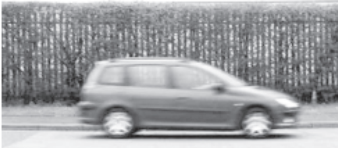
A car leaves the PSA Peugeot Citroen Ryton plant in Coventry, central England, on 18 April, 2006.