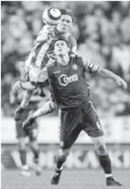
Wigan Athletic's Jimmy Bullard outjumps Aston Villa's Gareth Barry, front, during their English Premier League soccer match at the JJB Stadium, Wigan, England, on 18 April, 2006.