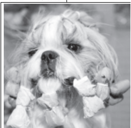
A Shih-tzu dog wears hair curlers during the Zoo Russia International Cat and Dog Exhibition in Moscow on 16 April, 2006. —INTERNET

pushing up the prices of sugar further in the local markets.—MNA/Xinhua