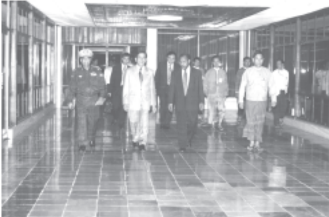
Foreign Affairs Minister U Nyan Win seen at the airport before departure for Indonesia to participate in ASEAN Ministerial Meeting Retreat.

YANGON, 19 April — At the invitation of Indonesian Foreign Minister Dr N Hassan Wirajuda, Minister for Foreign Affairs U Nyan Win left for Bali, Indonesia, by air yesterday evening, to attend ASEAN Ministerial Meeting Retreat to be held in Ubud, Bali, Indonesia on