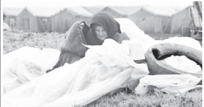
An old villager uses a plastic cover to protect herself from the rain in the flooded village of Rast, 300 km southeast of Bucharest. Thousands of Romanians prepared to flee homes threatened by floodwaters from the rising River Danube, as emergency crews desperately sought to reinforce damaged river dykes.