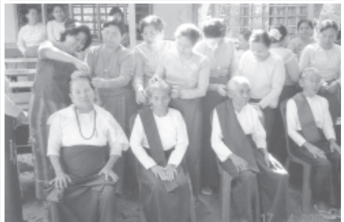
Aged women at Pyinmana Home for the Aged being shampooed on Myanmar New Year Day.

YANGON, 19 April — The Working Group for Rehabilitation and Reintegration under the Myanmar Women's Affairs Federation, Pyinmana Township Women's Affairs Organization and Social Welfare Department welcomed the New