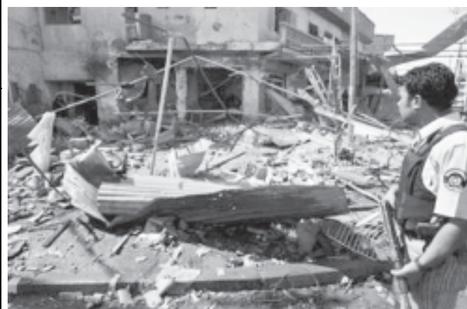
A policeman views the destruction after a powerful bomb blast in Baghdad’s Adhamiya district, on 18 April, 2006.