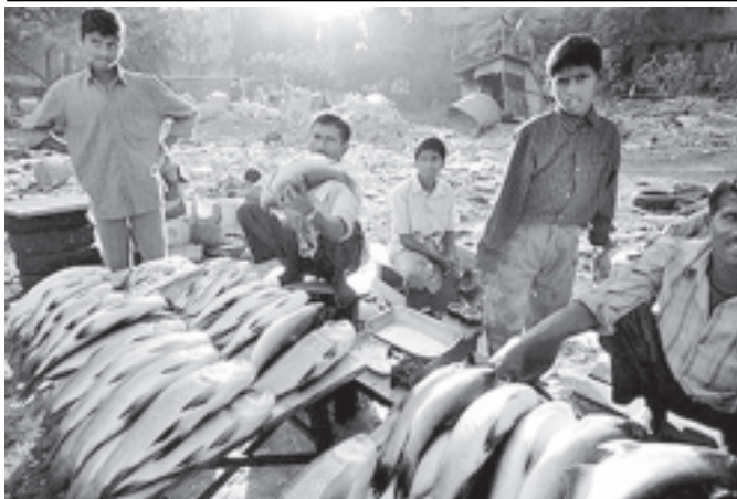
Indian hawkers selling fish on the street. India counts an estimated 10 million hawkers who sell anything from south Indian savoury pancakes to toys at prices far cheaper than restaurants and shops.