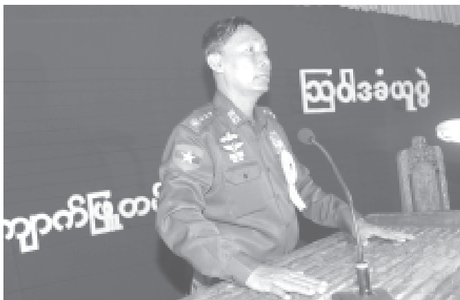
General Thura Shwe Mann gives instructions to Tatmadawmen at Thadoe Maha Bandoola Hall of the local regiment in Kyaukpyu Station.

(from page 16) the Senior General on tasks in connection with hydel power projects and dam projects. In response to the reports, Senior General Than Shwe gave guidance saying that officials of the Ministry of Agriculture and Irrigation and the Ministry of Electric Power are to collaborate in their tasks by applying appropriate technology for timely completion of the projects without delay. Senior General Than Shwe and party