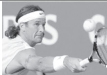
Carlos Moya of Spain returns the ball to Fernando Gonzalez of Chile during their first-round match of the Monte Carlo Open tennis tournament in Monaco. Fernando Gonzalez beat Carlos Moya 6-3, 3-6, 6-1.

Texas Rangers' Akinori Otsuka works against the Seattle Mariners during the eighth inning of their Major League Baseball game in Seattle, on 18 April, 2006. INTERNET