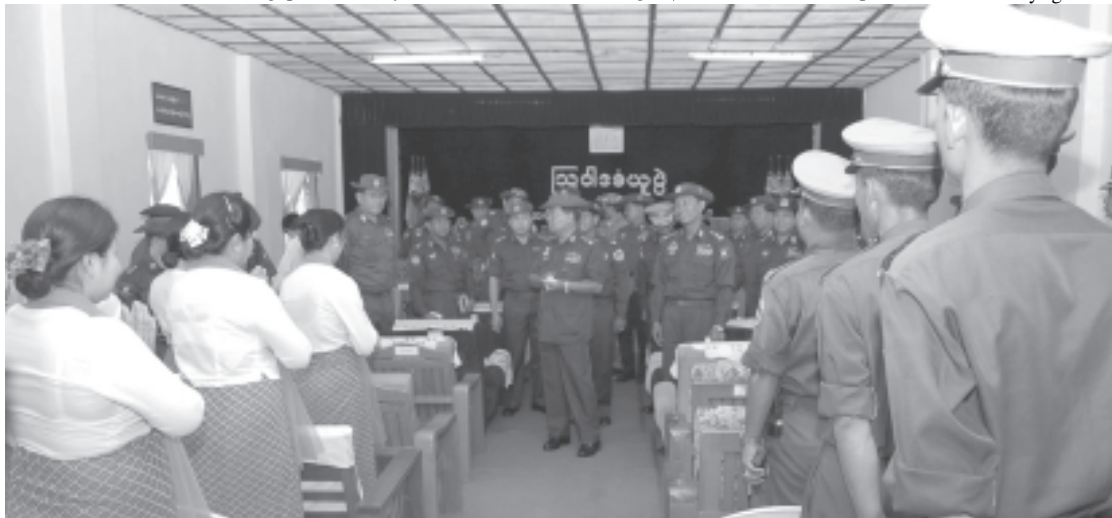
Senior General Than Shwe cordially greets officers and other ranks of local regiments and units and their family members in Kyaukpyu Station.