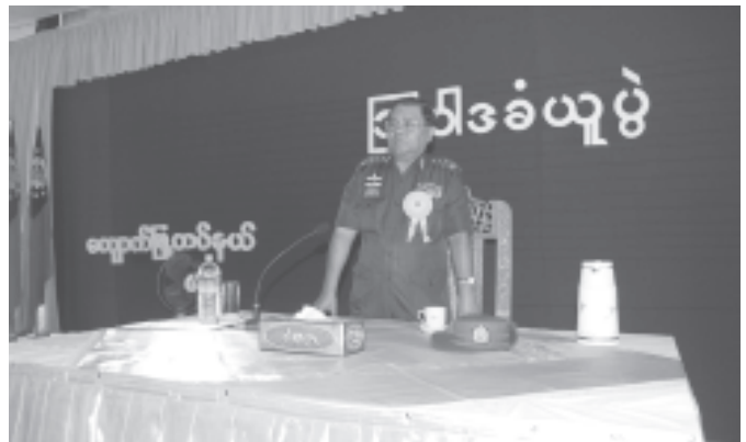
Senior General Than Shwe gives guidance to officers and other ranks of local regiments and units and their families in Kyaukpyu Station.

General Thura Shwe Mann explained construction of the nation and build-up of the