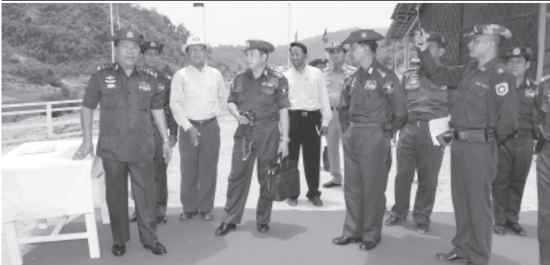
Senior General Than Shwe inspects construction of the dam of Thahtay Hydel Power Project with the use of heavy machinery. —MNA

Senior General Than Shwe inspects Thahtay Hydel Power Project in Thandwe