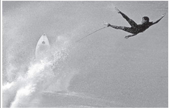
Wipe out : A Brazilian surfer flies off a wave at Leblon beach in Rio de Janeiro, Brazil.