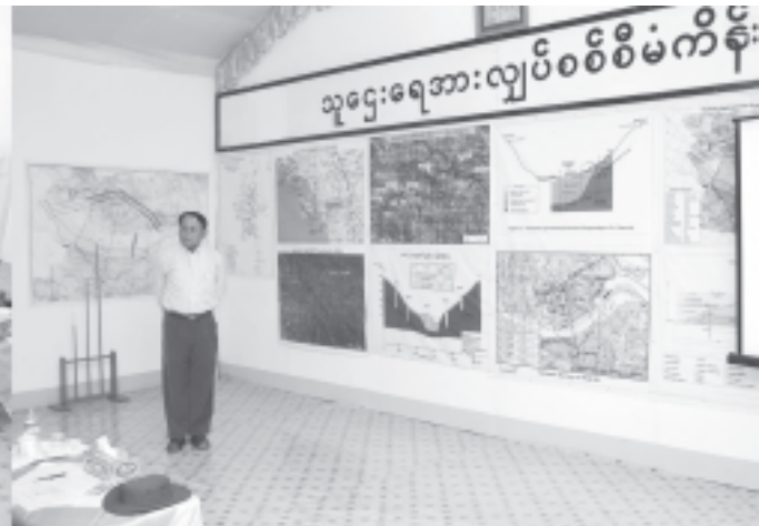
Senior General Than Shwe hears reports on implementation of Thahtay Hydel Power Project by Deputy Minister for Electric Power U Myo Myint.