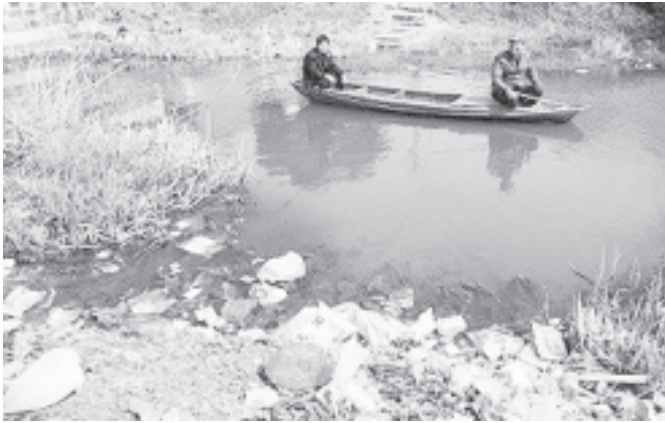
Chinese villagers fish in a polluted river. Worsening environmental problems are threatening social stability in China as aggrieved residents resort to protests to make their voices heard.