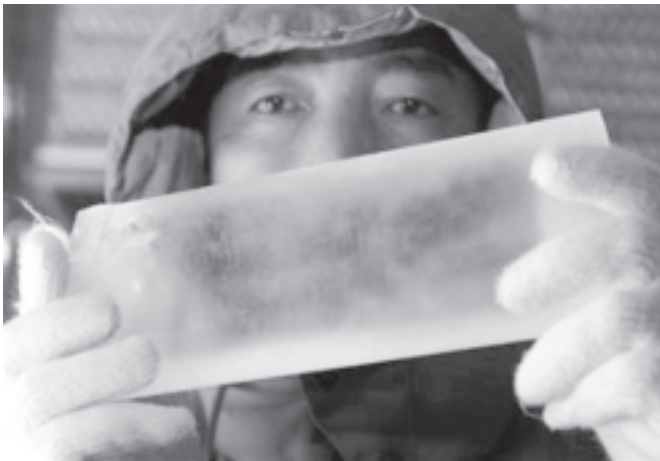
Hideaki Motoyama, project leader of the National Institute of Polar Research, holds a million-year-old ice sample in Tokyo on 18 April, 2006. — INTERNET

The researchers believe they can dig about another 20 metres into the ice at the Antarctic site before reaching base rock.—MNA/Reuters