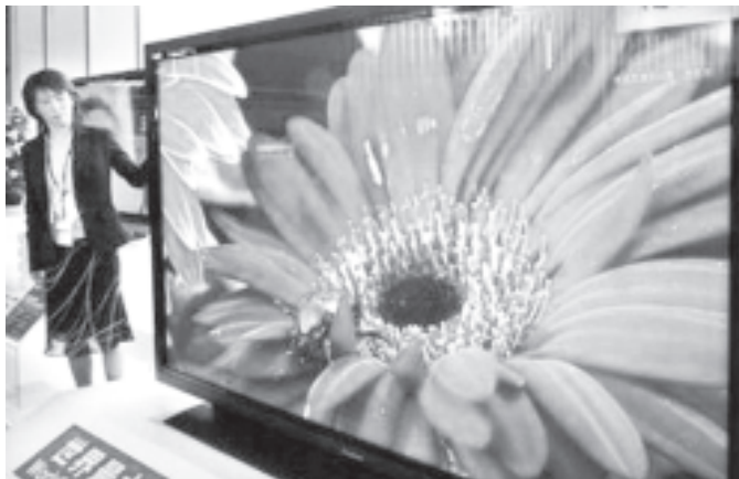
Panasonic employee Eriko Fujikawa shows off the world's largest plasma display panel with 1080p (progressive) HDTV resolution at FineTech Japan FPD (flat panel display) exhibition in Tokyo on 19 April, 2006.