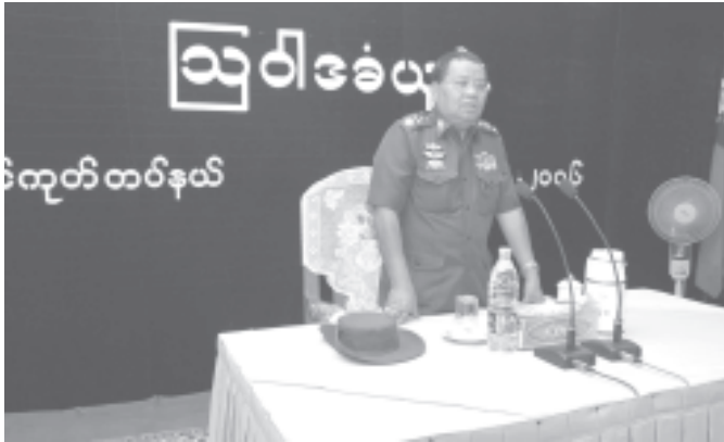
Senior General Than Shwe gives guidance to officers, other ranks and family members of regiments and units in Taungup Station. —MNA

Thahtay Hydel Power Project linked up with the national power grid is being implemented with the aim of supplying power not only to regions of Rakhine State but also to other areas. The dam is also being built for the prevention of floods in the region.