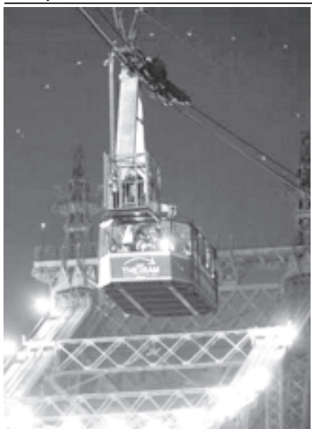
Rescue personnel help commuters trapped in a cable car of the Roosevelt Island Tram into a rescue basket in New York, on 18 April, 2006.

“I really believe it is premature for anybody to be talking about trends regarding incidents that have occurred over a two-week period,” Johnson said. — MNA/Reuters