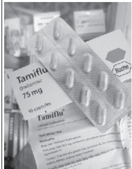
Tamiflu tablets on display at a pharmacy in Hanoi. Swiss pharmaceutical giant Roche says it has finished building a stockpile of three million courses of the antiviral drug Tamiflu for the World Health Organization.

Ahmadinejad took the salute of thousands of Army, Navy and Air Force troops goose-stepping passed. Tanks were towed passed on large trucks and helicopters flew in formation overhead. Parachutists trailing ribbons sailed down from the sky.