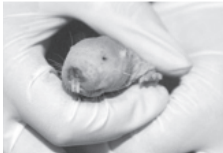
A keeper holds a naked mole-rat while it's being transferred from a holding cage at the Knoxville Zoo.