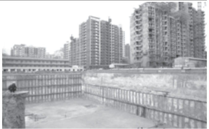
A Chinese worker perched precariously over a gigantic hole construction as the foundation of another building project in Beijing, China on 17 April, 2006. President Hu Jintao announced Sunday that the economy grew 10.2 percent in the first quarter — more than 2 percentage points above the official target.