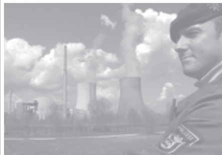
A German policeman stands guard in front of the Philippsburg nuclear power plant in an undated photo. German authorities are changing 150 locks at the power plant after its owner said they had lost keys to a security area, a ministry spokesman in the south western state of Baden-Wuerttemberg said on Monday.

Prosecutors have launched an investigation for theft.