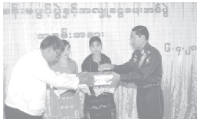
Lt-Gen Myint Swe of the Ministry of Defence accepts cash donation for Mibagonyi Home for the Aged in Twantay Township.