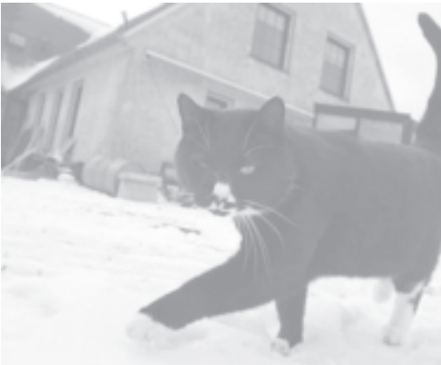
A cat walks on a farm in Seehof, Germany, on 2 March, 2006. Animal health experts called on 5 April, 2006 for new precautions against bird flu because cats, and possibly other mammals, can be infected and could spread the H5N1 virus. INTERNET

"And in this way we are no less charming than the young people," she said. —MNA/Xinhua