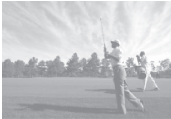
Masters golf tournament at the Augusta National Golf Club in Augusta, Georgia, on 5 April, 2006. Woods is a four-time Masters champion. Play in the tournament begins on Thursday.