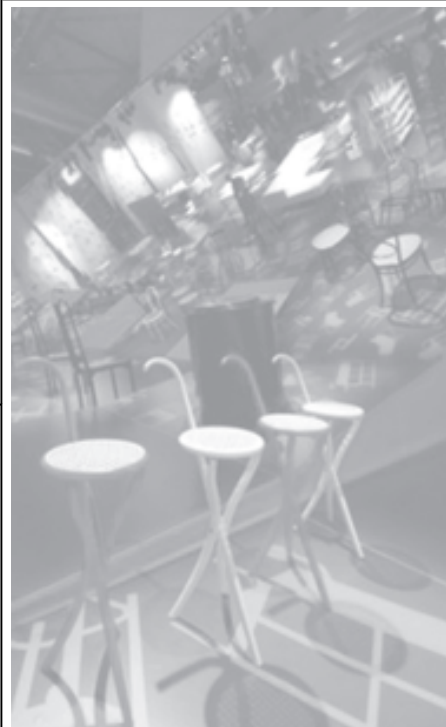
'Stocks walking stick seats' are shown at the Thonet stand, during the International Furniture and Design exhibition that was unveiled in Milan, Italy, on 5 April, 2006.