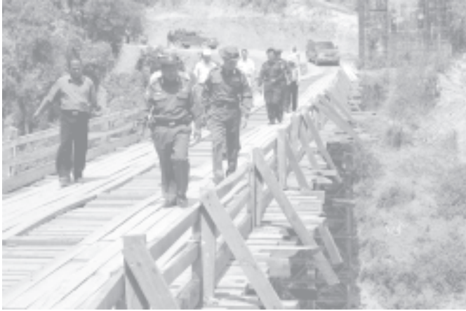
Lt-Gen Ye Myint inspects maintenance tasks at Tiyanzwep Bridge in Myitkyina Township. —MNA