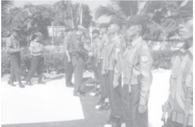
Commander Brig-Gen Hla Htay Win inspects members of Myanmar Police Force at Coco Island Township.

Next, the commander and the mayor and party arrived at Coco Island Police Station and met with policemen and their families and presented souvenirs to them. Afterwards, the commander and the mayor looked into measures for digging drink-