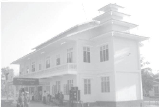
Mibagon hall in Mibagon Home for the Aged in Twantay Township. (News on page 16)

တန်ဖိုးရှိလှ လူငယ်ဘဝ မှူးယစ်ကင်းစင် ကျန်းမာမှု