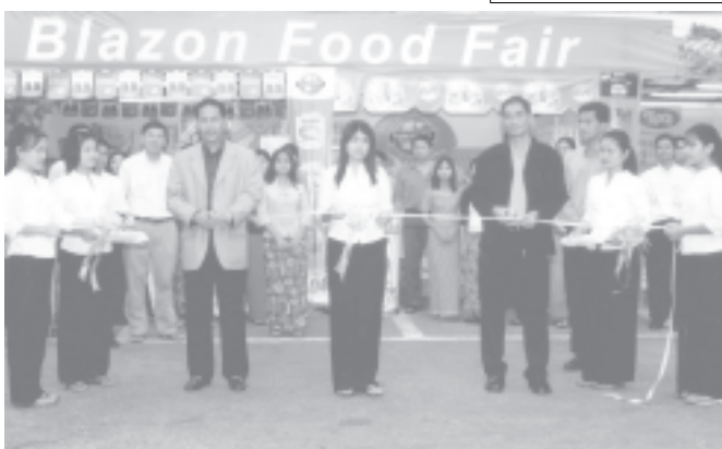
The opening ceremony of Blazon Food Fair in progress at its store.—MNA

and sauce, dairy products and a variety of soft drinks are being sold, it is learnt. — MNA