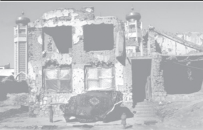
A group of women shake a carpet in front of their destroyed home at western Kabul, Afghanistan, on 5 April, 2006.