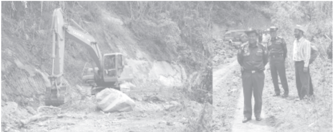
Lt-Gen Ye Myint views extended construction of the road at mile post No 73 in Dayukha Village of Sumprabum Township.

NAYPYIDAW, 6 April — State Peace and Development Council Member Lt-Gen Ye Myint of the Ministry of Defence, accompanied by Kachin State Peace and Development Council Chairman Northern Command Commander Maj-Gen Ohn Myint and departmental officials arrived at Tiyanzwet Village in Myitkyina Township on 4 April and cordially greeted local people.