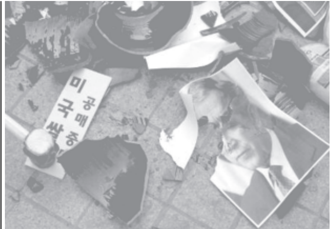
A farmer uses a hammer to smash a portrait of US President George W Bush during a protest against rice imports in Seoul on 5 April, 2006. The sign on the floor (L) reads, ‘Stop the public auction of rice from US’.