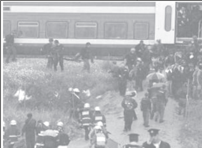
Israeli emergency rescue personnel take part in a drill simulating an attack on a passenger train in Tel Aviv on 5 April, 2006.—INTERNET

Budapest is safe up to a level of 10 metres, Mayor Gabor Demszky said, adding the threat remained high in the capital. “According to the latest estimates, the total damage will exceed 10 billion forints and it will probably not be more than 30 billion (137.8 million US dollars), but that is assuming no major dams bursting anywhere,” Gyurcsany said.—MNA/Reuters