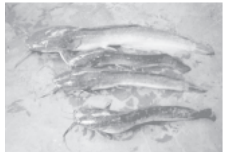
The photo shows African catfish farming in the country and import of which is prohibited.

YANGON, 6 April— Action will be taken against those who raise African catfish, said the Fisheries Department under the Ministry of Live-