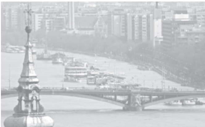
View of the flooded Danube River and Margaret bridge in centre of Budapest seen on 5 April, 2006.

The rainstorm attacked the district at around 17:30 pm on Monday, he said. Members of Cambodia’s Red Cross have rushed to the disaster area to provide relief to the victims, he said.