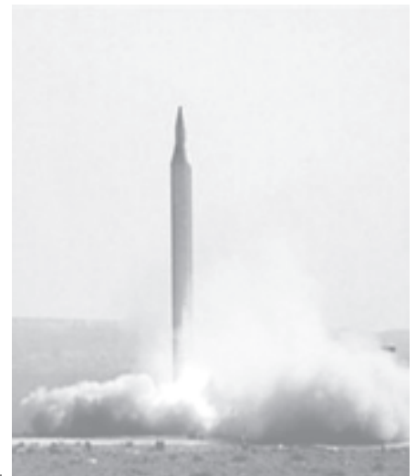
Photo released on 3 April, 2006 shows a test firing of a Fajr-3 missile fired by Iran in the Persian Gulf on 1 April, 2006.—INTERNET

On Tuesday, Safavi called for foreign forces to leave the region. The US 5th Fleet is based in Bahrain.—INTERNET