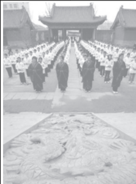
Chinese students, who have just reached the age of 15, attend a coming-of-age ceremony at a temple in Zhengzhou, capital of central China's Henan Province on 5 April, 2006.