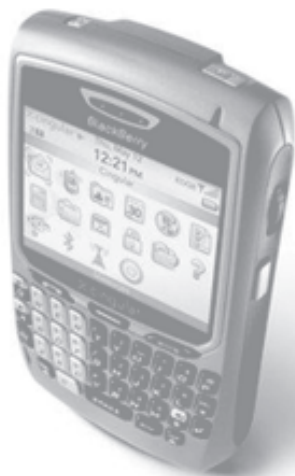
A BlackBerry 8700c is seen in an undated file photo. Research In Motion will put such Yahoo Inc Web offerings as search, e-mail, instant messaging, and news on its BlackBerry devices, and will start rolling out the service in 60 countries in about two weeks, the two companies said on 5 April, 2006.

The carnival will also be partnering with online auctioneer, eBay, by setting up bidding stations with broadband access throughout the event in which movie fans could bid for exclusive imported movie merchandise and tickets.