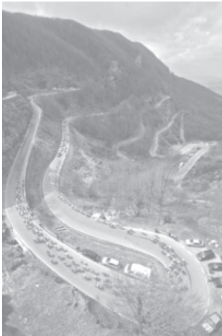
Riders climb Urbasa during the third stage of the Tour of the Basque Country cycling race near Alsasua on 5 April, 2006.