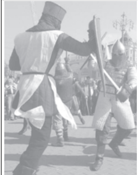
Men wearing knight costumes perform a sword fight during a street activity marking the anniversary of a historical Russian victory, in Moscow, on 5 April, 2006. INTERNET