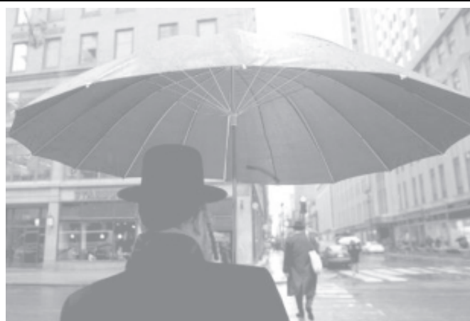
A man makes his way through a light snowfall in New York on 5 April, 2006. A mixture of rain and snow fell throughout the New York metropolitan area.