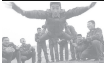
A Chinese paramilitary policeman performs martial arts for his companions during a training exercise in Xuzhou, east China's Jiangsu Province on 4 April, 2006.