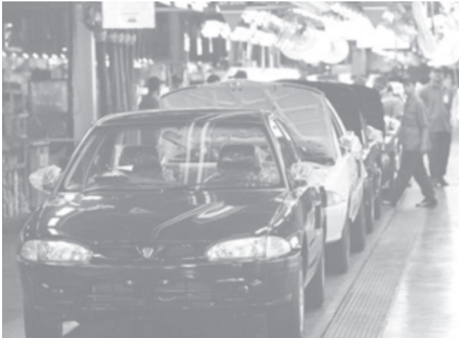
Workers work on production line of Proton car 'WIRA' at a Proton factory in Shah Alam, near Kuala Lumpur, Malaysia, on 5 April, 2006.