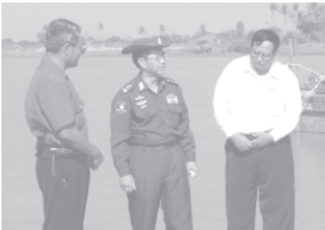
Lt-Gen Myint Swe inspects progress of Twantay Bridge Construction Project in Twantay.

YANGON, 6 April — Lt-Gen Myint Swe of the Ministry of Defence this morning unveiled the signboard of Mibagon Hall of Mibagon Home for the Aged in Twantay, attended the physic nut plants growing ceremony and inspected progress of Twantay Bridge project.