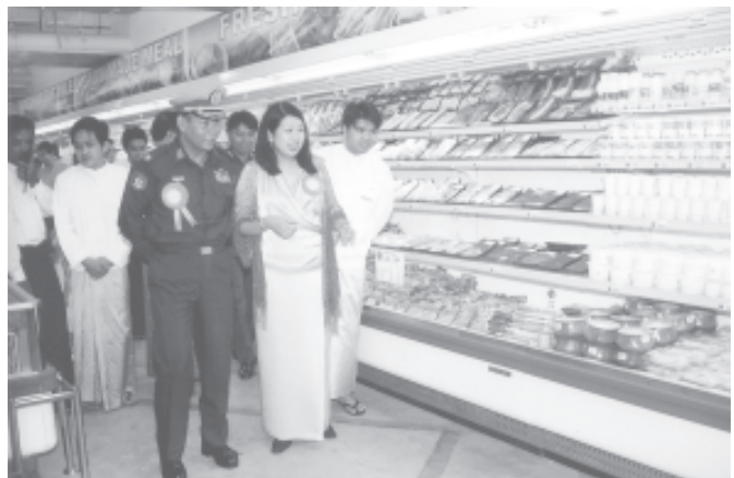
Mayor of Yangon Brig-Gen Aung Thein Lin views shops opened at North Point, Ocean Super Shopping Centre.