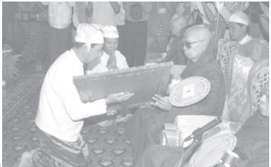
Vice-Senior General Maung Aye presents a religious title to a Sayadaw.