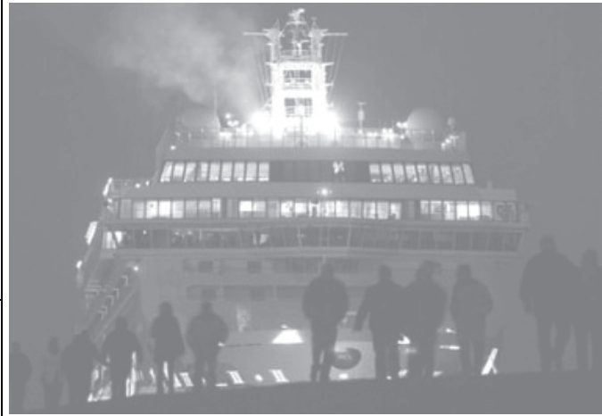
Spectators walk along the embankment of the river Ems to take a view of the new cruiser 'Pride of Hawaii' which makes its way down the river from the shipyard Meyer in Papenburg, northern Germany, towards the North-Sea, on 12 March, 2006. The cruiser of shipping company Norwegian Cruise Line, NCL, is over 294 meters long and over 32 meters wide.