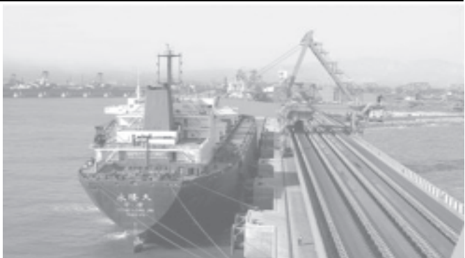
The initial joint project of stowing coals onto the exclusive coal-freight ship of Yonglongjiu is well underway, at the newly-built No 5 dock in Qinhuangdao port, north China's Hebei Province, on 11 March, 2006. The very first combined loading project marks the completion of the fifth phase construction project of the Qinhuangdao port for coal transport, a national key project with the designed annual transport capacity up to 50 million tons, poised to be put into full swing.