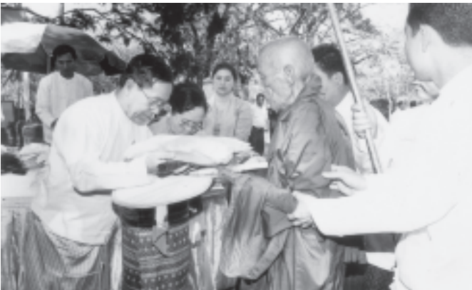
Prime Minister General Soe Win and wife Daw Than Than Nwe offer alms to a Sayadaw.