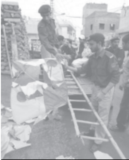
Pakistani police look at a broken kite during Basant festival in Lahore, on 12 March, 2006.