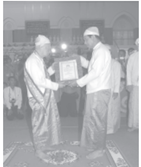
Vice-Chairman of SPDC Vice-Senior General Maung Aye confers title on a lay person.