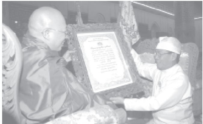
Prime Minister General Soe Win presents a religious title to a Sayadaw.

Prime Minister General Soe Win conferred Abhidaja Agga