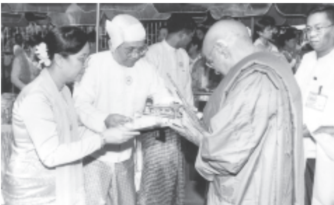
Secretary-1 Lt-Gen Thein Sein and wife Daw Khin Khin Win offer alms to a Sayadaw.