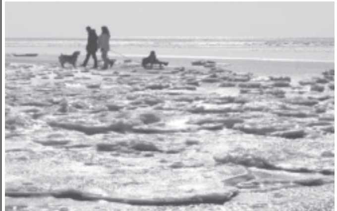
A couple pulls a child on a sledge as they stroll on the snow-covered mudflats of a national park on Germany's North Sea coast near St Peter-Ording, on 12 March, 2006.

United Nations agencies say 25 percent of Zimbabwe's 12 million people are now dependent on international food relief, even though the country was for years a major food exporter to the region.