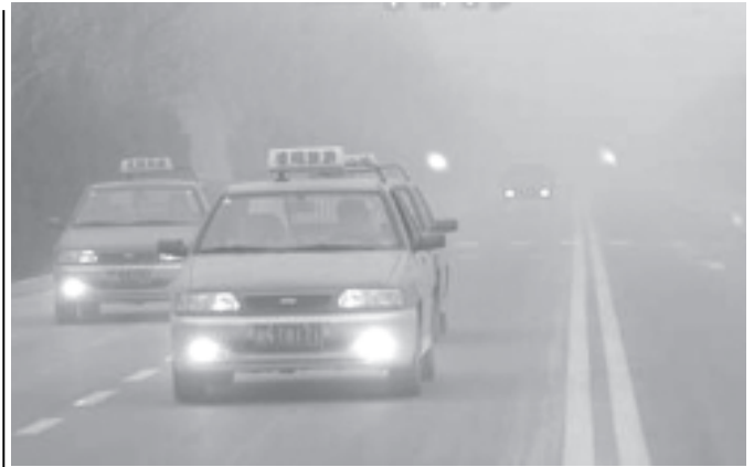
Cars run with lights on against a sand storm on a street in the town of Kuqa in Kuqa County, northwest China's Xinjiang Uygur Autonomous Region, on 12 March, 2006.

of the deputies has been improved as a result, said the official. In addition, TV media are allowed to do more live broadcasts on the plenary sessions of the NPC this year. China Central Television, China National Radio and China Radio International for the first time telecast and broadcast live the work report of the NPC Standing Committee, delivered by Wu Bangguo, chairman of the NPC Standing Committee, on Thursday. — MNA/Xinhua