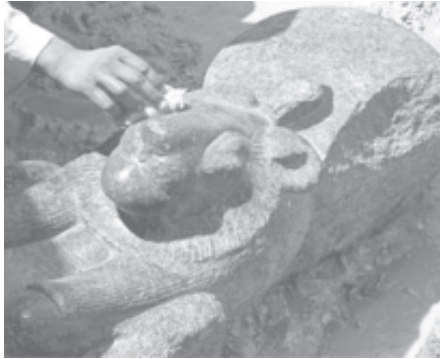
An Egyptian antiquities worker cleans a newly discovered 3,400-year-old statue in Luxor, Egypt, on 12 March, 2006.