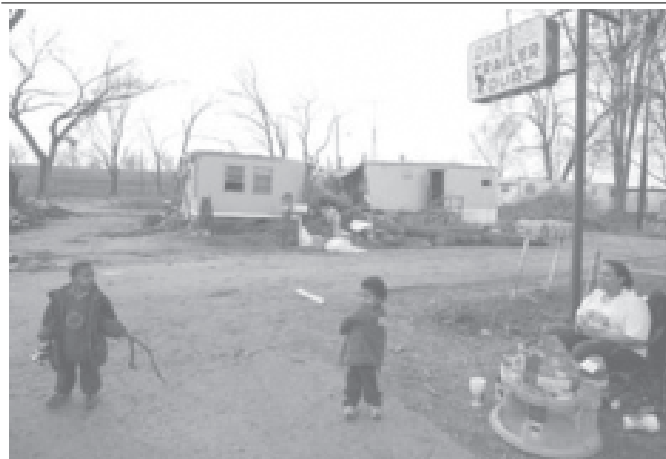
Two children play in the road of Dale's Trailer Court after a strong storm swept through the park damaging several homes on 12 March, 2006, in Lawrence, Kan. No one was injured during the storm but emergency management officials declared Douglas County a disaster after the storm hit Lawrence around 8 am.