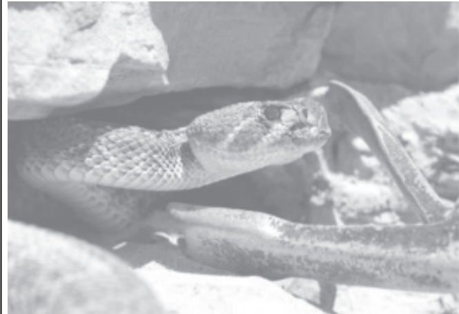
A snake hunter uses a snake stick to grab a snake as it comes out of its den in Sweetwater, Texas, on 11 March, 2006. Sweetwater is home to the world's largest Rattlesnake Round-up which started as a way for ranchers to rid the abundance of snakes that were threatening their livestock.

Drug trafficking by sea has been rampant recent years, as a wide application of radar system has made it hard to smuggle drug by land and air.