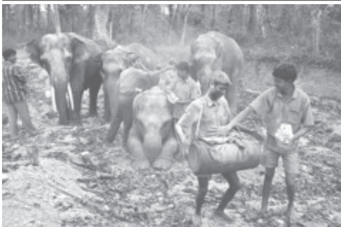
Indian men perform a traditional dance, in front of their elephants, during celebrations for Basanta Utsav or Spring Festival in Gourama National Park, 100 km (62 miles) from the northeastern Indian city of Siliguri on 13 March, 2006.

The excavators found a water reservoir, a hearth, a storage pit and some household accessories inside the pit-dwelling. They also unearthed an earlier dug-out road, leading to what seems to be a fortified town.— MNA/Xinhua