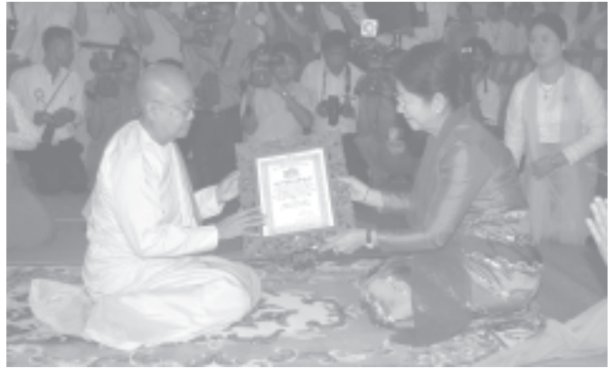
Daw Mya Mya San, wife of Vice-Senior General Maung Aye, confers title on a nun.