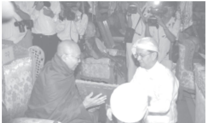
Secretary-1 Lt-Gen Thein Sein presents a religious title to a Sayadaw.