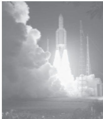
Ariane 5 ECA is launched from the European Space Station in Kourou, French Guiana, in this 11 March, 2006 picture made available by the European Spaceport.—INTERNET

KOUROU, 12 March—An Ariane-5 rocket launched two European telecommunications satellites into orbit from