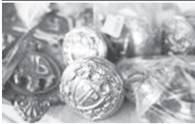
Plaza Hotel brass door knobs are shown during a Christies auction media preview on 10 March, 2006 in New York City. The sale is featuring over 350 lots with estimations in value from $50 - $18,000. —INTERENT

This telephone poll of a random sample of 1,885 New York State residents has a margin of error between 3 and 5 per cent. — MNA/Xinhua