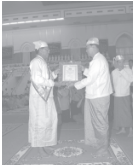
General Thura Shwe Mann confers title on a lay person.