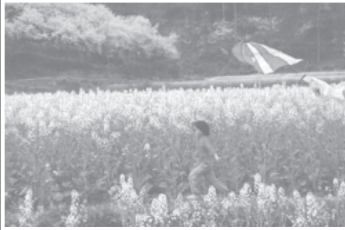
A girl flies a kite in the field of cole at Yinzhai village in Guiding County, southwest China's Guizhou Province, on 11 March, 2006.

That's when the banks believe new federal guidelines that require significantly increased monthly minimum payments will begin to hurt customers already struggling to pay bills.