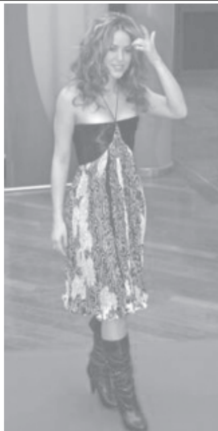
Colombian singer Shakira arrives on the red carpet for the "Echo Music Awards" ceremony in Berlin, on 12 March, 2006. The German Phonographic Academy honours artists from all over the world in 22 categories.