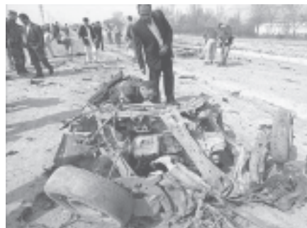
A soldier of the International Security Assistance Force (ISAF) inspects a damaged car at the site of a suicide car bombing in Kabul.