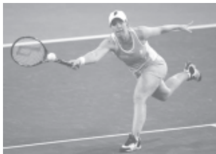
Lisa Raymond of USA reaches to return against Maria Sharapova of Russia during the second round match of Pacific Life Tennis Open in Indian Wells, Calif, on 12 March, 2006. Sharapova won, 6-4, 6-0.