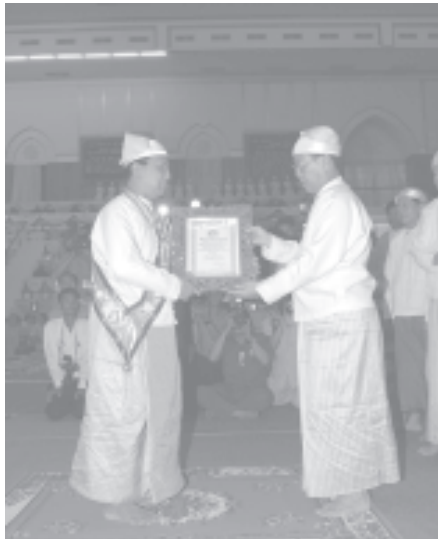
Prime Minister General Soe Win presents title to a lay person.