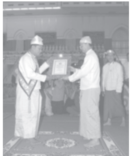
Secretary-1 Lt-Gen Thein Sein presents title to a lay person.

Afterwards, Prime Minister General Soe Win Conferred religious titles on U Than Tun at No 3-A, Kaba Aye Pagoda Road, Pyidawaye Yeiktha, No 7 Block in Yankin Township, U Shwe at No 37 Thayawady Street, Sayasan Block, Bahan Township, U Soe Han Lin at No 209, Bomyattun Street, No 9 Block in Botahtaung