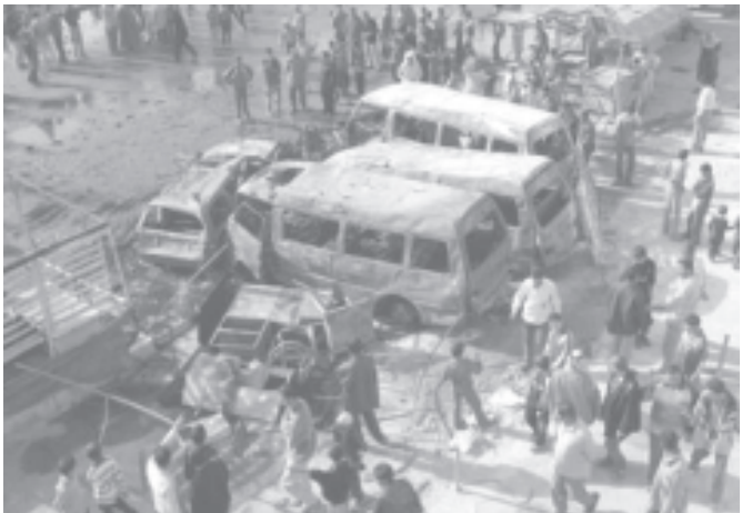
Iraqis gather at the scene of Sunday's bombing in Baghdad's Sad'r City, on 13 March, 2006.