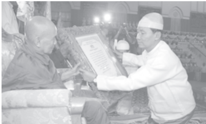
General Thura Shwe Mann presents a religious title to a Sayadaw.

Afterwards, Deputy Minister for Religious Affairs Brig-Gen Thura Aung Ko, Deputy Minister for Information Brig-Gen Aung Thein, Deputy Minister for Energy Brig-Gen Than