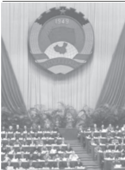
Delegates attend the closing session of the Chinese People's Political Consultative Conference at the Great Hall of the People in China's capital Beijing on 13 March, 2006.