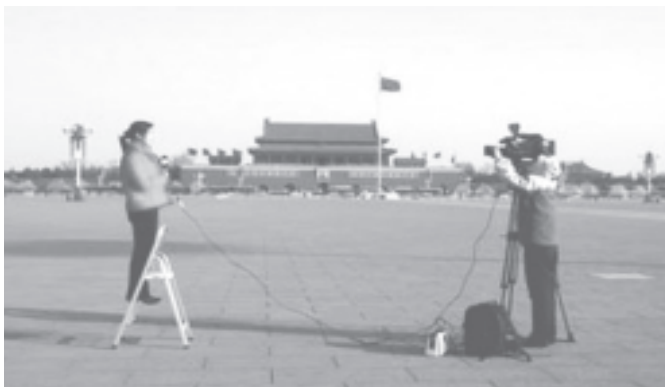
A television correspondent does a stand up in Tiananmen square as delegates to Chinese People's Political Consultative Conference attend the conclusion of the closing session of the CPPCC where they adopted a resolution to 'resolutely oppose and check 'Taiwan independence' secessionist forces and activities,' at the Great Hall of the People in Beijing, on 13 March, 2006. The 2,280-member Advisory body to China's legislature is meant to keep China's leaders in touch with what's really going on in the country's far-flung regions and various social and professional circles. Parliament is scheduled to conclude its session Tuesday.