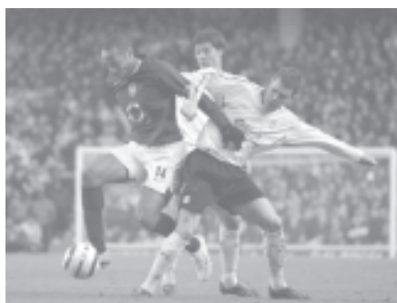
Arsenal's captain Thierry Henry, left, is challenged by Liverpool's Steve Finnan, right, and Xabi Alonso for the ball during their English Premier League soccer match at Highbury, London, on 12 March, 2006. Arsenal won 2-1.

Brazilian Nene atoned for his error when he sent an unstoppable long-range shot fizzing into the top corner midway through the first half.