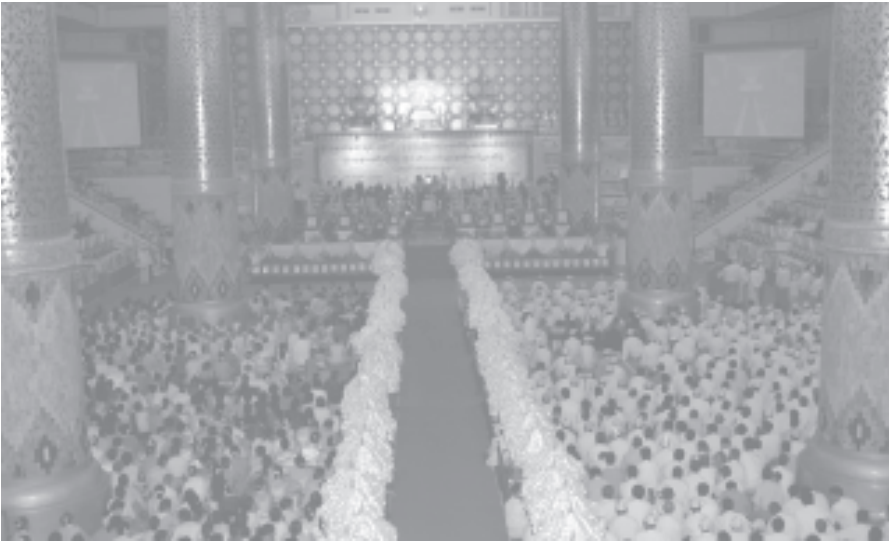
Religious titles offering ceremony in progress.