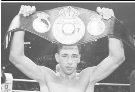
German boxer Felix Sturm shows the champion's belt after beating Maselino Masoe from New Zealand during their WBA Middleweight Champion fight on Saturday, 11 March, 2006 in Hamburg, northern Germany. Sturm won by decision of the scoring judges.