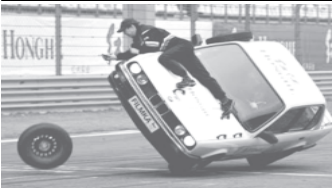
A Hollywood stunt actor dismounts a tire from a moving car at Shanghai International Circuit, on 12 March, 2006. The Hollywood stunt team started their tour of China and performed during the intermissions of the 2006 China Circuit Championship in Shanghai on Sunday.

"If any country or any government violates human rights and is a centre of corruption, it's the US Government," he said.