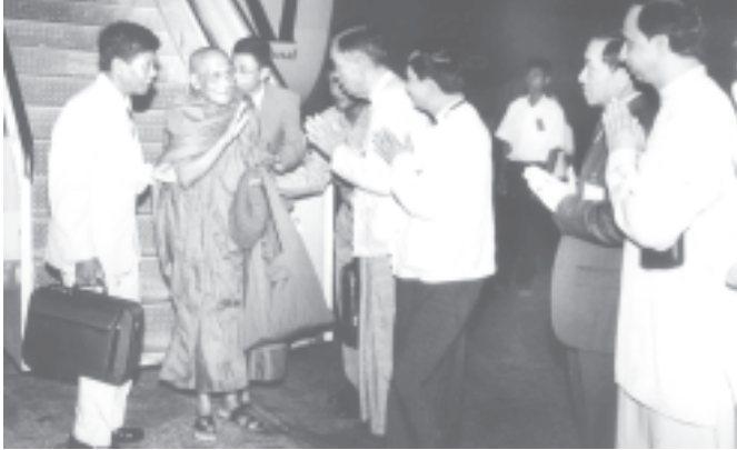
A religious title recipient Sayadaw from abroad being welcomed by officials at the airport.