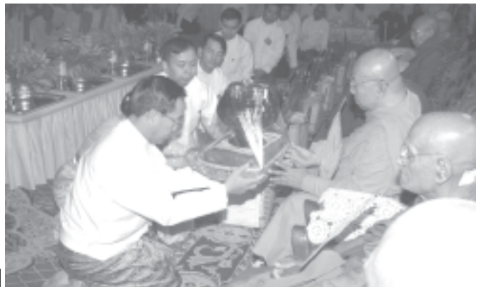
Prime Minister General Soe Win and wife Daw Than Than Nwe present offertories to a Sayadaw.