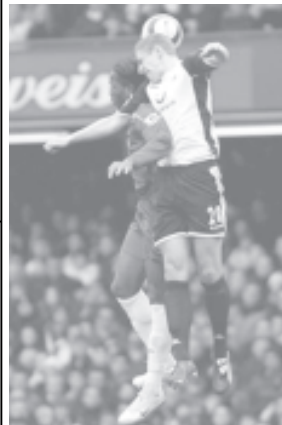
Chelsea's Didier Drogba, left, of Ivory Coast goes for a header with Tottenham Hotspur's Michael Dawson during their English Premier League soccer match at Stamford Bridge, London, on Saturday, 11 March, 2006. Chelsea won 2-1.

LONDON, 12 March—William Gallas, who struck a long-range shot in stoppage time to earn Chelsea a 2-1 win over Tottenham Hotspur on Saturday, said the victory helped to make amends for the team's midweek Champions League exit.