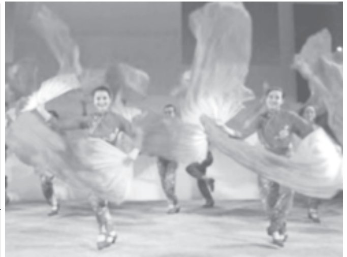
Chinese dancers perform at the opening ceremony of 2006 China-Japan tourism exchange year in Tokyo, capital of Japan, on 10 March, 2006.