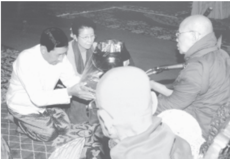
Vice-Senior General Maung Aye and wife Daw Mya Mya San offer alms to a Sayadaw.