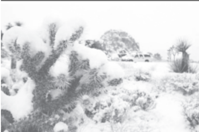
A US Forest Service vehicle drives past snow-covered cactus in Joshua Tree National Park, California, on 11 March, 2006. A late winter storm brought several inches of snow to parts of Southern California, due to a cold weather system that is pushing through the region.