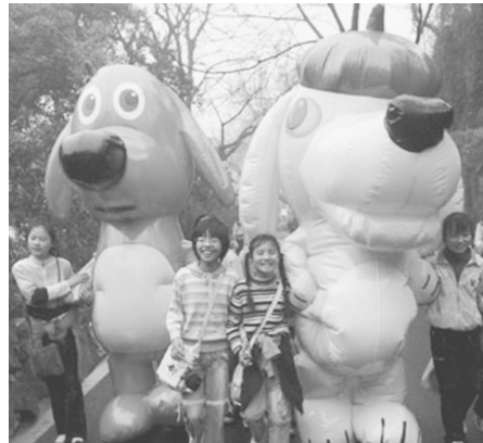
Cartoon dogs “Duo Duo” and “Dian Dian”, mascots of the Second China International Cartoon and Animation Festival, walk with girls at the West Lake in Hangzhou, capital of east China’s Zhejiang Province, on 11 March, 2006. The festival will be held on 28 April, in Hangzhou.