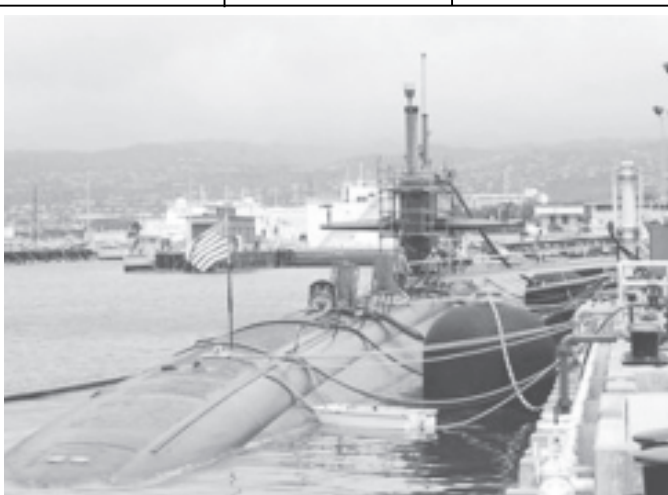
A US Navy submarine, is seen docked at Pearl Harbour, on 10 March, 2006 in Honolulu. By 2010, Pacific ports will be home to 60 percent of the nation's attack submarines.

The money in the fund would be continually replenished as contributions later poured in for each individual disaster. Some 11 million people face famine in the Horn of Africa due to a long drought in the region, with Kenya, Ethiopia and Somalia the hardest-hit countries.—MNA/Reuters