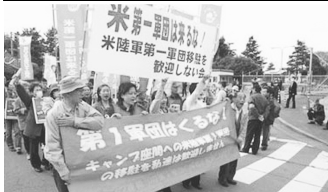
Shouting slogans against the US forces and carrying banners reading, ‘Stay Away, US (Army) 1st Corps,’ protesters stage a rally in front of the main gate of US Camp Zama, Tokyo’s outskirts, on 12 March, 2006.