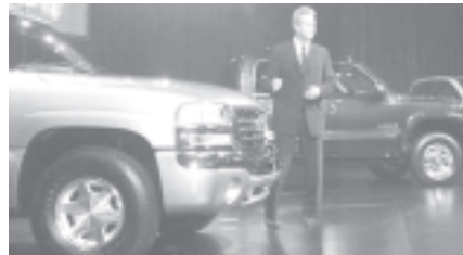
The GMC Sierra pickup truck (L) and the Chevrolet Silverado are introduced at the Chicago Auto Show.