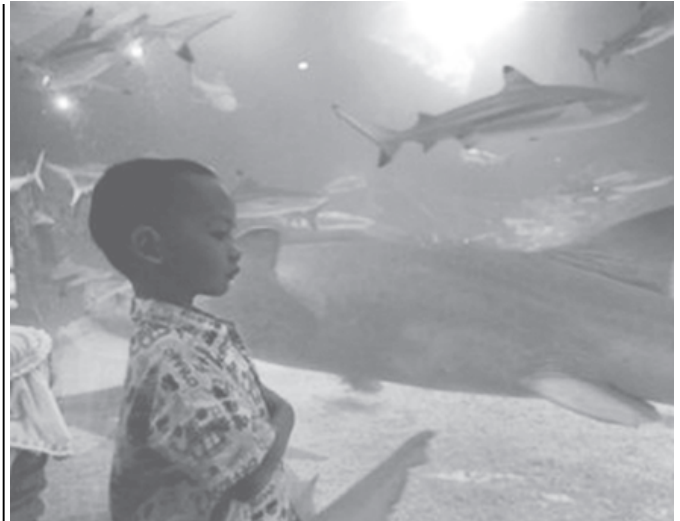
An Indonesian boy watches sharks in an aquarium at the Sea World in Jakarta, Indonesia, on 11 March, 2006.