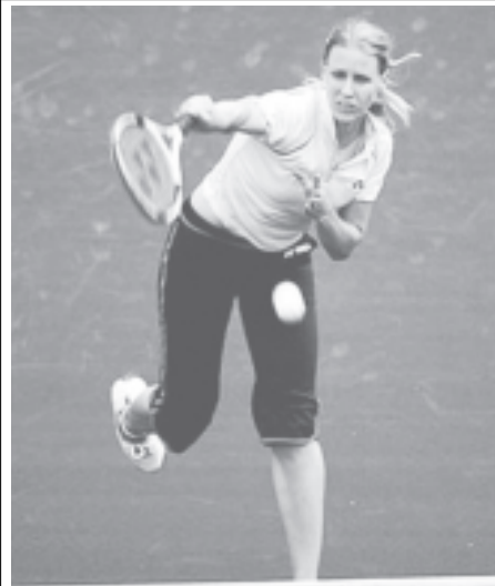
Elena Dementieva of Russia returns a shot to Anastasiya Yakimova of Belarus during the Pacific Life Open at the Indian Wells Tennis Garden in Indian Wells, California. Dementieva won 6-4, 3-6, 6-3.