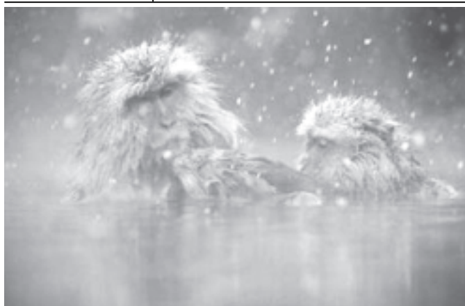
Japanese monkeys bathe in a hot spring in a snow-covered valley in Yamanouchi town, central Japan, on 12 March, 2006.