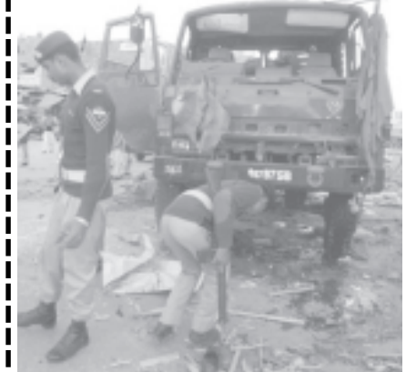
A truck carrying a marriage party hit a landmine in Pakistan’s restive southwestern province of Baluchistan, killing 26 people and injuring seven, a provincial official said.—INTERNET

There has been no evidence or claim of any cooperation between the al-Qaeda-linked Islamist rebels and the Baluch nationalists, analysts say.— MNA/Reuters