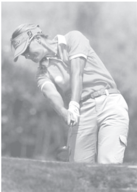
Silvia Cavalleri, of Italy, tees off on the fourth hole during the second round of golf's LPGA MasterCard Classic, on Saturday, 11 March, 2006, in Huixquilucan, Mexico. — INTERNET

The pageant also offered such titles as Best Evening Gown, Best Hair, Best National Costume, Face of Net, Personality, Platinum Model, Photographer, Press and Team Model. — MNA/Xinhua