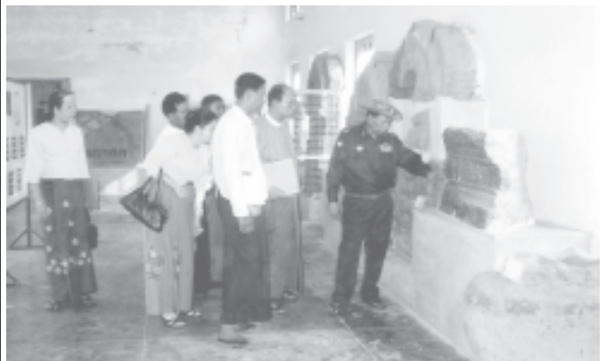
Minister for Culture Maj-Gen Kyi Aung visits Sari Kesttra Archaeological Museum in Pyay. — CULTURE