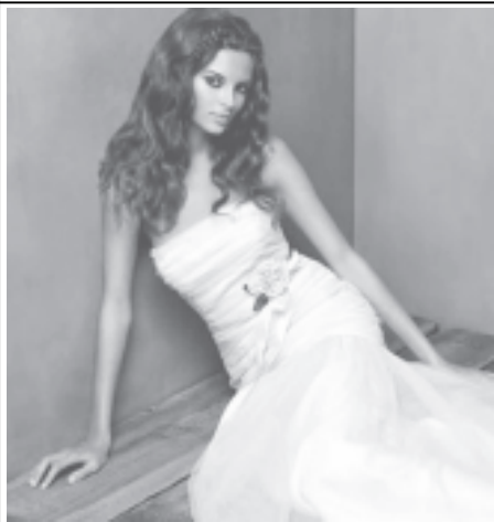
Lazaro's 2006 spring collection of bridesmaid dress (2).