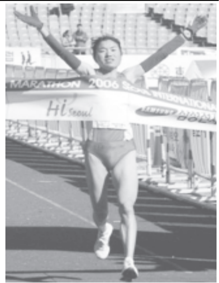
Zhou Chun-xiu from China raises her arms as she crosses the finish line in the women's race of the Seoul International Marathon at Olympic Stadium in Seoul, on 12 March, 2006. Zhou won the race in time of 2 hours, 19 minutes, 51 seconds.