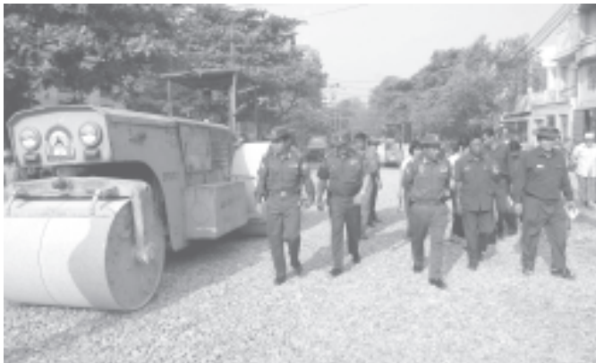
Lt-Gen Ye Myint inspects paving of road in Mandalay.—MNA

a supplementary report. Lt-Gen Ye Myint gave instructions on worksite safety and fire prevention measures. He inspected laying of gravel on Taungthaman Lake ring Road, paving of roads Chanmyathazi Township.—MNA