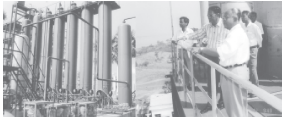
Minister U Aung Thuang inspects progress in installation of machines at Chemicals Factory (Hydrogen Peroxide) (Chauk) Project. — INDUSTRY-1

YANGON, 12 March —Minister for Industry-1 U Aung Thuang, accompanied by Managing Director U Nyunt Aung of Myanma Paper and Chemicals Industries, inspected construction of Chemicals Factory (Hydrogen Peroxide) (Chauk) Project in Chauk Township yesterday.