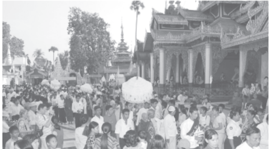
The rice offering ceremony of 2549th Buddha Pujaniya of Shwedagon Pagoda in progress.

Member of the Pagoda Board of Trustees, over 60 religious associations, and wellwishers offered rice and alms worth K 18 million to the Sayadaws and nuns.