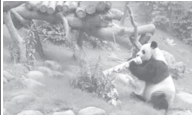
Giant panda An An plays with a "puzzle feeder" in the Ocean Park in Hong Kong, south China, on 9 March, 2006. The two-foot feeder, designed by university students in Hong Kong, is made from a plastic pipe with holes and a painted surface, in a bid to keep pandas healthy within zoological facilities.