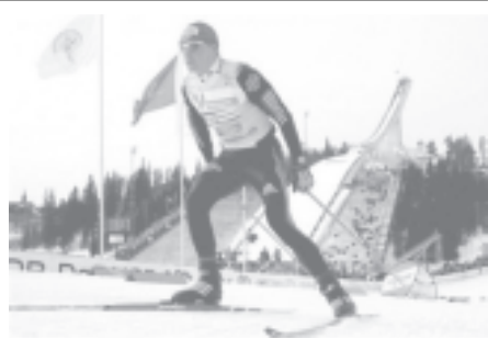
Germany's World Cup leader Tobias Angerer on his way during the 50 km Cross Country skiing event in Holmenkollen, Oslo, on Saturday 11 March, 2006.

Wolfsburg, Peru striker Paolo Guerrero hitting the back of the net after 57 seconds, only to be ruled offside.