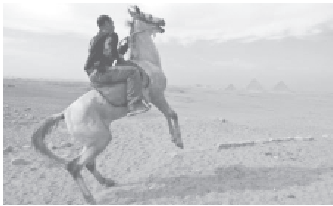
A man rides a horse near the pyramids in Cairo on 11 March, 2006.