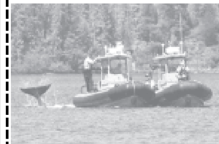
Luna the Orca Whale flips his tail behind a Canadian Department of Fisheries and Oceans boat of Bligh Island on the west coast of Vancouver Island.