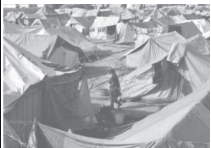
A Kashmiri earthquake survivor walks through the University Ground refugee camp in the Kashmiri earthquake-devastated city of Muzaffarabad in Pakistan-administered Kashmir on 12 March, 2006.—INTERNET

The official said all six people on board the executive jet were killed when the plane disintegrated soon after leaving the runway at about 3.30 pm local time (1930 GMT). — MNA/Reuters