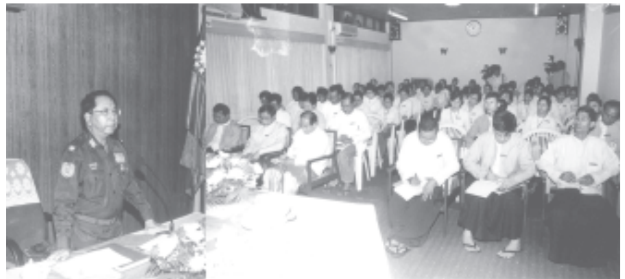
Minister for Information Brig-Gen Kyaw Hsan meets with employees of Press Scrutiny and Registration Division. — MNA