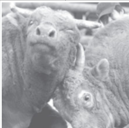
Urami, right, and Mupae, both from South Korea, wreathe in the annual bullfighting festival in Cheongdo, southeast of Seoul, South Korea, on 12 March, 2006.