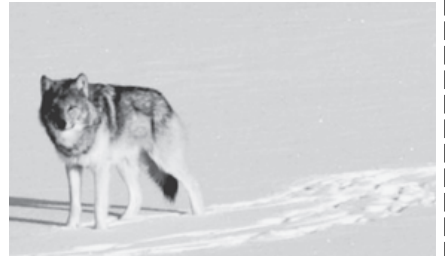
In this photo released by Michigan Technological University, a gray wolf is shown on Isle Royale National Park in northern Michigan.