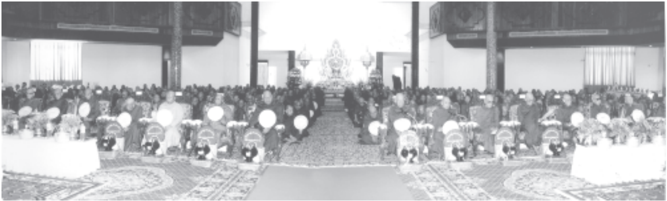
State Ovadaçariya Sayadaws, members of the State Sangha Maha Nayaka Committee and State Central Working Committee of the Sangha, and religious title recipient Sayadaws—MNA