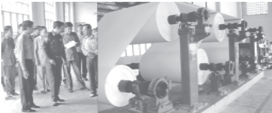
Minister Maj-Gen Htay Oo inspects paper mill in Maubin.