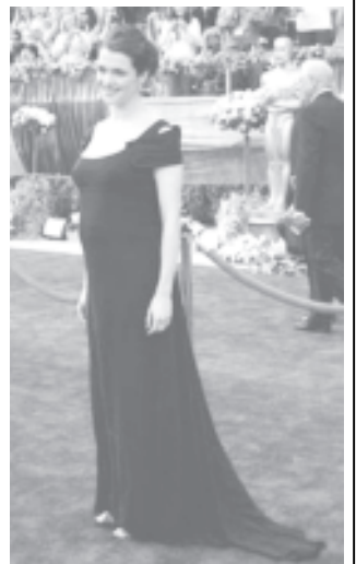
British actress Rachel Weisz, nominated for an Oscar for best actress in a supporting role for her work in 'The Constant Gardener,' arrives for the 78th Academy Awards on Sunday, 5 March, 2006, in Los Angeles. Weisz, who is seven months pregnant, is the face of Burberry's ad campaign for the new fragrance London. The ads were shot last fall.

pregnancy, but, so far, there's nothing that's a complete turnoff. — Internet