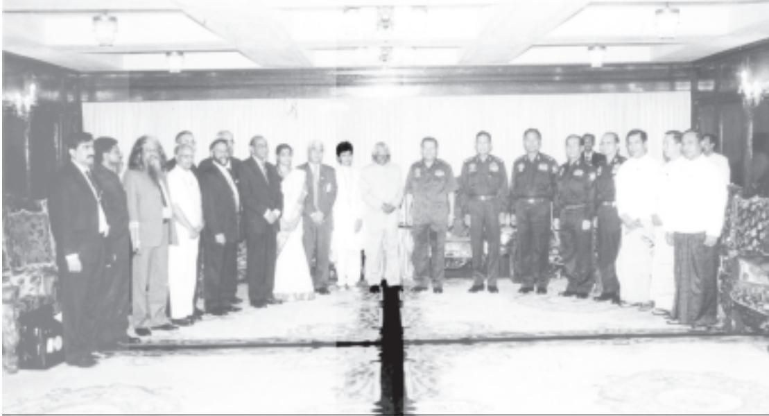
Senior General Than Shwe and party and Indian President Dr APJ Abdul Kalam and party pose for a documentary photo. (News on page 1)