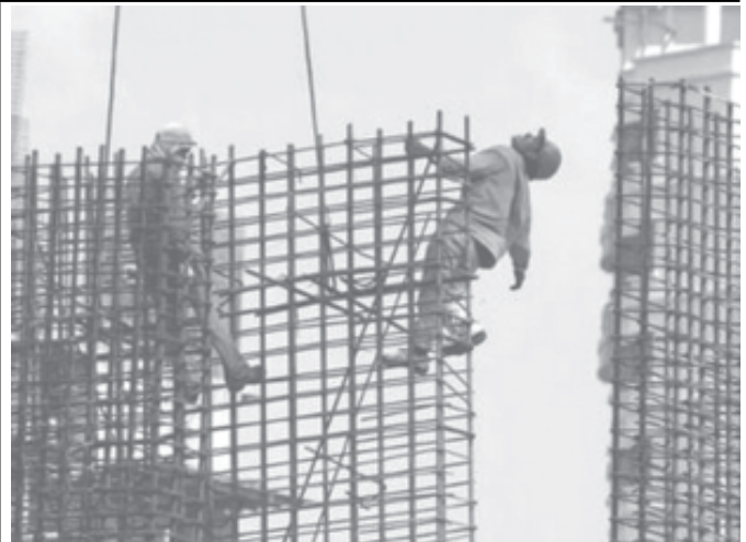
Indonesian workers stand on steel bars at a construction site in Jakarta, on 8 March, 2006.