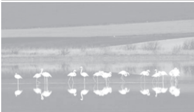
Flamingos are seen in Fuente de Piedra natural reserve in Fuente de Piedra, southern Spain on 6 March, 2006.