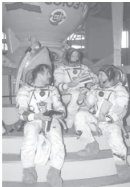
Astronauts Marcos Pontes of Brazil (R) and Jeffrey Williams of the US (C) and Russian cosmonaut Pavel Vinogradov sit in front of a training module of the Soyuz space capsule in the Star City space centre near Moscow, on 7 March, 2006.