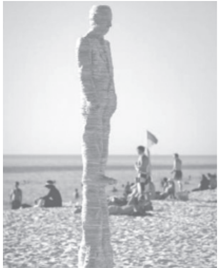
Beachgoers relax behind a sculpture by Australian artist Richie Kuhaup titled "Straight Up and Down" at Perth's Cottesloe Beach, on 8 March, 2006, which is part of the Sculpture by the Sea Exhibition.