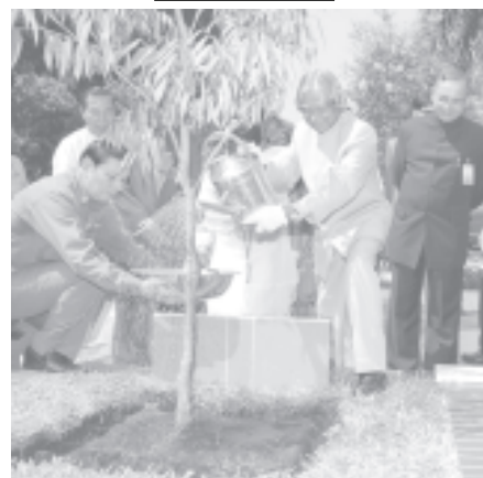
The Indian President pours water on a Gangaw tree in People's Park planted to mark his visit.