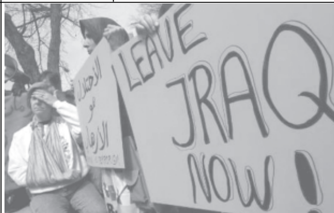
Anti-war activist Cindy Sheehan attends a peace march as part of International Women's Day in Washington, on 8 March, 2006. The protesters collected over 100,000 signatures calling on the withdrawal of all foreign troops and fighters from Iraq.