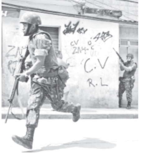
A Brazilian Army soldier runs during an operation to search for weapons at the Mangueira slum in Rio de Janeiro, on 8 March, 2006.