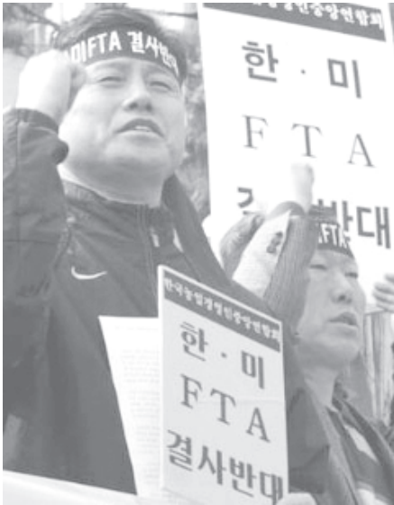
South Korean protesters shout slogans at a rally against the free trade agreement (FTA) talks in Seoul on 6 March, 2006. South Korea started on Monday its first preparatory talks on a free trade agreement deal with the United States, local media reported. The slogan on the headband and placard read, 'Oppose the FTA talks between South Korea and the United States to the death'.