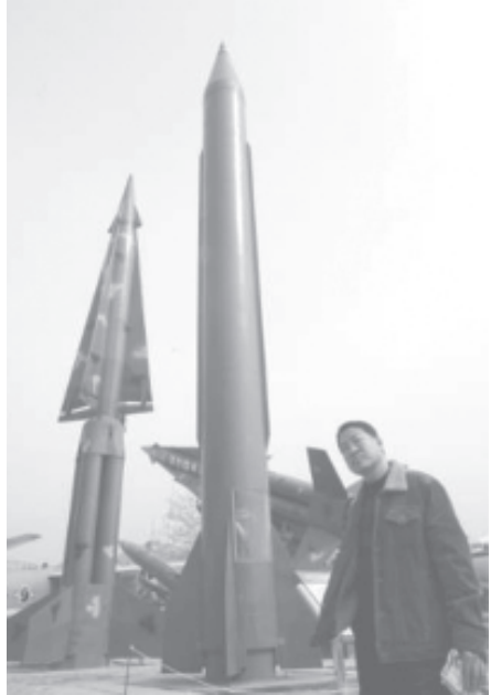
A South Korean walks past a model of a Scud-B missile (R) and a model of a Nike missile at a war museum in Seoul, on 9 May, 2006. INTERNET