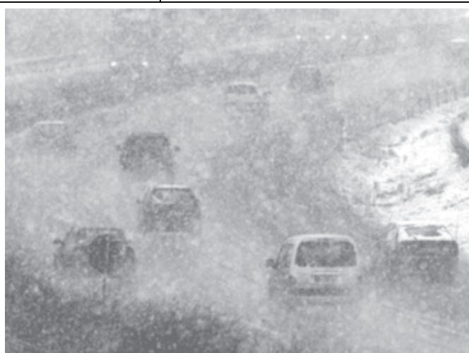
Cars drive through the snow on a highway in Frankfurt, central Germany, on 8 March, 2006 after heavy snowfalls started again in southern Germany.

The attackers fled the scene in their cars, leaving the victims stained in blood in their police vehicles, he added. —MNA/Xinhua