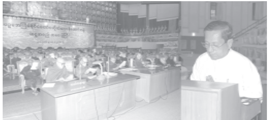
Minister Brig-Gen Thura Myint Maung supplicates on religious affairs.