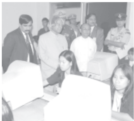
The Indian President visits Myanmar Info-Tech.