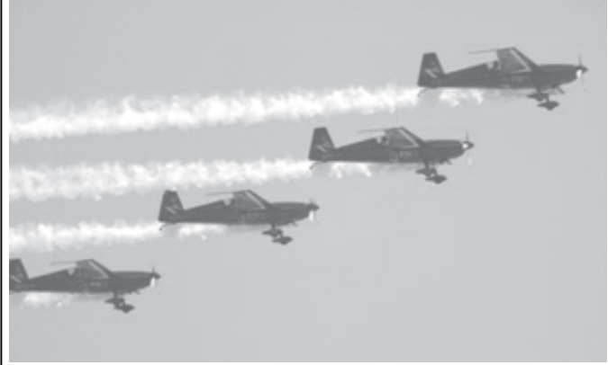
An aerial acrobatic team performs in the Air Show & Aviation Expo held in Egypt's Red Sea resort Sharm el Sheikh, on 8 March, 2006. More than 50 aviation enterprises including Boeing and Airbus took part in the event.