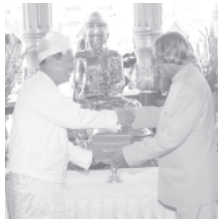
Indian President Dr APJ Abdul Kalam donates cash to the Shwedagon Pagoda funds through Minister Brig-Gen Thura Myint Maung.

At 3.45 pm, the Indian guests arrived at Myanmar Info-Tech Building in Hline Township where they were welcomed by Minister for