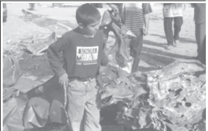
An Iraqi boy holds a debris from the wreckage of a vehicle used as a car bomb after an attack in Baghdad, on 8 March, 2006. Six civilians were wounded in the attack targeting a police patrol, police said.