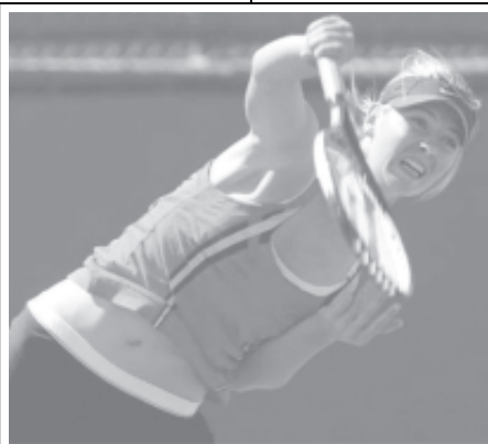
Third seed Maria Sharapova of Russia serves during a practice session at the Pacific Life Open in Indian Wells, California, on 8 March, 2006.