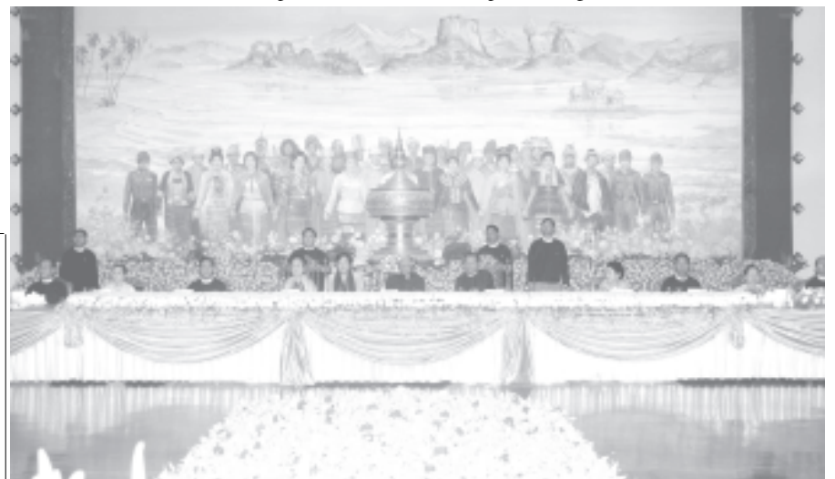
Senior General Than Shwe and wife Daw Kyaing Kyaing host a dinner in honour of the Indian goodwill delegation led by Indian President Dr APJ Abdul Kalam.

Later, Indian President Dr APJ Abdul Kalam presented gifts to the artistes.