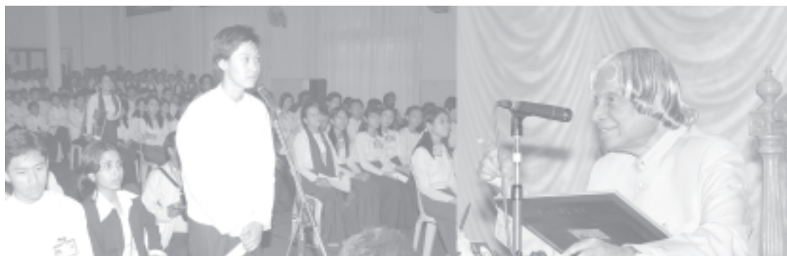
The Indian President replies to the questions asked by school boys and girls at Dagon Township No 1 BEHS.