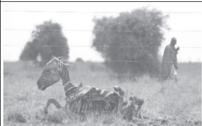
A Maasai man passes near a zebra carcass near Isinya in Kenya, on 7 March, 2006. Hundreds of people and tens of thousands of livestock have died from hunger and thirst across a vast region in east Africa, encompassing some of Africa's poorest and most arid zones.