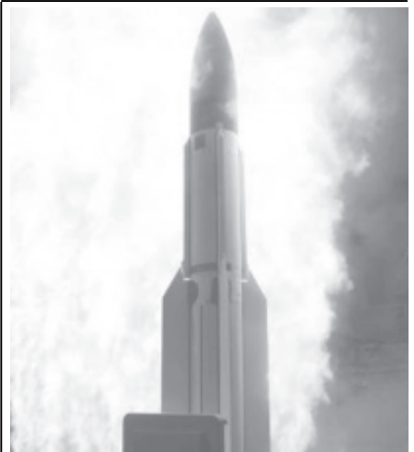
A Standard Missile — 3 (SM)—is launched from the USS Lake Erie (CG 70) in a Missile Defence Agency and Japan Defence Agency joint test in the Pacific in this photo released by the US Defence Department, on 8 March, 2006.