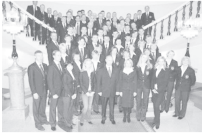
Russian President Vladimir Putin, front centre, and members of the Russian Olympic team pose in the Kremlin in Moscow, on 6 March, 2006. President Putin said at a meeting with Russian athletes who took part in the Olympic Games in Turin, that each of Russia's Olympic medalists will be presented with a Toyota car.

The Vietnamese Government has recently adopted four projects on combating trafficking of children and women in the 2005-2010 period, which focus on four areas, namely strengthening propaganda and education on preventing children and women trafficking in the community, intensifying fights against human trafficking, building up legal documents on the issue, and giving stronger support to victims. — MNA/Xinhua