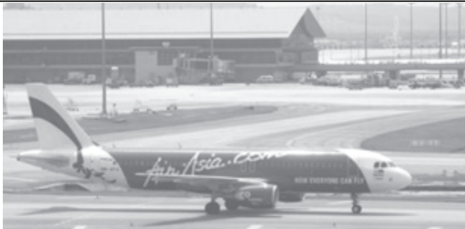
An aircraft from Malaysia's budget carrier, AirAsia, taxis at Kuala Lumpur International Airport in Sepang, outside Kuala Lumpur, Malaysia, on 9 March, 2006. Malaysia said on Wednesday its low-cost budget terminal, Asia's first, would begin operations in two weeks, just days before neighbouring Singapore is scheduled to open its own low-cost terminal.