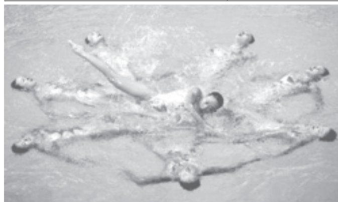
China's Synchronise Swimming team perform during the Team Free Routine in the Synchronise Swimming competition, on 8 March, 2006 in Singapore during the 7th Milo Asia Swimming Championships. China won the competition beating teams from Malaysia and Singapore who came in second and third respectively.