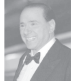
PM Silvio Berlusconi of Italy.

"When someone gave me a camera, I used it to take pictures at funerals, weddings and I took portraits," he added in an interview with northern Italian