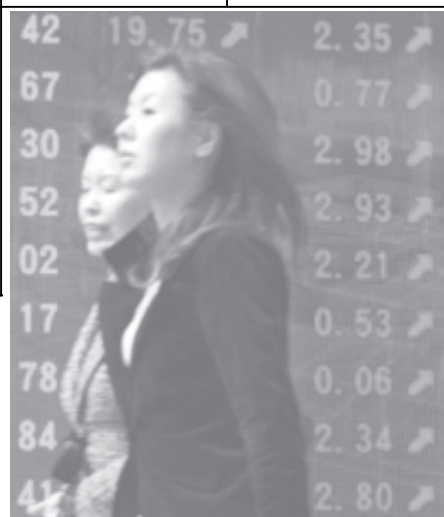
Japanese walk past a stock quotation board in Tokyo, on 9 March, 2006. The Nikkei share average climbed 2.23 percent on Thursday morning as investors bet the Bank of Japan was likely to scrap its unprecedented ultra-loose monetary policy later in the day, putting an end to weeks of market uncertainty.