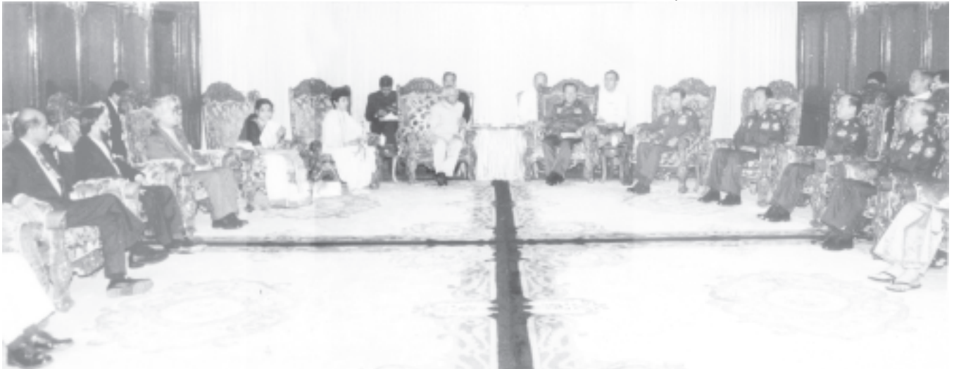
Chairman of the State Peace and Development Council Senior General Than Shwe receives Indian President Dr APJ Abdul Kalam at Pyithu Hluttaw Building.

After exchanging the notes, the signing ceremony came to a close.