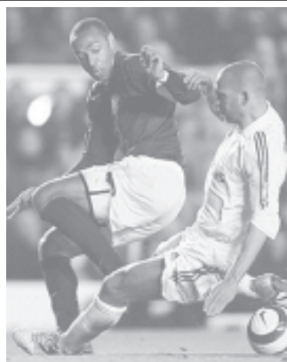
Arsenal's Thierry Henry (L) is challenged by Real Madrid's Raul Bravo in their Champions League round of 16 second leg match in London. Arsenal's goalless draw completed a 1-0 aggregate victory over Real Madrid. Arsenal boss Arsene Wenger believes his young Gunners team has the potential to be a great side.