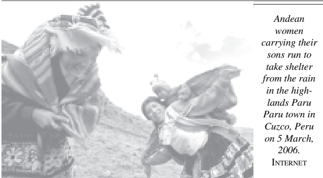
Andean women carrying their sons run to take shelter from the rain in the highlands Paru Paru town in Cuzco, Peru on 5 March, 2006.

Sheikh Ahmad also said that some 10 to 13 billion barrels of light crude reserves have been discovered in the same areas. — MNA/Xinhua