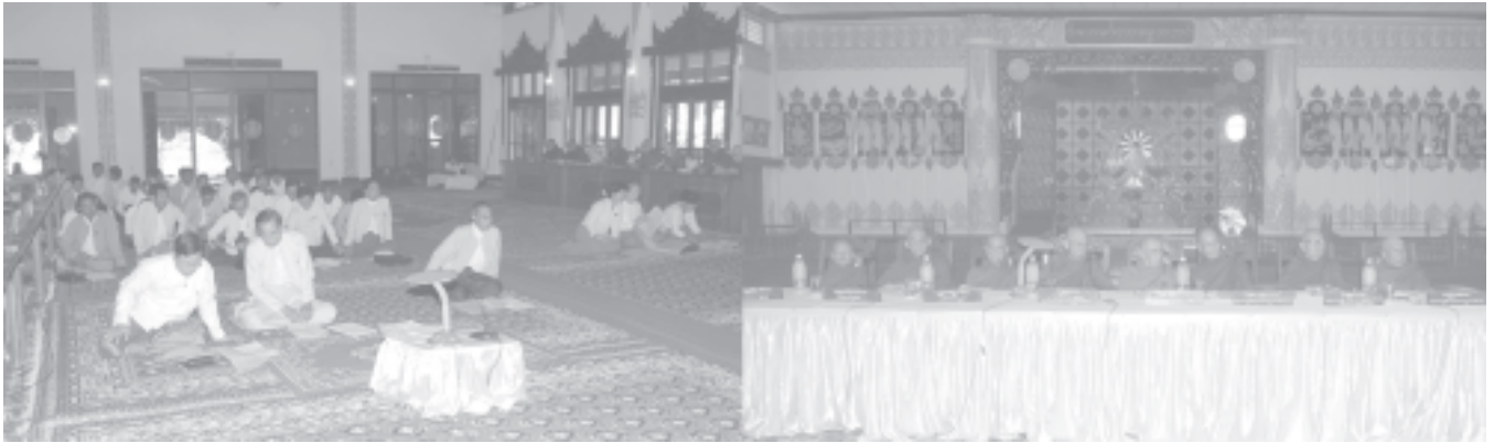
The second day session of the 16th plenary meeting of fifth 47-member SSMNC in progress.