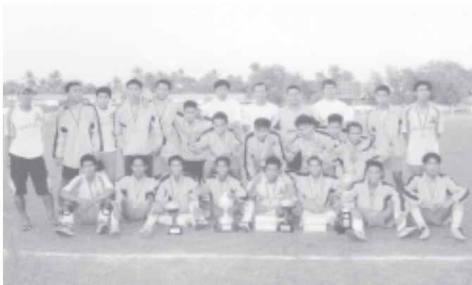
Champions First Eleven team seen with the trophy.

YANGON, 7 March — First Eleven grabbed a championship trophy after defeating Lunpyan with a 3-2 in the final of Junior Knockout Soccer Tournament for 2005-2006 in Padetha Sports Grounds at 3.30 pm today.