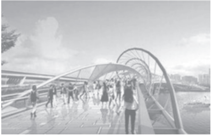
An artist's impression released on 6 March, 2006 shows a new bridge that will form a link with a massive new tourist development on reclaimed land in Singapore.