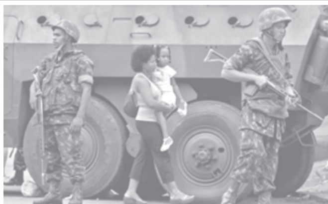
A woman and her daughter walk past armoured vehicle during an operation to search for weapons at the Grotta slum in Rio de Janeiro, Brazil on 5 March, 2006.