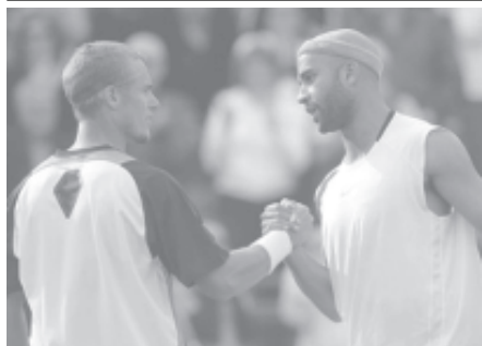
James Blake, right, shakes hands with Lleyton Hewitt, left, of Australia, after their final match of Tennis Channel Open tennis tournament in Las Vegas on 5 March, 2006. Blake won the final match, 7-5, 2-6, 6-3.