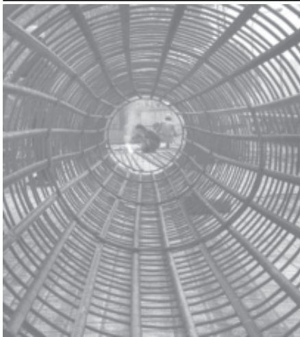
A Chinese worker welds steel rebar at a construction site in Nanjing, capital of east China's Jiangsu Province on 6 March, 2006.

BELING, 6 March — China has launched a pilot campaign to tackle major environmental problems in its vast rural areas, according to the State Environmental Protection Administration of China.