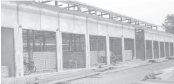
Lt-Gen Ye Myint inspects the Myoma Market Project in Kanbalu. — MNA