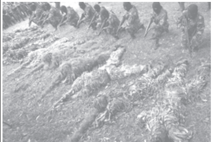
Venezuelan Army snipers draped in foliage exercise at a remote military base on the outskirts of Caracas in Macarao on 4 March, 2006.