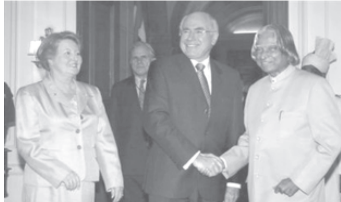
Indian Prime Minister Manmohan Singh, right, and Australian Prime Minister John Howard shake hands before a meeting in New Delhi, India, on 6 March, 2006.