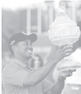
Tiger Woods holds the trophy after winning the Ford Championship at Doral golf tournament for the second consecutive year in Doral, Fla on 5 March, 2006.—INTERNET

England last faced the Netherlands at Villa Park in February 2005 and historically The Three Lions have the edge over the men from the Netherlands, boasting a 5-4 lead in the 16 games that the sides have contested to date. —MNA/Xinhua