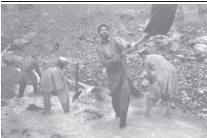
Kashmiri men work on the road to Neelum Valley, some 25 km (15 miles) north of the earthquake-devastated city of Muzaffarabad in Pakistan-administered Kashmir on 6 March, 2006. —INTERNET

According to the respected www.top500.org website, which provides a ranking of supercomputers, the Juelich-based machine beats the current holder of the most powerful computer in Europe, a machine in Barcelona.—Internet