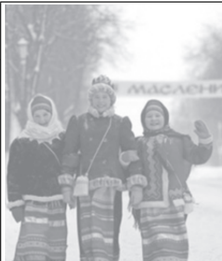
Wearing traditional Russian costumes girls walk in the ancient Russian city of Suzdal, about 200 km (124 miles) east of Moscow, on 5 March, 2006, during a traditional carnival marking the end of Pancake week or Maslentsa ('butter' in Russian).