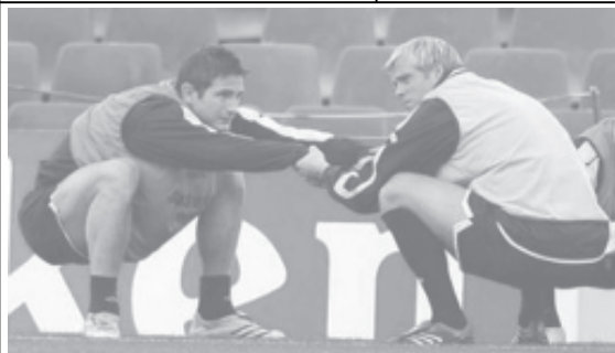
Chelsea's Frank Lampard (L) stretches with Eidur Gudjohnson during a training session at the Nou Camp stadium, Barcelona on 6 March, 2006.

"The case will be heard by a disciplinary commission on Tuesday." —MNA/Xinhua