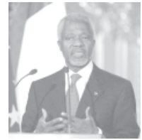
Mr Kofi Annan

YANGON, 8 March — The Following is UN Secretary-General Kofi Annan's message on International Women's Day, today: