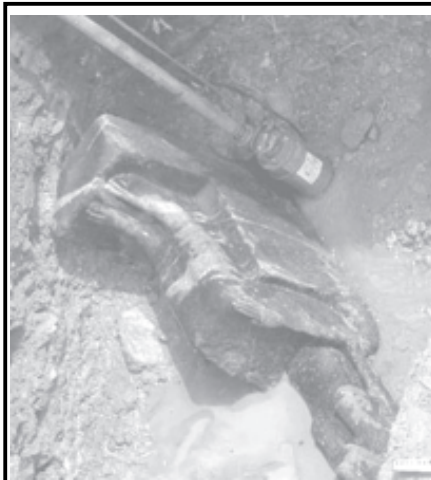
An undated photo of an ancient Pharaonic statue in a newly discovered pit in Luxor, Egypt. Egyptologists have discovered 3,400-year-old statues depicting the lion-headed goddess Sekhmet, Egypt's Supreme Council of Antiquities said on 6 March, 2006.