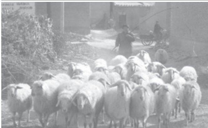
A Chinese farmer shepherds sheep in the suburbs of Langfang, northern China's Hebei Province on 6 March, 2006.—INTERNET

Statistics showed that at least 84 multi-baby cases were registered between 2002 and 2005 among affluent citizens in Shanghai, China's commercial hub. And there was a growing trend of the cases. In Shenyang, capital of Northeast China's Liaoning Province, 76 wealthy people were punished for having extra babies in 2000.—MNA/Xinhua