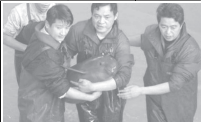
Staff of Wuhan Baiji Dolphin Aquarium hold an eight-month-old finless porpoise before doing a physical examination in Central China's Hubei Province on 6 March, 2006. This finless porpoise is up to 111cm long, about 40cm longer than when it was born, and weighs 32kg.