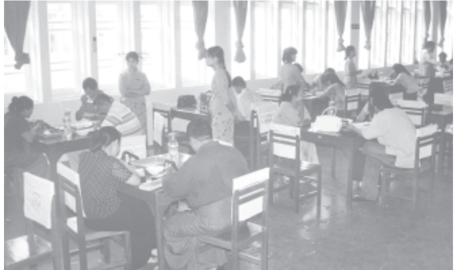
Gem merchants examining lots of pearls at the 20th Pearl Sale (2006).