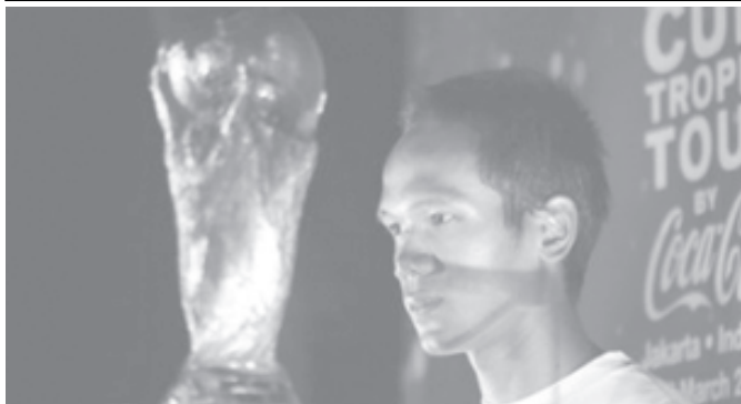
An Indonesian man poses for a photo in front of the legendary World Cup trophy on 6 March, 2006 in Jakarta, Indonesia.