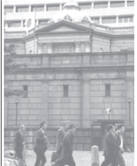
A group of Japanese businessmen walk by the Bank of Japan headquarters in Tokyo on 6 March, 2006.