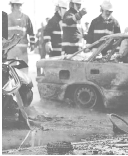
An unexploded bomb lies on the ground after a car bomb attack in Baghdad on 6 March, 2006.