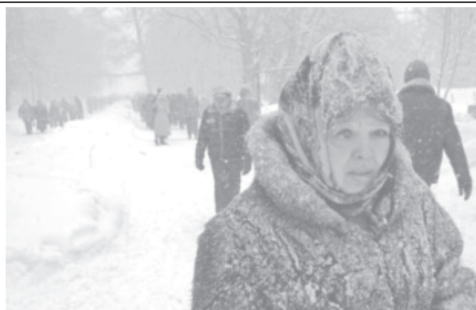
A Russian woman walks in heavy snowfall in a park in Russia's provincial town of Tambov on 5 March, 2006. Early spring started with heavy snowfalls and strong winds in central Russia.

Fifteen famous companies worldwide have registered for the bidding, which marks the first of its kind to attract investment partners in tapping energy resources on the Ukrainian part of the Black Sea, the President said.