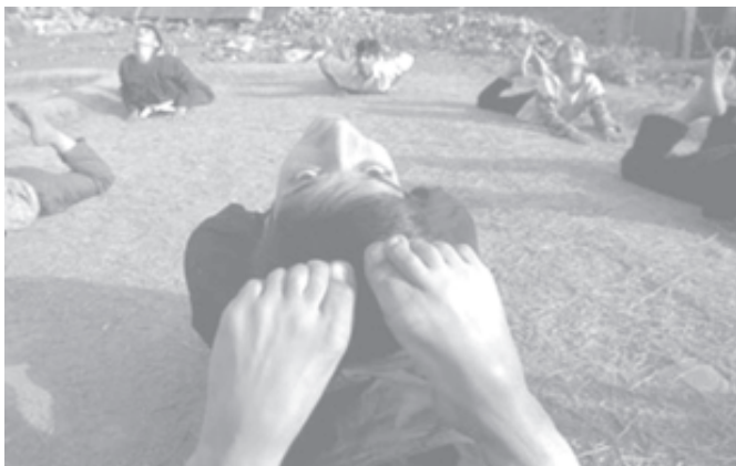
Kashmiri youths perform martial arts exercises outside the Jalalabad refugee camp in the earthquake-devastated city of Muzaffarabad in Pakistan-administered Kashmir on 5 March, 2006.—INTERNET

Consumption of cigarettes in Turkey, which was registered as 1,610 cigarettes per capita six years ago, dropped to 1,490 per capita in 2005, according to the report. —MNA/Xinhua