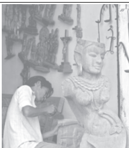
A craftsman works at a workshop on the outskirts of Raipur, capital of the central Indian state of Chhattisgarh, on 6 March, 2006.