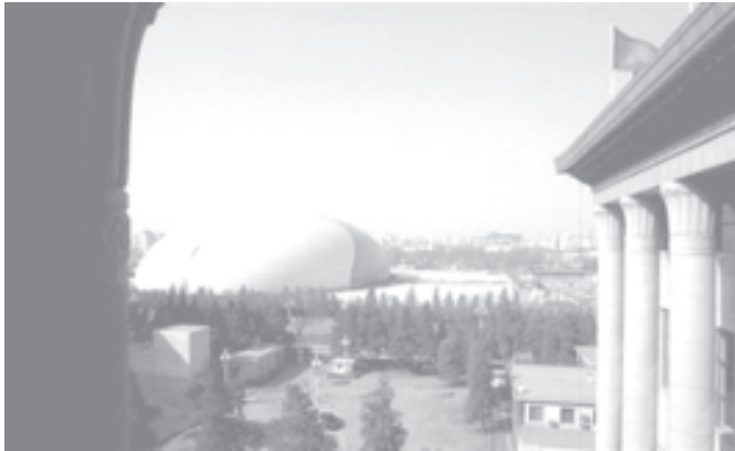
China's new National Theatre is seen from the Great Hall of the People in Beijing on 6 March, 2006.