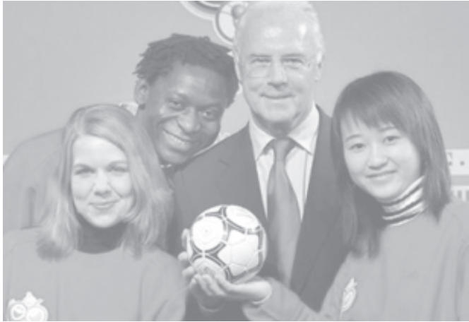
German soccer legend Franz Beckenbauer, centre, poses for photographers with volunteers of the World Cup soccer in Germany during the FIFA team workshop in Duesseldorf, western Germany, on 6 March, 2006.