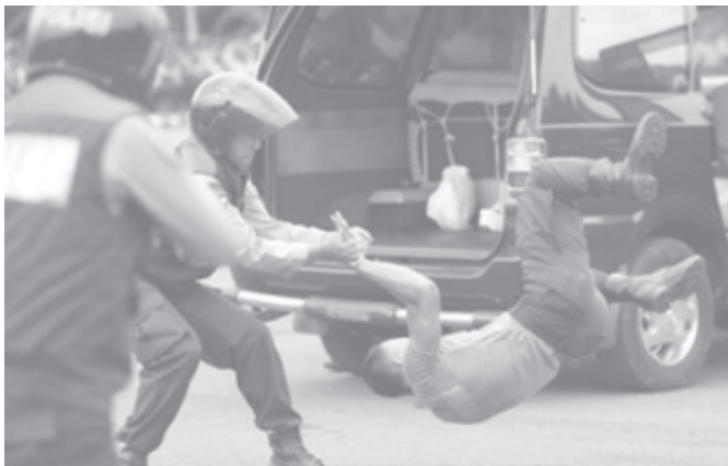
A member of elite police unit Mobile Brigade (BRIMOB) subdues a suspected terrorist during a drill in Jakarta, Indonesia, on 6 March, 2006. The drill was a part of the rehearsal for a police show of force which will be held on to boost the fight against terrorism.