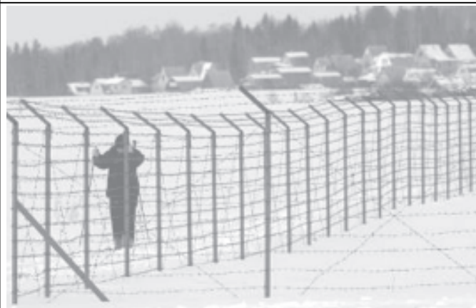
A Belarussian man skis by the memorial "Stalin's line" near the village of Goroshki, about 30 km (19 miles) west of Minsk, on 5 March, 2006. —INTERNET

The exhibition, which will run through March, was organized by the Singaporean Embassy in cooperation with the gallery to both promote Cambodian artists and encourage exchanges between artists from the two countries, said Ambassador Lawrence Anderson. —MNA/Xinhua