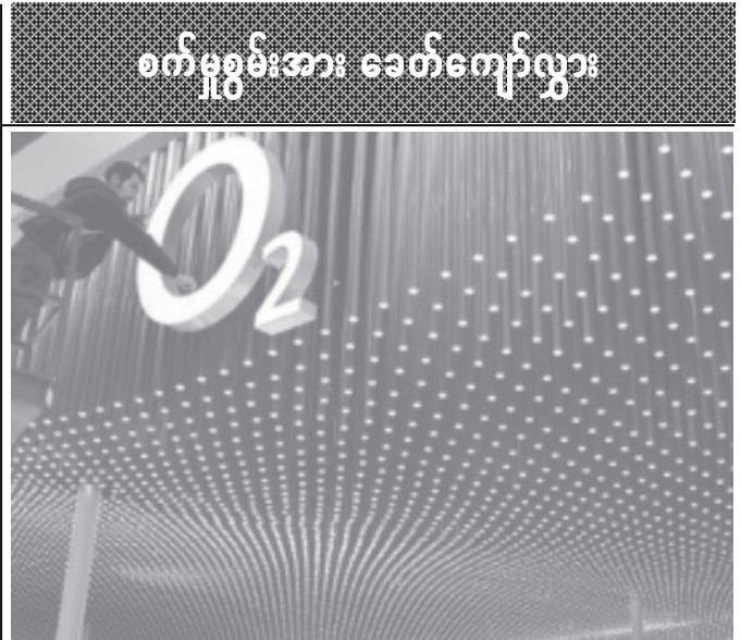
A worker makes final touches on the logo of British mobile phone company O2 in preparation for the CeBIT computer fair in the northern German town of Hanover on 6 March, 2006. The world's largest computer and information technology fair CeBIT runs from 9 March until 15 March, 2006.