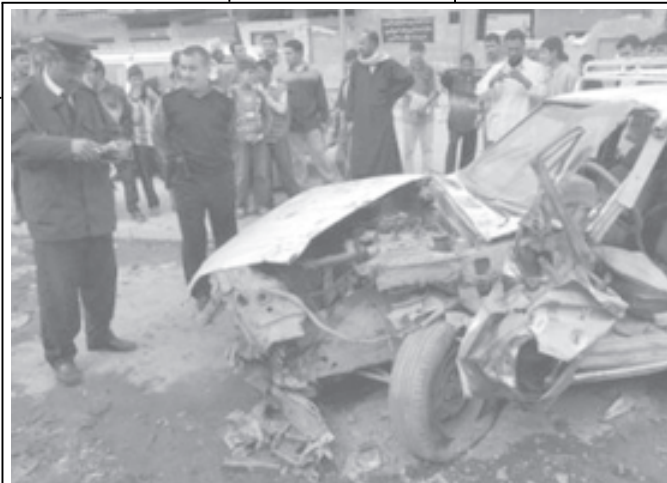
Iraqi policemen inspect a damaged vehicle in Basra, 550 kilometres (340 miles) southeast of Baghdad, Iraq, on 27 Feb, 2006. —INTERNET

Reports earlier said six Iraqis were killed and 38 others wounded. The attack probably were targeting a US military base close to the neighbourhood, the source said. —MNA/Xinhua