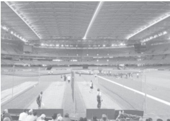
Australia and New Zealand will jointly bid to host the cricket World Cup in 2011.—INTERNET