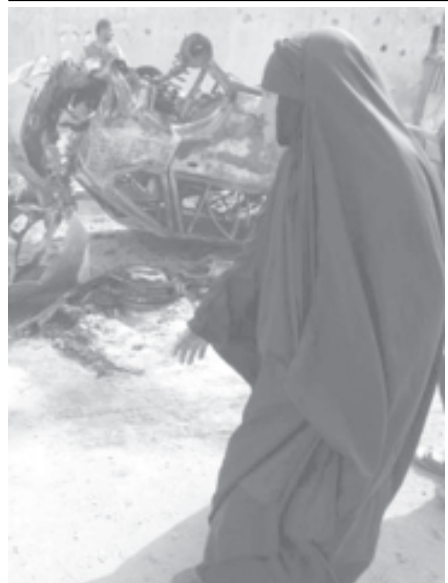
An Iraqi woman walks near a destroyed vehicle after a mortar attack in Baghdad on 27 Feb, 2006.