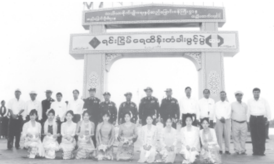
Lt-Gen Maung Bo, ministers, officials and local people pose for a photo at the opening of Yinnyein Sluice Gate.