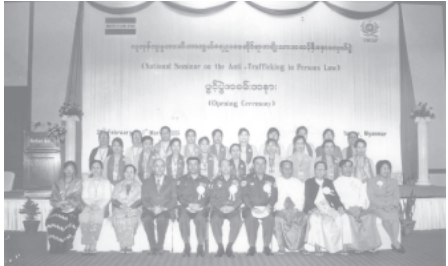
Secretary-I Lt-Gen Thein Sein poses for photo together with resource persons, chairmen of social organizations, personnel of NGOs, diplomats at the seminar.

I am pleased to note that the law you have before you is the result of inter-sector involvement, which as we all know, is the only way to truly combat this unacceptable human rights abuse called trafficking.