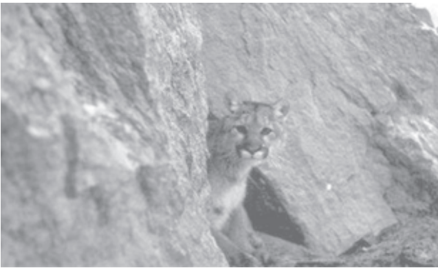
A mountain lion is seen in an undated photo. A mountain lion was found wandering through a Los Angeles suburb on Monday.