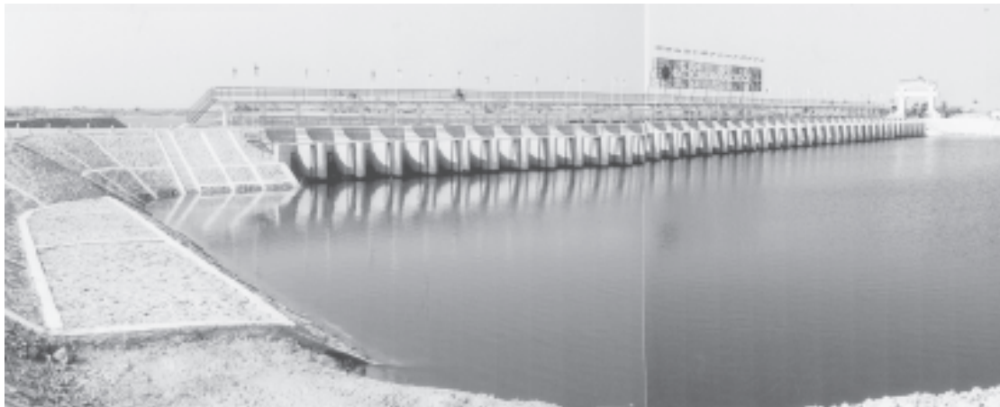
Yinnyein Sluice Gate in Paung Township in Mon State. — MNA

Today, states and divisions have seen parallel (See page 11)