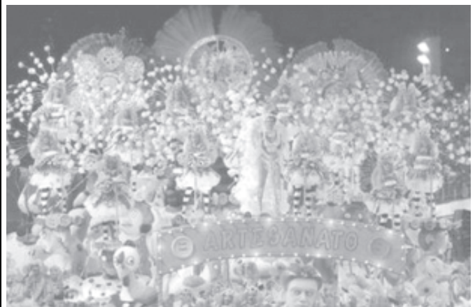
Revellers of the Mangueira samba school perform on the top of a carnival float during the second night of the Carnival parade at the Sambadrome in Rio de Janeiro on 27 Feb, 2006.