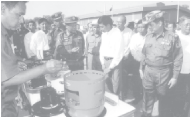
Lt-Gen Ye Myint views physic nut oil-used stoves.

Lt-Gen Ye Myint and party planted physic nut saplings. Tatmadaw members and families planted over 100,000 physic nut plants at the ceremony. They then observed a physic nut farm in the compound of Kaunghmudaw Pagoda.