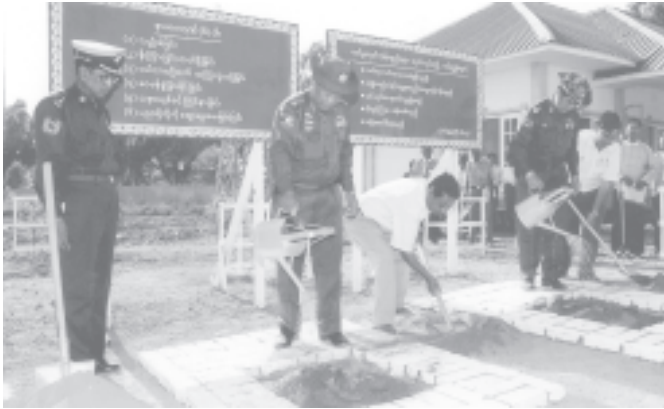
Lt-Gen Ye Myint waters a physic nut plant at physic nut growing ceremony in Monywa Industrial Zone.