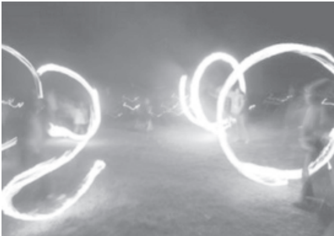
Bulgarian children rotate fireballs during celebrations of 'Mesni Zagovezni' in the village of Lozen near the capital Sofia on 26 Feb, 2006. —INTERNET

For fear of a pandemic sparked by bird flu, many countries have been trying recently to stockpile Tamiflu, currently made from shikimic acid, which is found in a fruit named star anise often used as a spice in Chinese cuisine.—MNA/Xinhua