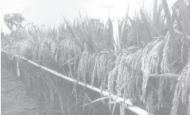
A thriving Hsinshweli paddy plantation in Kyugok (Pangsai) with a yield of 200 baskets per acre.

However, under the leadership of officials from Shan State (North) Peace and De-