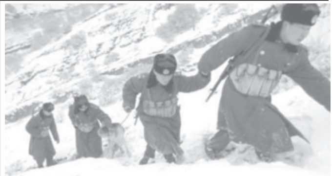
Chinese armed policemen climb a snow-covered mountain during a cold-endurance training in Taiyuan, north China's Shanxi Province on 27 Feb, 2006.