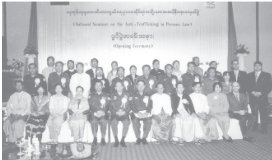
Secretary-I Lt-Gen Thein Sein poses for photo together with resource persons, chairmen of social organizations, personnel of NGOs, diplomats at the seminar.

While the enactment of the law provides a much need legal tool to combat trafficking, as the next two days discussions on the law will reveal, the implementation of this highly comprehensive law on trafficking if not going to be an easy undertaking. The challenge now is to successfully and effectively implement the law. The whole law enforcement sector and the criminal justice system including everyone from all walks of life will have to cooperate and work together to ensure its effective implementation. Lessons learnt from looking at countries, who have before us, enacted anti-trafficking laws reveal that we have many challenges ahead;