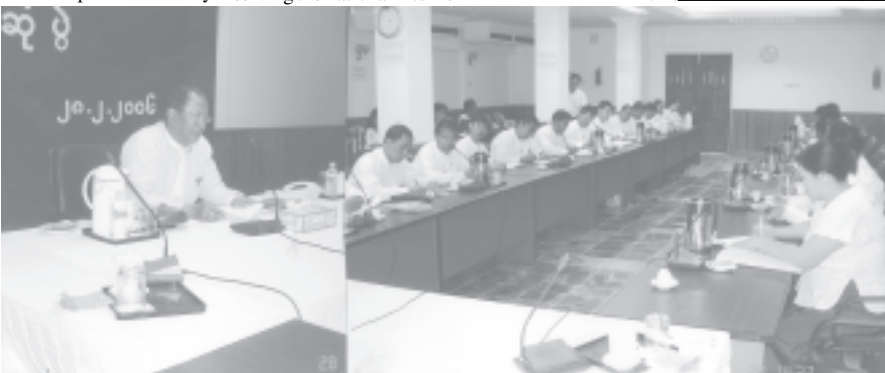
USDA Secretariat member Minister U Aung Thaung meets members of USAs from Bahan, Tarmway, Pabedan Townships.

Afterwards, they inspected summer paddy fields at between Myinmu and Myaung Townships.