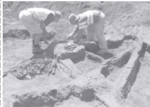
Scientists have found what they believe are traces from the lost Indonesian civilization of Tambora, which was wiped out in 1815 by the largest volcanic eruption in recorded history.