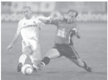
Real Madrid French player Zinedine Zidane, left, duels for the ball against Real Mallorca player Angelos Basinas during their Spanish league soccer match at the Son Moix Stadium in Palma de Mallorca, Spain, on Sunday, 26 Feb, 2006. Real Madrid lost 2-1.

Zidane believed France are good enough to win the World Cup although they have to overcome a major obstacle from Brazil.