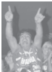
Diego Maradona gestures as he watches Rio de Janeiro's carnival parade at the Sambodrome, Brazil, on Monday, 27 Feb, 2006.

BRASILIA, 28 Feb—Argentine legend Diego Maradona said Sunday that Brazil would be the top favourite to win the World Cup in Germany.