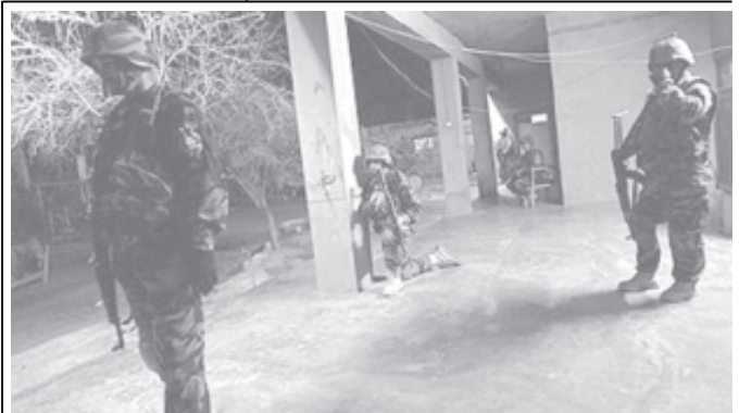
Iraqi Special Police Commandos from the 2nd Battalion 2nd Brigade, also widely known as the "Wolf Brigade", maintain security around a house while it is searched by other commandos from the unit, in the restive city of Ramadi, west of Baghdad.