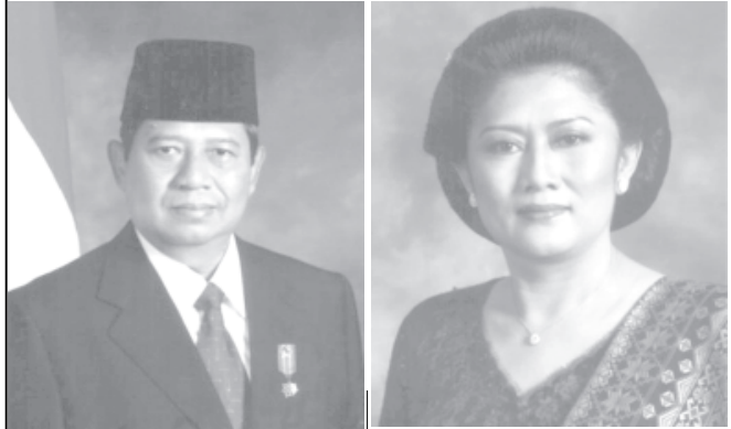
Dr Susilo Bambang Yudhoyono