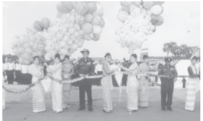
Commander Maj-Gen Soe Naing, Minister Maj-Gen Htay Oo formally open Yinnyein Sluice Gate.

The Yinnyein Sluice Gate is located near Yinnyein Creek, one and a half miles upstream Kyonhaw Village, Paung Township. The water surface area of the concrete type facility is 31.25 square miles with 40