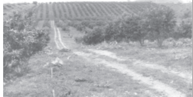
A Hsinshweli honey orange plantation owned by North East Command in Naungmon village in Lashio Township.

With a view to enjoying self-sufficiency in rice, Shan State (North) cultivated 13,679 acres of Hsinyadana paddy in 2005-2006 monsoon paddy cultivation season. Shan State (North) is taking systematic measures for cultivating 300,000 acres of monsoon paddy in its effort to successfully implement the economic objectives of the State.