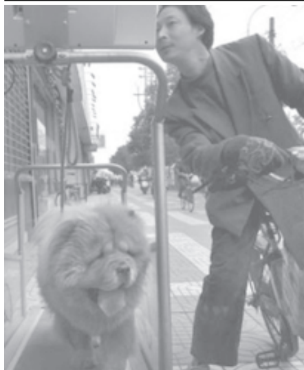
A Chow Chow exercises on a treadmill while a passer-by looking at its meter on a side road in Nanjing, China's Jiangsu Province on 27 Feb, 2006.