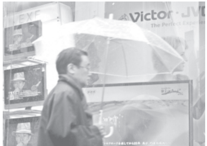
A Victor Company of Japan (JVC) showroom in Tokyo. Japanese plants and factories boosted production for a sixth straight month in January, lifting industrial output to record high levels.—INTERNET

Kaberuka reaffirmed the commitment of the bank to continue supporting Ethiopia's economic development and poverty eradication efforts.—MNA/Xinhua