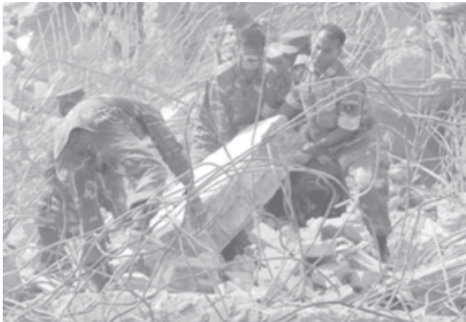
Bangladeshi soldiers help rescue operations at the site of a six-storey building collapse in Dhaka, Bangladesh, on 27 Feb, 2006.