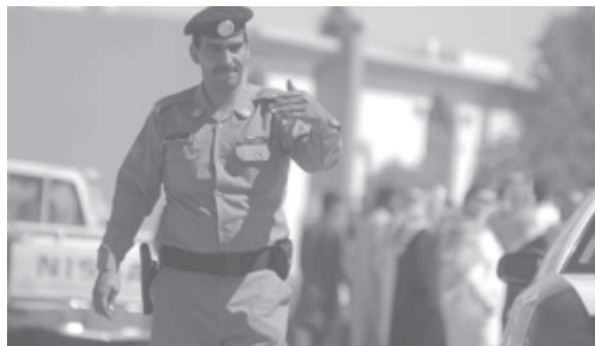
A Saudi policeman directs traffic at a roadblock in the Yarmuk area of eastern Riyadh, Saudi Arabia, on 27 Feb, 2006. Saudi forces on Monday killed five suspected militants during a shootout that erupted at dawn.