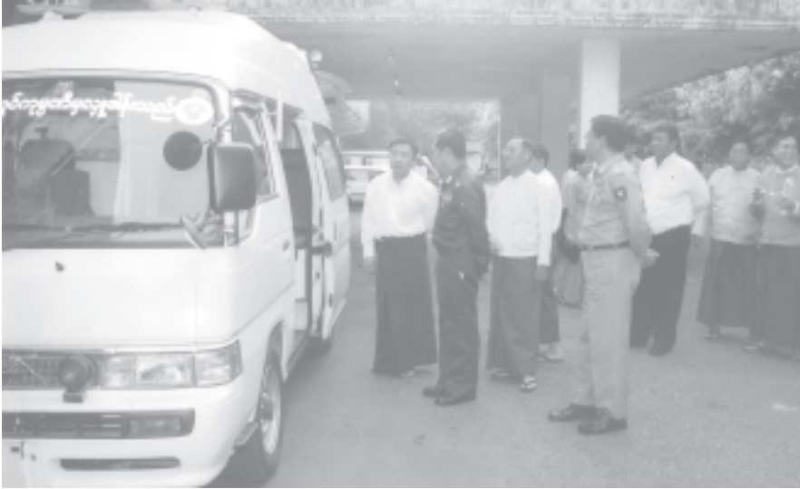
Transport Minister Maj-Gen Thein Swe views the ambulance donated by Shwe Thanlwin Co Ltd.

YANGON, 15 Feb — Shwe Thanlwin Co Ltd donated an ambulance to the Ministry of Transport yesterday. Managing Director