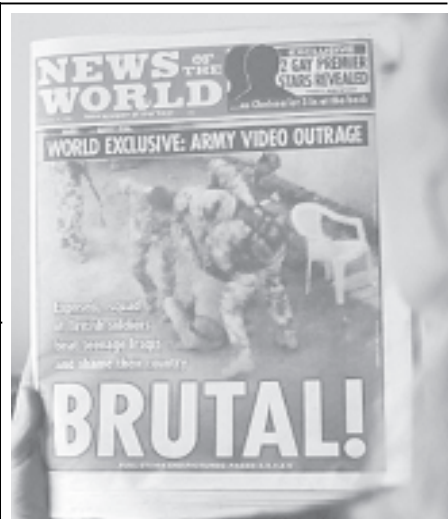
A woman reads the front page of Britain's 'News of the World' newspaper in London, on 12 Feb, 2006, which features video footage apparently showing British troops abusing Iraqi civilians. British military police have made an arrest in connection with a probe into the video footage, the defence ministry said.

were inter-linked and all members should fulfill their duty towards the objective of collective well being.—MNA/Xinhua