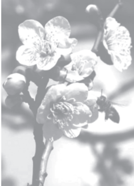
A honeybee hovers to collect nectar from blossoms of a Japanese plum tree at Yushima Tenjin shrine in Tokyo, on 14 Feb, 2006. The blossoms signify the approach of Spring.