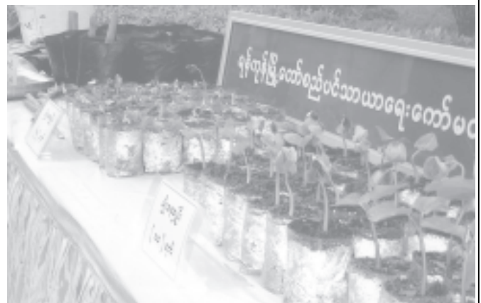
Physic nut saplings exhibited at the ceremony to demonstrate bio-diesel production.

high. The following table indicates the oil content rate of physic nut fruits acre-wise or age-wise.