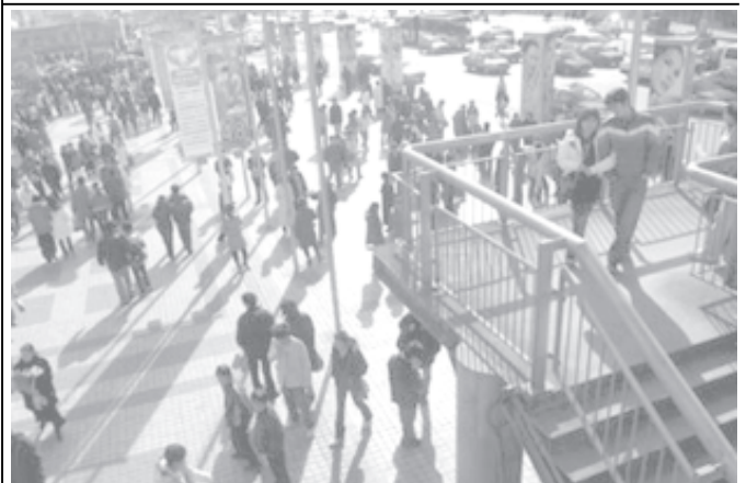
Chinese walk through the central shopping district of downtown Beijing on 14 Feb, 2006.