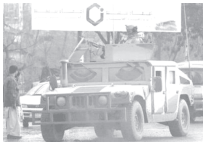
US soldiers patrol a street in the outskirts of Kabul, Afghanistan, on 14 Feb, 2006.

MEXICO CITY, 14 Feb—Nine people were killed in two separate cases of murder in Mexico on Monday, local police said. Six people died of gunshot wounds in the northern state of Durango. The bodies were found in a place adjacent to Sinaloa, a state with one of the largest drug-trafficking problems in Mexico, said the Attorney General's Office of Durango. The Durango authorities said the multiple homicides took place in the early hours of Monday in Tamazula municipality, because of a dispute about a shipment of marijuana. It has been the second multiple homicides in Tamazula this year. Meanwhile, the state government of Michoacan, a state in central Mexico, said police found the bodies of three men who had been murdered. The bodies were found in a van with no license plates, close to the border with the neighbouring state of Colima. The three victims, aged between 28 and 41, lived in Colima, and had been killed there and then dumped in Michoacan, said the attorney general of Morelia, the capital of the state. Michoacan has seen around 30 killings of organized crime this year. MNA/Xinhua