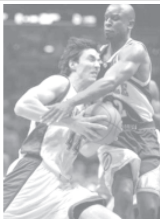
Milwaukee Bucks guard Jiri Welsch (L) of the Czech Republic is fouled by Seattle Sonics guard Ronald Murray (R) as he drives the paint in the third quarter of their NBA game in Milwaukee, Wisconsin on 14 February, 2006.