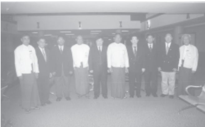
The UMFCCI Vice-President and officials at the airport on their departure for Thailand.