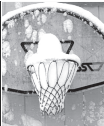
A basketball net is full of snow in Silver Spring, Maryland after the first major winter storm passed through Washington area on 12 Feb, 2006. Airports from Washington to Boston are closed because of high, gusting winds and large accumulations of snow.

The imported technology has mainly been used in major Chinese energy projects such as the Three Gorges power project, key nuclear power plants and electricity and natural gas transmission projects from the resources-rich western China to the country's power-thirsty eastern part, the ministry said. — MNA/Xinhua