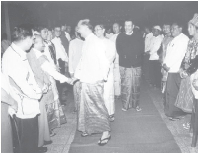
Secretary-1 Lt-Gen Thein Sein cordially greets Union Day delegates at the dinner.