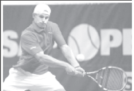
Andy Roddick hits a backhand shot during his first round match against Spain's Guillermo Garcia-Lopez in the SAP Open in San Jose, Calif, on Tuesday, 14 Feb, 2006.