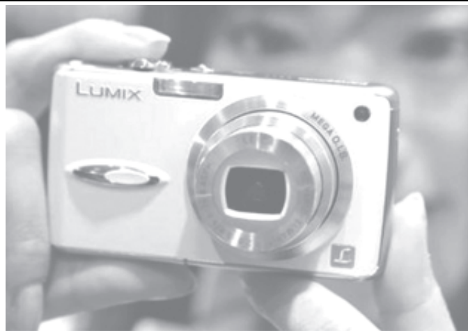
Japanese model Rika Ando demonstrates Panasonic's new 'LUMIX' digital still camera DMC-FX01 at an unveiling in Tokyo 14 Feb, 2006.