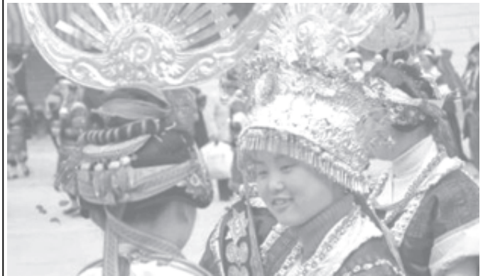
Women from the Miao ethnic minority group talk during the Miao's traditional Lusheng (reed-pipe wind instrument) Festival in Kaili in southwest China's Guizhou Province on 14 Feb, 2006.—INTERNET