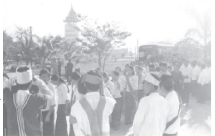
Union Day delegates and cultural troupes visit National Races Village.