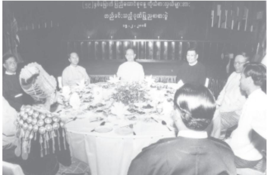
Secretary-1 Lt-Gen Thein Sein attends a dinner in honour of cultural troupes and USDA member Union Day delegates.