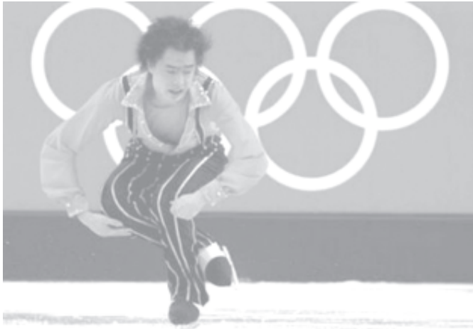
Zhang Min from China performs during the figure skating men's Short Programme at the Torino 2006 Winter Olympic Games in Turin, Italy, on 14 Feb.