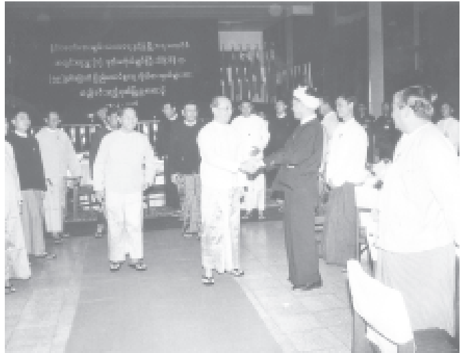
Secretary-1 Lt-Gen Thein Sein cordially greets Union Day delegates at the dinner.