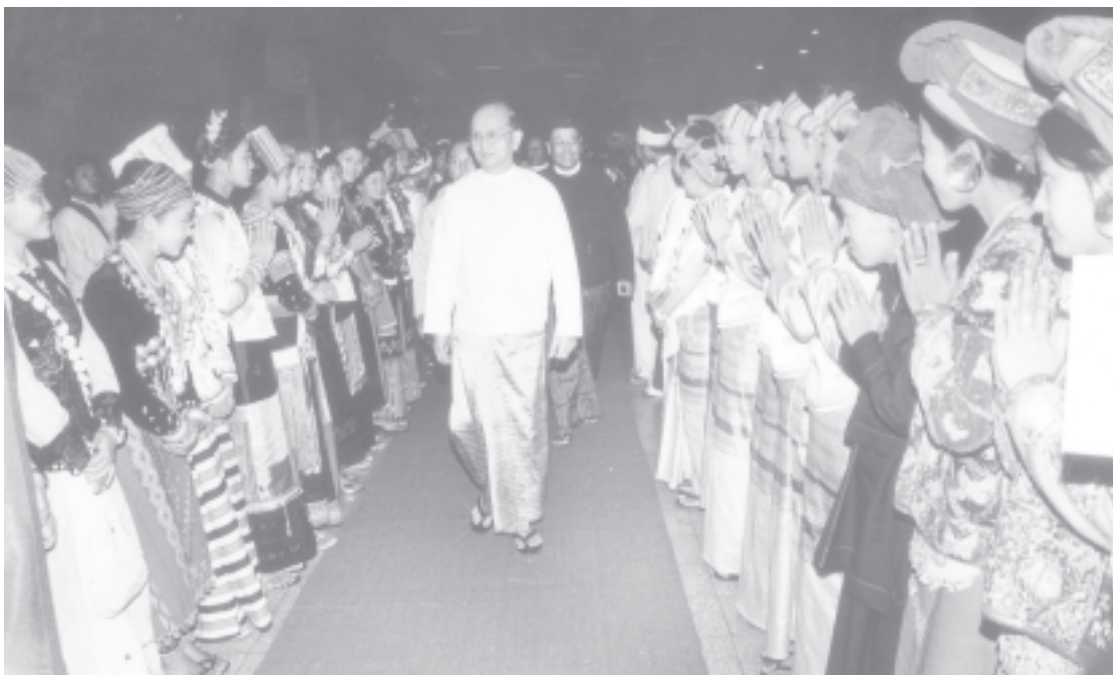
Secretary-1 Lt-Gen Thein Sein cordially greets cultural troupe members from States and Taninthayi Division and USDA member Union Day delegates from States and Divisions at the dinner held in their honour.

Also present on the occasion were Chairman of the Management Committee for Organizing the 59th Anniversary Union Day Lt-Gen Myint Swe (See page 8)