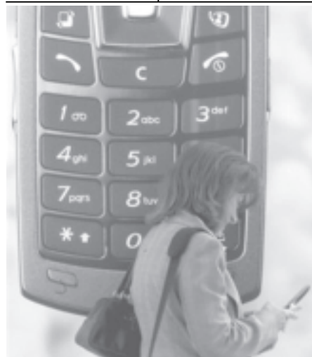
A woman looks at a new generation mobile phone on the first day of the 3GSM World Congress in Barcelona, Spain, on 13 Feb, 2006.