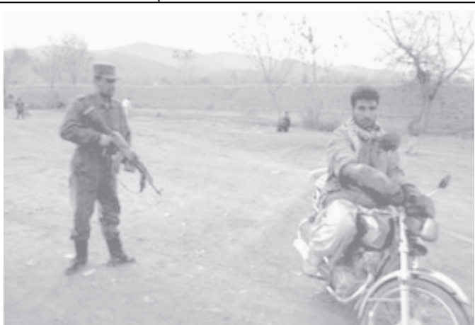
An Afghan policeman diverts a motorcyclist from the site of a blast in Kabul, Afghanistan, on 13 Feb, 2006.