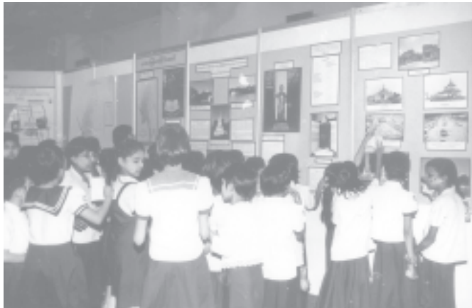
Students visit 59th Anniversary Union Day Exhibition.

booths on traditions and customs of the national races are also shown at the exhibition. The exhibition will last till 16 February. MNA