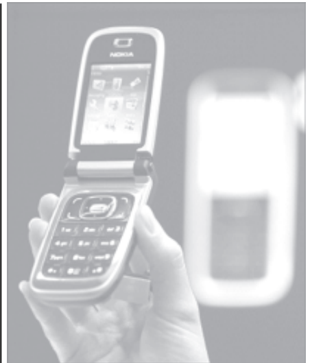
A Nokia 6131. Struggling Japanese electronics maker Sanyo and Finnish mobile telecommunications giant Nokia are in talks to set up a global joint venture in third-generation (3G) mobile phones.— INTERNET

It was compiled by the European Commission in collaboration with the Economic Policy Committee, a panel of economic and financial experts from the EU states.— Internet