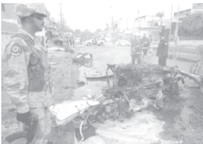
An Iraqi soldier views the scene following a car bomb explosion in Baghdad, Iraq, on 14 Feb, 2006.

"The Royal Military Police have identified several people in the video and investigations are ongoing to identify all those involved in the alleged incident," he added. A Ministry spokesman said on Monday the First Battalion of the army's Light Infantry Regiment was helping military police with their investigation into the incident. He confirmed the man arrested on Sunday night was a serving soldier. The video has been shown widely on British television as well as Arabic news stations and shows a group of soldiers dragging Iraqi protesters behind a wall while a demonstration is under way, beating them with batons and kicking them.—Internet