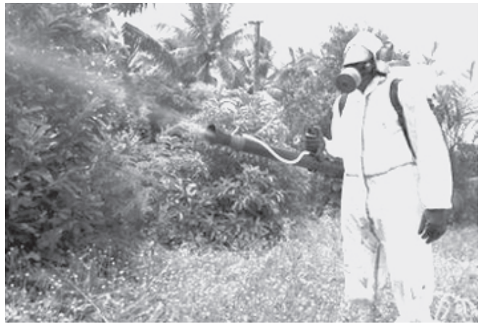
A French soldier sprays a chemical to battle a mosquito-borne virus, the Chikungunya, that has infected more than 50,000 people on the French island of La Reunion in the Indian Ocean, in Saint-Denis, La Reunion, on 10 Feb, 2006.