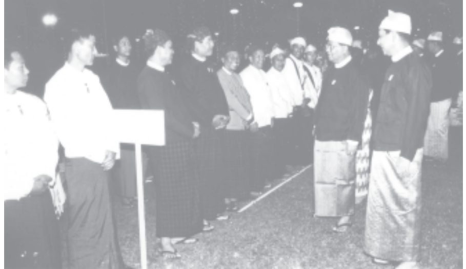
Senior General Than Shwe and wife Daw Kyaing Kyaing cordially greet Union Day delegates, cultural troupes of States and Divisions and Taninthayi Division, and Union Day delegate USDA members of States and Divisions at 59th Anniversary Union Day Reception and Dinner.

They were welcomed by Vice-Chairman of the State Peace and Development Council Vice-Senior Gen-