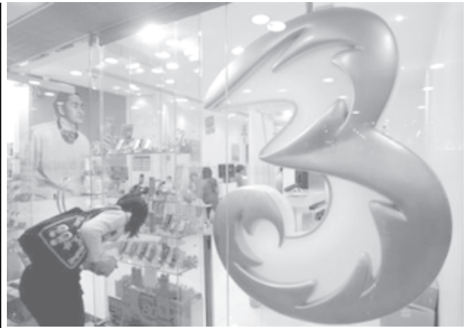
A woman looks at the mobile phones at a 3G shop in Hong Kong on 11 Feb, 2006.

On Saturday, Russia played host to the G-8 financial minister's meeting for the first time. Reports said the world's second-largest oil exporter was eager to highlight its newfound financial muscle and brush off its suspicion over its reliability as an energy supplier.