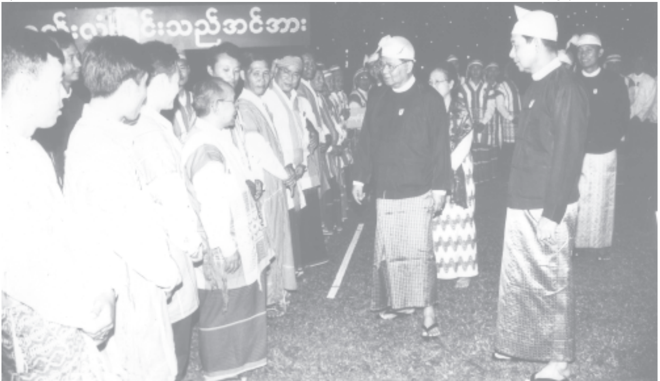
Senior General Than Shwe and wife Daw Kyaing Kyaing cordially greet Union Day delegates, cultural troupes of States and Divisions and Taninthayi Division, and Union Day delegate USDA members of States and Divisions at 59th Anniversary Union Day Reception and Dinner.

YANGON, 12 Feb — Chairman of the State Peace and Development Council of the Union of Myanmar Senior General Than Shwe and wife Daw Kyaing Kyaing hosted a reception to mark the 59th Anniversary Union Day and the dinner, on the lawns of the President House on Ahlon Road, here, this evening. At 6.30 pm, the Senior General and wife arrived at the reception and dinner. (See page 7)