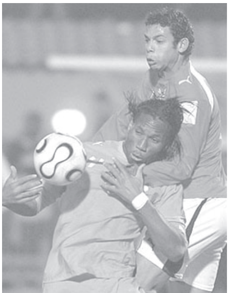
Egyptian defender Abdel Zaher El Saca (R) challenges Ivory Coast's captain Didier Drogba during overtime of the African Nations Cup final in Cairo on 10 Feb, 2006.

"Of course such a dramatic event as happened to him this morning won't help him recover... It won't contribute to the wellbeing of Prime Minister Sharon. Every day that passes, the chances are reduced."—MNA/Reuters