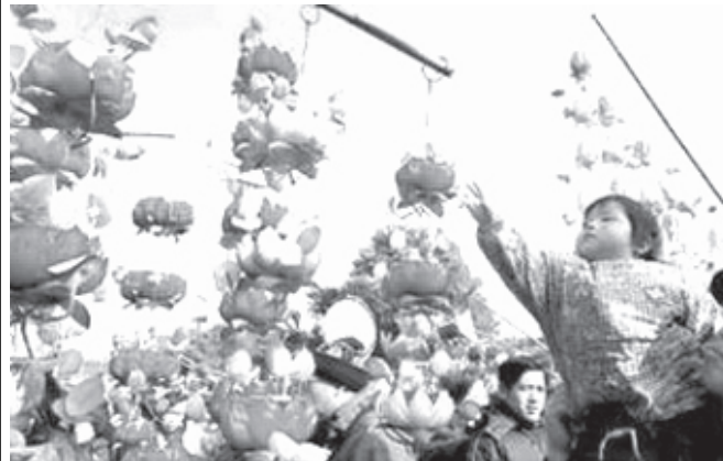
A Chinese girl looks at lotus flower-shaped lanterns for the upcoming Lantern Festival in Nanjing, capital of east China's Jiangsu Province on 10 Feb, 2006. The traditional Chinese festival will fall on 12 Feb. — INTERNET

The international meeting will be hosted by India in April, Pinij said. — MNA/Xinhua