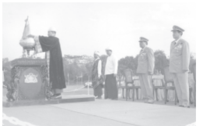
Mayor Brig-Gen Aung Thein Lin plants the Union Flag in the silver bowl on the dais at People's Square.

and flag relay team took out the Union Flag from the silver bowl and carried it flanked by members of the panel of chairmen, Tatmadaw (Army, Navy and Air) and Police Officers, national races and