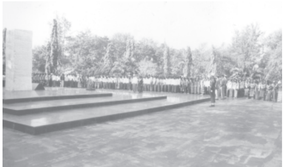
Union Day delegates and cultural troupes pay tribute to fallen heroes at Memorial to Fallen Heroes. — MNA

They also visited Shwedagon Pagoda and donated K 118,390 to the pagoda. Later, they proceeded to Maha Wizaya Pagoda. The Union Day delegates also donated K 106,650 to the pagoda and paid homage to it. — MNA