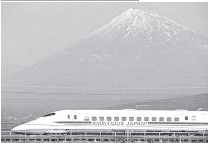
A Japanese bullet train speeds past Mount Fuji in this photo. Japan’s government is expected to announce measures to deal with a possible eruption of its famed Mount Fuji, officials said on 10 Feb, 2006, but they added there were no signs that the long-dormant volcano had become active. — INTERNET