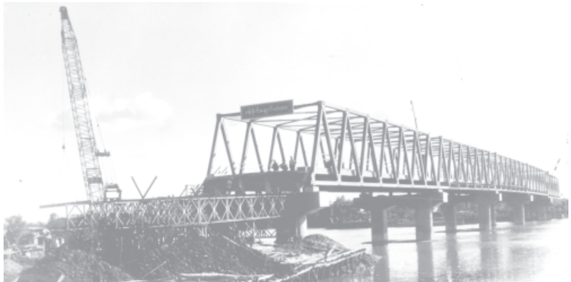
Wanphaik Creek Bridge under construction in Yanbye township to develop transportation sector of Rakhine State.

Rakhine State is sandwiched between the Bay of Bengal and Rakhine mountain range which is running from north to south. With an altitude of 3000 feet, Rakhine mountain range has more higher peaks in the north than in the south. Rivers namely Naff, Mayyu and Kitsapanadi and creeks such as Ma-ei, Tanlwe, Taungup, Thandwe, Kyeintali and Gwa are flowing from north to south. Sittway plain is