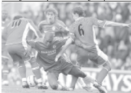
Chelsea's Carlton Cole, centre, battles his way through Middlesbrough's Fabio Rochemback, left, and Gareth Southgate, right, during their English Premier League soccer match at Middlesbrough's Riverside Stadium, Middlesbrough, England, on 11 Feb, 2005. Middlesbrough won 3-0.

Liverpool stay third on 48 points, 18 behind leaders Chelsea who are in action later at Middlesbrough.—MNA/Reuters