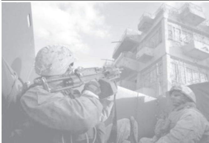
US soldiers scan rooftops for armed groups from their position in the open back of a humvee in Ramadi, 115 kilometres (70 miles) west of Baghdad, on 10 Feb, 2006.