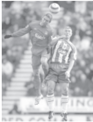
Wigan Athletic's Graham Kavanagh, right, and Liverpool's Harry Kewell jump for the ball during their English Premier League soccer match at The JJB Stadium, Wigan, England, on 11 Feb, 2006. Liverpool defeated 1-0.

LONDON, 12 Feb — European champions Liverpool ended a dismal run of Premier League form with a scrappy 1-0 victory at Wigan Athletic on Saturday.