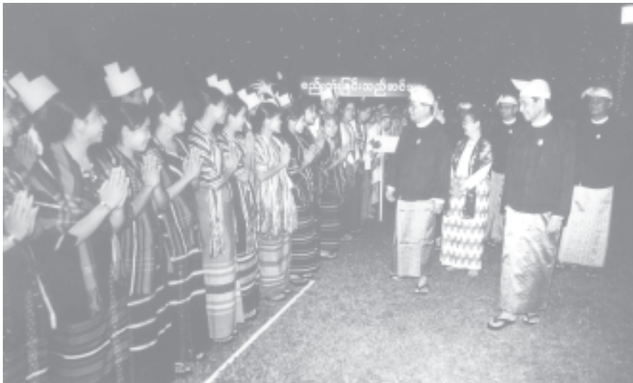
Senior General Than Shwe and wife Daw Kyaing Kyaing cordially greet Union Day delegates, cultural troupes of States and Divisions and Taninthayi Division, and Union Day delegate USDA members of States and Divisions at 59th Anniversary Union Day Reception and Dinner.

After the dinner, goal medallists of Myanmar Traditional Cultural Performing Arts Competitions, cultural troupes of Kachin, Kayah, Kayin, Mon, Taninthayi, Chin, Rakhine and Shan States and artists of Fine Arts Department presented entertainment to the guests.