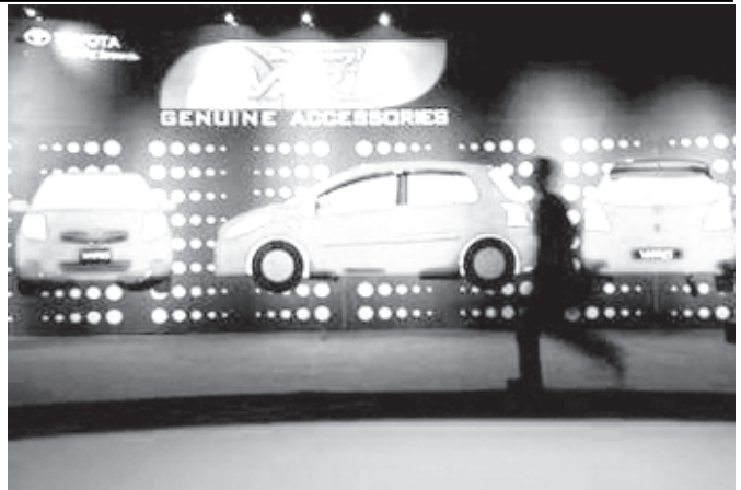
An Indonesian man walks in front of an advertisement of Toyota’s new compact car Yaris in Jakarta on 10 Feb, 2006.

“We cannot be satisfied with an operating margin of 3.2 per cent,” he said, adding that it was “inferior to the average margin of other world car makers which is 3.6 per cent”. Earlier, Renault posted its net profit in 2005 at 3.367 billion euros (4.03 billion dollars), a rise of 18.7-per-cent compared with 2004 and the best record in the company’s history.