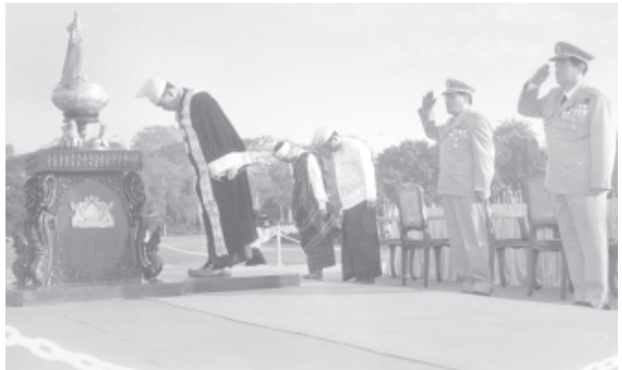
Mayor Brig-Gen Aung Thein Lin and those present at the 59th Anniversary Union Day Ceremony salute the Union Flag.

Chairman of Yangon City Development Committee Mayor