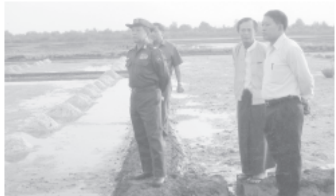
Minister for Mines Brig-Gen Ohn Myint oversees Thahmephyu salt industry in Ngaputaw Township. — MINES

The minister oversaw salt fields and met local authorities, entrepreneurs, members of Union Solidarity and Development Association. They discussed rural development tasks and cultivation of physic nut. The minister inspected Thahmephyu