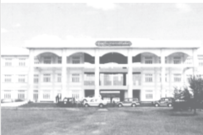
Three-storey main building of Government Technological College (Swittway) in Rakhine State.