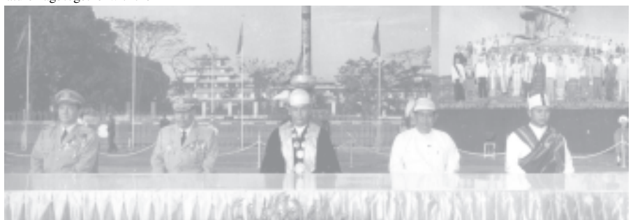
Members of the panel of chairmen at 59th Anniversary Union Day Ceremony.