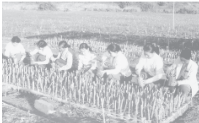
Women nurturing grafts of physic nut in Lashio District.

months. In general, a plant grown from a graft starts to bear fruits at the age of six months and a plant grown from a seed, at the age of eight months.