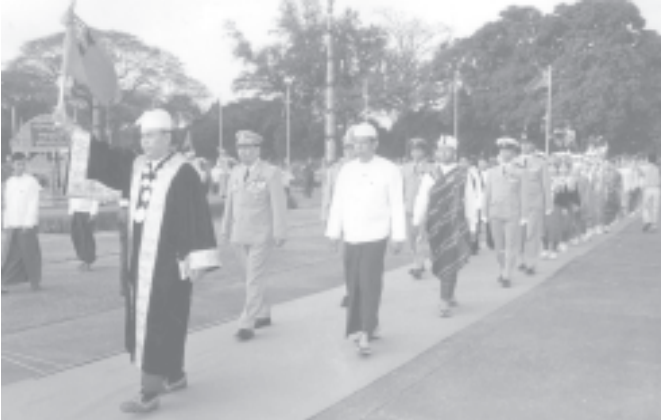
Mayor Brig-Gen Aung Thein Lin conveys Union Flag to People's Square.