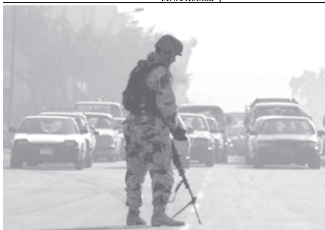
An Iraqi soldier holds a weapon as he secures a road in Baghdad on 11 Feb, 2006.