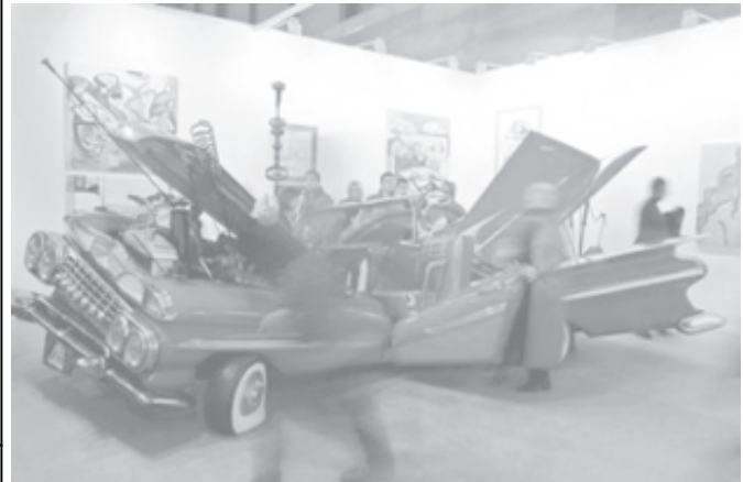
A visitor passes an art work by Mariscal displayed at the Spanish International Arts Fair (ARCO) in Madrid, Spain, on 11 Feb, 2006.