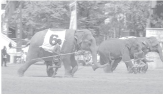
Elephants run in a race during an elephant show in Colombo, Sri Lanka, on 11 Feb, 2006. Sri Lankan tamed elephants staged a show on Saturday to raise funds for their medical needs.