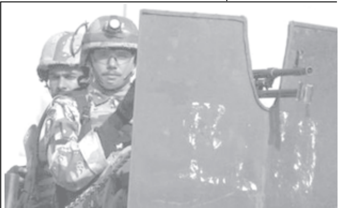
Iraqi soldiers secure a road on a vehicle at a checkpoint in Baghdad on 11 Feb, 2006.

Chavez visited China and signed a series of agreements on co-operation in petroleum, gas, telecommunications and trade.