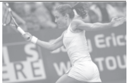
Anna Smashnova of Israel rushes to the net during her match against Nadia Petrova of Russia in the second round of the indoor Paris tennis open at Pierre de Coubertin stadium on 9 Feb, 2006.