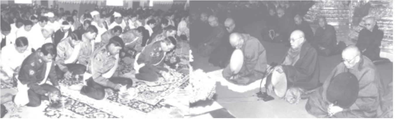
Prime Minister General Soe Win and party and congregation sharing merits gained at the hoisting of Shwehtidaw atop Maha Ratthabhi Samaggi Pagoda.