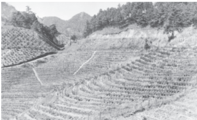
Tea plantations in Haka Township.