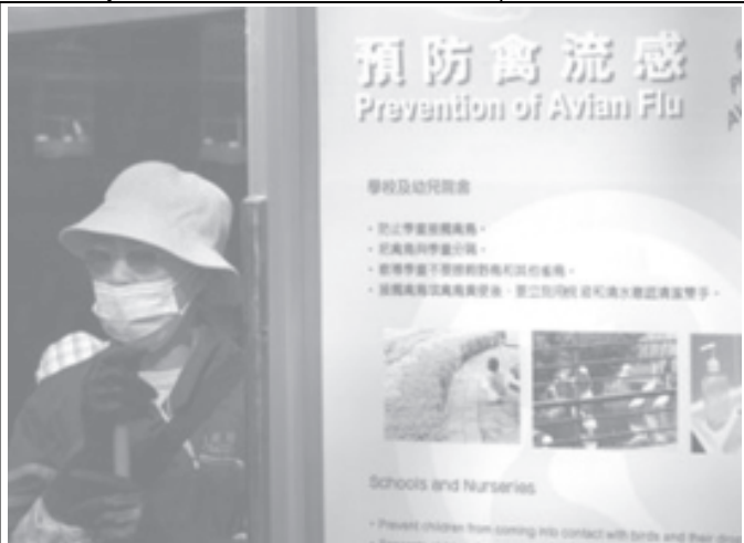
A worker cleans up near a anti-avian flu poster at a local bird market in Hong Kong on 9 Feb, 2006.