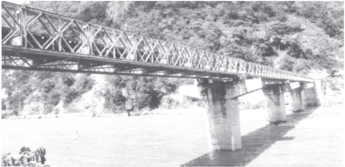
Var Bridge across Manipur River built on Kale-Haka Road in Falam Township.

Chin brethren are highlanders, they are at oneness with other national brethren living in the plains. Thanks to the government's efforts for equitable development of all regions in the country, the hill regions are