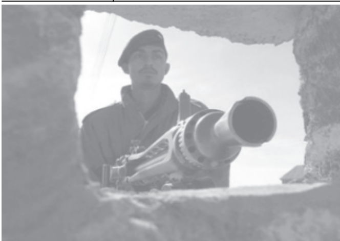
A Pakistani soldier mans a machine gun at the Pakistan-Afghan border near Chaman after security was tightened, on 9 Feb, 2006.—INTERNET

For his last meal, Neville requested chicken fried steak, mashed potatoes with gravy, fried okra, mixed fresh vegetables, bread and butter, sweetened tea, chocolate cake and doughnuts.—MNA/Reuters