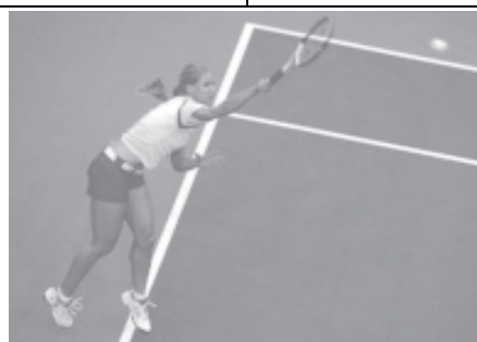
Elena Dementieva of Russia serves during her match against Nathalie Dechy of France in the second round of the indoor Paris tennis open at Pierre de Coubertin stadium, on 9 Feb, 2006.