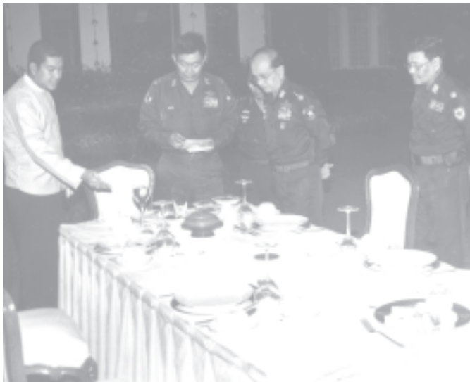
Secretary-1 Lt-Gen Thein Sein inspects preparations for 59th Anniversary Union Day Dinner.