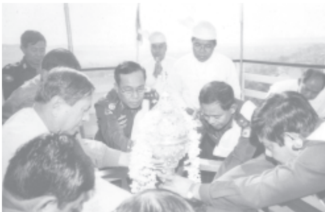
Prime Minister General Soe Win fixes the Seinbudaw (diamond bud) atop Maha Rathabhi Samaggi Pagoda.