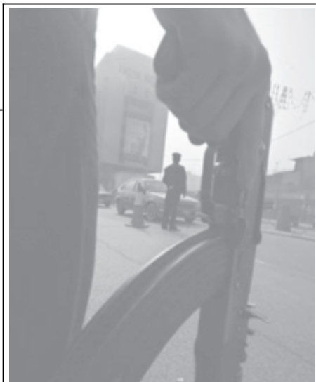
An Iraqi policeman holds a weapon at a checkpoint on a road in Baghdad, on 9 Feb, 2006. —INTERNET

The extra police were being sent to guard Indian engineers and support staff working on various development projects, especially a key highway project, around the war-torn country. —MNA/Reuters