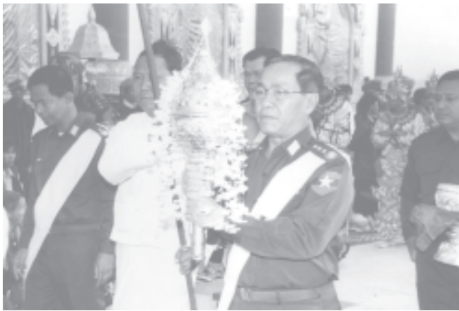
Prime Minister General Soe Win conveys Seinbudaw (diamond bud).