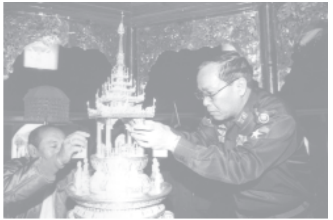
Prime Minister General Soe Win puts Buddha relics into the reliquary.