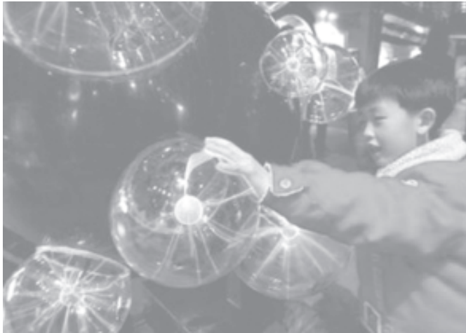
A Chinese boy plays in the Shanghai Science and Technology Museum in Shanghai on 9 Feb, 2006.