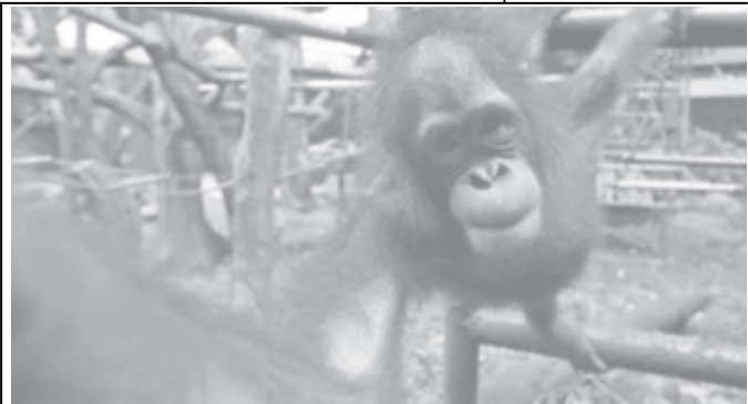
A young orangutan plays at Jakarta's Ragunan zoo on 9 Feb, 2006. There are an estimated 30,000 orangutans left in the wild but the deforestation of their main habitat on Indonesia's part of Borneo (Kalimantan) and Sumatra island is threatening their existence.