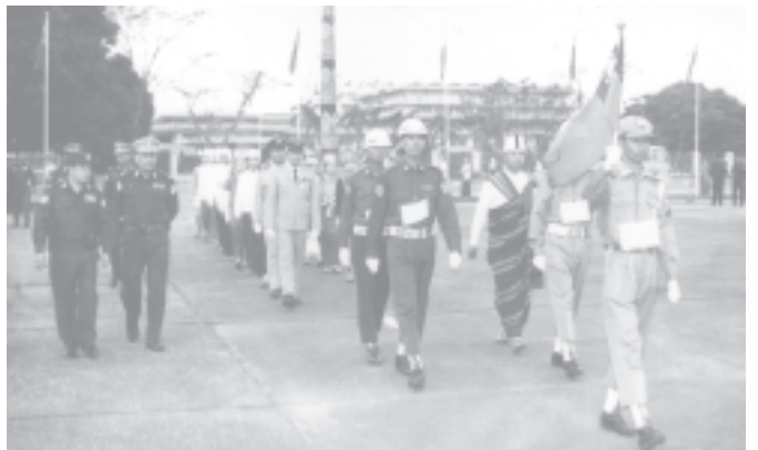
Commander Brig-Gen Hla Htay Win oversees full-dressed rehearsal of 59th Anniversary Union Day Flag Hoisting Ceremony. — MNA

YANGON, 10 Feb — The full-dressed rehearsal of the 59th Anniversary Union Day Flag Hoisting Ceremony took place at the People's Square on Pyay Road, here, at 6.45 am today.