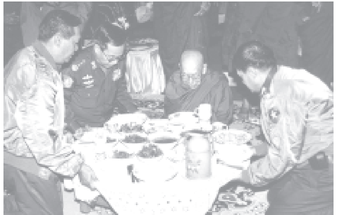
Prime Minister General Soe Win offers 'soon' (meal) to a member of the Sangha.