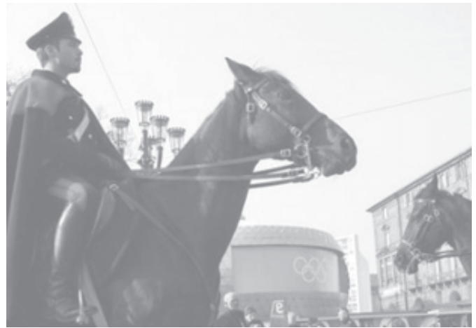
An Italian mounted Carabinieri police officer guards the area surrounding the medals plaza ahead of the Torino 2006 Winter Olympic Games in Turin, Italy, on 9 Feb, 2006.