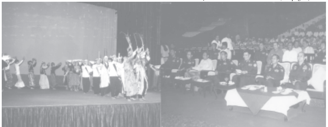
Secretary-1 Lt-Gen Thein Sein views dress rehearsal of cultural troupes of national races.