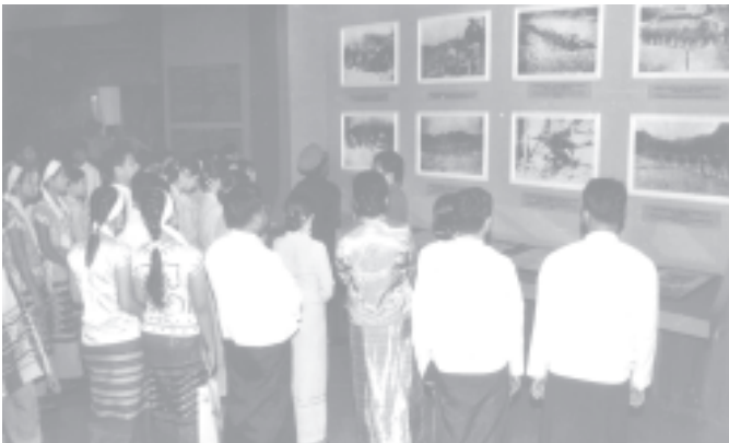
Union Day delegates observe documentary photos at 59th Anniversary Union Day Exhibition.