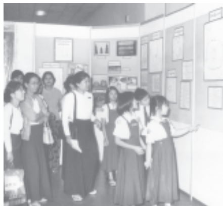
Schoolchildren visit 59th Anniversary Union Day Exhibition. — MNA

Moreover, enthusiasts also took part in computer quiz at the exhibition which will last till 16 February from 9 am to 5 pm daily. — MNA