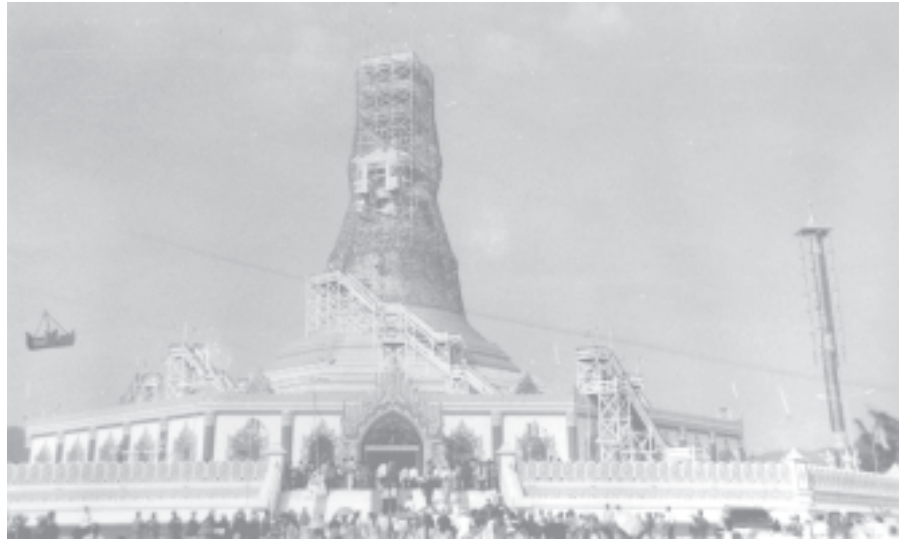
Maha Rathabhi Samaggi Pagoda. — MNA

Prime Minister General Soe Win offered Seinbudaw (diamond bud), religious objects and alms to the Chairman Sayadaw. (See page 11)