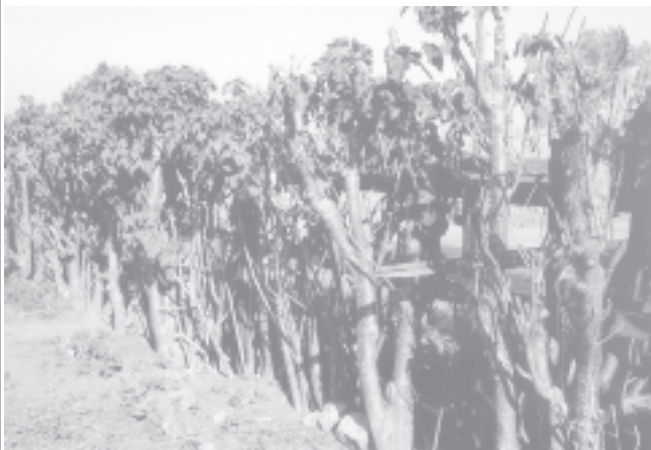
Physic nut plants in Lashio.

Myanmar has tested that oil obtained by milling physic nut seeds can be filtered through a cloth. And without being mixed with any other liquid, physic nut oil can be used directly in place of diesel to operate various types of machinery.