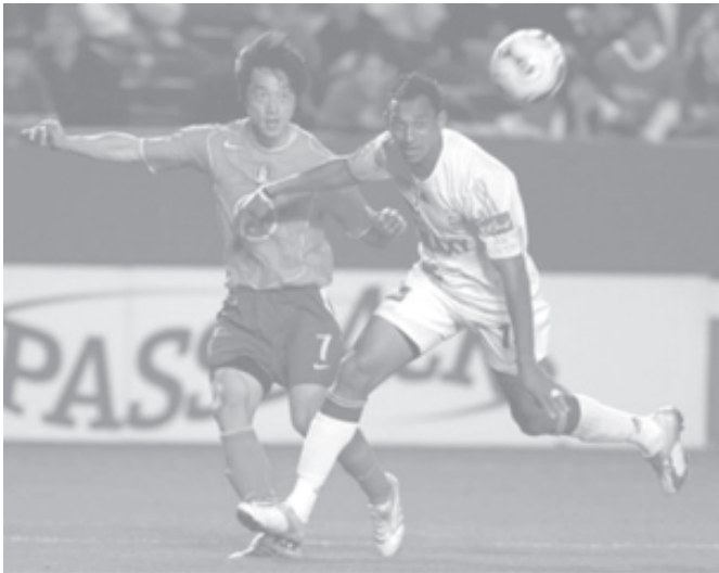
South Korea's Nam-Il Kim, left, and Los Angeles Galaxy's Tyrone Marshall chase down the ball during the second half of an exhibition soccer game on 8 Feb, 2006, in Los Angeles. South Korea won 2-0.