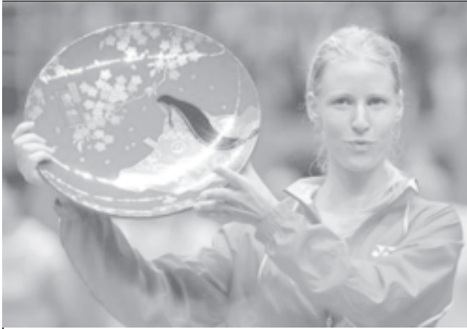
Russia's Elena Dementieva raises her winner's plate after the Pan Pacific Open tennis tournament final match against former world number one Martina Hingis of Switzerland in Tokyo, on 5 Feb, 2006.