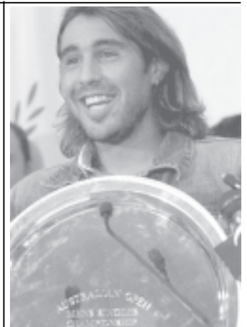
Cypriot tennis player Marcos Baghdatis holds his trophy from the Australian Open during a press conference at Larnaca international airport 45 kilometers (28 miles) south of capital Nicosia, Cyprus, on 4 Feb, 2006.