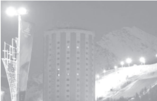
A night view of the Olympic ski alpine slalom course for the upcoming Torino 2006 Winter Olympic Games in Sestriere, Italy, on 3 Feb, 2006. The Games will be held from 10-26 Feb, 2006.