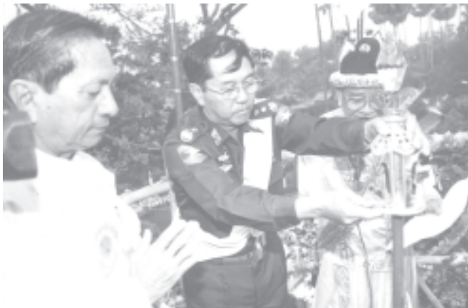
Lt-Gen Myint Swe of Ministry of Defence fixes Seinbudaw atop Aung Min Aung Pagoda.