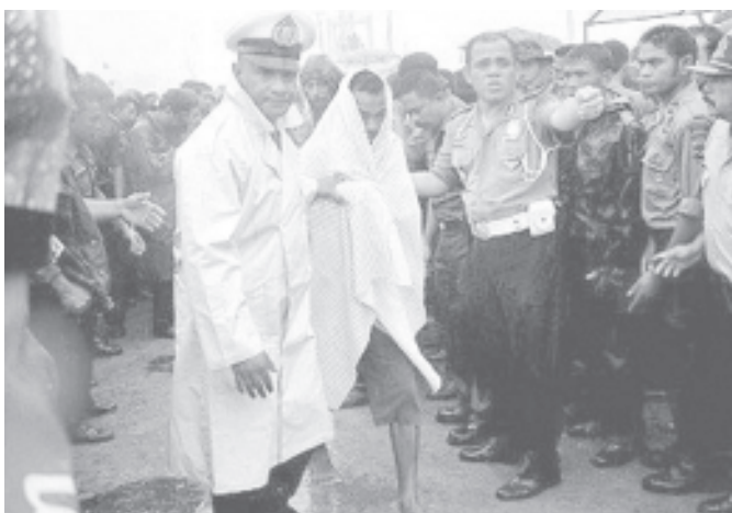
Rescuers escort a ferry accident survivor in Kupang, the capital of the western half of Timor island recently.