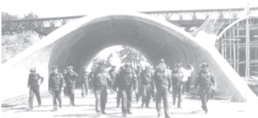
Secretary-1 Lt-Gen Thein Sein inspects underpass under construction.