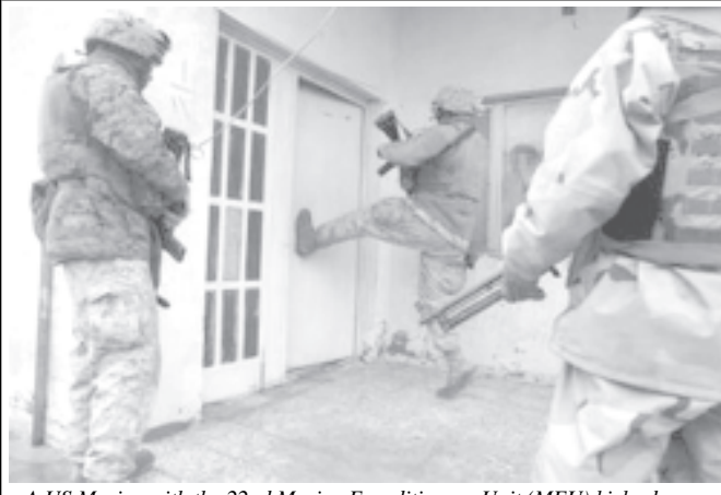
A US Marine with the 22nd Marine Expeditionary Unit (MEU) kicks down a door as they search houses near the western Iraq town of Hit, on 3 Feb, 2006.

The tremor was caused by the lithosphere's friction, he said, adding that it was not dangerous for people as it was not powerful. — MNA/Xinhua