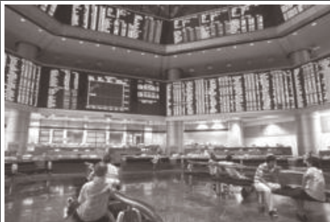
Investors study shares prices during the morning trading at RHB private stock market gallery in Kuala Lumpur, on 3 Feb, 2006.