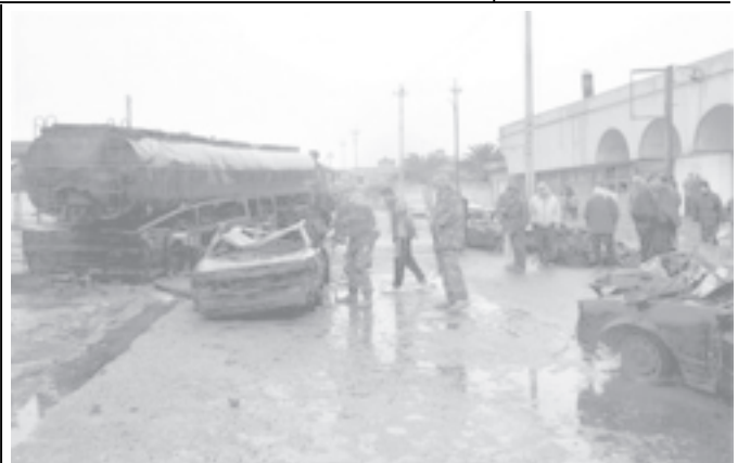
A US military patrol inspects the damage from a car bomb, on 3 Feb, 2006, in eastern Baghdad, Iraq.