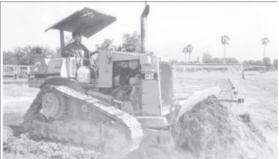
Secretary-1 Lt-Gen Thein Sein inspects demonstration of test run of a bulldozer with the use of physic nut oil at the farm of MCDC on 3-2-2006. (News Reported) — MNA