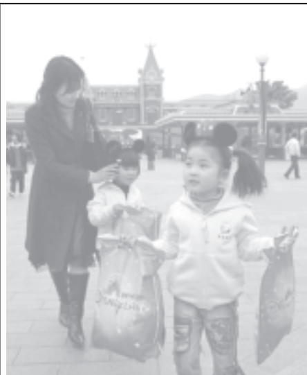
Visitors from China's eastern Zhejiang Province leave Hong Kong Disneyland on 4 Feb, 2006, after a tour of the entertainment theme park.

Vietnam's demand for electricity is estimated at 53 billion kilowatt hours this year, up around 17 per cent against last year. Now, 96 per cent of communes in Vietnam have access to the national power grid, the EVN said.