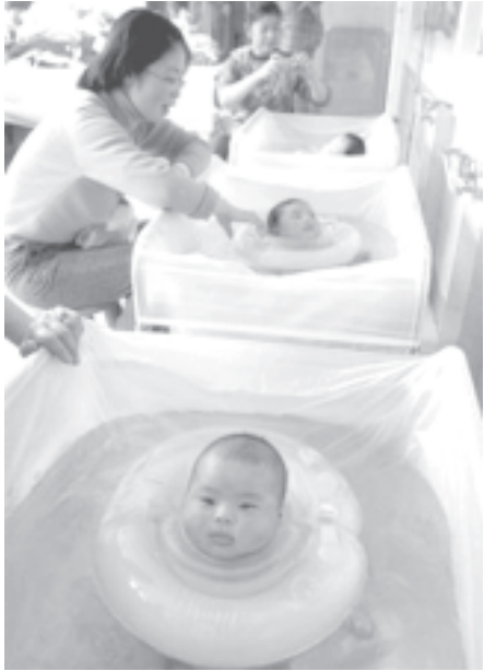
In this photo released by China's Xinhua news agency, babies have the swimming training at a Maternal and Infantile Health Care Center in Suzhou, east China's Jiangsu Province, on 3 Feb, 2006.