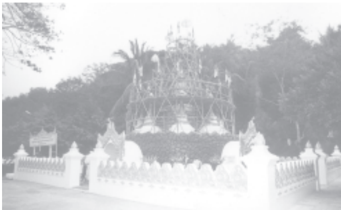
The Htidaw hoisting of Aung Min Aung Pagoda in progress.