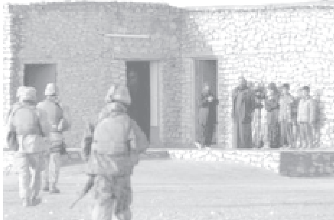
An Iraqi family waits outside for US Marines from the 22nd Marine Expeditionary Unit (MEU) and Iraqi soldiers to search their home during an operation in the village of Abu Rayat, 25 km (16 miles) southeast of the western Iraq town of Hit, on 4 Feb, 2006.

The Seychelles military has been called in to provide personnel and transport and help authorities clear areas prone to mosquito-breeding such as stagnant pools of water and to spray areas where cases of the viral infection have been found.