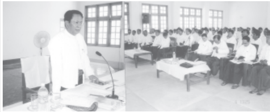
Minister U Aung Thuang meets USDA members in Mandalay.—INDUSTRY-1

After the ceremony, Minister U Aung Thuang inspected 1,000 cuttings and 2,300 physic nut saplings. In the afternoon, U Aung Thuang met secretaries and executives of Mandalay Division, Districts and 31 Township USDAs.—MNA