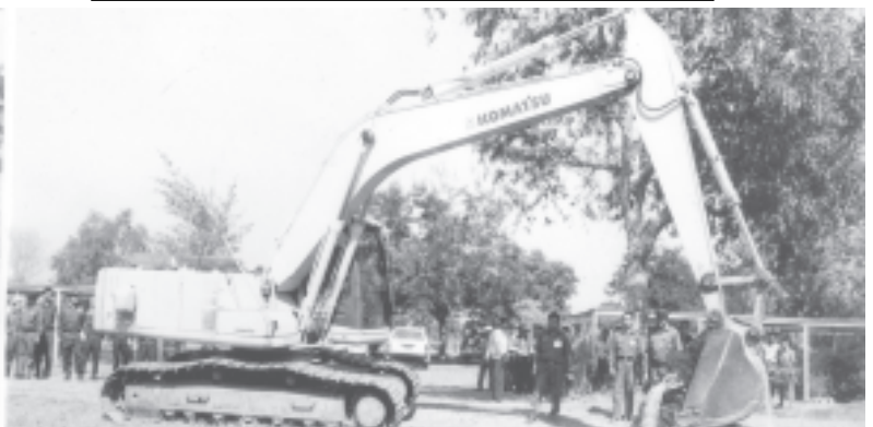
Secretary-1 Lt-Gen Thein Sein inspects demonstration of test run of an excavator with the use of physic nut oil at No 1 farm of MCDC on 3-2-2006.(News reported)—MNA