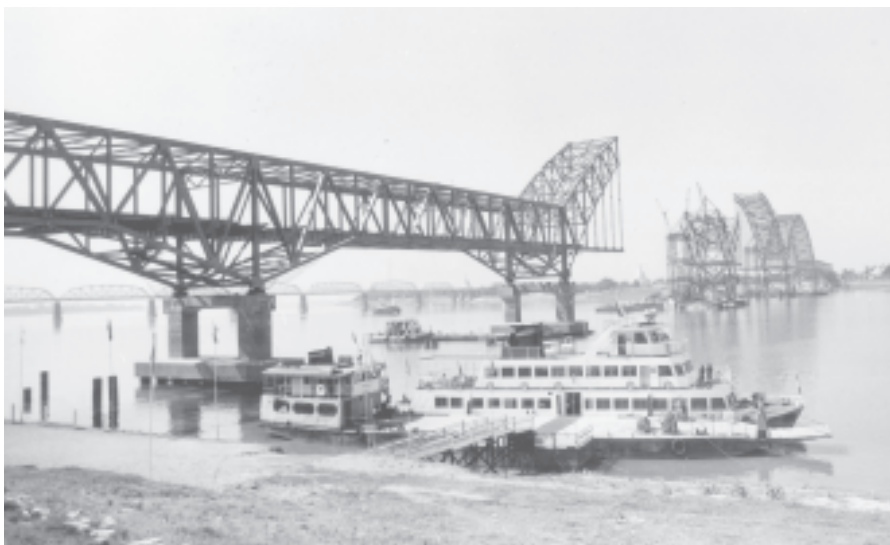
Progress in construction of Ayeyawady Bridge (Yadanabon). (News on page 1)