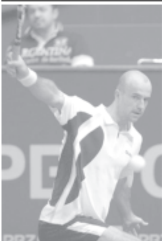
Ivan Ljubicic of Croatia eyes the ball during the quarter final match with Mikhail Youzhny of Russia at the ATP Zagreb Tennis Tournament in Zagreb, Croatia, on 3 Feb, 2006.—INTERNET

Malaga's Portuguese defender Litos headed the home side in front from an Antonio Hidalgo free kick after 30 minutes, but fellow strugglers Bilbao levelled the scores through Aritz Aduriz just before the break. —MNA/Reuters