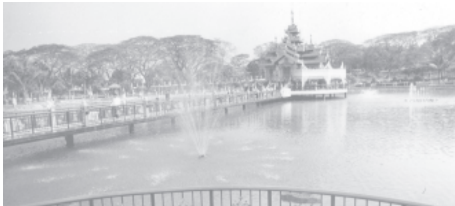
Newly-renovated Shin Upagutta Mingala Lake.