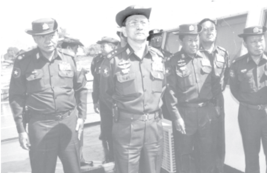
Secretary-1 Lt-Gen Thein Sein inspects construction of Ayeyawady Bridge (Yadanabon).