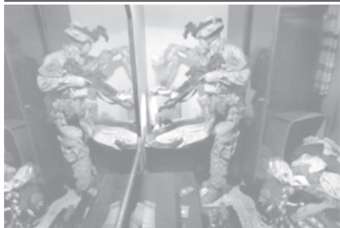
An American soldier searches a house during a raid in Ramadi, 115 kilometers (70 miles) west of Baghdad, Iraq, on 4 Feb, 2006. Men from the US Army's 101st Airborne Division detained ten Iraqis during a series of raids.