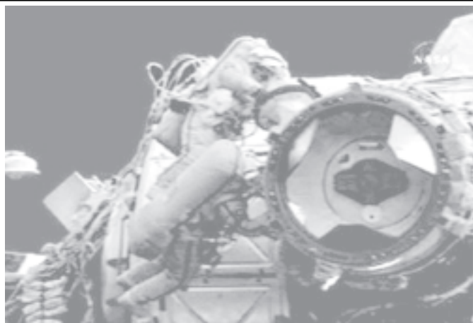
Astronauts Bill McArthur of the US and Valery Tokarev of Russia are seen during their spacewalk from the International Space Station on 3 Feb, 2006.