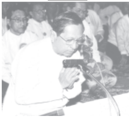
Minister for Religious Affairs Brig-Gen Thura Myint Maung.