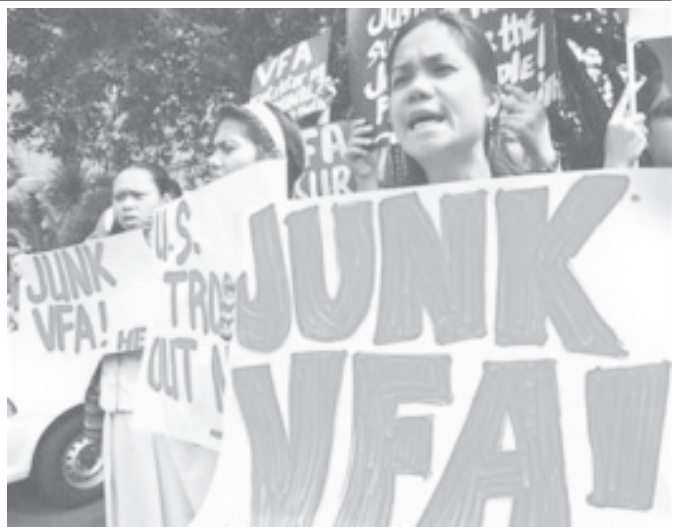
Protesters display their placards as they shout slogans during a rally commemorating the Filipino-American war on 3 Feb, 2006 in front of the US Embassy in Manila, Philippines.