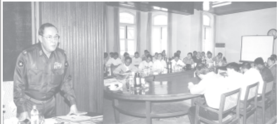
Minister Brig-Gen Thein Zaw addresses the coordination meeting on Ngwe Hsaung Beach Development Project (Phase-II) (Hotel Project). — COMMUNICATIONS

YANGON, 3 Feb — Minister for Communications, Posts and Telegraphs and for Hotels and Tourism Brig-Gen Thein Zaw attended the coordination meeting on Ngwe Hsaung Beach Development Project (Phase-II) (Hotel Project) at the Ministry of CPT this morning.