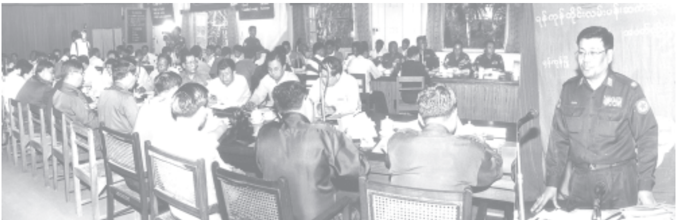
Commander Brig-Gen Hla Htay Win speaking at the meeting of Yangon Division Supervisory Committee for Ensuring Smooth and Secure Transport. — MNA

Emergence of the State Constitution is the duty of all citizens of Myanmar Naing-Ngan.