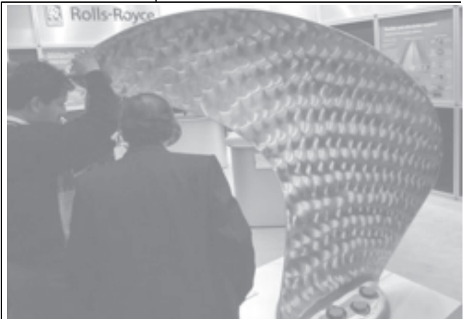
Visitors look at the nickel Aluminum and bronze made propeller of a ship at the Rolls-Royce stall during Defence Expo 2006 in New Delhi, India, on 2 Feb, 2006.