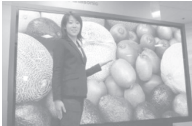
Japan's Matsushita Electric Industrial Co Ltd official presents its world's largest 103-inch plasma display panel in Tokyo, on 2 Feb, 2006.