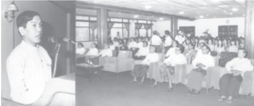
Minister for Foreign Affairs U Nyan Win delivers an address at the ceremony to conclude Basic Diplomatic Skills Course No 14/2005. — MNA