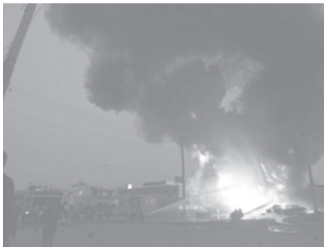
Firemen try to extinguish a fire at a gas station after a bomb attack in Baghdad, on 2 Feb, 2006.