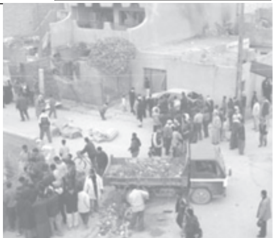
Residents gather at the scene of a US military helicopter attack on homes on early Thursday, 2 Feb, 2006 in the Sadr City area of Baghdad, Iraq.

The carbon brakes will be available for deliveries starting in early 2008. —MNA/Xinhua