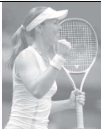
Former world number one Martina Hingis of Switzerland celebrates her win over Nathalie Dechy of France during their second round match at the Pan Pacific Open tennis tournament in Tokyo on 2 Feb, 2006.

Huntelaar sealed the win one minute before time when he struck from close range for his first goal for Ajax and he set up Urby Emanuelson for the third in injury time.