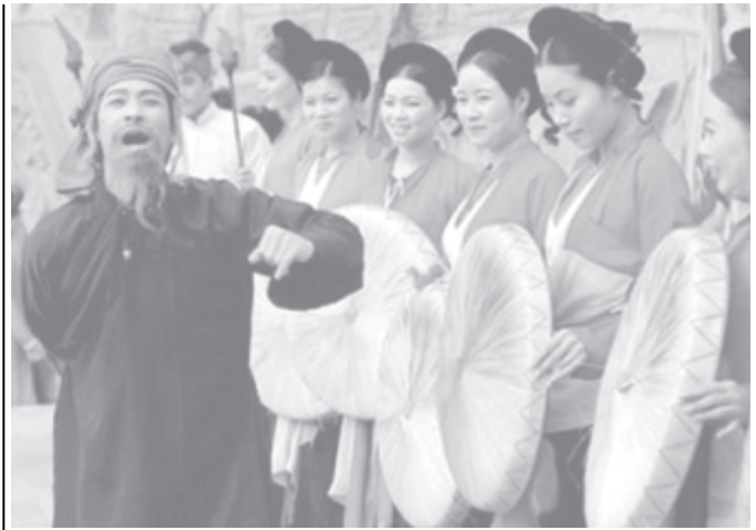
Vietnamese performers take part in a traditional spring festival in the Dong Da district of Hanoi on 2 Feb, 2006. The festivals are celebrated throughout northern Vietnam after the Lunar New Year and brings a respite from the dreary winter months.

Britain has about 8,000 troops in Iraq, based in and around the southern port of Basra.