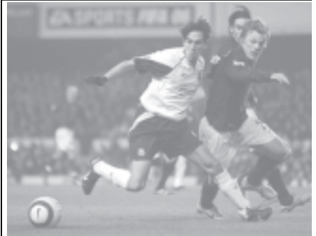
West Ham United's Yossi Benayoun, left, from Israel, controls the ball in front of an Arsenal's player during their English Premier League soccer match at the Highbury stadium in London, on 1 Feb, 2006. West Ham won the match 3-2.