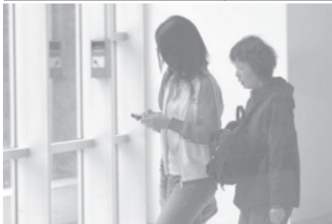
A woman from Hong Kong (R), who was treated for injuries from the tourist bus crash, leaves a hospital while accompanied by a relative in Cairo on 2 Feb, 2006.