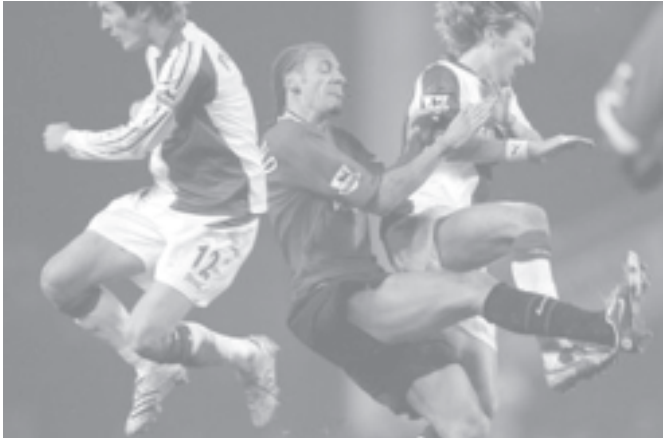
Manchester United's Rio Ferdinand, centre, fouls Blackburn's Robbie Savage, right earning himself a second yellow card and a sending off during their English Premier League soccer match at Ewood Park Stadium, Blackburn, England, on 1 Feb, 2006.