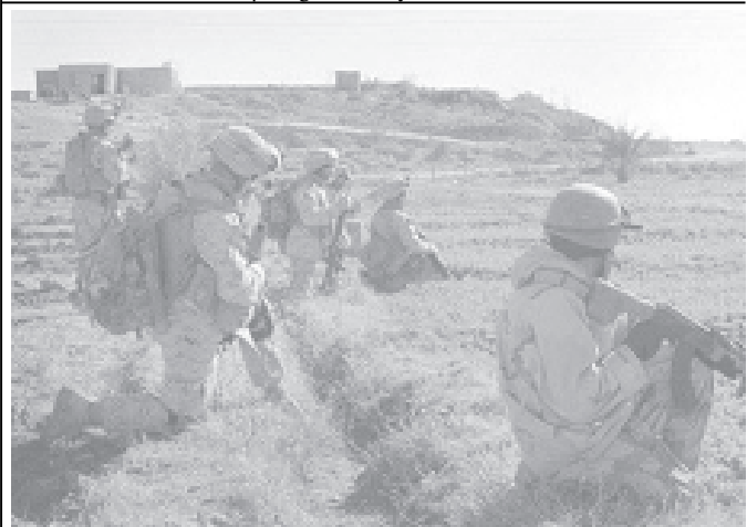
US Marines and Iraqi soldiers searching for weapons caches and guerillas in the city of Hit in Iraq's western Anbar Province recently.

"Every compatriot from Hong Kong is a member of the great family of China," he said.