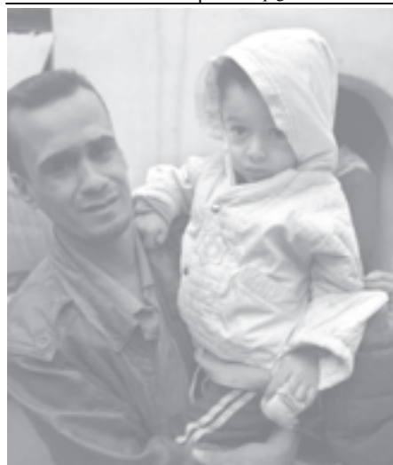
A family friend holds a young girl wounded from a US military helicopter attack on a home on early Thursday, 2 Feb, 2006, in the Sadr City area of Baghdad, Iraq.