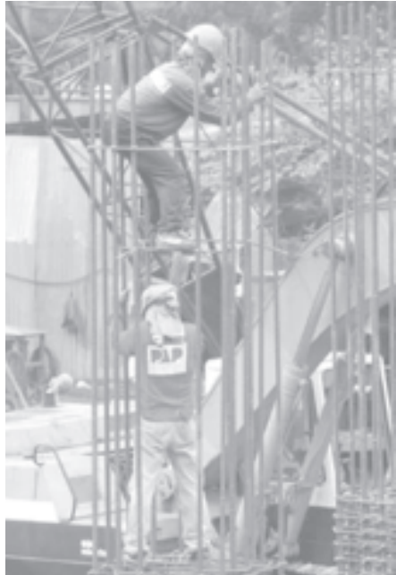
Filipino construction workers work on a residential condominium building in Manila's Makati financial district, Philippines on 2 Feb, 2006. —INTERNET

Noticeably absent from the speech was a short-term plan to ease high gasoline and natural-gas prices, or to sharply raise government fuel standards for cars and trucks—which environmentalists say is the only way to significantly reduce gasoline use and oil imports. "Only one measure has ever stopped the growth of foreign oil imports and helped the Big Three automakers stave off foreign competition: increased fuel efficiency standards for American-made cars," Philip Clapp, President of the National Environmental Trust, said in response to Bush's speech.—MNA/Reuters