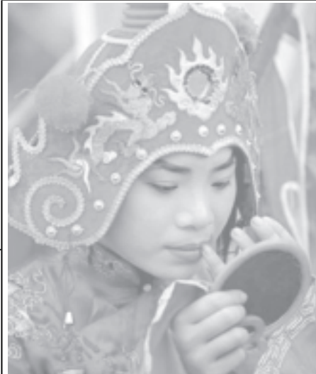
A Vietnamese teenager fixes her makeup prior to taking part in a traditional spring festival in the Dong Da district of Hanoi on 2 Feb, 2006.

Calmy-Rey also reiterated that Switzerland sticks to one-China policy.— MNA/Xinhua