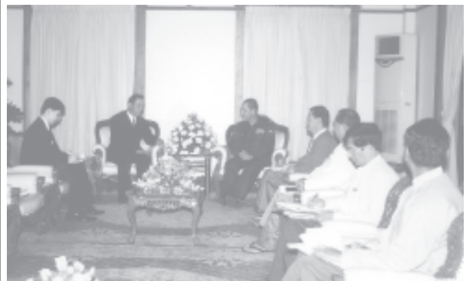
MINISTER MEETS GUEST: Ambassador of the People's Republic of China to the Union of Myanmar Mr Guan Mu called on Minister for Communications, Posts and Telegraphs and for Hotels and Tourism Brig-Gen Thein Zaw at his office on 3-2-2006. The photo shows the minister receives the Chinese Ambassador.