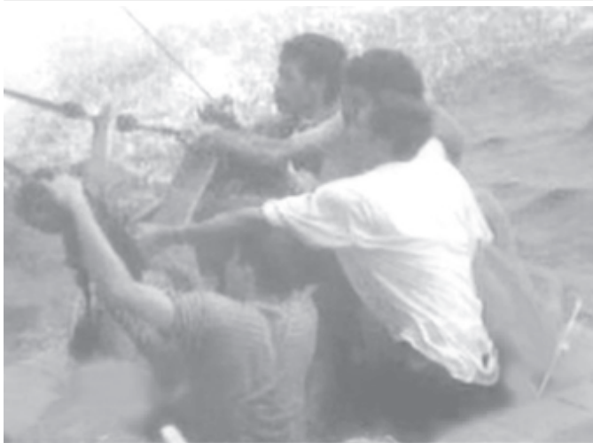
Survivors of a ferry sinking cling to a rope thrown to them by rescuers on 1 Feb, 2006, in the waters off of Kupang, Indonesia.

Li also held talks with UN Secretary General Kofi Annan on Tuesday on issues ranging from Afghanistan, Iran, the Middle East to the UN reform.