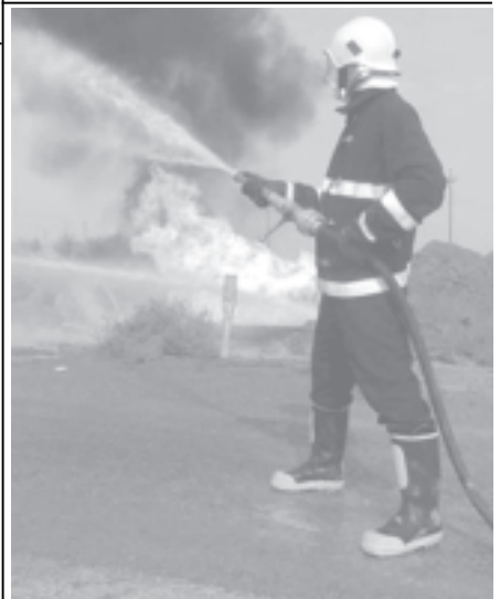
Iraqi firefighters try to douse flames from an oil pipeline fire, on 1 Feb, 2006, about 60 kilometres (40 miles) south of Baghdad, Iraq.