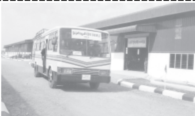
A bus running on bio-diesel.