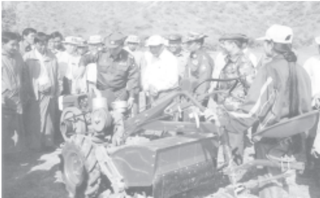
Preparations being made for a demonstration of operating a power-tiller with the use of bio-diesel.

In meeting with officials from Kachin State, Sagaing, Bago, Magway and Mandalay Divisions, Shan State (North) and Shan State (South) on 15 December 2005 in PyinOoLwin, Head of State Senior General Than Shwe gave guidance on putting 500,000 acres under physic nut plants in each state or division in three years, totalling seven million acres across the nation.