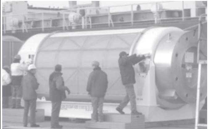
A container of vitrified nuclear waste is prepared for loading onto the cargo ship Pacific Sandpiper belonging to the British company PNTL (Pacific Nuclear Transport Limited) at the French port of Cherbourg, on 1 Feb, 2006. This is the 11th of 12 controversial voyages returning processed Japanese nuclear waste to Rokkasho-Mura in Japan.