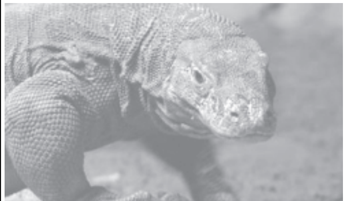
A 2m (6.6 feet) Komodo dragon explores its new surroundings at the national zoo in the South African capital of Pretoria on 31 Jan, 2006.