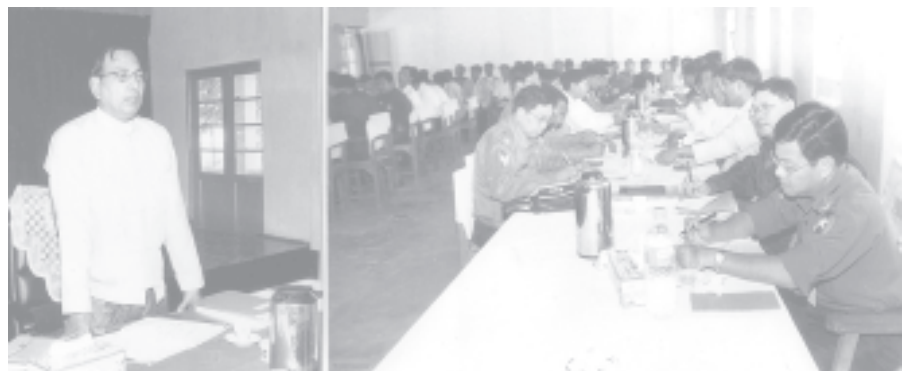
Deputy Minister Thura U Thaug Lwin addresses the meeting of Accommodation and Reception Sub-committee for organizing the 59th Anniversary Union Day. — MNA

Deputy Minister for Rail Transportation Thura U Thaug Lwin discussed with officials of the work committees tasks being carried out for the Union Day celebration. The meeting ended with concluding remarks by Chairman Thura U Thaug Lwin. — MNA