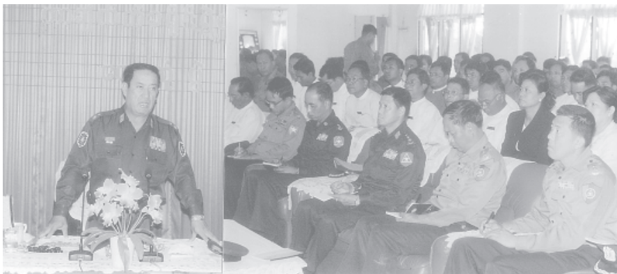
Minister Maj-Gen Maung Oo delivers an address in meeting with officials in Tachilek.