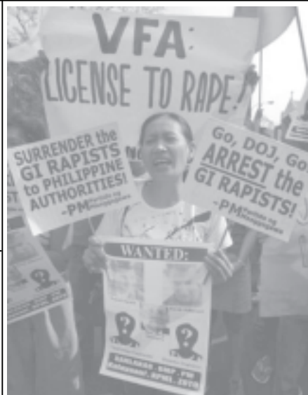
Filipino protesters display anti-US placards calling for the surrender of four US Marines accused of raping a Filipino woman during a rally in Manila on 1 Feb, 2006.