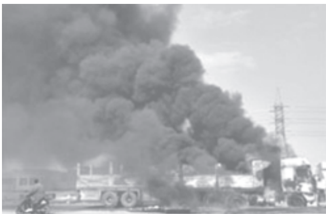
A scooter passes a commercial truck burning after an attack by unknown gunmen on 1 Feb, 2006 in Baghdad, Iraq.