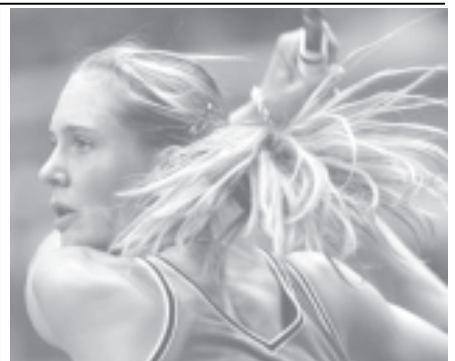
Nicole Vaidisova of the Czech Republic makes a return to Japan's Saori Obata during their second round match at the Pan Pacific Open tennis tournament in Tokyo on 1 Feb, 2006.