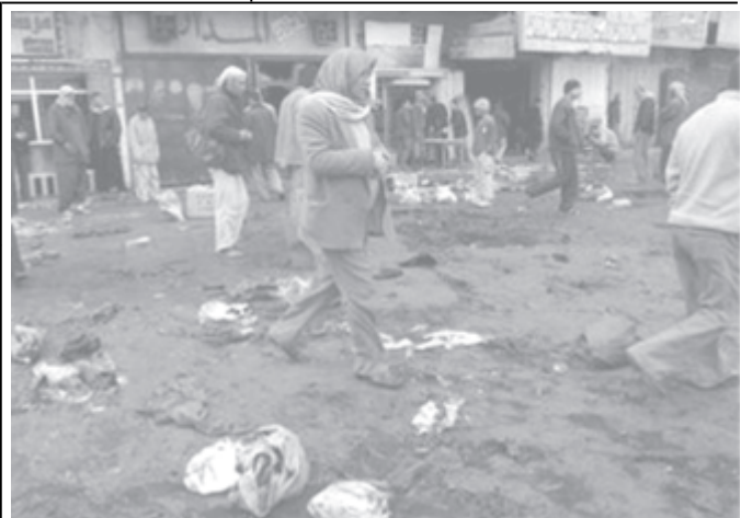
People walk among the debris of a suicide bomb attack in Baghdad, on 1 Feb, 2006.

The kidnapers have demanded Germany close its Embassy in Baghdad and stop cooperation with the Iraqi Government. — MNA/Xinhua