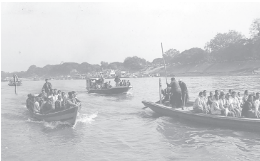
Diesel engine boats running with physic nut oil at demonstration near Gawwin Jetty in Mandalay.