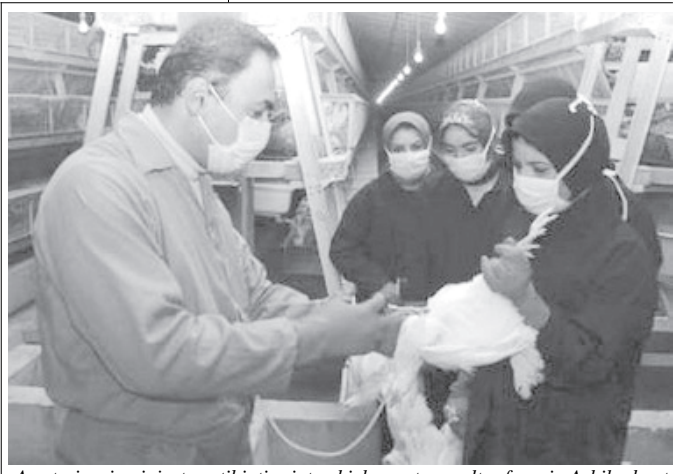
A veterinarian injects antibiotics into chickens at a poultry farm in Arbil, about 350 km (220 miles) north of Baghdad on 1 Feb, 2006.