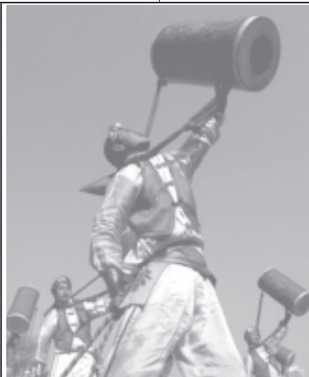
Chinese artistes perform at the Dongfanghong Square, in Lanzhou, western China's Gansu Province, as part of the Spring Festival celebrations on 1 Feb, 2006.