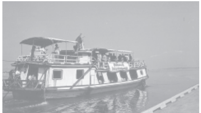
A watercraft installed with diesel engine running with physic nut oil in Ayeyawady River near Gawwin Jetty in Mandalay.

Emergence of the State Constitution is the duty of all citizens of Myanmar Naing-Ngan.