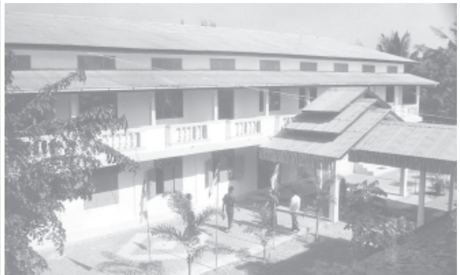
Refectory of Thirigonwai Dhamma Beikman Monastery in No 1 War Veterans Model Village (Ledaunkkan) in Dagon Myothit (South) Township. MNA (News Reported)