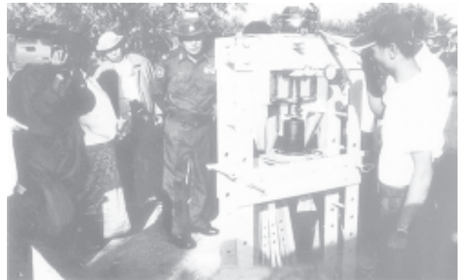
Two men milling physic nut seeds to produce bio-diesel.

In some rural areas, local people have come to use bio-diesel to light bio-diesel lanterns and stoves. Besides, generators can be run on a broader scale with the use of bio-diesel. Tests have showed that a vehicle consumes a gallon of bio-diesel to run about 23 miles.