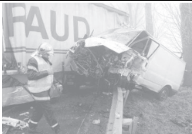
A French firefighter checks a van after a pile up accident due to the fog on the Lille-Dunkerque motorway near Meteren, northern France on 1 Feb, 2006.