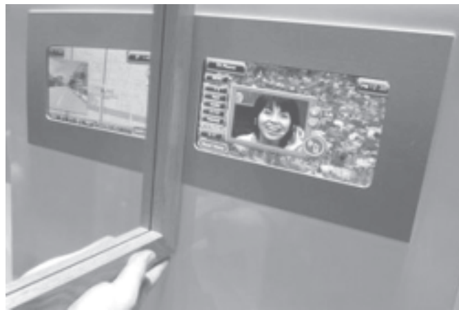
A technician at the Sharp booth holds a mirror to demonstrate a two-way LCD screen being sold only in Japan, at the 2006 Consumer Electronics Show in Las Vegas, on 5 Jan, 2006.