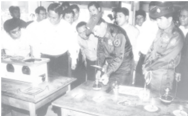
Lanterns and oil lamps can be lit with the use of bio-diesel.

If the crop is harvested at the age of six years, an acre of physic nut plants can produce 248 viss of oil, from which 100 gallons of bio-diesel plus 655 viss of propeller cakes can be produced. If so, a state or division can obtain 124 million viss of oil or 50 million gallons of bio-diesel plus more than 327 million viss of propeller cakes.