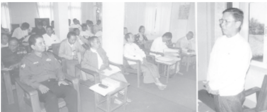
Coordination meeting to organize the 5th Buddha Pujaniya of Lawka Chantha Abhaya Labha Muni Buddha Image in progress.

YANGON, 2 Feb — The coordination meeting to organize the 5th Buddha Pujaniya of Lawka Chantha Abhaya Labha Muni Buddha Image on Mindhamma Hill in Insein Township was held at the meeting hall