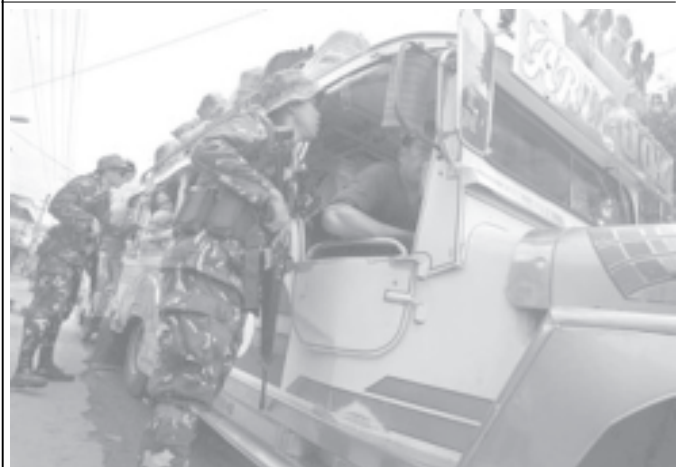
Philippine soldiers inspect a passenger mini-bus locally called Jeepney at a checkpoint in Cotabato City, Maguindanao Province, southern Philippines on 19 Jan, 2006.