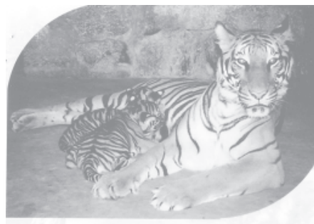
Tiger (Panthera tigris)