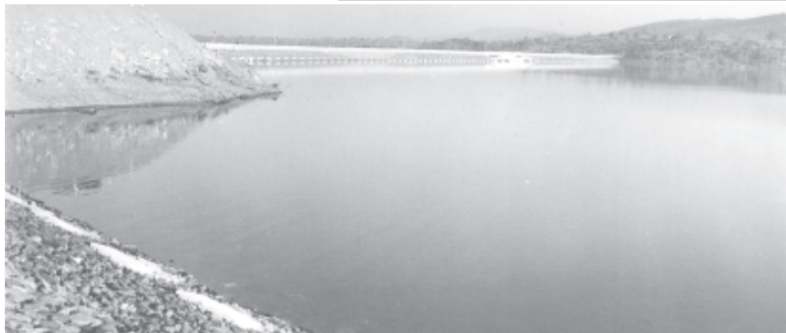
Newly-inaugurated Yagyi Dam in Kyaukpadaung Township, Mandalay Division. — MNA

Since 2004-2005, Mandalay Division has take steps to increase acreage of monsoon paddy cultivation up to 1 million acres during three years. As Yagyi Dam will supply water to Kyatmauktaung Dam, acreage of crops plantations will jump to 22,000 acres from 5,800.