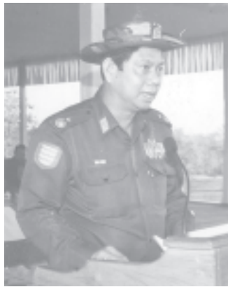
Minister Maj-Gen Htay Oo speaking at opening ceremony of Yagyi Dam. MNA

water storage capacity is 4400 acre feet and it can irrigate 853 acres of land. —MNA