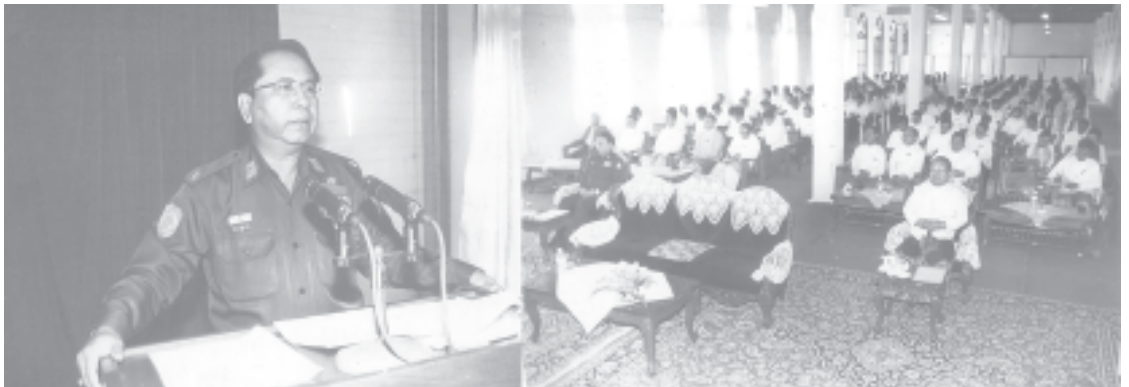
Minister Brig-Gen Kyaw Hsan delivers a speech at the 15th Anniversary of Information and Public Relations Department.

He said it is not the time for the service personnel