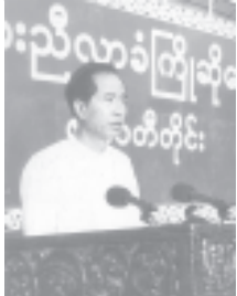
Meeting Chairman U Soe Myint.

unity and ensuring development of all regions. While formulating the new State Constitution, the National Convention is studying previous constitutions of the nation. Due to the weak points of the past constitutions, the government and the people faced difficulties.