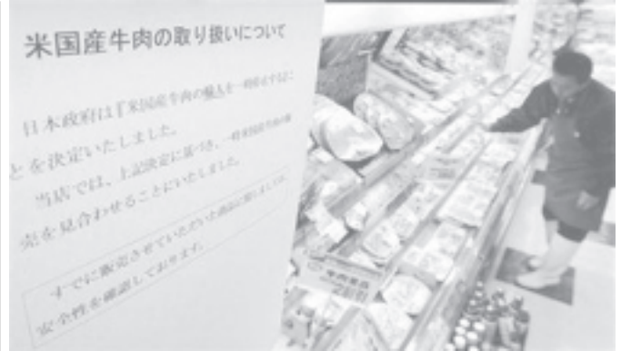
A sign announcing voluntary restraint in selling US beef is posted at a supermarket in Tokyo on 21 Jan, 2006. Japan will reimpose a ban on all US beef imports just a month after lifting it, following the discovery of spinal material in a recent shipment which prompted mad cow disease concerns.—INTERNET