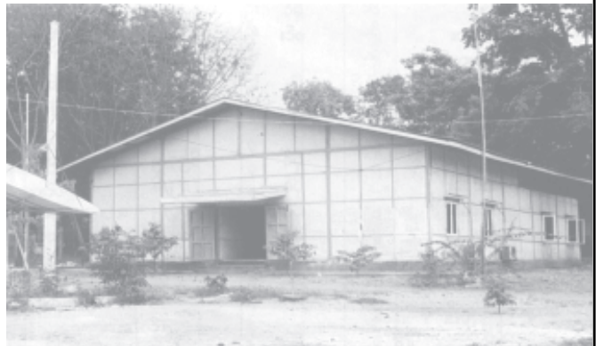
Computer Network building in Magway Sub-printing House.

As efforts are being made to enhance the media to cover the whole country in the time of the Tatmadaw government, the table is the tangible proof of these efforts.