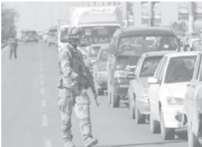
Iraqi soldiers conduct security checks at a highway in Baghdad on 21 Jan, 2006.