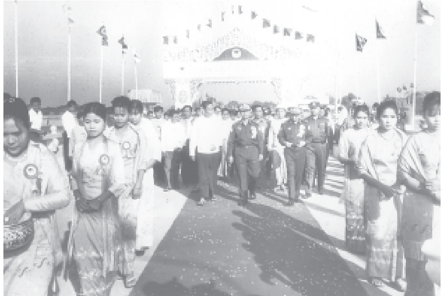
Commander Lt-Gen Myint Swe, Minister for Construction Maj-Gen Saw Tun and Mayor Brig-Gen Aung Thein Lin passing through newly-opened Rakhinegyaung Bridge.

Speaking on the occasion, the commander said that Rakhinegyaung Bridge above 180 feet is the 25th bridge in Yangon Division in the time of the Tatmadaw (See page 9)