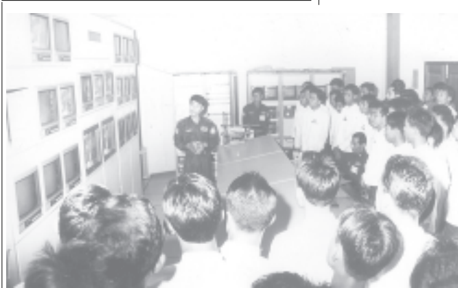
UDNR trainees visit Myawady TV Broadcasting Unit.