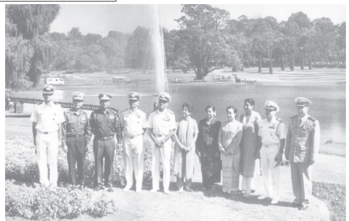
The goodwill delegation of Indian Navy at National Kandawgyi Gardens in PyinOoLwin.