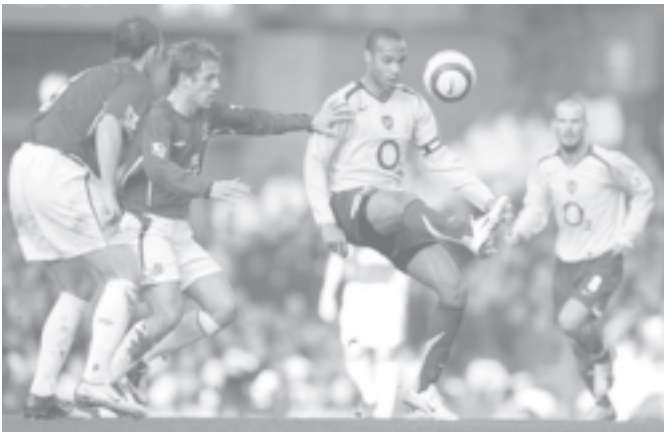
Everton's Phil Neville, second from left, tries to keep Arsenal's Thierry Henry at arms length during their English Premier League soccer match at Goodison Park Stadium, Liverpool, England, on 21 Jan, 2006. Everton won the match 1-0.