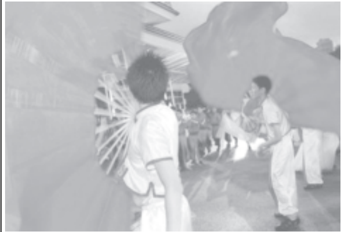
Street performers are seen carrying giant fans during a street performance rehearsal, on 21 Jan, 2006 in Singapore where Chinese locals will celebrate the Chinese New Year at the end of January. During that time, street performances and carnivals will be held as part of the month long celebrations.

Born several years later than the other two international standards for 3G, namely WCDMA and CDMA2000, China's home-grown standard encountered great difficulties on its way of development.