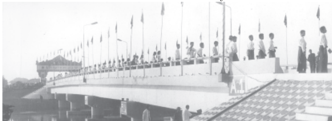
The opening ceremony of Rakhinegyaung Bridge in progress in Twantay Township.