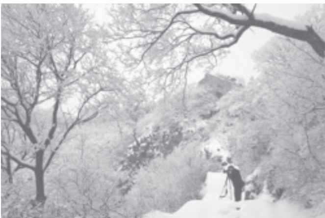
A photographer shoots a snow scene at Shennong Mountain in Qinyang, China's Henan Province on 20 Jan, 2006.

producers and traders, the Unyathani Industrial Estate has a logistic advantage since it is located near Bangkok's new Suvarnabhumi Airport, and is convenient for visitors to observe the production process and purchase.