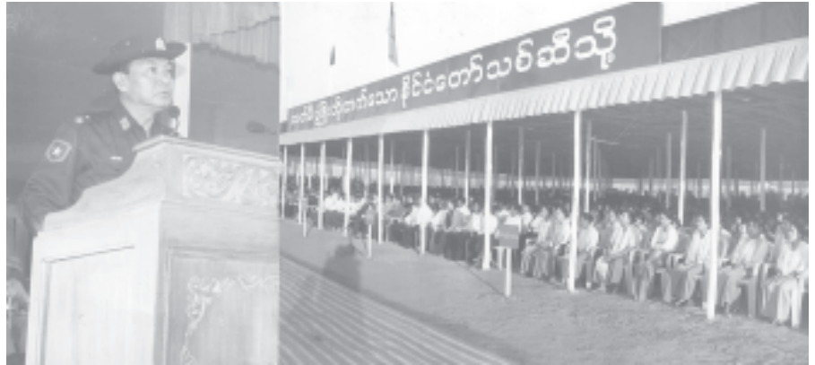
Commander Maj-Gen Khin Zaw speaking at opening ceremony of Yagyi Dam in Kyaukpadaung Township.

Next, Minister Maj-Gen Htay Oo made a speech, saying Yagyi Dam is the main one out of the five dams built for Kyatmauktaung supporting dam project. So far the State has built 182 dams across the nation to benefit 2.45 million acres of land. The government is taking measures to boost production of 10 major crops. Cultivation of industrial crops such as rubber, pepper, coffee, tea, onion and ginger is being carried out. In addition, steps are being taken for producing bio-diesel by