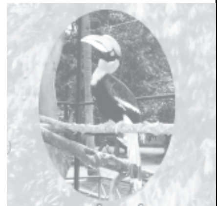
Great Hornbill (Buceros bicornis)

Now, the area of present Yangon Zoological Garden has touched 58.25 acres. In the zoo are 61 species of mammals including elephant, tiger,