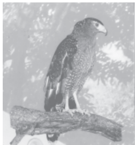
Crested Serpent Eagle (Spilormis cheela)

a bird house, a house to keep animals without