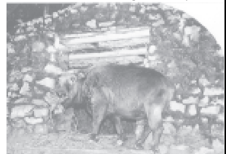
Takin (Budorcas taxicolor)

Animal performance shows are staged on public holidays in the