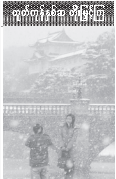
A Japanese man takes a photograph near the snow-blanketed Imperial Palace in Tokyo on 21 Jan, 2006.