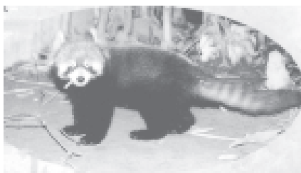
Red Panda (Ailurus fulgens)

The upgrading of Yangon Kandawgyi Gardens and the Zoo coincides with the centenary of the Yangon Zoological Gardens. According to the records, Yangon Zoo was