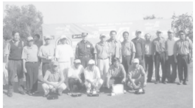
Winners and president of MPGA and MGF seen after prize-distribution ceremony.