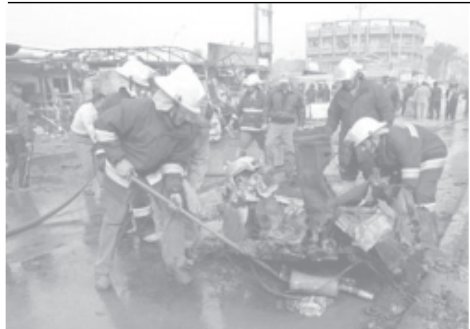
Iraqi firemen remove wreckage of a car from the road after a car bomb attack in the Shi'ite Shaab district in Baghdad on 21 Jan, 2006.

The cold snap has hit public transport with many of Moscow's trolley-buses, that rely on an overhead cable, out of action. With many cars refusing to start, passengers on the city's underground railway system (metro) have swelled alarmingly in numbers.