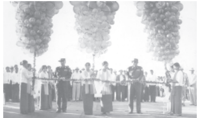
Commander Maj-Gen Khin Zaw and Minister Maj-Gen Htay Oo inaugurate Yagyi Dam in Kyaukpadaung Township.