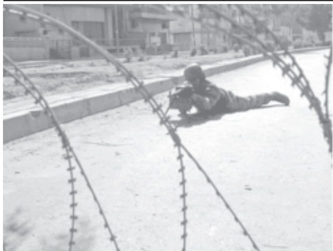
An Iraqi soldier takes his position as soldiers conduct security checks at a highway in Baghdad on 21 Jan, 2006.

An Associated Press count shows at least 22-hundred-24 members of the US military have died since the Iraq war began in March 2003. — Internet