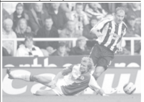
Newcastle United's Alan Shearer, right, controls the ball past Blackburn Rovers' Michael Gray during their English Premier League soccer match at St James' Park, Newcastle, England, on 21 Jan, 2006.