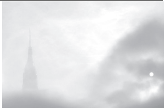
Fog swirls around the Empire State Building at sunrise on 13 Jan, 2006 in New York City. The New York area is experiencing unseasonably warm temperatures this week, with highs on Friday expected to reach 52 degrees Fahrenheit (11 Celcius).—INTERNET