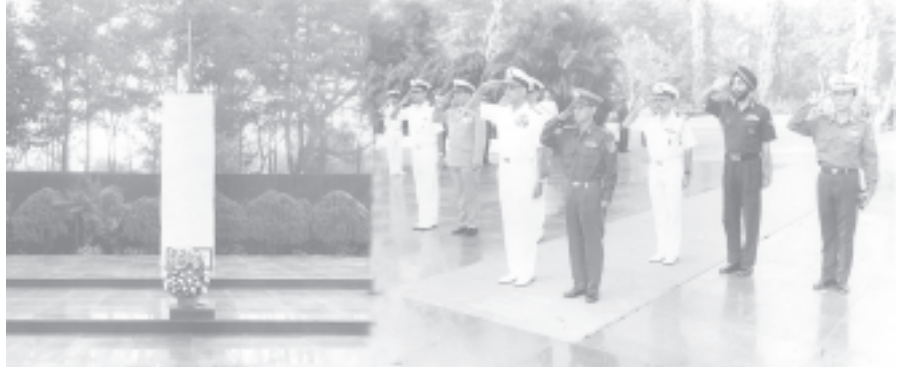
The Indian Admiral and party pay tribute to fallen heroes at Memorial to Fallen Heroes on Arzani Road.