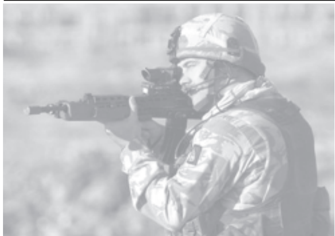
A British soldier scans the landscape through his gun sight as he secures the scene of a roadside attack, on 18 Jan, 2006, outside of the southern city of Basra, Iraq.

The accident occurred in Locotal, located in the central region of Cochabamba. The driver appeared to be exhausted and began steering poorly, taking the bus over the edge of a 100-metre precipice, said the report. The bus was travelling from Cochabamba to the neighbouring eastern region of Santa Cruz, according to ABI . — MNA/Xinhua