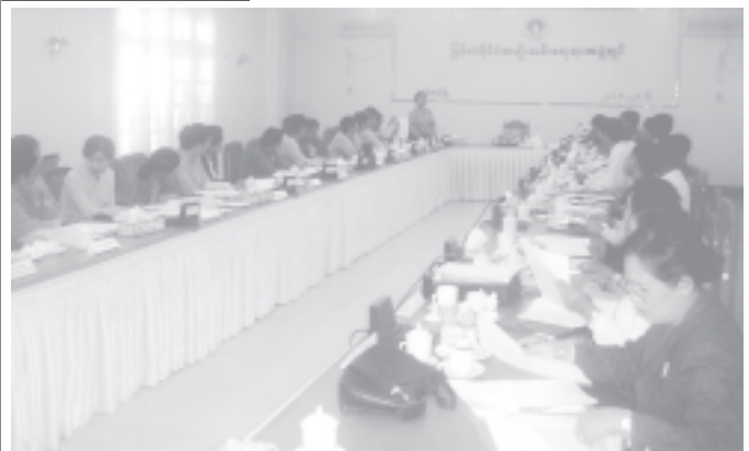
The coordination meeting of MWAFF Annual General Meeting Organizing Committee in progress.

Afterwards, those present reported on the future plan and the chairman of work committee gave necessary instructions. Next, the meeting ended with the concluding remarks by the chairman of work committee.— MNA