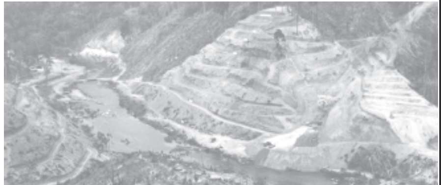
An aerial view of Ahtet Paunglaung Hydropower Project to be implemented on Paunglaung River near Kyitaung-Khawma Village, about 10 miles east of Pyinmana, Yamethin District, Mandalay Division.

The table shows systematic arrangements being made to supply power in the time of the Tatmadaw government.