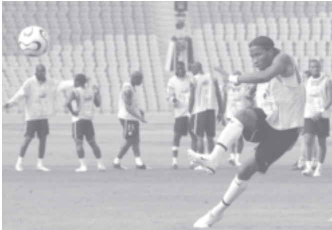
Chelsea star Didier Drogba, of Ivory Coast, shoots the ball during a training session at Cairo soccer stadium in Cairo, Egypt on 19 Jan, 2006 ahead of the opening session of the 2006 African Cup of Nations there on Friday.