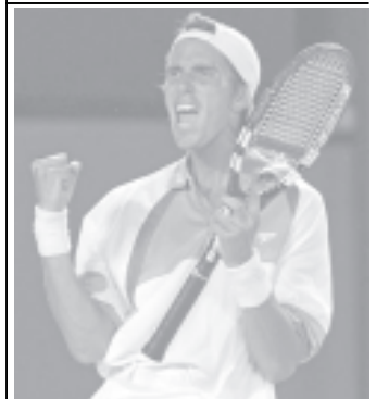
Juan Ignacio Chela of Argentina reacts after defeating Lleyton Hewitt of Australia during the Australian Open tennis tournament in Melbourne on 19 Jan, 2006.