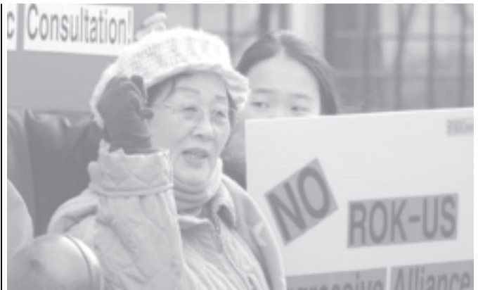
South Korean protesters shout slogans during an anti-US press conference against the inaugural meeting of a newly established high-level security forum between the two allies dubbed the 'Strategic Consultation for Allied Partnership.' in Seoul, on 19 Jan, 2006.