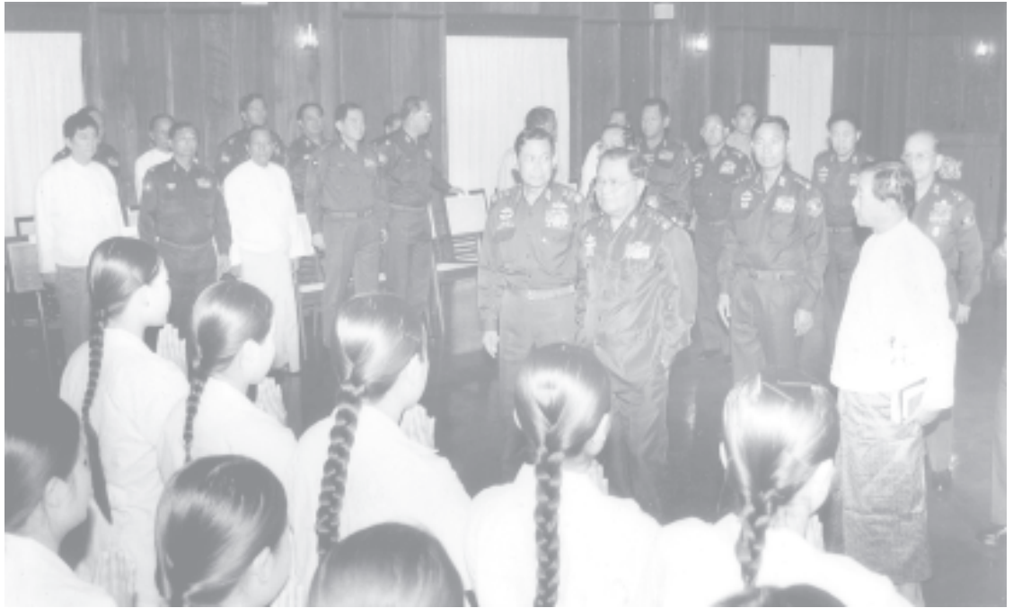
Senior General Than Shwe cordially greets trainees of No 37 Course (Bed) of UDNR.

In the past, far-flung areas had just a few relations with the interior regions of the nation. As a result, the majority of the youths in border areas were far from access to the opportunity of pursuing edu-