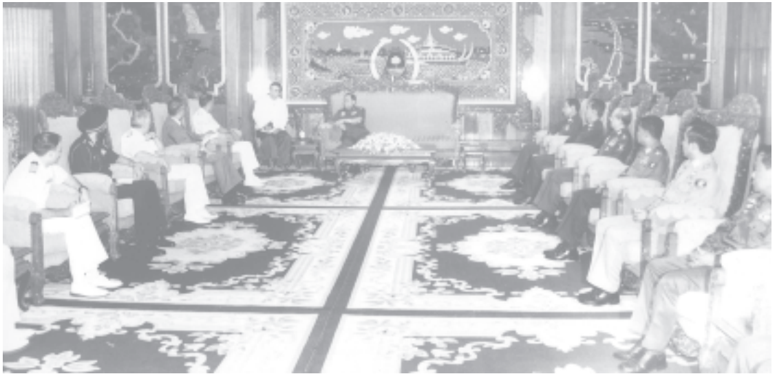
Senior General Than Shwe receives Chairman of Chiefs of Staff Committee (COSC) and Chief of Naval Staff Admiral Arun Prakash (PVSM, AVSM, VrC, VSM, ADC) and party of Indian Navy.

Also present at the call were Vice-Chairman of the State Peace and Development Council Deputy Commander-in-Chief of Defence Services Commander-in-Chief (Army) Vice-Senior General Maung Aye, Member of the State Peace and Development