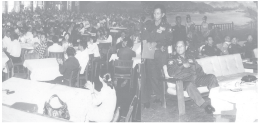
Lt-Gen Tin Aye of Ministry of Defence views UMEHL's Gems and Jade Sales.