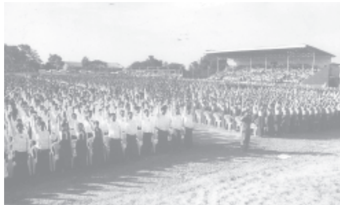
Those present at the mass meeting in Mawlamyine chanting slogans.

has realized all round developments such as health, education and economic sectors and established 18 industrial zones for national entrepreneurs. We have