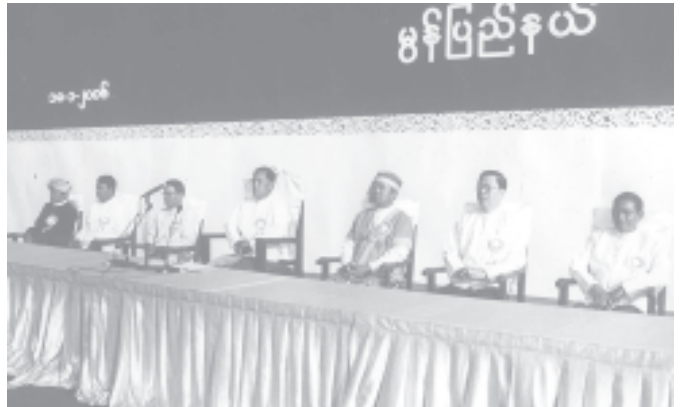
Panel of chairmen at the mass meeting in Mon State to support the National Convention.

only. All the national brethren want to enjoy fruitful results of peace and development.