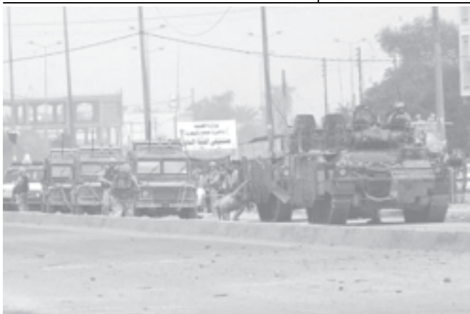
British soldiers inspect damage following a roadside bomb attack on their patrol, on 19 Jan, 2006, in the southern city of Basra, 550 kilometers (340 miles) southeast of Baghdad. —INTERNET

The targets of the attacks were not immediately clear, as there were no US or Iraqi security forces near the explosion sites, the source said. — MNA/Xinhua