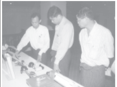
Visitors observe CCTV cameras being displayed at Digital World Seminar.