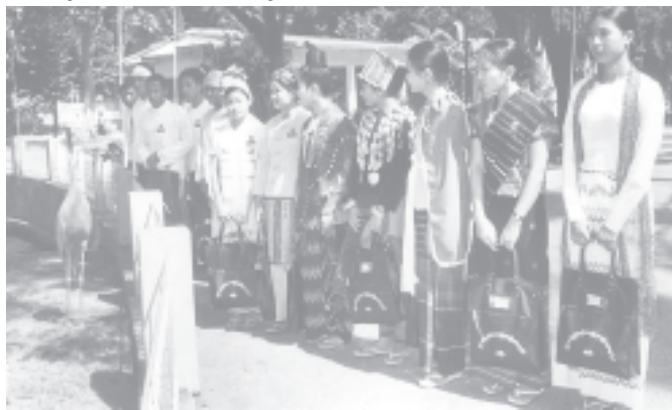
The trainees of No 37 Course (BE) of the University for Development of National Races visit the Zoological Garden (Yangon). — MNA

At Aquarium of Kandawgyi Natural Gardens, an official of Fisheries Department extended greetings to them and gave a briefing on the aquarium. Next, the trainees viewed round the gardens. — MNA