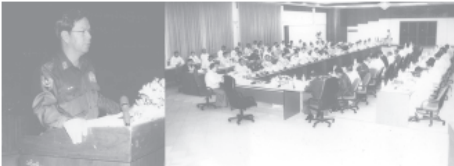
Minister Maj-Gen Hla Tun addresses meeting of Ministry of Finance and Revenue. — F&R