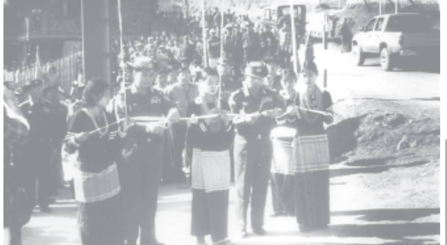
Commander Maj-Gen Tha Aye and Deputy Minister Brig-Gen Than Tun formally open new tar road in Lahe, Sagaing Division. —MNA