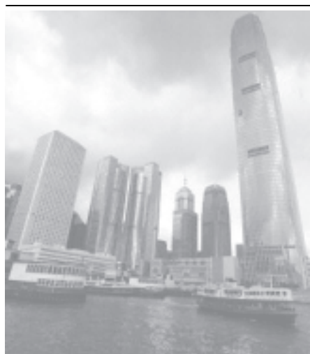
Hong Kong harbour. A huge multi-billion dollar arts hub planned for Hong Kong's famed harbourside is in doubt as public opinion gathers against it and influential businessmen and politicians declare the proposal flawed.

A fire broke out in a nightclub called Republica de Cromagnon in downtown Buenos Aires on December 30, 2004, leaving 175 dead immediately and at least 700 injured. More than 91 people now remain hospitalized with 40 of them under intensive care in clinics of Buenos Aires and its outskirts.