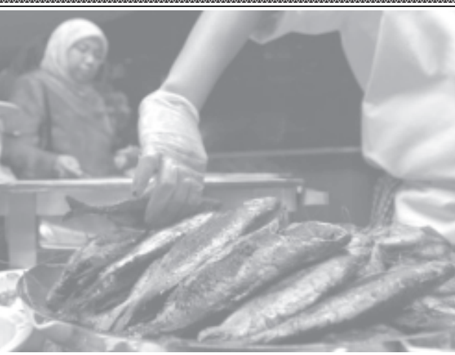
A kitchen worker places the fried fish as a Malaysian woman selecting other fish dishes during a fish-eating promotion at a hotel in Kuala Lumpur, Malaysia, on 16 Jan, 2005.