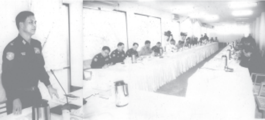
Maj-Gen Lun Maung addresses coordination meeting of NCC Management Committee.

There is car rental service at Myanmar Travels and Tour. For more information, contact Myanmar Travels and Tour, No 77-91, Sule Pagoda Road, dialling 252859 or 664472.-MNA