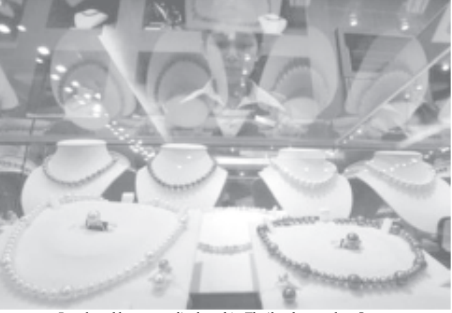
Pearl necklaces are displayed in Thailand recently.