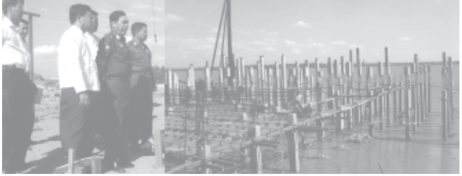
Ministers Maj-Gen Thein Swe and Brig-Gen Maung Maung Thein inspect progress in constructing Tharkayta wharf. — Transport

Also present on the occasion were Deputy Ministers U Tint Swe and Brig-Gen Myint Thein, managing directors and directors-general of the ministry, heads of departments, superintending engineers of construction sites and officials.-MNA