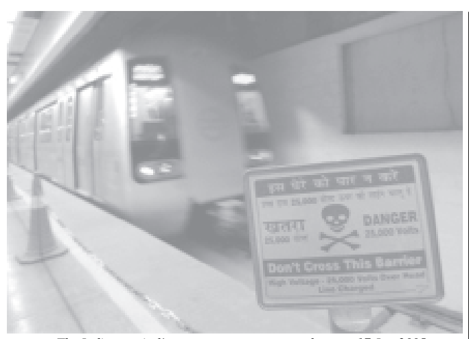
The Indian capital's new metro system, seen here on 17 Jan 2005.