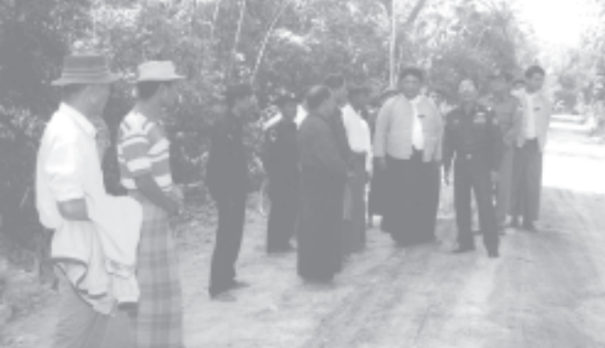
Minister Maj-Gen Tin Htut inspects construction of road in Avevawady Division. - MNA

Secretariat member Maj- I of Zalun Township PDC, the township USDA secretary and officials, Maj-Gen Tin Htut inspected construction of the 4.8 miles long earth road linking Thetkekyun village and Danubay village, cordially met the villagers and gave necessary instructions to officials.