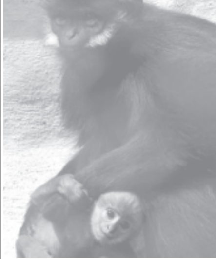
A francois' monkey and her baby enjoy the sunshine at the Hongshan Gorest Zoo in Nanjing, East China's Jiangsu Province, in this picture taken on 16 Jan, 2005. Animals at the zoo are enjoying spring-like weather with and warm temperatures in Nanjing.

Customs investigators also searched the homes of company officials and confiscated computers and other material.