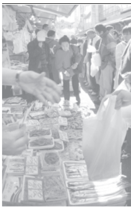
Tokyo shoppers on 17 Jan, 2005.