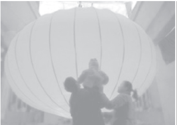
A Chinese couple and their child look at a red lantern in Sanzhao Village of Xi'an, Northwest China's Shaanxi province, on 16 Jan, 2005. Sanzhao Village has a tradition of producing lanterns for festival celebrations across China. It is estimated that the village will provide more than one million lanterns this year for the upcoming Spring Festival.