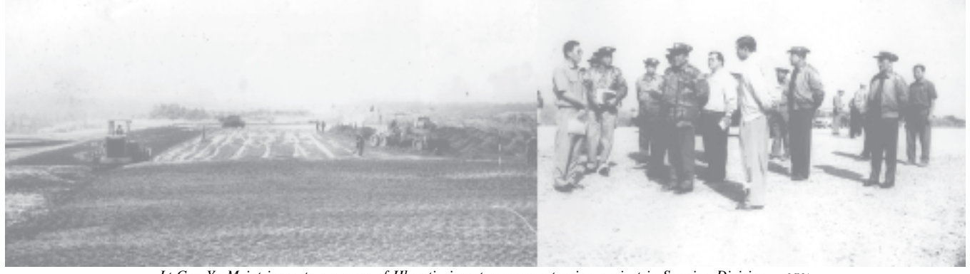
Lt-Gen Ye Myint inspects progress of Hkamti airport runway extension project in Sagaing Division.