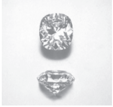
Diamonds in display at the diamond mine at Catoca in eastern Angola on 16 Jan, 2005.