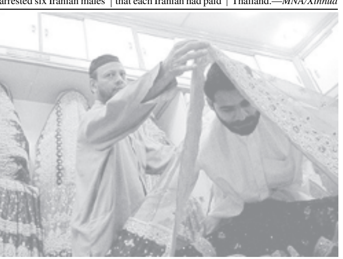
Pakistani shop keepers display bridal dresses to customers at a shop in Karachi. Pakistan's Supreme Court recently took the decision to uphold a ban on the country's notoriously extravagant wedding feasts.