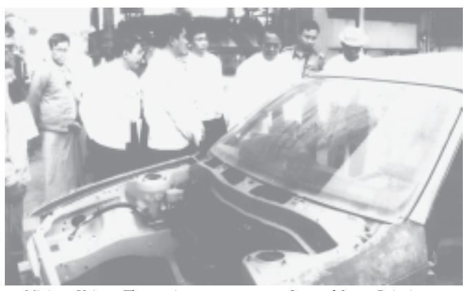
Minister U Aung Thaung inspects autos manufactured from Pyigyitagun industrial zone, Mandalay Division. (News reported)—MNA

Next, Lt-Gen Ye Myint, the commander and party inspected tea plantations of the Development