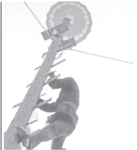
A barefooted Chinese man climbs a trunk inserted with knives during the opening ceremony of a tourism festival in Libo county, southwest China's Guizhou Province, on 12 Jan, 2006.