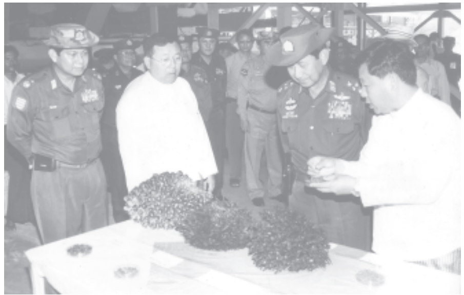
Vice-Senior General Maung Aye views samples of fruits of oil palm from Yuzana Co's oil palm plantations.

nies of national entrepreneurs participate in the oil palm plantation project. At present, efforts are being made for growing oil palm to meet the target of 500,000 acres.