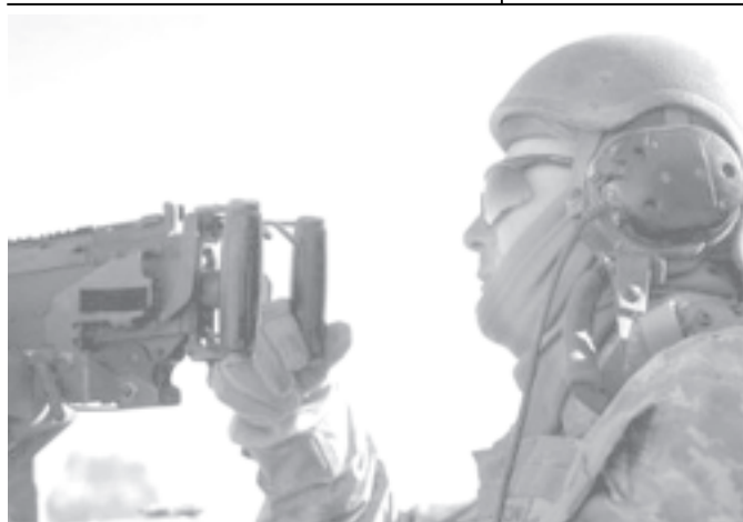
A US soldier holds a machinegun during a patrol at Forward Operating Base Q-West in Iraq on 10 Jan, 2006.