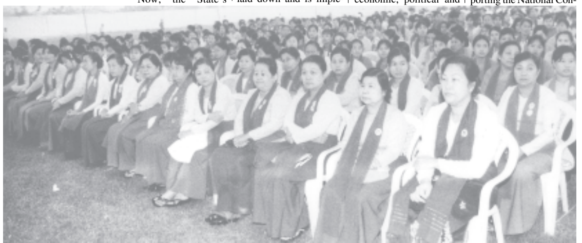
Those attending the mass meeting of Bago Division (West) in Pyay.

It is common knowledge that since its assumption of State duties, the Tatmadaw has upheld as a national duty Our Three Main National Causes namely non-disintegration of the Union, non-disintegration of national solidarity and perpetuation of sovereignty. Now, it is focusing its all-out efforts on the drive for the emer-