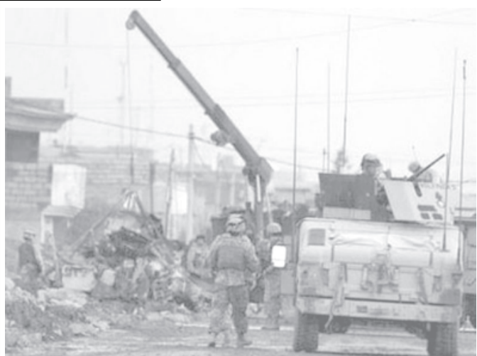
A crane removes the wreckage of US OH-58D Kiowa Warrior helicopter after it crashed in Mosul, about 390 km (240 miles) northwest of Baghdad on 13 Jan, 2006.

As for bunker sales, according to the minister, Singapore upheld its global leadership position last year with sales of ship fuel exceeding 25 million tons for the first time in its port history. — MNA/Xinhua