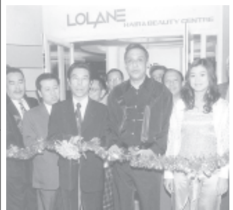
The opening ceremony of Lolane Showroom and Hair & Beauty Centre in progress.