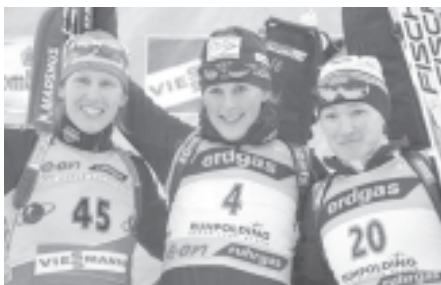
Kati Wilhelm of Germany, Sandrine Bailly of France and Svetlana Ishmouratova of Russia (L-R) celebrate their places during the flower ceremony after the women's 7.5 km sprint race at the Biathlon World Cup in the southern Bavarian skiing resort of Ruhpolding on 13 Jan, 2006. Bailly won ahead of Wilhelm and Ishmouratova.

The Catalans stormed their way into the quarters when they completed a crushing 9-1 aggregate victory over Third Division Zamora, with a 6-0 win at the Nou Camp on Wednesday.