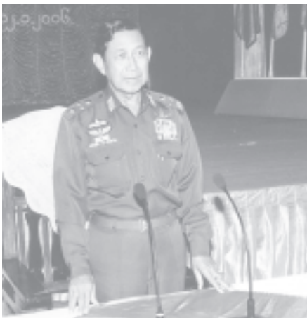
Vice-Senior General Maung Aye delivers address in meeting with departmental personnel, members of social organizations and townsenders in Kawthoung.