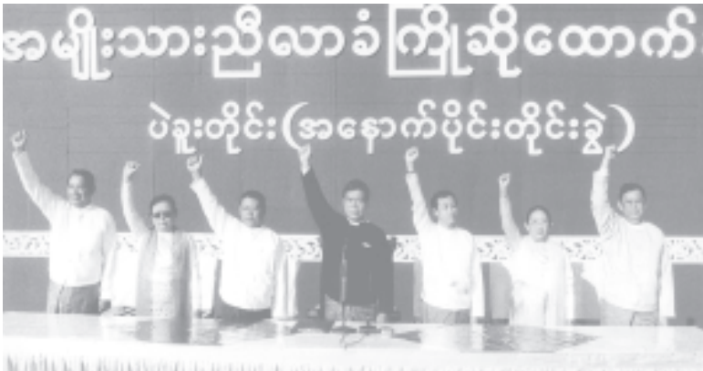
Panel of chairmen and those present chanting slogans at the mass meeting in support of the National Convention in Bago Division (East).

tions, departmental personnel, nurses, teachers, students, members of musical and pom pom troupe, and local people numbering over 15,000 this morning converged on Mingalar Shwepyi sports ground in Pyay to express their support for the National Convention.