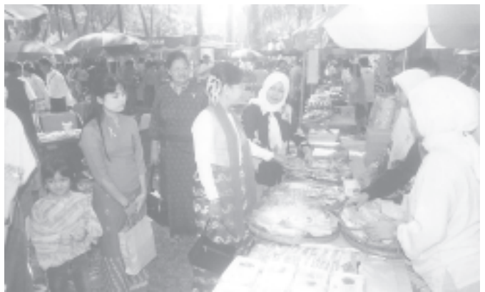
Guests visit International Fair 2006, organized by Myanmar ASEAN Women's Friendship Association (MAWFA), at Ministry of Foreign Affairs.

other products from various countries were sold to donate cash to social organizations and it attracted many people.