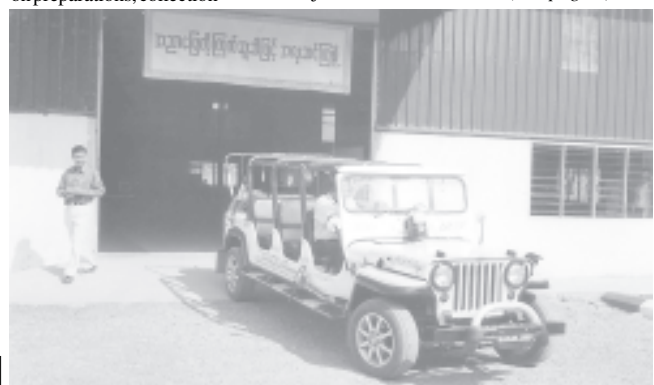
A jeep running with the use of physic nut oil.

Mandalay Division organized a demonstration on preparations, collection