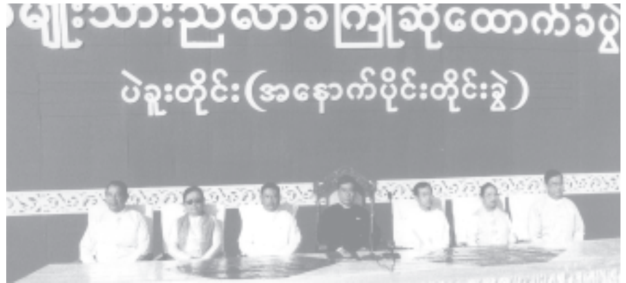
Members of the Panel of Chairmen at mass meeting held in Pyay in Bago Division (West).

As is known to all that due to the destructive acts of internal and external elements who cannot bear to see the successful completion of the National Convention and the emergence of a strong democratic administrative machinery that conforms to an enduring constitution, the National Convention was adjourned temporarily. Then, certain destructive elements were resorting to a variety of means to hinder the procedures of the National Con-