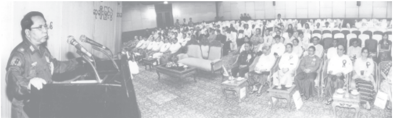
Minister Brig-Gen Kyaw Hsan delivers a speech at the first Thutaswezon literary award presentation ceremony for 2004.

YANGON, 14 Jan — The first Thutaswezon literary award for 2004 organized by Myanmar Writers and Journalists Association was held at Traders Hotel on Sule Pagoda Road this afternoon.