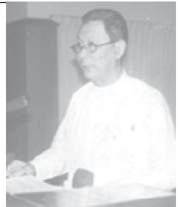
U Aung Thein of the Ministry of Construction.

and the paras 20, 21 and 22, the sending back of bills, the approval of bills and promulgation of bills appropriate.