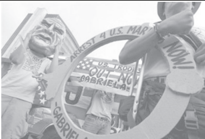
Anti-US protesters, one wearing a US President George Bush mask, display a handcuff to symbolize their demand for the arrest of four US Marines charged in the alleged rape of a 22-year-old Filipino woman during a rally outside the Department of Foreign Affairs building in Manila, on 13 Jan, 2006.

"Our earlier efforts should have been directed more tightly at meeting Iraqis' day-to-day needs," he added.— Internet