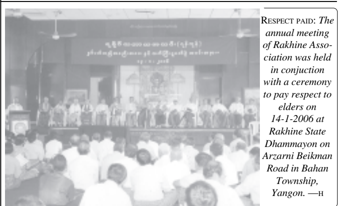
RESPECT PAID: The annual meeting of Rakhine Association was held in conjunction with a ceremony to pay respect to elders on 14-1-2006 at Rakhine State Dhammayon on Arzarni Beikman Road in Bahan Township, Yangon.