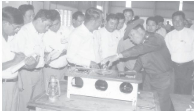
Officials make preparations to test a diesel stove with the use of physic nut oil.

As part of the drive, the government has taken extensive measures to grow physic nut ( Jatropha curcas ) from which bio-diesel can be obtained for diesel-substitute fuel.