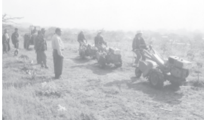
The test shows success in running power-tillers with the use of physic nut oil.

claiming the virgin land to grow tea, coffee and rubber. They are doing so in the areas out of the total area of 128,206 acres in the entire division. They