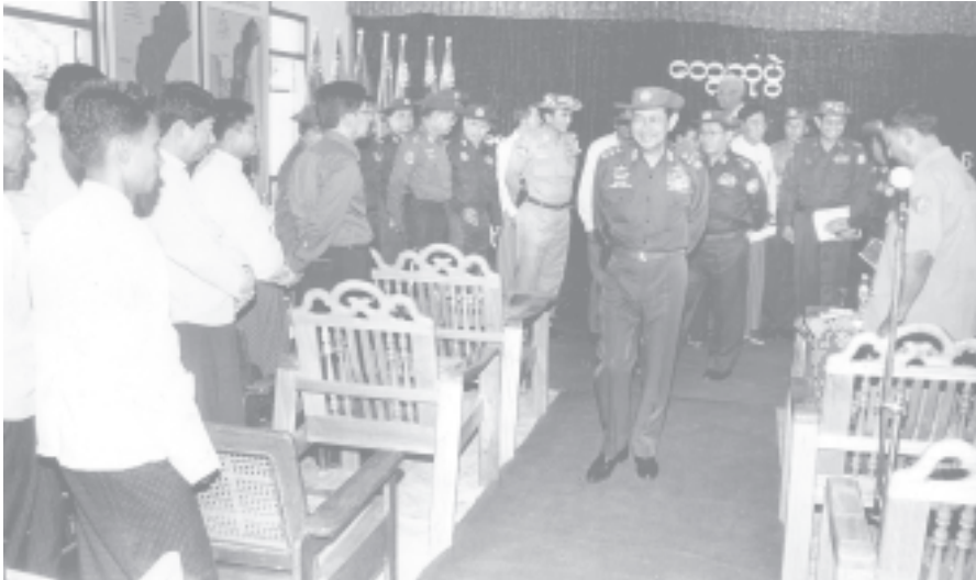
Vice-Senior General Maung Aye cordially greets departmental personel and townselders in Khamaukkyi.