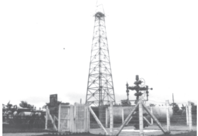
Well No 2 in Oil and Natural Gas Field in Nyaungdon Township.

When defeated in the war, they also destroyed the oil fields of