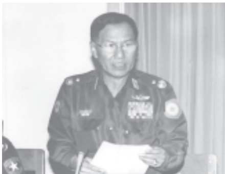
Minister for Electric Power Maj-Gen Tin Htut submits reports on improvement of small-scale hydel power projects in border areas.— MNA