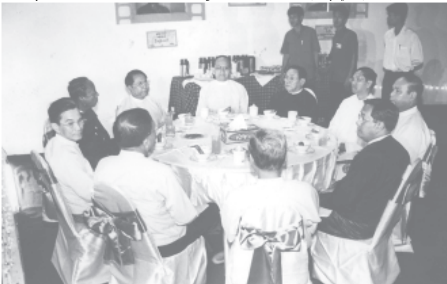
Secretary-1 Lt-Gen Thein Sein attends dinner in honour of Academy Award winners for 2003.