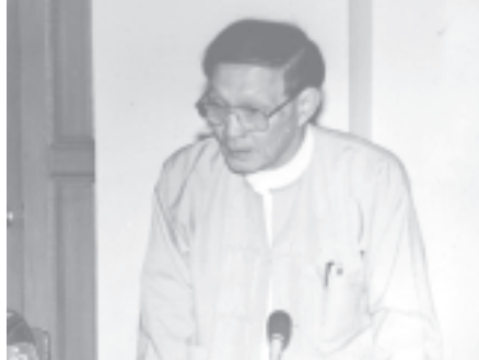
Deputy Minister for Agriculture and Irrigation U Ohn Myint reports on reclamation of highland cultivation.

In his reports, he said highland farms are being reclaimed with the aim of raising the living standard of farmers. With the establishment of education and health