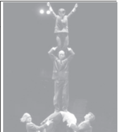
Members of Circus Oz perform their balancing act under the 'Big Top' during a preview of their show in Sydney on 30 Dec, 2004. The circus, known for its unusual and dangerous acts, will be performing over the next few months in capital cities and small country towns after a sell-out tour of England.