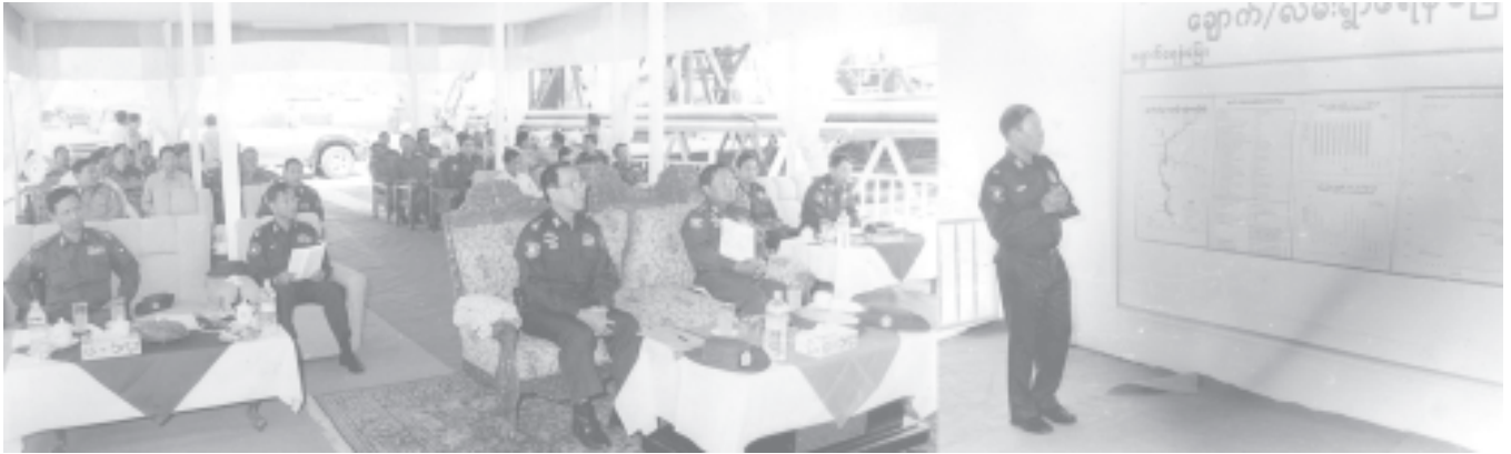
Prime Minister Lt-Gen Soe Win hears reports on matters concerning Chauk-Lanywa oilfield by Minister for Energy Brig-Gen Lun Thi.