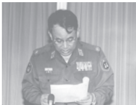
Minister for Livestock and Fisheries Brig-Gen Maung Maung Thein reports on development of livestock breeding tasks.