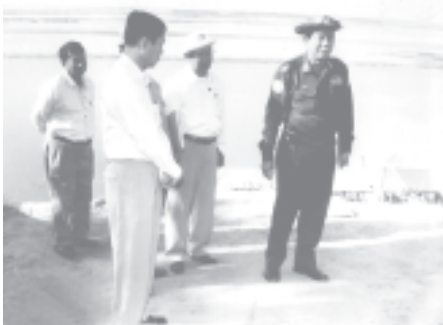
Minister for Agriculture and Irrigation Maj-Gen Htay Oo inspects functions of Ngathayauk river water pumping project in NyaungU District.

and Irrigation Maj-Gen Htay Oo and Minister for Livestock and Fisheries Brig-Gen Maung Maung Thein who accompanied