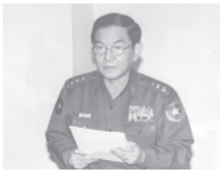
Minister for PBANRDA Col Thein Nyunt presents reports on implementation of the minutes of the previous meeting.