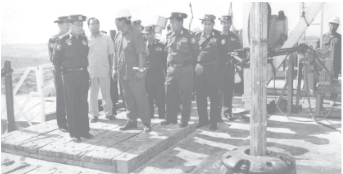
Prime Minister Lt-Gen Soe Win inspects drilling of Oil Well No 1154 in Chauk-Lanywa oilfield.