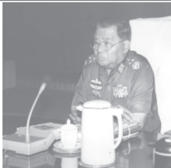
Senior General Than Shwe addresses Development of Border Areas and National Races Central Committee Meeting No 2/2004.