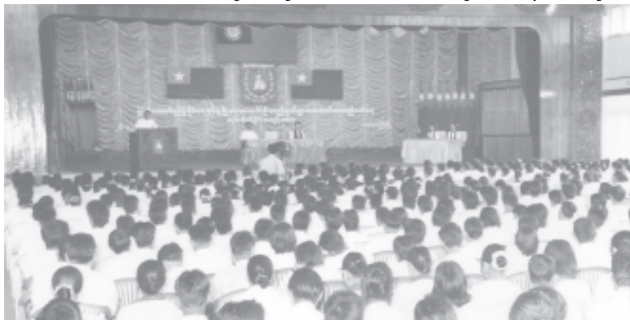
Shan State (South) USDA holds discussions on implementation of the seven objectives and nine future tasks adopted by AGM 2004 and plans for Shan State(South).— MNA

that the Government firmly believes that better foundations for national solidarity came together