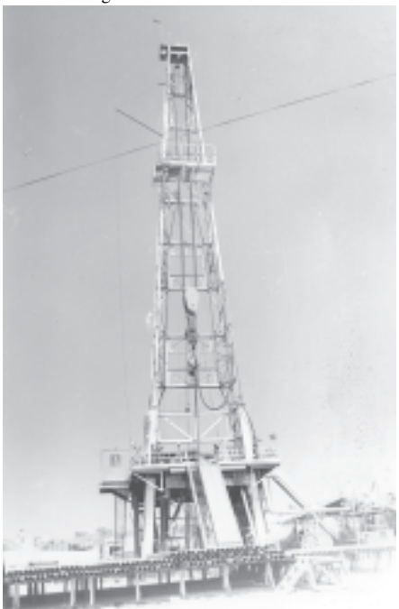
Oil Well No 1154 seen at Chauk-Lanywa oilfield.

In Chaungwa Village, the commander and party cordially greeted those who were hit by the tidal waves and presented relief items to them. Next, the commander and party inspected damages at the places hit by tidal waves. — MNA