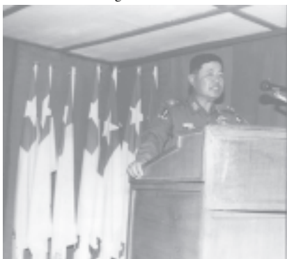
Commander-in-Chief (Navy) Rear-Admiral Soe Thein explains development for Cocogyun Township.