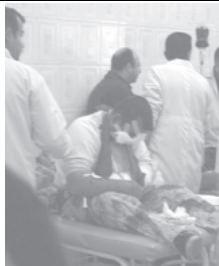
Medics take care of injured Iraqi National Guard officers caught in a road side bomb and explosion southeast of Baquba, 60 kms northeast of Baghdad on 29 Dec, 2004.