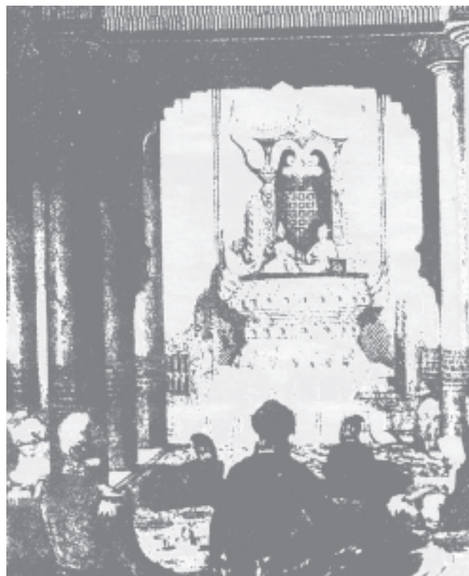
French and British merchants, messengers of the colonialists, waiting on the king at the court in the late Konbaung Era.

cause it was gained through voting system. Capitalist parliamentary system was beautifully dubbed parliamentary democratic system. Capitalists won democratic parliamentary elections by means of wealth.