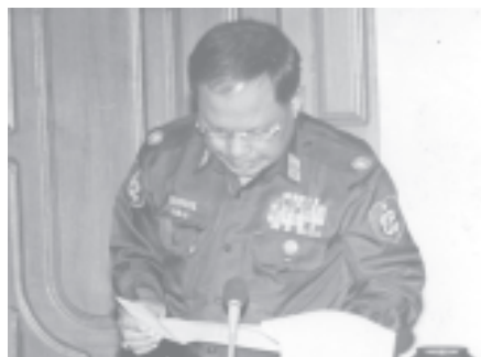
Minister for Forestry Brig-Gen Thein Aung submits reports on conservation of forests.

In line with the guidance of the Head of State, 26 nationalities youths development training centres and 18 vocational training centres for women have been opened in border areas, and two Nationalities