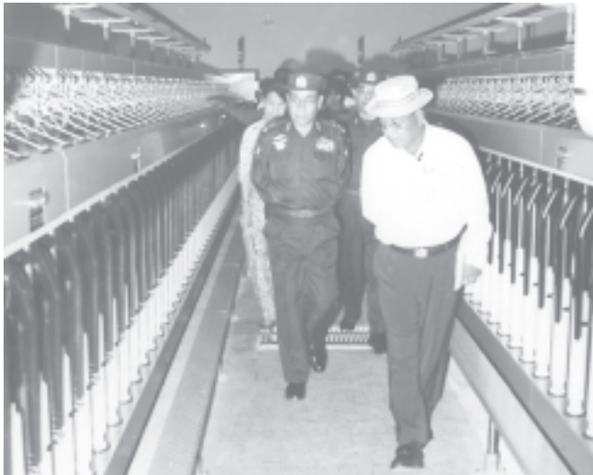
Prime Minister Lt-Gen Soe Win inspects machines of Pwintbyu Textile Factory (Project).

On arrival at the Natural Gas Filling Station in Chauk, Minister Brig-Gen Lun Thi reported to the Prime Minister that about 1,500 ve-