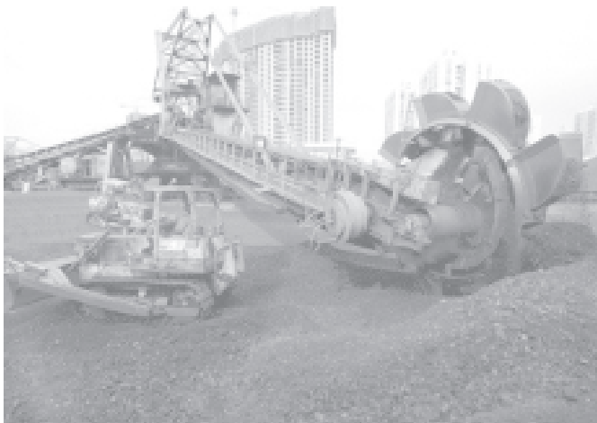
A Shanghai coal dock. China's state economic planners have set an 8.0 percent ceiling on coal price rises for electric power generation in 2005 as energy demand continues to outpace supply.