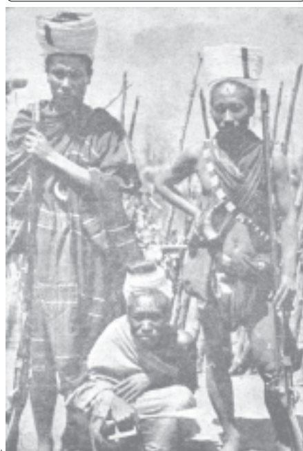
Leaders of Chin national race who waged war against the British colonialists with unyielding spirit.