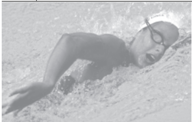
Olympic swimming champion Laure Manaudou has been named as France's sports personality of the year by L'Equipe newspaper.