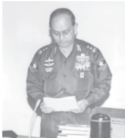
Secretary-1 Lt-Gen Thein Sein reports on accomplishments of border areas and national races.—MNA

So far, the government has established seven