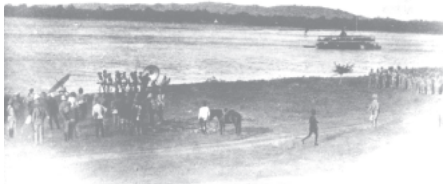
A ship of colonialists seen arriving at Inwa harbour during third Anglo-Myanmar war.

Hand in hand with the people, the Tatmadaw, the strong national force, had to protect the country during these political upheavals. It is only the Tatmadaw and people who always safeguard the State and its sovereignty. This national force as such is striving to transform the nation into a peaceful, modern and developed one.