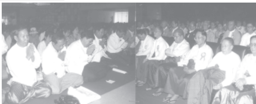
Old students of YTU pay respects to retired faculty members.—(H)