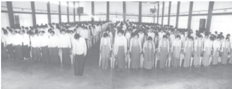
USDA members saluting Union Flag at Shan State (South) USDA Meeting in Taunggyi.