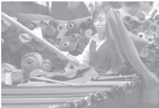
A Chinese vendor measures out textile at the Alice Tailor Shop in Beijing, China, on 29 Dec, 2004.