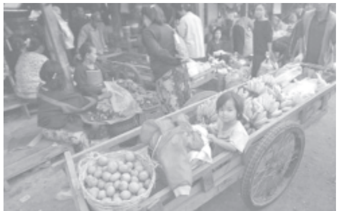
A young Lao girl takes a ride in a vegetable cart in one of Vientiane's many morning markets, recently.