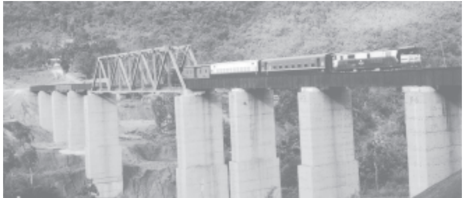
The above photo shows a train passing through Punchaung Bridge built by Myanma Railways on Shwenyaung-Taunggyi-Punchaung-Namsan railroad in Shan State (South).

Newly built Thilawa station and a passenger train in Thanlyin Township, Yangon Division.