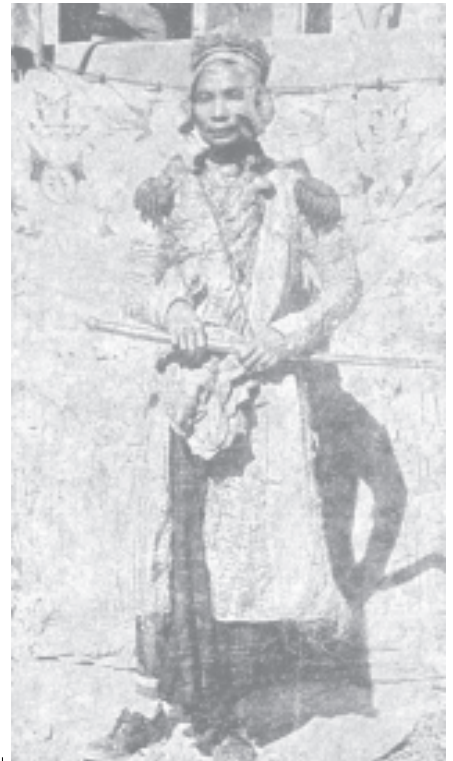
Daipha Duwa was among the leaders of Kachin nationals who fought against colonialists.

Hand in hand with the people, the Tatmadaw, the strong national force, had to protect the country during these political upheavals. It is only the Tatmadaw and people who always safeguard the State and its sovereignty. This national force as such is striving to transform the nation into a