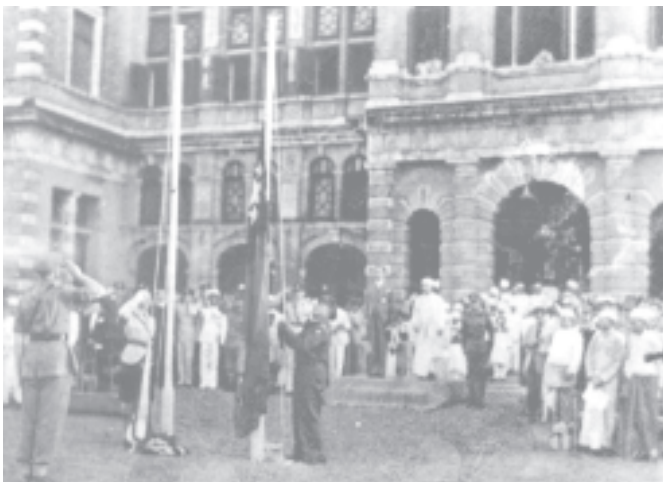
The Union Flag hoisted up on 4 January 1948, at 6.30 pm, Independence Day ceremony of the Union of Myanmar was held at the Governor's Residence.

In the whole struggle for independence, Myanmar exercised national politics with national spirit. With the shared political stance they became united. After independence, Myanmar again experienced the imminent loss of national unity due to party political and sectarian divides in the nation which were caused by the instigations of elements inside and outside the nation. That was why national unity or national consolidation collapsed.