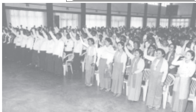
Participants chanting slogans at the conclusion of Shan State (South) USDA Meeting in Taunggyi.

Hailing the 57 th Anniversary Independence Day