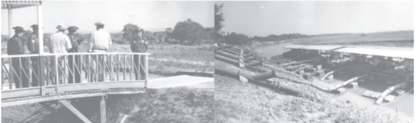
Prime Minister Lt-Gen Soe Win inspects tasks of Tanyaung river water pumping project in Salin Township.—MNA

The plan is under way to irrigate 2,000 acres of summer paddy and 2,000 acres of cotton with the use of water facilities of Tanyaung River Water Pumping