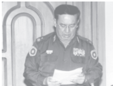
Minister for Home Affairs Maj-Gen Maung Oo reports on management matters for border areas development.