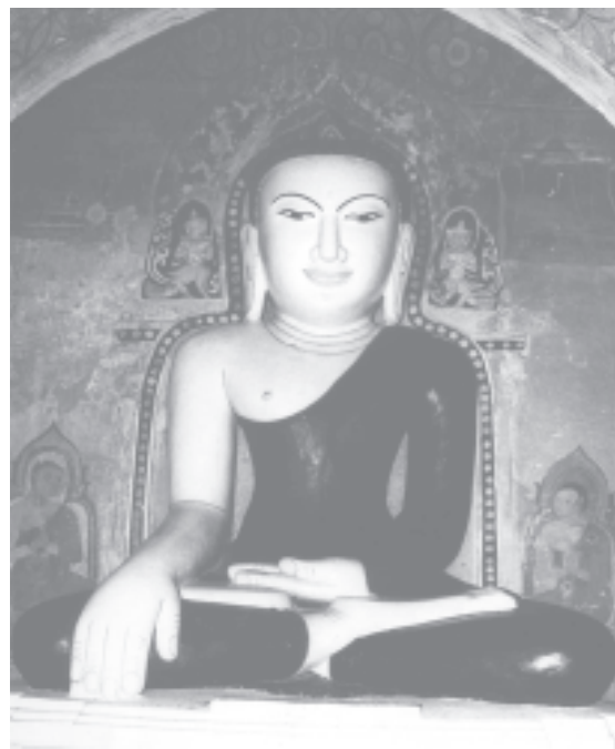
Senior General Than Shwe and party pay homage to Hsinmyashin Buddha Image.