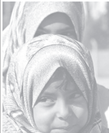
Displaced children: Two girls from the city of Fallujah, wait with a family member outside the Iraqi Red Crescent Society headquarters in Baghdad, after being displaced by the violence on 21 Dec, 2004.