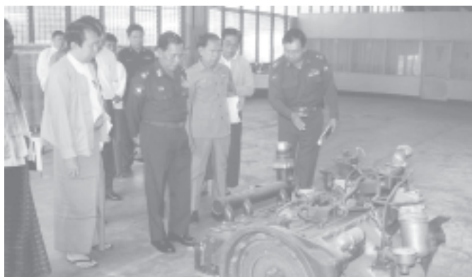
Minister for Industry-2 Maj-Gen Saw Lwin inspects CNG engine at No 1 Automobile Factory.— INDUSTRY-2

YANGON, 22 Dec—Minister for Industry-2 Maj-Gen Saw Lwin inspected natural gas cylinders, CNG conversion kit and accessories, installation of CNG conversion kit in bus and TE-21 and installation of diesel and CNG-used engines in buses at No 1 Automobile Factory of Myanmar Automobile and Diesel Engine Industries on Inya