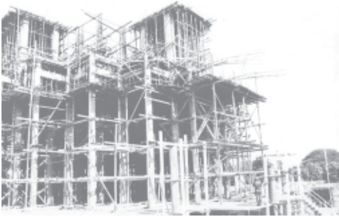
Senior General Than Shwe inspects progress in construction of Southern Building of Bagan Golden Palace and Pyinsapathada Palace in NyaungU.