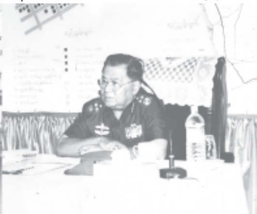
Commander-in-Chief of Defence Services Senior General Than Shwe gives guidance to departmental officials in Magway Division, members of the Supervisory Committee of Yenangyoung Industrial Zone and industrialists. — MNA

Emergence of the State Constitution is the duty of all citizens of Myanmar Naing-Ngan.