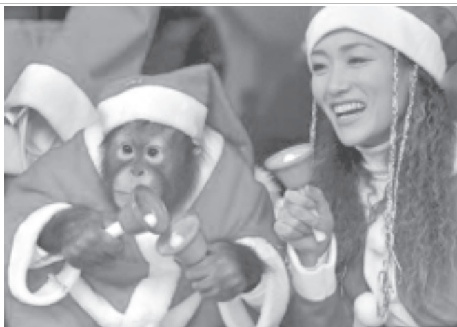
Dressed in Santa Claus outfits, monkey and trainer try to raise more donations by ringing bells at a department store in Seoul, on 22 Dec, 2004.