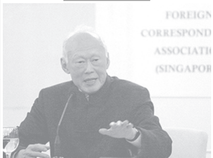
Singapore's elder statesman Lee Kuan Yew speaks at a forum at the Foreign Correspondents Association of Singapore on 20 Dec, 2004.

old Lee, who holds the title "minister mentor" and remains active in the Cabinet headed by his son, Lee Hsien Loong. "It is to the advantage of ASEAN countries that any such East Asian community should include India," Lee Kuan Yew said. ASEAN comprises Malaysia, Singapore, Indonesia, the Philippines, Thailand, Vietnam, Brunei, Cambodia, Laos and Myanmar.—MNA/AP