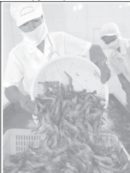
A worker pours fresh shrimp at a local seafood processing factory in Vietnam, on 20 Dec, 2004.