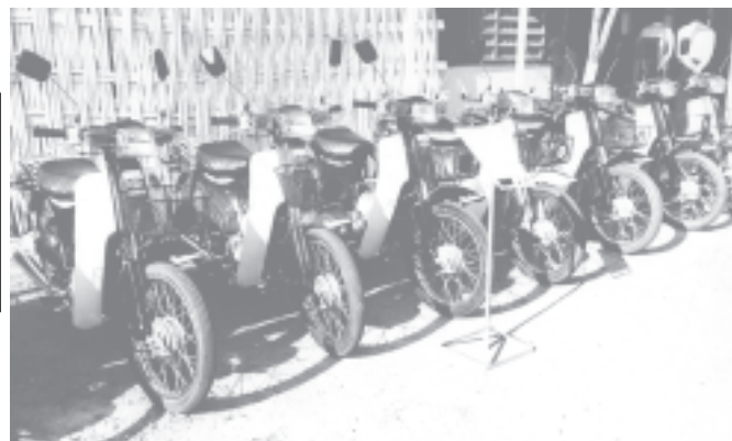
Two-wheel and three-wheel motorcycles produced at Yenangyoung Industrial Zone.