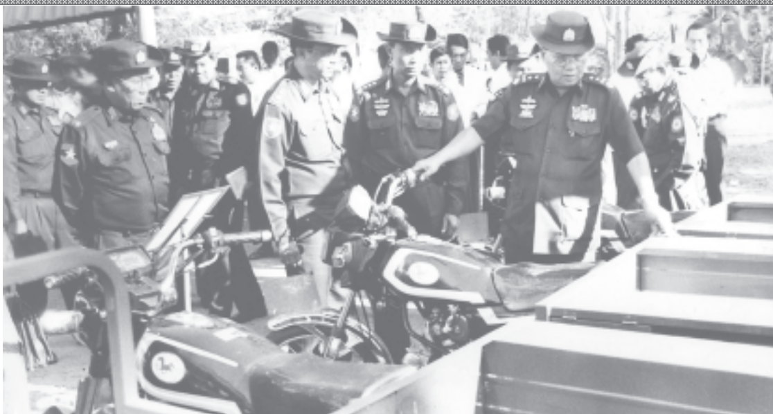
Commander-in-Chief of Defence Services Senior General Than Shwe inspects three-wheeled motorcycles produced by Yenangyoung Industrial Zone.