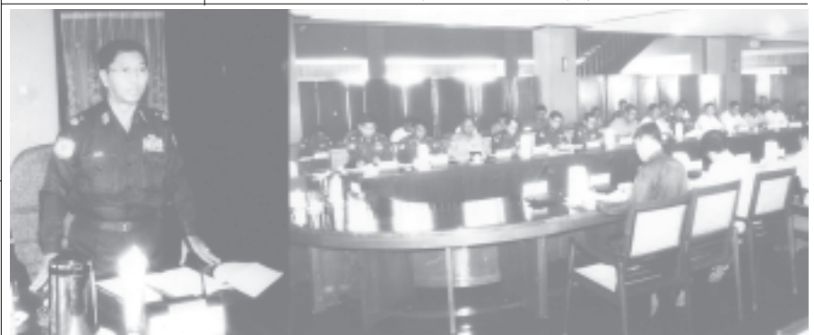
Commander Maj-Gen Myint Swe addresses coordination meeting on excursion tour of UDNR trainees.

After hearing reports, the commander attended to the needs. In the zone, 6,546 macadamia, 4,400 honey orange trees and crops are being cultivated. MNA