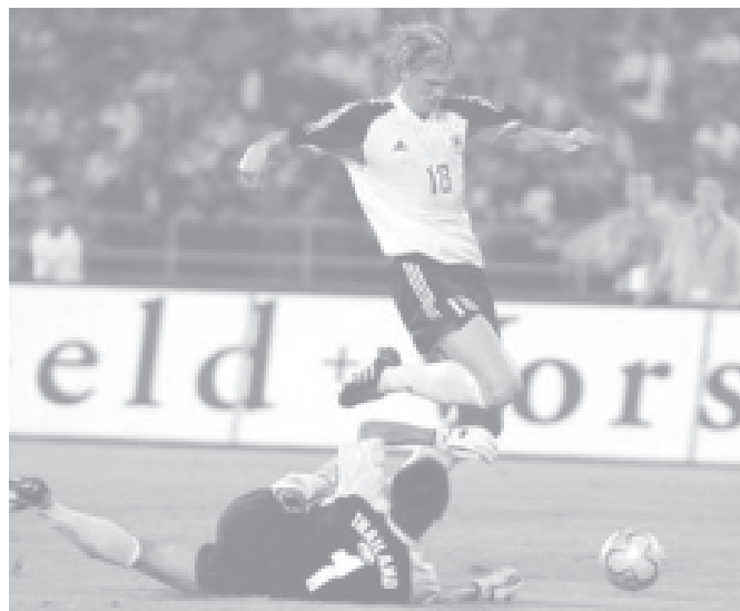
Germany's Tim Borowski (R) fights for the ball with Thailand's Kosin Hathairattanakool (L) during a friendly soccer match at Rajamangala stadium in Bangkok on 21 Dec, 2004.

Their games against Japan, South Korea and Thailand were a reward for the backing Germany received from Asian countries in their successful bid to host the 2006 World Cup. "There have been a lot of positives to take from the trip," Klinsmann said. "The integration between the younger players and the experienced players was a major plus." —MNA/Reuters