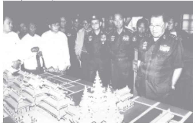
Senior General Than Shwe views scale model of Bagan Golden Palace being built in NyaungU.— MNA

Phone Maw Shwe, officials of the SPDC Office and departmental heads, the Senior General inspected the project for construction of Arimadapada Bagan Palace of Maha Raja Siri Aniruddha Deva King Anawrahta.