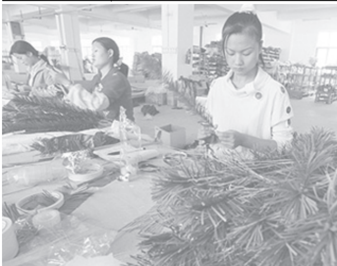
Factory employees assemble artificial Christmas trees and Christmas novelties in Shenzhen recently.