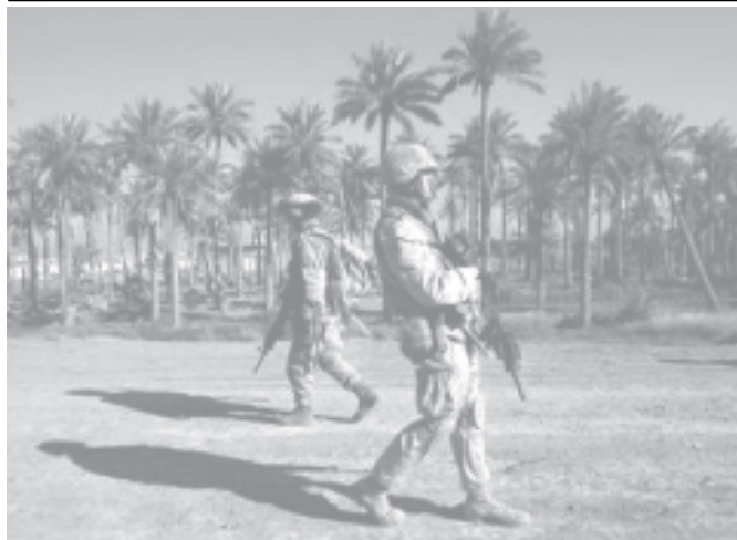
US Marines from 3rd battalion, 1st Marines, patrol in the Iraqi town of Fallujah, 50-km west of Baghdad, on 21 Dec, 2004.