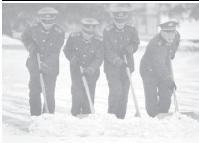
Chinese soldiers remove snow in China's capital Beijing after the city was hit by a heavy snowstorm on 22 Dec, 2004.