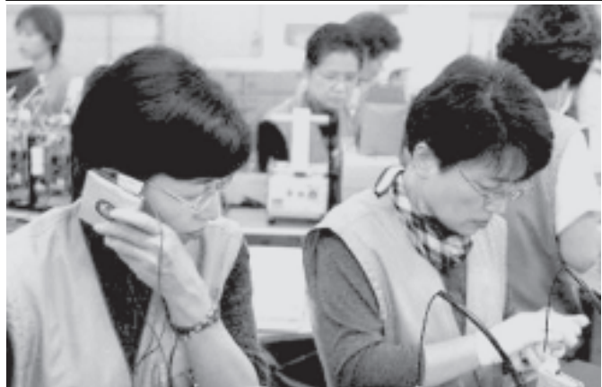
Workers check electronic devices at a factory north of Tokyo, on 22 Dec 2004.