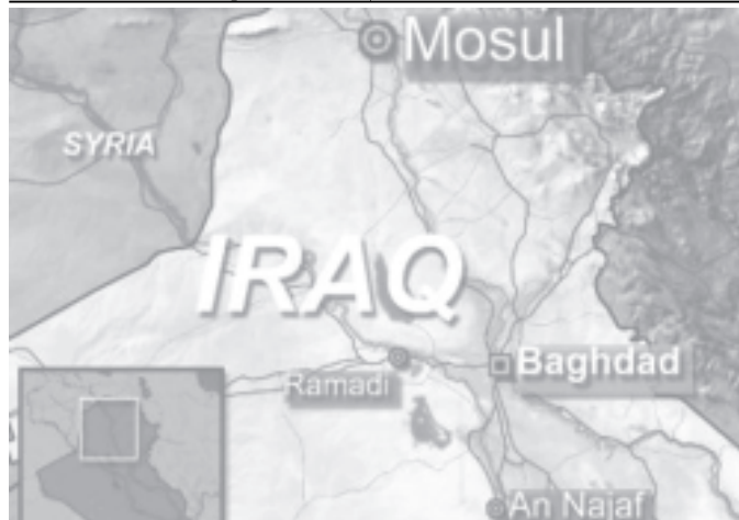
A mortar and rocket attack on a US military base in the Iraqi city of Mosul killed at least 22 people and wounded more than 50 on 21 Dec, 2004 in one of the most deadly attacks on US forces since last year's invasion.—INTERNET

On the New York Mercantile Exchange on Monday, crude oil for January delivery fell 64 cents to close at 45.64 US dollars a barrel. Meanwhile, on London's International Petroleum Exchange the February Brent crude-oil futures contract shed 94 cents to settle at 42.45 dollars per barrel. Crude oil prices had jumped 5 per cent last Friday to reach their highest level this month. — MNA/Xinhua