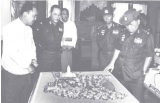
Senior General Than Shwe views the scale model of Nanmyint Tower and Nanmyint Tower Hotel in Bagan Archaeological Region.— MNA

hotel in Bagan. The Senior General left necessary instructions and viewed the Nanmyint Tower Project site. The Senior General and party then enjoyed the beautiful scenery of Bagan from the tower. They also inspected progress of construction of the Nanmyint Tower Hotel and layout of the building.— MNA