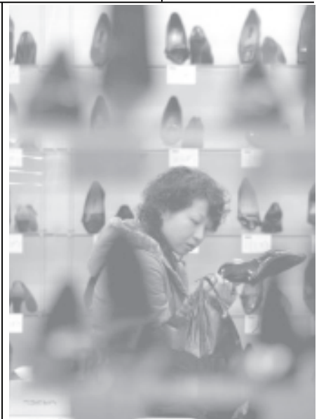
A shopper inspects shoes at a department store in Shanghai on 21 Dec, 2004.—INTERNET

Cambodia has witnessed more traffic accidents and more people killed and injured in recent years since the roads are being improved and the transportation is on increase.—MNA/Xinhua