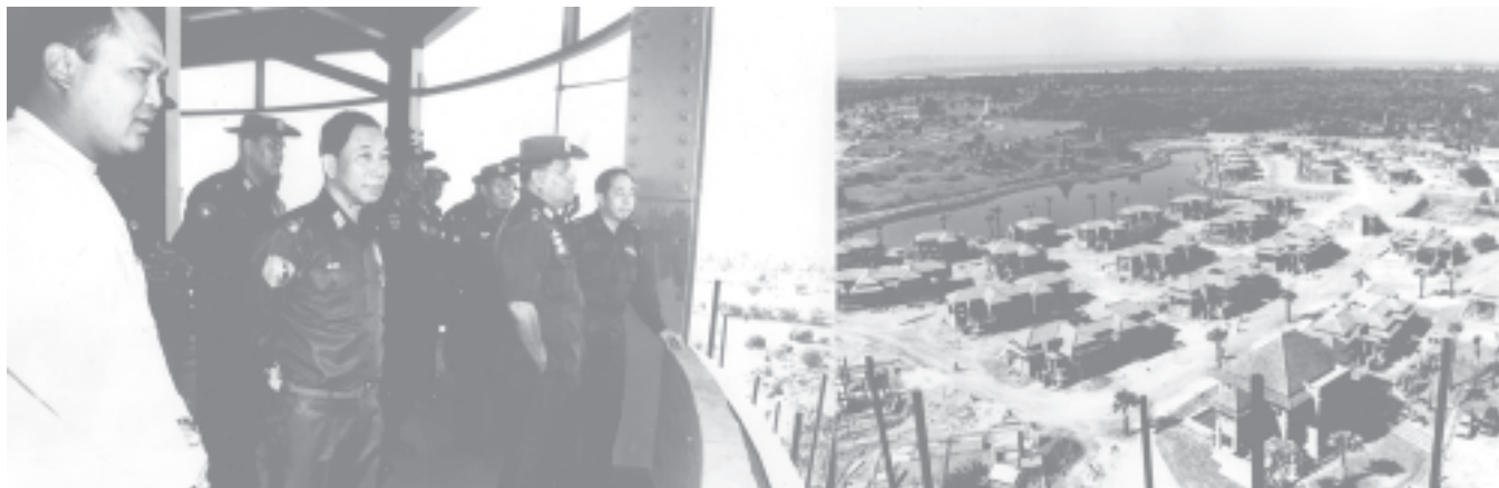
Senior General Than Shwe enjoys beautiful scenes of Bagan from Nanmyint Tower in Bagan Archaeological Region.