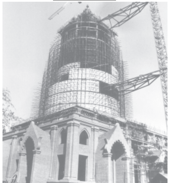
Progress in construction of 13-storey Nanmyint Tower in Bagan Archaeological Region.

The number of the visitors to Bagan is growing annually and up to this November, the region received a total of 36,678 foreign visitors and 25,307 local visitors, he said, reporting on construction of Nanmyint Tower and Nanmyint Tower Hotel. Next, the chairman of the Htoo Trading Co Ltd presented a report, saying that the Nanmyint Tower