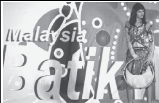
A model wears the local made handicrafted batik during the Malaysia Batik Week in Kuala Lumpur, Malaysia, on Sunday, 12 Dec, 2004. Malaysia's batik of the traditional dyed textile is now the target of a big push to popularize it in global fashion circles.

per cent are managers and administrators. Of the Hong Kong people living in the region, about 51 per cent are employees and 16 per cent retirees. With regard to occupation, 32 per cent are professionals and associate professionals while 23 per cent are managers and administrators. Of those engaged in foreign-funded enterprises, about 44 per cent live in premises provided by employers, 35 per cent in self-owned housing and 18 per cent in rented accommodation.—MNA/Xinhua