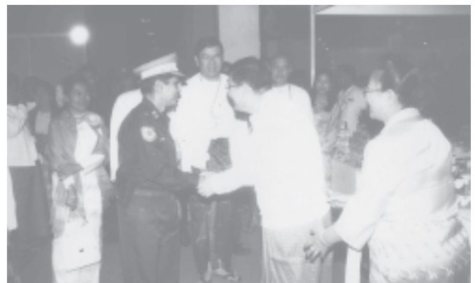
Commander Maj-Gen Myint Swe views booths at the Fifth Traditional Medicine and Medical Equipment Exhibition.