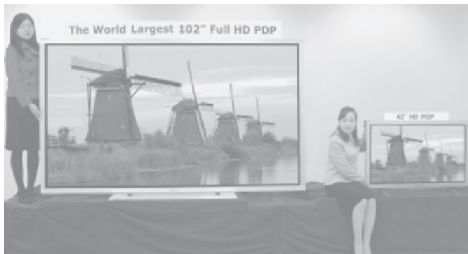
The world's largest 102-inch plasma display panel (PDP) flat television screen, developed by South Korea's Samsung SDI.