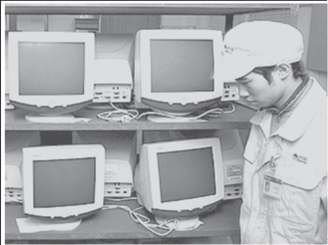
A worker walks past a rack of computers in China on 14 Dec, 2004.