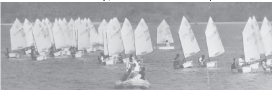
The individual race of 2004 ASEAN Open Optimist Championship in progress at Chaungtha Beach on 15 December.

Team Races will be held tomorrow. The prize presentation ceremony for the 2004 ASEAN Open Optimist Championship will be held at Chaungtha beach at 6 pm on 20 December.