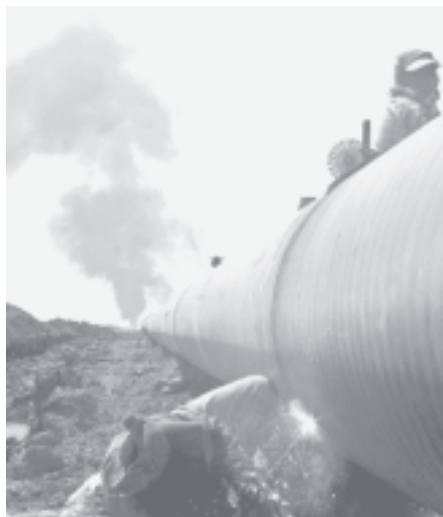
Iraqi workers repair a pipeline as smoke from a fire billows in the background on 15 Dec 2004.