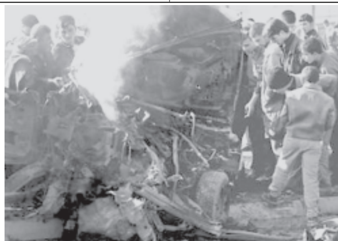
People look over smoking debris after a car bomb exploded in the northern Iraq city of Mosul, on 15 Dec, 2004. The bomb detonated as a US military convoy was driving past.