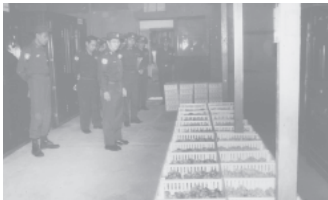
Commander Maj-Gen Myint Swe inspects No 1 Livestock Breeding Farm of Yangon Command.

After inspecting the farm, Maj-Gen Myint Swe gave instructions on sanitation and renovation of buildings at the firm. The farm sells 3,500 chicks a week. — MNA