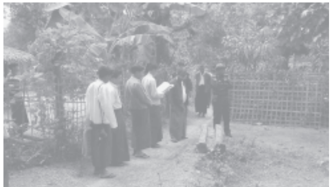
Minister for Culture Maj-Gen Kyi Aung inspects excavation and maintenance of gutters made of stone in ancient Vesali city in Rakhine State. — CULTURE

On 13 December, the Minister inspected renovation of Laungkyettaung Mawshwekyetpha Pagoda, Kothaung Stupa, Phayaoak Pagoda and MINGAUNG SHWETU PA-