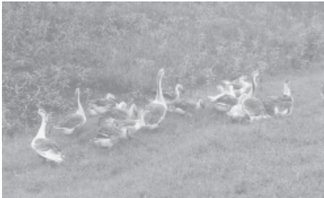
Natural resources of riparian ecosystem.

biometric data needs to be analyzed to understand the various aspects of Avifauna. Protecting wetlands used as wintering sites is not sufficient to conserve a species without protection at breeding sites and throughout the flyway. We also need flyway conservation for waterbirds because of pollution eutrophication, agricultural, industrial and domestic operation create severe problems for inland and coastal wetlands. These contaminations affect waterbirds both directly and indirectly. The more