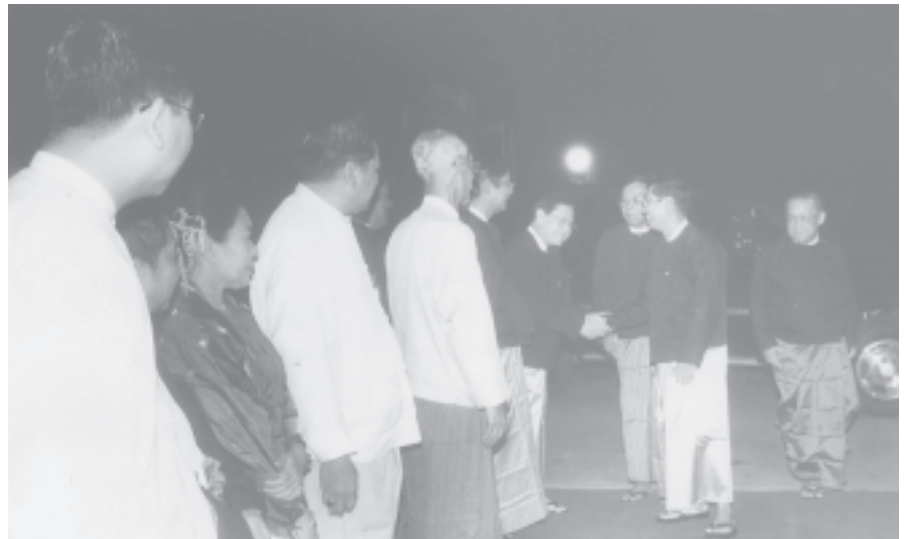
Commander Maj-Gen Myint Swe cordially greets delegates to Traditional Medicine Practitioners' Conference at the dinner. — MNA

Before and during the dinner, artistes entertained the delegates with songs to the accompaniment of A-1 Soe Myint modern music troupe. — MNA