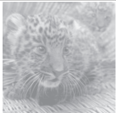
Six-week-old female Asian leopards (pantera pardus) 'Namlea' (front) and her sister 'Kendari' sit in a basket during a presentation at Berlin's Tierpark Friedrichsfelde zoo, on 14 Dec, 2004.

The best time to plant a tree was 20 years ago. The second best time is now.