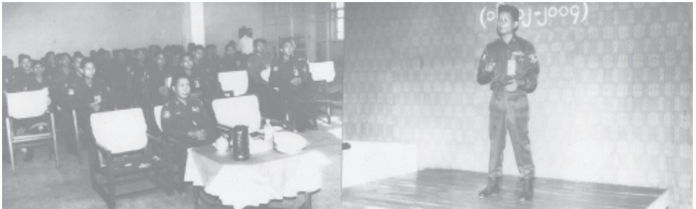
Altogether 93 contestants participated in the Camp Commandant's Office Extempore Talks Contest at Komnyintha Hall on Pyay Road this morning. Camp Commandant of Ministry of Defence Maj-Gen Hla Aung Thein observes the Contest. — MNA