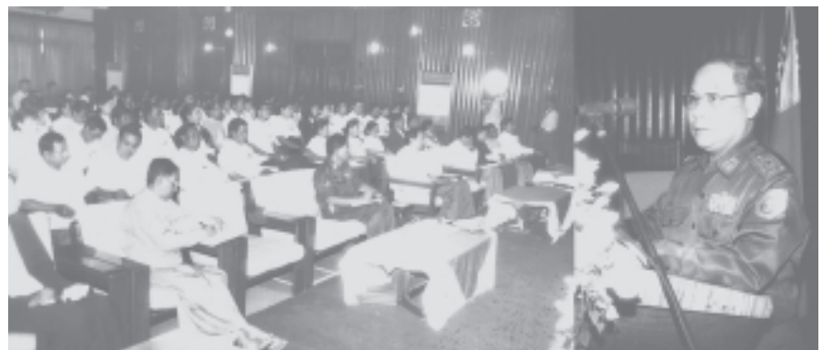
Deputy Minister for Finance and Revenue Col Hla Thein Swe speaking at the second four-monthly meeting of Myanma Insurance. — F&R