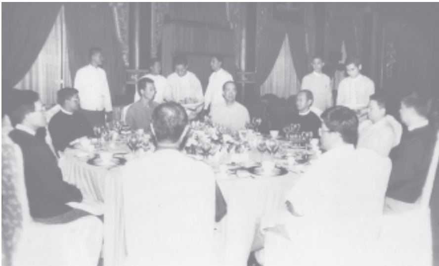
Quartermaster-General Lt-Gen Thiha Thura Tin Aung Myint Oo hosts dinner in honour of Deputy Chief of General Logistics Department of PLA Lt-Gen Sun Zhiqiang and party at Karaweik Palace.