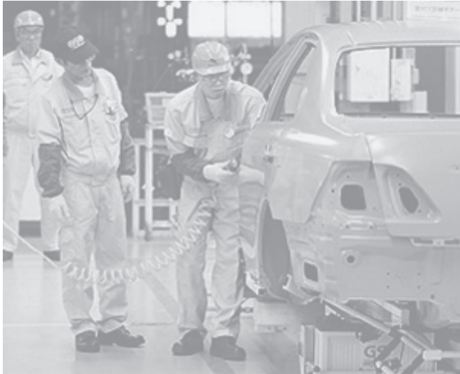
Workers assemble a vehicle at a Toyota plant in central Japan on 15 Dec, 2004.