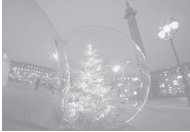
Giant Christmas bubbles containing Christmas trees sit in the prestigious Place Vendome in Paris. — INTERNET

For the eighth-graders, about 225,000 students from 46 countries and regions took part, with about 4,900 students from 146 schools representing Japan. — MNA/Xinhua