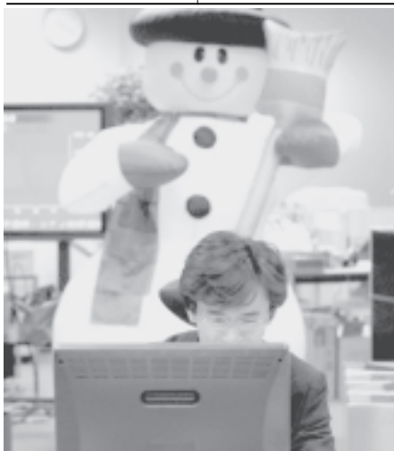
A dealer trades while a snowman looks on at a foreign exchange brokerage in Tokyo. Japan's economy may be heading towards a slowdown in 2005 as a stronger yen and a growing disparity between rich and poor threaten to spoil the party the country enjoyed in the early part of 2004.

The memorandum provides for the increase of the number of Cypriot athletes training in Greece and vice versa, the creation of a scientific support plan for Cypriot champions, and general cooperation in all sports related issues.—MNA/Xinhua