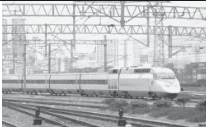
View of a high-speed train introduced into service in April built under an accord between South Korea and Alstom. Based on French technology a new bullet train jointly developed by South Korea's Rotem Co and Hyundai Heavy Industries Co has broken the 350 kilometres-per-hour barrier putting the country at the forefront of high-speed railway technology.

The committee recommended an official acknowledgment be made that successive governments have failed to recognize veterans were exposed to a toxic environment during their service in Vietnam.