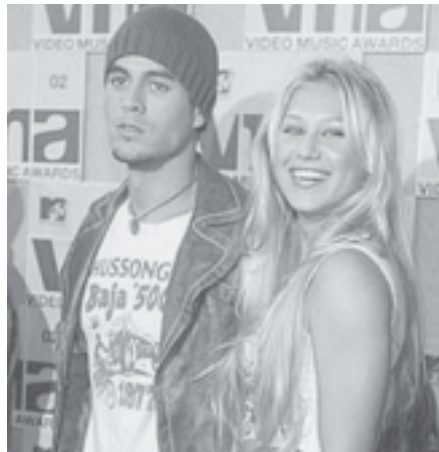
Former Russian tennis star Anna Kournikova(R) and long-time beau Enrique Iglesias(L), seen here in 2002, have finally tied the knot, marrying at a secret ceremony in Mexico last month.

"It was a very small and secret wedding — only family and a few very close friends were invited," the source told the magazine. — Internet