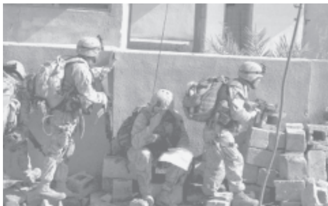
Picture released by the US Marines shows Marines taking cover and searching for a sniper attempting to pin them down on the edge of a courtyard in the restive city of Fallujah recently.