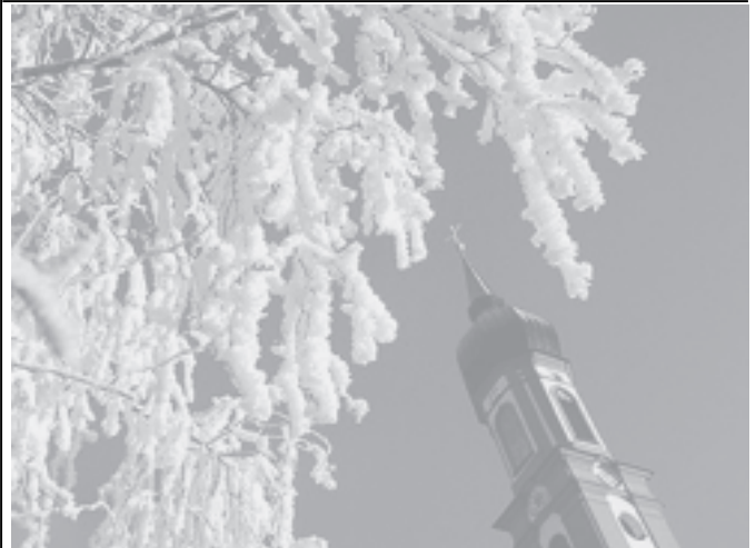
Frosty morning: A tree standing in front of the pilgrimage church of Vilgertshofen in southern Germany is covered with a thick layer of glazed frost.—INTERNET

Cagan Sekercioglu of the Stanford Centre for Conservation Biology and colleagues analysed all 9,787 living and 129 extinct bird species.—MNA/Reuters