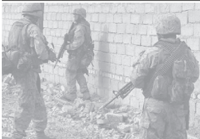
US Marines patrol the restive Iraqi city of Fallujah on 14 Dec, 2004.