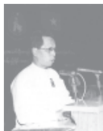
Mandalay District USDA Secretary U Ko Lay. — MNA

factory in Dagon Seikkan Industrial Zone-1. Member of Board of Directors U Aye Lwin reported to the minister on exporting of furniture to foreign countries. The minister inspected production of furniture round the factory and instructed officials to export quality furniture to foreign countries, to earn foreign exchange more and to create new design of furniture. — MNA