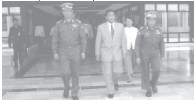
Minister for SWRR Maj-Gen Sein Htwa being seen off at the airport before departure for Bangkok, Thailand.