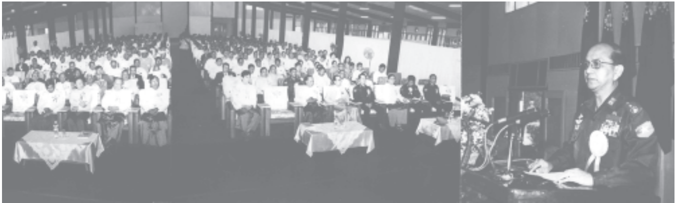
Secretary-1 Lt-Gen Thein Sein delivers an address at fifth Myanmar Traditional Medicine Practitioners' Conference.—MNA