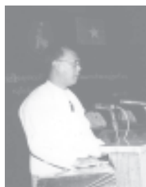
Meiktila District USDA Joint-Secretary U Hla Myint.