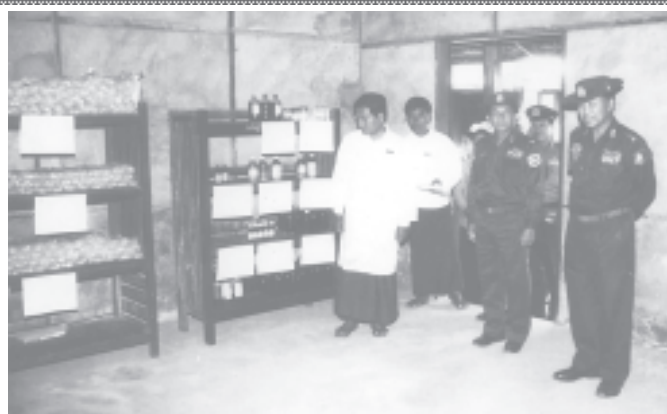
Lt-Gen Khin Maung Than inspects Thitpon Village Station Hospital in Manaung Township, Rakhine State. — MNA

Speaking on the occasion, Lt-Gen Khin Maung Than said the government designated 24 development zones and has implemented five rural development tasks. So, officials concerned are also need to make efforts at grass-roots level. Although fisheries is the main business of the region, agriculture and livestock breeding need to be extended. Agriculture is not only main economy of the State but also of Rakhine State. Now, Rakhine State is making efforts so that it can meet the target of 1.1 million