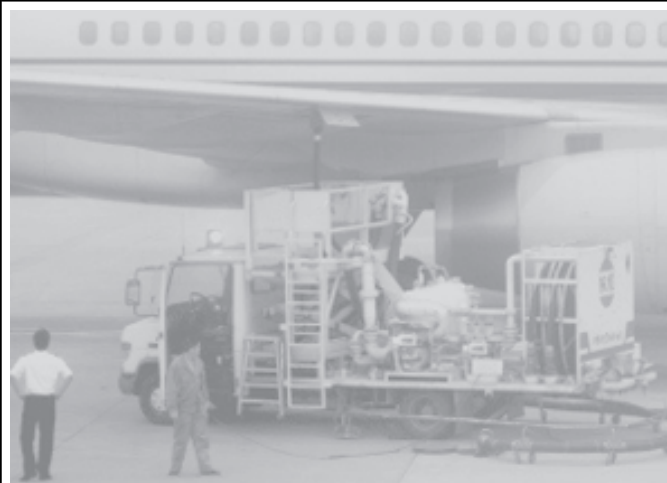
An aircraft is refueled at Beijing Interneational Airport on 15 Dec, 2004.