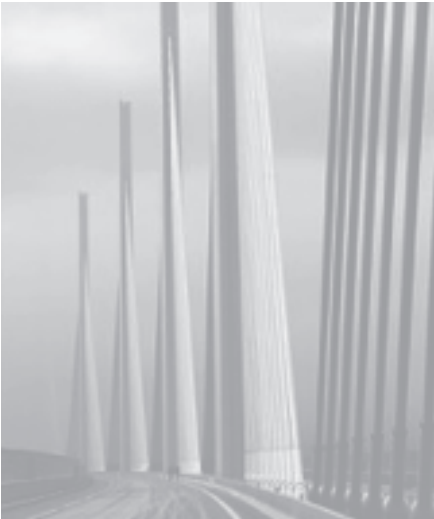
A view of the Millau motorway viaduct, tallest bridge in the world, which was designed by British architect Norman Foster and opened to the public on 14 Dec, 2004.