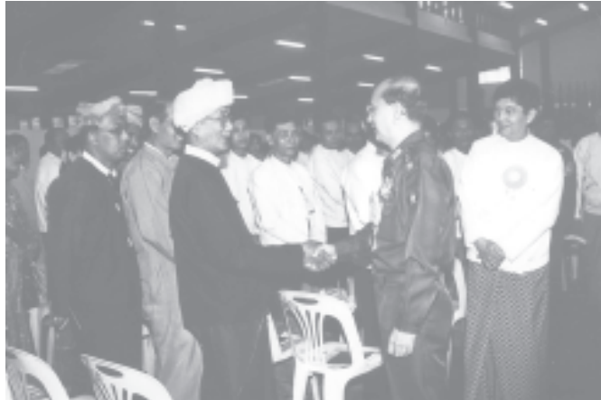
Secretary-1 Lt-Gen Thein Sein cordially greets Myanmar traditional medicine practitioners.

In addition, the practitioners are required to make endeavours to organize all the different bodies of the profession to stand united under the leadership of the Myanmar Traditional Medicine Practitioners Association, while systematically integrating all the cream and essential parts of the different branches of