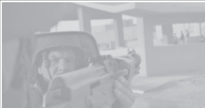
A Kurdish member of the Iraqi National Guard patrols through a part of Mosul under Kurdish control, on 10 Dec, 2004.