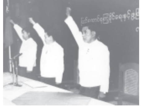
Delegates and meeting chairmen chanting slogans at concluding ceremony of the meeting.

The Yangon-Mandalay six-lane highway and Yoma ring road both pass-