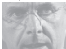
England coach Sven-Goran Eriksson (pictured) indicated he was ready to give highly-rated Middlesbrough winger Stewart Downing an international debut.

LONDON, 15 Dec— Middlesbrough midfielder Stewart Downing is set to make his England debut in a friendly against the Netherlands in February, manager Sven-Goran Eriksson said on Monday.