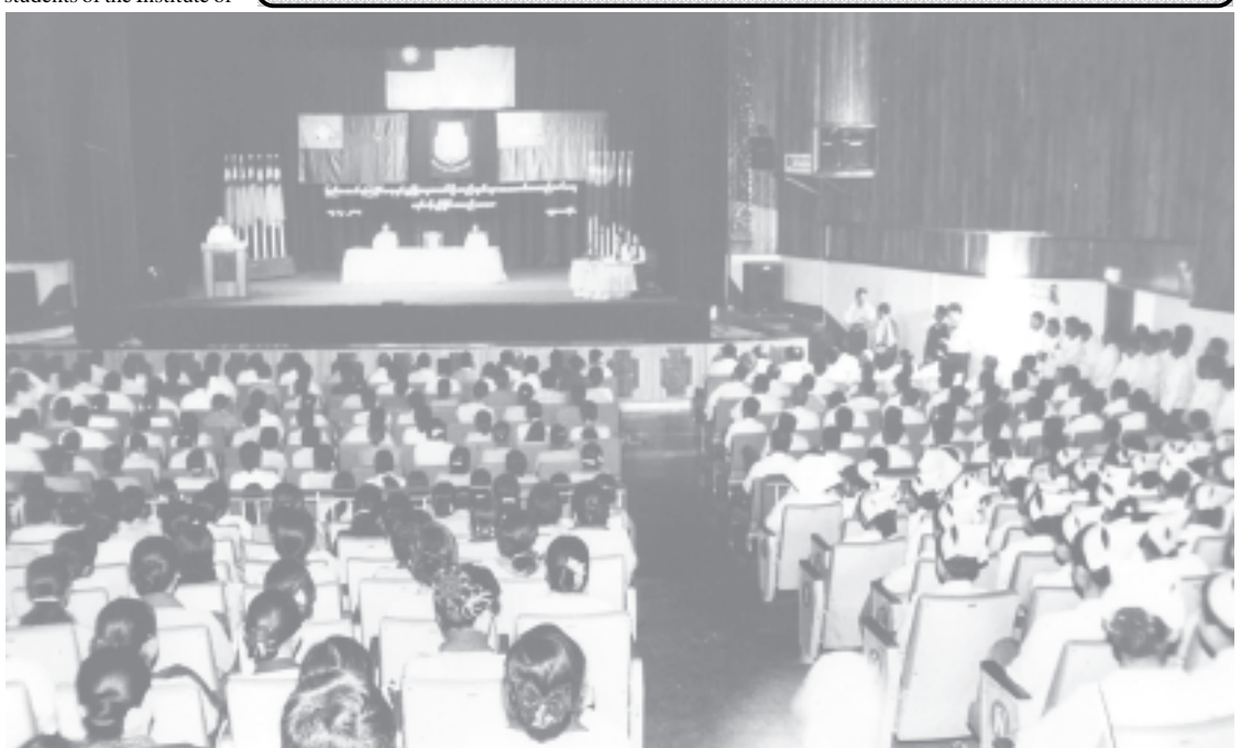
Mandalay Division USDA holds coordination meeting on implementation of seven objectives and nine future tasks adopted by USDA Annual General Meeting (2004) at National Theatre in Mandalay.

National unity plays the most indispensable role in taking steps for development of the nation.