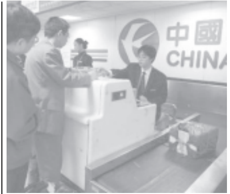
Chinese passengers check in at a China Eastern counter at Hongqiao Airport in Shanghai, on 15 Dec, 2004. China Eastern Airlines Co Ltd. posted a 9.47 percent rise in November passenger traffic, thanks to an improving global economy and booming travel, the country's second-largest carrier said on Wednesday.