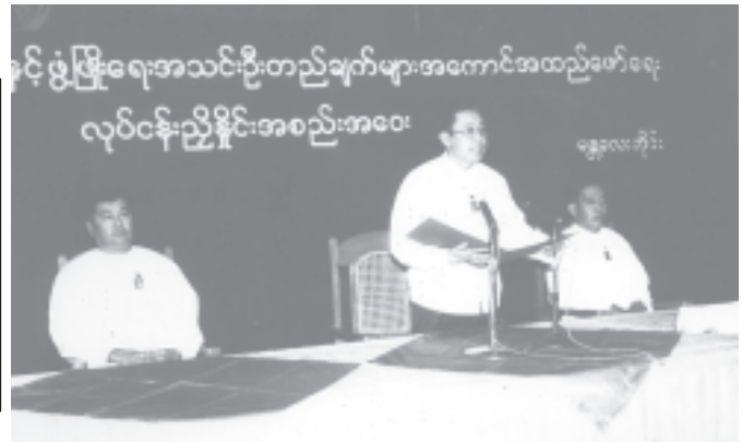
The coordination meeting to implement objectives and future tasks adopted by USDA Annual General Meeting 2004 in progress in Mandalay.