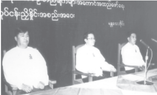
The chairman and co-chairmen seen at coordination meeting to implement objectives and future tasks adopted by USDA Annual General Meeting 2004, in Mandalay.