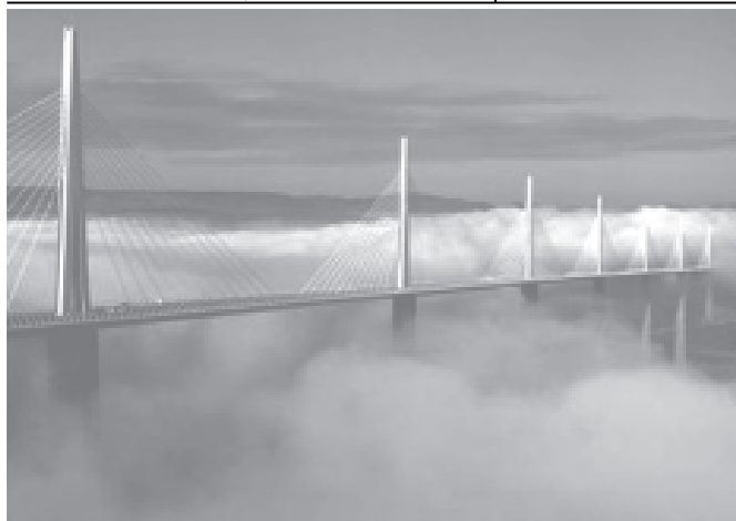
The Millau Viaduct, designed by the English architect Lord Norman Foster, crosses the cloud-covered valley of the River Tarn in Millau, on 9 Dec, 2004.