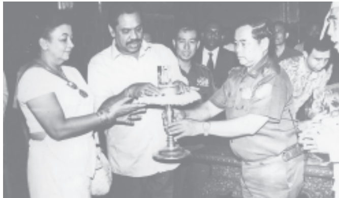
Member of the Pagoda Board of Trustees presents gift to Sri Lankan Prime Minister.