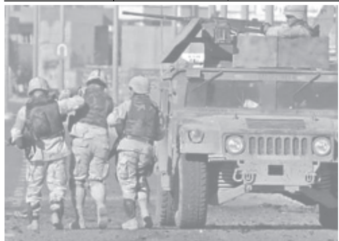
The Army is seeking more production of the most fully armour-protected 'Humvee' military vehicles, defence officials said on 10 Dec, 2004, after a soldier's complaint to Defence Secretary Donald Rumsfeld that troops had to use scrap metal to protect vehicles in Iraq.