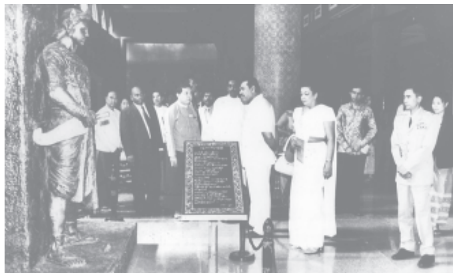
Prime Minister of the Democratic Socialist Republic of Sri Lanka Mr Mahinda Rajapakse and wife and the Sri Lankan delegation visit Bagan Archaeological Museum in Bagan. —MNA

The Prime Minister and party observed lacquerware of Bagan period and those of (See page 8)