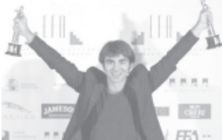
Faith Akin, Turkish actor-director of 'Gegen Die Wand,' poses with his trophies at the European Film Awards Ceremony in Barcelona, on 11 Dec, 2004.