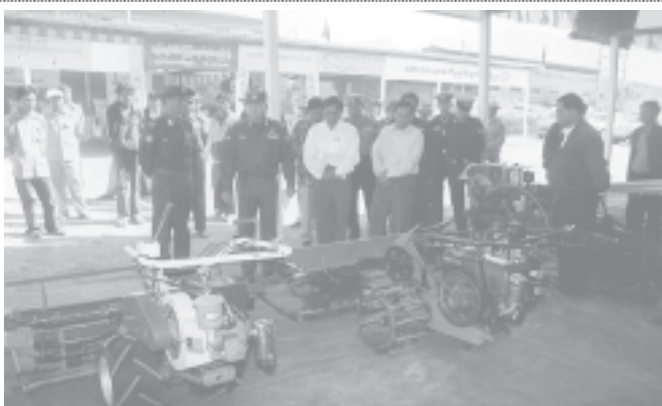
Commander Maj-Gen Khin Maung Myint and Minister Brig-Gen Lun Thi inspect power tillers at Taunggyi Ayethaya Industrial Zone.

During the meeting, Secretary of foundry plant construction committee