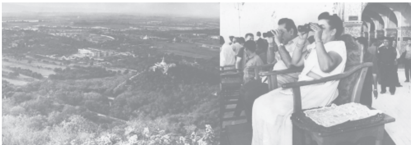
Sri Lankan delegation led by Prime Minister Mr Mahinda Rajapakse and wife view the sun set of Mandalay from Mandalay Hill.