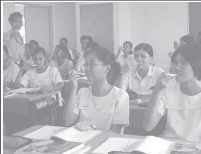
Teacher instructs pupils at a Singapore school on how to take their temperatures on 13 Dec, 2004.