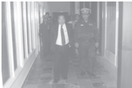
Deputy Minister for Home Affairs Brig-Gen Phone Swe being welcomed back at the airport.— MNA

eral's Office U Kyaw Sein and Director of the International Organizations and Economic Department U Nyunt Swe also arrived back on the same flight.— MNA