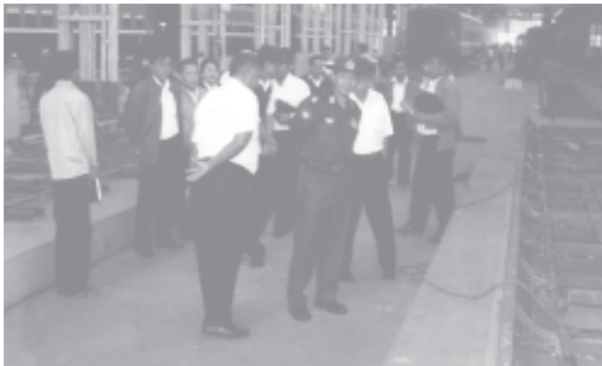
Minister for Rail Transportation Maj-Gen Aung Min inspects construction of coaches in Myintnge on 12 December.

In the evening, he watched the final match of the USDA CEC member's Shield Soccer Tournament of Hinthada District and presented prizes to the winners.— MNA