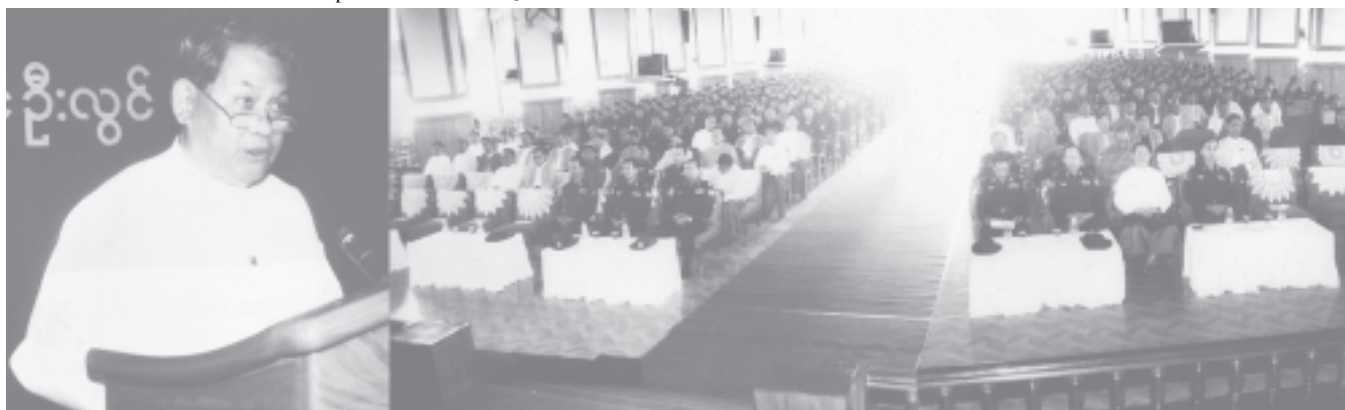
On behalf of the Chairman of MEC, Minister for Education U Than Aung delivers an address at closing of Special Refresher Course No 3 for Faculty Members at CICS (Upper Myanmar). — MNA

After the ceremony, the minister cordially greeted the trainees. The course lasted four weeks—MNA