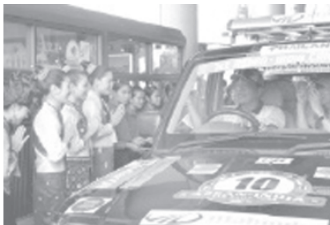
Women dressed in traditional Laotian costumes welcome drivers from Thailand upon their arrival in Vientiane after they crossed the Friendship Bridge from Thailand to Laos recently. —INTERNET

According to the original target set by the provincial government, the GDP is to reach two trillion yuan and the per capita GDP to hit approximately 3,450 US dollars by 2010, double that of 2000. — MNA/Xinhua