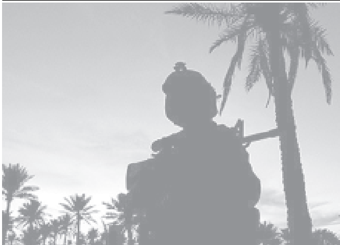
A US soldier is silhouetted while on patrol at dusk in Iraq on 12 Dec, 2004.