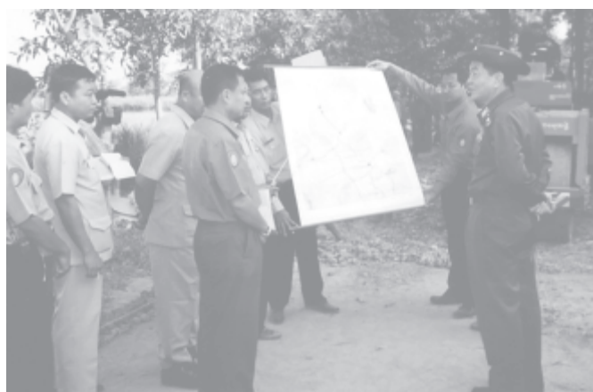
Minister Col Thein Nyunt inspects rural development tasks in Taikkyi Township.—MNA

Afterwards, the minister and party heard reports on rural development tasks presented by responsible officials. In