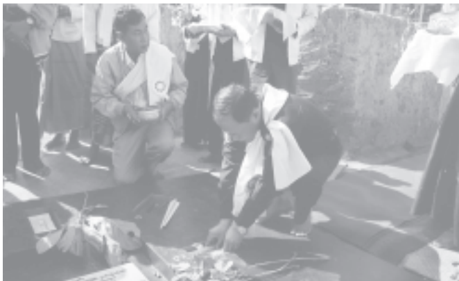
CEC member of USDA Minister for Forestry Brig-Gen Thein Aung lays cornerstones at Shwedagon replica Pyilonechantha Wizaya pagoda in Mezaligon village, Ingapu. — FORESTRY