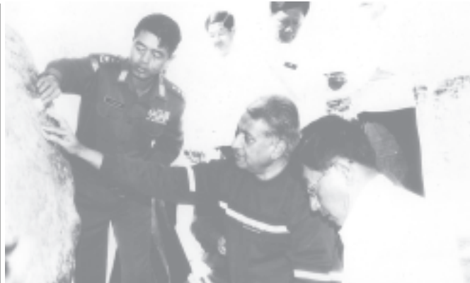
Nepalese Minister of Culture, Tourism and Civil Aviation Mr Deep Kumar Upadhyaya offers Shwethingan at Kyaukhtiyo Pagoda.