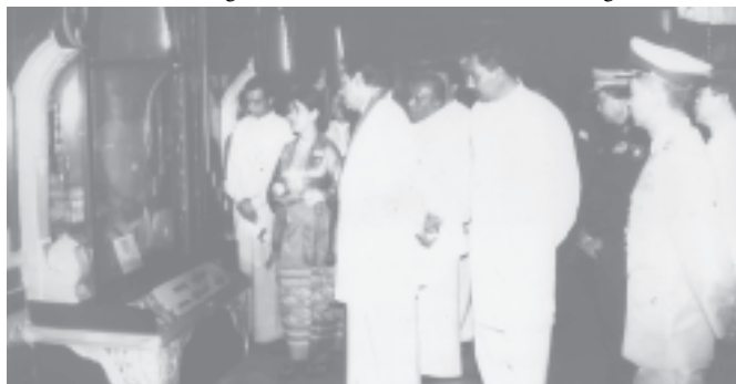
Sri Lankan Prime Minister Mr Mahinda Rajapakse and party visit National Museum. — MNA

The Sri Lankan Prime Minister then offered alms to the Sayadaw and left there in the evening. — MNA