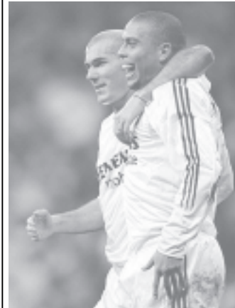
Real Madrid's Brazilian Ronaldo (R) celebrates his goal against Real Sociedad with teammate Frenchman Zinedine Zidane (L) during their Premier League football match in Santiago Bernabeu Stadium in Madrid. Spectators at Real Madrid's Santiago Bernabeu Stadium were evacuated following a bomb scare.