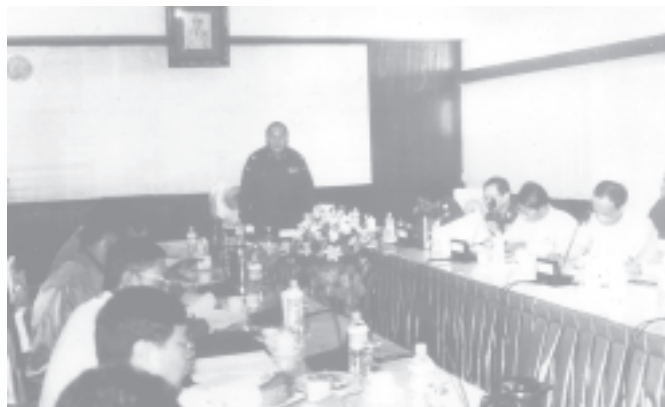
Minister Brig-Gen Thein Zaw addresses the meeting on providing assistance to hoteliers.