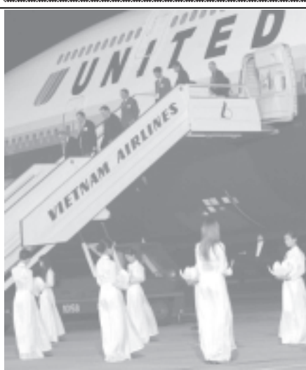
Passengers disembark from a United Airlines' Boeing 747-400 after the first passenger flight to Vietnam by a US carrier since the fall of Saigon in 1975.