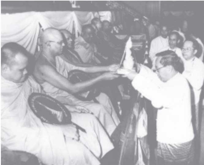
Prime Minister Lt-Gen Soe Win offers a Buddha Image to a Sayadaw in Maha Pasana Cave.—MNA