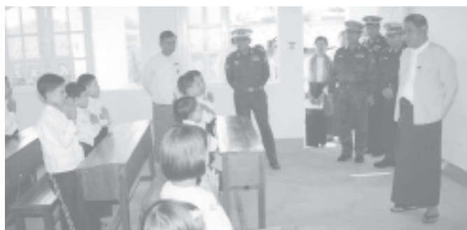
Minister for Education U Than Aung inspects classrooms of No 9 BEPS in South Okkalapa Township.—EDUCATION

It was attended by Minister for Construction Maj-Gen Saw Tun, Minister for Livestock and Fisheries Brig-Gen Maung Maung Thein, Minister for Education U Than Aung, Minister at the Prime Minister's Office Brig-Gen Pyi Sone, Deputy Minister for Construction Brig-Gen Myint Thein, Deputy Minister for Education Brig-Gen Aung Myo Min, departmental officials, officials of social organizations and