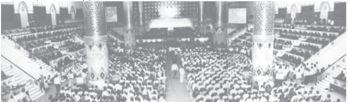
The opening ceremony of World Buddhist Summit in progress at Maha Pasana Cave on Kaba Aye Hill in Mayangon Township.

Emergence of the State Constitution is the duty of all citizens of Myanmar Naing-Ngan.