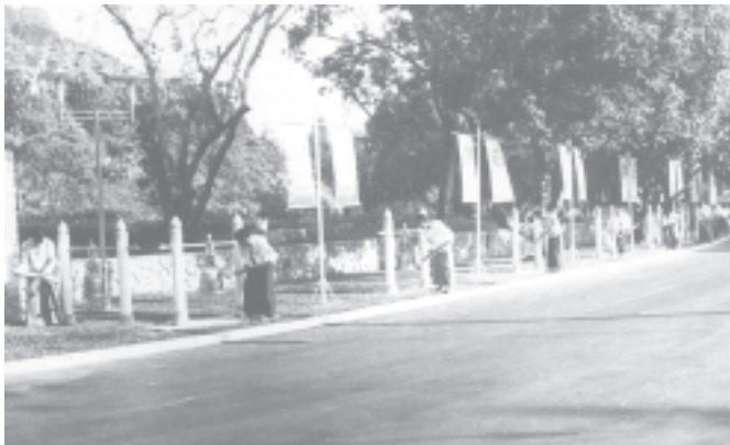
At the opening of the World Buddhist Summit, 108 bells are tolled simultaneously.