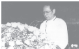
A delegate reads the message sent by the Bangladeshi Prime Minister.