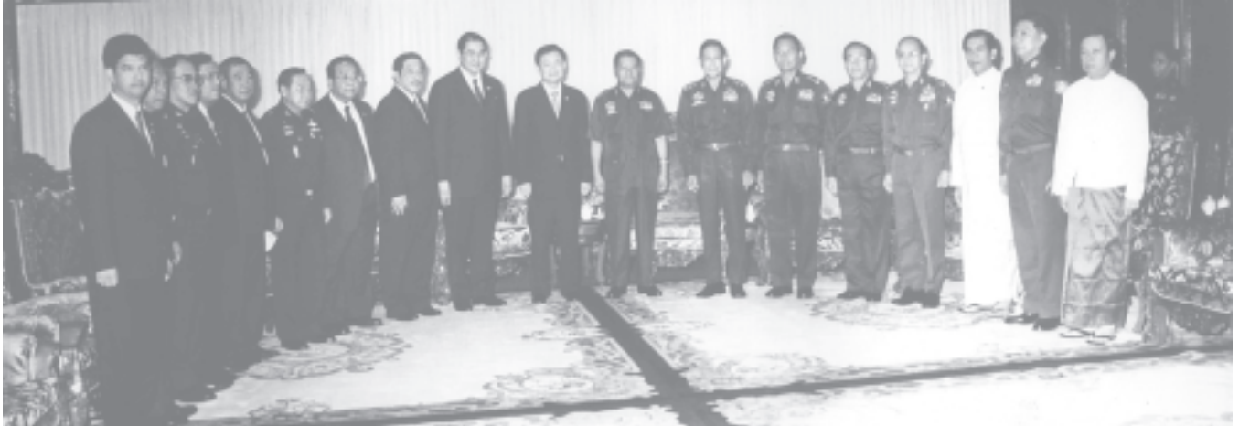
Senior General Than Shwe poses for documentary photo with Thai Prime Minister Dr Thaksin Shinawatra and party at Credentials Hall of Pyithu Hluttaw Building.