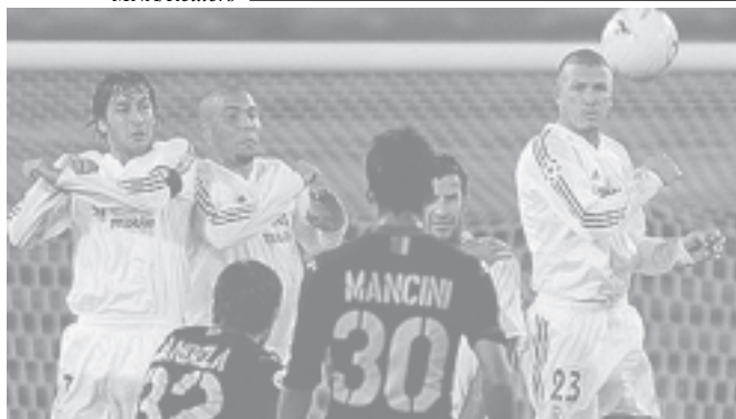
Real Madrid players forming a wall watch AS Roma's French midfielder Vincent Candela (#32) fire his free kick during their Champions League clash at Rome's Olympic Stadium.