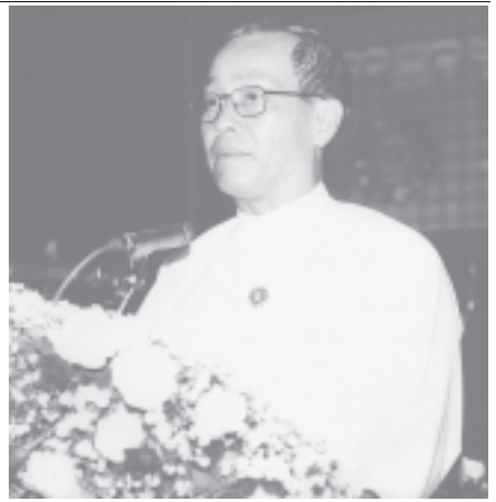
Prime Minister Lt-Gen Soe Win delivers an opening address at World Buddhist Summit.

The farmers, on their part, are required to grow 10 major crops suitable to the soil and climatic conditions of their respective regions, making effective use of water resources.