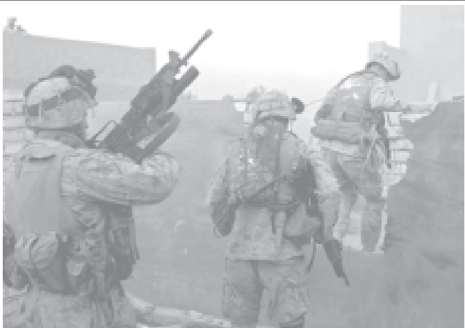
A picture released by the US Marines shows Marines jumping from rooftop to rooftop during their advance on an guerillas stronghold in Fallujah, 50 kms west of Baghdad. — INTERNET