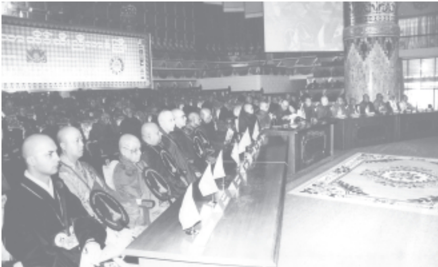
Most Venerable Sayadaws and Chiefs of Buddhist Ganas from various countries seen at the opening ceremony of World Buddhist Summit in Maha Pasana Cave.—MNA

Respective representatives also read the messages of Chinese Ambassador to Myanmar (See page 13)