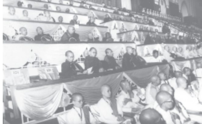
Members of the Sangha from abroad seen at the World Buddhist Summit.