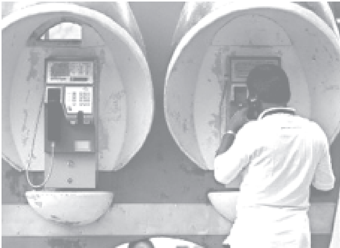
A man uses a Telekom Malaysian payphone in Kuala Lumpur on 6 Dec, 2004.