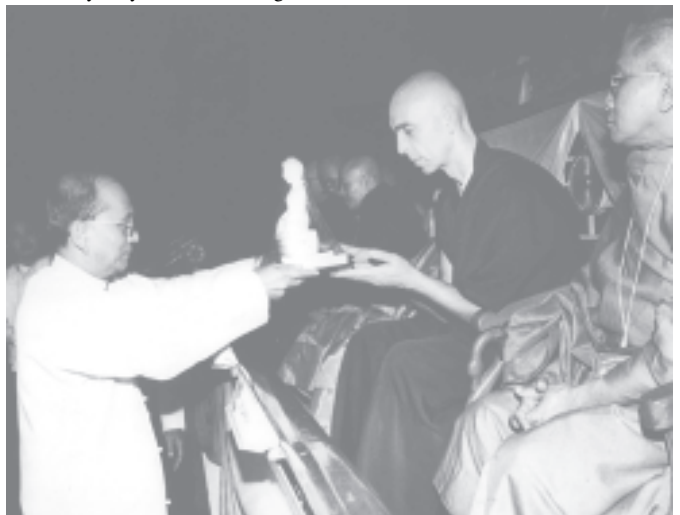
Secretary-1 Lt-Gen Thein Sein donates a Buddha Image to a Sayadaw in Maha Pasana Cave.