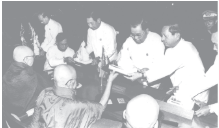
Senior General Than Shwe offers a Buddha image to a Sayadaw at World Buddhist Summit.

We should rid the world of the roots of all evils and sow the seeds of goodwill, tolerance, kindness and altruism for the sake of peace and prosperity Senior General Than Shwe sends Congratulatory Message to Summit