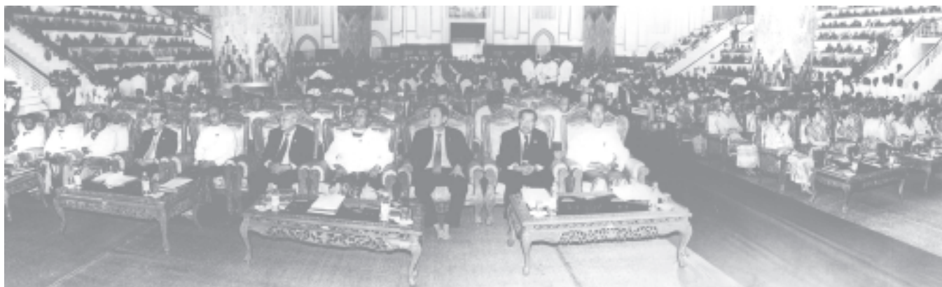
General Thura Shwe Mann, Prime Minister Lt-Gen Soe Win, Secretary-1 Lt-Gen Thein Sein and dignitaries seen at the World Buddhist Summit.

We also have to help propagate that understanding, compassion, love and assistance are the beautiful and indispensable virtues for mankind and the true noble goals of all religions