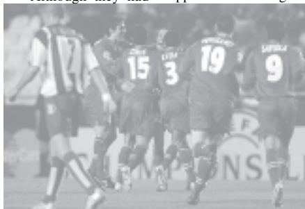
From 2nd L to R, AS Monaco's players Francois Modesto, Greek Andreas Zikos, Gael Givel, Patrice Evra, Sebastien Squillaci and Argentinian Javier Saviola celebrate their 2nd goal against Deportivo La Coruna next to Uruguayan Walter Pandiani (L).

nothing other than pride to play for, a second-string Depor made a promising enough start as Monaco took time to settle into their rhythm.