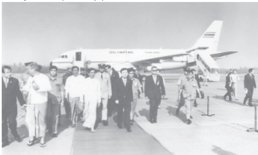
Prime Minister Dr Thaksin Shinawatra being welcomed at Yangon International Airport.