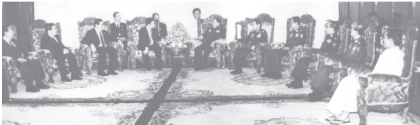
Senior General Than Shwe receives Thai Prime Minister Dr Thaksin Shinawatra and party at Credentials Hall of Pyithu Hluttaw Building. (News on page 16)