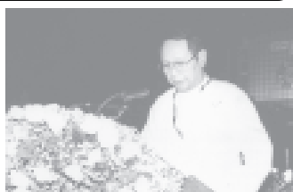
A delegate reads the message sent by the Bangladeshi President Prof Dr Iajuddin Ahmed.