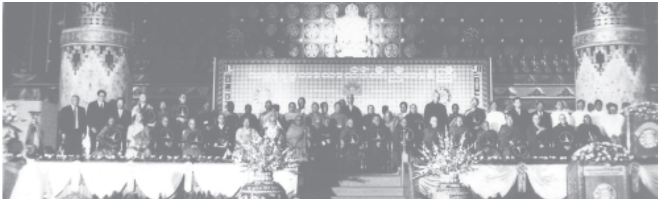
Sayadaws at home and abroad, Prime Minister Lt-Gen Soe Win and Buddhist leaders pose for documentary photos at the opening ceremony of World Buddhist Summit.—MNA