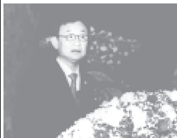
Dr Thaksin Shinawatra

It is a pleasure for me to be present at this august gathering of esteemed members of Maha Sangha, scholars, government representatives and Buddhists