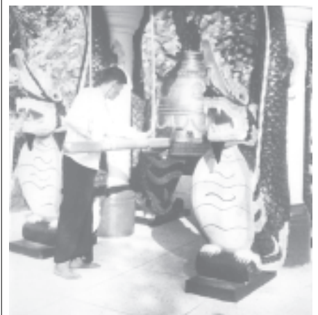
To mark the World Buddhist Summit, a bell is tolled for nine times.