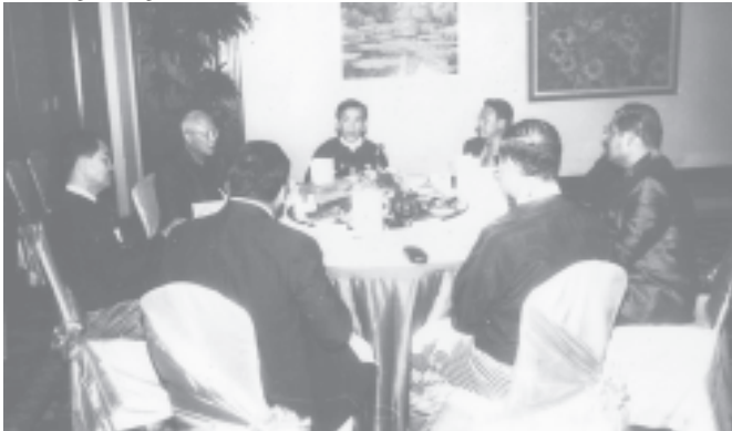
Minister for Foreign Affairs U Nyan Win hosts dinner to Cambodian Deputy Prime Minister Mr Lu Lay Sreng and party at Hotel Nikko Royal Lake.— MNA