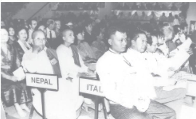
The congregation seen at the World Buddhist Summit.