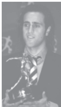
Iran's Ali Karimi holds the Asian Football Confederation's Player of the Year trophy.

Japan were honoured as the continent's top national team after retaining the Asian Cup and Saudi Arabia's Al Ittihad were named as the top club team after capturing the Asian Champions League title earlier this month.