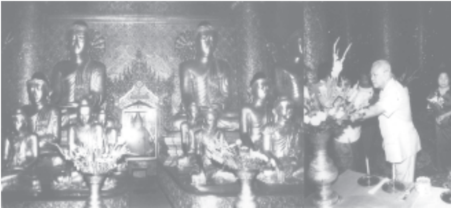
Cambodian Deputy Prime Minister Mr Lu Lay Sreng and party offer flowers to Buddha images at Shwedagon Pagoda.