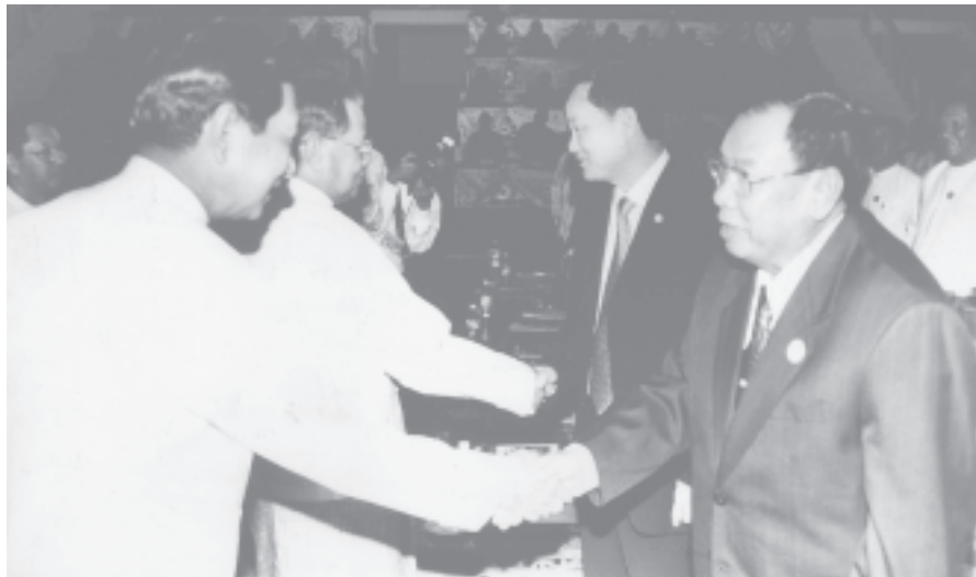
Senior General Than Shwe cordially greets Thai Prime Minister Dr Thaksin Shinawatra at Maha Pasana Cave.—MNA

Next, the opening ceremony of the World Buddhist Summit followed. Prime Minister Lt-