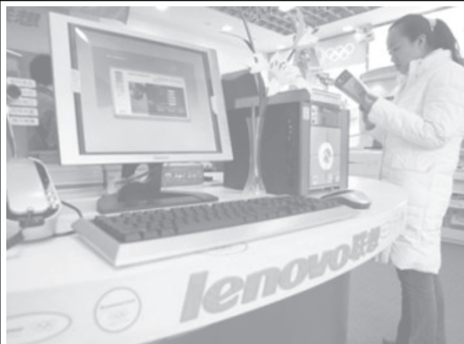
A Chinese woman examines a pamphlet near Lenovo computers on display at a computer shop in Beijing, China, on 8 Dec, 2004.