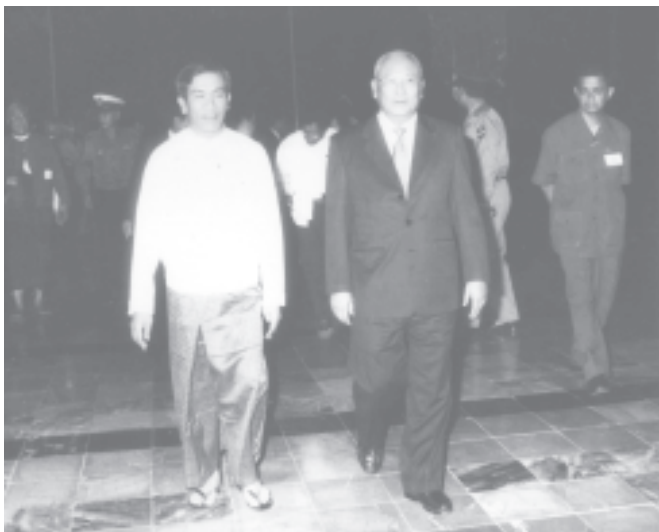
Cambodian Deputy Prime Minister Mr Lu Lay Sreng and party being welcomed at Yangon International Airport.