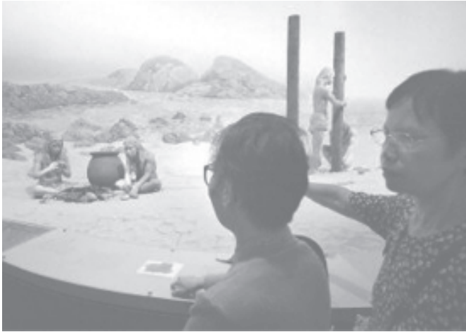
Two Mainland Chinese tourists look at a prehistoric Chinese scene recreated in a Hong Kong museum. A 9,000-year-old prehistoric preserved wine dug up from the Neolithic village of Juahu in northern China could be the ultimate vintage for wine snobs keen to impress.