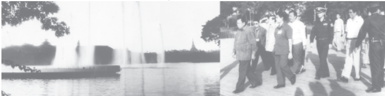
Lao PDR Prime Minister Mr Bounnhang Vorachith and party view all-round upgrading of Kandawgyi Lake.— MNA

After the visiting Prime Minister and party had observed the View Deck in Recreation Zone, they left there in the evening. — MNA