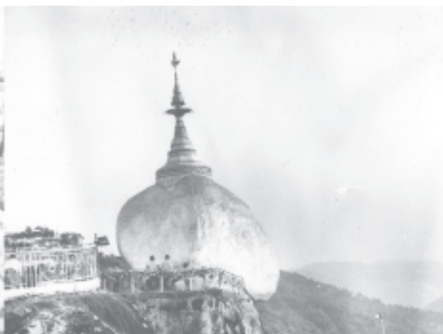
Laotian Prime Minister Mr Bounnhang Vorachith paying homage to Kyaikhtiyoe Pagoda in Kyaikto Township.