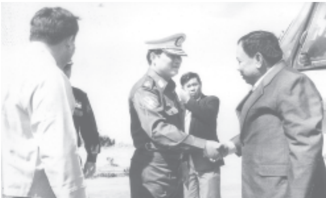
Commander Maj-Gen Thura Myint Aung greets Lao PDR Prime Minister Mr Bounnhang Vorachith at Kyaikhtyoe Pagoda.— MNA

The Laotian Prime Minister and party returned here in the afternoon. — MNA