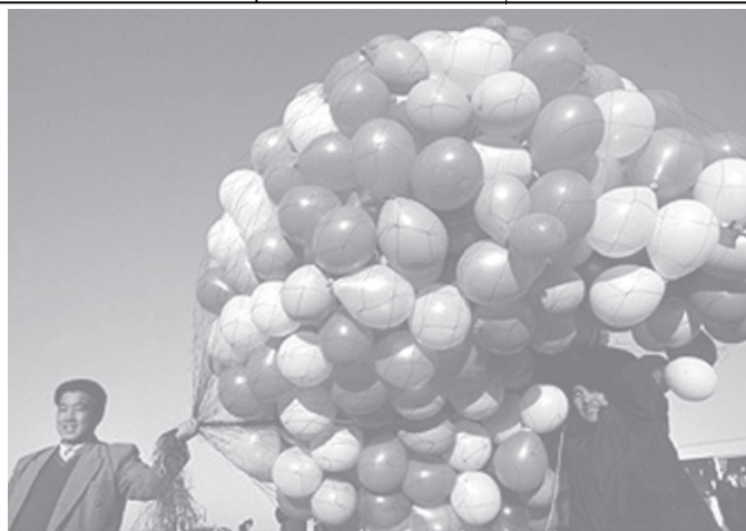
Balloons in Beijing: Chinese employees hold a huge bunch of balloons prior to the ground-breaking ceremony for a Daimler Chrysler plant in Beijing, attended by German Chancellor Gerhard Schroeder.