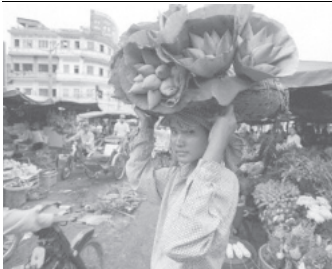
A girl displays lotus flowers on her head at a Phnom Penh market on 8 Dec, 2004.