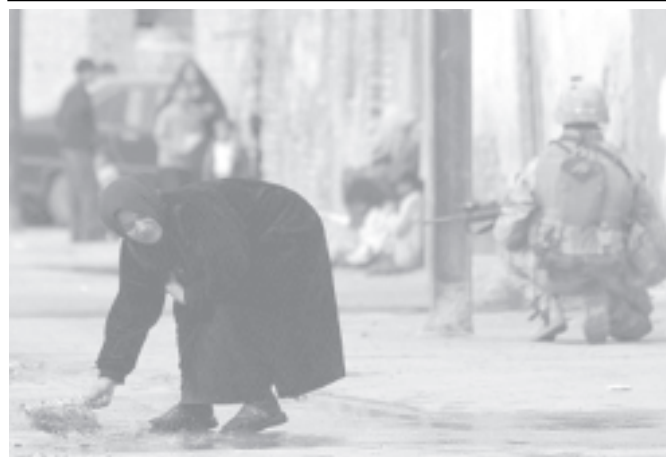
An Iraqi woman cleans the road outside her house as a US Marine patrols the central Iraqi city of Yusufiyah, south of Baghdad, on 7 Dec, 2004.

Britain and the United States have suffered around 1,070 losses in the war so far. The Iraq-wide casualty count is not known, and a high tally could wreak political damage in Britain, where Blair is expected to win a 2005 election but with a reduced majority.