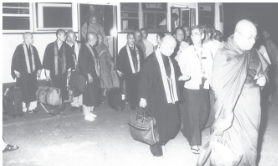
Japanese Sayadaus being welcomed at Yangon International Airport.

Buddhist delegations from the United States of America, Indonesia, Singapore and Bangladesh, and Mongolian Buddhist delegation