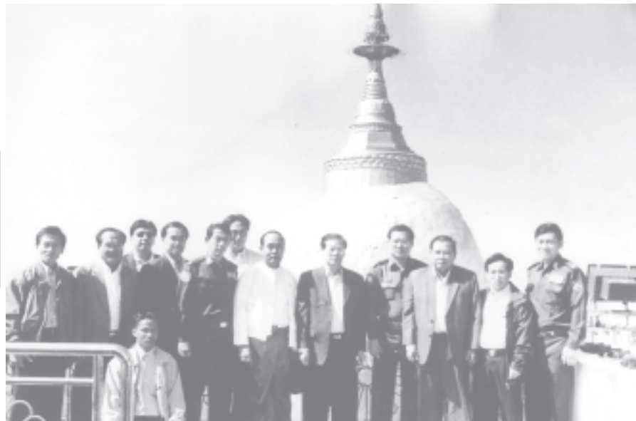
Laotian Prime Minister Mr Bounnhang Vorachith and party pose for documentary photo at Kyaikhtyoe Pagoda.