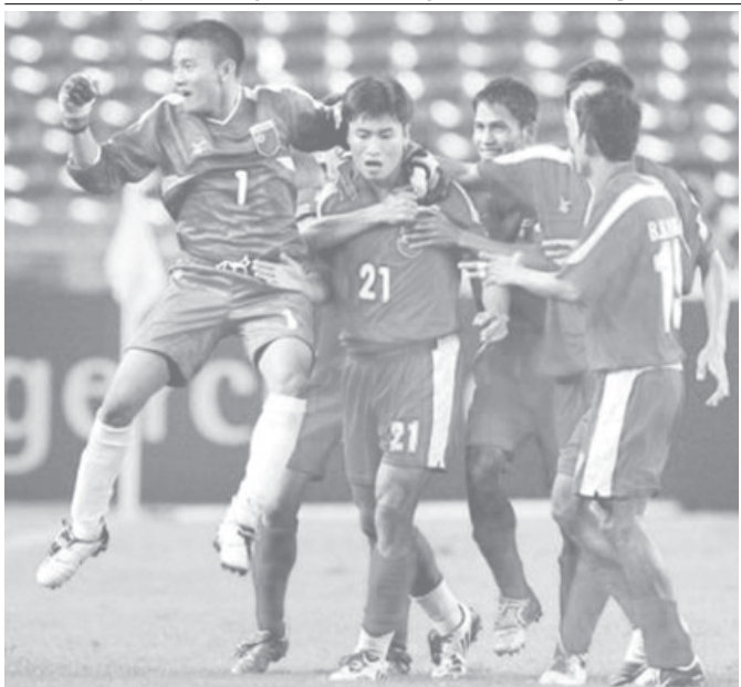
Myanmar's San Day Thein (2nd L) is surrounded by his teammates after scoring the only goal in a match against Philippines during Tiger Cup ASEAN Football Tournament 2004 in Kuala Lumpur on December 8, 2004. Myanmar beat Philippines 1-0.