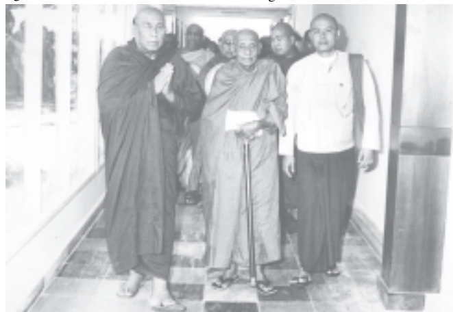
Sri Lankan Sayadaus being welcomed at Yangon International Airport.— MNA

Arrival of Singaporean Sayadaus seen at the airport.— MNA