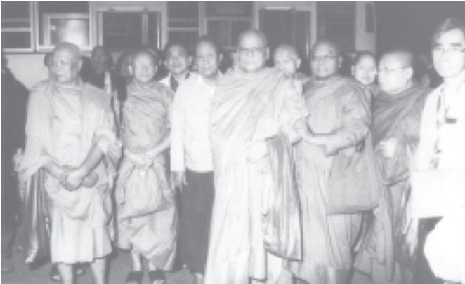
Thai Sayadaws being welcomed at Yangon International Airport. (News on page 16)—MNA