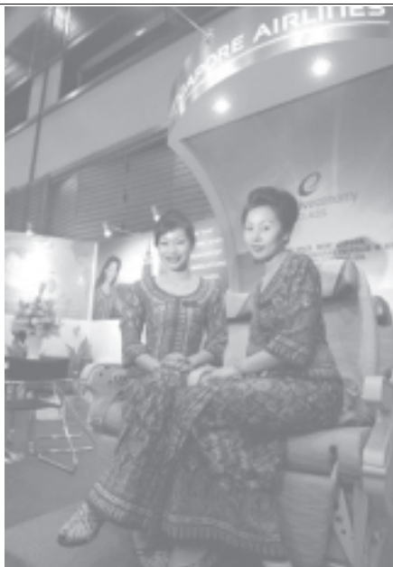
Singapore Airlines staff smile at their booth in a Bangkok travel exhibition recently.