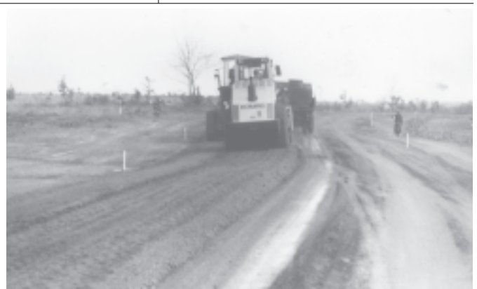
Construction of Thityagauk-Sanmagyi-Koebin Road in progress in Magway Division. — CONSTRUCTION