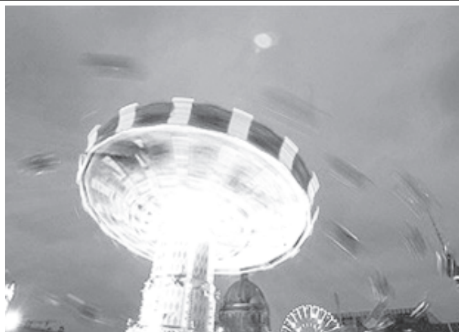
Merry Christmas: A lightened merry-go-round, part of a Christmas market, is seen turning next to Berlin's Dome (C) and the TV tower (R).

Motorists were urged to watch their speed, not to drink, buckle up and switch on their headlights at all times. "Be sensible and Arrive Alive," a statement from the organization read. —MNA/Reuters