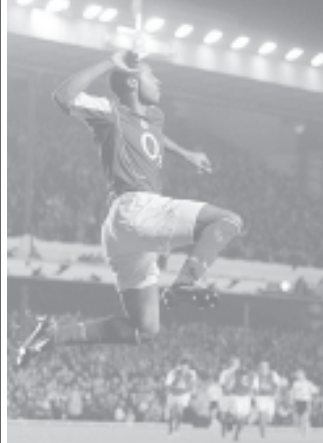
Arsenal's Thierry Henry celebrates scoring against Rosenborg during their Champions League football match at Highbury in London.

Although Rosenborg played slightly better after the break they were only saved from a bigger mauling because of some wasteful Arsenal attacking.