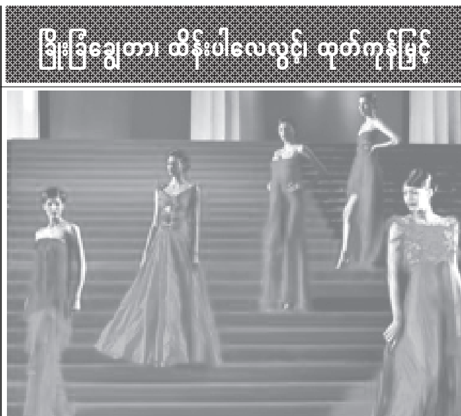
India models showcase outfits by Italian designer Valentino during a fashion show in Bombay on 5 Dec, 2004. The show was part of the Italian festival in Bombay. Picture taken on 5 December.—INTERNET