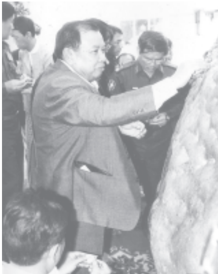
Lao PDR Prime Minister Mr Bounnhang Vorachith offers gold foils to Kyaikhtyoe Pagoda.