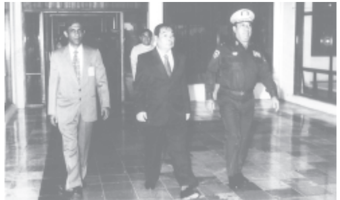
Deputy Minister Brig-Gen Phone Swe and party being seen off at the airport.

The delegates were seen off at Yangon International Airport by Minister for Home Affairs Maj-Gen Maung Oo, officials from the Indian Embassy to Myanmar, officials of Myanmar Police Force and departments and