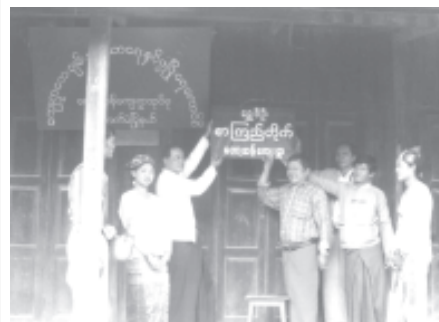
A self-reliant library being opened in TotSan Village in Kyaukse Township, Shan State (North) recently. — KYEMON

Official statistic shows that the number of libraries has increased to 10,598 nationwide up to 7 December. There are 60,000 hamlets and villages across the country. Therefore, IPRD urged wellwishers to help the ministry provide books on general knowledge and cash assistance. — KYEMON