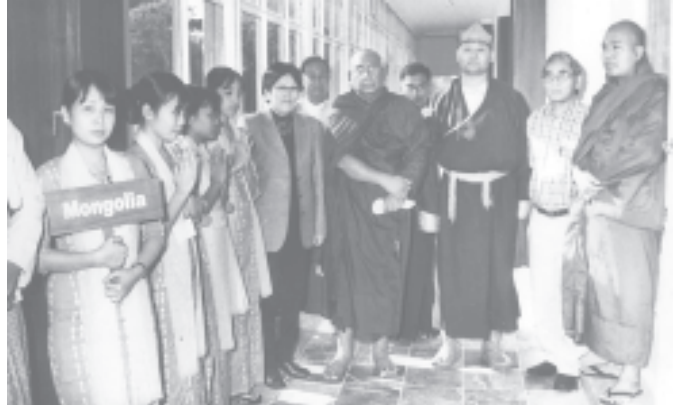
Mongolian Sayadaws being welcomed at the airport. (News on page 16)