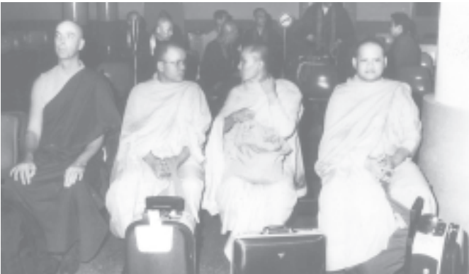
The Chief of Maha Nikaya Gana of Cambodia and party seen at the airport. (News on page 16) —MNA