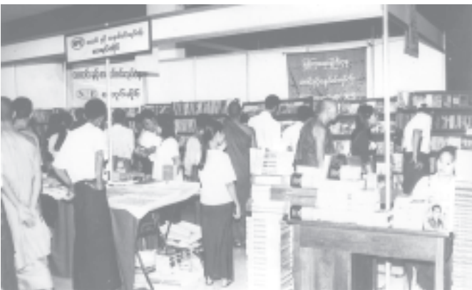
Bookworms seen at Sarsodaw Day commemorative Book Fair.

After that, the commander gave instructions on efforts to be made for regional developments. He proceeded to Mawlamyine University and inspected measures being taken for construction tasks in front of the main building and left necessary instructions there.