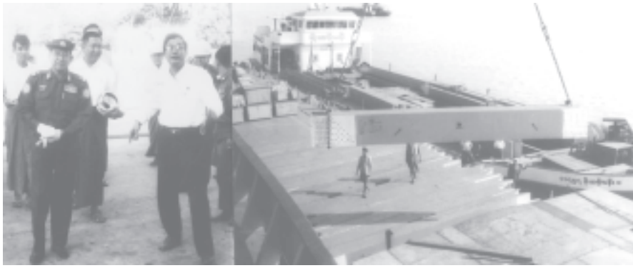
Minister for Construction Maj-Gen Saw Tun inspects unloading of iron beams for Ayeyawady River Bridge (Yadanabon). — CONSTRUCTION