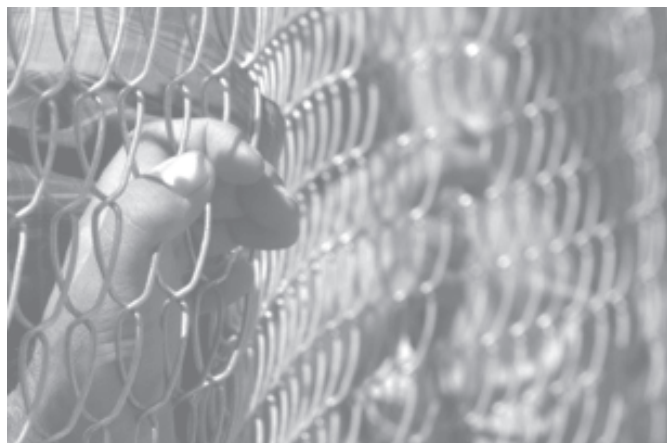
Iraqi detainees hold a fence at Abu Ghraib prison on 6 Dec, 2004.

No official figures are available for the numbers of Iraqi dead. Estimates have ranged from some 14,000 to tens of thousands of civilians and around 5,000 troops in the war. A US soldier was killed in Baghdad Tuesday when his patrol came under fire, the US military said in statement. — Internet