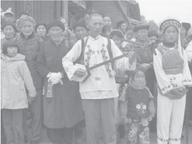
An elderly musician performs among the crowd, wearing colourful traditional dress of China's ethnic Bai group, as they gather at the market place of Sideng town recently.