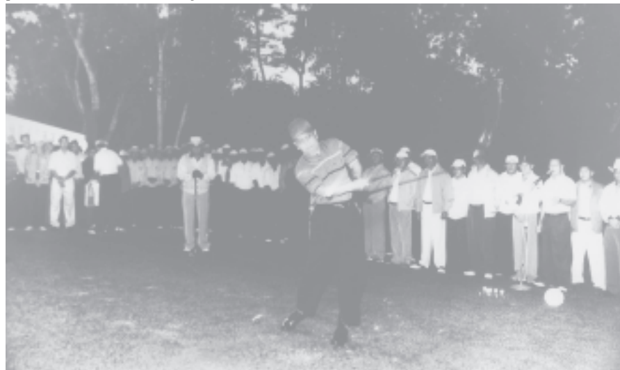
Secretary-1 Lt-Gen Thein Sein tees off a smoke ball to open the State Peace and Development Council Chairman's Trophy Golf Tournament.