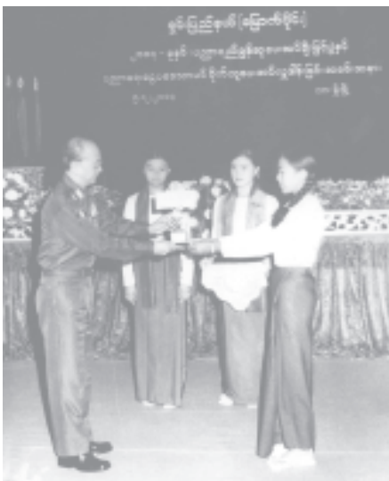
Lt-Gen Thein Sein presents a prize to an outstanding student.