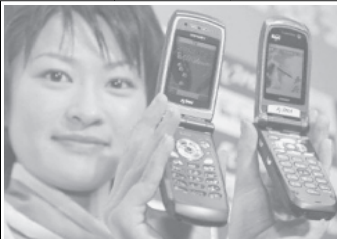
Japanese Internet firm Softbank said it aims to enter the mobile phone industry supplying third-generation (3G) services, which are currently only in the hands of NTT DoCoMo.—INTERNET