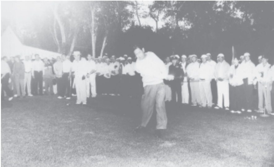
Vice-Senior General Maung Aye tees off smoke ball to open the State Peace and Development Council Chairman's Trophy Golf Tournament 2004.