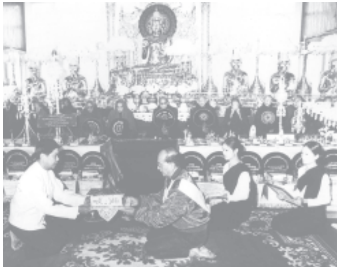
Secretary-1 Lt-Gen Thein Sein accepts K 200,000 donated by Minister for Electric Power Maj-Gen Tin Htut and family.