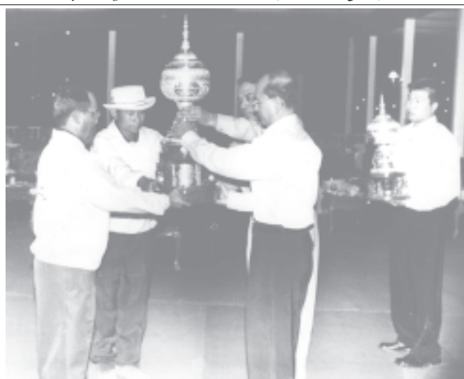
Lt-Gen Thein Sein presents the bowl to Ministry of Defence Team who comes first in State Peace and Development Council Chairman's Trophy Golf Tournament. (News on Page 16)