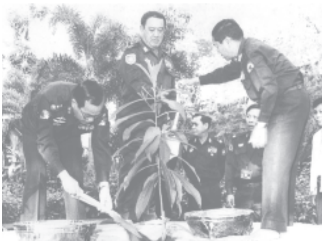
Lt-Gen Soe Win plants an Ingyin Tree near the southern entrance of Maha Pathana Cave. (News on Page 16)