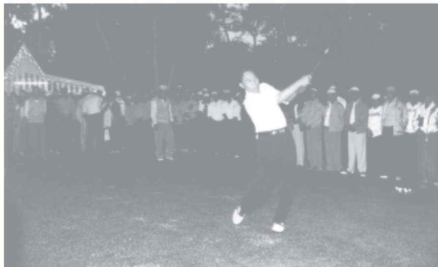
General Thura Shwe Mann tees off a smoke ball to open the State Peace and Development Council Chairman's Trophy Golf Tournament.

Next, Secretary-1 Lt-Gen Thein Sein, on be-