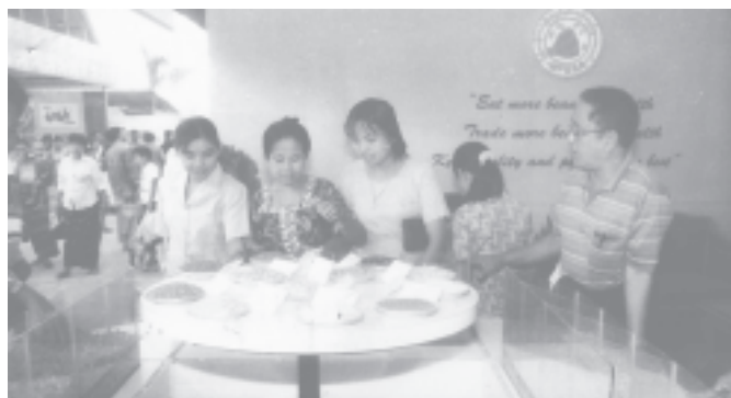
Booth of UMFCCI being displayed at First CLMTV-ECS Trade Fairs-2004.

At the fair, wood-based furniture, electronic appliances, traditional medicines, plastic pipes, personal goods, seafood, traditional costumes, paints, foodstuff and sculptures are on display. Cultural troupes from the Fine Arts Department of Myanmar and traditional cultural troupes from Thailand and Cambodia entertained the audience with dances. Eight ministries, 135 local companies and 21 foreign companies participated in the fair, and the number of today's visitors totalled to some 60,000. Today's sale of the trade fair fetched K 17,924,838. The sale from the beginning to date fetched K 32,901,451 and the trade fair continues until 7 December.—MNA