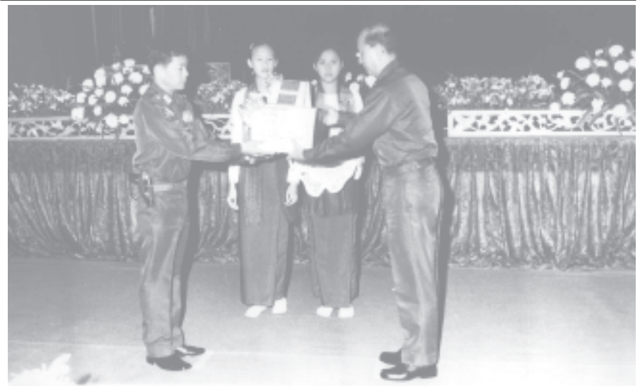
Lt-Gen Thein Sein accepts K 60 million for savings account book presented by Commander Maj-Gen Myint Hlaing. — MNA

Myint Hlaing presented K 60 million for savings account book to the Secretary-1. Deputy Minister Brig-Gen Aung Myo Min reported on Myanmar's education promotion pro-