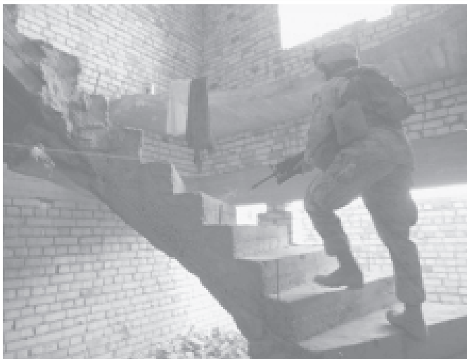
A US Marine searches a building in the central Iraqi city of Mahmudiyah, south of Baghdad on 5 Dec 2004.