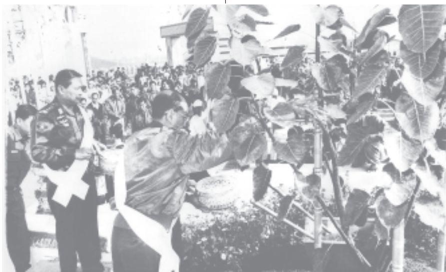
Lt-Gen Thein Sein sprinkles scented water onto Bo Tree at Wizayabumi Maha Aungmyay Hill in Lashio.

Next, Secretary-1 Lt-Gen Thein Sein performed the rituals of golden and silver showers to mark the success of the ceremony.—MNA