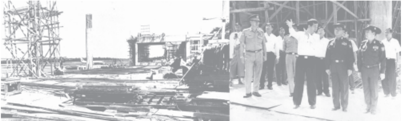
Prime Minister Lt-Gen Soe Win inspects extension project of Yangon International Airport.