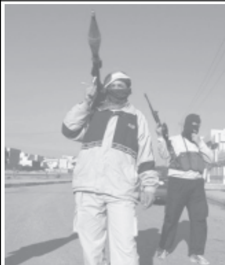
Armed guerillas take to a street in the northern Iraqi town of Mosul, on 5 Dec, 2004.—INTERNET

The wounded soldiers were evacuated to a Mosul military hospital for treatment. — MNA/Xinhua