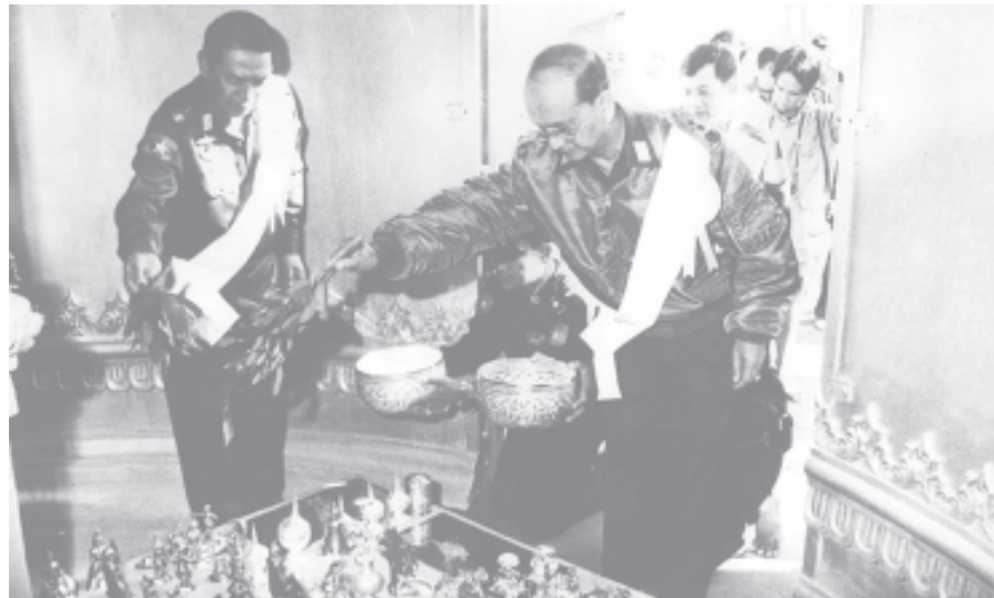
Lt-Gen Thein Sein sprinkles scented water onto relics.

Next, the ceremony to enshrine relics in Yandaing Aung Hsutaungpyi MyoU Pagoda followed.