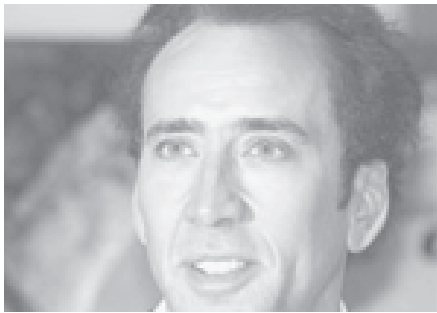
Nicolas Cage logged a third weekend atop the North American box office on Sunday with his action-adventure "National Treasure".

The only new entry in the top 10 was director Mike Nichols' potty-mouthed adultery drama "Closer," which opened at No 6 with $7.7 million, a hefty number for a limited release.