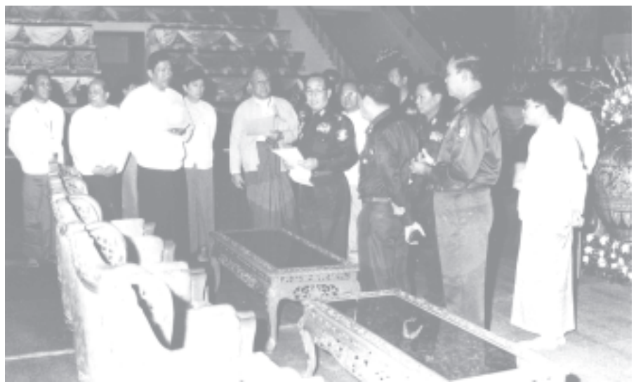
Prime Minister Lt-Gen Soe Win inspects rehearsal at Maha Pasana Cave for World Buddhist Summit. MNA