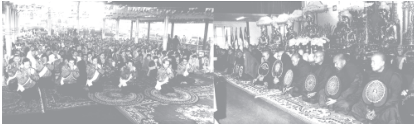
Secretary-1 Lt-Gen Thein Sein and congregation receive the Nine Precepts at a ceremony to enshrine relics in Yandaing Aung Hsutaungpyi MyoU Pagoda in Lashio.