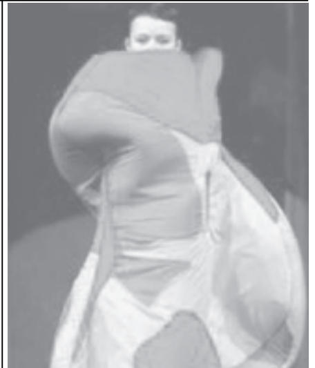
A Russian model sports creation by a young fashion designer during an avant-garde fashion show contest in St Petersburg, recently.