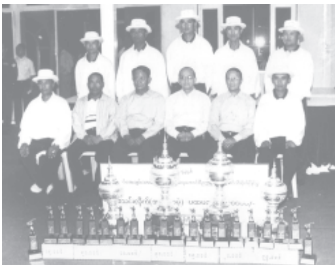
Lt-Gen Thein Sein, Ministers U Aung Thaung and Brig-Gen Thura Aye Myint pose for a documentary photo together with golfers of the Ministry of Defence Team. — MNA

1999. Five more monastic schools have been opened in the township including in hill regions, and 324 students are attending classes at the schools. The minister met with USDA members in Toungoo District USDA Office, Pyu Township Office and Bago Division Office, and urged them to take part in the successful materialization of the seven-point future policy programme of the State. MNA