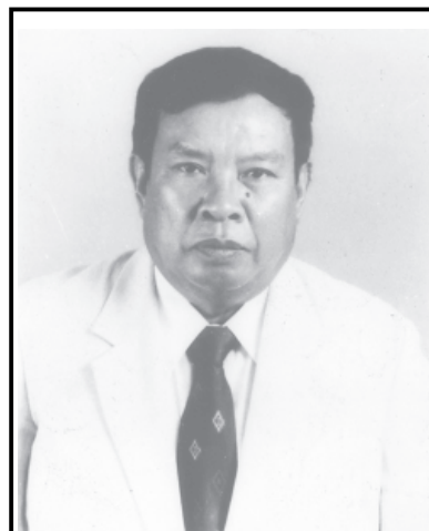
Mr Bounnhang Vorachith.