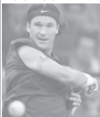
Carlos Moya crushed Andy Roddick on Sunday to win the Davis Cup for Spain.

Moya won over the American 6-2, 7-6 (7-1), 7-6 (7-5) before a 27,000