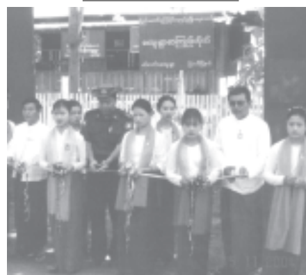
Photo shows opening ceremony of a library in Minlatpan Village in Myawady Township.