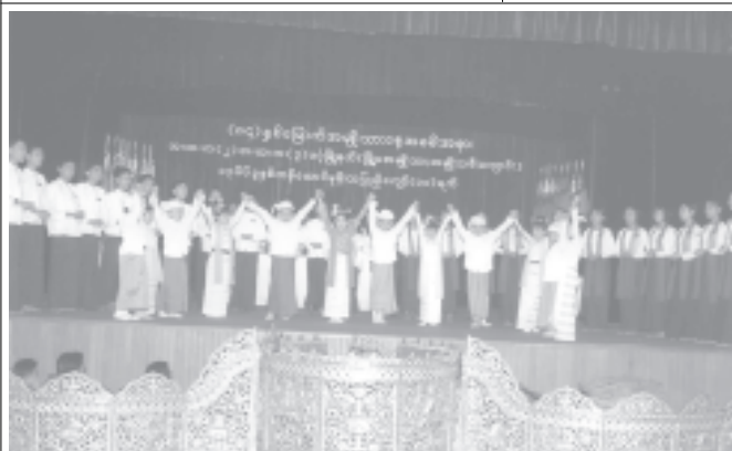
Students of Dagon BEHS-2 and 3 entertain with dance and song at the celebration of 84th Anniversary National Day at the hall of BEHS-2 Dagon.