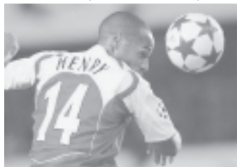
Thierry Henry struck two late goals to help Arsenal maintain the pressure on leaders Chelsea with a 3-0 victory over Birmingham City at Highbury.