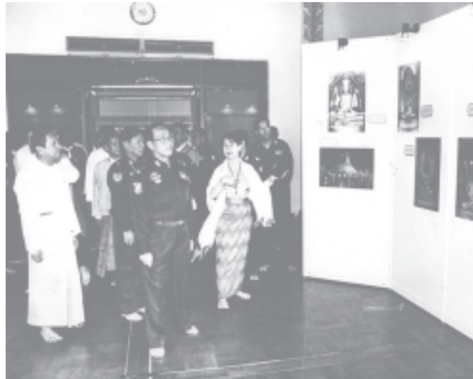
Lt-Gen Soe Win inspects Photo Exhibition on the Essence of Buddhism at Wizaya Mingala Dhamma Thabin Hall. (News on Page 16)