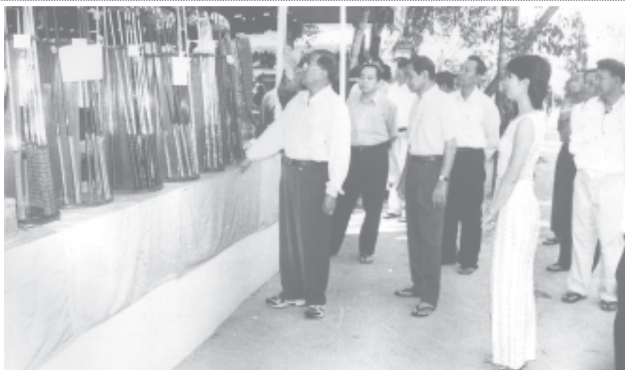
Senior General Than Shwe inspects golf accessory shops at Yemon Kyunthaya Golf Course in Hlegu Township.