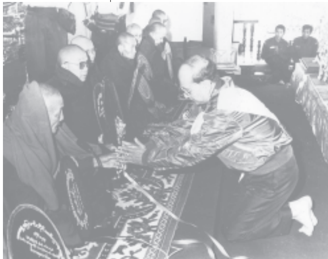
Lt-Gen Thein Sein presents Yadana Seinbudaw, Shwehtidaw, golden and silver padethabins and gold casket donated by Senior General Than Shwe and wife Daw Kyaing Kyaing, and family to a Sayadaw. — MNA

ister's Office Brig-Gen Pyi Sone and family; K 200,000 by Minister for Electric Power Maj-Gen Tin Htut and family; K 5 million by Asia World Co Ltd; K 2.7 million by Hsenwi Station; K 2.7 million by Tangyan Station;