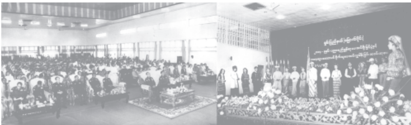
BEHS students in Lashio entertain Lt-Gen Thein Sein and party with songs at a ceremony to honour outstanding students in Shan State (North).