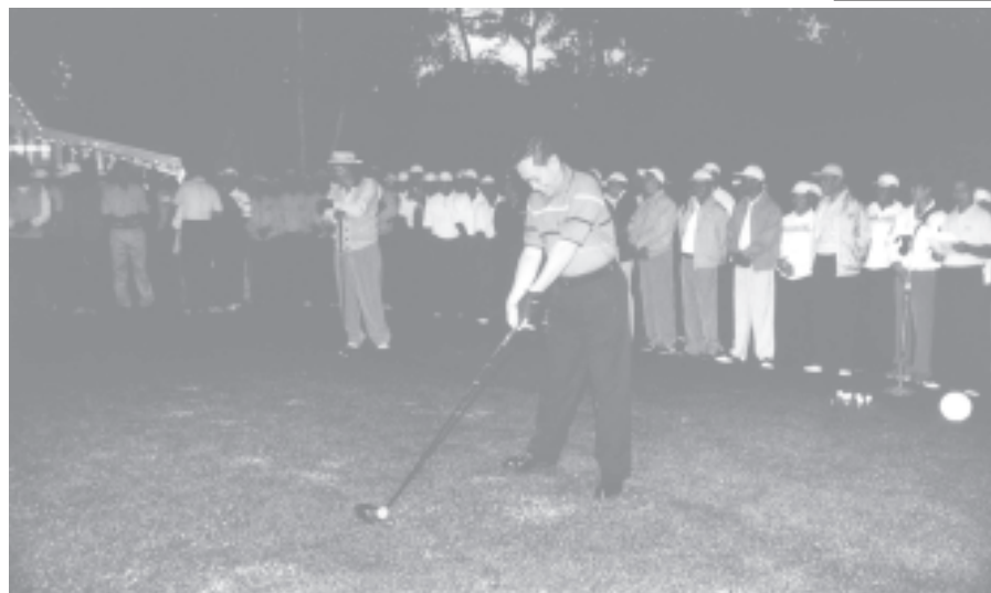
Prime Minister Lt-Gen Soe Win tees off a smoke ball to open the State Peace and Development Council Chairman's Trophy Golf Tournament.

half of State Peace and Development Council Chairman Senior General Than Shwe, presented championship awards to the leader of the Ministry of Defence team in the team handicap event and the leader of the Ministry of Defence team in the scratch event.