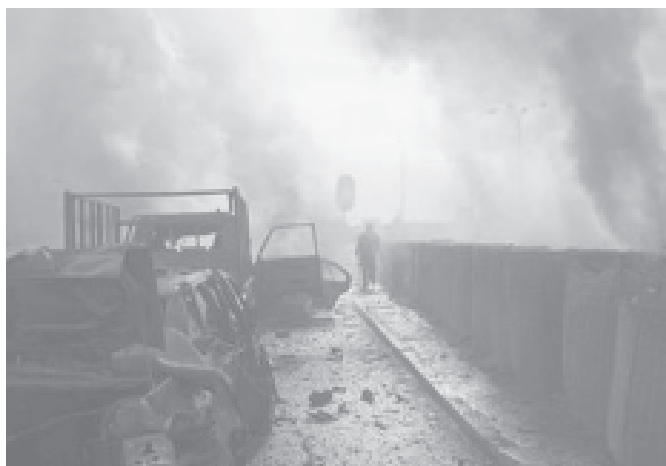
Smoke and steam rise from a mass of vehicles destroyed by two car bombs which detonated in front of a police station near a checkpoint to Baghdad Green Zone on 4 Dec, 2004.—INTERNET

Garments valued at 5.37 million US dollars were exported to the United States last month, while the figure was eight million dollars in November 2003, the data revealed—MNA/Xinhua