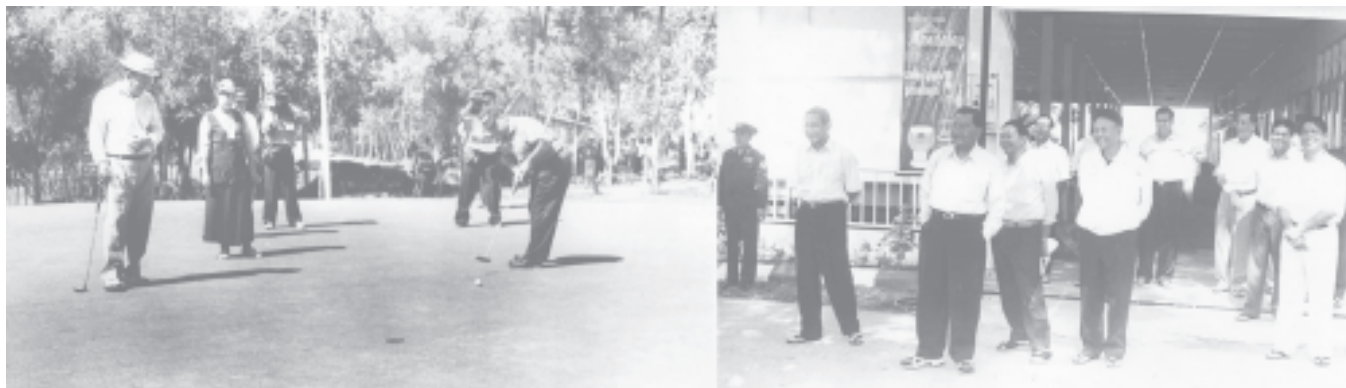
Senior General Than Shwe watches State Peace and Development Council Chairman's trophy Golf Tournament.