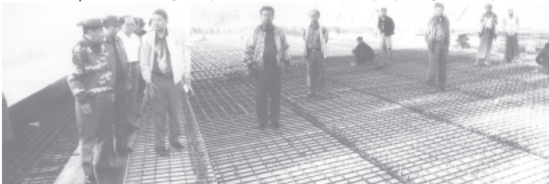
Lt-Gen Ye Myint looks into the construction site of Myitnge Bridge Project.

Emergence of the State Constitution is the duty of all citizens of Myanmar Naing-Ngan.