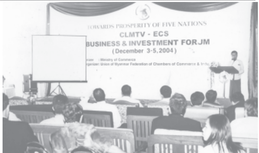
The CLMTV-ECS Business & Investment Forum-2004 in progress.