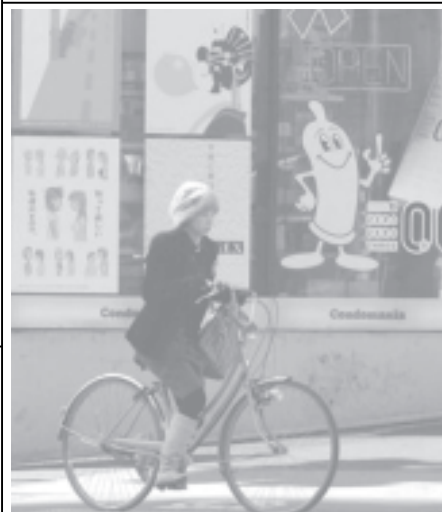
A young girl waits on a bicycle to cross the street in front of a poster in Tokyo, capital of Japan, on 1 Dec, 2004 on World AIDS Day. The main theme of this year's World AIDS Day is on the need to protect women and girls, often sidelined in the fight against the disease.