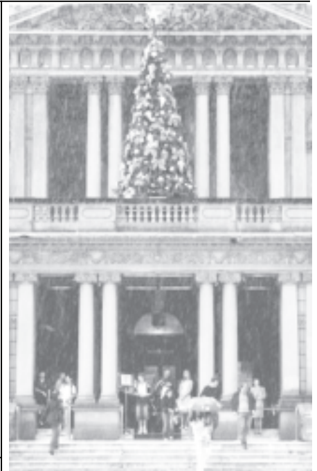
A single Christmas tree decorates the Town Hall in Sydney on 3 Dec, 2004.