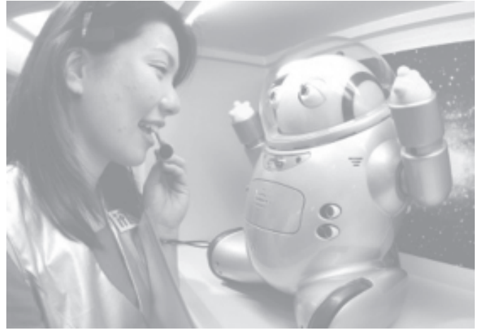
A woman chats with Japanese Business Design Laboratory's communication robot 'Ifbot' at the robot exhibition Robodex 2003' in

The US Government's frequent sanction upon Chinese companies according to its domestic law is not conducive to the effective cooperation between the two countries in the non-proliferation area, she said. — MNA/Xinhua