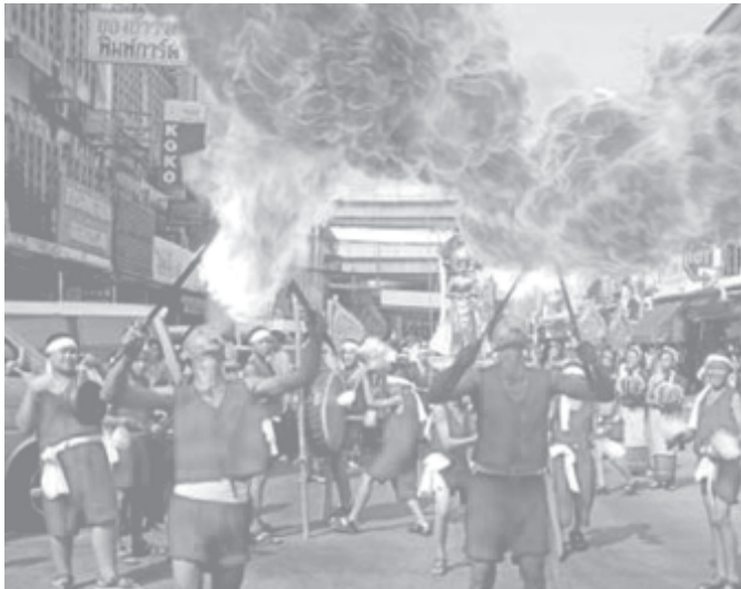
Thai students in traditional dress perform fire stunts during a parade to mark World AIDS Day, in Bangkok on 1 Dec, 2004.