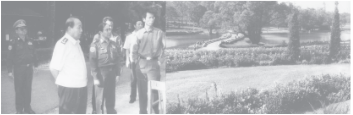
Deputy Chief of the General Staff of the People's Liberation Army of the People's Republic of China General Ge Zhenfeng and party visit Pyin Oo Lwin National Gardens.

On arrival at Mandalay International Airport in Tada U Township, they were welcomed by Mandalay Division Peace and Development Council