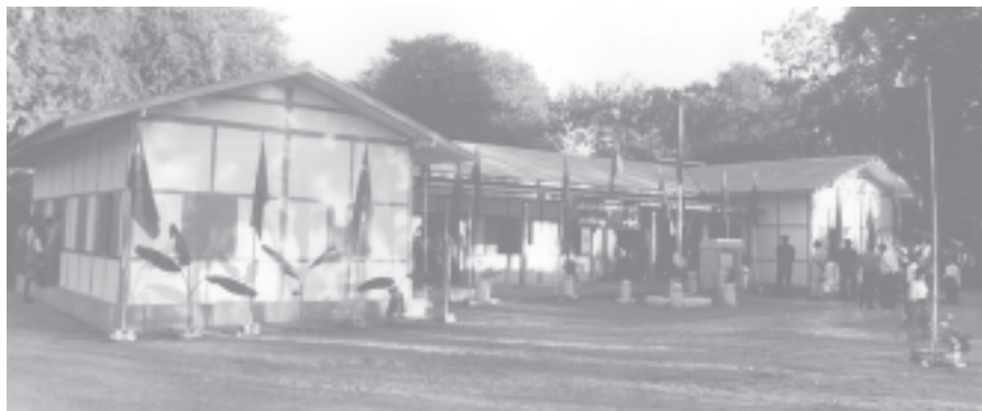
Newly-built basic education primary school in Ohnnauk village, Pale Township.