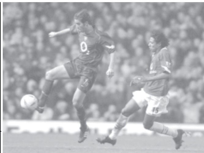
Manchester United's Kleberson (R) fights for the ball with Arsenal's Mathieu Flamini. Kleberson has been ruled out of action until the New Year after incurring an ankle injury in Manchester United's midweek League Cup win over Arsenal.