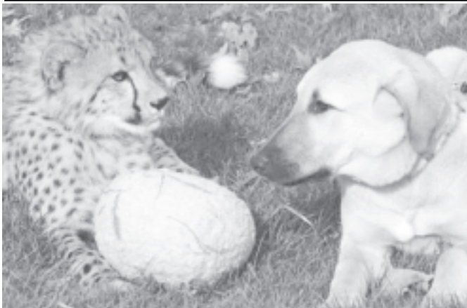
Bravo, a 7-month-old male cheetah cub, takes a break with CJ, a 5-month-old Anatolian shepherd puppy, on 3 Dec 2004, at the Cincinnati Zoo in Cincinnati. The two just arrived at the zoo from Cape Town, South Africa, along with another cheetah cub.