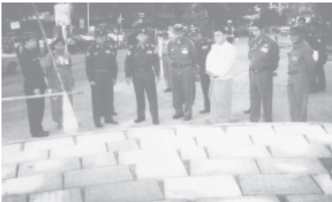
Commander Maj-Gen Myint Swe inspects tasks for upgrading of Yangon City.

The commander and party inspected repair of pavements at the corner of Shwebontha Street and Anawrahta Street in Pabedan Township, sanitation tasks being carried out and dredging of drains and spraying of insecticide, tarring of Bagaya Road linking Dhamma Zedi Road in