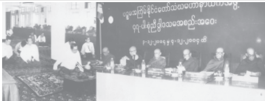
Minister Brig-Gen Thura Myint Maung attends the 12th 47-member plenary meeting of the fifth State Sangha Maha Nayaka Committee.