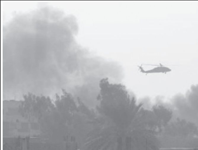
A US Army Black Hawk helicopter flies past smoke after several loud explosions rocked Baghdad on 2 Dec, 2004.