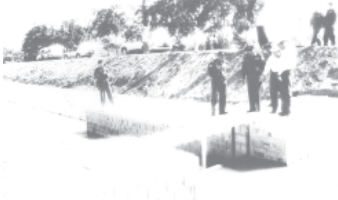
Lt-Gen Ye Myint inspects supply of water from Thittetkon Dam through an outlet canal of Kinda main canal in TadaU Township, Mandalay Division.

Lt-Gen Ye Myint inspected the site for water pumping station and the main canal. He also inspected Thukaungti river water pumping project