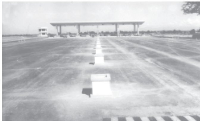
Meiktila-Mandalay Section of Yangon-Mandalay Union Highway Project under construction. — MNA

They arrived back at Mandalay in the evening to spend the night there. —MNA