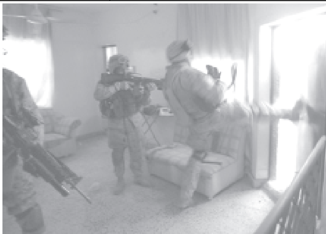
US Marines search a house in the restive city of Fallujah on 2 Dec, 2004.