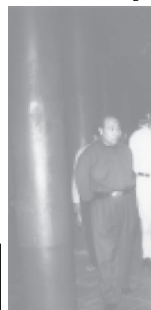
General Ge Zhenfeng and party at the Cultural Museum of Myanansankyaw Golden Palace in Mandalay.