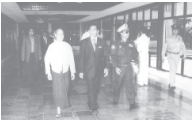
Minister U Nyan Win being seen off at the airport.

Minister U Nyan Win was accompanied by Director-General U Tint