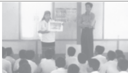
Medical staff give educational talks on AIDS.

The Myanmar delegation arrived back here yesterday evening and were welcomed at the Yangon International Airport by Minister for Forestry Brig-Gen Thein Aung, Minister at the Prime Minister's Office Brig-Gen Pyi Sone and officials.—MNA