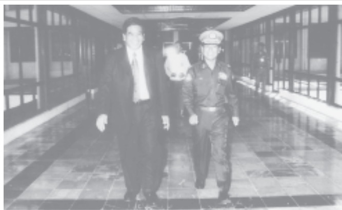
Laotian Commerce Minister Mr Soulivong Daravong and party seen off at the airport.

They were seen off at the Yangon International Airport by Deputy Minister for Commerce Brig-Gen Aung Tun, Director-General of Directorate of Trade U Nyunt Aye and officials of Laotian Embassy to Myanmar.—MNA