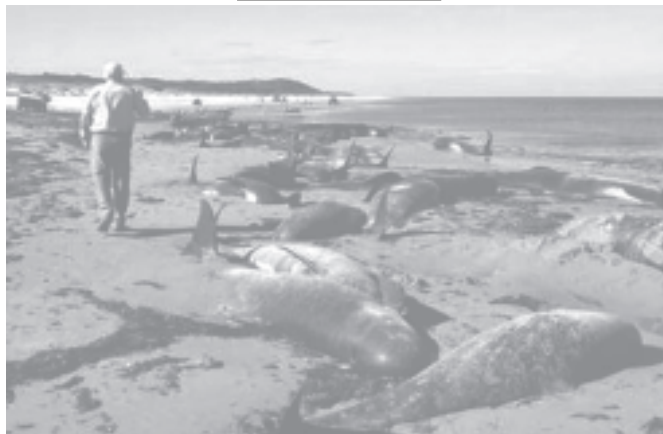
A local walks past carcasses of stranded long-finned pilot whales and bottlenosed dolphins at Sea Elephant Beach on Tasmania's King Island in southeast Australia, on 28 Nov, 2004. More than 100 of the mammals mysteriously beached themselves in a mass stranding which was repeated at another beach on the island states' south-east coast, on 29 Nov, 2004.