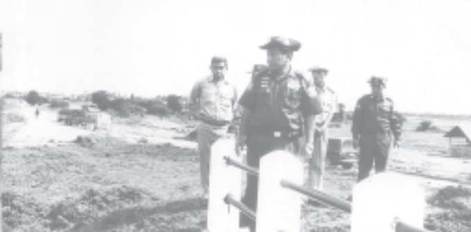
Lt-Gen Ye Myint inspects Thugaungte Water Pumping Station Project near Auknyint Village in NyaungU Township, Mandalay Division.

YANGON, 4 Dec — Member of the State Peace and Development Council Lt-Gen Ye Myint of the Ministry of Defence, accompanied by officials of the State Peace and Development Council Office