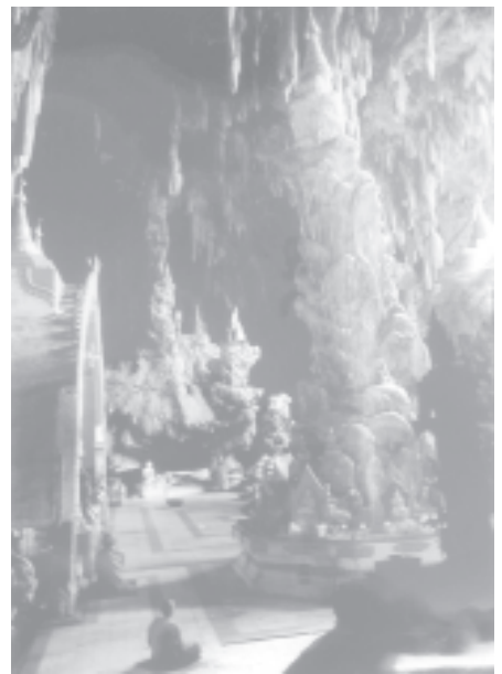
The third-prize winning work.

The prize presentation ceremony will be held at YMCA at 9 am on 11 December.