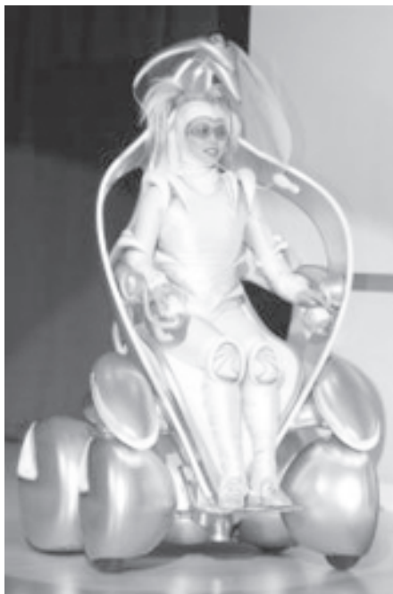
Toyota Motor Corp's new concept vehicle i-unit is driven in during its unveiling performance in Tokyo on 3 December, 2004.