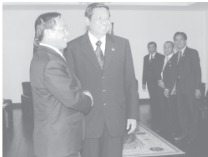
Prime Minister Lt-Gen Soe Win and Indonesian President Mr Susilo Bambang Yudhoyono shake hands. — MNA

present were Minister for National Planning and Economic Development U Soe Tha, Minister for Foreign Affairs U Nyan Win, Myanmar Ambassador to Laos U Tin Oo and directors-general of the Ministry of Foreign Affairs of Myanmar, and Minister of Foreign Affairs of Brunei Prince Haji Mohamed Bolkiah and high level officials. — MNA