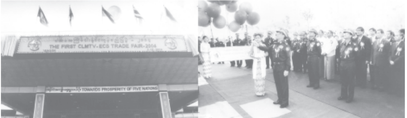
Prime Minister Lt-Gen Soe Win presses the button to unveil the signboard to open the first CLMTV-ECS Trade Fair-2004.