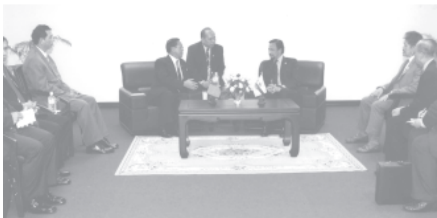
Prime Minister Lt-Gen Soe Win pays a courtesy call on King of Brunei Sultan Haji Hassanal Bolkiah Muizzaddin Waddaulah.

The Prime Minister, on behalf of Chairman of the State Peace and Development Council Senior General Than Shwe, invited the Sultan to visit Myanmar