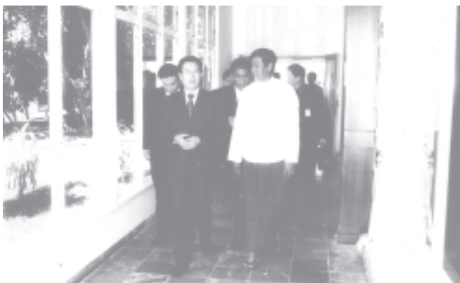
Chinese Vice Minister of Foreign Affairs Mr Wu Dawei being welcomed at the airport. — MNA

The PRC delegation led by Chinese Vice Minister of Foreign Affairs Mr. Wu Dawei was welcomed at Yangon International Airport by Deputy Minister for Foreign Affairs U Kyaw Thu, responsible officials of the Ministry of Foreign Affairs, Chinese Ambassador to Myanmar Mr. Li Jinjun and staff of the Chinese Embassy in Myanmar. The Chinese Vice Minister was accompanied by Deputy Director General Mr. Guan Mu and Deputy Director Mr. Chen Dehai of the Asian Affairs Department of the Ministry of Foreign Affairs—MNA