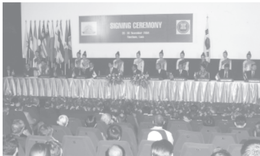
Prime Minister Lt-Gen Soe Win signs the Joint Declaration on Comprehensive Cooperation Partnership Between ASEAN and ROK together with heads of State/Government of ASEAN members and the Korean President. — MNA

Also present on the occasion were ministers, deputy ministers, high-ranking officials from ASEAN nations, Australia and New Zealand and the ASEAN Secretary-General.—MNA