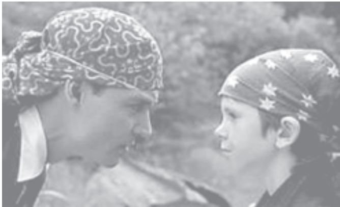
“Finding Neverland”, a fictionalized account of the creation of children’s classic “Peter Pan”, was named best film of 2004 by The National Board of Review on, 1 Dec, 2004 in the first major award of the Oscar season.