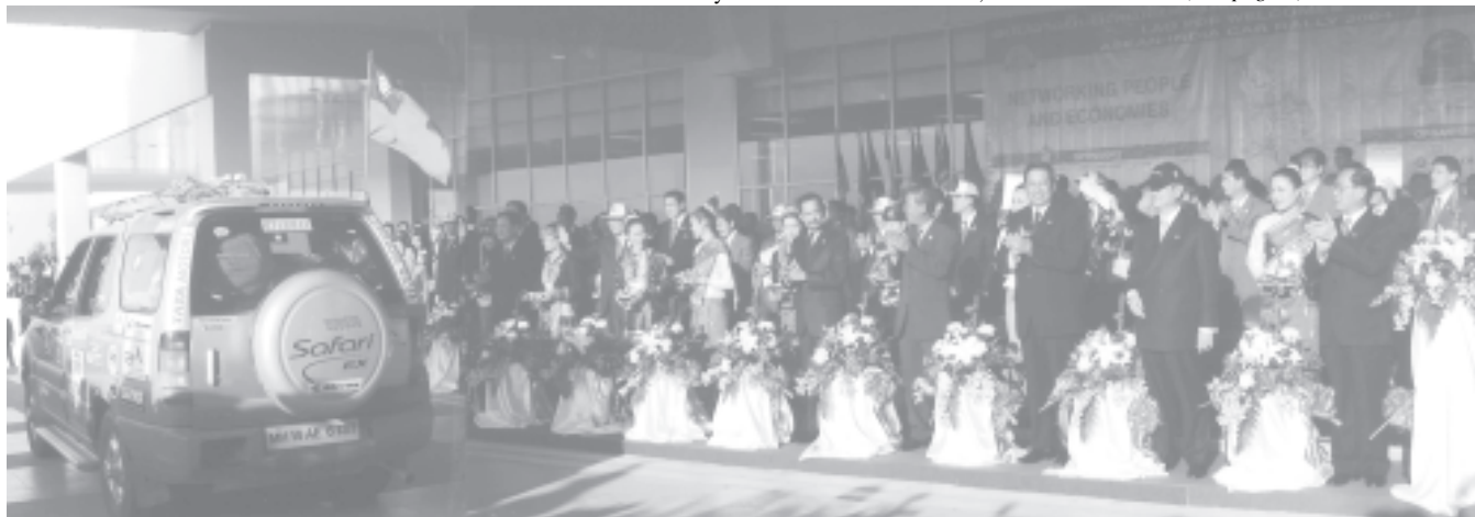
Prime Minister Lt-Gen Soe Win attends the welcoming of competitors of the first ASEAN-India Car Rally 2004 in the Lao People's Democratic Republic.

Bruneian King Sultan Haji Hassanal Bolkiah Muizzaddin Waddaulah, Cambodian Prime Minister Mr Samdech Hun Sen, Indonesian President (See page 8)