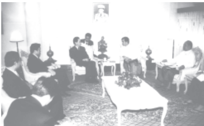
MNA Minister U Nyan Win receives Chinese Vice Minister of Foreign Affairs Mr Wu Dawei and party.

Also present at the call were Directors-General and responsible officials of the Ministry of Foreign Affairs and Chinese Ambassador to Myanmar Mr. Li Jinjun.