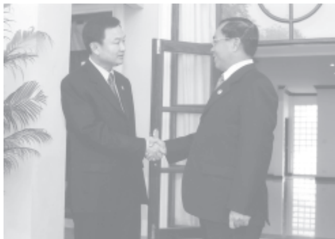
Prime Minister Lt-Gen Soe Win and Thai Prime Minister Dr Thaksin Shinawatra shake hands in a friendly atmosphere.