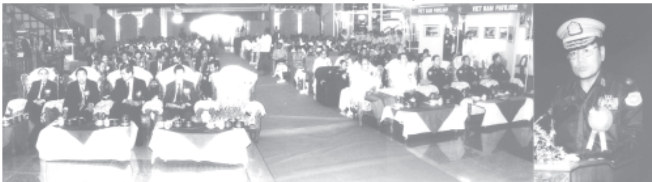
Minister Brig-Gen Tin Naing Thein addresses the opening of the First CLMTV-ECS Trade Fair-2004. — MNA

The UMFCFI will hold CLMTV-ECS Business & Investment Forum 2004 with the other participating countries on the first floor of the same venue from 3