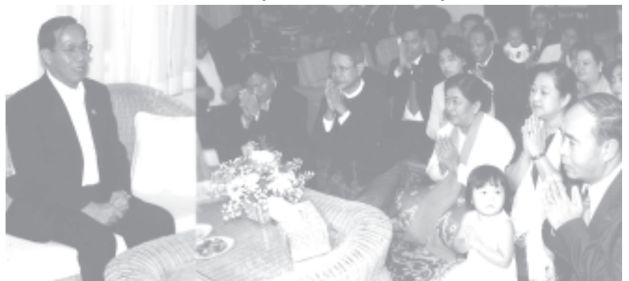
Prime Minister Lt-Gen Soe Win receives the Myanmar Ambassador to Laos, Military Attache and Embassy staff and family members.

Next, the Myanmar Ambassador and wife hosted a dinner to Prime Minister Lt-Gen Soe Win and party.—MNA