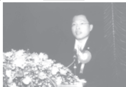
Thai Commerce Minister Mr Watana Muangsook.