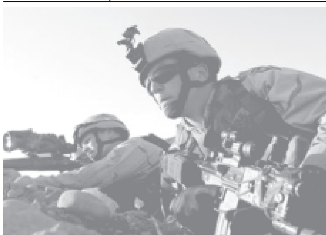
US Army 1st Battalion, 24th Infantry Regiment soldiers search for guerrillas in Mosul, Iraq, on 2 Dec, 2004.