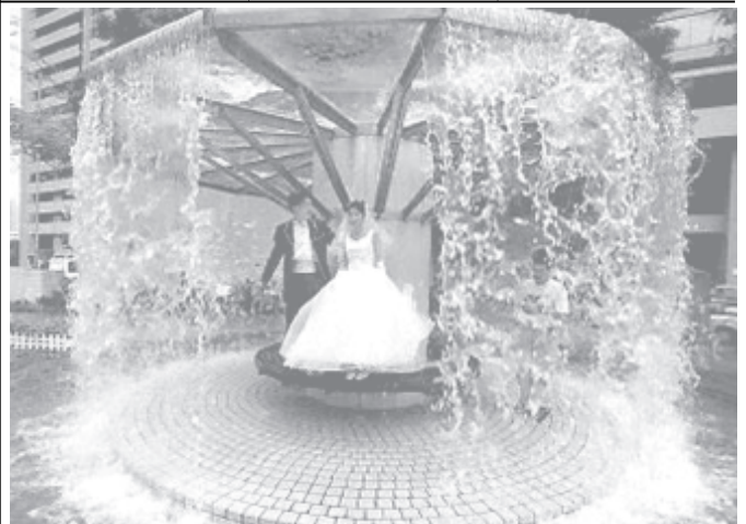
A newly-married couple stand inside a water fountain.