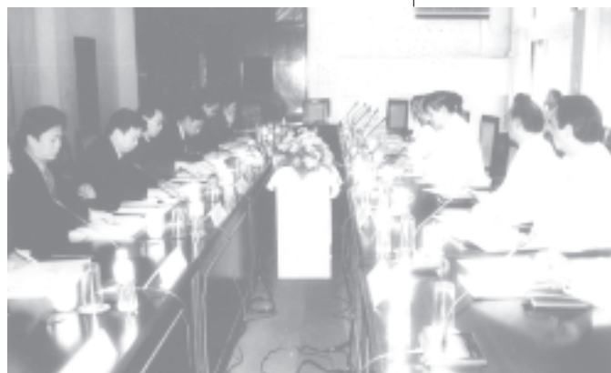
Deputy Minister U Kyaw Thu and Chinese Vice Minister of Foreign Affairs Mr Wu Dawei hold discussions on bilateral relations.

In the evening, Deputy Foreign Minister U Kyaw Thu hosted a dinner in honour of the Chinese delegation at Sedona Hotel.