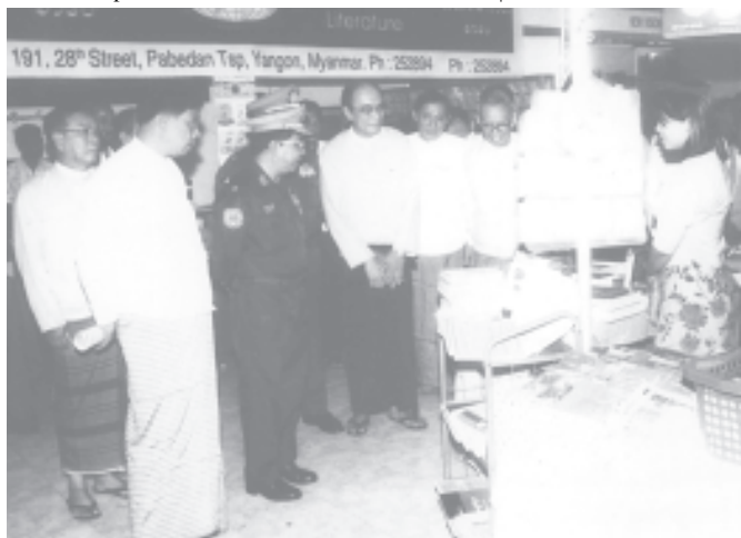
Minister Brig-Gen Kyaw Hsan views a book stall at the book fair. — MNA