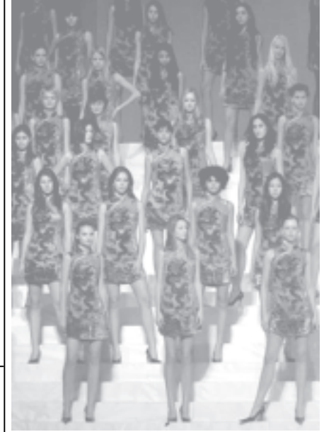
Contestants wearing Chinese dresses pose on the stage during a dress rehearsal of the Olay Elite Model Look 2004 International on 1 Dec, 2004, in Shanghai, China.