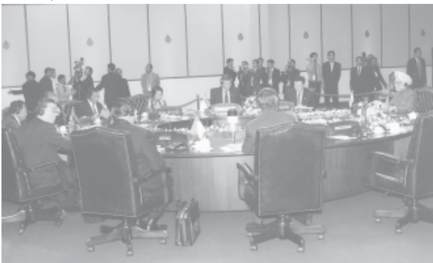
Prime Minister Lt-Gen Soe Win attends the ASEAN + India Summit together with heads of State/Government of ASEAN members and the Indian Prime Minister.

Later, Heads of State/Government of ASEAN countries, Indian Prime Minister Dr Manmohan Singh and ASEAN Secretary-General Mr Ong Keng Yong formally opened the ceremony. Next, the Laotian Prime Minister and the Indian Prime Minister flagged off the caravan.—MNA