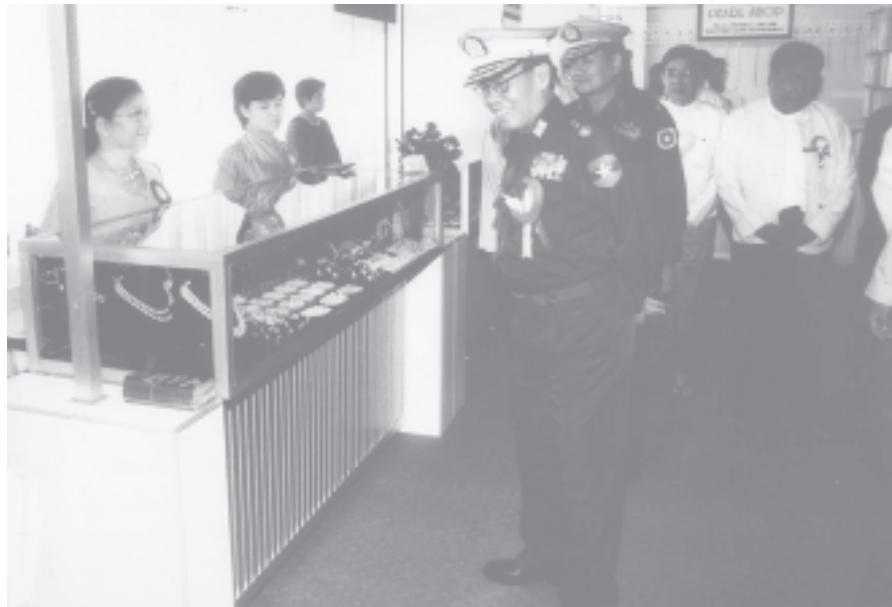
Prime Minister Lt-Gen Soe Win observes the items at a pavilion of the First CLMTV-ECS Trade Fair-2004.

Next, the Prime Minister formally unveiled the sign-board to open the Trade Fair. The Prime Minister and party and the guests viewed the pavilions of the respective countries displayed on the ground floor and the booth of Myanmar pearls, gems and jewelry and the booth of Thai silk. Next, they also inspected preparations made at the seminar room of the work committee. After viewing the booths of ministries, coop-