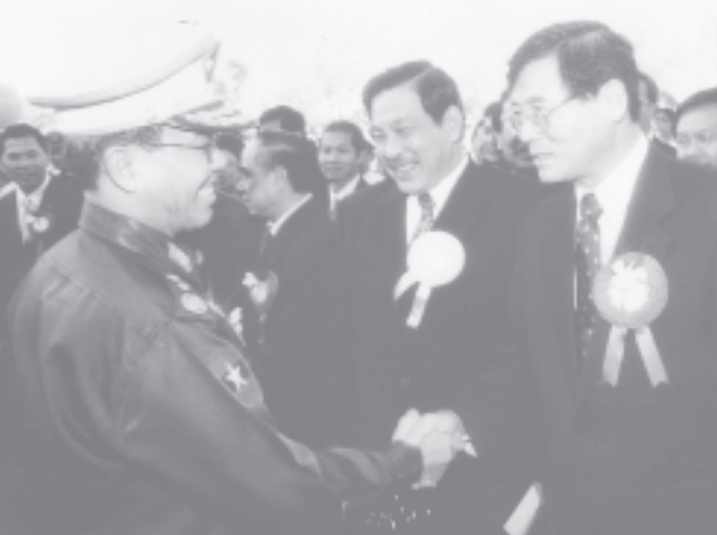
Prime Minister Lt-Gen Soe Win greets foreign ministers and delegates to the Trade Fair-2004.

YANGON, 3 Dec — Under the programme of economic cooperation among ASEAN nations, the First CLMTV-ECS Trade Fair-2004, co-organized by the Kingdom of Cambodia, Lao PDR, Myanmar, the Kingdom of Thailand and Socialist Republic of Vietnam, was opened at Myanmar Convention Centre on Min Dhamma Road, Mayangon Township, here this morning, attended by Prime Minister Lt-Gen Soe Win.