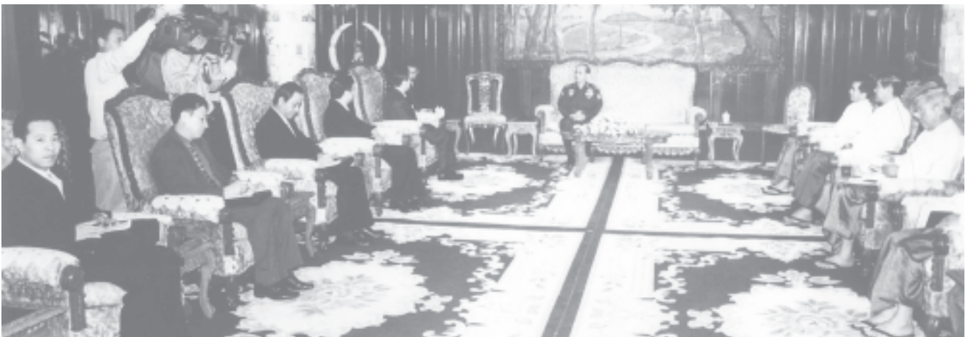
Secretary-1 Lt-Gen Thein Sein receives Chinese Vice Minister of Foreign Affairs Mr Wu Dawei and party.