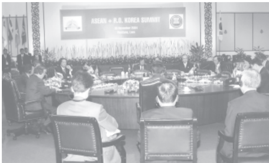
Prime Minister Lt-Gen Soe Win attending the ASEAN + Republic of Korea Summit together with heads of State/Government of ASEAN members and the Republic of Korea.

Also present on the occasion were ministers, deputy ministers, high-ranking officials from ASEAN nations and ASEAN Secretary-General Mr