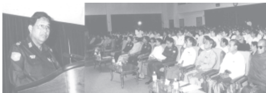
Minister Maj-Gen Sein Htwa addresses the observing of the International Day of Disabled Persons ceremony. — MNA

YANGON, 3 Dec — The International Day of Disabled Persons was observed at the International Business Centre on Pyay Road here this morning.