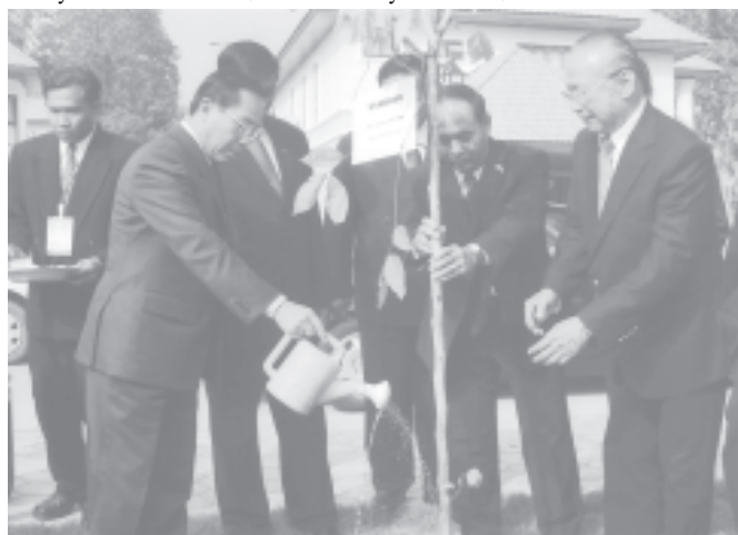
Prime Minister Lt-Gen Soe Win plants a commemorative tree at Villa Dongpasak in Vientiane, LPDR.