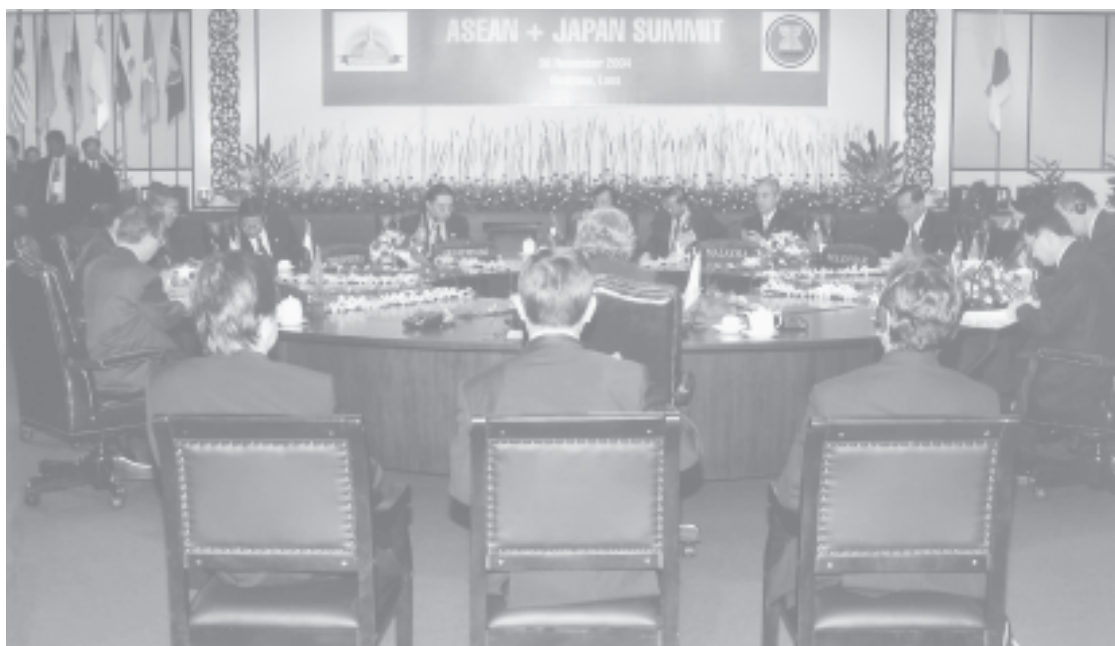
Prime Minister Lt-Gen Soe Win attending the ASEAN + Japan Summit together with heads of State/Government of ASEAN countries and the Japanese Prime Minister.

Also present on the occasion were Bruneian King Sultan Haji Hassanal Bolkiah Muizzaddin Waddaulah, Cambodian Prime Minister Mr Samdech Hun Sen, Indonesian President Mr Susilo Bambang Yudhoyono, Laotian Prime Minister Mr Bounnhang Vorachith, Malaysian Prime Minister Dato' Seri Abdullah bin Haji Ahmad Badawi, Philippine President Mrs Gloria Macapagal Arroyo, Singaporean Prime Minister Mr Lee Hsien Loong, Thai Prime Minister Dr Thaksin Shinawatra, Vietnamese