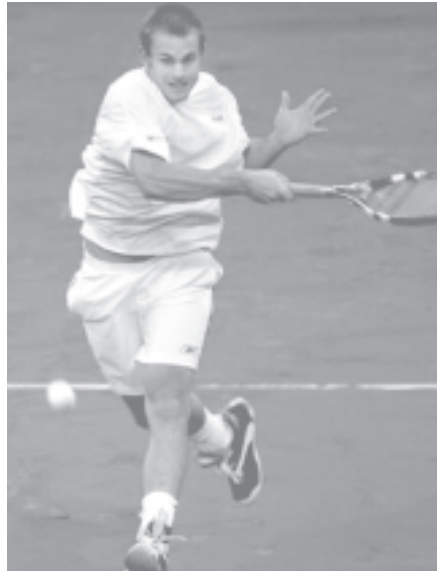
American tennis player Andy Roddick returns a ball to his teammate, Mardy Fish, during a training match in Seville, Spain, on 1 Dec, 2004. The United States will play Spain in this year's Davis Cup final later this week.