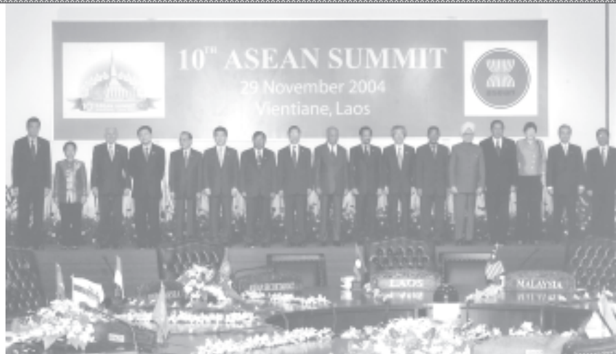
Prime Minister Lt-Gen Soe Win poses for documentary photo at the luncheon together with heads of State/Government of ASEAN countries, China, Japan, Korea, India, Australia and New Zealand to the 10th ASEAN Summit. — MNA

Prime Minister Lt-Gen Soe Win attends the luncheon hosted by Lao President Khamtay Siphandone. — MNA