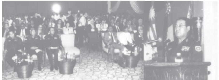
Minister for Home Affairs Maj-Gen Maung Oo addresses opening of 14th IFNGO ASEAN NGOs Workshop on Prevention of Drug and Substances Abuse. — MNA