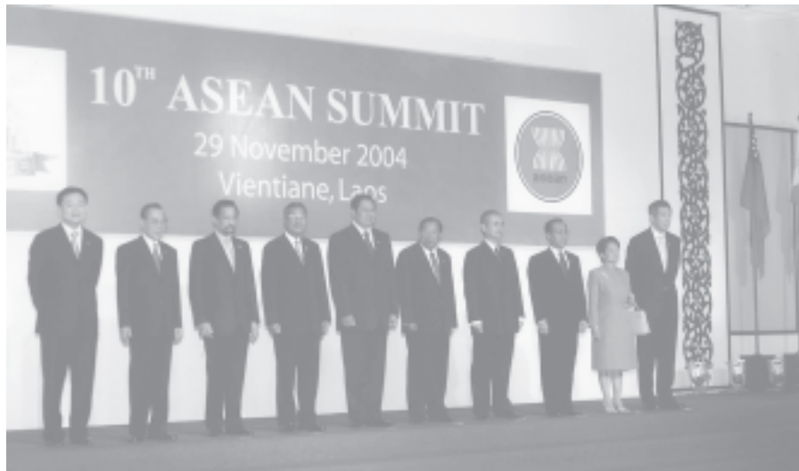
Prime Minister Lt-Gen Soe Win poses for documentary photo with Heads of State/Government of ASEAN countries at 10th ASEAN Summit.

Next, the ceremony to sign the Vientiane Action Programme and the ASEAN Framework Agreement for the Integration of the Priority Sectors was held at Theatre-1 of Lao-ITECC, attended by Prime Minister Lt-Gen Soe Win and Heads of