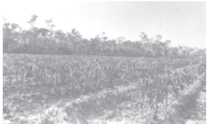
Thriving over four months old rubber plantation.

It is learnt that rubber is popular in the world market; that it is a foreign exchange earner and can serve the long-term interest with a considerable amount of capital; that the government is providing necessary assistance to rubber growers and that it can be grown the length and breadth of the nation.