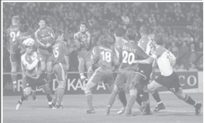
A free kick by Feyenoord goes through the wall of Schalke 04 during their UEFA Cup football match in Rotterdam.