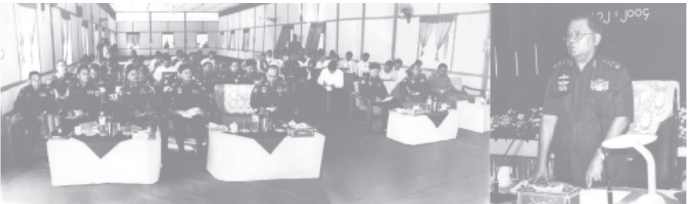
Senior General Than Shwe gives guidance to local authorities and departmental officials from Kyaukpyu District at Yammawady Hall in Kyaukpyu.

The local people need to double or triple their efforts. The district is required to extend crops that thrive well in the region, in addition to paddy to raise income. As the Government and the people have their own responsibilities, it is impor-