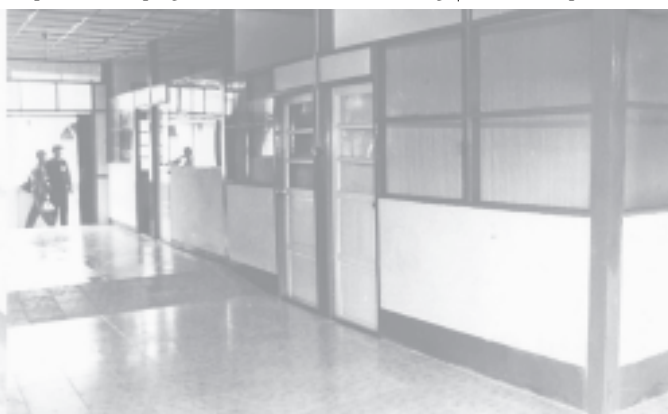
Senior General Than Shwe inspects progress in building An Township Hospital (100-bed).