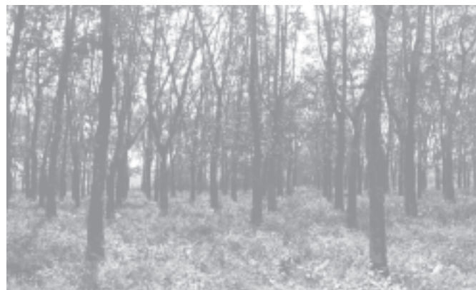
Some 30 years old rubber trees.

Myanmar which has a favourable weather condition for growing rubber can become a main rubber grower if vast vacant and virgin land in the nation is reclaimed. Everyone should engage in rubber growing since it benefits both growers and the State.