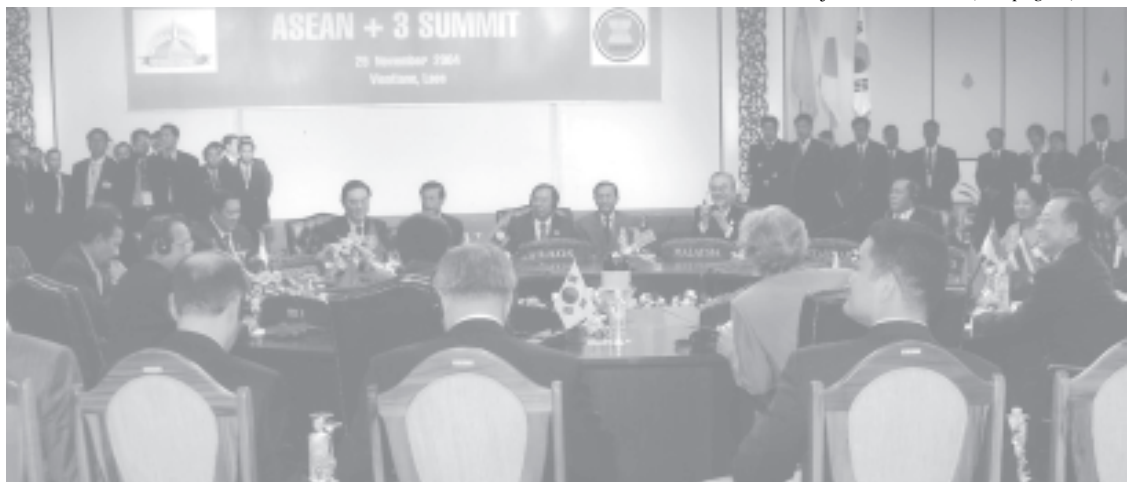
Prime Minister Lt-Gen Soe Win attends ASEAN+3 Summit at Lao-ITECC in Vientiane, Lao PDR.