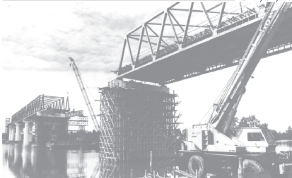
Minkyaung Creek Bridge on Yangon-Kyaukpyu Road in Yanbye Township under construction.

The Senior General gave guidance on systematic construction of the medical facility in accordance with the (See page 8)