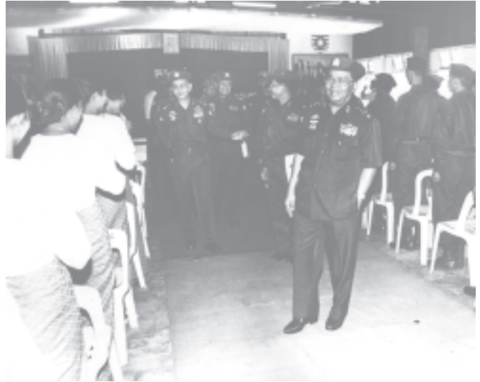
Senior General Than Shwe cordially converses with Tatmadawmen and families of Kyaukpyu station at Thadoe Maha Bandoolla Hall.