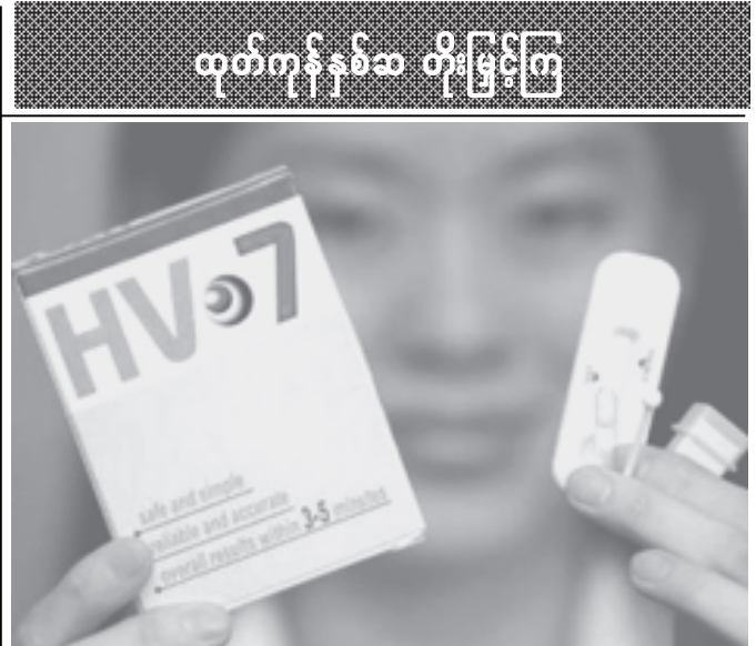
A Malaysian shows newly launched HIV test kits in Kuala Lumpur on 29 Nov, 2004.

A slide in Blair's public trust and popularity ratings, primarily over the US-led war in Iraq, sparked a flurry of speculation earlier this year over his future, prompting him to take the unprecedented step of setting his own departure date.—Internet