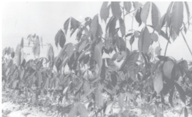
Growth of four months old rubber nursery.

Enterprise is providing everyone, who want to grow rubber, with land plots, rubber seeds, technology, fertilizer and pesticides. Growing of rub-