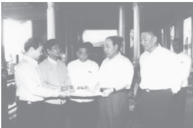
Chinese delegation offers cash donations to funds of the Shwedagon Pagoda.—MNA

and party paid homage to Jade Buddha Image and viewed the big bell donated by King Thayawady. Afterwards, they had group photo taken. They made a clock-wise round of the pagoda as an act of homage