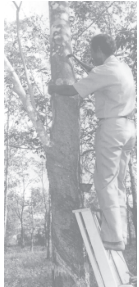
Collection of latex from upper part of an old rubber tree.