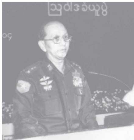
Secretary-1 Lt-Gen Thein Sein explains progress in politics and economy of the State.—MNA

Bridge Project on Yangon-Kyaukpyu Road in Yanbye Township, Kyaukpyu District, where they were welcomed by Deputy Minister for Construction Brig-Gen Myint Thein, Project Senior Engineer U Tin Soe and officials. Minister for Construction Maj-Gen Saw Tun gave an account of the project, progress in constructing approach roads, the main bridge, large bridges in Rakhine State, and repairing of Kyaukpyu-Maei section and Maei-Taungup section on Yangon-Kyaukpyu Road.