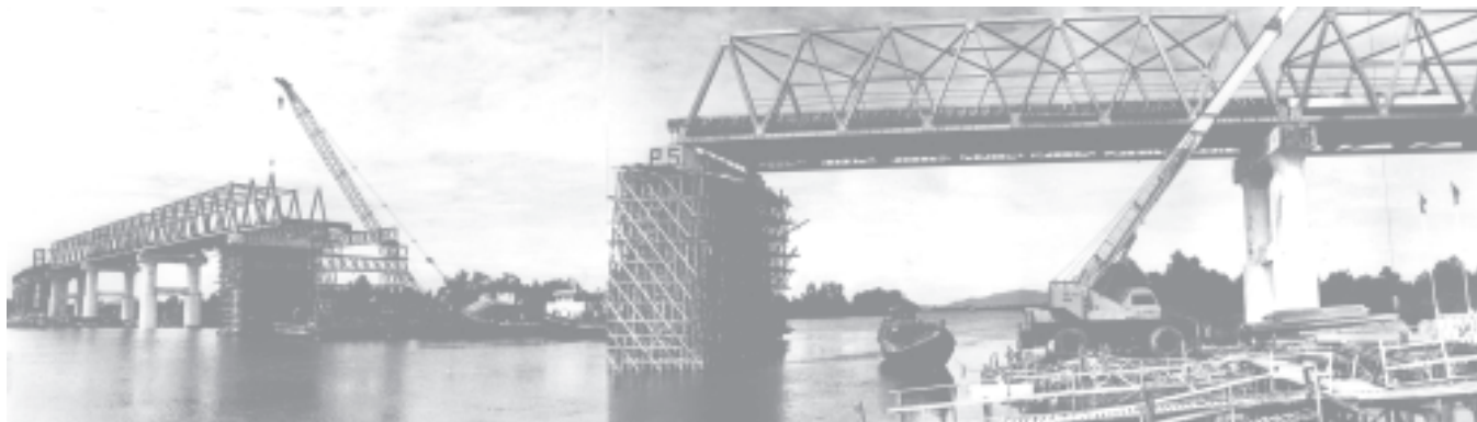
Minkyaung Creek Bridge under construction, 2,704 feet long, with 24 feet wide motor road and three feet wide pedestrian ways on both sides, seen on Yangon-Kyaukpyu Road in Yanbye Township, on 1 December.

On completion, Minkyaung Creek Bridge will be a 2,704 feet long facility with a 24-foot-wide motorway and two 3-foot-wide pedestrian lanes on it.