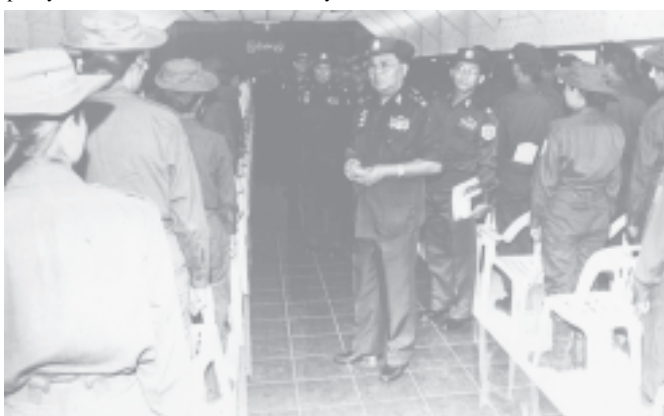
Senior General Than Shwe cordially greets Tatmadawmen and families from An station.

The 30-megawatt Thandwe Creek Hydel Power Station will be on Thandwe Creek 13 miles south-east of the town.