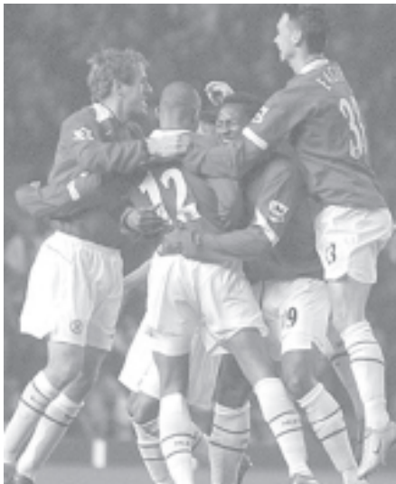
Manchester United players celebrate after David Bellion scored in the opening minutes making it 1-0 against Arsenal during their Carling Cup quarterfinal clash at Old Trafford.