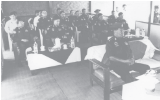
Senior General Than Shwe hears reports on plans for water supply and summer paddy cultivation.

Project, and Kyeintali Creek Hydel Power Project in the region, with the help of maps and charts. Commander Brig-Gen Min Aung Hlaing, Minister for Energy Brig-Gen Lun Thi, and Minister for Agriculture and Irrigation Maj-Gen Htay Oo gave supplementary reports.