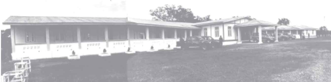
Cent per cent completion of An Township Hospital (100-bed). — MNA