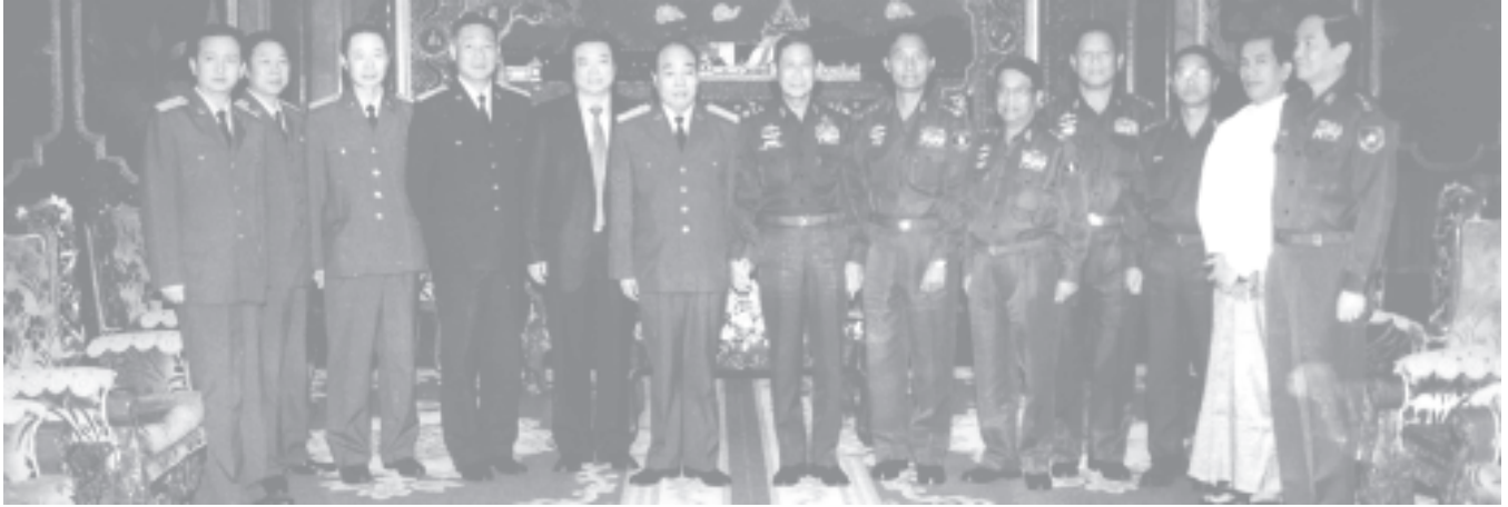
Vice-Senior General Maung Aye and visiting PLA Deputy Chief of General Staff General Ge Zhenfeng and party at Zeyathiri Beikman Hall.