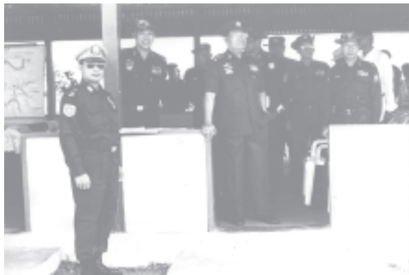
Senior General Than Shwe inspects water storage capacity at Hinywet Dam.— MNA