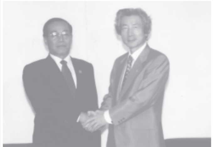
Prime Minister Lt-Gen Soe Win cordially greets Japanese counterpart Mr Koizumi at Friendship House in Villa Dongpasak, Vientiane.