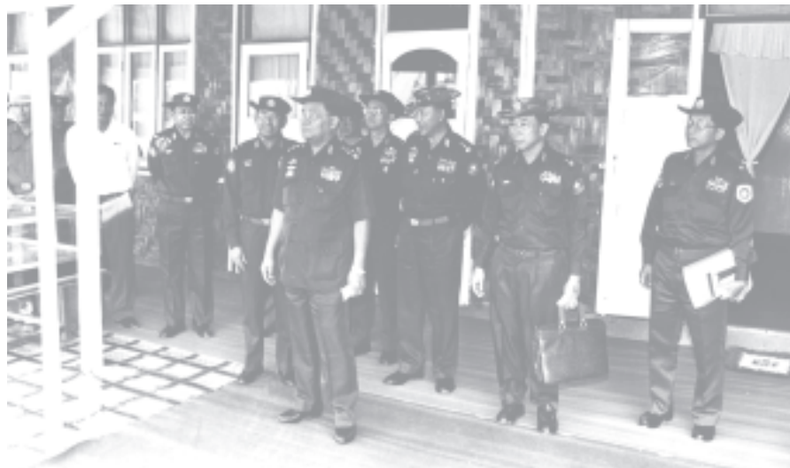
Senior General Than Shwe inspects progress in building Minkyaung Creek Bridge on Yangon-Kyaukpyu Road in Yanbye Township.

In response, the Senior General gave guidance to the officials and viewed water storage of the dam. With a 70-