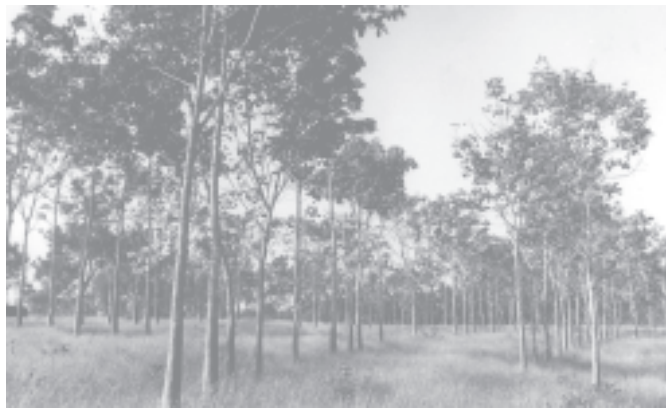
10 years old rubber trees.

tural entrepreneur, through a friend of mine. She is making progress in growing over 300 acres of rubber in Alieni Special Zone, Indagaw, Bago Township.