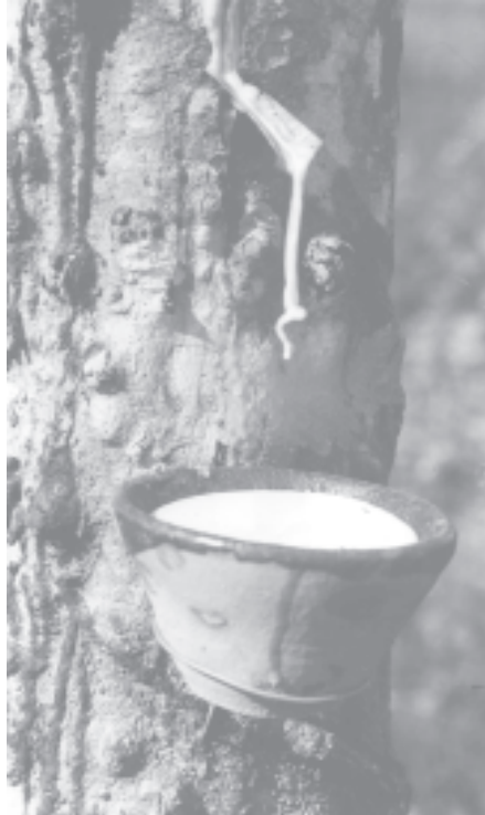
Collection of latex from nearly 30 years old rubber tree.

"73 per cent of world rubber is grown in Malaysia, Thailand and Indonesia combined. The three nations are also enjoying 73 per cent of world rubber production. But they have found it difficult to increase growing of rubber due to land constraint.