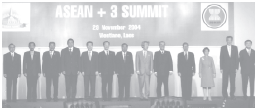
Prime Minister Lt-Gen Soe Win poses for documentary photo with Heads of State/Government of ASEAN countries at ASEAN+3 Summit.— MNA

Kyaw Thu, the ministers and deputy ministers of ASEAN countries and China, senior officials and the ASEAN Secretary-General. — MNA