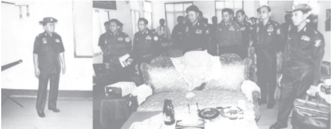
Senior General Than Shwe gives guidance on efforts to complete Kyaukpyu-Ma-ei-Taungup section earlier than scheduled. —MNA

mate and geographical condition, and its development relies on the efforts and labour of the local people. However, the district cannot produce enough rice for its population and per capita income is low when compared with other regions.