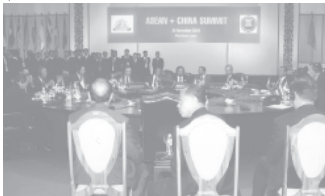
Prime Minister Lt-Gen Soe Win attends ASEAN+China at Lao-ITECC in Vientiane, Lao PDR, on 29-11-2004.