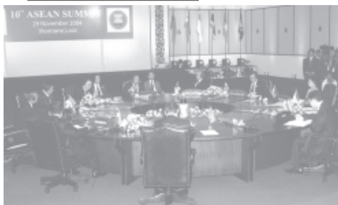
Prime Minister Lt-Gen Soe Win attends ASEAN+3 Summit at Lao-ITECC in Vientiane, Lao PDR.