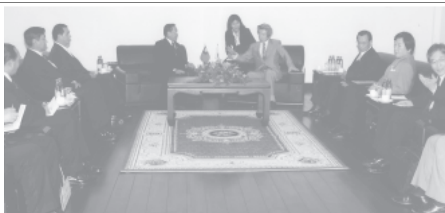
Prime Minister Lt-Gen Soe Win and Japanese Prime Minister Mr Junichiro Koizumi in a discussion at Friendship House at Villa Dongpasak in Vientiane, Lao PDR. (News on page 7)