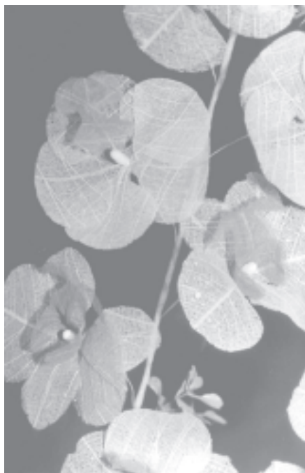
Rubber leaves treated with chemicals change into household goods.