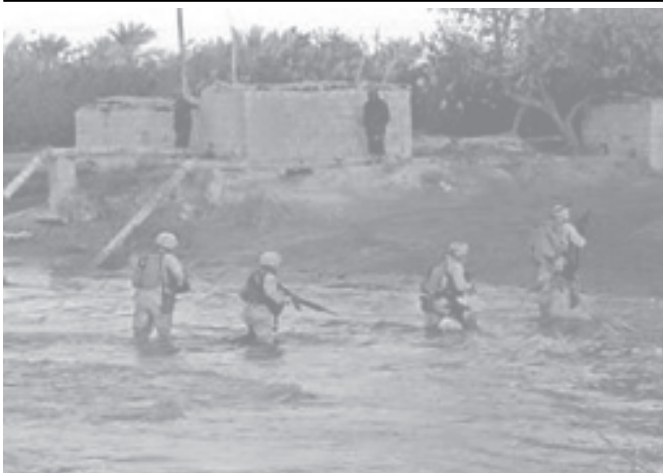
US Marines wade ashore while conducting military operations near Yusufiya, south of Baghdad on 28 Nov, 2004.