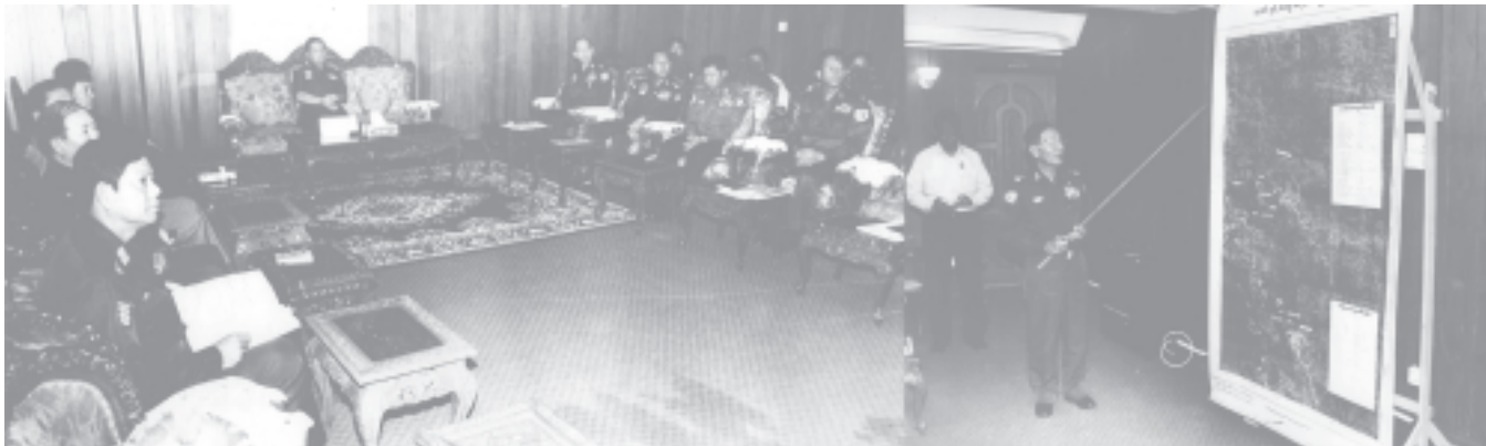
Senior General Than Shwe hears reports on implementation of hydel power projects in Thandwe Region by Minister for Electric Power Maj-Gen Tin Htut.