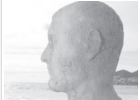
The bust of a statue archaeologists identify as Roman Emperor Philip the Arab, who ruled from 224 to 249 AD, is seen on a beach on the Mediterranean island of Corsica in this recent undated photo. Archaeologists announced on 19 Nov, 2004 that a 2-metre statue of a feminine silhouette and statue fragments of the Roman Emperor were discovered on 23 Oct, 2004 in shipwreck dating from the third century off Porticcio in southern Corsica.