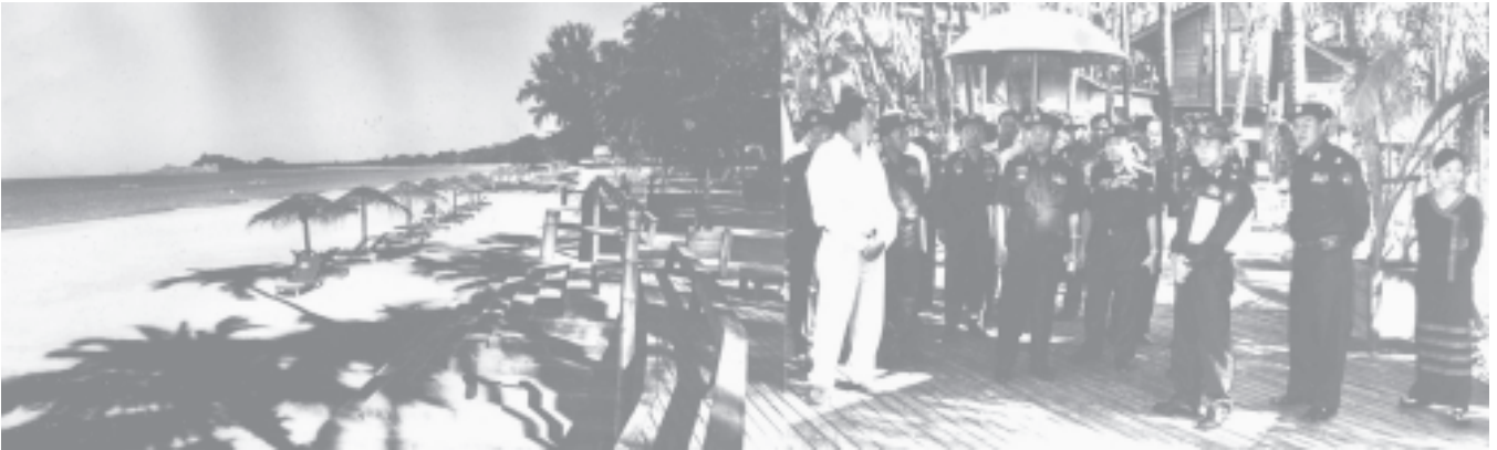
Senior General Than Shwe inspects the resorts along Ngapali Beach.