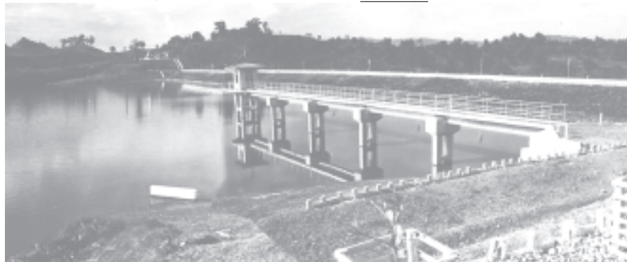
Storage of water seen at Hinywet Dam 70 feet in height and 750 feet in length on 1st December.