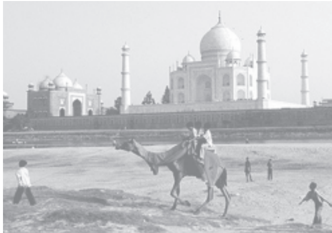
India's Taj Mahal is seen here recently. Tourists flocked to the northern Indian city of Agra to see the Taj Mahal by moonlight after the Supreme Court lifted a 20-year ban on night viewing of the 17th-century monument to love.

“We would like to find a way of making joint exploration with Malaysia in the disputed waters of South China Sea,” he said.— MNA/Xinhua