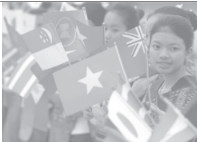
People line the streets, waving flags of member countries, as leaders arrive for the 10th Association of Southeast Asian Nations (ASEAN) Summit in Vientiane on 29 November, 2004.

မြို့ပြခွေတာ၊ သိန်းဝါးလေလွင့်၊ ထုတ်ကုန်မြင့်