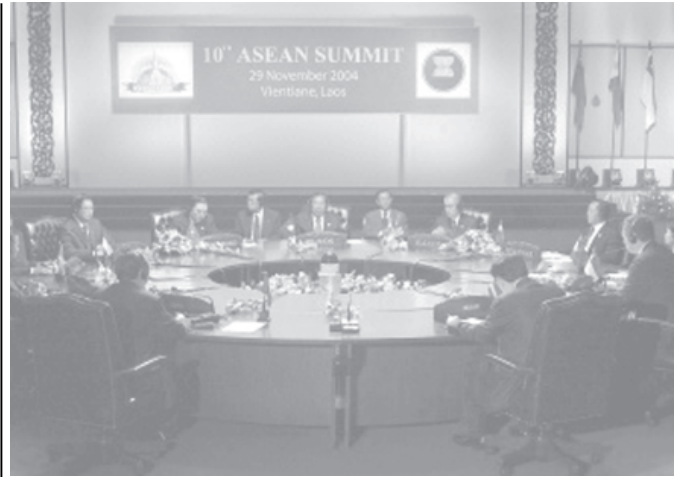
General view of the 10th summit of the 10 Southeast Asian Nations (ASEAN) in Vientiane on 29 Nov, 2004.

Urging more cooperation with non-ASEAN trading partners, Badawi said, "The synergies of cooperation with these countries will enable us to promote growth...provide the competitive environment for the region to be attractive to trade and investment flows." — MNA/Xinhua