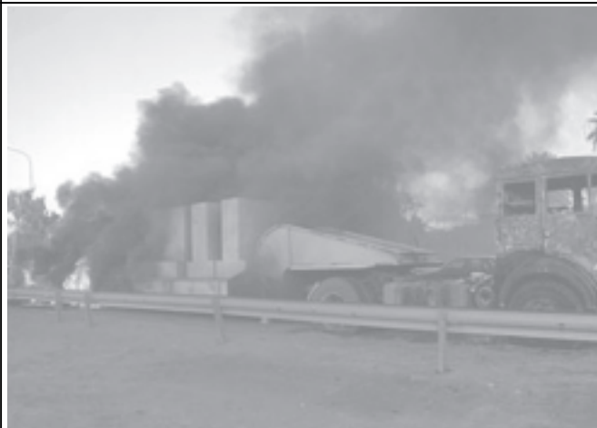
A truck transporting blast walls burns after it came under attack in western Baghdad, on 24 Nov, 2004.