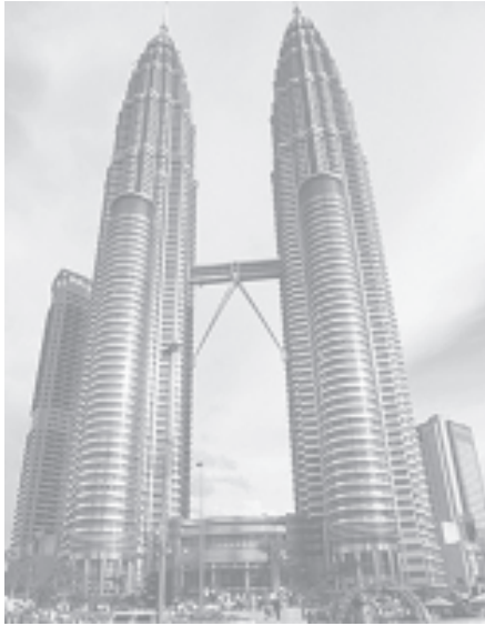
The Petronas Towers in Kuala Lumpur, seen here in 1999 is one of the seven architectural achievements named here as winners of the 2004 Aga Khan award for architecture.