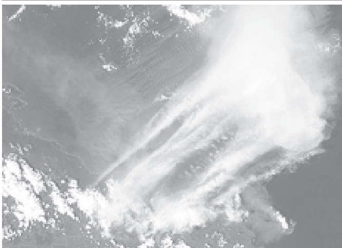
This NASA satellite image released on 27 October 2004 shows a plume of ash (brown) from an eruption 24 October of the Manam Volcano (Lower-R), located in the Bismarck Sea across the Stephan Strait from the east coast of mainland Papua New Guinea.