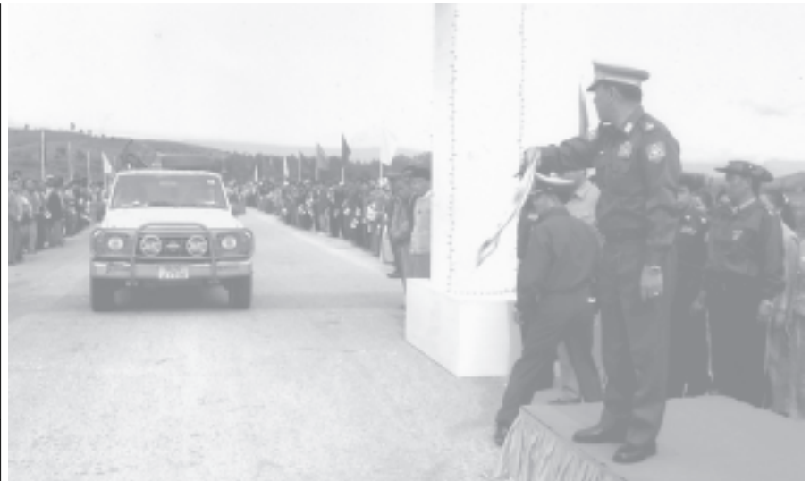
Commander Maj-Gen Khin Zaw initiates the First ASEAN-India Car Rally Flag-off in Kengtung. (News on page 16) — MNA

The commander and the minister inspects the MEB and the IRD in Patheingyi. — MNA