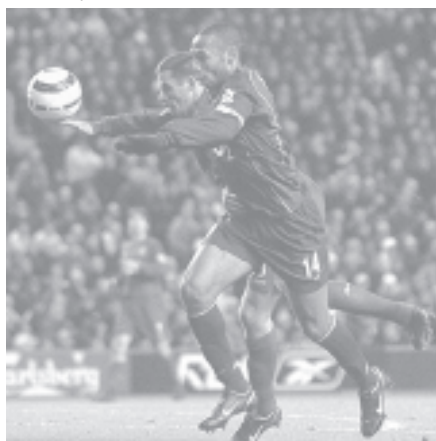
Arsenal's French Thierry Henry (blue) vies with Liverpool's Jamie Carragher during a Premiership clash at Anfield, in Liverpool.

Mellor, playing only because of injuries to regular strikers Djibril Cisse and Milan Baros, rose to the occasion though with his first Premier League goal — a thundering shot on the bounce from 25