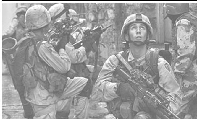
US Army soldiers from the 1st Battalion, 24 Infantry Regiment, search for guerillas in Mosul, Iraq.