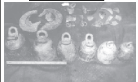
The 16th century artifacts found in Bago Division. — CULTURE

They presented the artifacts to the Bago branch of the Archaeology Department, the Ministry of Culture. The department will honour them with handsome awards. —MNA