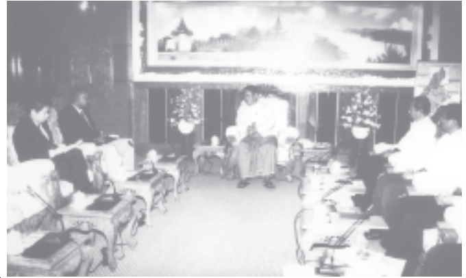
Minister U Aung Thaung receives the Singaporean ambassador.