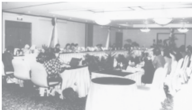
The Third Meeting of ASEAN Committee on Women in progress in Mindon Hall of Sedona Hotel.

Declaration and Platform for Action. The year 2005 will also be the thirtieth anniversary of the First World Conference on Women held in Mexico in 1975. The First World Conference set the stage for a new era in global efforts to promote the advancement of women by establishing a concrete global commitment on the empowerment of women and gender equality. In nearly every country, researches and analysis were conducted on women's issues for the first time, goals were set, and progress was reviewed as well as gaps, challenges