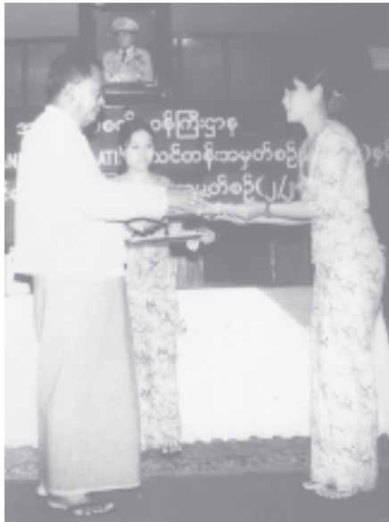
Minister U Aung Thaung presents a completion certificate to a trainee at the closing ceremony of Courses on Interpreting and Translation No 1/2004 and Work Efficiency 2/2004. — INDUSTRY-1

Altogether 52 trainees attended the ten-week courses. — MNA