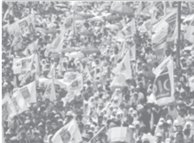
Indonesians march toward the US Embassy during a rally in Jakarta, Indonesia, on 28 Nov, 2004.