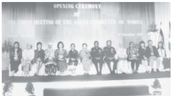
Minister Maj-Gen Sein Htwa together with delegates from ASEAN member countries pose for a documentary photo at the opening ceremony of the Third Meeting of the ASEAN Committee on Women at Sedona Hotel. — MNA