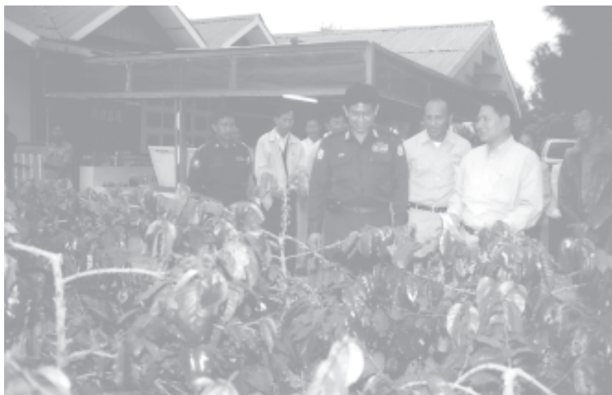
Minister for Agriculture and Irrigation Maj-Gen Htay Oo inspects coffee plantations in PyinOoLwin.