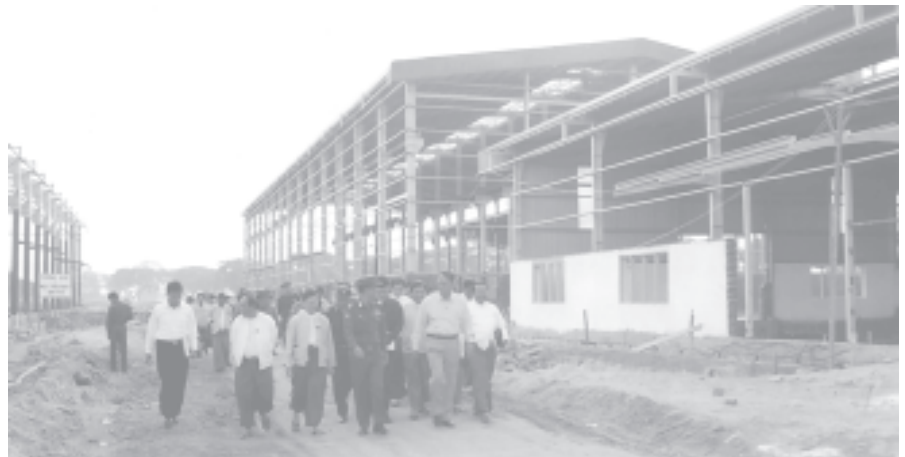
Commander Maj-Gen Ye Myint, Minister U Aung Thaung and party inspect progress in building of machine shops, ware houses and foundries in Mandalay Industrial Zone. — INDUSTRY-1

Giving technological training to the new