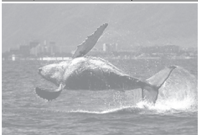
A whale is seen jumping above water. Dozens of whales and dolphins mysteriously beached themselves on an Australian island, state government officials said.