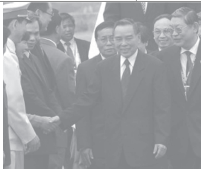
Vietnam's Prime Minister Phan Van Khai, centre, smiles as he is greeted on 27 Nov, 2004, in Vientiane, Laos, on his arrival for the 10th ASEAN summit.

The survey recently held in Southwestern China's Sichuan Province showed that about one-third of Party cadres were most focused on the will and interests of their superiors, not their service to the people. About 32 per cent of Party's cadres at or above county levels chose "realizing individual's value" and "build well-off families" as their life purposes, not service to the people. Experts here said the wavering convictions of the Party members, a major source of corruption in some regions, had seriously eroded the consolidation of the Party's governing status.—MNA/Xinhua