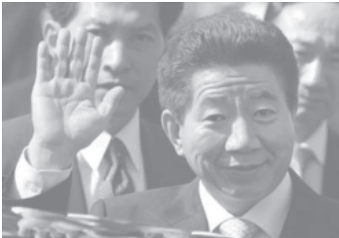
South Korea's President Roh Moo-hyun waves upon his arrival in Vientiane before the 10th Association of Southeast Asian Nations (ASEAN) Summit in Laos, on 28 Nov, 2004.

He also said the ASEAN+South Korea Senior Officials Meeting held here Friday agreed on the arrangements for the signing ceremony of the South Korea's accession to the Treaty of Amity and Cooperation in Southeast Asia on Saturday.