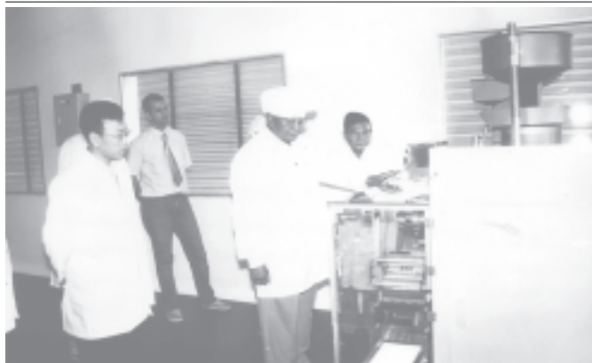
Minister for Industry-1 U Aung Thaung inspects installation of machines at PyinOoLwin Pharmaceutical Factory.— INDUSTRY-1