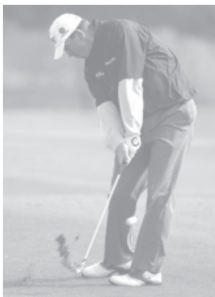
Thomas Bjorn of Denmark hits a shot during the third round of the US$1 million Volvo China Open at Shanghai Silport Golf Club on 27 November, 2004.