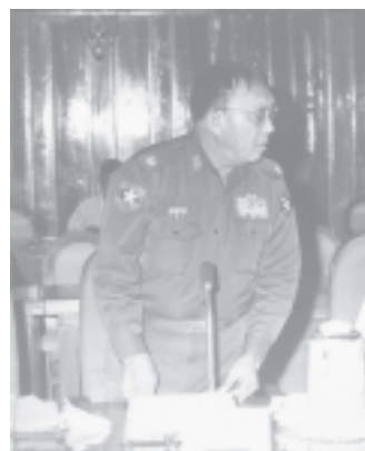
Deputy Minister for Information Brig-Gen Aung Thein.