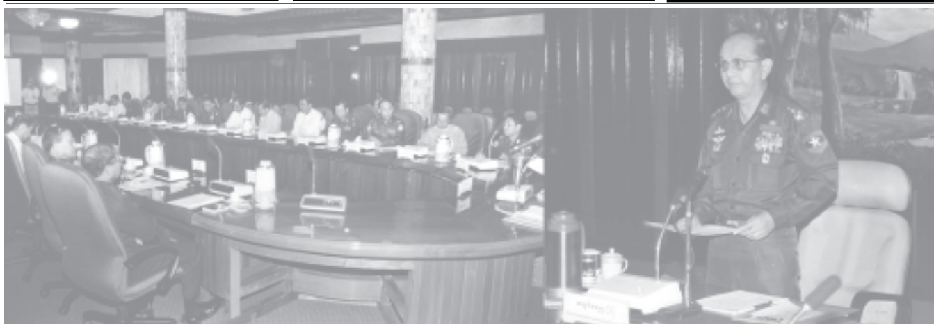
Secretary-1 Lt-Gen Thein Sein delivers an address at coordination meeting to hold 22nd Conference on ASEAN Federation of Engineering Organizations (CAFEO-22).