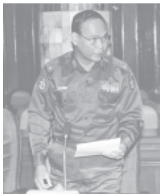
Mayor Brig-Gen Aung Thein Lin submits matters related to 22nd Conference on ASEAN Federation of Engineering Organizations (CAFEO-22).