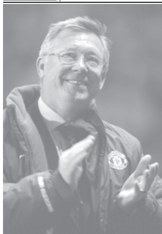
Manchester United's Alex Ferguson celebrates his team's win over Olympique Lyonnais and his 1,000th game as the team's manager. United will play second-from-bottom West Brom.

"We keep on winning in style. It was a good game overall and when our legs let us down, we had enough heart left to hold the result," said coach Paul Le Guen.