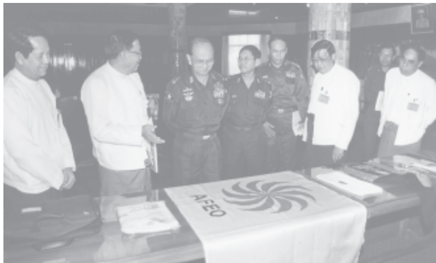
Secretary-1 Lt-Gen Thein Sein inspects samples of prizes, gifts, bags, souvenirs and pamphlets to mark the CAFEO-22.

After hearing the reports, Secretary-1 Lt-Gen Thein Sein attended to the needs through coordination with officials concerned.