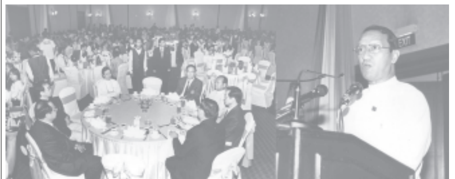
Minister for Sports Brig-Gen Thura Aye Myint delivers an address at the dinner hosted to athletes and officials of 6th Asian Wushu Championships 2004.— MNA

Next, those present were served with dinner. Before and during the dinner, artists from the hotel entertained variety of dances to the audience. — MNA