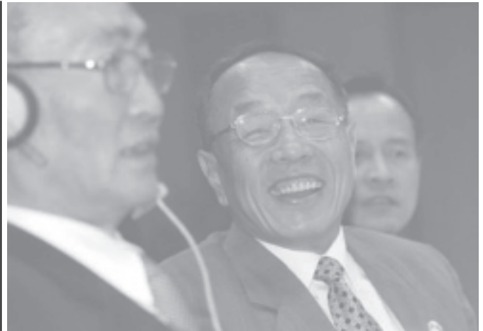
Chinese Foreign Minister Li Zhaoxing (C) listens to a speech at a meeting of ASEAN foreign ministers in Vientiane on 27 Nov, 2004.

ASEAN's unification efforts are targeted at increasing Southeast Asia's competitiveness for sustained economic growth and equitable development.—MNA/Xinhua