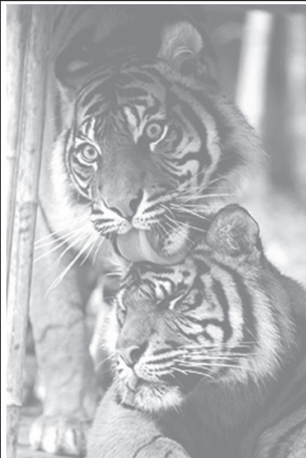
Sumatran Tiger female Assiqua (top), gives an affectionate lick to Sendiri (below), one of her three cubs at Sydney's Taronga Zoo.