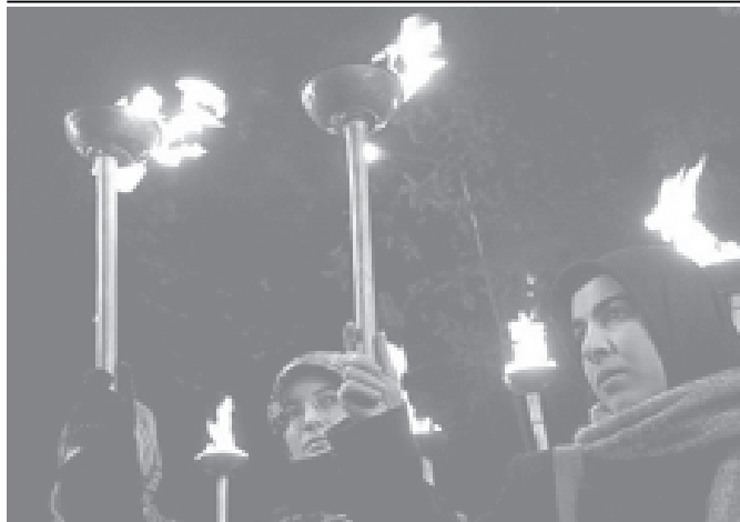
Carrying the torches: Two Turkish women hold torches during a demonstration on 26 Nov, 2004 in a downtown Istanbul street against US politics in the Middle-East and the attack on Fallujah, Iraq.