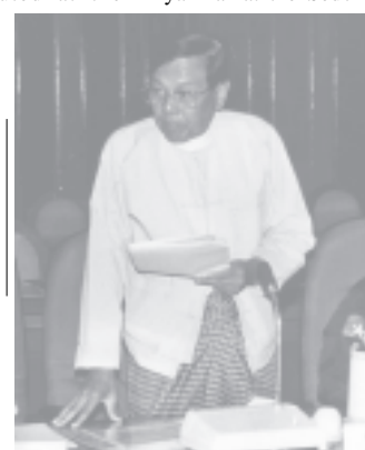
Deputy Minister for Health Dr Mya Oo.

rangements being made for hosting the CAFEO-22. Later, MES General Secretary U Than Myint presented reports on measures being taken by the MES in cooperation with the AFEO, the organizational setup of the MES, the conducting of engineering courses, the MES's participation in nation-building endeavours, the formation of the central committee and sub-