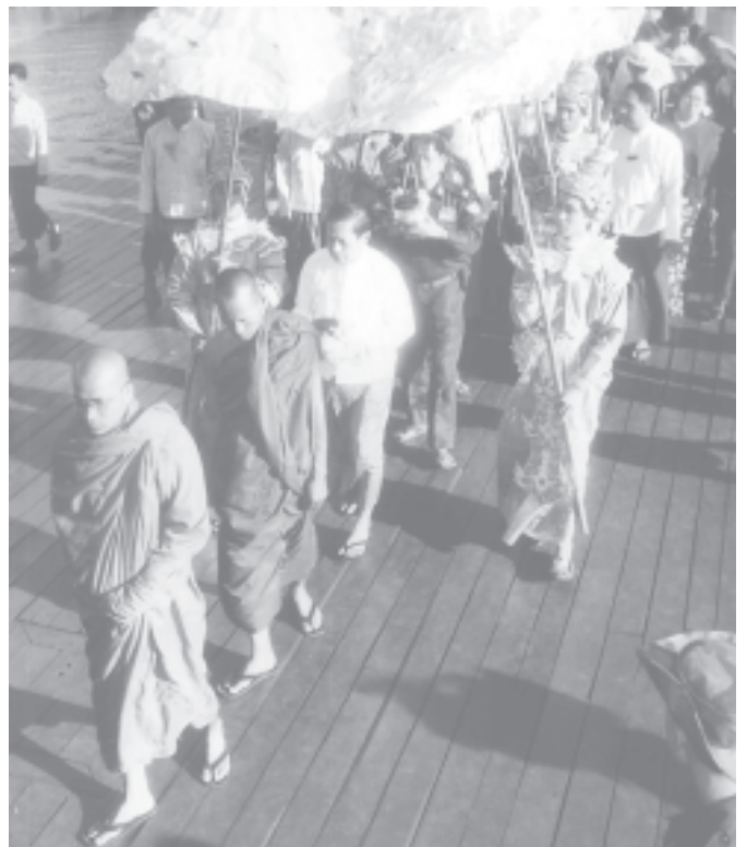
Dhatudaka Puja of ash of the remains of the Chairman of State Sangha Maha Nayaka Committee Sayadaw in progress.