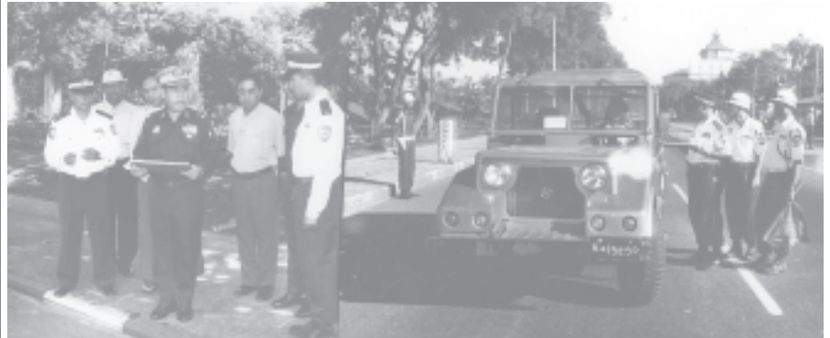
Minister for Transport Maj-Gen Thein Swe and party supervise functions of dry day inspection teams.—MNA

YANGON, 28 Nov — Dry Day Supervisory Committee Chairman Minister for Mines Brig-Gen Ohn Myint, Vice-Chairman Minister for Transport Maj-Gen Thein Swe, members Deputy Minister for Hotels and Tourism Brig-Gen Aye