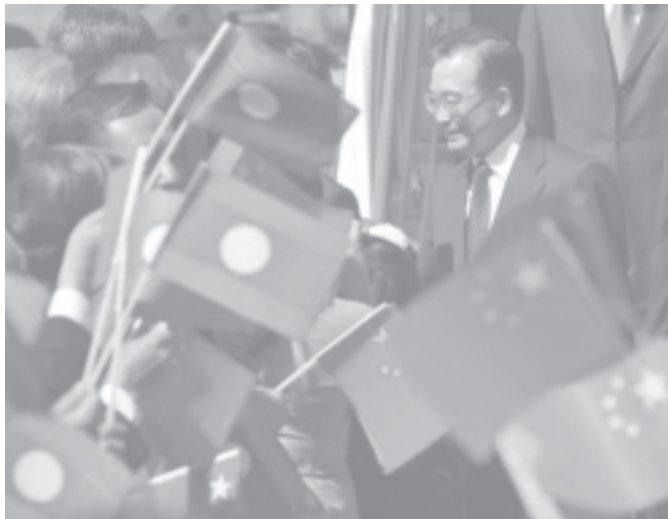
China's Premier Wen Jiabao is greeted at Vientiane Wattay international airport on the eve of the 10th Association of Southeast Asian Nations (ASEAN) Summit in Laos on 28 Nov 2004. —INTERNET