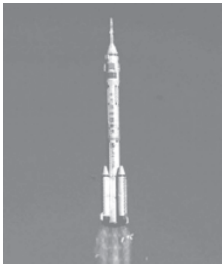
A 'Long March' rocket carrying the manned 'Shenzhou V' spacecraft is launched from the Jiuquan launch centre. China will launch its lunar orbiter Chang'e 1 to explore the moon's environment and study the thickness of its soil by the end of 2007.

မြန်မာ့သမိုင်းကို မိမိတို့အတွက် ထုတ်ဖော်ပြော