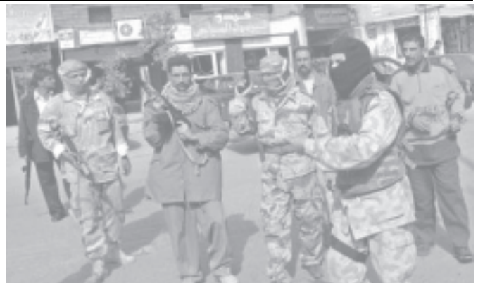
Iraqi national guardsmen secure area of al-Yarmouk hotel in the southern city of Basra, on 26 Nov, 2004.