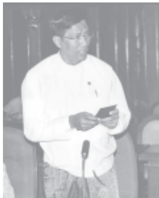
Deputy Minister for Foreign Affairs U Maung Myint.— MNA

Society, the CAFEO-22 will be hosted in Myanmar at the Sedona