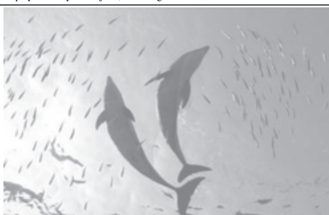
Dolphins are seen swimming at Hakkeijima Sea Paradise in Yokohama, south of Tokyo on 24 November, 2004.