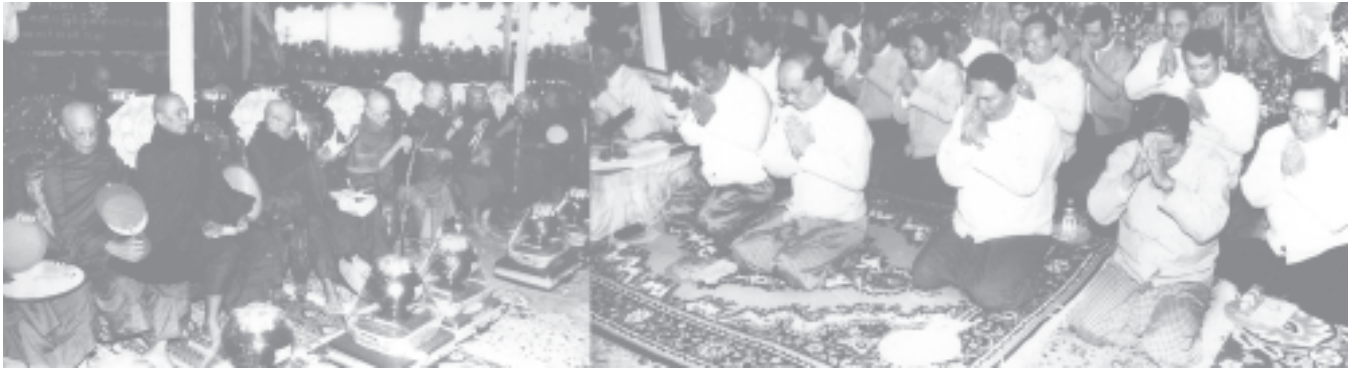
Secretary-1 Lt-Gen Thein Sein and party take the Five Precepts from the Vice-Chairman Sayadaw at the final rites for Chairman Sayadaw Bhaddanta Sobhita.