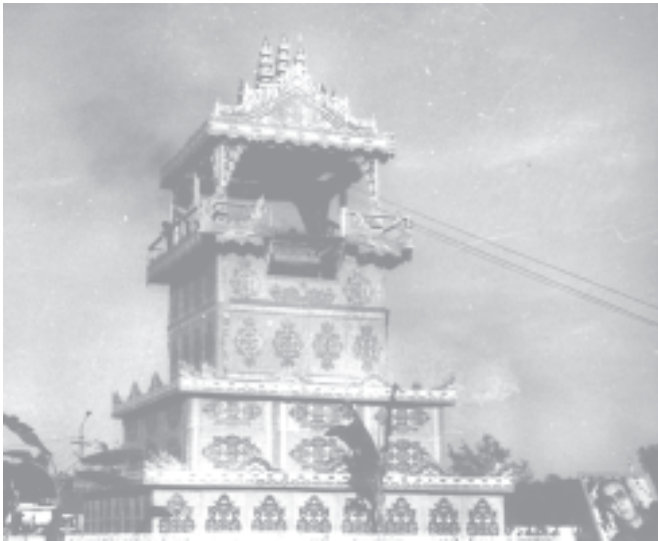
The remains of the Chairman Sayadaw being incinerated at final rites ceremony.