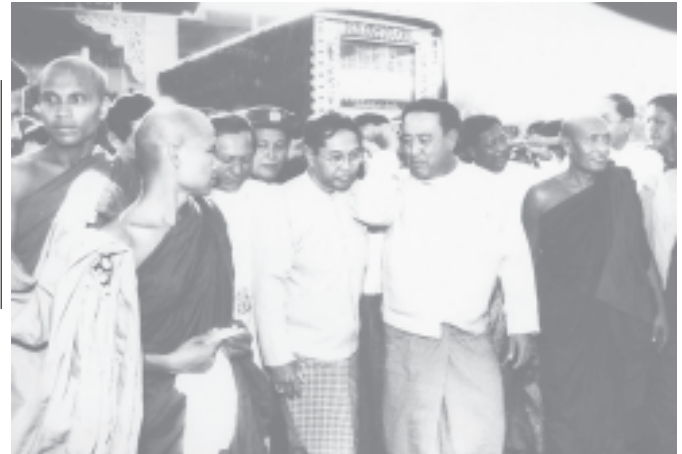
The Commander and ministers convey the remains onto the carriage.