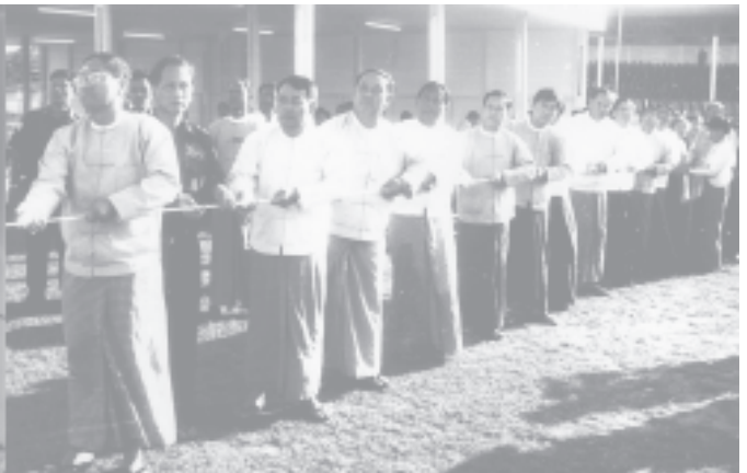
The Commander and ministers convey the remains of the Chairman Sayadaw onto the pyre.