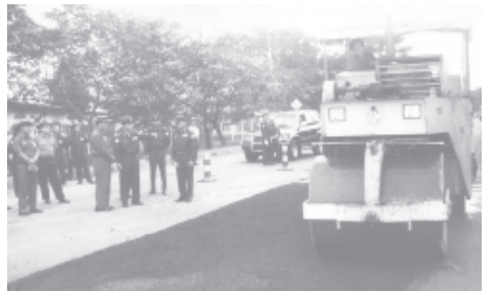
Commander Maj-Gen Myint Swe inspects upgrading of roads in Yangon City.