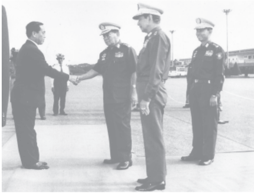
Senior General Than Shwe sees off Prime Minister Lt-Gen Soe Win before his departure for LPDR.

Minister for National Planning and Economic Development U Soe Tha and Minister for Foreign Affairs U Nyan Win left in advance for Vientiane, Laos, on 26 November to attend the Meetings of the ASEAN Foreign Ministers and ASEAN Economic Ministers prior to the ASEAN Summit.—MNA