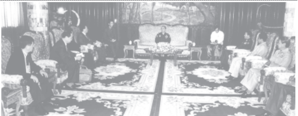
Chairman of Myanmar Olympic Council Secretary-1 Lt-Gen Thein Sein receives Asia Wushu Federation President Mr Li Zhijian and party at Zeyathiri Beikman Hall.— MNA

Also present at the call were Chairman of Myanmar Olympic Committee Minister for Sports Brig-Gen Thura Aye Myint (See page 10)