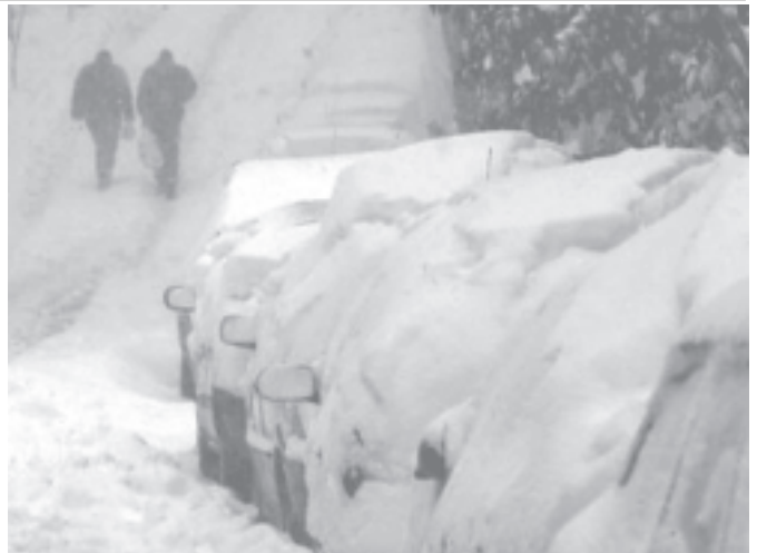
Pedestrians make their way through a snowstorm in Istanbul recently.

Mandated by the State Council, the commission oversees 187 large state-owned companies.