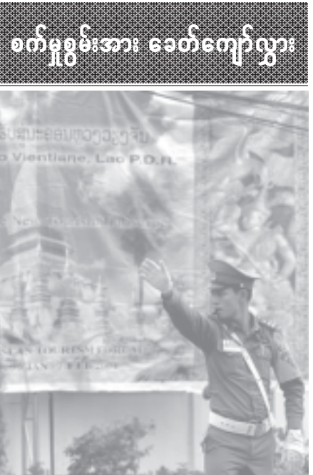
A police official directs traffic outside the Vientiane international airport as a billboard in the background welcomes delegates to the 10th Association of Southeast Asian Nations (ASEAN) summit in Vientiane on 25 November, 2004.