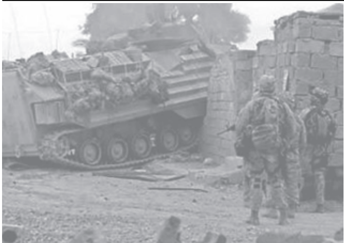
A US military Amphibious Assault Vehicle drives through a wall and locked gate to open a path for Marines assigned to the western Iraqi city of Fallujah on 26 Nov, 2004.

He said the dates of the visit will be worked out through diplomatic channels of the two countries.