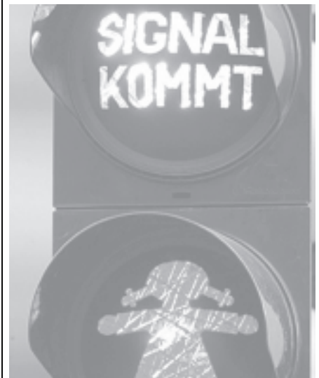
A pedestrian crossing signal features a woman in Zwickau, Germany, on 24 Nov 2004. The traffic lights in one town in eastern Germany have been seized by the equality of the sexes, with little green women replacing little green men on some pedestrian crossings from this week.