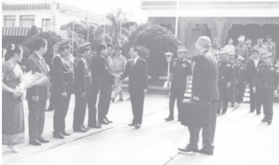
Prime Minister Lt-Gen Soe Win being seen off by diplomats of foreign missions at Yangon International Airport.