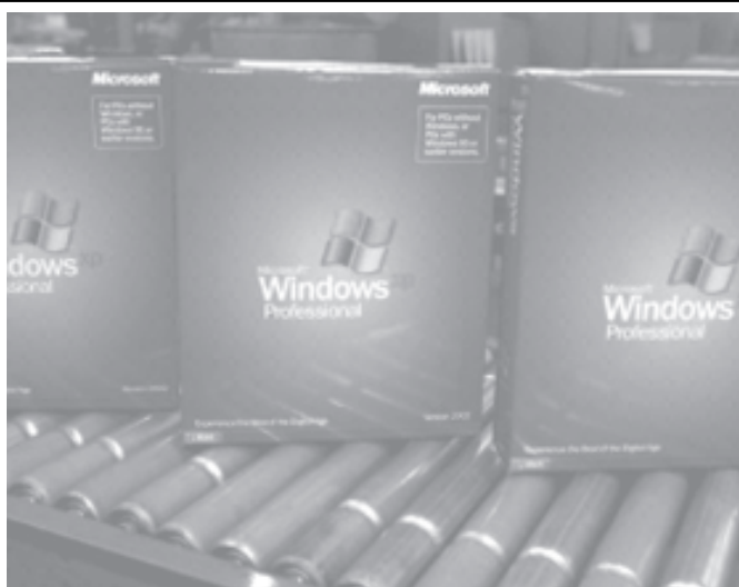
Microsoft's Windows XP Pro operating system roll off the assembly line. The European Union's second-highest court will rule in mid-December on whether to suspend EU sanctions against Microsoft pending an appeal by the US software giant.