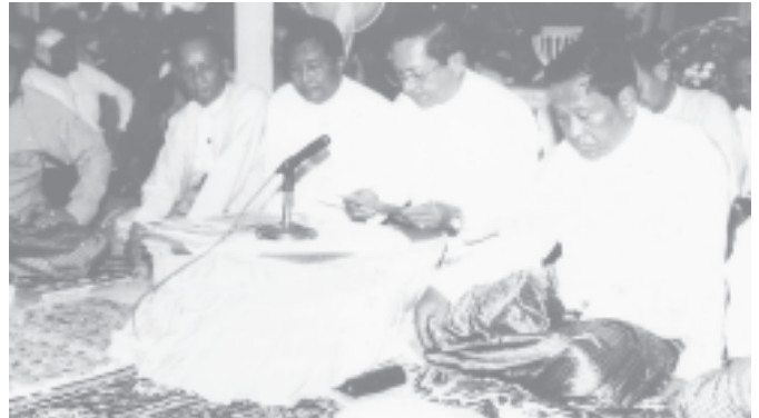
Minister for Religious Affairs Brig-Gen Thura Myint Maung supplicates on message of condolence.