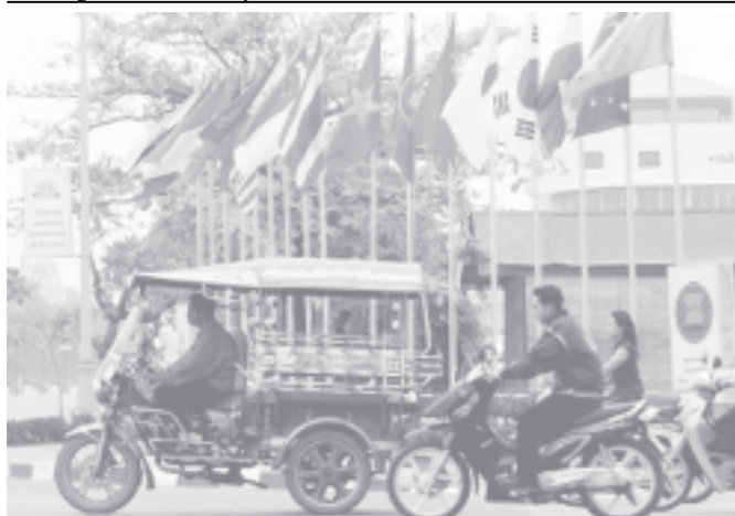
Motorcyclists pass a row of ASEAN and partner countries' flags in the centre of Vientiane.