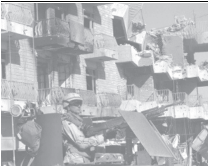
A US Marine drives over the remains of Fallujah on 26 Nov, 2004.

The massive earthquake measured 7.3 on the Richter Scale and struck nine sub-districts in Alor Island, East Nusa Tenggara Province in Indonesia in the early hours of 12 November.—MNA/Xinhua