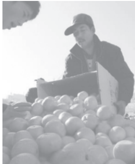
A Chinese vendor unloads oranges at an open market in Beijing on 26 Nov, 2004. China entered the World Trade Organization in 2001 as a 'non-market economy' and faces anti-dumping barriers to exports until it gains 'market economy' status.—INTERNET

Filipino households spend between 50 and 60 per cent of their incomes on food and beverage, he said. —MNA/Xinhua