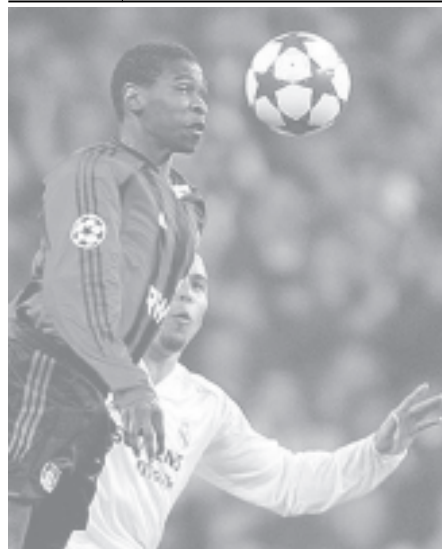
Bayer Leverkusen's Brazilian defender Juan Silveira dos Santos (L) vies with Real Madrid's Brazilian Ronaldo (R) during their Champions League clash at Santiago Bernabeu stadium in Madrid.