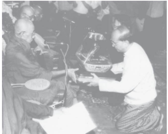
Secretary-1 Lt-Gen Thein Sein offers alms to a Sayadaw at the final rites for Chairman Sayadaw Bhaddanta Sobhita.