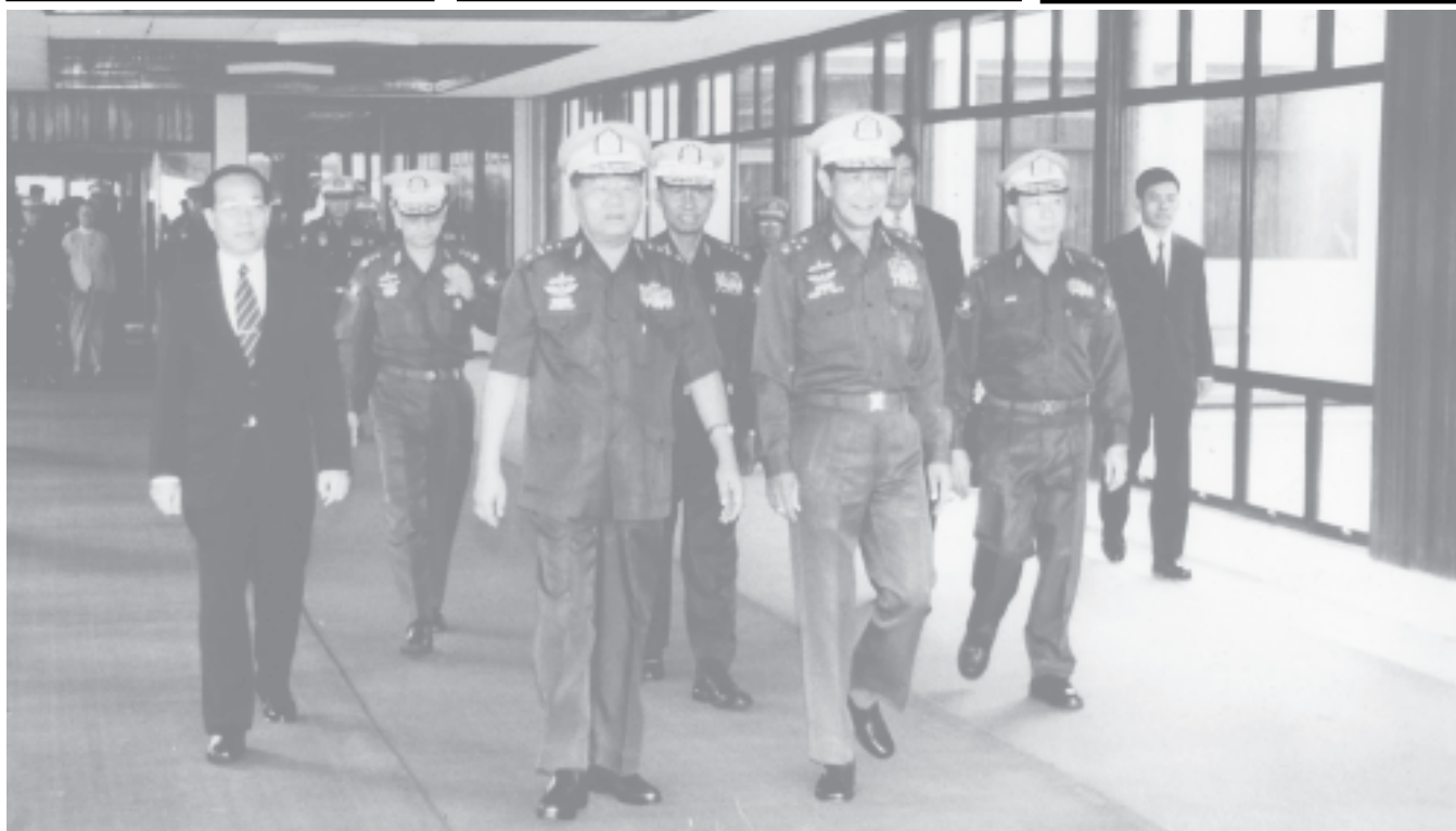
Senior General Than Shwe and party see off Prime Minister Lt-Gen Soe Win at the airport on his departure for Vientiane, Lao People's Democratic Republic, to attend 10th ASEAN Summit.