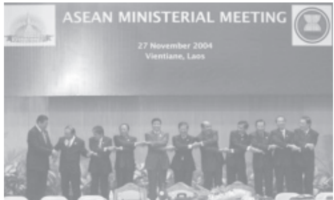
ASEAN Foreign Ministers line up for a photo call at the start of their meeting in Vientiane on 27 Nov, 2004. They are from left: Thailand's Surakiart Sathirathai, Vietnam's Nguyen Dy Nien, Prince Mohamed Bolkiah of Brunei, Hor Namhong of Cambodia, Indonesia's Hassan Wirajuda, Somsavat Lengsavat of host nation Laos, Datuk Seri Syed Hamid Albar of Malaysia, Myanmar's Nyan Win, Edsel Custodio of the Philippines, Singapore's George Yeo and ASEAN Secretariat Keng Yong.