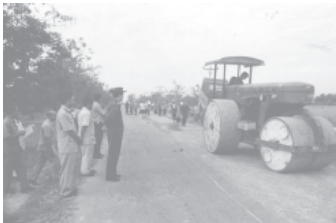
Minister for PBANRDA Col Thein Nyunt inspects construction of Okkan-Sanywa rural road in Taikkyi Township.—DAD

The Minister also inspected the tarring of Parami Yeiktha 2nd Street, and the sites for construction of more roads in the township. — MNA