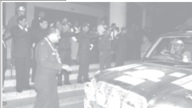
Commander Maj-Gen Ye Myint, Minister for Sports Brig-Gen Thura Aye Myint and Mayor Brig-Gen Yan Thein welcome competitors of 1st India-ASEAN Car Rally at Mandalay Hill Resort Hotel.