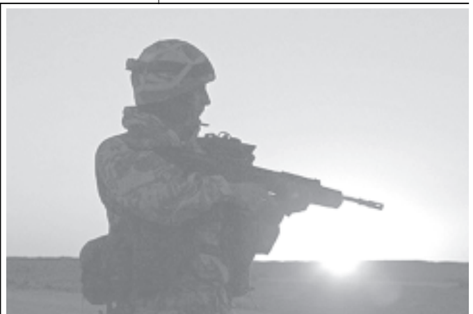
A British soldier takes position as armoured carriers form battle lines in the desert west of the Euphrates, south of Baghdad.