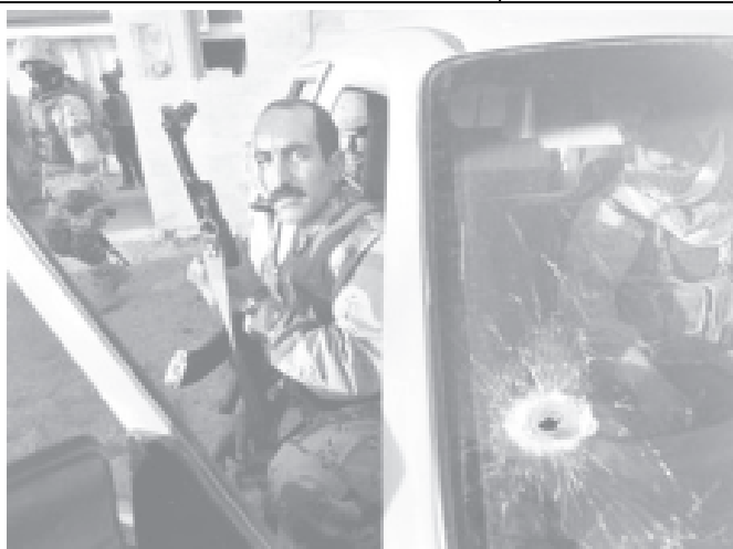
An Iraqi police car burns after it was attacked by gunmen in Baghdad.