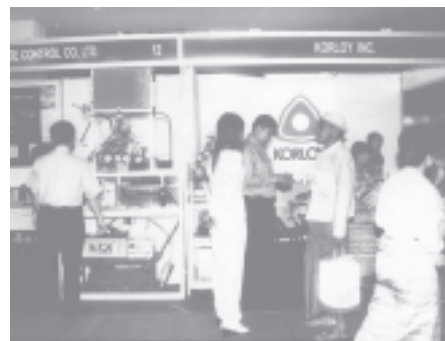
Products of Sam Hwa Climate Control Co Ltd and Korloy Inc being displayed at Korean Products Show 2004 at Yangon Trade Centre on 26 November.— UMFCCI