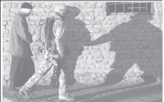
An Iraqi suspect is led by a British soldier during a raid. The UN's anti-torture panel has urged Britain to publish the findings of investigations into alleged cases of torture by British forces in Iraq and Afghanistan, according to a report obtained by AFP.