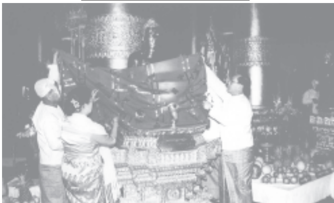
Prime Minister Lt-Gen Soe Win and wife Daw Than Than Nwe offer Shwekyar Thingan to Mahakaruna Mudra Buddha Image.