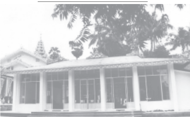
Newly built Maha Punnyawpakara Dhammayon.