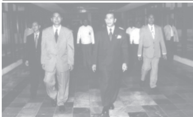
Minister for Foreign Affairs U Nyan Win and Minister for National Planning and Economic Development U Soe Tha being seen off at the airport.