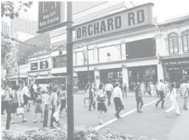
Pedestrians cross Orchard Road in Singapore's shopping district. Singapore is aiming to turn its famous Orchard Road district into one of the greatest shopping streets of the world, in a revamp aimed at meeting rising retail competition from other Asian cities. — INTERNET

In October last year, the government set up a Remaking Orchard Road Committee, comprising the Singapore Tourism Board, the Urban Redevelopment Authority and the Land Transport Authority, to study ways of making Orchard Road a more compelling shopping destination for both Singaporeans and tourists.—MNA/Xinhua