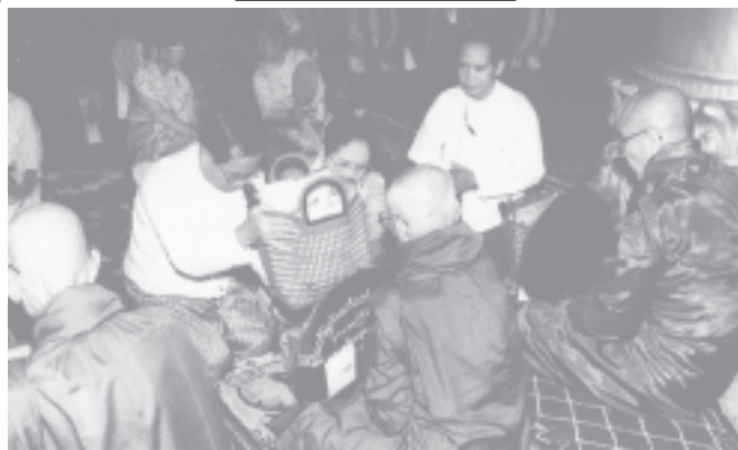
Prime Minister Lt-Gen Soe Win and wife Daw Than Than Nwe donate Kathina robes to a Sayadaw.