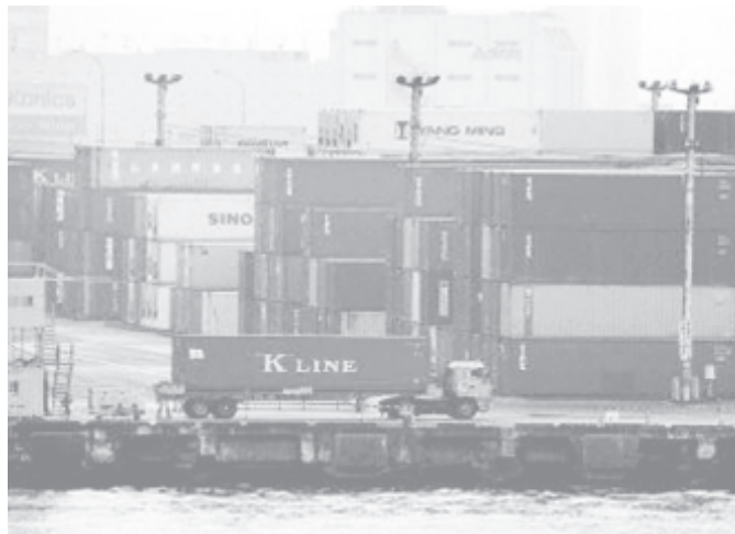
Japan's trade surplus in October rose 8.8 per cent as exports hit a record high on strong demand for ships, automobiles and steel even as export growth overall slowed.—INTERNET

The Pentagon's latest official count, provided on Wednesday, listed 1230 US military deaths in the Iraq war. It also listed more than 9300 US troops wounded in action, more than 5000 of whom were too badly injured to return to duty. —Internet