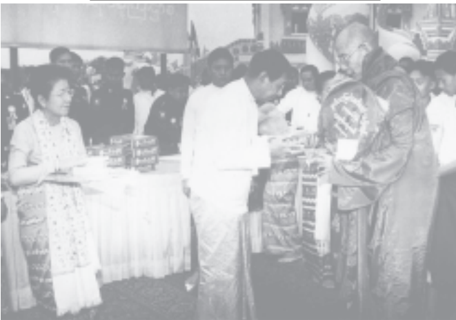
Vice-Senior General Maung Aye presents alms to a Sayadaw.