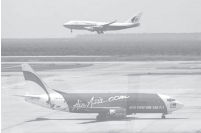
An AirAsia airplane taxis on the tarmac while a Malaysia Airlines System's airplane approaches the runway at Kuala Lumpur International Airport on 22, November 2004. Shares in Asia's only major listed budget airline, Malaysia's AirAsia Bhd., jumped 16 percent in their debut on Monday, as investors bet that cheap fares would drive strong growth in air travel across the region.