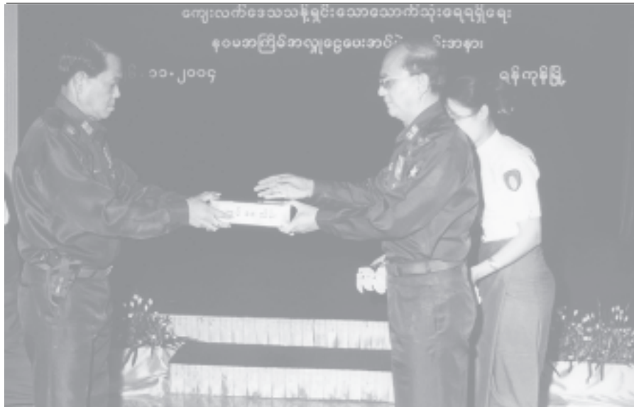
Secretary-1 Lt-Gen Thein Sein accepts K 1 million from Ministry of Defence at the ninth cash donation ceremony for supply of clean water in rural areas.