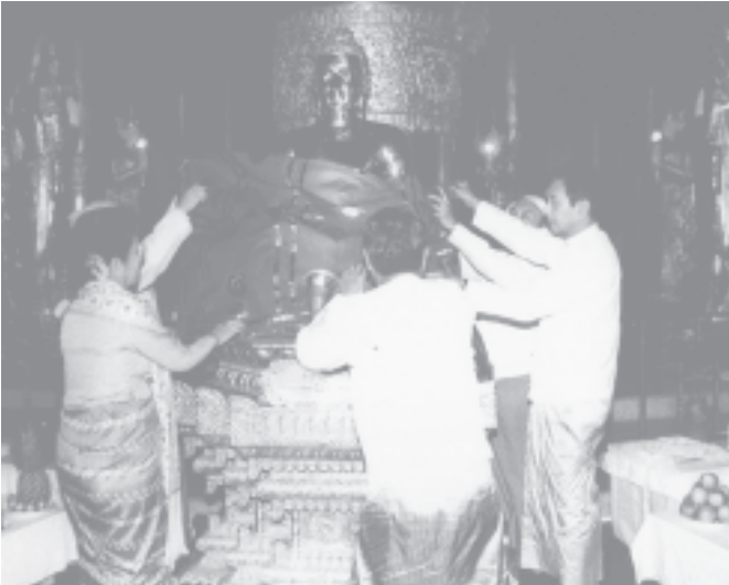
Vice-Senior General Maung Aye and wife Daw Mya Mya San offer Shwekyar Thingan to Varada Mudra Buddha Image.