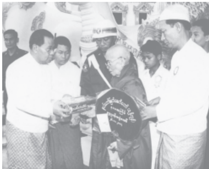
Senior General Than Shwe presents alms to a Sayadaw at the provisions offering ceremony of Tooth Relic Pagoda (Yangon).