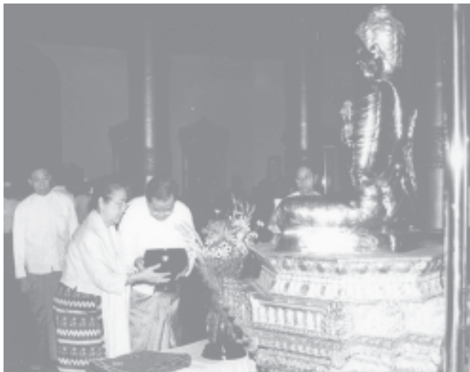
Senior General Than Shwe and wife Daw Kyaing Kyaing offer 'soon' and fruits to the Buddha Image of Tooth Relic Pagoda (Yangon).