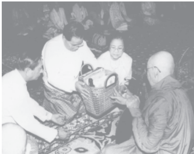
Senior General Than Shwe and wife Daw Kyaing Kyaing donate Kathina robes and alms to a Sayadaw.