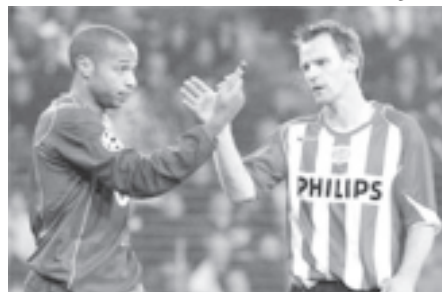
Andre Ooijer of PSV Eindhoven, right, gestures as Thierry Henry of Arsenal holds a lighter that was thrown on the pitch during the UEFA Champions League soccer match between PSV Eindhoven and Arsenal at the Philips Stadium in Eindhoven, The Netherlands.