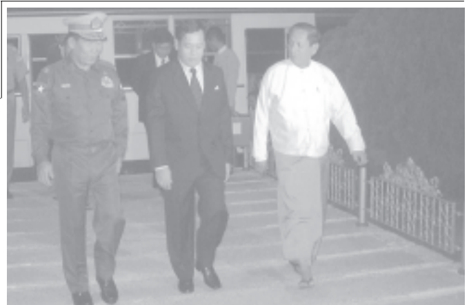
Minister Maj-Gen Thein Swe being welcomed back on his return from 10th ASEAN Transport Ministers Meeting in Cambodia.—TRANSPORT

Likewise, Deputy Minister for Transport Col Nyan Tun Aung and party who attended ASEAN Transport Senior Officials Meeting held on 20 and 21 November returned on the same flight.—MNA