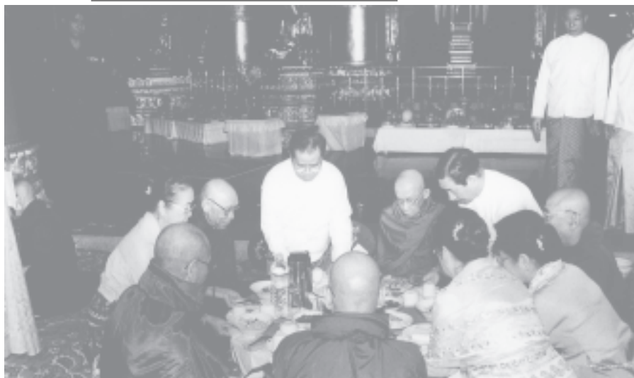
Senior General Than Shwe, wife Daw Kyaing Kyaing and party offer 'soon' to Sayadaws at the Ninth Buddha Pujaniya of Tooth Relic Pagoda (Yangon).

wives, the Chairman of Yangon Division Peace and Development Council Commander of Yangon Command and the ministers donated robes and alms to the Sayadaws.