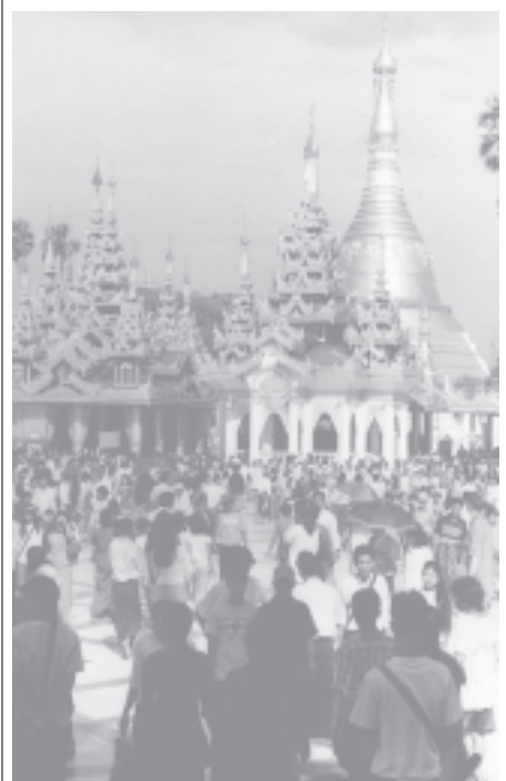
The precinct of Shwedagon Pagoda being thronged with devotees.— NLM

The meeting discussed to cooperation in trade, economy and information between Myanmar and India, and establishing bilateral special trade zone infrastructures. The two ministers also held discussions on bilateral economic cooperation, investment, and promotion of border trade. — MNA