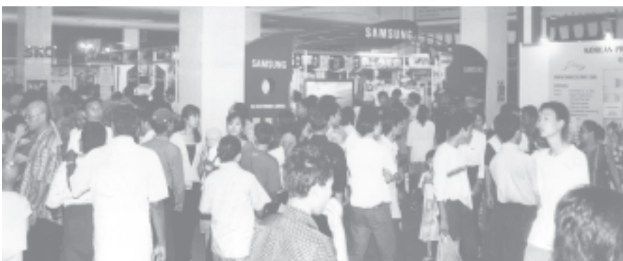
Korean Products Show 2004 draws a large number of visitors on Friday.

According to observations at (06:30) hours MST today, due to the influence of the depression in the Andaman Sea, isolated to scattered rain or thundershowers are likely Rakhine, Mon and Kayin States, Ayeyawady, Yangon, Bago and Taninthayi Divisions within the next (48) hours commencing morning today.