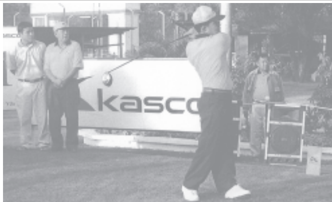
Mandalay Mayor Brig-Gen Yan Thein tees off to open First Kasco Open Golf Championship.—MGF