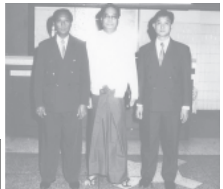
Myanmar delegation seen at the airport before departure for China.