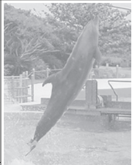
This combo picture released by Japanese tiremaker Bridgestone shows a dolphin named Fuji jumping out of the water with the world's first artificial rubber fin at an aquarium in Japan's southern island of Okinawa on 19 Nov, 2004.