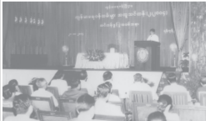
Minister Dr Kyaw Myint addresses the opening of special course No 2/2004 for health staff. — HEALTH

A total of 41 trainees including the staff who will study advanced medical science abroad are attending the five-day course. — MNA