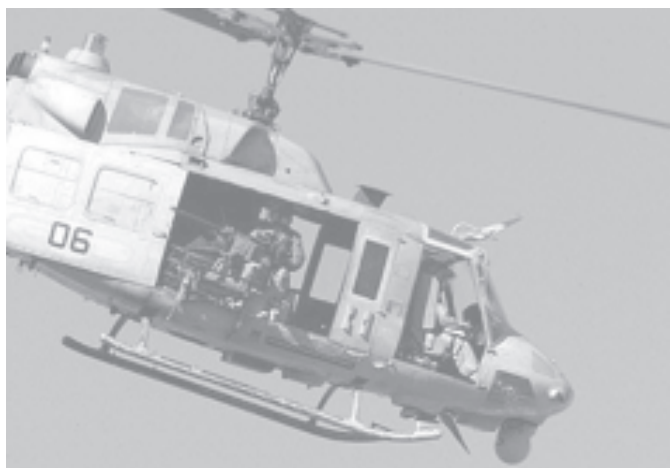
A US Marine helicopter flies over Fallujah on 19 Nov, 2004.