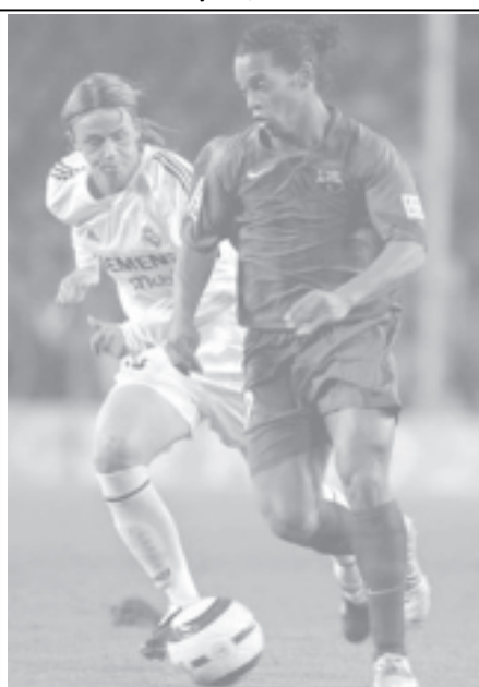
FC Barcelona player Ronaldinho, from Brazil, is followed by Real Madrid player Guti, left, during their League soccer match in Barcelona, Spain, on 20 Nov, 2004. FC Barcelona won, 3-0.

the tournament became just the third player to serve more than 1,000 aces in the season, fired seven missiles past Hewitt in the opening set. But a relentless Hewitt, Masters champion in 2001 and 2002, would not be intimidated, weathering the assault and patiently waiting his chances.—MNA/Reuters