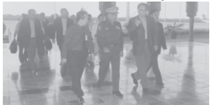
Chinese Sports Minister Mr Li Zhijian and party being welcomed by Deputy Minister Brig-Gen Aung Thein and WWF President U Khin Maung Lay. — NLM

Executive member of WWF Gen Falconi and party of Italy arrived here by air yesterday evening. — NLM