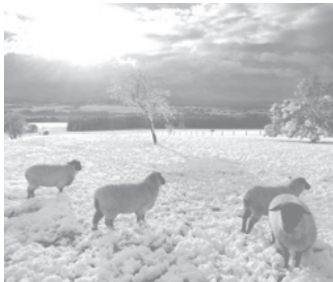
Sheep stand on a snow-covered meadow in the early morning in Froendenberg, western Germany, on 20 Nov 2004.