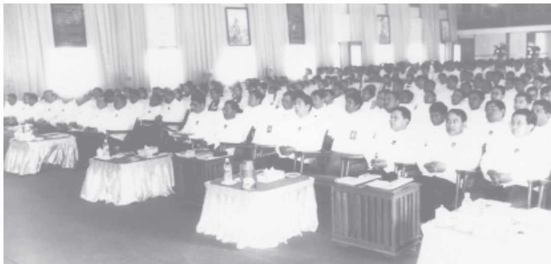
Dignitaries at the third-day session of USDA Annual General Meeting (2004).

ing the discussions on the organizational sector that the USDA will be a stronger one if trips for organizational purposes can be conducted right (See page 7)