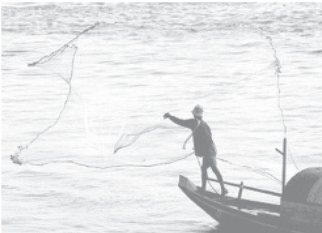
A man throws out a fishing net from his boat on the Mekong river recently.

The number of food trade disputes posted by the World Trade Organization soared from 200 in 1995 to 600 in 2001. And this growth trend continues, Zhang said.—MNA/Xinhua