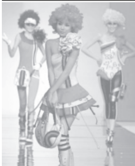
Chinese models parade on a catwalk during the 10th China New Fashion Designers' Contest in Beijing on 19 Nov, 2004. —INTERNET