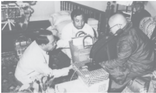
Minister Brig-Gen Kyaw Hsan offers alms to Sayadaw Bhaddanta Candobhasa.

Present on the occasion were Presiding Sayadaw Agga Maha Saddhammajotikadhaja Bhaddanta Candobhasa and members of Sangha, Deputy Minister for Information Brig-Gen Aung Thein, directors-general and managing