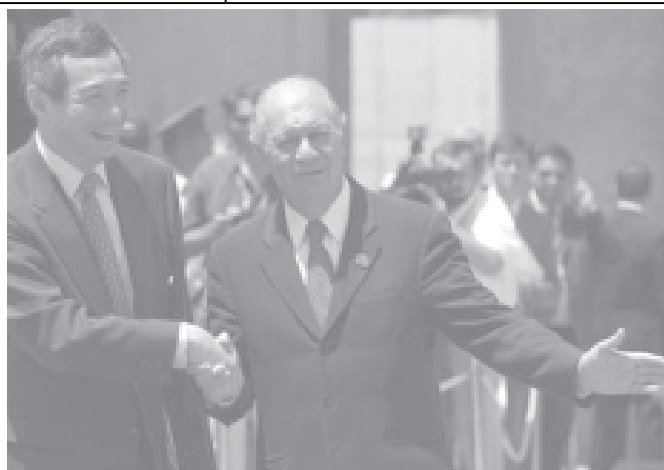
Chile's President Ricardo Lagos, right, welcomes Singapore's Prime Minister Lee Hsien Loong during his arrival to the Espacio Riesco Convention Centre in Santiago for the first APEC leaders working session, on 20 Nov, 2004.