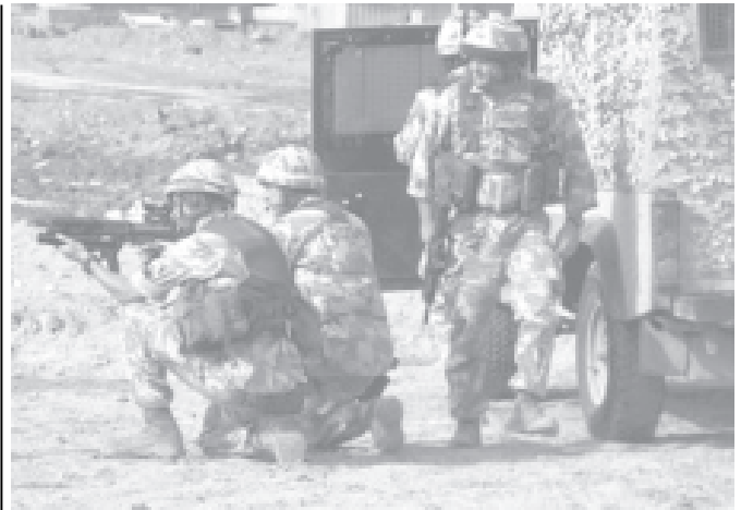
British troops secure the area during a ceremony in Basra, Iraq, on 19 Nov, 2004.