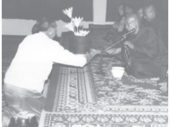
Minister U Thaung and wife offering Kathina robes to members of the Sangha.