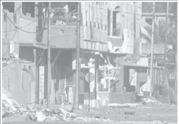
A war-ravaged street in Fallujah on 19 Nov, 2004. — INTERNET

Both leaders are here for the 12th Economic Leaders Meeting of the Asia-Pacific Economic Cooperation Forum. —MNA/Xinhua