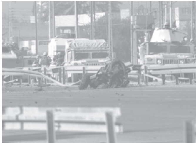
US Marines against the shrapnel damaged shutters of stores in Fallujah on 19 Nov, 2004.