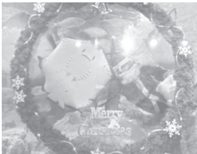
Rays gather around diver Hitomi Ito dressed as Santa Claus feeding fish as the annual Christmas attraction starts at Tokyo's Sunshine International Aquarium on 19 Nov, 2004.—INTERNET

— Factors of uncertainty and instability, such as local conflicts and terrorism, pose increasing threat to world peace and development. — MNA/Xinhua