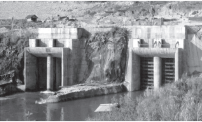
No 1 diversion tunnel of Paunglaung Hydropower project, which has a generating capacity of 280 megawatts. -MNA