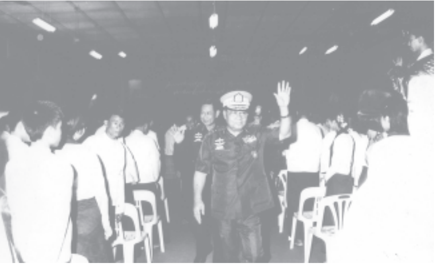
Senior General Than Shwe cordially greets delegates to Annual General Meeting (2004) of Union Solidarity and Development Association.

All the people suffered ill effects of misunderstanding among them. Over 40 years of armed conflict smeared Myanmar history. The people had to live in miserable condition in the colonial period. National solidarity weakened soon after regaining the independence due to the divide-and-rule policy of the colonial period resulting in the loss of peace, tranquillity and national races is the demand of history. Tangible results were achieved as the government had carried out the tasks with genuine goodwill. Better foundations for national solidarity came together with development.