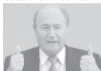
FIFA-President Sepp Blatter

"A select few European clubs are increasingly des-