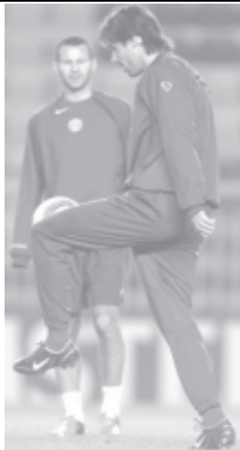
Ryan Giggs (L) watches his teammate Ruud Van Nistelrooy.

The Sunday Mirror said Giggs could be sold as early as January after chief executive David Gill told manager Alex Ferguson that players must be sold before anymore can be brought in.—MNA/Reuters