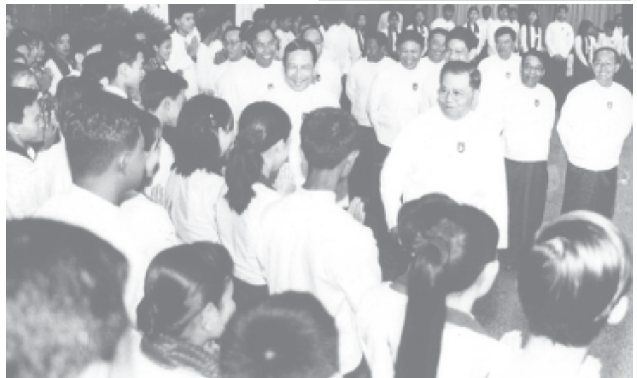
USDA Patron Senior General Than Shwe cordially greets delegates to USDA Annual General Meeting (2004) and outstanding youths.

The USDA Patron arrived at the dinner at 6.45 pm and cordially greeted secretaries of State and Division USDAs, regional coordinators of USDA Headquarters, the delegates to the Annual General Meeting, students who stood first to tenth in matriculation examination (2004) in the entire Myanmar, students who stood first in matriculation examination in respective States and Divisions, who won gold in Asia level sports events, outstanding Red Cross members, Auxiliary Fire Brigade, outstanding new generation youths in aviation and marine courses, those who won prizes in the 59th Anniversary Armed Forces Day commemorative extempore talks contest (USDA central level), students who won five gold and above in the Myanmar Traditional Cultural Performing Arts Competitions organized by (See page 10)