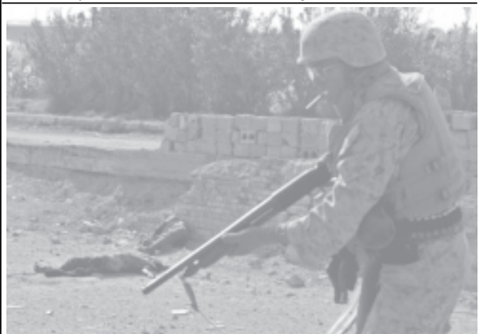
A US soldier secures an area in the devastated Iraqi city of Fallujah. US-led forces hunted down final pockets of resistance in Fallujah on 16 Nov, 2004.