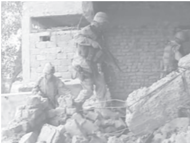
A video image shows US Marines sneak into a breach in a wall in the city of Fallujah, on 16 Nov, 2004.