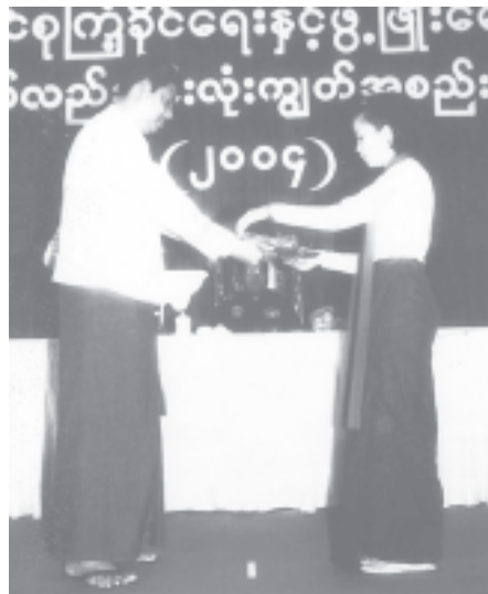
USDA Secretary-General U Htay Oo presents gift to Ma Win Le Mon of Mawlamyine BEHS No 9 in Mon State.