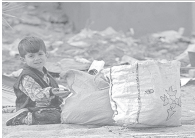
An Iraqi boy waits for his mother near her belongings in Baghdad on 17 Nov, 2004. The boy arrived with his mother to live in one of the tents erected by a local relief agency for Iraqis fleeing the devastated city of Fallujah. —INTERNET

Blix told a seminar here in Stockholm that "the UN today is in a difficult situation after the US, Britain and some other states ignored the majority of the Security Council and intervened in Iraq to eliminate weapons of mass destruction—weapons that were not there". He also criticized the United States for acting unilaterally when international groups, including the UN, disagreed with US views.—MNA/Xinhua