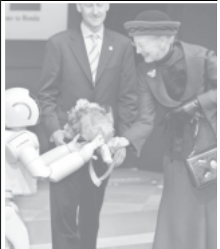
Visiting Danish Queen Margrethe II receives a bouquet of flowers from robot Asimo as she visits the Honda headquarters in Tokyo on 17 Nov, 2004. — INTERNET

A police spokesman said the train struck a gate at a level crossing near the village of Kirkby Green. — MNA/Reuters