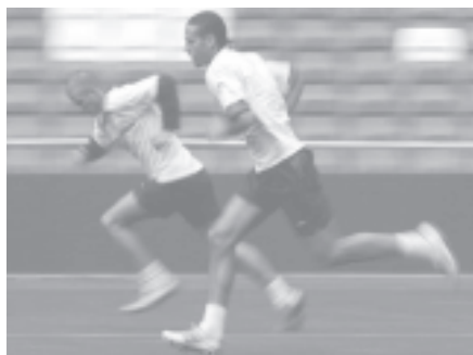
England's captain David Beckham (L) and Rio Ferdinand (R) run during a training session at the Bernabeu Stadium in Madrid, on 16 Nov. 2004. England play Spain in a friendly international soccer match in Madrid on 17 Nov. 2004.