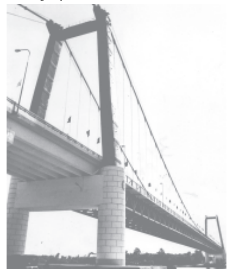
Patheon Bridge across Ngawun River. — MNA