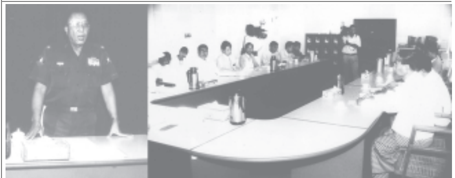
Deputy Minister Brig-Gen Aung Thein addresses first meeting of Work Committee for 60th Anniversary Armed Forces Day commemorative TV Quiz. — MNA