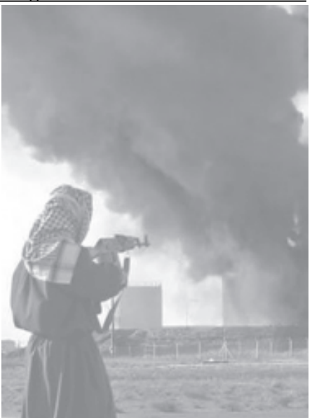
An Iraqi guerilla points his rifle towards a blazing oil storage tank near the northern city of Mosul on 15 Nov, 2004.

tary action to oust former Iraqi president Saddam Hussein. "I am not sure with America as it is these days that it would be easy for someone, even the British, to be an honest broker," Chirac was quoted as saying in the Times .—MNA/Reuters