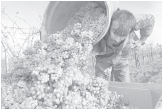
Harvesting Riesling grapes. German wine is enjoying a renaissance on the world market with a new generation of Rieslings squeezing out well-established French and Californian whites.