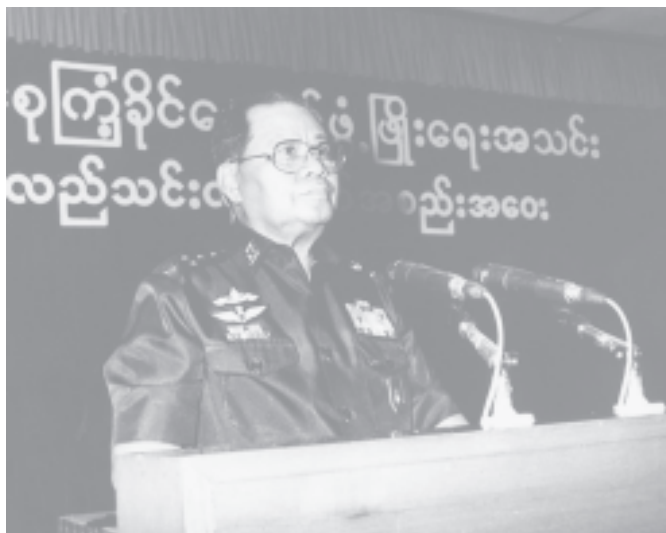
Patron of the Union Solidarity and Development Association Senior General Than Shwe addresses the USDA Annual General Meeting (2004).

The government firmly believes national solidarity major requirement for national development The government will further strengthen national solidarity in the interest of the State and the people