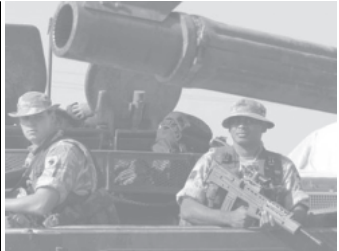
British Army troops deploy to the southern Iraq town of Shekhata, 30 km north of Basra, on 15 Nov, 2004. —INTERNET