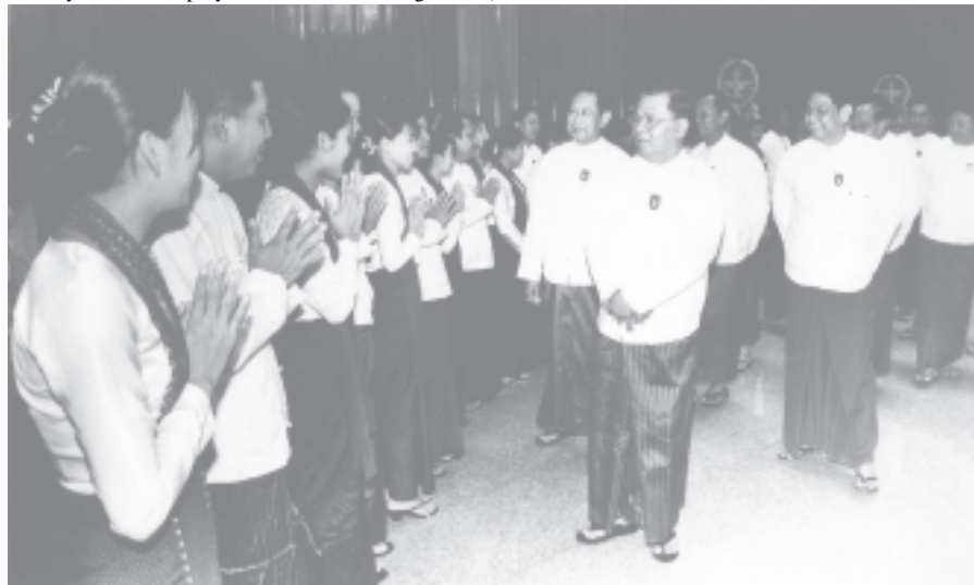
Senior General Than Shwe has a cordial conversation with delegates to the USDA Annual General Meeting (2004).