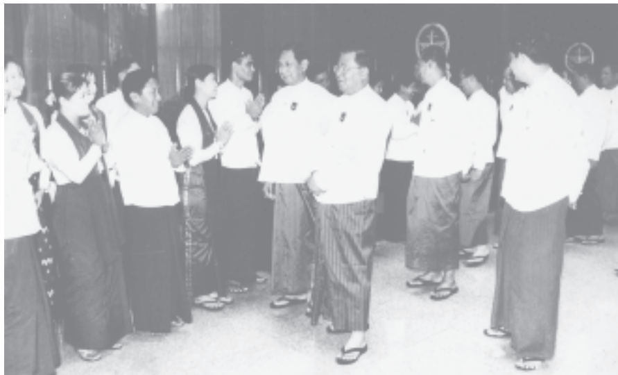
Senior General Than Shwe cordially greets delegates to the USDA Annual General Meeting (2004) of the Union Solidarity and Development Association.

Also present were Members of Panel of Patrons of USDA Vice-Chairman of State Peace and Development Council Deputy Commander-in-Chief of Defence Services Commander-in-Chief (Army) Vice-Senior General Maung Aye, Member of the State Peace and Development Council General Thura Shwe Mann of the Ministry of Defence, Prime Minister Lt-Gen Soe Win, Secretary-1 of the State Peace and Development Council Lt-Gen Thein Sein, members of the State Peace and Development Council, the Commander-in-Chief (Navy), the Commander-in-Chief (Air), the chairman of Yangon Division Peace and Development Council the Commander, ministers, the chief justice, the attorney-general, the auditor-general, the chairman of Civil Service Selection and Training Board, central executive committee members of USDA, members of National Convention Convening Commission, senior military officers, deputy ministers, directors-general