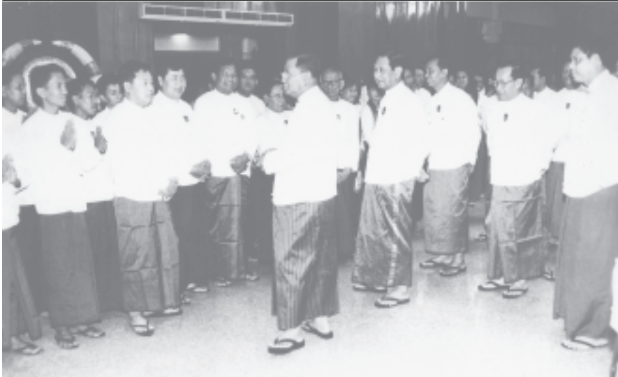
Patron of USDA Senior General Than Shwe cordially greets delegates to USDA Annual General Meeting (2004) and outstanding youths at the dinner.