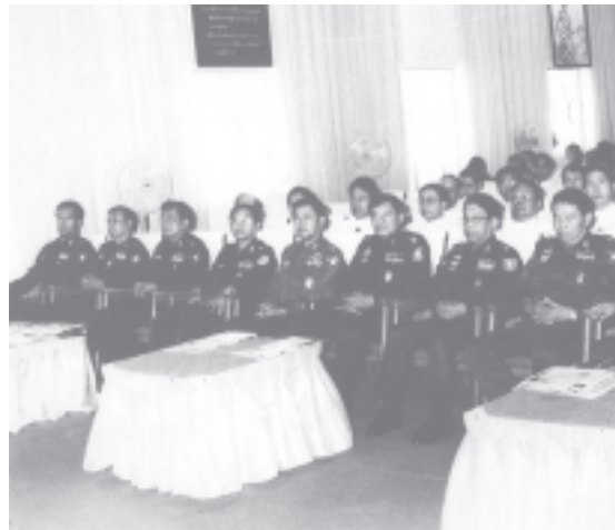
Dignitaries at the Annual General Meeting (2004) of the Union Solidarity and Development Association.