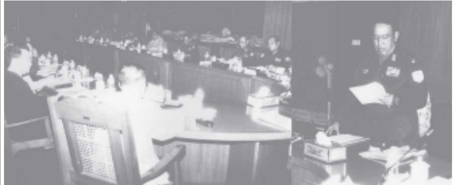
Minister Maj-Gen Maung Oo addresses the Meeting of the Central Authority on the Mutual Assistance in Criminal Matters. — MNA

YANGON, 16 Nov.—The Central Authority on Mutual Assistance in Criminal Matters held its 1/2004 meeting at the Ministry of Home Affairs this afternoon.