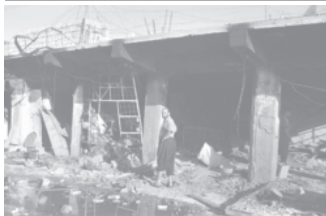
An Iraqi man looks at battle damage in Baiji, Iraq, on 15 Nov, 2004, after a battle erupted Sunday between militants and US troops in the main market in the northern town, killing at least six people and wounding 20 others, according to witnesses.