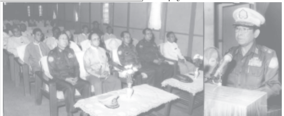
Minister Maj-Gen Saw Tun delivers a speech at the opening of road quality control course No 2 and store keeping course No 4. — CONSTRUCTION

A total of 40 trainees are attending the two-week road quality control course and 23 trainees five-week store keeping course. — MNA