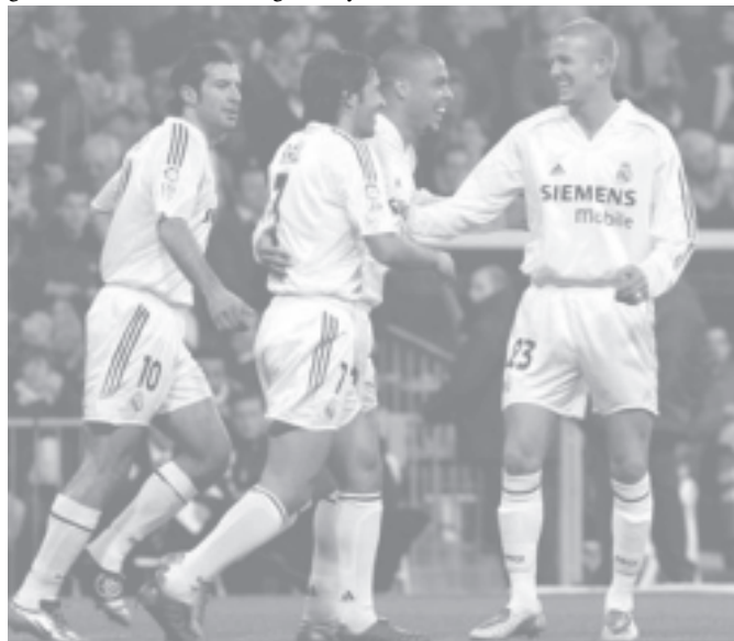
Real Madrids Brazilian striker Ronaldo, 3rd left celebrates with teammates Luis Figo of Portugal, left, Raul Gonzalez, 2nd left and David Beckham of England after Ronaldo scored against Albacete during a Spanish league soccer match at the Bernabeu stadium in Madrid Sunday Nov 14, 2004.

In the second period, Real looked even more threatening as they attacked at every opportunity and they went 4-1 up in the 49th minute after a David Beckham free kick following a foul on Figo was headed inside the post by Samuel.—MNA/Reuters