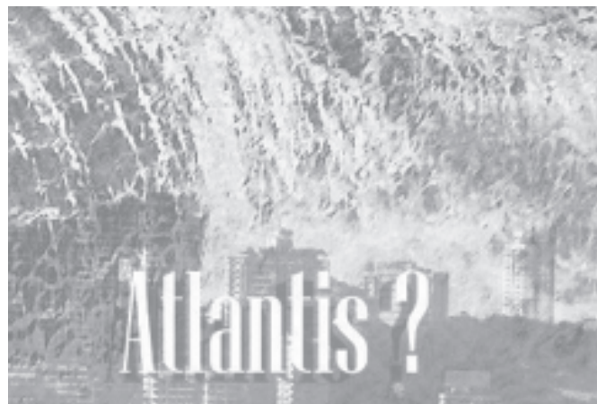
US researcher Robert Sarmast claimed to have found proof that the mythical lost city of Atlantis actually existed and is located under the Mediterranean seabed between Cyprus and Syria. — INTERNET