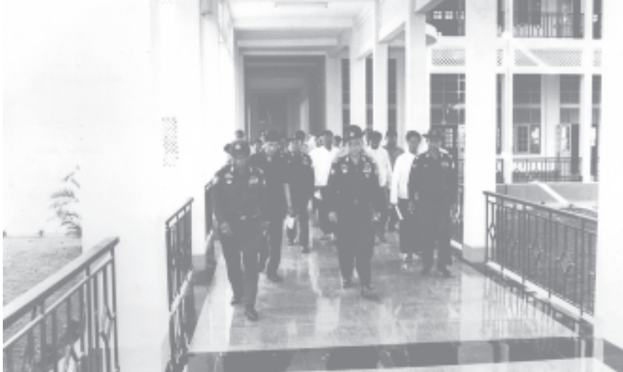
Secretary-1 Lt-Gen Thein Sein inspects Institute of Traditional Medicine (Mandalay) under construction.

Next, NHC Chairman Secretary-1 Lt-Gen Thein Sein and party arrived at the Mandalay International Airport. They next left the airport and arrived here in the evening.—MNA