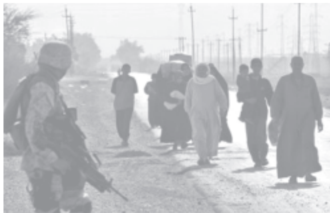
Iraqi families leave the outskirts of Fallujah, Iraq, on 15 Nov, 2004 as US forces resumed heavy airstrikes and artillery in Fallujah and surrounding areas.