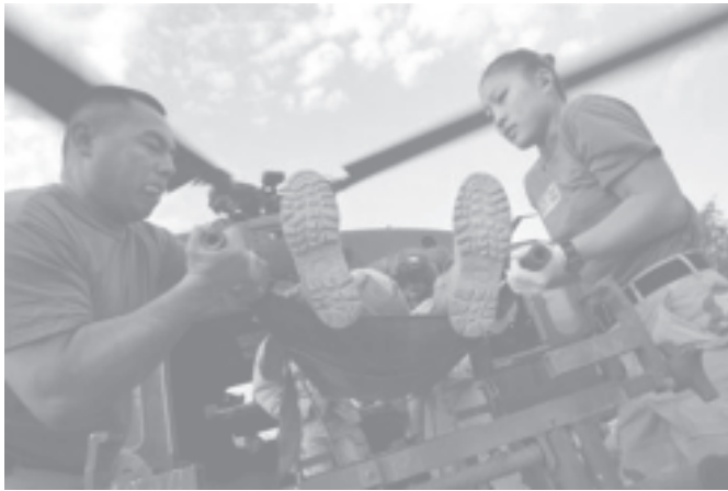
US Army personnel receive an American soldier with shrapnel wounds to the head at the 31st Combat Support Hospital in Baghdad, on 15 Nov, 2004.