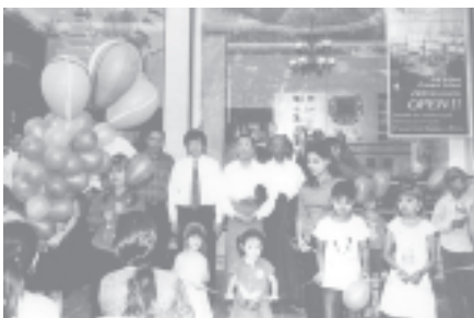
Opening ceremony of Total Learning Academy in Progress.—H

level to advanced level will be taught by well-experienced teachers at the well-facilitated school. There will also be Saturday and Sunday classes for day students. Other foreign language classes will soon be conducted there.—MNA