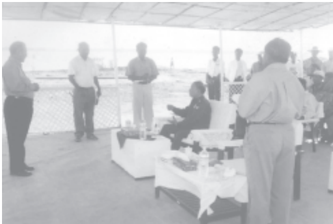
Minister Brig-Gen Lun Thi hears reports by Deputy Minister U Pe Than and officials. — ENERGY

YANGON, 16 Nov — Minister for Energy Brig-Gen Lun Thi yesterday oversaw the completion of the laying of 10-inch gas pipeline linking Pyay and Seiktha Village in Bago Division (West) at the work site in Seiktha Village in Shwedaung Township.