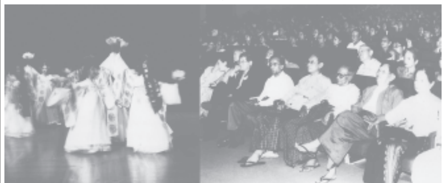
Korean dance troupe performs entertainment programmes at the National Theatre. — MNA