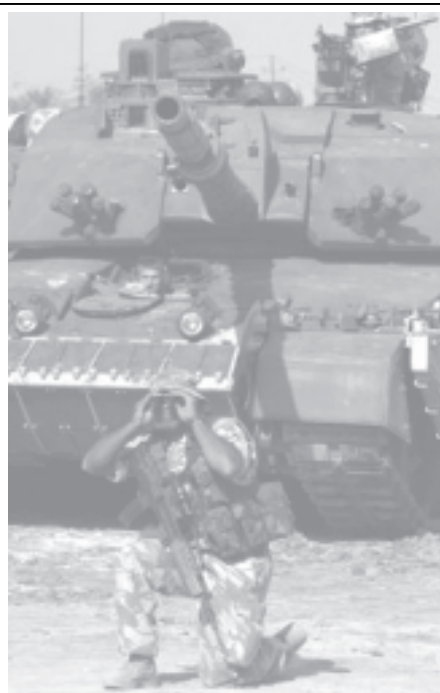
British Army Challenger 2 tank crew watches over the area after deploying to the southern Iraq town of Shekhata, 30 km north of Basra, on 15 November, 2004.