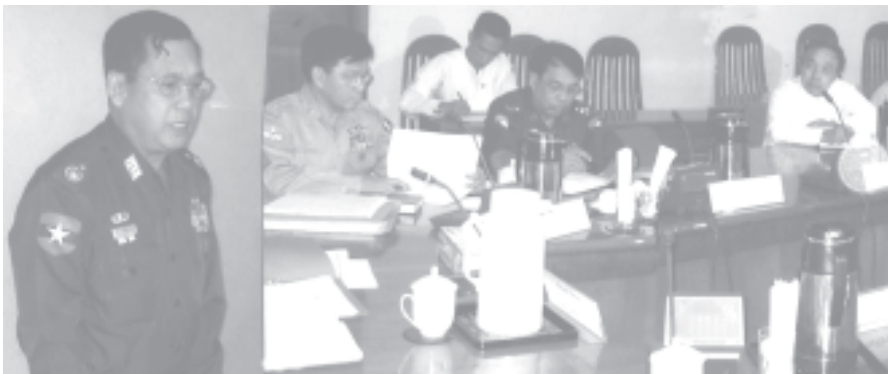
Minister Maj-Gen Thein Swe speaks at the third meeting of Transport Subcommittee for Holding the fourth World Buddhist Summit. — TRANSPORT