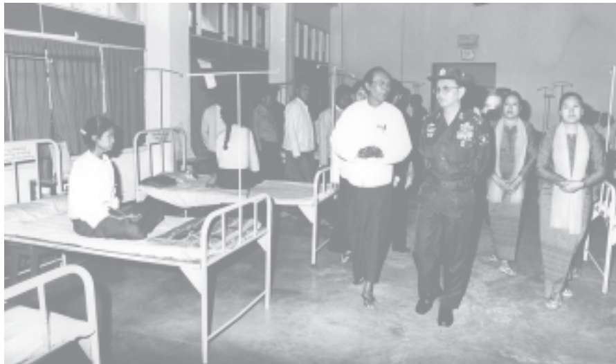
Secretary-1 Lt-Gen Thein Sein inspects Mandalay Traditional Medicine Hospital (50-bed).