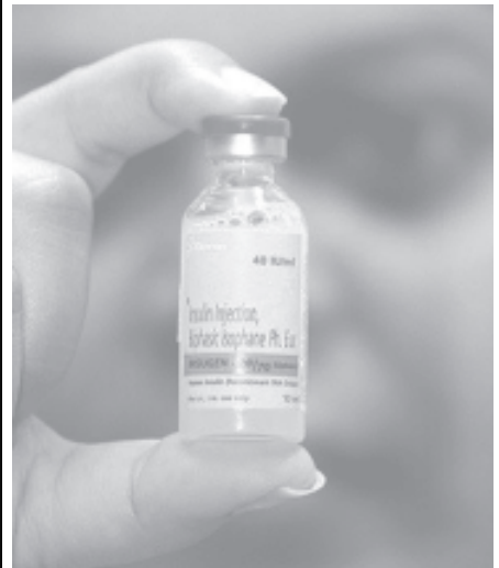
An Indian woman holds a vial of the newly launched insulin at a press conference in Bangalore. Biocon launched the sale of a cheap form of insulin to treat diabetes in a country which accounts for one-quarter of the world's diabetic population.