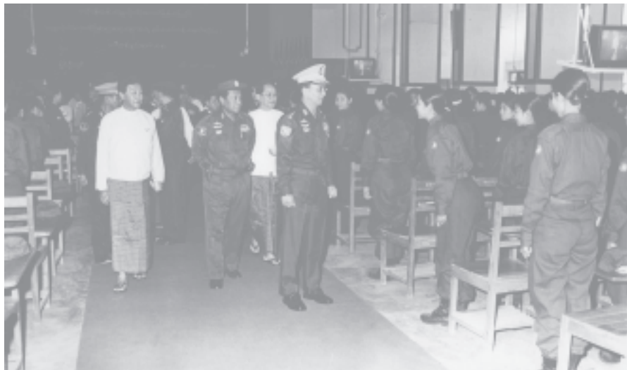
Secretary-1 Lt-Gen Thein Sein cordially greets trainees of Special Refresher Course No 3 for Faculty Members.

In addition, the education sector should strive to