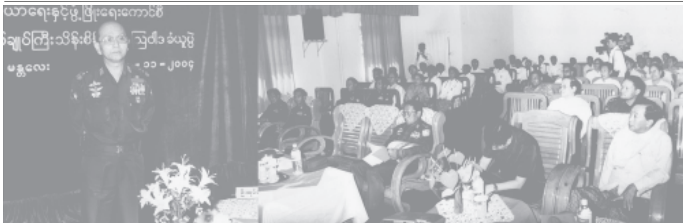
Secretary-1 Lt-Gen Thein Sein holds a meeting with officials and medical staff at Mandalay General Hospital.

After the ceremony, Secretary-1 Lt-Gen Thein Sein cordially greeted the trainees. A total of 634 faculty members of colleges and universities are attending the course.