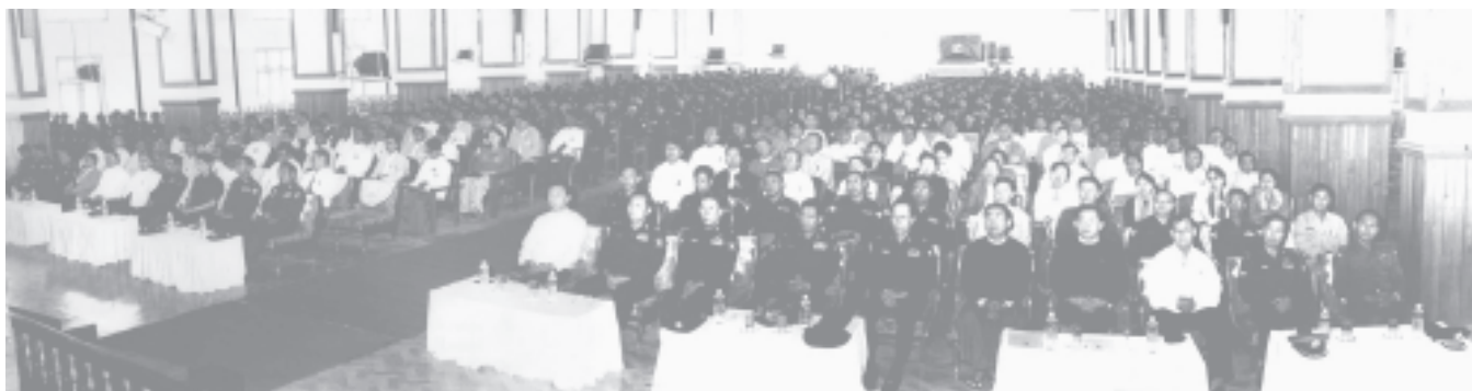
Secretary-1 Lt-Gen Thein Sein gives a speech at the opening of Special Refresher Course No 3 for Faculty members.