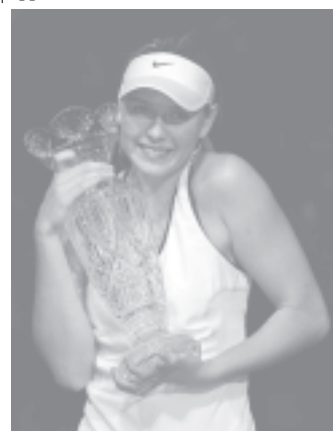
Russia's Maria Sharapova hugs the trophy after defeating Serena Williams, 4-6, 6-2, 6-4, in the final game of the WTA Tour Championships at Staples Center in Los Angeles, on 15 Nov, 2004.

Serena lifted the trophy on her first appearance in 2001.—Internet