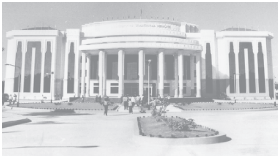
The Institute of Traditional Medicine in Mandalay.