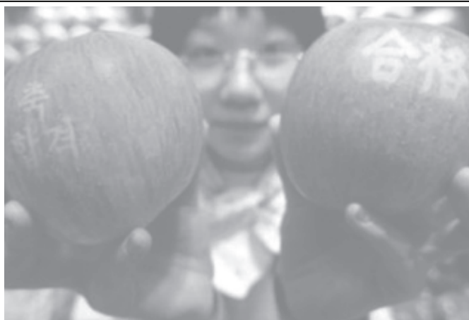
A clerk displays apples bearing the words "passing the examination" (Chinese characters in R and Korean in L) at a department store in Seoul on 16 Nov, 2004.