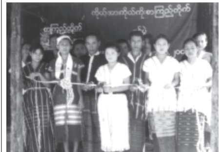
Photo shows the opening ceremony of the self-reliant library in ThanBan village.