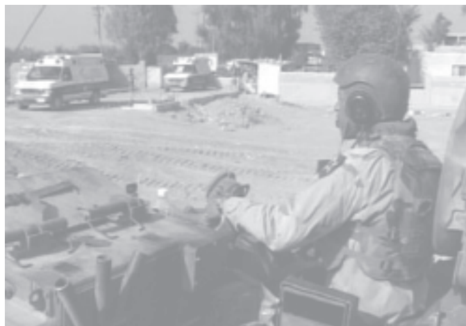
Iraqi ambulances leave the Fallujah Hospital under the watchful eyes of US Marines, on 15 Nov, 2004.

The International Red Cross said it was striving to gain access.— Internet