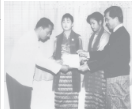
Minister U Nyan Win presents a completion certificate to a course graduate.