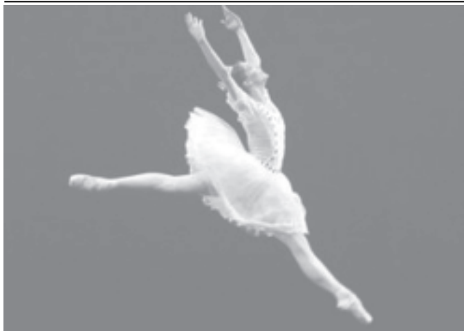
British dancer Darcy Bussell performs the Awakening Pas De Deux during a dress rehearsal for the Ashton Mixed Programme at the Royal Opera House in London, on 12 Nov, 2004.