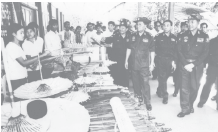
Senior General Than Shwe observes production process of Patheingyi traditional umbrellas in Patheingyi Shwesar Umbrella Enterprise.