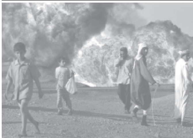
Iraqis walk near an oil pipeline fire in Taji, Iraq on 14 Nov, 2004.