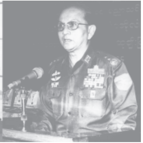
Secretary-1 Lt-Gen Thein Sein addresses prize presentation to outstanding students in matriculation exam (2003-2004) and Maths Olympic Contest.