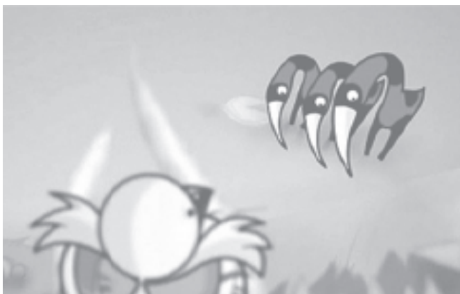
This picture shows a painting of one of the first animation films made in Kenya on 14 Nov, 2004. UNESCO has launched in Kenya the first animation film workshops with the objective to promote African economy. Since July 2004, seven short animation films have been produced in Kenya by African interns after a five week internship.

JINAN, 15 Nov— In an effort to lure Chinese students studying abroad to come back to “serve for the construction of the Motherland,” China will work out “more effective measures and create a better environment”, a senior personnel official said here on Sunday. Speaking at the third China Shandong Overseas Personnel Exchange Fair in Jinan, capital of east China’s Shandong Province, Zhang Bolin, China’s minister of personnel, said that China will put as much importance on wooing talented students studying overseas to come back as it has placed on the introduction of foreign funds, advanced technologies and modern management mechanisms. — MNA/Xinhua