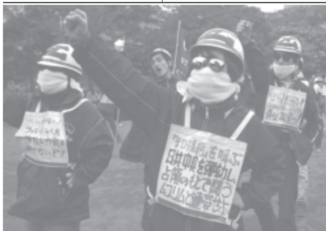
Masked leftist protesters shout anti-war slogans in Tokyo, on 14 Nov, 2004.