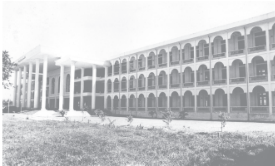
Pathein Technological College. (News on page 1) — MNA