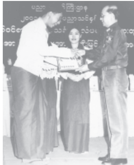
Secretary-1 Lt-Gen Thein Sein presents second prize (science combination) to Maung Ye Oo of No 3 BEHS in PyinOoLwin.

Gen Thein Sein said that the State Peace and Development Council has laid down the national education promotion programmes and is implementing them for the emergence of highly-qualified human resources capable of safeguarding and