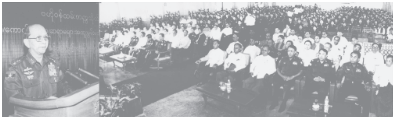
Secretary-1 Lt-Gen Thein Sein addresses opening of Special Refresher Course No 6 for faculty members. — MNA