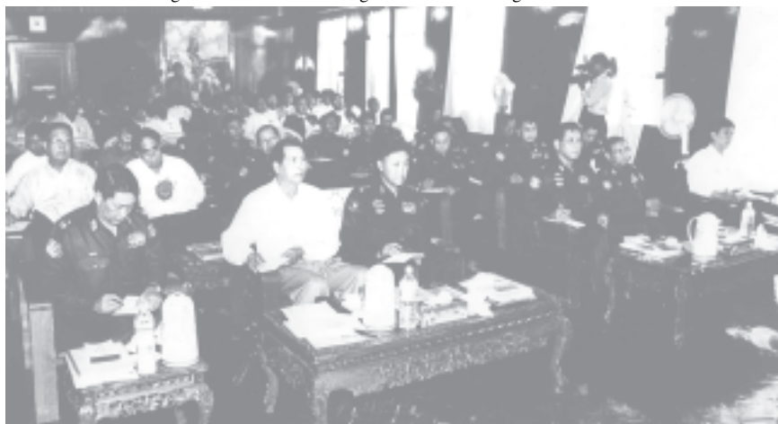
Senior General Than Shwe gives guidance at the meeting with departmental personnel at Mya Ayeya Hall of South-West Command in Patheingyi, Ayeyawady Division.