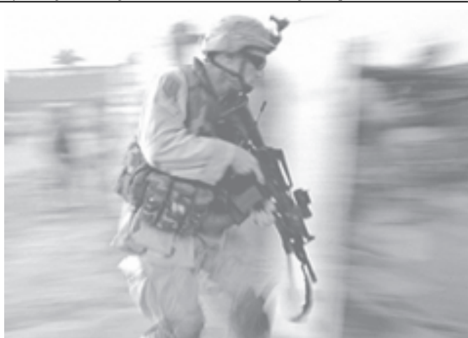
A US soldier from the 1st Infantry Division enters a house in the Iraqi northern city of Samarra during a raid for weapons on 13 Nov, 2004.