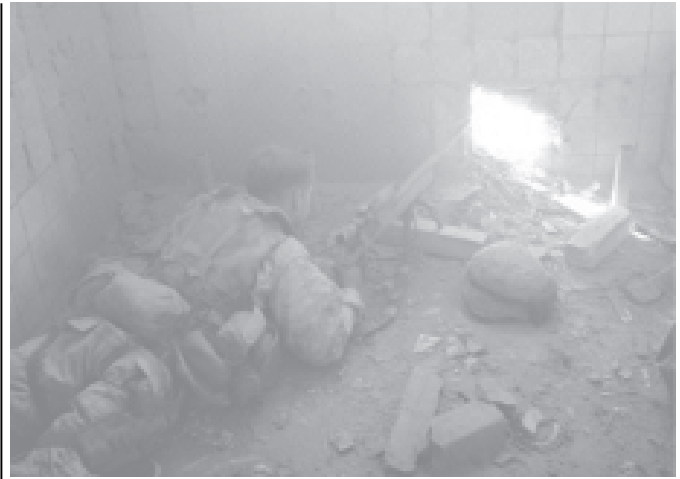
A picture released by the US Army shows a Marine attached to 1st Battalion, 8th Marine Regiment, 1st Marine Division, looking for guerilla activity in restive city of Fallujah on 13 Nov, 2004.