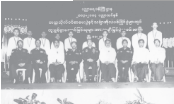
Secretary-1 Lt-Gen Thein Sein and party pose for a documentary photo together with outstanding students in Maths Olympic Contest.