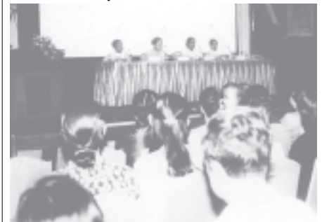
Attention Deficit/Hyperactivity Disorders in Children & Role of Multivitamins With Citrus Bio-flavonoids as Immunity Booster in progress.