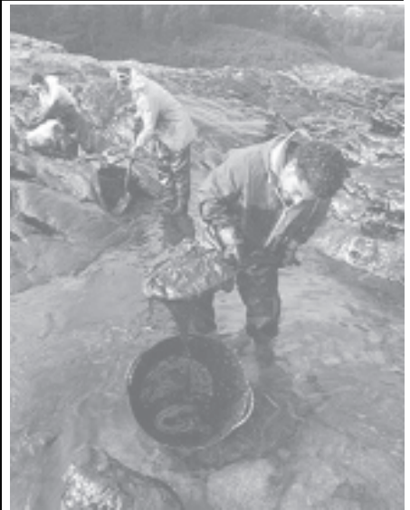
Volunteers clean the Figueras oiled beach in Galicia, recently devastated by the sinking of the Prestige oil tanker. The cost of pumping heavy oil out of the wreck of the Prestige oil tanker cost 130 million US dollars.