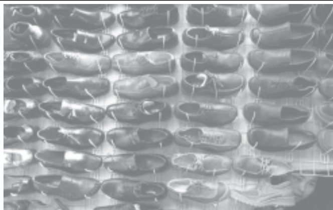
A Chinese vendor peers from behind an array of shoes at a stall in Beijing on 15 November, 2004. China’s retail sales for October rose a faster-than-expected 14.2 percent from a year earlier, their highest growth rate in five months, though some analysts said the strength was due in part to higher consumer prices.