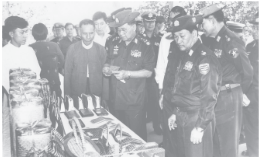
Senior General Than Shwe observes Myanmar traditional handicraft in Yekyi Township.