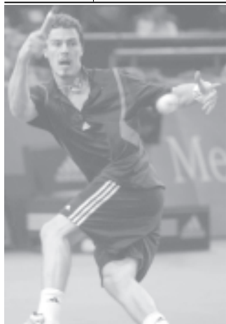
Marat Safin in action at the Tennis Masters Series final earlier this month. Attitude adjustments will be crucial for Safin, Lleyton Hewitt and Andy Roddick in Houston this week at the ATP Masters Cup as they compete to become world number one Roger Federer's top challenger.

Midfielder Antoine Sibierski had given the home side the lead with a tap-in just before halftime from Shaun Wright-Phillips' pass.—MNA/Reuters