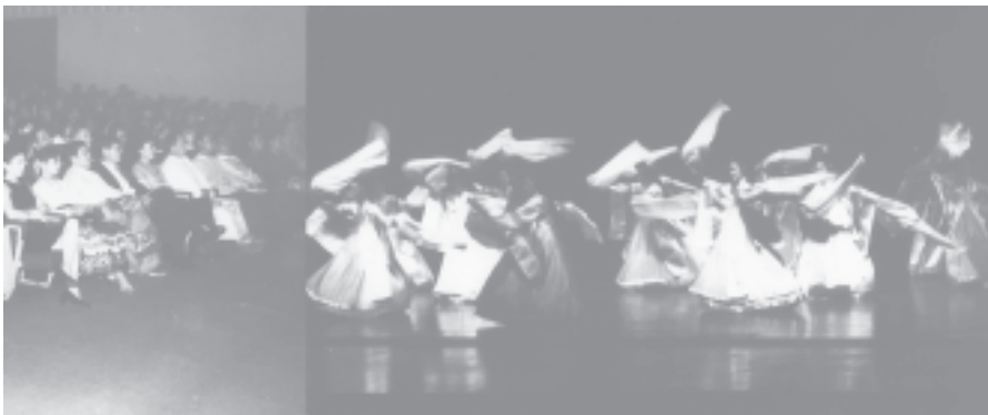
Minister U Nyan Win and wife enjoy performances of Korean dancers.

YANGON, 15 Nov — Under the cultural promotion programme between Myanmar and the Republic of Korea, the visiting dance troupe from Incheon Metropolitan City Dance Theatre of the ROK gave their traditional performance at the National Theatre on Myoma Kyaung Street here this evening.