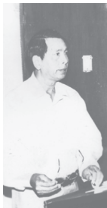
Minister U Soe Tha.