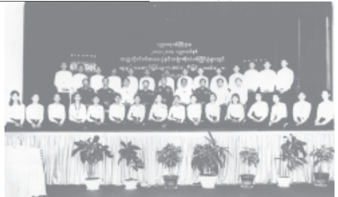
Secretary-1 Lt-Gen Thein Sein and party pose for a documentary photo together with outstanding students in matriculation examination (2003-2004).