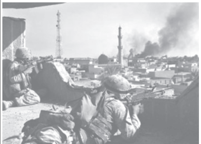
US Marines of the 1st Division take position overlooking the western part of Fallujah, on 13 Nov, 2004.