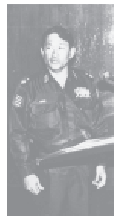
Commander Maj-Gen Soe Naing.

The division is raising over 40,000 acres of fresh water and sea prawns, over 9.7 million chicken of local strains, over 2.4 million ducks, running irrigation works, introducing mechanized farming, he said, explaining the industrial, health, education and rural development sectors.