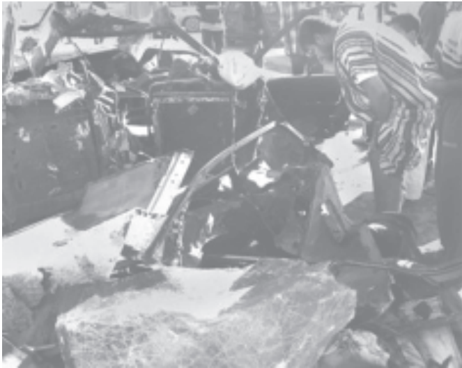
An Iraqi man looks at wreckage after clashes between guerillas and US forces in Ramadi, Iraq on 13 Nov, 2004.