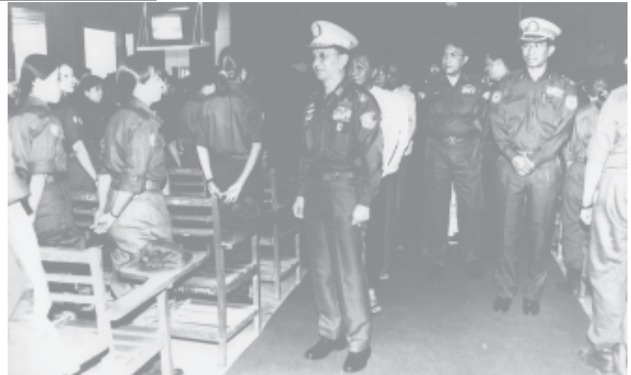
Secretary-1 Lt-Gen Thein Sein cordially converses with trainees after the opening of Special Refresher Course No 6 for Faculty Members.