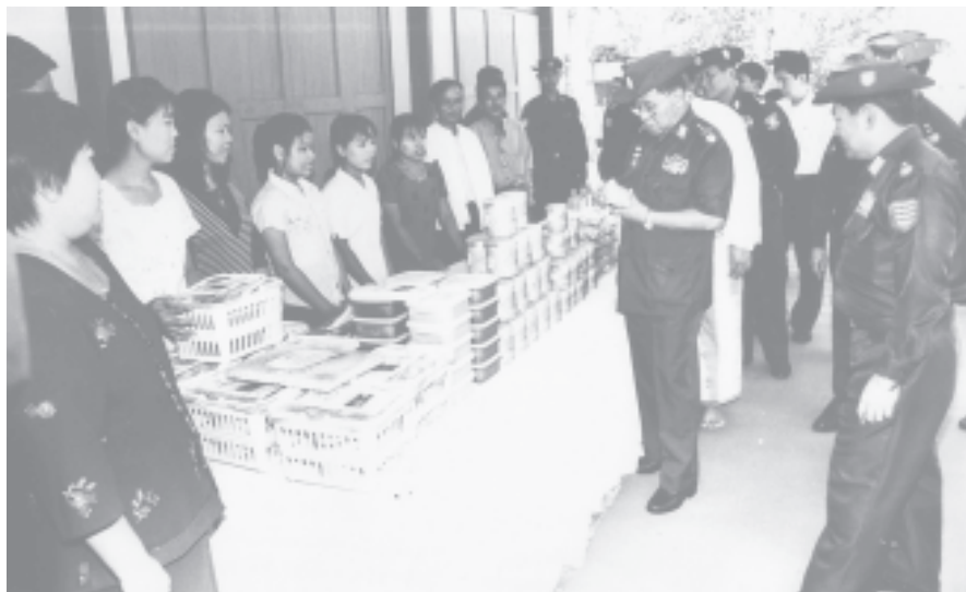
Senior General Than Shwe inspects foodstuff produced by ShweMyinByan Pathein Halawa Industry in Pathein.